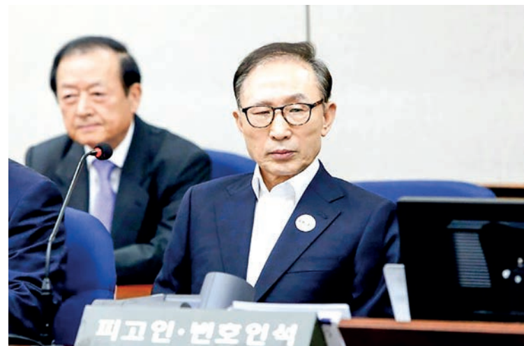
Former president Lee Myung-bak (R, pictured during his trial in 2018) was serving 17 years for bribery and embezzlement during his time in office.

Lee was arrested in 2018 under the government of pro-