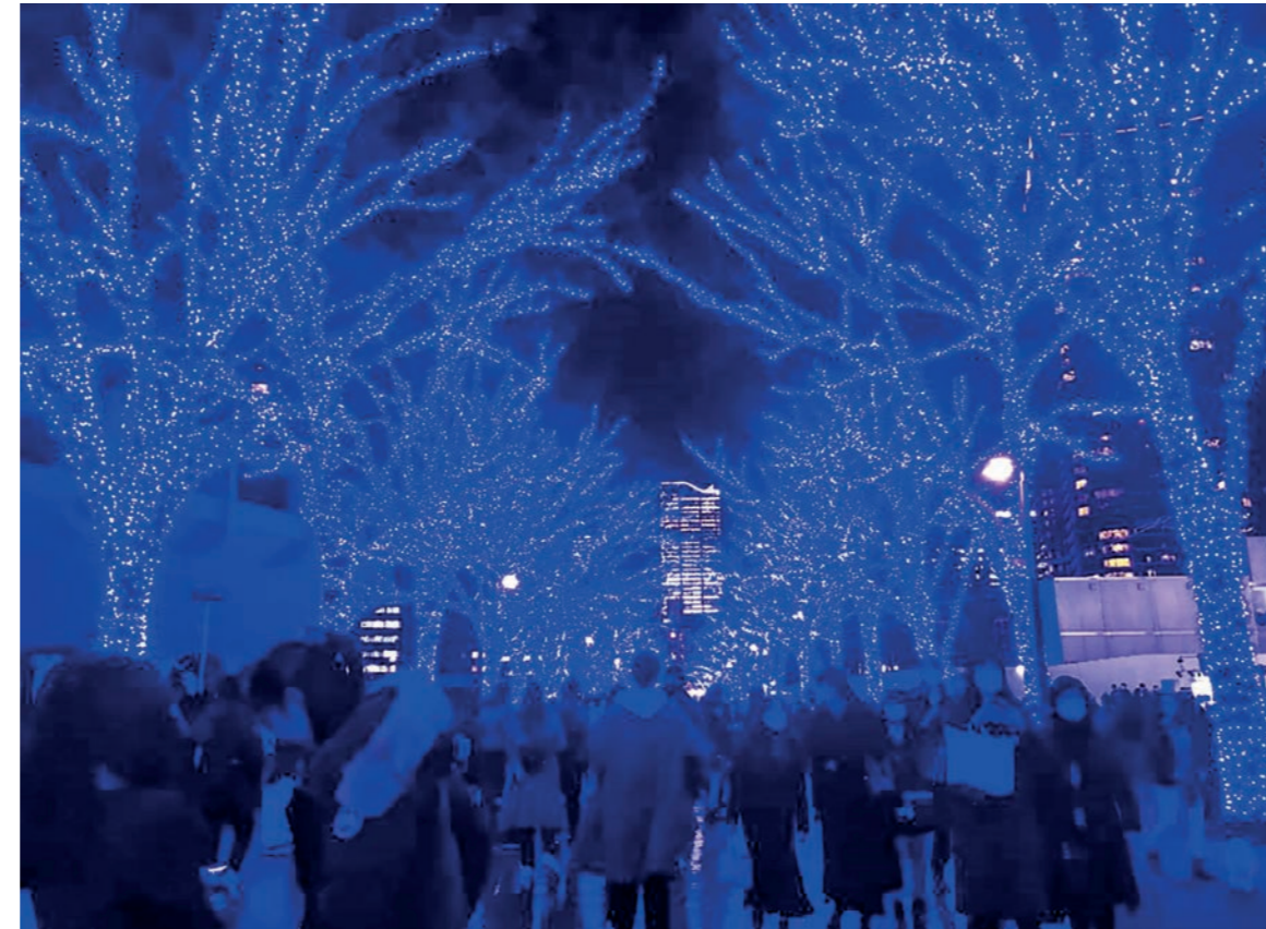
Blue Grotto Illumination in Tokyo. Diverse people coming from many countries are enjoying the beautiful illumination at the end of 2022.

Then full of joy will come to you and surround you with champagne-gold colour.