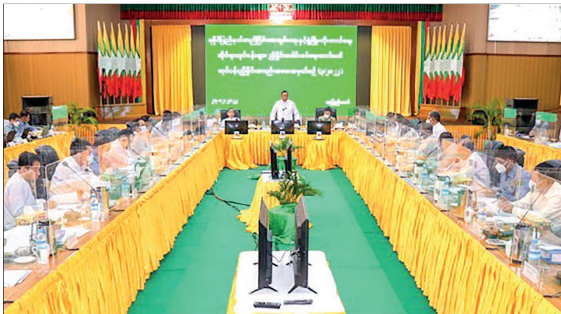
The meeting 3/2022 of the Rakhine State Stability, Peace and Development Work Coordination Committee is in progress yesterday in Nay Pyi Taw.

THE Rakhine State Stability, Peace and Development Work Coordination Committee held a