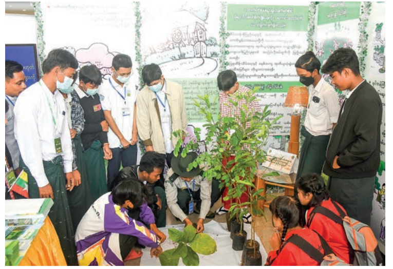
Pathein Umbrella Industry at the Ayeyawady Region booth (left) and environmental conservation (above).