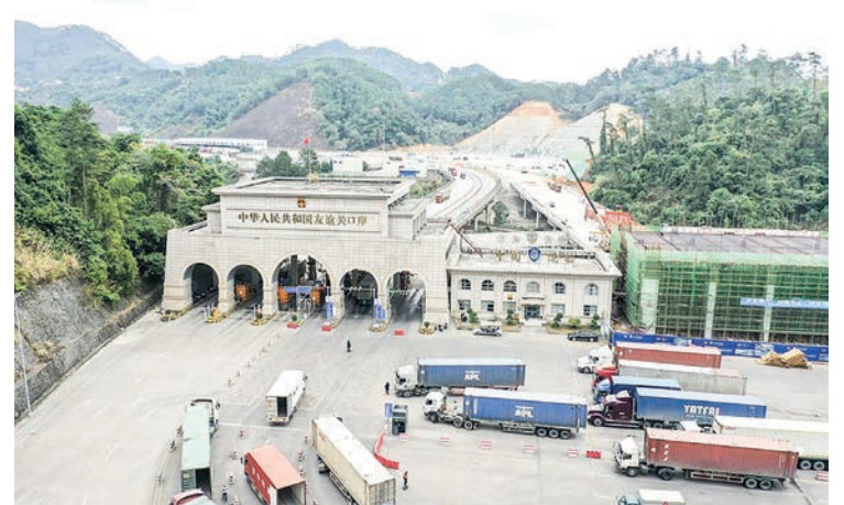
Aerial photo taken on 3 January 2020 shows vehicles waiting to pass the port of the Friendship Pass on the China-Vietnam border in Pingxiang, south China’s Guangxi Zhuang Autonomous Region.