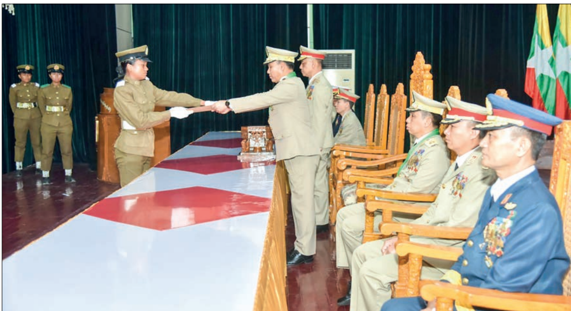
The commissioning ceremony for graduates of the Ninth Intake of Female Cadet Course is in progress.

THE ceremony to commission graduates of the 9 th Intake of Female Cadet Course of the Defence Services (Army) Officers Training School (Hmawby) took place at the Myawady Hall of the training school yesterday morning.