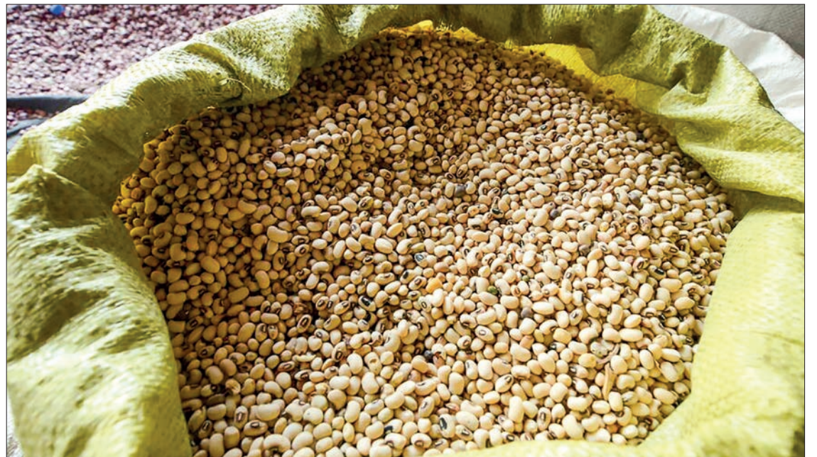
Myanmar shipped over 1.6 million tonnes of different varieties of pulses, especially black grams, with an estimated worth of US$1 billion, to other counties in the FY2018-2019.

Myanmar exported over 2 million tonnes of various pulses