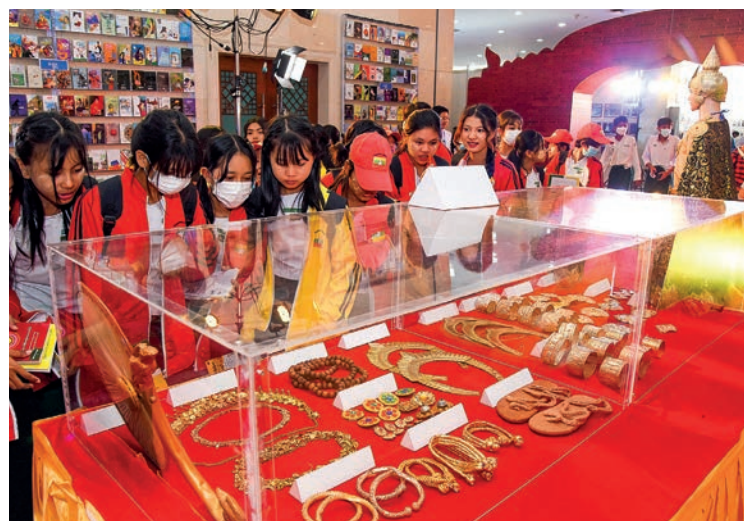
Students look into the exhibits.