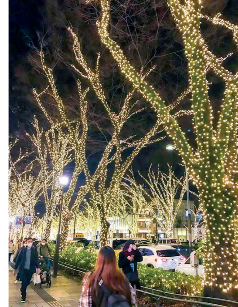
Champagne-gold illumination in Tokyo