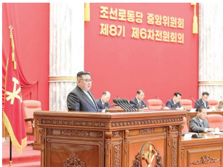
North Korean leader Kim Jong Un (front) makes a speech during a plenary meeting of the Workers' Party of Korea Central Committee in Pyongyang on 26 December 2022.