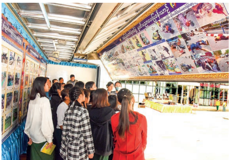
The Ministry of Home Affairs booth.

The festival intends to encourage students to read books and journals, know the benefits of literature, uplift patriotic spirit and dignity through arts with the knowledge of the history of independence and know peace, stability and development of the country including the lovely culture of rural regions and to love their regions and states via photo contests and to understand activities of ministries concerned through the booths. Therefore, students, youths and children should participate in the event without fail.