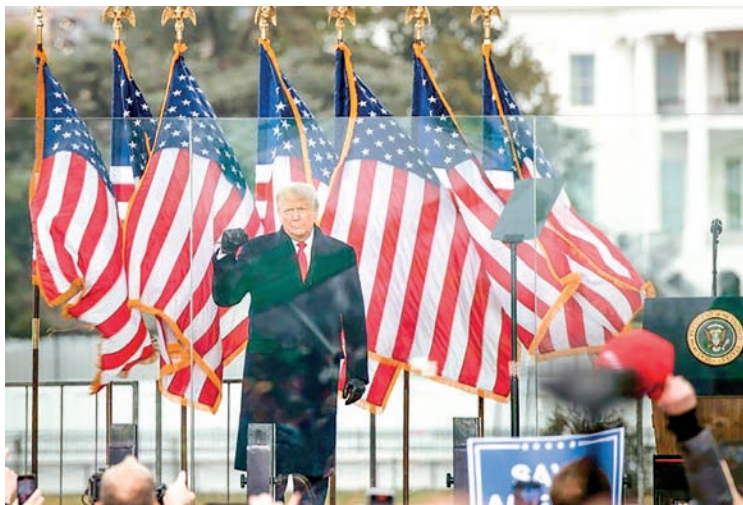
Fired up by false claims of fraud, supporters of Donald Trump stormed the US Capitol in January 2021 in a bid to overturn his defeat to Joe Biden.

FROM the United States to Brazil and Israel, a barrage of election-related misinformation hammered voters around the world in 2022, but many pushed back against the conspiracy-laden Trumpian tactic of sowing distrust in the democratic process.