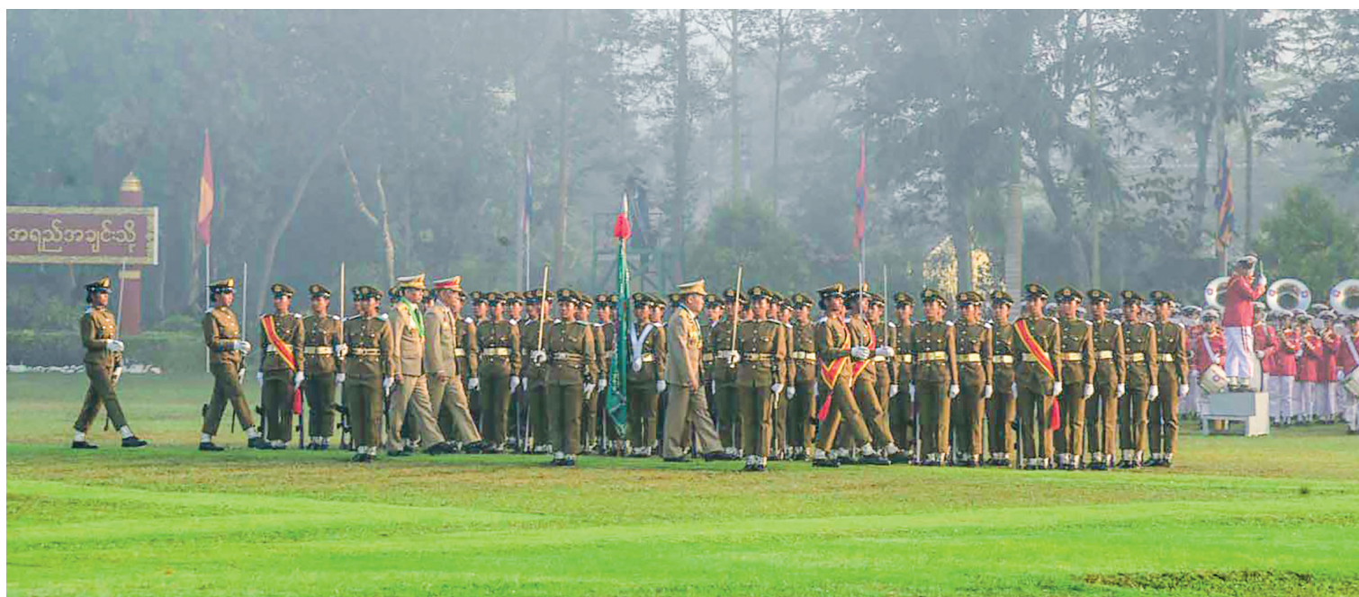
The Vice-Senior General inspects the graduate cadet company at the event.

Only when individual capability improves will the whole organization be higher. So, they have to take individual training,