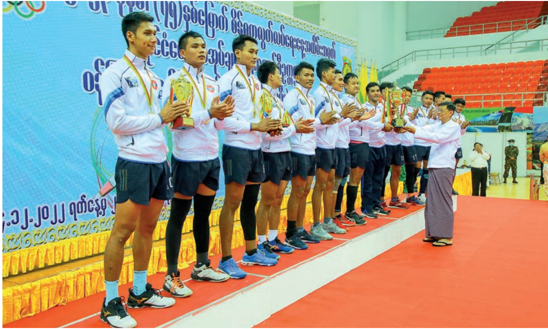
SAC Member General Mya Tun Oo presents the first prize to the Ministry of Defence team.

IN commemoration of the 2023 Diamond Jubilee Independence Day, the final matches of the SAC Chairman Cup Inter-Ministerial Volleyball (Men/Women) Tourney were held at Wunna Theikdi Stadium B in Nay Pyi Taw yesterday morning.