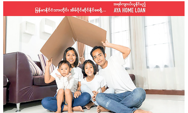
The picture shows the home loan advert of the AYA Bank.

Additionally, Yoma Bank will also offer the best rate for the seafarer in foreign in-