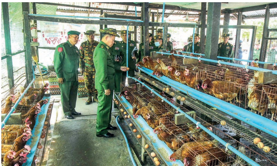
State Administration Council Vice-Chair Deputy Commander-in-Chief of Defence Services Commander-in-Chief (Army) Vice-Senior General Soe Win views the breeding farm of the training depot yesterday in Hmawby.

VICE-CHAIRMAN of the State Administration Council Deputy Commander-in-Chief of Defence Services Commander-in-Chief (Army) Vice-Senior General Soe Win inspected the Tatmadaw (Army) Warrant Officer and Non-Commissioned Officer Training Depot in Hmawby Station yesterday morning.