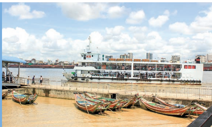
The Cherry ferry.

THE number of trips of Cherry passenger ferries that run daily from Pansodan jetty to Dala jetty has been reduced since 26 December. Owing to the trip reduction, locals who usually use the Cheery ferry service are experiencing difficulties in travelling.