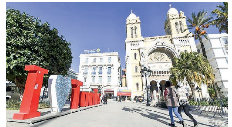
People walk past Saint-Vincent de Paul Cathedral on Habib Bourguiba Avenue in Tunis on 14 December 2021, one day after Tunisia’s president extended his monthslong suspension of parliament until new elections in December 2022, while calling for a July referendum on constitutional reforms.

The budget is based on assumptions of 1.8 per cent GDP growth, oil at $89 a barrel and a deal with the International Monetary Fund for a $1.9 billion bailout loan.—AFP