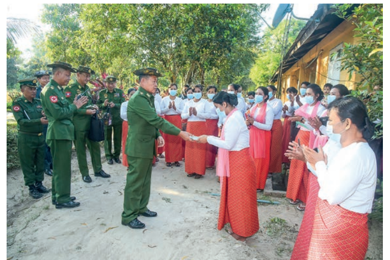
The Vice-Senior General presents cash awards at Hmawby Station.

The Vice-Senior General and party inspected local regiments and units in Hmawby Station, cordially conversed with the families, coordinated with officials for necessary measures and presented cash awards to them.