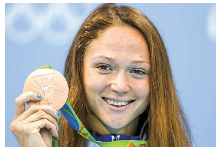
The 36-year-old was found guilty on multiple charges.

Herasimenia had auctioned off a gold medal she won at the 2012 World Championships for over $16,000, using the proceeds to support the foundation.—AFP