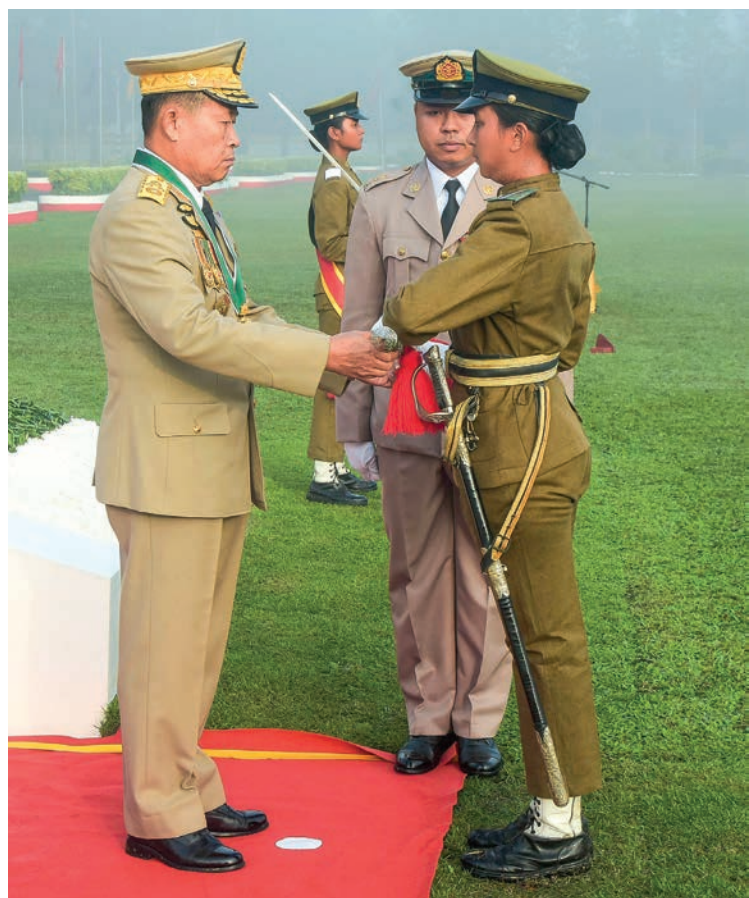
The Vice-Senior General presents the best female cadet award.

ing, collective training and joint operation training for the