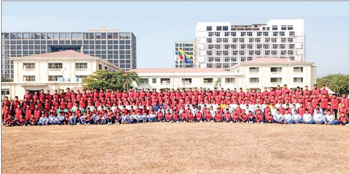
Youth Teams are seen with team officials at the MFF Internal Academy Football Tournament 2022.