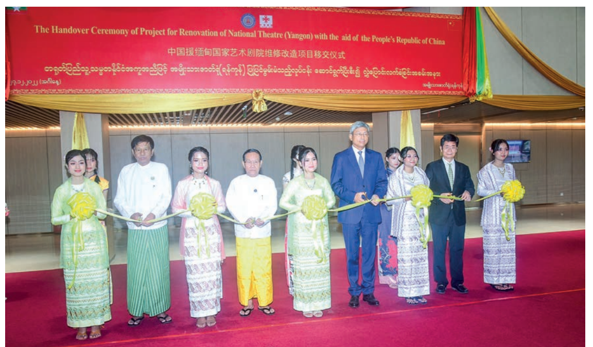
Union Minister U Ko Ko, the Chinese ambassador and officials cut the ceremonial ribbon at the handover event.

Union Minister U Ko Ko thanked China on behalf of Myanmar for handing over the National Theatre (Yangon) in time for observing Diamond Jubilee