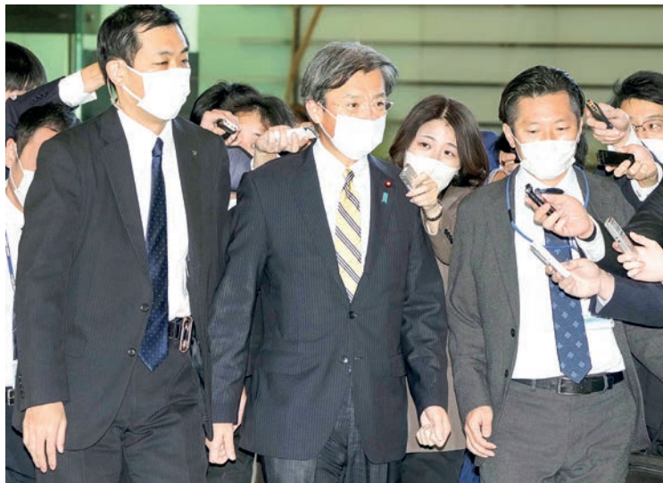
Japanese reconstruction minister Kenya Akiba (C) arrives at the prime minister’s office in Tokyo on 27 December 2022. He is expected to step down from his post later in the day over a political funds scandal and his ties with the controversial Unification Church.

JAPAN’S scandal-hit reconstruction minister Kenya Akiba stepped down on Tuesday, effectively dismissed by Prime Minister Fumio Kishida over scandals