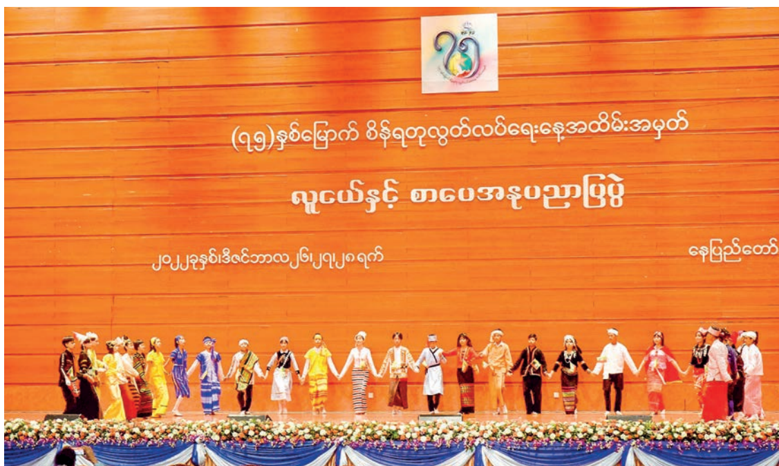
Students perform song and dance entertainment.

Information and the Ministry of Religious Affairs and Culture opened book shops for students and young people.