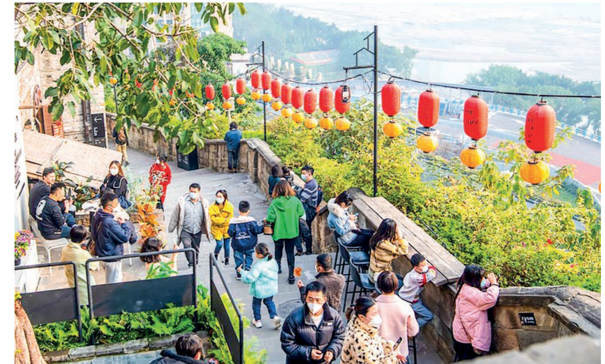
People visit Shancheng Alley of the Jiefangbei business district in Chongqing, southwest China, on 24 December, 2022.

The BDA has taken tailored measures for companies within