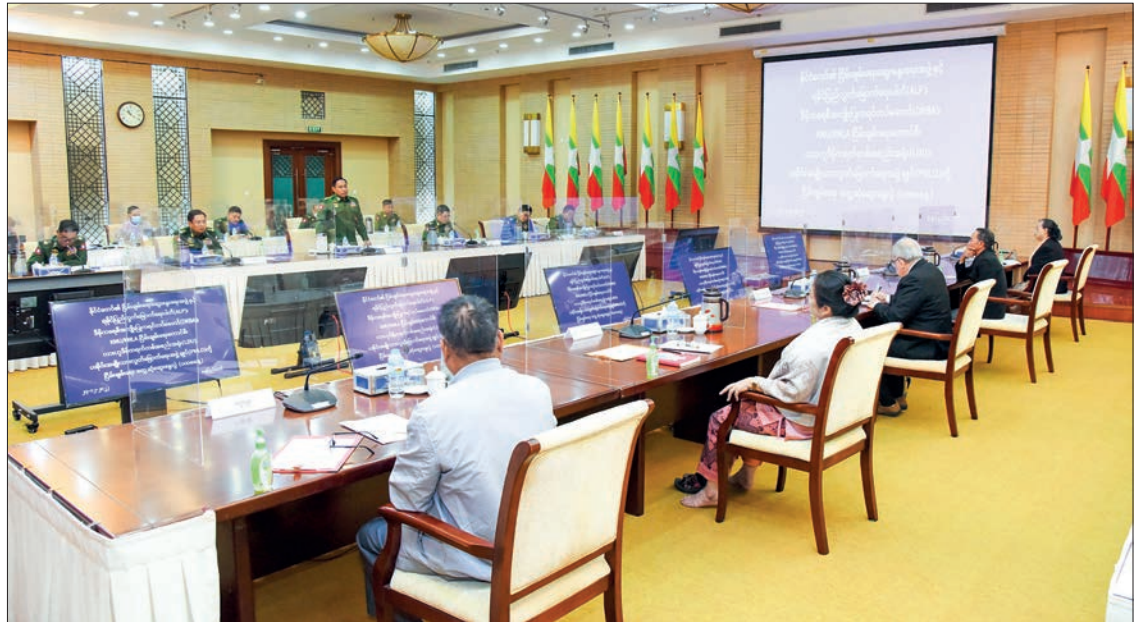
The meeting between the State Peace Talks Team and the delegation of five EAOs is underway in Nay Pyi Taw yesterday.