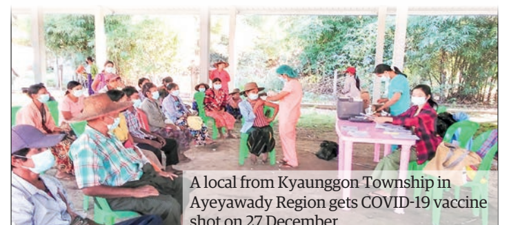
A local from Kyaunggon Township in Ayeyawady Region gets COVID-19 vaccine shot on 27 December.