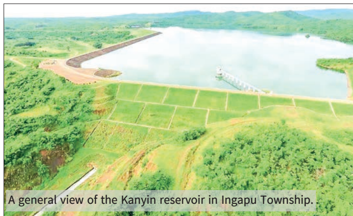
A general view of the Kanyin reservoir in Ingapu Township.

UNION Minister of Electric Power U Thaung Han, during his inspection tour of the Kanyin reservoir in Ingapu township of Ayeyawady region on 23 December, said that, ac-