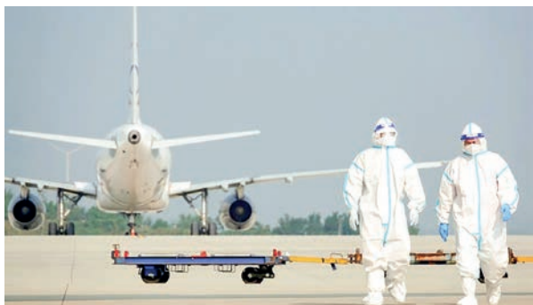
China said it would scrap mandatory quarantine on arrival, further unwinding years of strict virus controls.

People in China have since gone rushing to search for overseas flights, with the reopening set to be a boon for the travel industry.—AFP