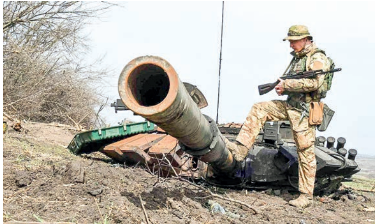
A Ukrainian soldier checks a wrecked Russian tank outside a village east of Kharkiv on 1 April.

Ukrainian drone downed in Russian air base, 3 killed: agencies