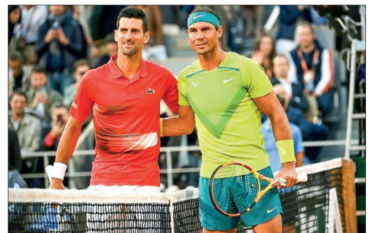
Novak Djokovic and Rafael Nadal begin their 2023 season in Australia.

Djokovic returns Down Under for the first time since being sensationally detained and then deported ahead of the 2022 Australian Open because of his refusal to get vaccinated for Covid-19.—AFP