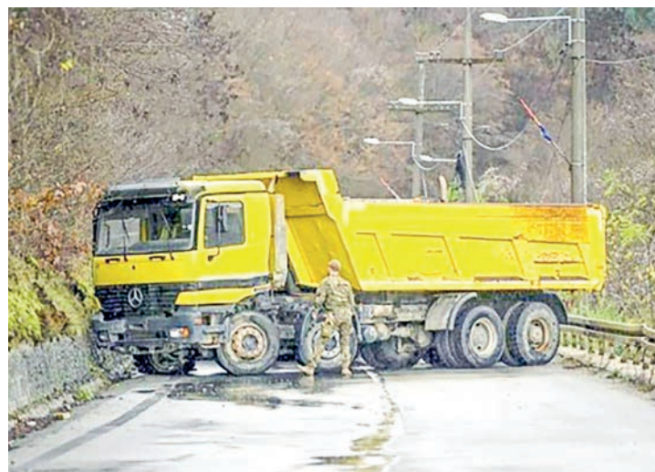
On December 10, Serbs in northern Kosovo set up barricades to protest against the arrest of an ex-policeman suspected of being involved in attacks against ethnic Albanian police officers.

He added that President Aleksandar Vucic also ordered the special armed forces to be beefed up from the existing 1,500 to 5,000.— AFP