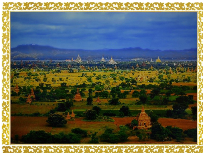
Scenic Beauty of Bagan.

(Excerpt from the message sent by Chairman of the State Administration Council Prime Minister Senior General Min Aung Hlaing to the 74 th Anniversary of the Shan State Day on 7 February 2021)