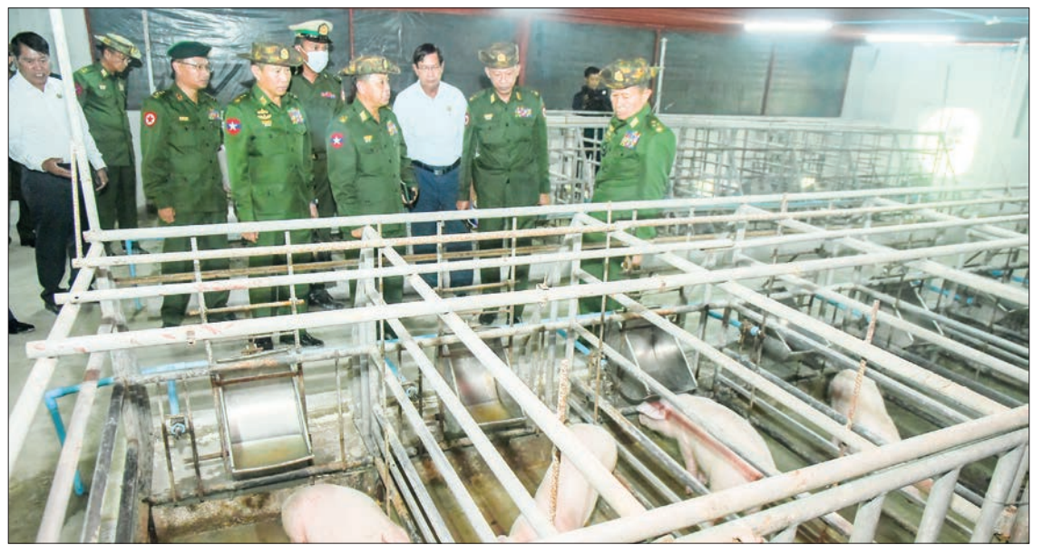
The Vice-Senior General inspects the breeding farm.

In his speech, the Vice-Senior General explained the undertaking of agriculture and livestock farms with the purpose of selling products to Tatmadaw members and service personnel at reduced prices, focusing on welfare tasks without the need to take profit, production of healthy products, taking consultation with veterinarian researchers, and collaborative efforts in the