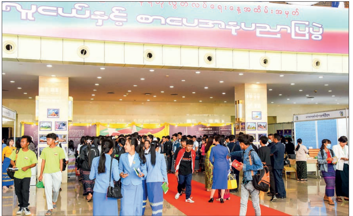
People through the Youth and Literary Arts Exhibition.

Similarly, the booths of the Road Transport Administration Department featured the diesel engine, traffic rules, and vehicles used in different times of history and the displays of Myanma Railways included Yangon circular train, railway,