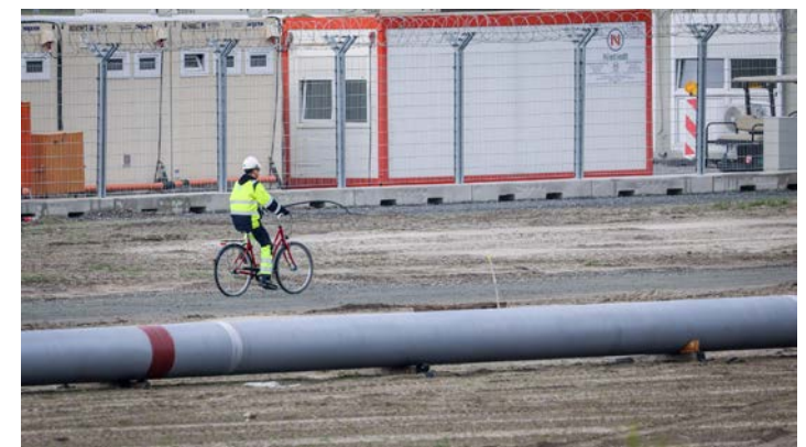
In this file photo taken on 29 September 2022 a worker rides a bike next to a pipeline at the landside construction site of the Uniper Liquefied Natural Gas (LNG) terminal at the Jade Bight in Wilhelmshaven on the North Sea coast, northwestern Germany.

"If we manage to expand this further at the current pace, then we will reconnect Germany to the world market," Habeck said. "And then we will also get world market prices that are significantly below what we have now." (1 euro = 1.06 US dollar)—Xinhua