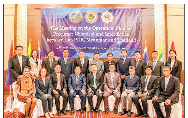
Meeting attendees pose for the group photo at the event.

The meeting also focused on access to funding and equipment support from the international narcotics control boards including UNODC in the annual destruction of seized precursor