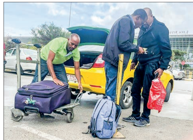
Tigray TV, a rebel-affiliated network, aired footage of passengers dropping to their knees and kissing the tarmac upon arrival in Mekele.

FAMILIES embraced and wept in emotional reunions Wednesday after the first commercial flight in 18 months between Ethiopia's capital city and the war-torn Tigray region to the north.