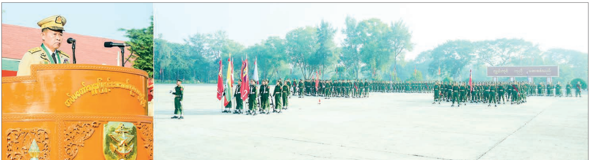
State Administration Council Vice-Chair Deputy Commander-in-Chief of Defence Services C-in-C (Army) Vice-Senior General Thray Sithu Soe Win addresses the passing-out parade of No 20 Intake of Nursing and Paramedical Science Degree Course and No 7 Intake of Female Nursing and Paramedical Science Degree Course in Yangon yesterday.

PASSING-OUT parade of No 20 Intake of Nursing and Paramedical Science Degree Course and No 7 Intake of Female Nursing and Paramedical Science Degree Course of the Military Institute of Nursing and Paramedical Sciences took place at the parade ground of the institute in Yangon yesterday morning, with an address by State Administration Council Vice-Chairman Deputy Commander-in-Chief of Defence Services Commander-in-Chief (Army) Vice-Senior General Thray Sithu Soe Win, on behalf of SAC Chairman Commander-in-Chief of Defence Services Senior General Maha Thray Sithu Min Aung Hlaing.