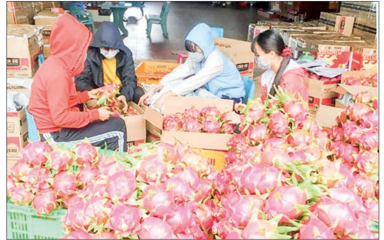
People package dragon fruits in the city of Buon Ma Thuot in Viet Nam's central highlands Dak Lak province on 12 Aug 2020.

According to the Viet Nam General Confederation of Labour, almost half a million workers have had their hours slashed during the last four months of this year, while about 40,000 people have lost their jobs. — AFP