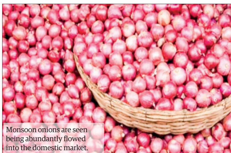
Monsoon onions are seen being abundantly flowed into the domestic market.

Nonetheless, the price is still higher than those in the corresponding periods of 2020 and 2021. The onions were worth K150-700 per viss on 27 Decem-