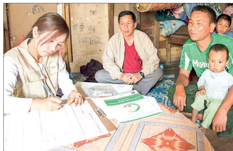
Home-to-home collection of population census was underway in 2014.