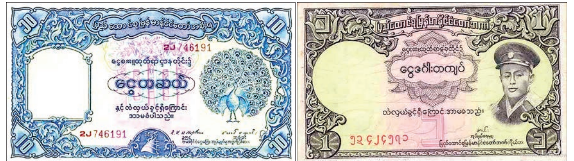
Pictures show a sample banknote worth K10 bearing the signature of the then treasury secretary Maung Kaung of the former Republic of the Union of Burma government and a sample K1 coin with the signature of San Lin.

THE Central Bank of Myanmar (CBM) is making concerted efforts to ensure maximum security of banknotes, said Dr Lin Aung, deputy governor of the CBM.