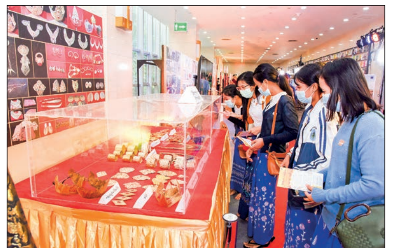
Students look into exhibits at the "Kyee Myat Thaw Myanmar" booth.

derstand activities of ministries concerned through the booths.