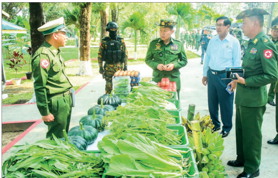
The Vice-Senior General views the agricultural products.

farming tasks between the command headquarters and the regional government to contribute to the food supply of commercial hub Yangon city.