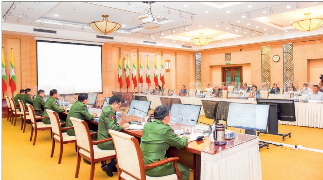
The final day of the meeting between the State Peace Talks Team and the delegation from five EAOs is in progress in Nay Pyi Taw.

THE third-day meeting of the State Peace Talks Team and the delegation of five Ethnic