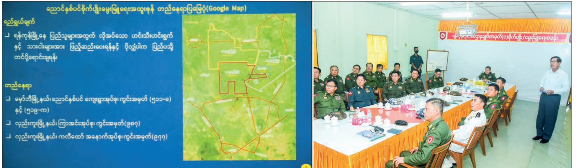
SAC Vice-Chair Deputy Commander-in-Chief of Defence Services Commander-in-Chief (Army) Vice-Senior General Soe Win hears the report on the agriculture and livestock zone.

STATE Administration Council Vice-Chairman Deputy Commander-in-Chief of Defence Services Commander-in-Chief (Army) Vice-Senior General Soe Win yesterday afternoon inspected agriculture and livestock farms of Yangon Command.