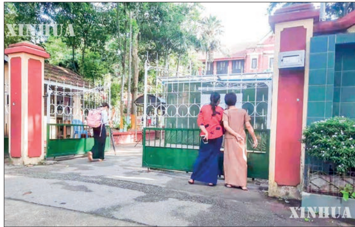
The 2022 matriculation exam result was announced at No 2 BEHS Latha.

A total of 132,077 out of 281,751 students passed the exam in 2022 matriculation examinations and the national pass rate was 46.88 per cent, according to the Ministry of Education. – TWA/MKKS