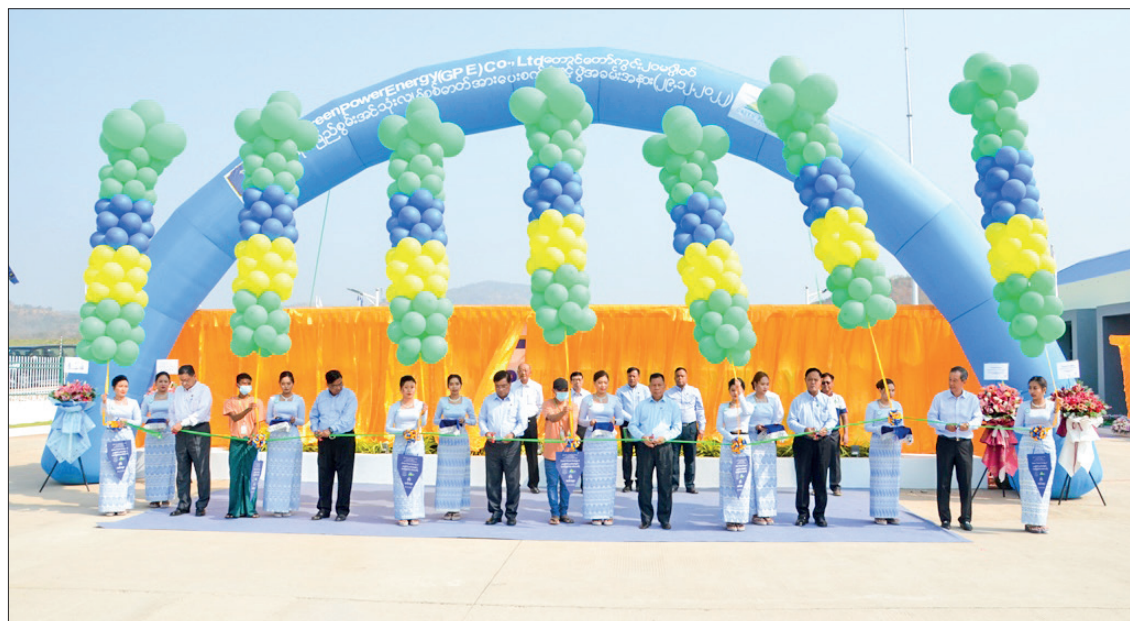
The SAC members, Union ministers and officials opens the 20-megawatt Taungdawgwin Solar Power Plant.

The 20-MW Taungdawgwin Solar Power Plant is the third project completed in Myanmar. It can generate 45 million kilowatt