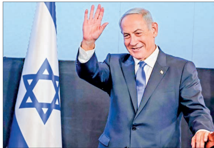
Benjamin Netanyahu, 73, already served as prime minister longer than anyone in Israeli history.

Both have a history of inflammatory remarks about the Palestinians.—AFP