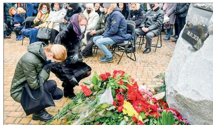
Women in Kyiv lay flowers to commemorate the crew and passengers of Ukraine International Airlines Flight 752, which was shot down by Iran.

And if the parties cannot agree within six months on the terms for organizing an independent arbitration tribunal, the dispute may be referred to the International Court of Justice in The Hague.—AFP