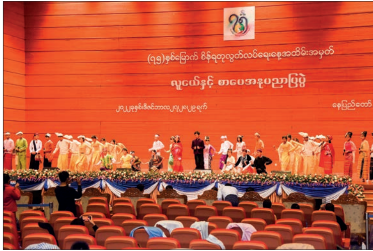
Dignitaries watch the song and dance entertainment at the Youth and Literary Arts Festival in Nay Pyi Taw yesterday.