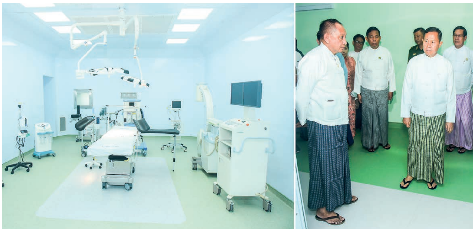
The Vice-Senior General views round the five-storey annexe.