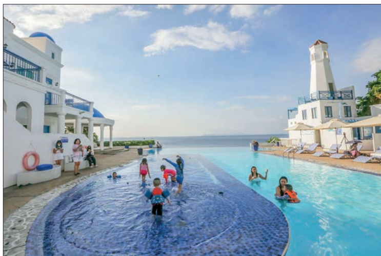
Official data showed the tourism industry contributed 5.2 per cent to the country's gross domestic product (GDP) in 2021, below the pre-pandemic level.

OVER 2.4 million foreign tourists visited the Philippines so far this year, earning roughly 2.65 billion US dollars in tourism revenues for the Southeast Asian country, according to the Philippines' Department of Tourism (DOT) data released on Wednesday.