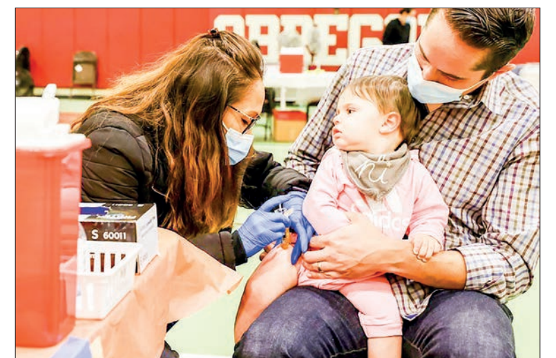
A child receives a COVID-19 vaccine shot in Los Angeles, the United States, on 17 Dec 2022.