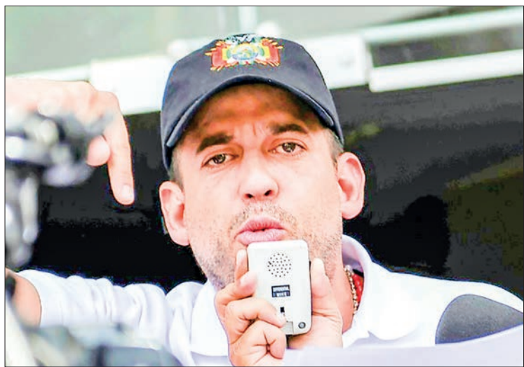
Right-wing Bolivian opposition leader Luis Fernando Camacho has been arrested.

BOLIVIAN police on Wednesday arrested Luis Fernando Camacho, governor of the economic powerhouse Santa Cruz region, on "terrorism" charges, setting off street clashes between his supporters and security forces.