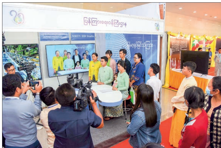
At the Ministry of Information booth.

of law and criminal cases, public services, capacity building, cartoon displays of traffic rules and regulations, actions on gambling and other matters and special security equipment used by the Ministry of Home Affairs.