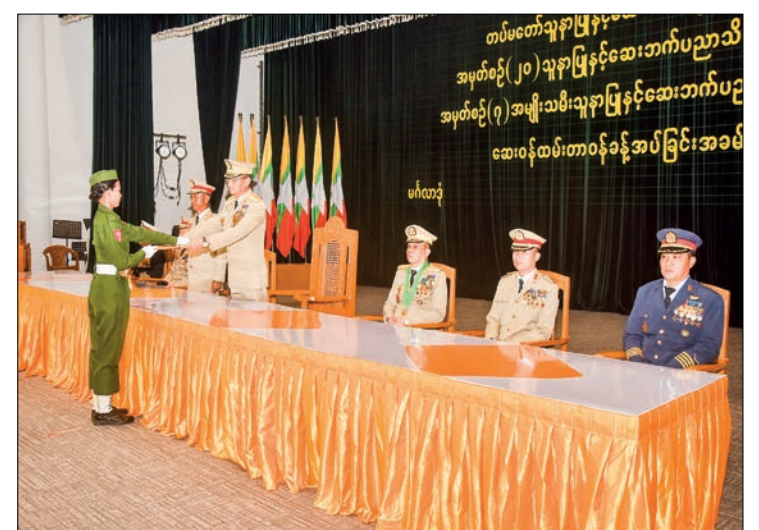
The 26 th Convocation of the Military Institute for Nursing and Paramedical Sciences is in progress.

204 students, the Bachelor of Science in Nursing Bridge on 113 students, Diploma in Medical Ultrasound Diagnostics on 16 students, Diploma in Intensive-Care Nursing on 22 students, Diploma in Surgical Nursing on 65 students, Bachelor in Nursing Science on 3,269 students, Bachelor in Pharmacology on 218 students, and Bachelor in Medical Technology on 649 students. — MNA/MKKS