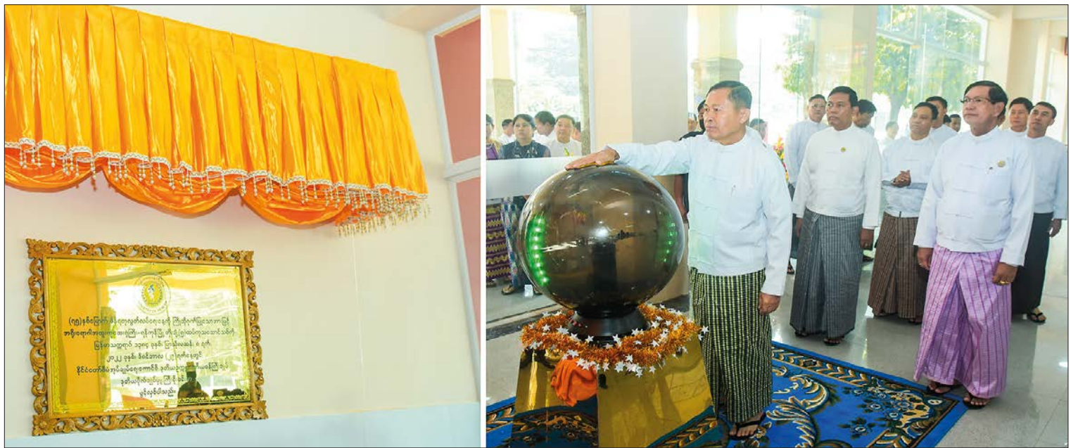
State Administration Council Vice-Chair Deputy Commander-in-Chief of Defence Services C-in-C (Army) Vice-Senior General Soe Win inaugurates the five-storey annexe of the Orthopaedic Speciality Hospital in Yangon yesterday.

AS Covid-19 can be controlled to some extent, an emphasis is being placed on undertaking regular healthcare services, treatment, research and medical education at full capacity in remedying the Covid-affected workplaces, said Vice-Chairman of the State Administration Council Deputy Commander-in-Chief of Defence Services Commander-in-Chief (Army) Vice-Senior General Soe Win at the inauguration ceremony of the five-storey annexe of Orthopaedic Speciality Hospital-Yangon in Kymyindine Township of Yangon Region yesterday morning as a gesture of hailing Diamond Jubilee Independence