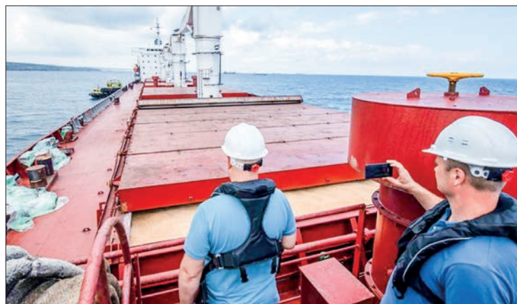
A vessel transports grain under the Black Sea Grain Initiative.