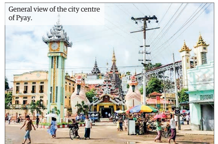
General view of the city centre of Pyay.

The Smart City project was started in Bago Region in 2017 to upgrade the city of Bago with the help of the Republic of Korea.