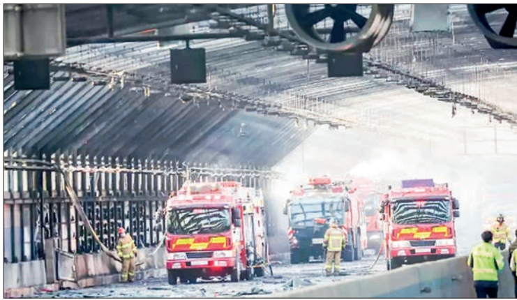
Firefighters work at the scene of a fire in an expressway tunnel in Gwacheon on 29 December.

FIVE people have been killed and dozens injured after a bus and truck crash caused a huge fire at an expressway tunnel on the outskirts of Seoul, the local fire