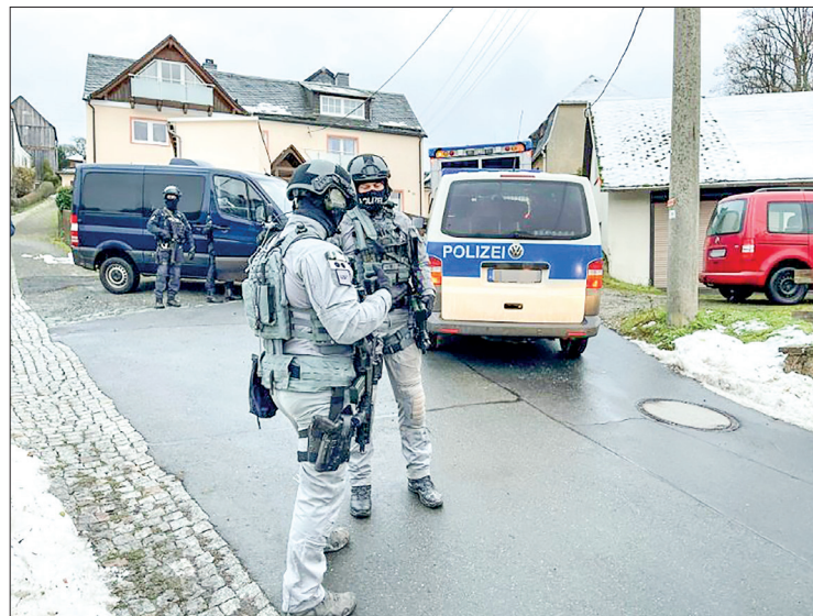
German police staged nationwide raids and arrested 25 people suspected of belonging to a far-right 'terror cell'.

The raids targeted alleged members of the "Citizens of the Reich" (Reichsbuerger) movement, federal prosecutors said in a statement.—AFP