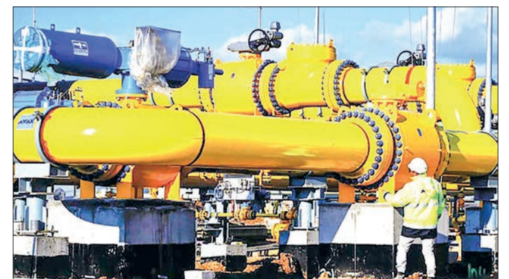
India has increased its purchases of cheap Russian oil six-fold since the invasion in February, to the extent that Moscow is now its top crude supplier, according to local media reports.

"Because you are buying cheap oil not because of Europeans but because of us, of our suffering, of our tragedy, and because of the war that Russia launched against Ukraine." — AFP