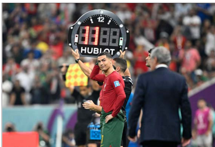
Portugal's Cristiano Ronaldo prepares to enter the pitch during Qatar World Cup round of 16 match against Switzerland.

"Every day Ronaldo is building up a unique track record at the service of the national team and the country,