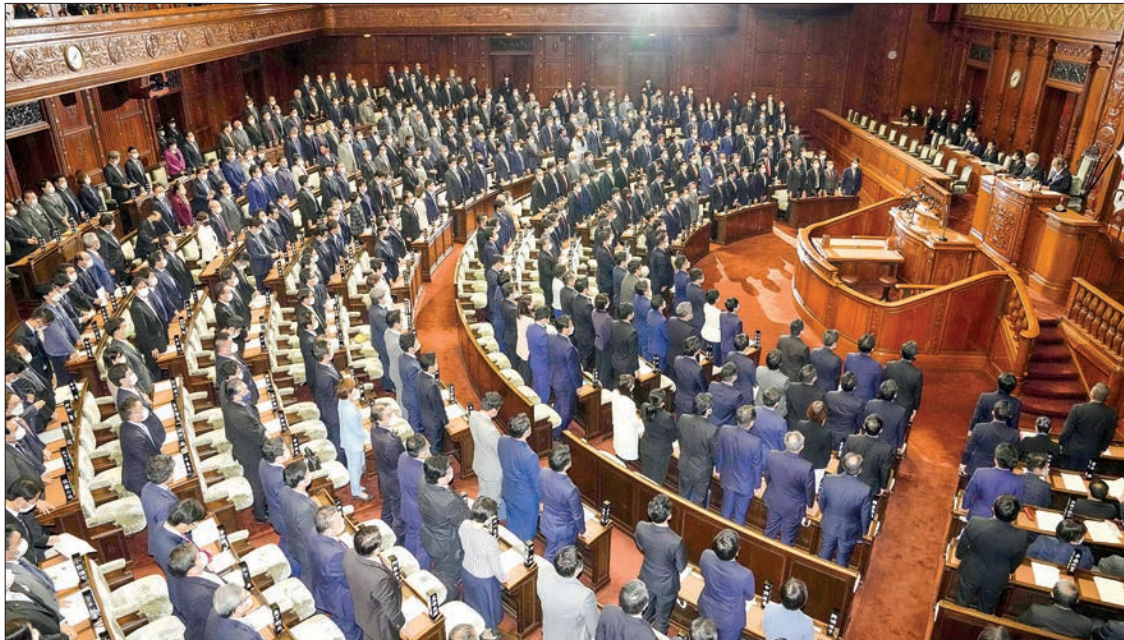
The House of Representatives passes a bill to ban organizations from maliciously soliciting donations, during a plenary session in the parliament in Tokyo on 8 December 2022.

JAPAN'S lower house on Thursday passed a bill to ban organizations from maliciously soliciting donations, following controversy