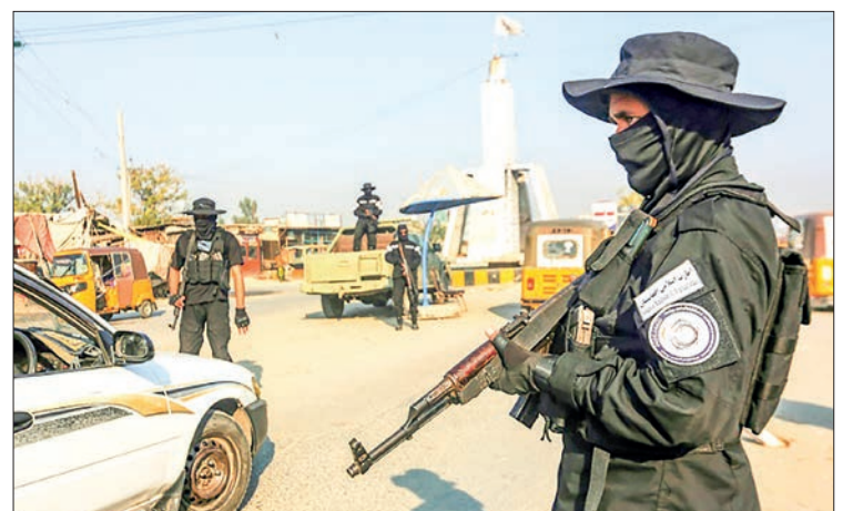
Taliban security forces stand guard at a checkpoint in Jalalabad on 6 December 2022. PHOTO: SPUTNIK/MIKHAIL METZEL/AFP

The execution was announced just as the US pointman on Afghanistan, Thomas West, met in Abu Dhabi with a Taliban delegation led by their defence minister Mohammad Yaqoob, the son of the group's founder Mullah Omar.—AFP