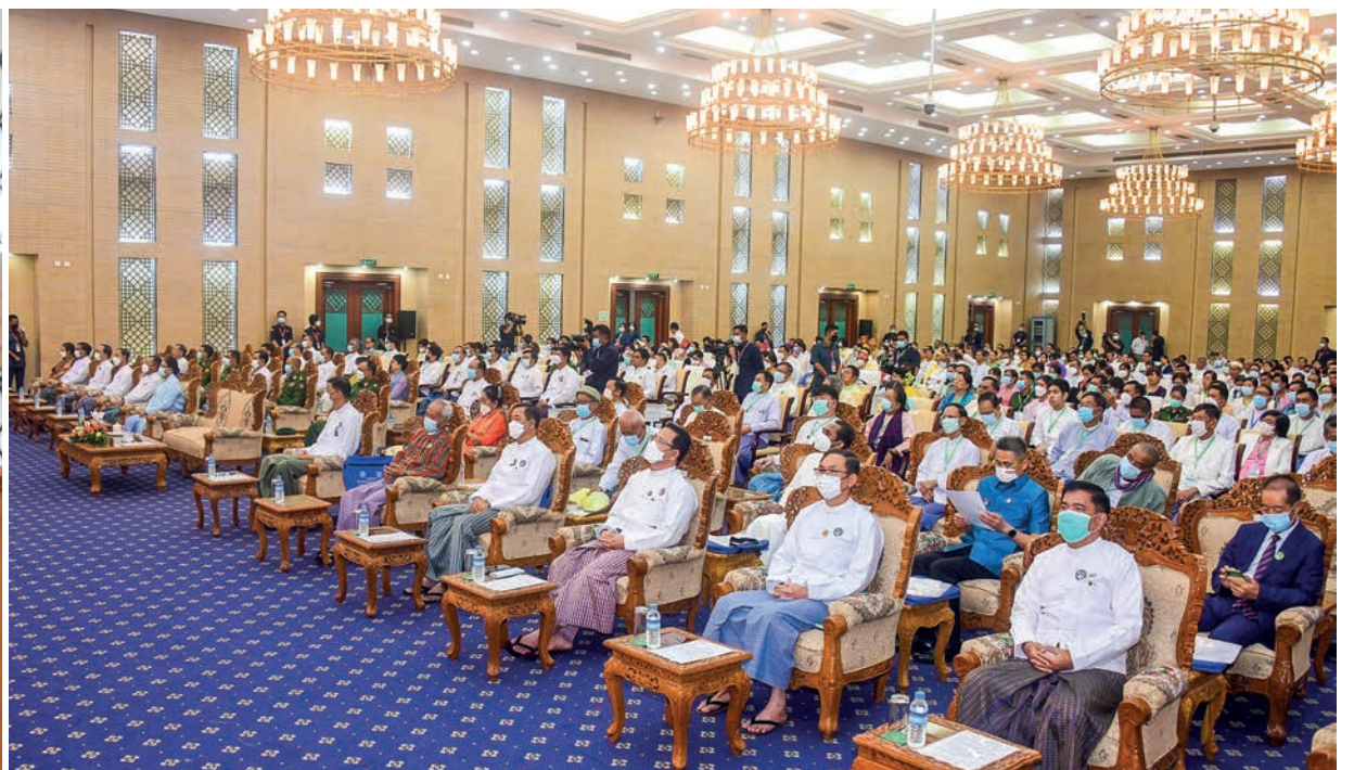
State Administration Council Vice-Chair Deputy Prime Minister Vice-Senior General Soe Win addresses the 21 st Myanmar Traditional Medicine Practitioners Conference in Nay Pyi Taw on 8 December 2022.

THE 21 st Myanmar Traditional Medicine Practitioners Conference was opened in conjunction