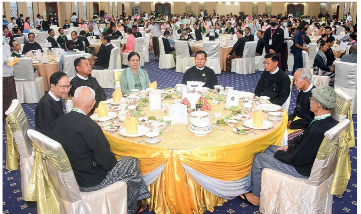
Vice-Senior General Soe Win hosts the dinner to honour the conference delegates.

The Vice-Senior General continued that the Myanmar traditional medicine conference and symposium have been held for the 21 st time since 2000. Traditional medicine research