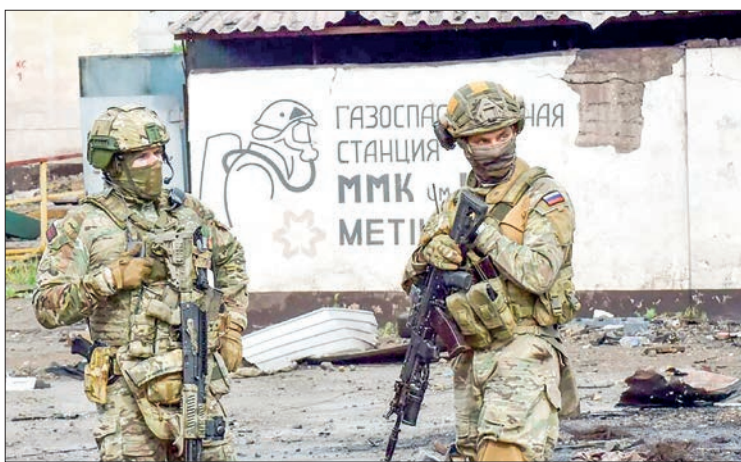
Russian servicemen stand guard at the destroyed part of the Ilyich Iron and Steel Works in Ukraine's port city of Mariupol, on 18 May.

RUSSIAN President Vladimir Putin said Wednesday that nuclear tensions were rising, though