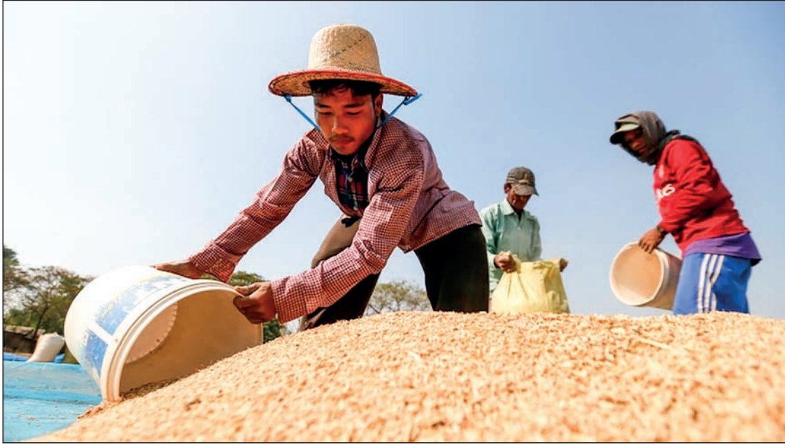
Paddies are put into a bag to proceed to the milling process.

THE price of newly harvested monsoon paddy 2022 dipped at the end of the first week of December.