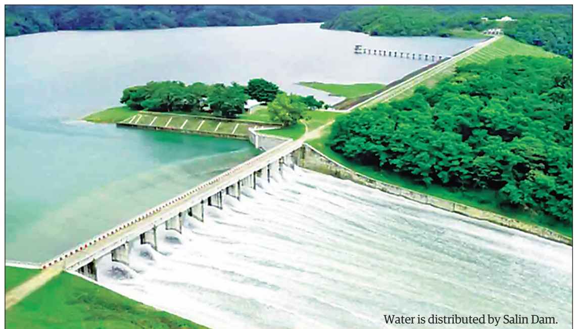
Water is distributed by Salin Dam.

questions of the public from the YESC Call Centre and Facebook Page, and offer 24 hours