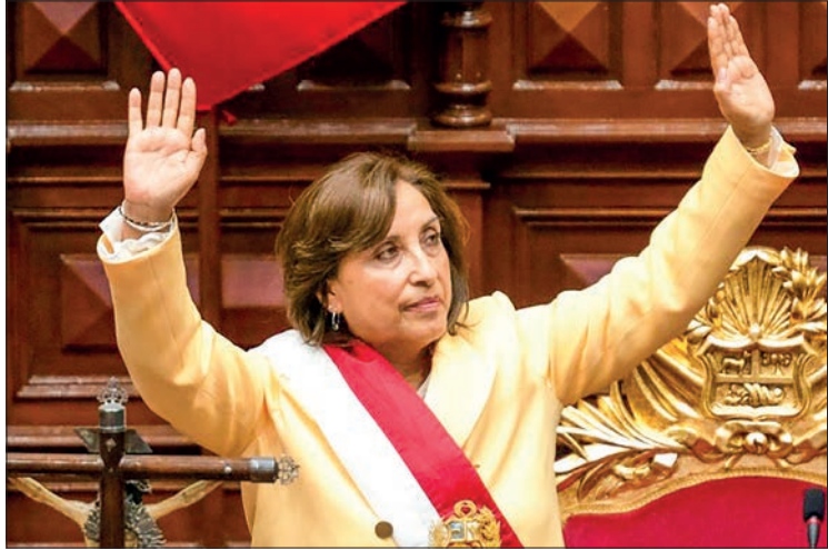
Dina Boluarte was sworn in as Peru's new president hours after congress removed Pedro Castillo from office.

PERU'S leftist president Pedro Castillo was ousted by lawmakers and arrested Wednesday after trying to dissolve the South American country's Congress in a move widely condemned as an attempted coup.