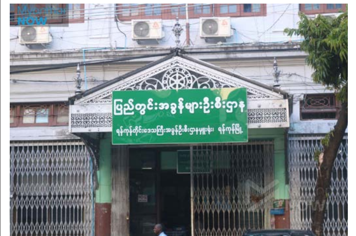
The Internal Revenue Department (Yangon).

Total revenues were collected at K4,745.732 billion in the 2020-2021 financial year and over K3,379 billion in the 2019-2020FY, the information unit under the Central Statistical Organization quoted the Internal Revenue Department as stating. — TWA/CT