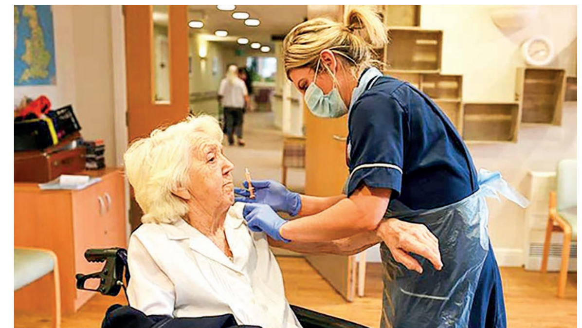
A nurse gives a COVID-19 jab to a care home resident in Wigan.