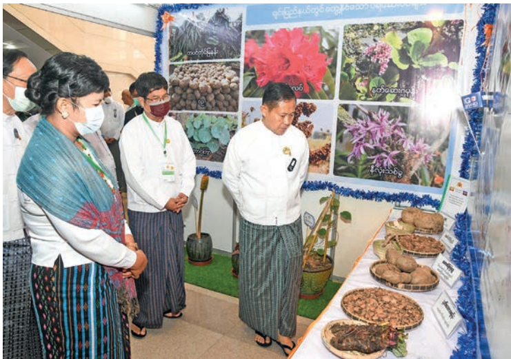
Vice-Senior General Soe Win views round the exhibits at the event.

is conducted annually and its findings are presented at the paper-reading session of the conference and the symposium for improvement of the medical science. The Vice-Senior General urged new-generation traditional medicine practitioners to systematically conduct research for further development of the science. Manufacturing of traditional medicine contributes to the development of MSME businesses as well as supports an increase in the GDP of the