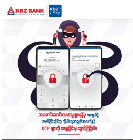
Notice of KBZ bank.

THE local private banks released statements on their Facebook pages as the swindlers ask for the data of customers from mobile phones by pretending as bank staff.