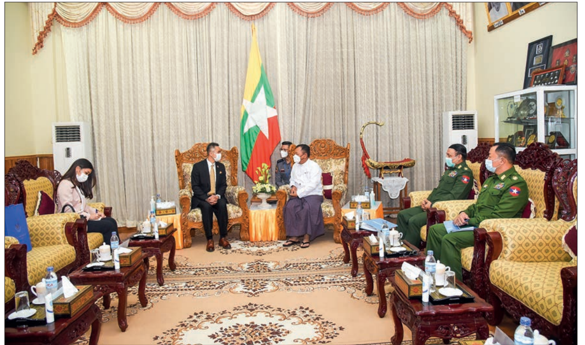
SAC member Union Minister Lt-Gen Soe Htut receives Thai Ambassador Mr Mongkol Visitstump yesterday.

Deputy Minister for Home Affairs Maj-Gen Soe Tint Naing and Deputy Minister and Chief of Myanmar Police Force Maj-Gen Zin Min Htet also attended the meeting. — MNA/MKKS