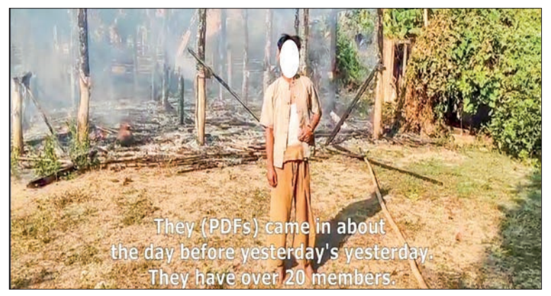
A villager of Naungpin tells what he witnessed in the incident.

madaw personnel in the morning. Then, the PDP came into the village and torched houses. About 30 houses were damaged by the fire. We were too afraid to put out the fire. The PDF entered villages and torched houses whenever fighting erupted.