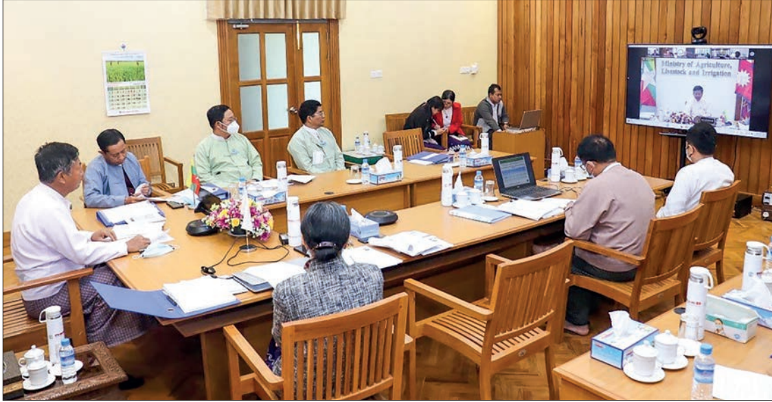
The Regional Seminar on Food Security and Sustainable Food Systems in BIMSTEC is in progress online.

THE Regional Seminar on Food Security and Sustainable Food Systems in BIMSTEC (Bay of Bengal Initiative for Multi-Sectoral Technical and Economic Cooperation) was organized in Myanmar via videoconferencing yesterday.