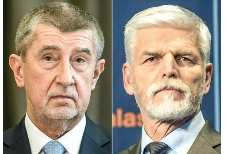
Billionaire ex-prime minister Andrej Babis (L) and retired NATO general Petr Pavel face off in the Czech presidential run-off.

The new head of state will face record inflation in the central European EU and NATO member of 10.5 million people, as well as bulging public finance deficits related to the war in Ukraine.— AFP