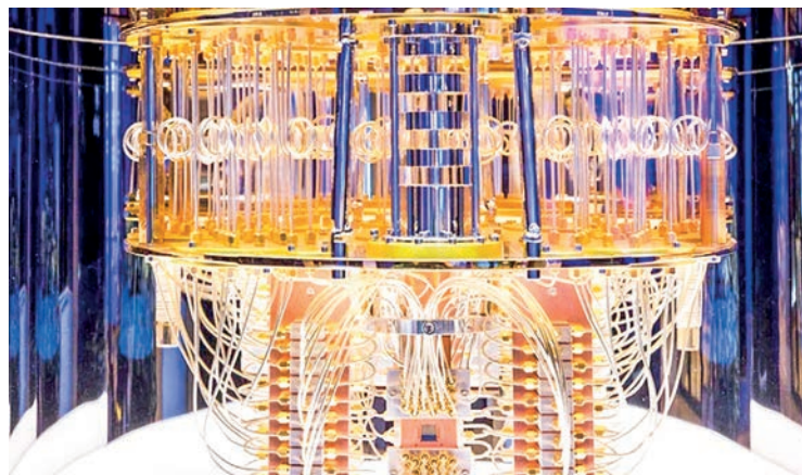
The innards of an IBM quantum computer show the tangle of cables used to control and read out its qubits.

which will have the potential to provide world leading capabilities to help solve complex data problems and could be used in a variety of sectors such as finance, transportation, environmental modelling, and health. Supported through the government's Strategic Innovation Fund, this project of 177.8 million Canadian dollars (142 million US dollars) is expected to create 530 new highly skilled positions in the high-tech and quantum computing fields, the release said.—Xinhua