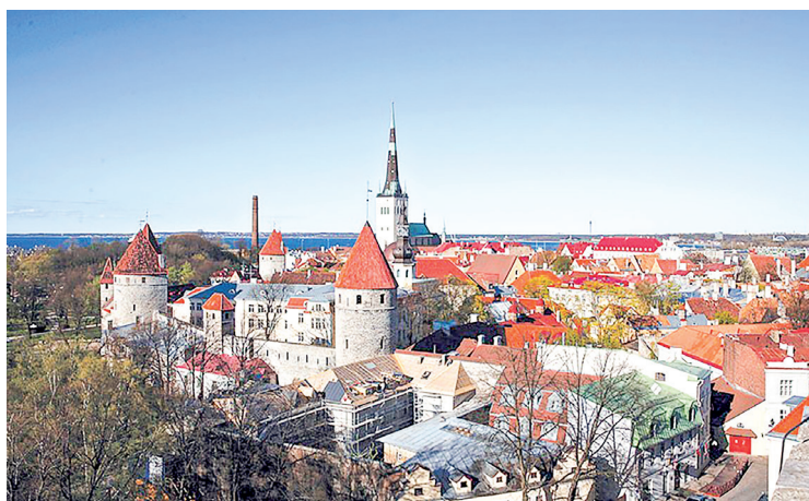
Tallinn is the official capital of Estonia.

In a tit-for-tat move, the Estonian Ministry of Foreign Affairs