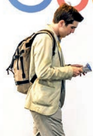
Google's ad dealings generated more than $200 billion in sales in 2021 and is parent company Alphabet's biggest moneymaker by a wide margin.