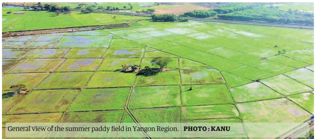
General view of the summer paddy field in Yangon Region.