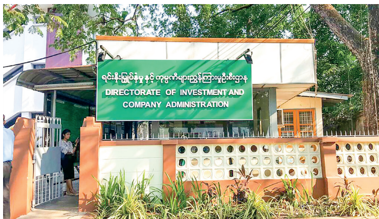
All overseas corporations must submit ARs in the prescribed format on MyCO within 28 days of the financial year ending, as per Section 53 (A-1) of the Myanmar Companies Law 2017.

In addition, all registered companies need to file annual returns (AR) on the MyCO registry system within two months of incorporation, and at least once every year (not later than one month after the anniversary of the incorporation) under Section 97 of the Myanmar Companies Law 2017. Under Section 266 (A) of the Myanmar Companies Law 2017, public