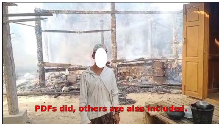
A villager of Moetargyi Village in Kachinsu tells what he witnessed in the incident.