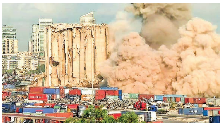
Smoke plume rising after the new collapse of the northern section of the grain silos at the port of Lebanon's capital Beirut, which were previously partly destroyed by the 2020 port explosion.