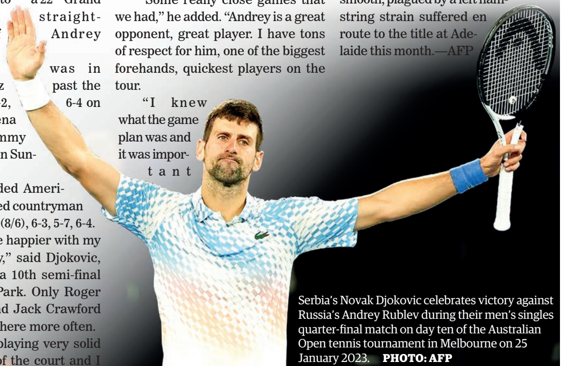
Serbia's Novak Djokovic celebrates victory against Russia's Andrey Rublev during their men's singles quarter-final match on day ten of the Australian Open tennis tournament in Melbourne on 25 January 2023.

that I found my best tennis." Djokovic's quest for a record-extending 10th Australian Open title has been far from smooth, plagued by a left hamstring strain suffered en route to the title at Adelaide this month.—AFP