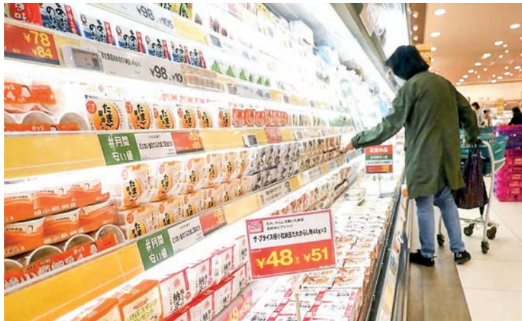
The cost of living in Japan has been pushed up by higher energy and food prices, with inflation hitting its highest level in December since 1981. A shopper browses in the food section at a supermarket in Tokyo's Ota Ward in May 2022.

The latest report said exports “have been in a weak tone recently,” the first time the component was downgraded in 14 months, with the fall particularly marked in Asia. Exports are ex-