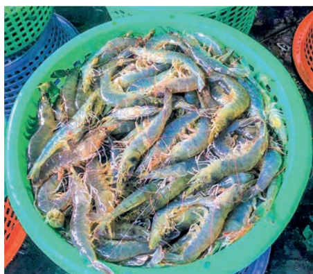
The white shrimp Vannamei farming is thriving in Kadan Island of Myeik Archipelago.

M YANMAR has been shipping its commercially-valued white shrimp Vannamei which has been successfully produced in fishing ponds in Myeik Archipelago, Taninthayi Region for five years, to Japan. Now, the country is making concerted efforts to expand its market to China.