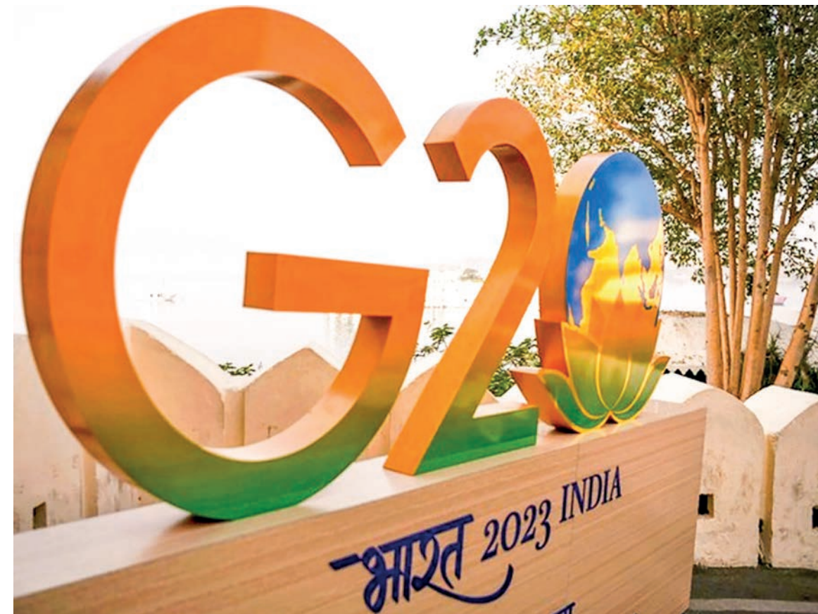
The G20 is an international forum which represents the world's biggest economies encompassing both industrialized and developing nations.

The Declaration, a 19-page document addressed in considerable detail, the major challenges confronting the global economy and financial system. In his remarks in the first session on Energy and Food Security, PM Modi clearly stated that the United Nations had failed to resolve the political and economic challenges afflicting the world. It is because of the