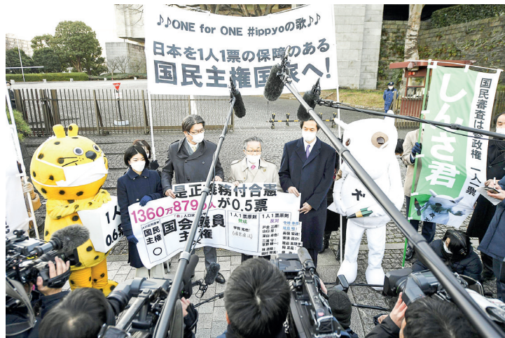
Lawyers are pictured outside the Supreme Court in Tokyo on 25 January 2023, following its ruling that the vote disparity of up to 2.08-fold in the 2021 lower house election was constitutional.

Two groups of lawyers had filed the 16 lawsuits. Out of them, nine rulings said the gap was constitutional, while seven others said the election was held "in a state of unconstitutionality". None of them favoured the plaintiffs' demand to nullify the election result. The top court's ruling comes after Japan's parliament last November enacted a law bringing about the country's largest-ever change to the boundaries and distribution of lower house single-seat constituencies, to correct a vote-value disparity.—Kyodo