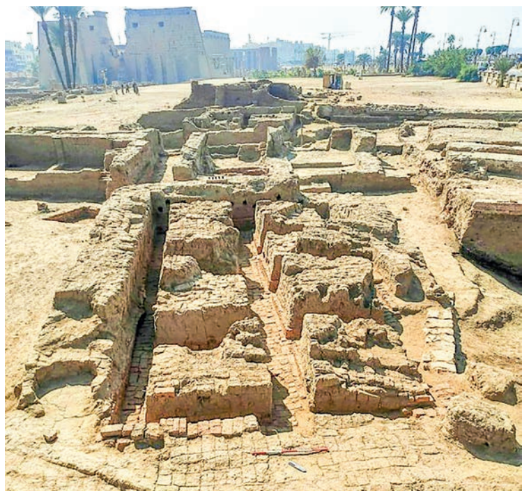
The excavation site of the Roman-era city discovered in the Egyptian city of Luxor, as seen in this photograph from the Egyptian Ministry of Antiquities.

EGYPTIAN archaeologists said Tuesday they had discovered an