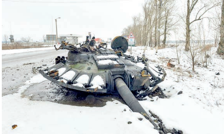
It's December, especially in Ukraine, where temperatures in some cities are already as low as 20 degrees Fahrenheit.

When the G-7 foreign ministers held a virtual meeting in late December, they denounced Russia for attacking Ukraine's energy facilities and infrastruc-