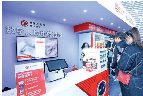
Visitors pay via e-CNY during an expo in Wuzhen, Zhejiang province.

With the digital currency included, China's outstanding M0, the amount of cash in circulation, totalled 10.47 trillion yuan by the end of last year, up 15.3 per cent year on year, according to the People's Bank of China.