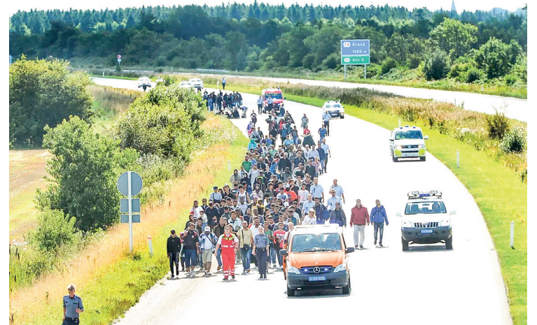
Migrants, mostly from Syria and Iraq, set out on foot along a highway on the Danish-German border, heading north to Sweden.

"If refugees who would be forced to return receive information about the regulations that apply here, we reduce the risk of suffering for these people and