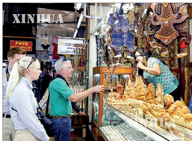
Three foreigners are seen buying souvenirs at a traditional handicraft store in Yangon.