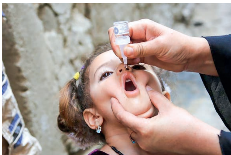
Afghanistan's Public Health Ministry, according to the statement, has been trying to bring to zero the crippling disease among children in the country.

AFGHANISTAN launched the first campaign this year to administer the polio vaccine to more than 5.3 million children under five in 16 out of the country's 34 provinces, the country's