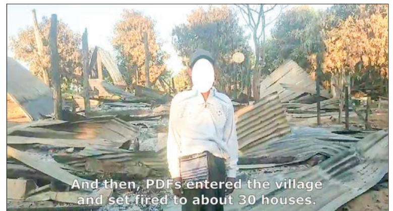
A villager of Minle tells what he witnessed in the incident.

We heard an exchange of fires between the PDF and Tat-