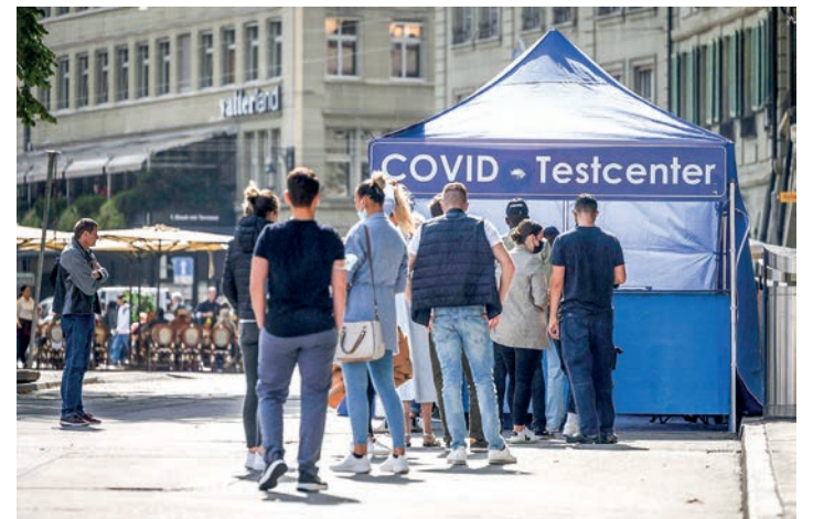
People queue at a Covid test centre installed in a street of Swiss capital Bern on 17 September 2021.

The Schweiz am Wochenende newspaper reported earlier this month that Berset's former communications chief had, at the height of the pandemic, systematically leaked information to one of Switzerland's largest media houses about confidential government plans for measures to counter the spread of the virus, including around vaccines and the reopening of businesses.—AFP