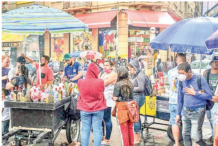
People visiting a commercial street in downtown Sao Paulo, Brazil.

BRAZIL collected a record 2.218 trillion reals (429 billion US dollars) in taxes in 2022, the most since records started being kept in 1995, the Federal Revenue of Brazil (RFB), the tax administration agency, said Tuesday.