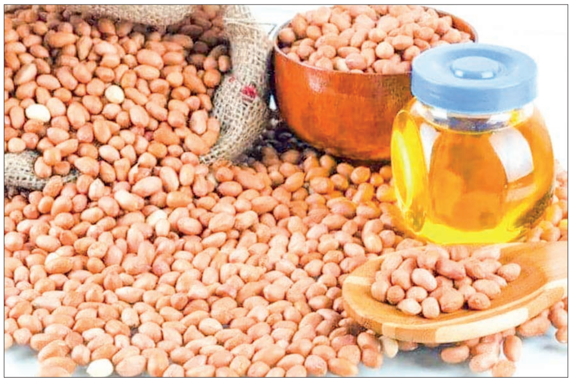
Peanuts are pictured in the market.

Exports of Myanmar's edible oil crops resumed as the world's top palm oil exporters