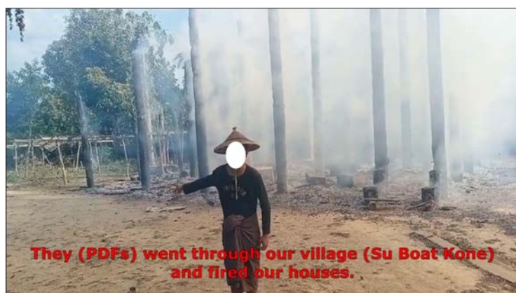
A villager of Subokegon tells what he witnessed in the incident

ing out and wearing uniforms but we didn't know who they were. There are about 40 or 50 of them. Some of them were wearing mufti and others were in guerrilla uniforms. They torched my house. Some of them were guerrillas and I didn't know whether they were the PDF or the KIA. I saw them.