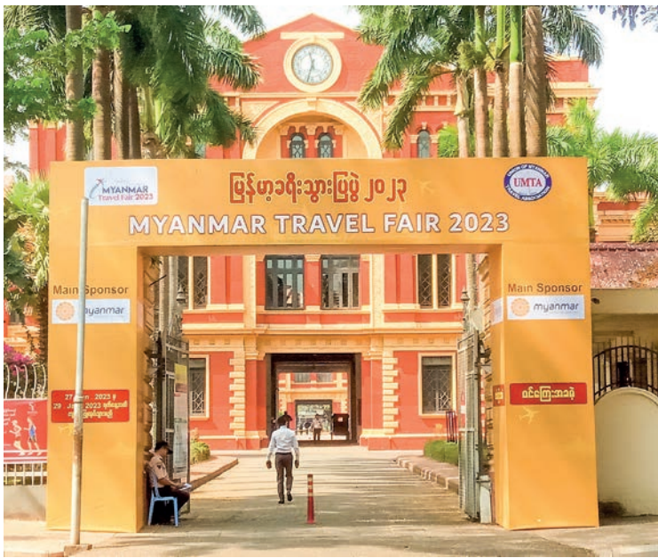
Entrance signboard is pictured at the Secretariat Office in Yangon yesterday.

THE Myanmar Travel Fair 2023 will be held at the Secretariat Office in Yangon starting from 27 to 29 January. The event will include over 40 booths of travel companies, airlines, hotels, restaurants, handicrafts, local products, local foods, insurance companies, healthcare companies and trav-