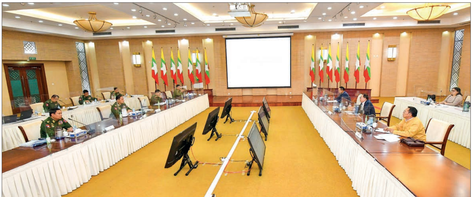
The second-day meeting between the State Peace Talks Team and the peace delegation headed by the RCSS Chair is progress yesterday.

pending issues from the first-day meeting and bilateral proposals on democracy and federalism. The 33 basic policies on Shan State proposed by the