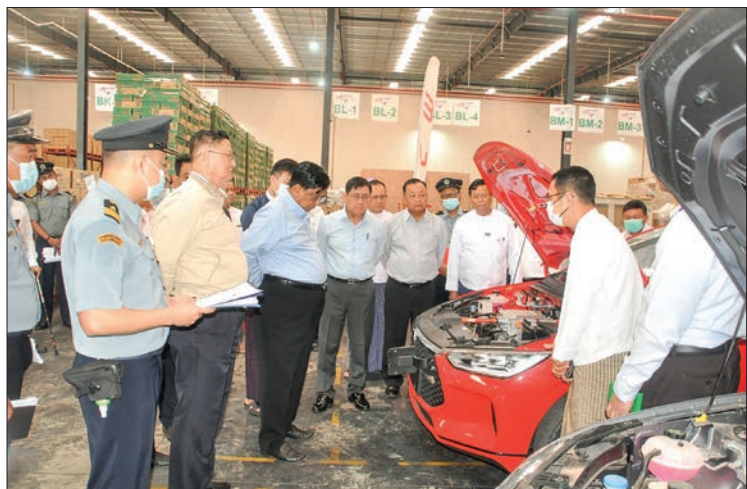
Battery electric vehicles (BEVs) imported from China are being inspected.

OF the first batch of 40 electric vehicles that arrived in Myanmar, two companies will operate 20 vehicles as taxis at Yangon Airport and Nay Pyi Taw Thabyaygon Market.