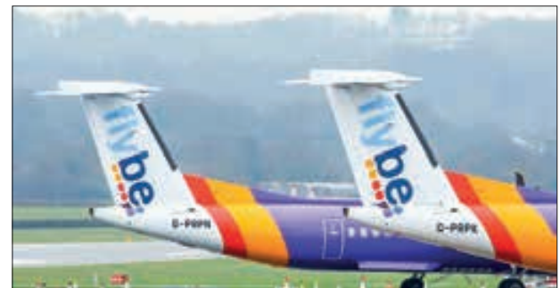
Flybe had only returned to the skies in April after it crashed into bankruptcy as the coronavirus crisis erupted.

"It is always sad to see an airline enter adminis-