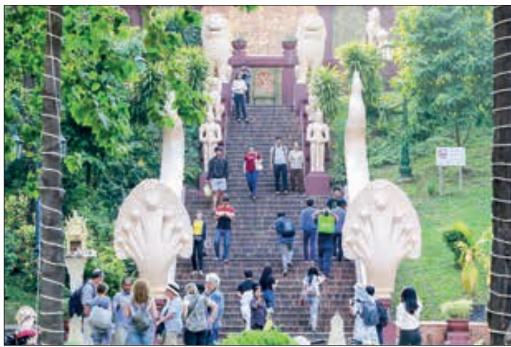
Tourists visit the Wat Phnom historic site in Phnom Penh, Cambodia, January 2019