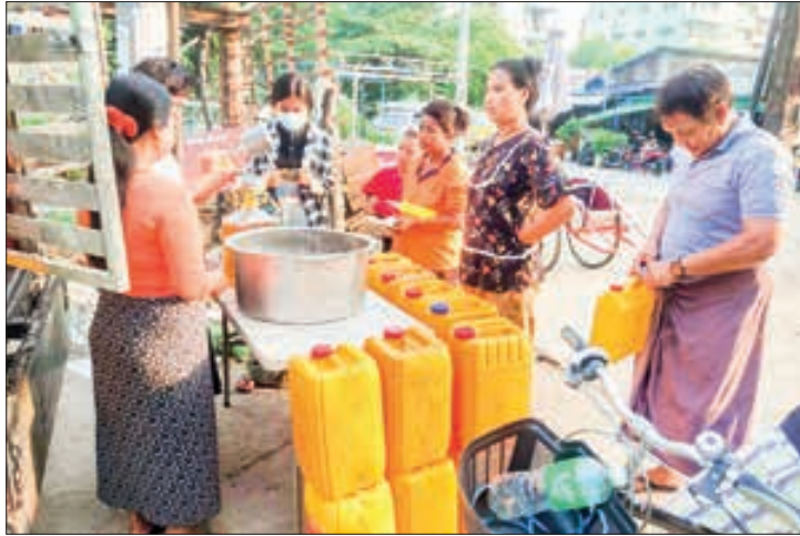
Myanmar Edible Oil Dealers Association sell palm oil at an affordable rate to consumers through the mobile market truck.

below K5,500 per viss for two weeks in mid-December. Yet, the difficulty in withdrawing palm oil from oil tanks in early 2023 pushed up the prices to K6,100 per viss on 9 January and