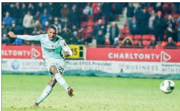
Moises Caicedo has pleaded to Brighton to let him join Arsenal.

cused only on Brighton. I hope he can stay with us until the end of the season because in my opinion, it's the best solution for him, for us," De Zerbi told reporters on Friday.