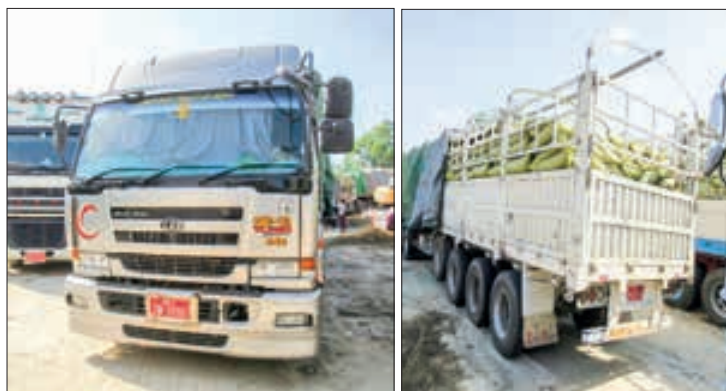
Confiscated illegal commodities and lorries in Kayin State.

Therefore, 22 arrests (at an estimated value of K458,588,000) were made from 25 to 27 January, according to the Illegal Trade Eradication Steering Committee. — MNA/KZW