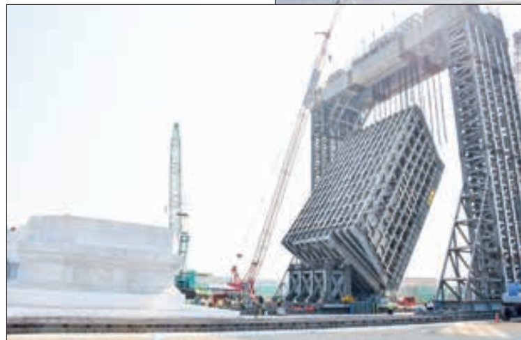
The lifting of the Maravijaya Buddha image is seen being 54.6° at noon on 28 January 2023.