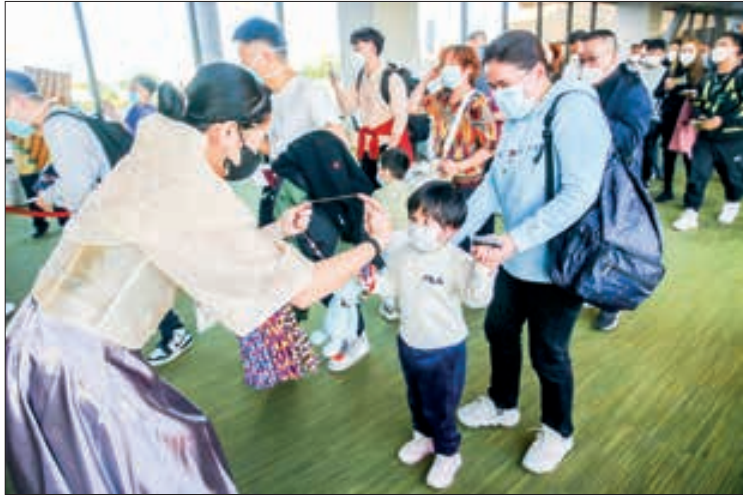
Tourists from China are welcomed at the Ninoy Aquino International Airport Terminal 1 in Pasay City, the Philippines, 24 January 2023.

PHILIPPINE President Ferdinand Romualdez Marcos Thursday ordered government agencies to work on the extension of e-visa for travellers from major tourism markets in Asia, includ-