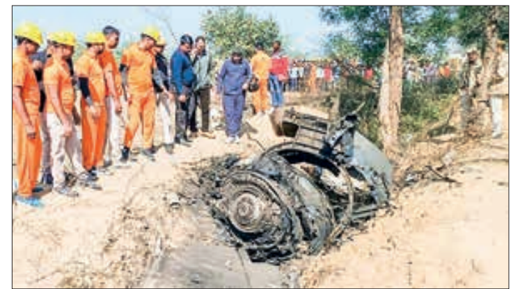
Rescuers inspect the wreckage of a crashed aircraft in Rajasthan.

It involved a Russian-made Sukhoi Su-30, carrying two pilots, and a French-built Mirage 2000, operated by a third, and was reported by witnesses to police at around 10:00 am (0430 GMT).—AFP