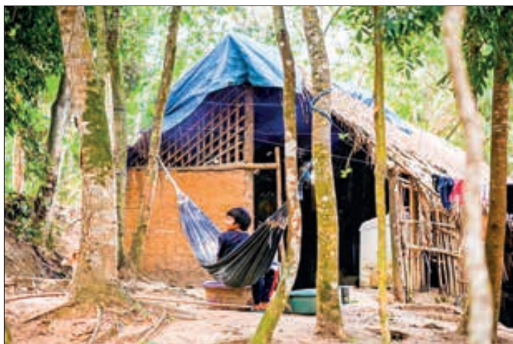
A Guarani Indigenous child swings in a hammock at the Kyringue Arandua Indigenous land, in the municipality of Marica, Rio de Janeiro State, Brazil, 29 July 2022.

TERRITORIES in Brazil’s fragmented Atlantic Forest where Indigenous peoples enjoy secure land rights have seen measurably less deforestation than similar areas in which land tenure is weak or non-existent, researchers reported Thursday.