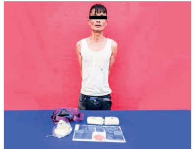
An arrestee is pictured along with seized stimulant pills.

Those offenders are prosecuted under the Narcotic Drugs and Psychotropic Substances Law. — MNA/MKKS