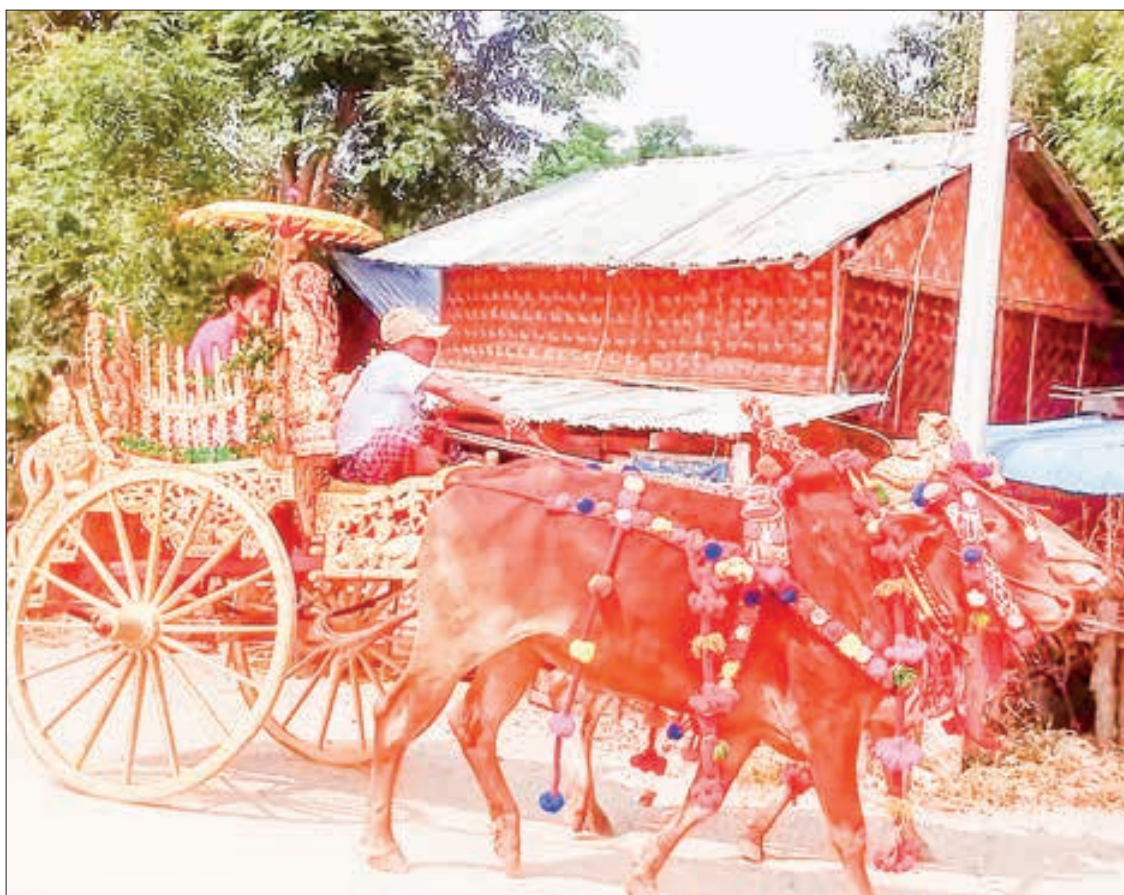
One of the Myanmar traditional cultures – a decorated fancy bullock cart.

The fancy bullock cart can be divided into three types depending on the posts lining the railings which shape the drooping form of posts on both sides of the cart body, the wings of a seagull, and carved rails. The fancy bullock cart is used in donation ceremonies and festivals as well as bullock cart contests. Moreover, the fancy bullock cart is often donated to members of the Sangha for their convenient travel. The fancy bullock cart can accommodate five passengers only because it is just for a show of riding. In the past, novices-to-be were carried by the fancy bullock cart for procession in the village before arriving at the monastery. Although fancy bullock carts were used in various forms in Bagan, Pinya, Inwa and