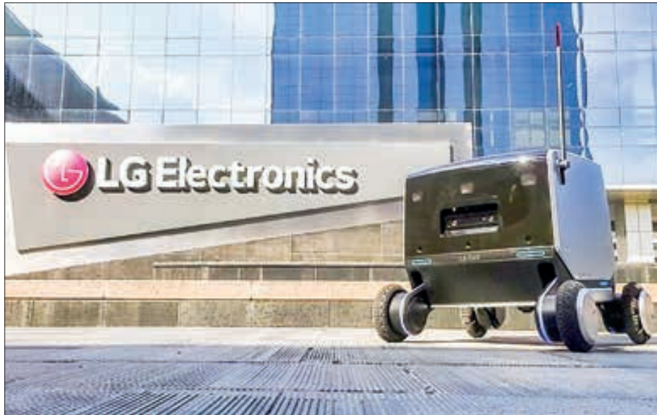
This file photo provided by LG Electronics Inc. on 13 July 2021, shows the company's new indoor-outdoor delivery robot. PHOTO: REPRESENTATIVE IMAGE/LG

The company said the revenue growth was driven by strong demand for premium home appliances