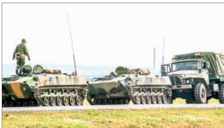
One of the goals of the operation was the "de-Nazification" of Ukraine, Putin said, when he announced nearly one year ago he had ordered Russian troops towards Kyiv. Russian soldiers outside the rebel stronghold of Donetsk

"This is evidenced by the crimes against civilians, ethnic cleansing and punitive actions organised by neo-Nazis in Ukraine. It is against that evil that our soldiers are bravely fighting," he said in a statement.