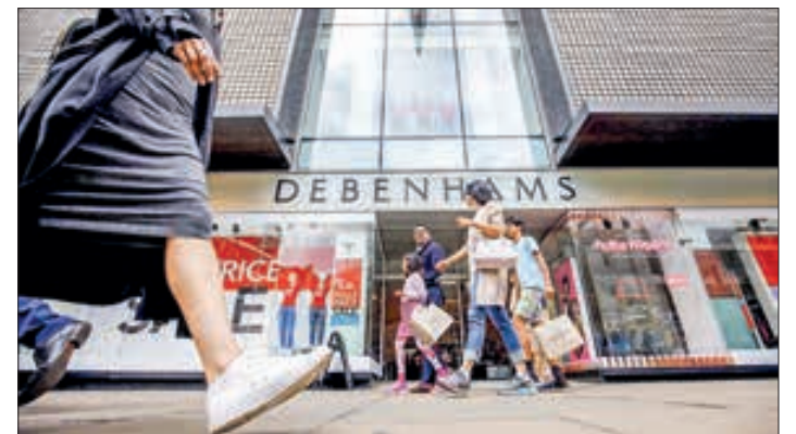
The Bank of England and the UK government’s own fiscal watchdog, however, believe that the economy has already entered recession on fallout from rampant consumer price inflation.

He added: “If we look further ahead, the case for declinism becomes weaker still. The UK is poised to play a leading role in Europe and across the world in the growth sectors which will define this century.”—AFP