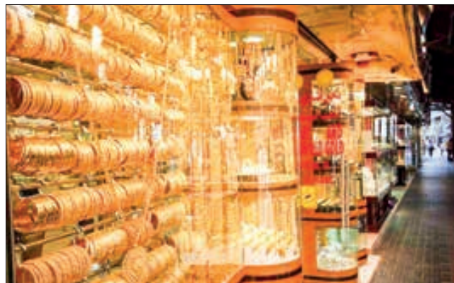
The gold outlet is seen in Yangon.

There are over 10,000 gold retailers in Yangon and almost all outlets have gold licences.