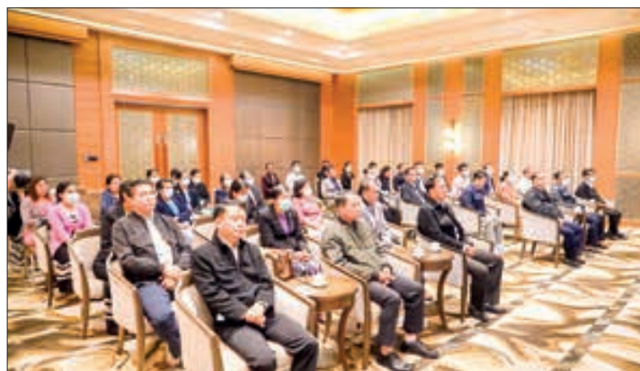
Union Minister Dr Htay Aung meets hoteliers from Nay Pyi Taw Union Territory yesterday.

During the meeting, the Union minister said Nay Pyi Taw is stated as the capital city of the country, an administrative city in the Constitution. Therefore, the hotel zones including the recreational sites, tourist destinations,