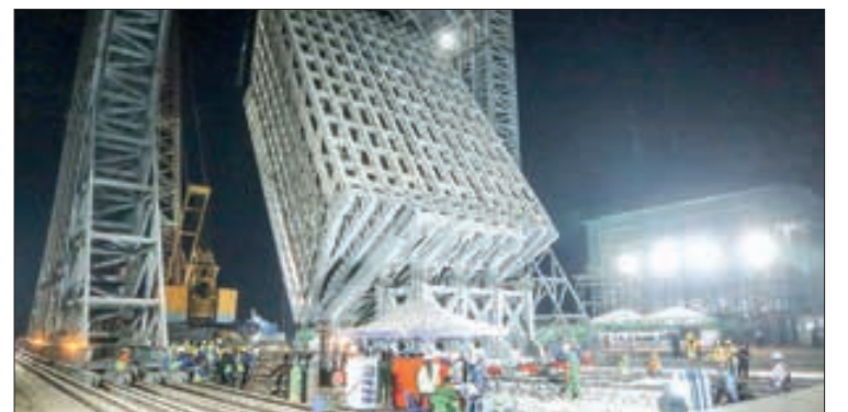
Lifting position is seen being 58.6° at 7 pm on 28 January 2023.

A steel crane is being used in lifting the Maravijaya Buddha Image on the jewelled throne. The image was lifted up to 68.6° at midnight yesterday. —MNA/TTA