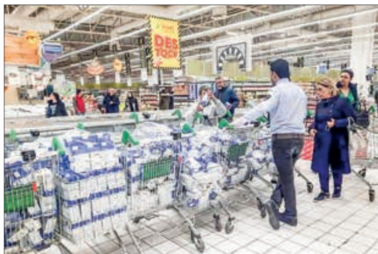
This picture taken on 12 January 2023 shows a view of carts filled with milk packages at a supermarket in Tunisia’s capital Tunis, where rationing is imposed to limit customers to two packets of milk per person amidst a shortage of coffee, milk, pasta, and sugar. PHOTO: FETHI BELAID / AFP

“These cows used to be my family’s main income,” he said. “Now four of my kids are working elsewhere to try to earn money to feed the herd.”—AFP