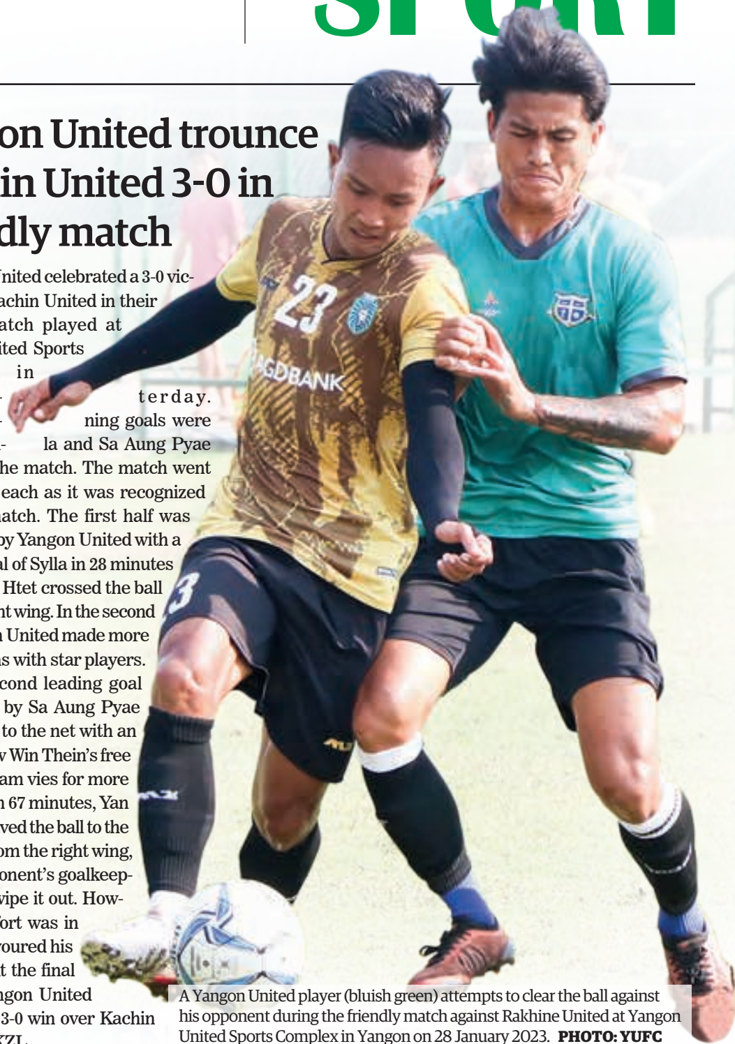
A Yangon United player (bluish green) attempts to clear the ball against his opponent during the friendly match against Rakhine United at Yangon United Sports Complex in Yangon on 28 January 2023.