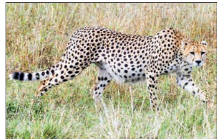
The cheetah is the world’s fastest land animal and Africa’s most endangered big cat PHOTO: REPRESENTATIVE IMAGE/ AFP/ FILE

Officials said the previous transfer from Namibia marked the first intercontinental relocation of cheetahs, the planet’s fastest land animal.—AFP