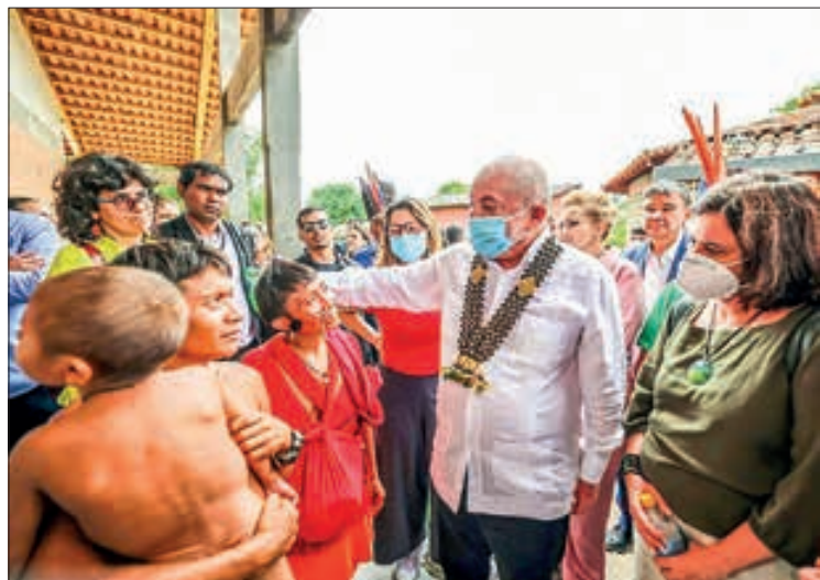
This handout picture released by the Brazilian Presidency press office shows Brazilian President Luiz Inacio Lula da Silva visiting the Yanomami Indigenous Health House (Casai) in the Boa Vista rural area, Roraima state, Brazil, on 21 January 2023.

In a hospital in Brazil's Amazon, half a dozen Yanomami children are dozing in blue hammocks. Some are suffering from pneumonia, others from malaria. Some even have snake bites. All of them are underfed.