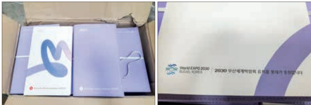
Seized illegal goods at the warehouse of Yangon International Airport.

A Customs team under the supervision of the Anti-Illegal Trade Task Force of Mon State made inspections on 25 January and seized 700 kilogrammes of frozen fish, 315 kilogrammes of peas and eight boxes of Thai-made tempura powder estimated at K4,740,000 ownerless on Mawlamyine road in Paung Township and the action was taken under Customs procedures.