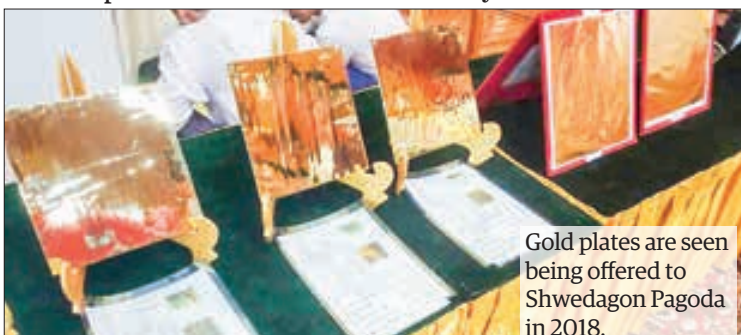
Gold plates are seen being offered to Shwedagon Pagoda in 2018.

It is announced that 10,000 gold foils made by machine and 14,000 traditional handmade gold foils will be purchased through bidding for gold-foil offering to Shwedagon Pagoda on 16 January. The tender opening for traditional handmade gold foils will be launched at the southern corner of the pagoda at noon on 14 February while the machine-made gold foil tender at 3 pm on the same day. — TWA/KTZH