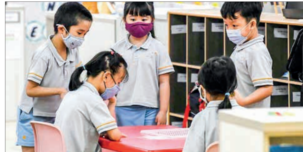
Children wearing face masks gather around a table inside their classroom as schools reopened in Singapore on 2 June 2020. PHOTO: FOR REPRESENTATIONAL PURPOSE ONLY/AFP/FILE

As they grow up and expose to more viruses, the naive T cells are