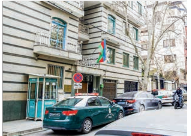
Police stay guard in front of the Azerbaijan embassy in Tehran on 27 January 2023, following an attack.

Azerbaijan's foreign ministry identified the victim as a guard, who had served as the head of security at the embassy, saying the Friday attack also wounded two people.—Xinhua