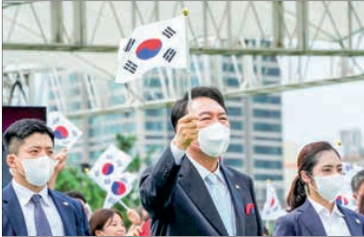
South Korean President Yoon Suk-yeol attends a ceremony marking Korean Liberation Day from Japanese colonial rule, in Seoul on 15 August 2022.

JAPAN plans to make clear it will maintain an apology to its neighbours over past aggressions, as part of efforts to improve its ties with South Korea, if Seoul finalizes a solution to a wartime labour issue, a government source said Saturday.