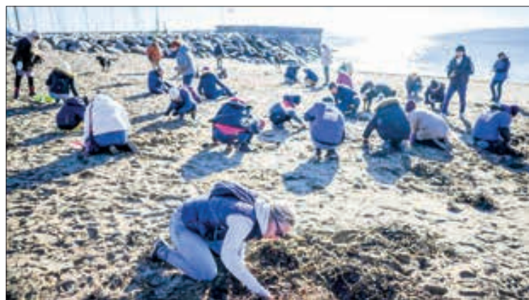
Dozens of volunteers look for plastic beads, also called nurdles or 'mermaid's tears,' on a beach in Pornic, France, on 21 January 2023.

But they can easily spill into the ocean when a cargo ship