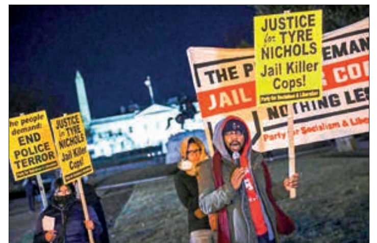
Protesters rally against the fatal police assault of Tyre Nichols, in Lafayette Square near the White House in Washington, DC, on 27 January 2023. The US city of Memphis released 27 January 2023 graphic video footage depicting the fatal police assault of a 29-year-old Black man, as cities nationwide braced for a night of protests against police brutality.

Subsequent segments -- the footage runs about an hour in total, and is audio-only in parts -- show Nichols crying out for his mother, and moaning as officers repeatedly kick and punch him. In one extremely graphic video, officers are seen aiming several kicks at Nichols' face. After pulling him up, they deliver five punches to his face. When he falls to the ground they aim two more kicks at his face.—AFP