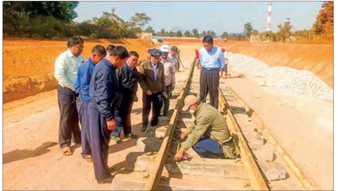
MoTC Deputy Minister U Aung Myaing and party inspect the upgrading work in Shan State.

He also instructed officials from Kalaw, Aungban, Shwenyaung, and Taunggyi stations to ensure cleaning and greening, growing flowering plants at the stations and station yards, and the convenience of passengers. — MNA/KZW