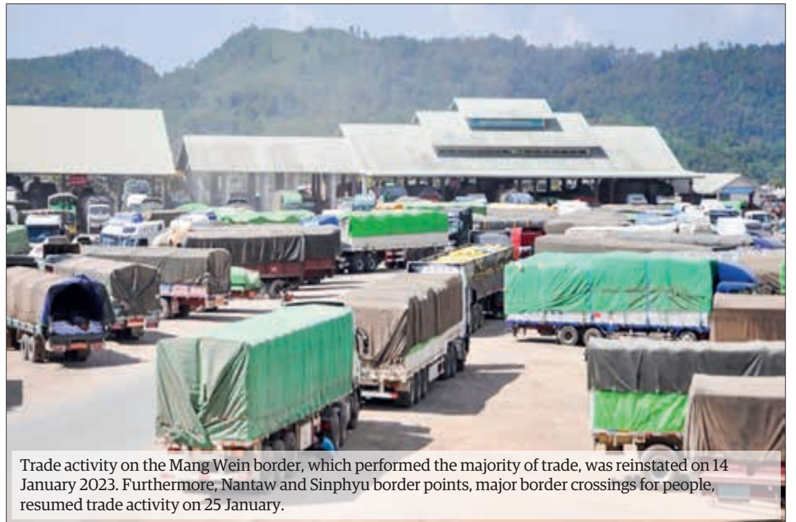
Trade activity on the Mang Wein border, which performed the majority of trade, was reinstated on 14 January 2023. Furthermore, Nantaw and Sinphyu border points, major border crossings for people, resumed trade activity on 25 January.

Myanmar primarily conveys goods to China via the Muse border. Nonetheless, traders usually face challenges amid the policy changes in China trig-