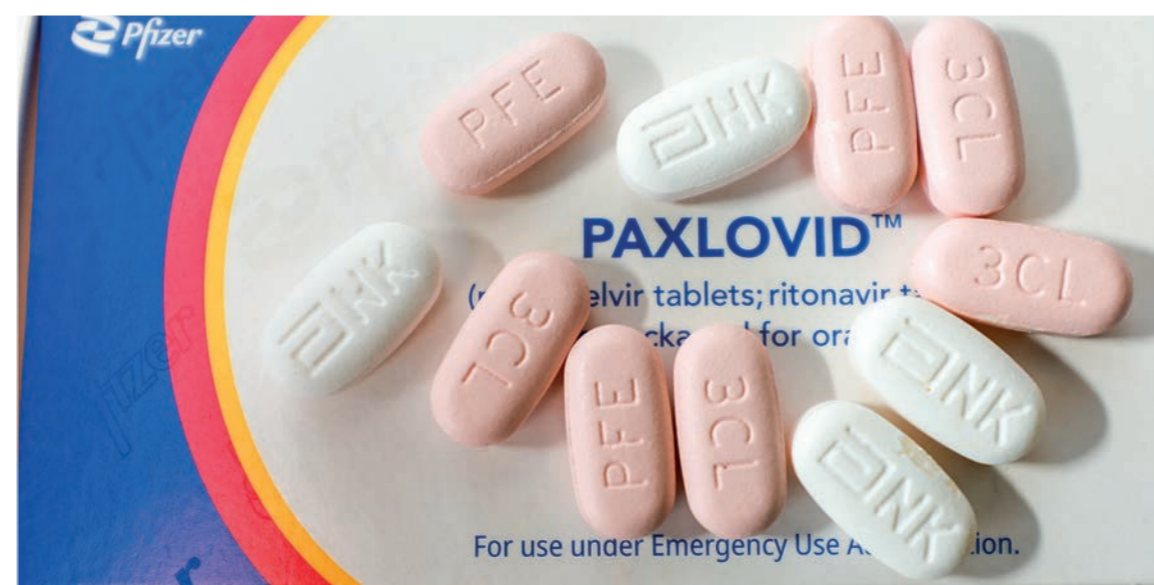
Paxlovid is an antiviral therapy that consists of two separate medications packaged together. Paxlovid, Pfizer's antiviral medication to treat the coronavirus disease (COVID-19), is displayed in this picture illustration.