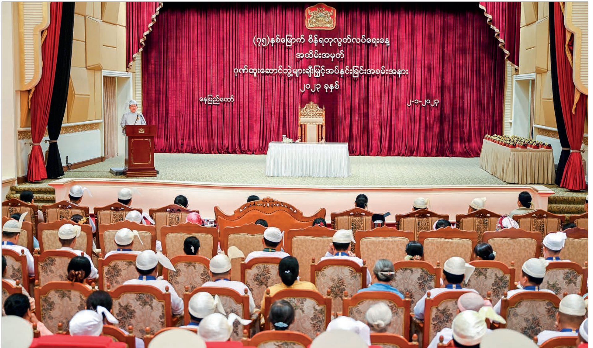
State Administration Council Chairman Prime Minister Senior General Thadoe Maha Thray Sithu Thadoe Thiri Thudhamma Min Aung Hlaing speaks on the second-day occasion of conferring honorary titles to mark the 75 th Anniversary (Diamond Jubilee) Independence Day 2023 in Nay Pyi Taw on 2 January 2023.

THE second-day ceremony to confer honorary titles on relevant recipients in commemoration of the 75 th Anniversary (Diamond Jubilee) Independence Day 2023 took place at the Thabin Hall of SAC Chairman Office yesterday