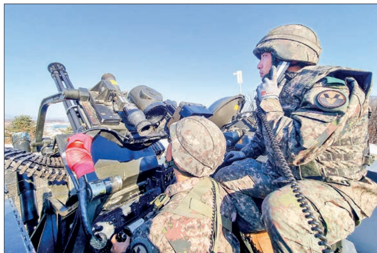
This handout photo taken on 29 December 2022 and provided by the South Korean Defence Ministry shows South Korean soldiers operating a 20mm Vulcan rotary cannon during an anti-drone drill in Yangju.

Since talks collapsed in 2019, Kim has doubled down on his banned weapons programmes, and Seoul and Washington have warned for months that Pyongyang is preparing to conduct its seventh nuclear test.—AFP