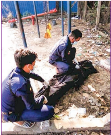
Bodies of the deceased.

The two dead bodies were sent to the Medawi hospital mortuary in North Okkalapa township by the Pale Auxiliary Fire Brigade and the police are investigating the case. — TWA/KZW