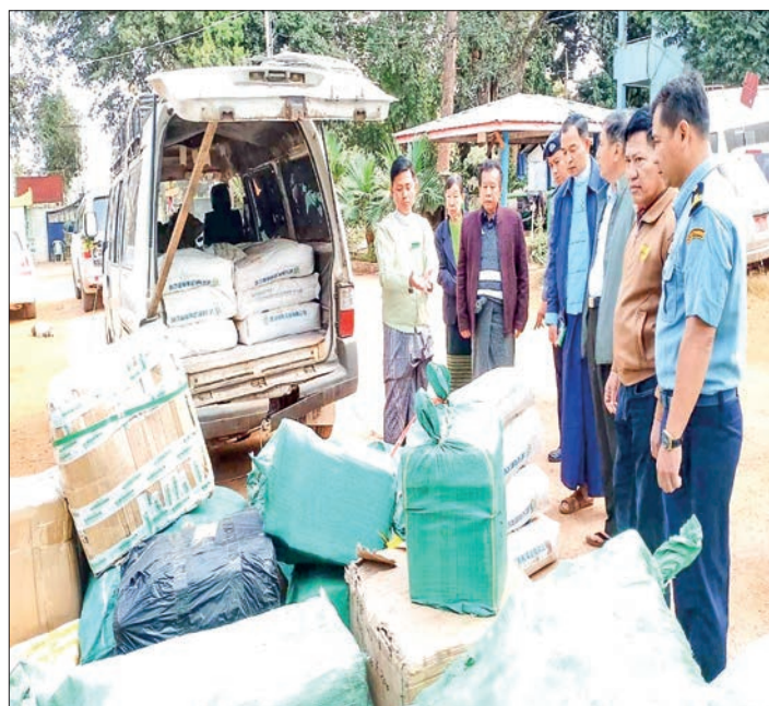
Officials check confiscated illegal commodities in Shan State.

were made on 31 December and 1 January, according to the Illegal Trade Eradication Steering Committee.— MNA/MKKS