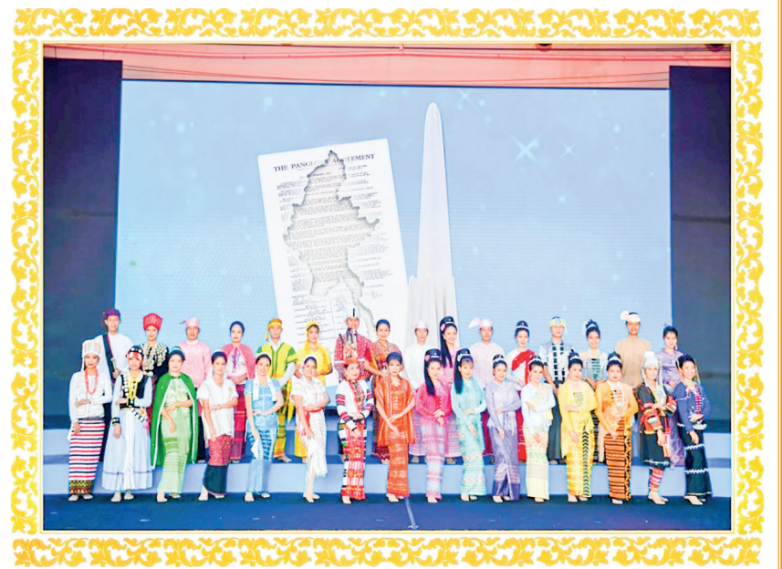
Union Ethnic People.

(Excerpt from the speech delivered by Chairman of the State Administration Council Prime Minister Senior General Min Aung Hlaing at the State Administration Council Meeting 4/2022 held on 12-5-2022)