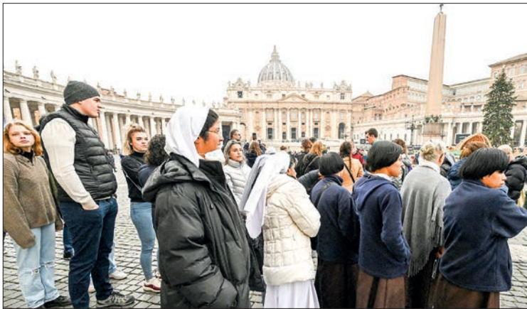
People wait in line to pay respect to Pope Emeritus Benedict XVI at St Peter's Basilica in the Vatican on 2 January 2023.

THOUSANDS of Catholics paid their respects Monday to former pope Benedict XVI at the Vatican, at the start of three days of lying-in-state at St Peter's Basilica before his funeral.