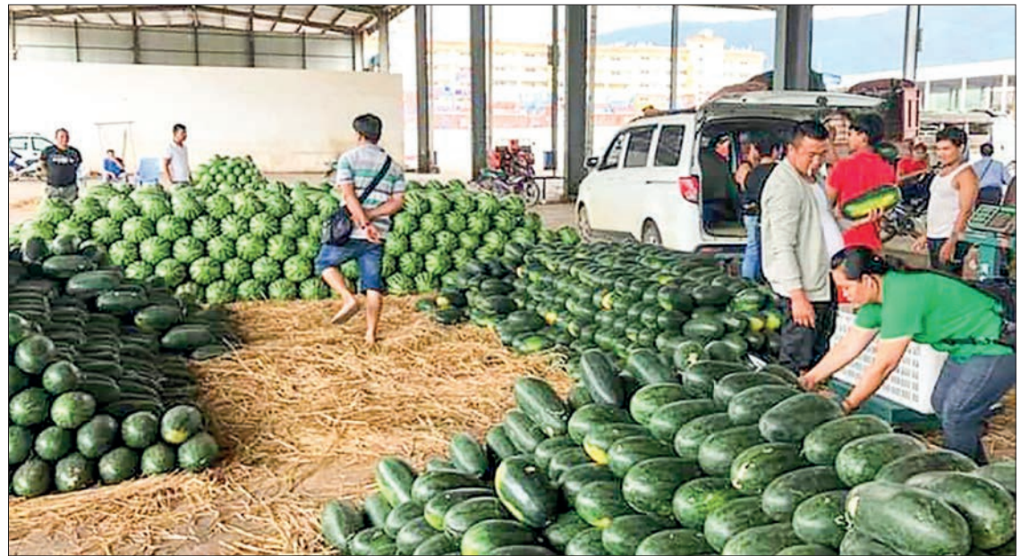
Watermelons are seen before being exported to China on the Sino-Myanmar border.

other food commodities to China through Kyinsankyawt by 100 trucks and building materials, electrical appliances, household goods and industrial raw materials are imported into the country by 40 trucks. — NN/EMM