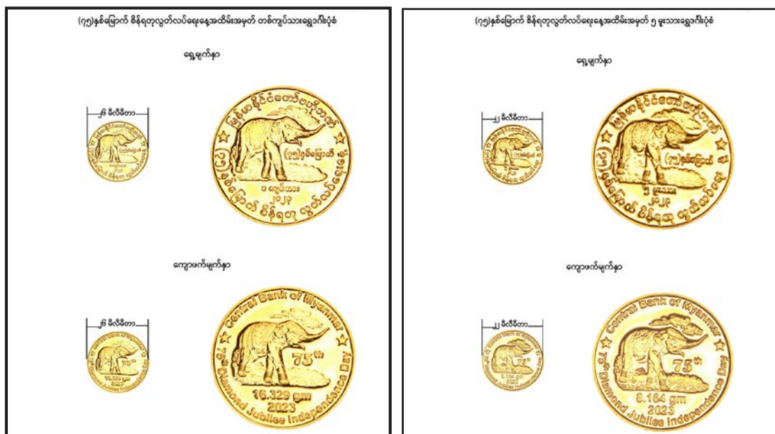
Samples of new one-tical (left) and half-tical (right) gold coins.

MARKING the Diamond Jubilee Independence Day of the Republic of the Union of Myanmar that will fall on 4 January 2023, the government will issue new gold coins weighing one-tical and half-tical.