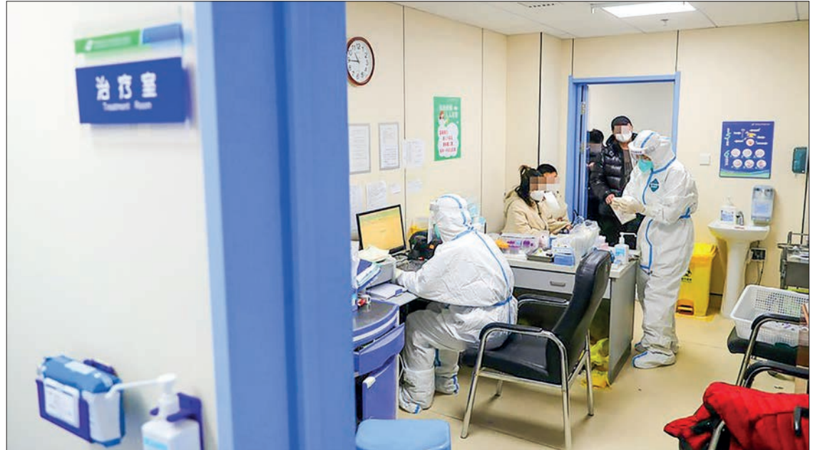
Medical workers treat patients at a fever clinic at Shengjing Hospital of China Medical University in Shenyang, northeast China's Liaoning Province, 15 December 2022.

AS multiple regions in China are hit with surging COVID-19 infections, local hospitals are going all out to offer timely treatment, particularly for severe cases.