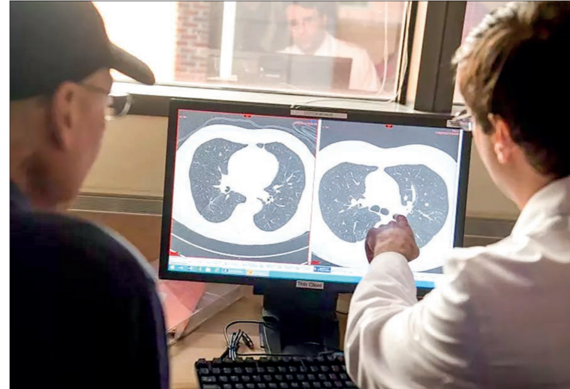
Cancer is a leading cause of death worldwide, yet up to half of diagnosed cancer is preventable through lifestyle changes and vaccination, such as human papillomavirus (HPV).

Questions on health habits and behaviours included a preference for conventional or alternative medicines