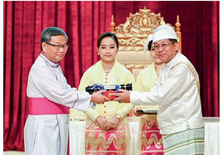
The Senior General gives the Thiri Pyanchi title to Archbishop Steven Than Myint Oo.

in building a peaceful, tranquil, modernized and developed nation, safeguarding Our Three Main National Causes, pouring out significant endeavours into economic, social and public ad-