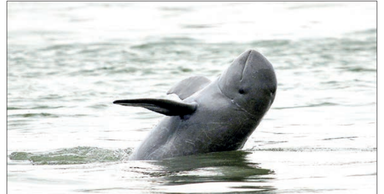
This handout photo taken on 24 March 2012 and released by the World Wildlife Fund - Cambodia (WWF-Cambodia) on 20 February 2014 shows a dolphin swimming in the Mekong river in Kratie province some 300 kilometres northeast of Phnom Penh.

“The Mekong river, which is home to near-extinct dolphins and fish species, must be well managed so that dolphins will not die from entanglement in gillnets,” he said. Gillnets are nets strung across parts of the river to snare fish.—AFP