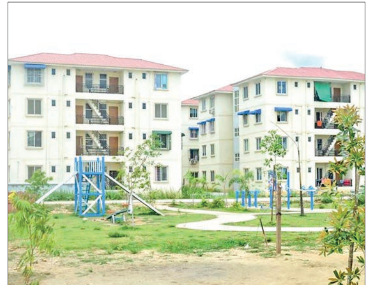
Some apartments of the public rental housing in Dagon Myothit (South) Township.

implemented by the Myanmar Construction Entrepreneurs Federation (MCEF) and Myanmar Licenced Contractors Association (MLCA). The housing projects are implemented in Nay Pyi Taw, Yangon and Mandalay to provide accommodation for civil servants, retired employees, and low-income people. As the first phase of public rental housing projects (10,000 apartments), 28 buildings in Nay Pyi Taw, 194 buildings in Yangon and 91 buildings in Mandalay are constructed with the 2022-2023 Union budget.— TWA/KZW