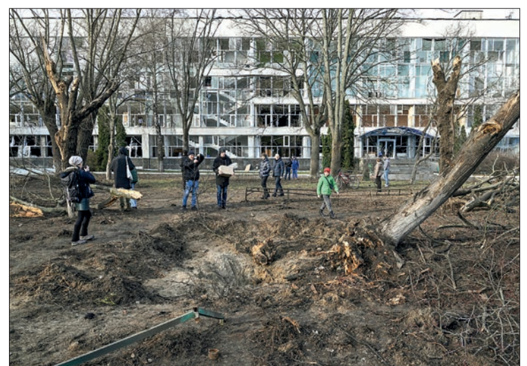
Bystanders look at a crater next to an educational building in Kyiv on 1 January 2023, which was damaged by a missile strike on the previous day, amid the Russian invasion of Ukraine.

In total, Russia has launched 45 combat drones, including 32 on Sunday after midnight and 13 late on Saturday, against Ukraine overnight Sunday and all of them were shot down by the air defence, according to the Air Force Command of the Ukrainian Armed Forces. —Xinhua