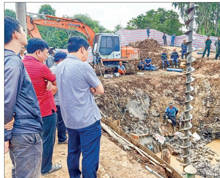
Rescuers look down into the site of where a 10-year-old boy is thought to be trapped in a 35-metre deep shaft at a bridge construction area in Vietnam's Dong Thap province on 2 January 2023.

On Monday, Prime Minister Pham Minh Chinh asked federal-level rescuers to join efforts by local authorities to save the boy.—AFP