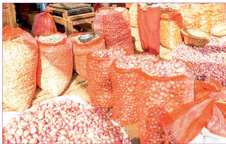
Onions are seen being supplied to warehouses in the Yangon wholesale market.

The prices of newly harvested monsoon onions dropped by half owing to the large supply from the main producing areas