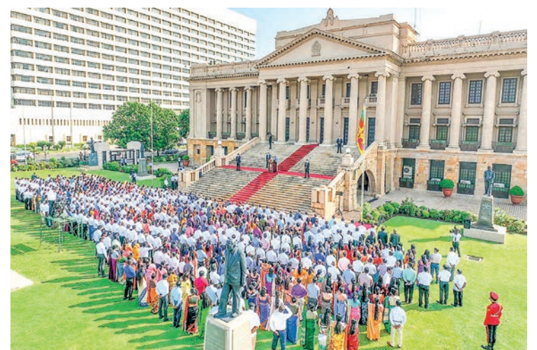
This handout photograph taken on 2 January 2023 and released by the Sri Lanka President's Office shows Sri Lankan President Ranil Wickremesinghe (C top) addressing the staff of the presidential secretariat in Colombo. A record 20,000 civil servants retired at the end of December — eight times as many as usual according to the public administration ministry — after Wickremesinghe reduced their retirement age from 65 to 60.

As part of the new measures, the finance ministry has also banned non-essential capital expenditure.—AFP