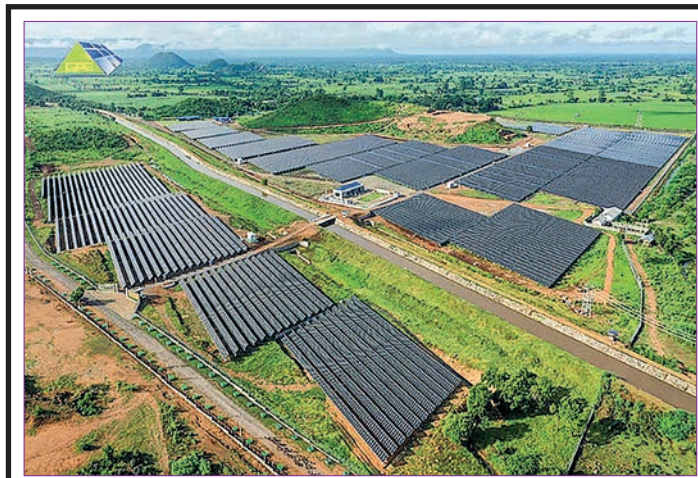
A part of the Taungdawgwin Solar Power Project is shown in the picture.