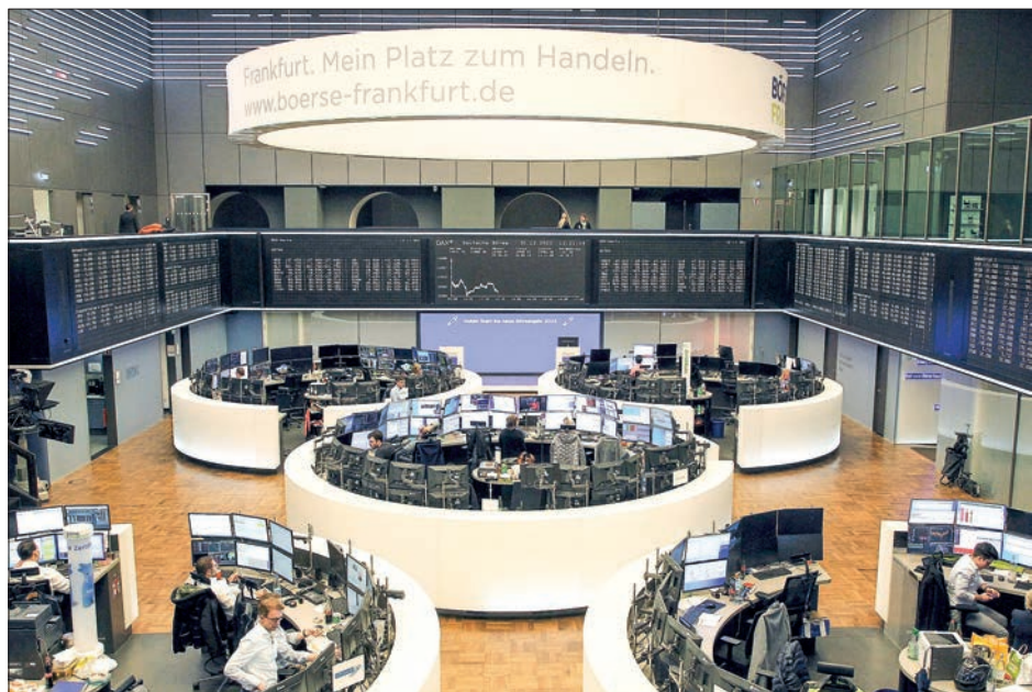
Brokers work at the stock exchange in Frankfurt am Main, western Germany on 30 December 2022.

EUROPEAN stock markets started the New Year on a high note on Monday after a tumultuous 2022, with the IMF chief warning that a third of the global economy faces recession in 2023.