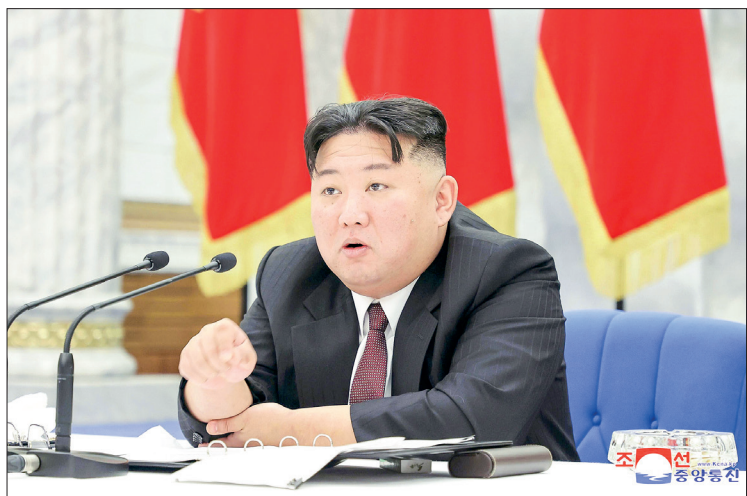
North Korean leader Kim Jong Un attends the 12 th meeting of the Political Bureau of the 8th Central Committee of the Workers' Party of Korea in Pyongyang on 30 December 2022.

NORTH Korean leader Kim Jong Un has called for an "exponential increase" in the country's nuclear arsenal, highlighting the need to mass-produce tactical nuclear weapons, as well as development of a new intercontinental ballistic missile