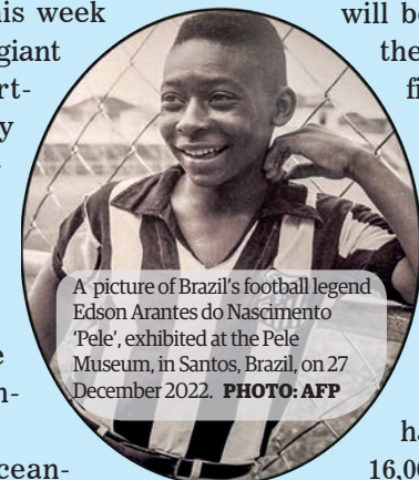
A picture of Brazil's football legend Edson Arantes do Nascimento 'Pele', exhibited at the Pele Museum, in Santos, Brazil, on 27 December 2022.

BRAZILIANS bid a final farewell this week to football giant Pele, starting Monday with a 24-hour public wake at the stadium of his long-time team, Santos.