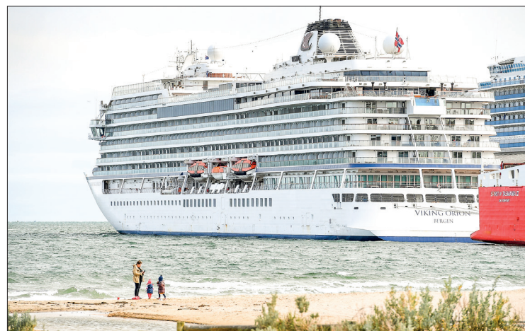
Cruise liner Viking Orion is moored at Station Pier in Melbourne on 24 March 2020.

PASSENGERS on a luxury New Year's cruise around New Zealand and Australia have reportedly been stranded on board for a week because of a "marine growth" on the ship's hull.