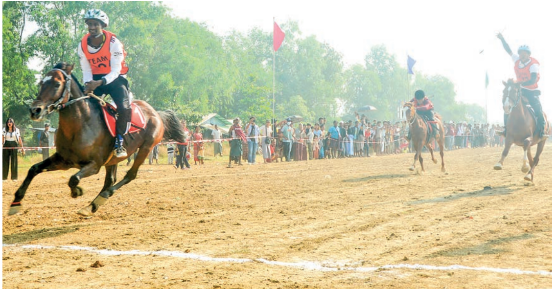
Jockeys are seen in competitive actions at the event in Yangon yesterday.

competing in four types of competition. The first, second, and third prizes will be awarded. As our federation, we are going to hold a competition like this in the coming month of February.