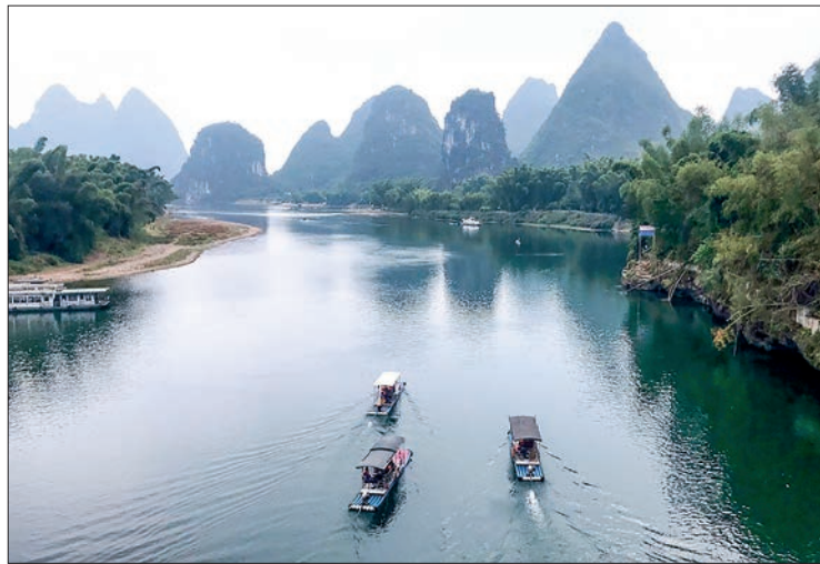
Aerial photo taken on 18 October 2018 shows tourists taking a boating trip on Lijiang River in Yangshuo County of Guilin, south China's Guangxi Zhuang Autonomous Region.

The revised law explicitly prohibits consumption of wild animals under special state protection as well as terrestrial wildlife of important ecological, scientific and social values and others on the list of national protection.