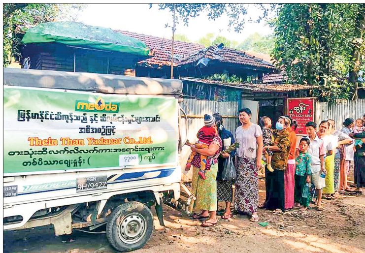
Residents line up to buy palm oil at the reference price.

The domestic consumption of edible oil is estimated at 1 million tonnes per year. The local cooking oil production is just about 400,000 tonnes. To meet the oil sufficiency in the domestic market, about 700,000 tonnes of cooking oil are yearly imported through Malaysia and Indonesia. —NN/EMM