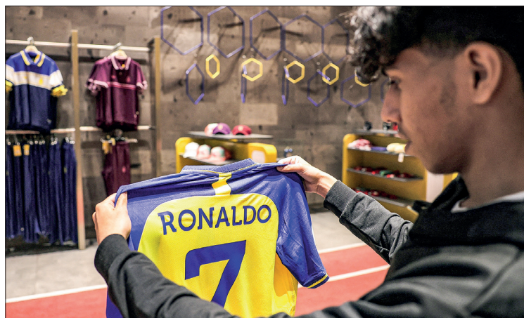
A fan holds the jersey of Saudi football club al-Nassr's new Portuguese forward Cristiano Ronaldo (#7) at a sports shop carrying the club's paraphernalia in the capital Riyadh on 2 January 2023.

PORTUGUESE superstar Cristiano Ronaldo will be unveiled before thousands of fans at Saudi Arabia's Al Nassr club on Tues-