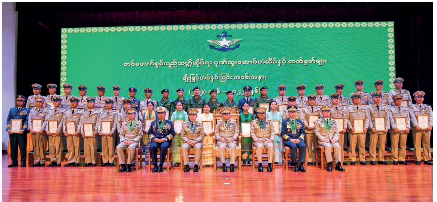
State Administration Council Chairman Commander-in-Chief of Defence Services Senior General Thadoe Maha Thray Sithu Thadoe Thiri Thudhamma Min Aung Hlaing poses for the documentary group photo at the event yesterday.