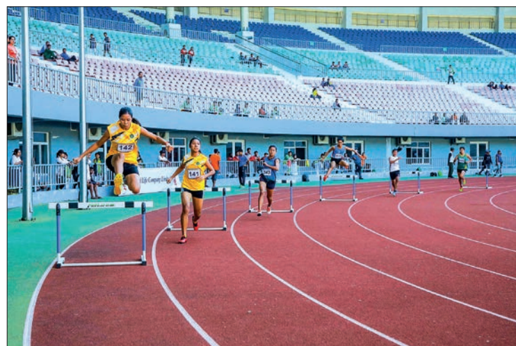
SAC members, Union ministers and party watch the athletic competitions in Nay Pyi Taw yesterday.

The Rakhine State team defeated the Yangon Region team