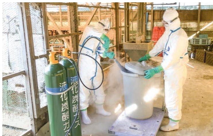
Officials from Chiba prefectural government cull chickens at a poultry farm in Asahi on 3 January 2023, after avian flu was confirmed there.

The previous record was registered two seasons ago, between November 2020 and March 2021, when 52 cases were confirmed in 18 prefectures, resulting in the culling of roughly