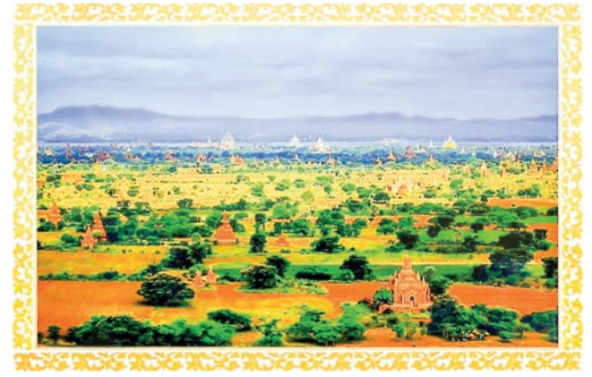
Scenic Beauty of Bagan.

(Excerpt from the message sent by Chairman of the State Administration Council Prime Minister Senior General Min Aung Hlaing to the 74 th Anniversary of the Shan State Day on 7 February 2021)