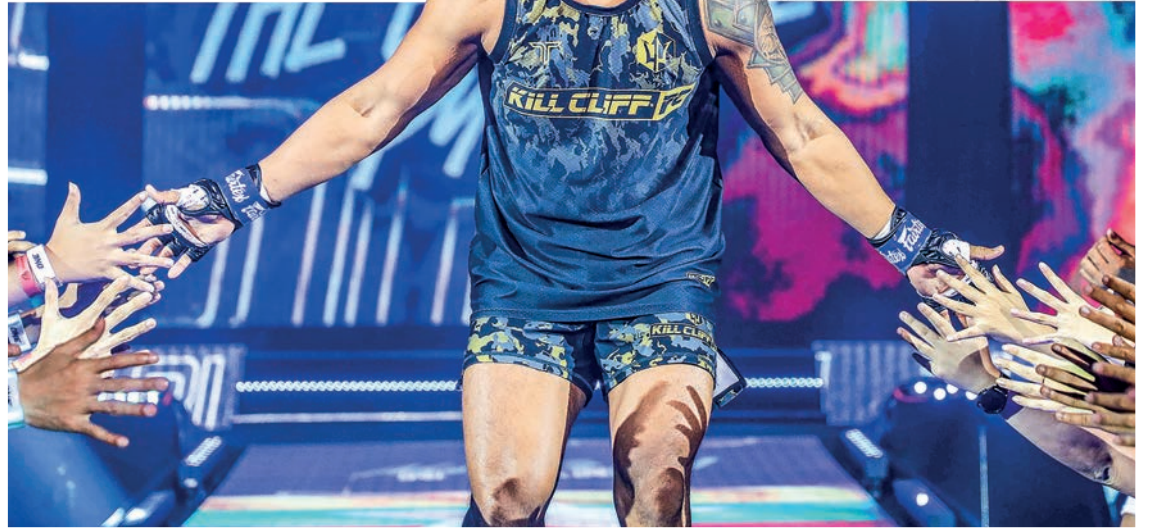
Former ONE Championship two division Champion Aung La N Sang.