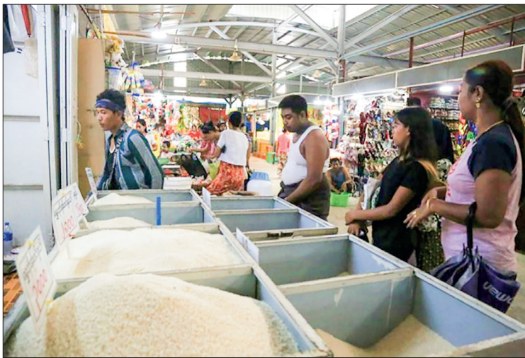
Some consumers are purchasing rice at a rice outlet.

Thus, traders in possession of stocks are able to gain lower profits than in 2022. — TWA/EMM