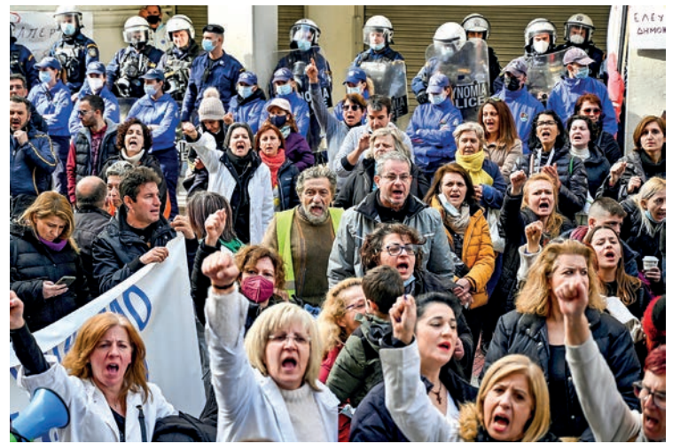
Healthcare workers opposing mandatory Covid-19 vaccination protest outside the Greek Ministry of Health in Athens on 23 February 2022 after the announcement that unvaccinated health workers will be fired from their jobs at the end of March.

Like several other European countries, Greece brought in rules during the worst of the pan-