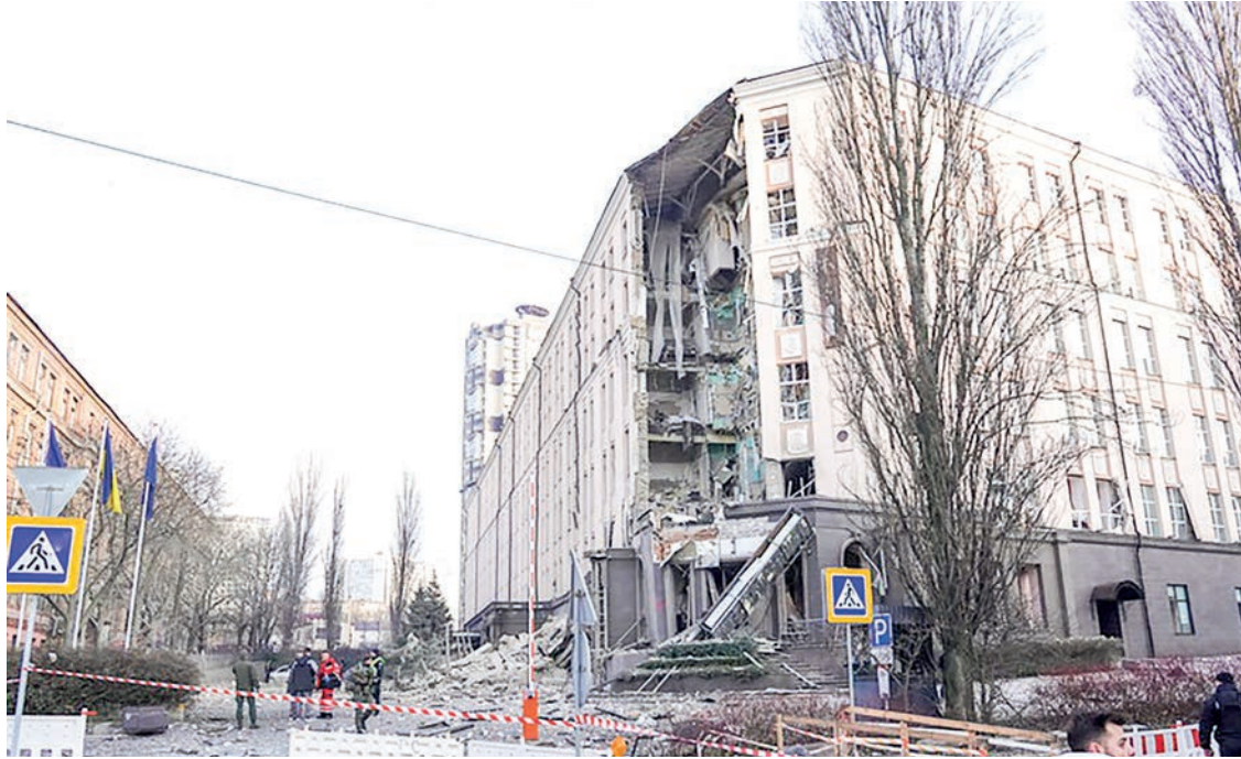
People stand by a damaged building in Kyiv, Ukraine, 31 December 2022.

THE following are the latest developments in the Ukraine crisis: