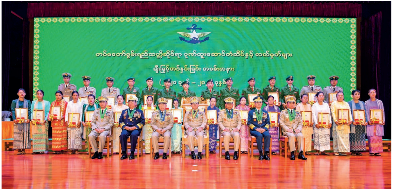
State Administration Council Chairman Commander-in-Chief of Defence Services Senior General Thadoe Maha Thray Sithu Thadoe Thiri Thudhamma Min Aung Hlaing poses for the documentary group photo at the event yesterday.