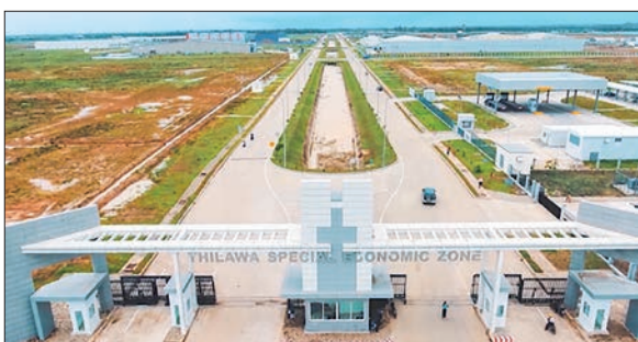
Footage shows an aerial view of the Thilawa Special Economic Zone.

The commission welcomes both foreign direct investment and domestic investments made by Myanmar citizens in those sectors. MIC and the related ministries will also ensure investment facilitation. — TWA/EMM