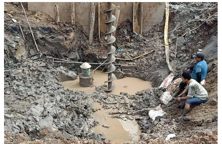
Rescuers gather at the site of where a 10-year-old boy is thought to be trapped in a 35-metre deep shaft at a bridge construction area in Dong Thap province Viet Nam on 2 January 2023.

A wider 19-metre-long metal pipe has been lowered around the concrete tube in which Nam is trapped to allow them to re-