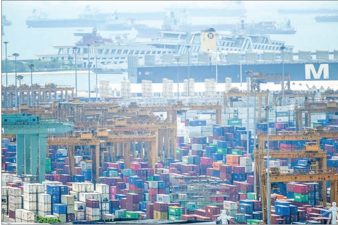
Containers are stacked at the Tanjung Pagar terminal port in Singapore on 21 September 2022.

SINGAPORE'S economy grew more than expected last year but much slower than in 2021, official data showed Tuesday, as analysts warned of weaker growth ahead owing to an expected recession in key markets.