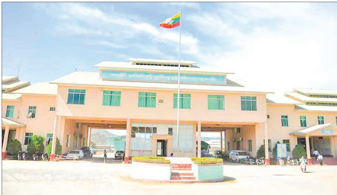
The closure of the Mang Wein checkpoint wreaked havoc on the Muse trade. The trade value through Muse land border was down by $337 million compared to the corresponding period of last FY.

“Mang Wein border saw a bustling trade with 400 and 500 trucks. The other two crossings – Nantaw and Sinphyu – have been closed down for three years. Now, those will be reopened on 8 January. They