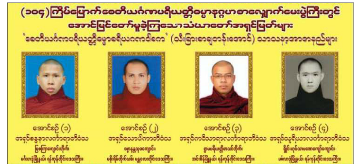
Sayadaws who passed the 104 th Ceti yangana Pariyatti Dhamma Nuggaha Examination.