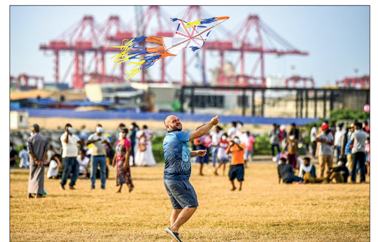
A tourist flies a kite at the Galle face promenade in Colombo on 1 January 2022.

Based on the data released by the Sri Lanka Tourism Development Authority, India accounted for 17 per cent of the total tourist arrivals. Russia ranked second accounting for 13 per cent and Britain became the third largest source market with 12 per cent. The Tourism Ministry said the tourism industry expects China to regain its position this year as one of the key source markets for Sri Lanka's tourism.—Xinhua