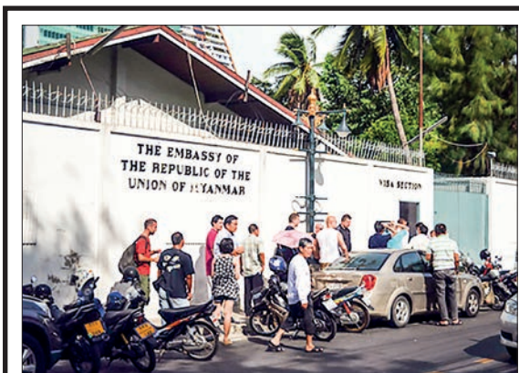
Myanmar nationals are pictured queuing for passport extension at the front of the Myanmar Embassy in Thailand.