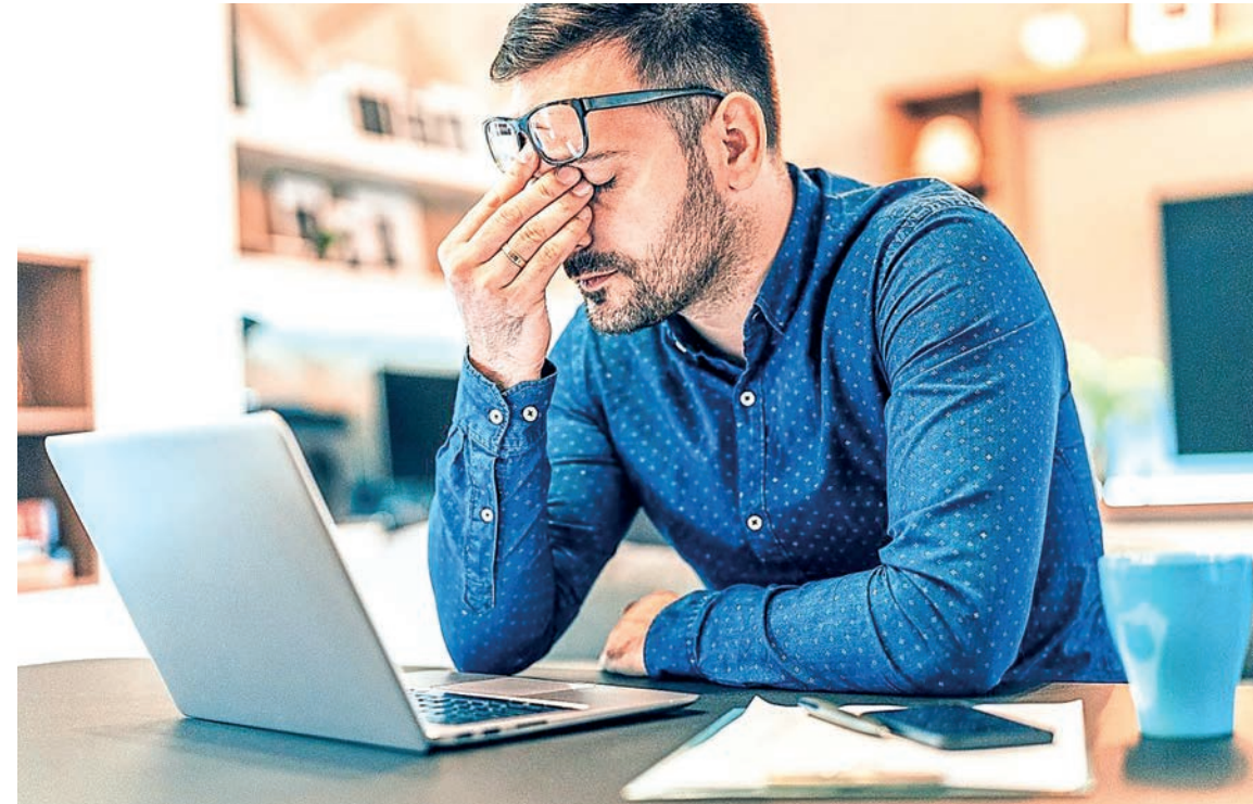
In this study, statistically controlling for CMV positivity also reduced the connection between stress and accelerated immune aging.

percentages of fresh disease fighters and higher percentages of worn-out white blood cells. The