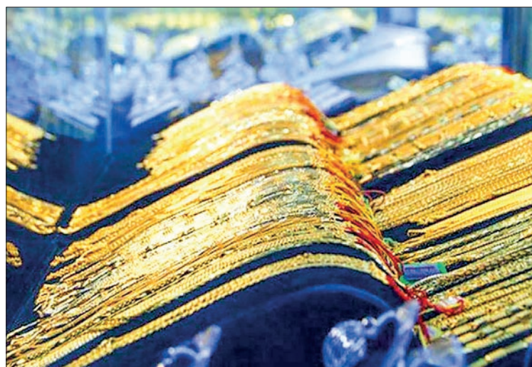
Gold jewellery is seen being displayed at the gold outlet in Yangon.

Under the guidance of the Central Committee on Ensuring Smooth Flow of Trade and Goods, the Monitoring and Steering Committee on Gold and Currency Market was formed on 21 January 2022 as gold and currency market stability play a crucial role in the trade facilitation.—NN/EMM