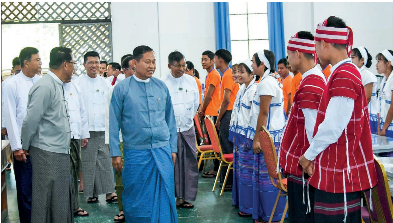
State Administration Council Vice-Chairman Deputy Prime Minister Vice-Senior General Soe Win warmly greets ethnic traditional cultural troupes and students in Nay Pyi Taw yesterday.