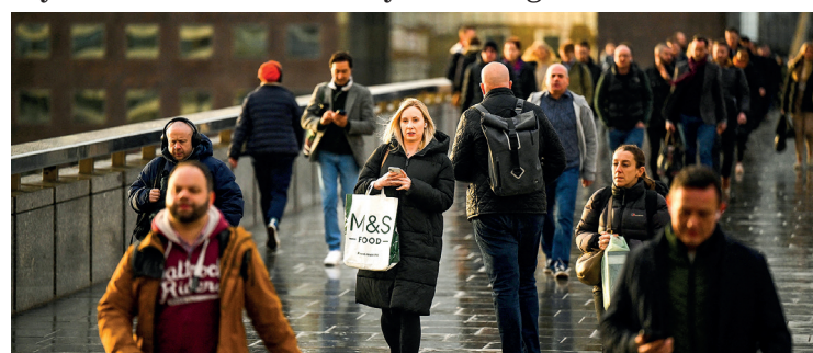
Commuters on their way to work cross London Bridge in central London on 3 January 2023. UK rail staff disrupted the New Year return to work in the latest strike action by workers in a range of sectors over the worst cost-of-living crisis in a generation.

Normally bustling London train stations were quiet on Tuesday, the first normal working day of 2023 after the New Year break. Network Rail, which operates the UK’s rail services, warned travellers of “significantly reduced” train services or no services at all in some areas until Sunday.—AFP