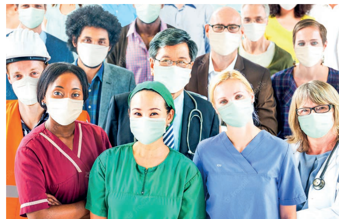
Study researchers found that labour unionization rates were low, at an overall prevalence of 13.2 per cent, with no significant change from 2009 through 2021.

U NIONIZED healthcare workers earned more money and received better non-cash benefits while working fewer hours