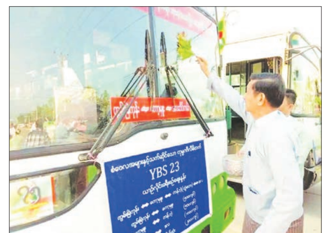
An inaugural ceremony for new YBS lines.

YBS 47, YBS 48, YBS 49 and YBS 50 are running in Hlinethaya, Dala, Kawhmu and Kungyangon townships.