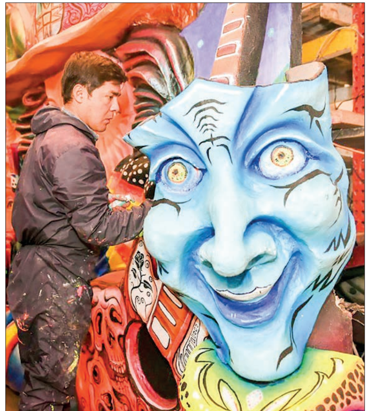
The festival is billed as a celebration of diversity.

The carnival, one of Colombia's biggest, is inscribed on UNESCO's "Representative List of the Intangible Cultural Heritage of Humanity." Every year, celebrations kick off with giant wa-