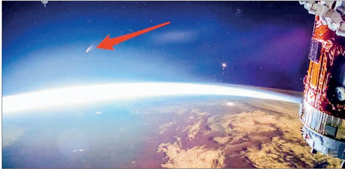
Considering the comet is out in space, it makes sense that you can see it from above the Earth as well as from the planet's surface. This photo was taken from the International Space Station (ISS). The comet is travelling 64 million miles away from Earth. On 9 July 2020, astronaut Robert Behnken captured an image of comet NEOWISE from the International Space Station.

It will be easy to spot with a good pair of binoculars and likely even with the naked eye, provided the sky is not too illuminated by city lights or the Moon.