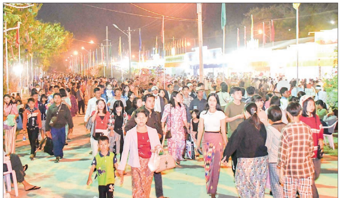
The booths and decorated floats receive more public enthusiasm as people are seen thronging at the event yesterday.