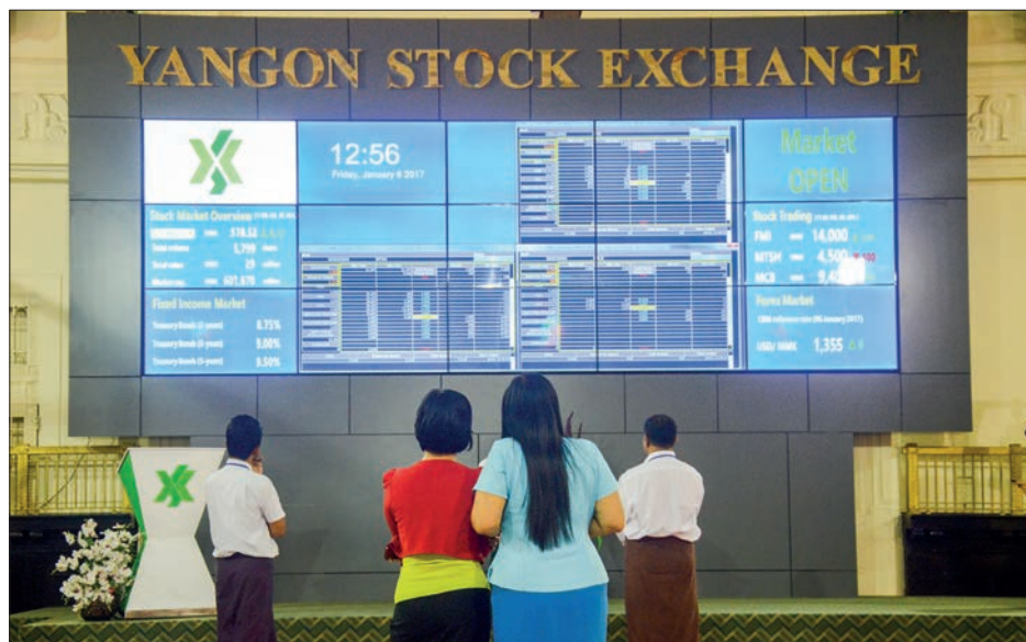
The panel is seen displaying stock-market indexes at the Yangon bourse.

At present, shares of seven listed companies — First Myanmar Investment (FMI), Myanmar Thilawa SEZ Holdings (MTSH), Myanmar Citizens Bank (MCB), First Private Bank (FPB), TMH Telecom Public Co Ltd (TMH), the Ever Flow River Group Public Co Ltd