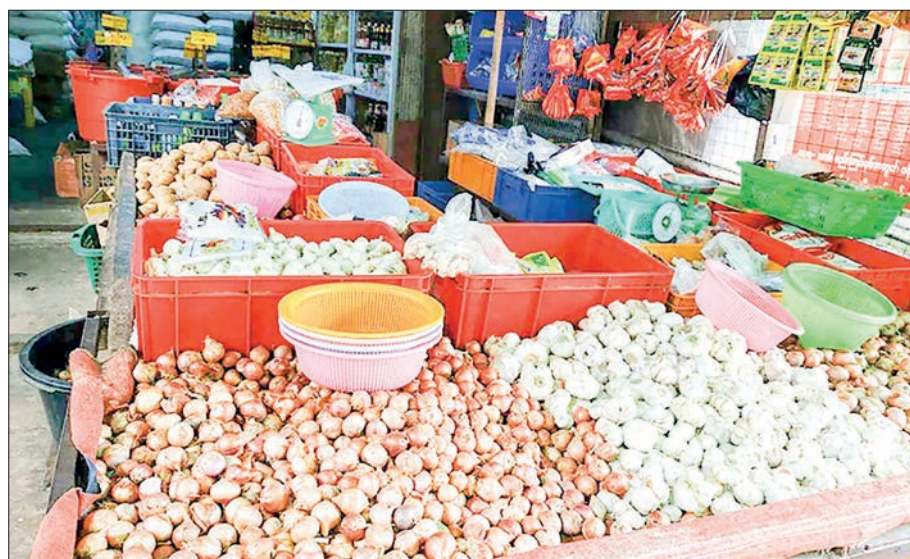
A retail shop is seen with kitchen groceries.

kets on 5 and 6 January yet the price is up by K100-200 per viss. Moreover, 100,000 visses of onions each from Myingyan and Myittha areas were supplied to the market that day. The onions stood at K1,800-2,400 per viss from the Myingyan area and K2,350-2,700 from the Myittha area on 6 January. The prices moved in the range between K1,700-2,600 per viss on 3 January. The price hit a high of K2,400 per viss at a Pakokku commodity depot with the supply of 60,000 visses of onions on 6 January. The onions were priced at K1,950-2,100 only with a bulk supply of 77,000 visses of onions on 3 January. Similarly, the highest