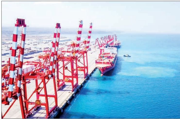
The Black Sea Grain Initiative, brokered by the United Nations and Türkiye, was set up to reintroduce vital food and fertilizer exports from Ukraine to the rest of the world.

WORLD food prices fell for a ninth month in a row in December but hit their highest level on record for the full year in 2022, UN data showed Friday.