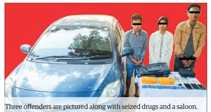
Three offenders are pictured along with seized drugs and a saloon.

The offenders are prosecuted under the Narcotic Drugs and Psychotropic Substances Law. — MNA/MKKS