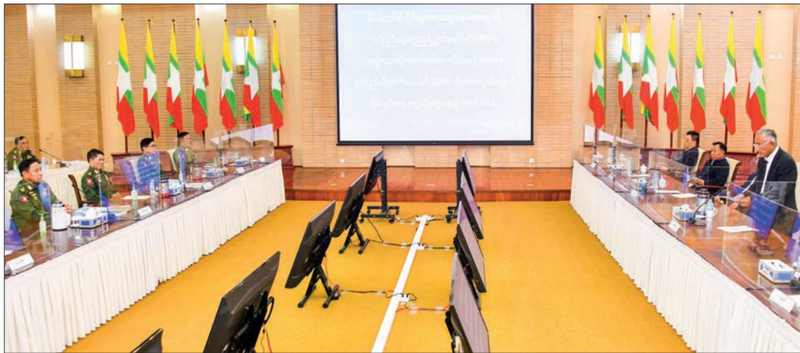
The State Peace Talks Team concludes its third-day meeting with delegations from three EAOs.