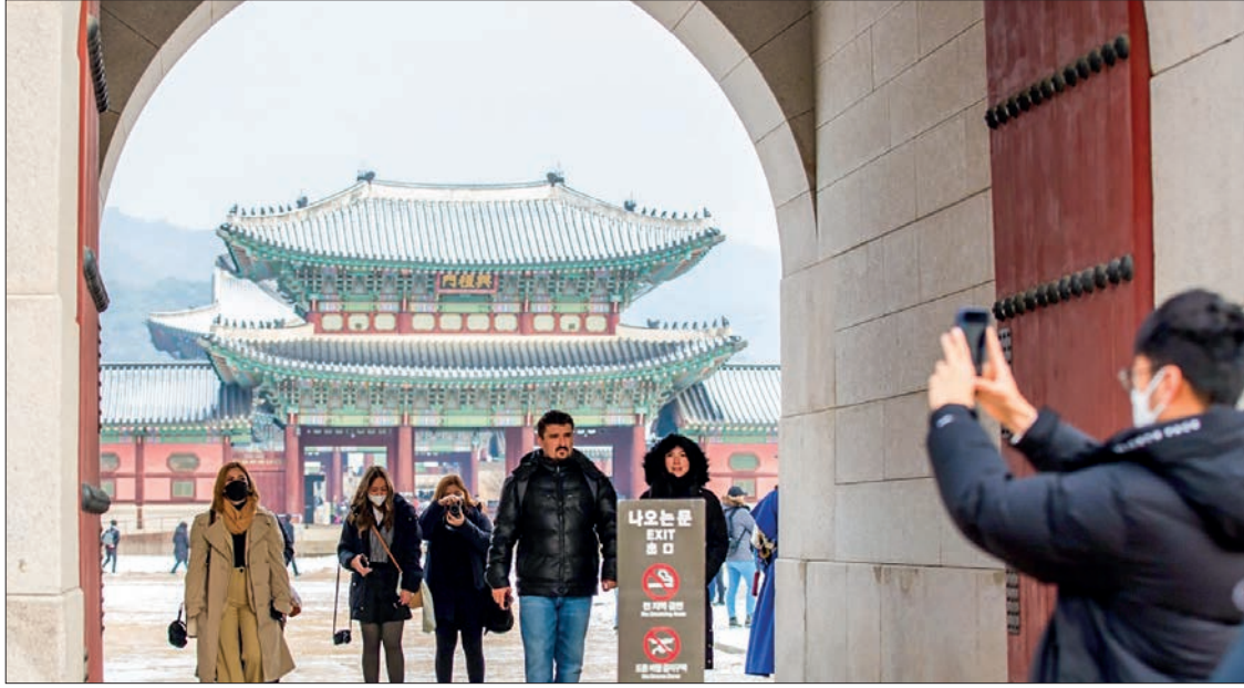
The slump in Chinese visitors during the pandemic has hit South Korea's tourism industry hard, a culture official ministry said. Tourists visit the Gyeongbokgung Palace in snow in Seoul, South Korea, 3 December 2022.