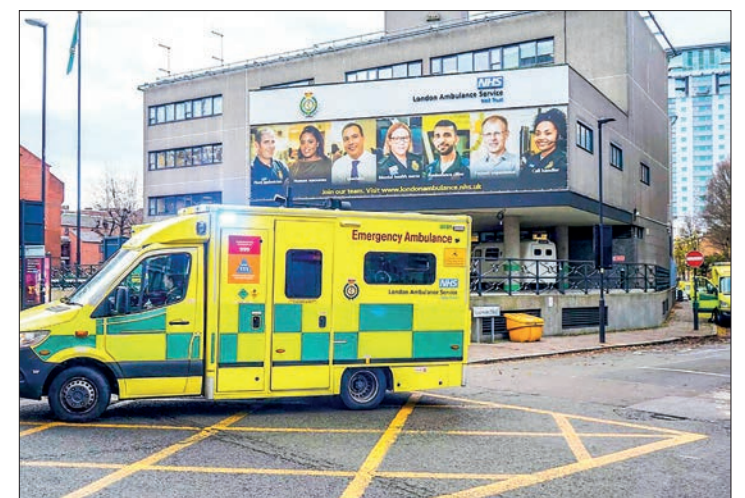
The UK has been hit by strikes across multiple sectors, including nurses and ambulance workers, raising fears that lives could be put at risk. An ambulance drives past the Waterloo ambulance station in London on 21 December.

That has led to governments subsidising rocketing energy bills for consumers, with help from the sector's companies via additional taxing of profits.—AFP