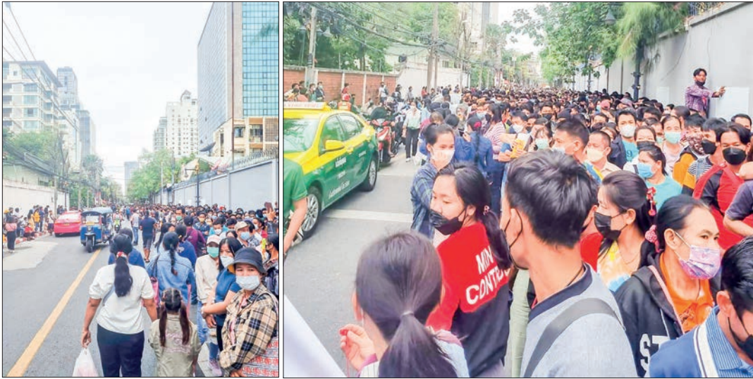
Myanmar migrant workers are seen queuing for passport renewal at the Myanmar Embassy in Thailand on 7 January 2023.

HUNDREDS of Myanmar migrant workers waited in a long queue in front of the Myanmar Embassy to Thailand on 7 January to receive tokens to get an appointment for passport renewals, said Myanmar workers in Bangkok.