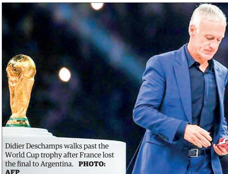
Didier Deschamps walks past the World Cup trophy after France lost the final to Argentina.

that the president has decided to extend (my contract) until 2026," Deschamps said at the FFF general assembly.—AFP