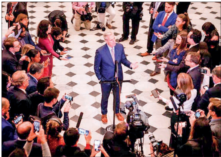
US Speaker of the House Kevin McCarthy talks to reporters in Statuary Hall after being elected Speaker in the House Chamber at the U.S. Capitol Building on 7 January 2023 in Washington, DC.