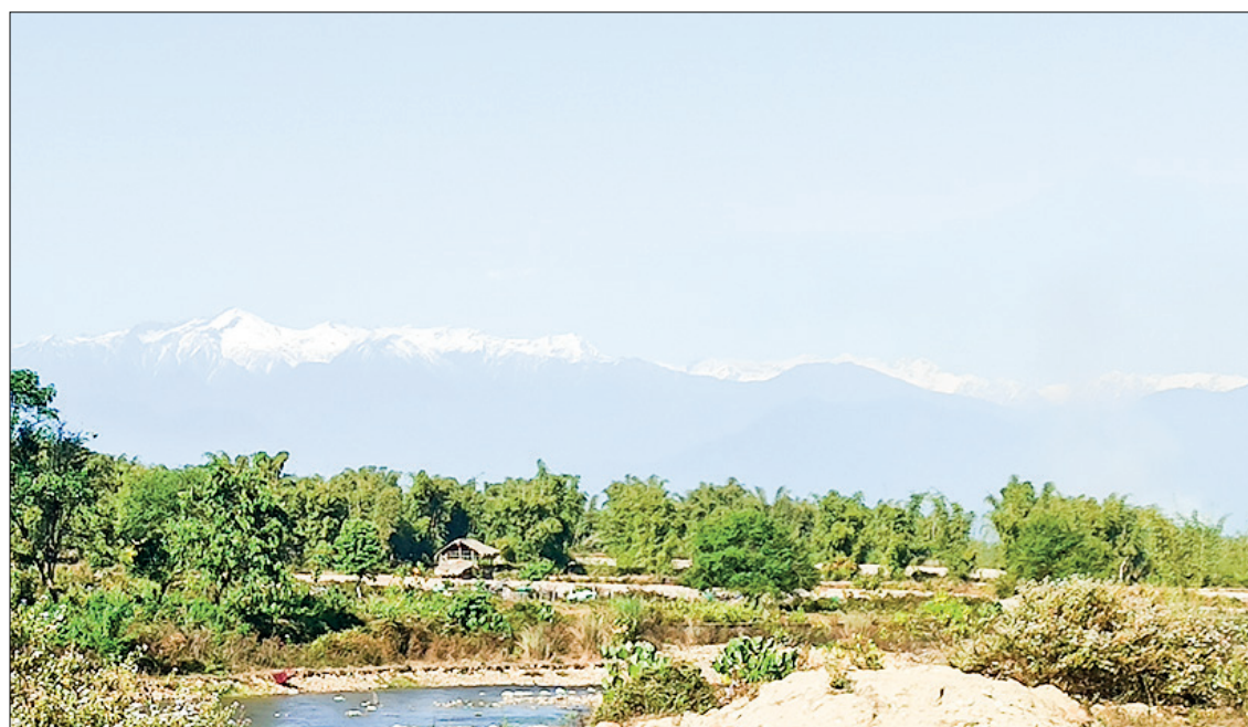
A general view of the ice-capped mountains in PutaO.