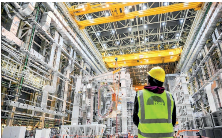
A man looks at a module being assembled at the International Thermo-nuclear Experimental Reactor project in Saint-Paul-les-Durance, France.

The date “wasn't realistic in the first place,” even before two major problems surfaced, Barabaschi said.—AFP