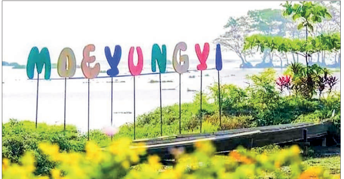
The visitors can get there after the six-furlong drive from Pyinpongyi village about 69 miles from Yangon-Mandalay Road in Waw Township of Bago Region.

Moeyungyi Sanctuary is 25,600 acres wide and was recognized as a Ramsar Site in Myanmar in 2005. East Asia-Australasian Flyway Partnership recognized it as a Flyway Network Site in 2014. It is a wildlife sanctuary to conserve endangered water birds. The visitors can get there after the six-furlong drive from