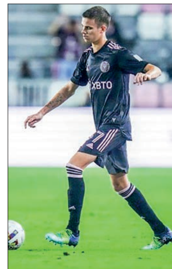
Romeo Beckham has joined Premier League club Brentford's reserve team.

"I came here at the start to keep fit during the off-season. The chance then came to come on loan here and I've never been so excited." Beckham joined Fort Lauderdale CF in 2021 before the reserve side were renamed Inter Miami II last year. He briefly featured in