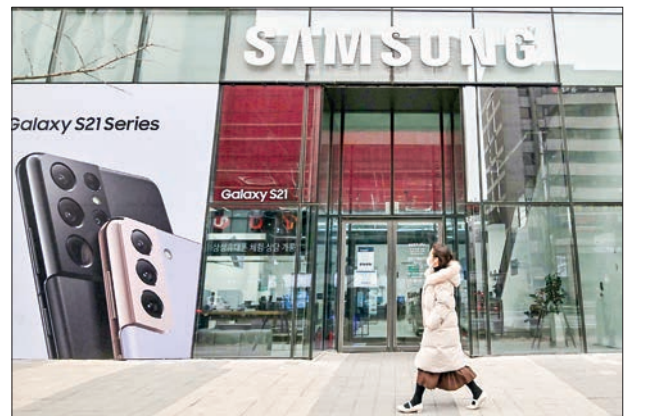
A woman walks past an advertisement for the Samsung Galaxy S21 smartphone at a Samsung Electronics store in Seoul.

continued high global interest rates and weak economic outlooks". Against that backdrop, the Galaxy smartphone maker also "saw a significant drop in the memory business results due to lackluster demand and also weaker sales of smartphones," it added.—AFP