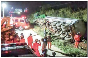
An overturned bowser was seen in the accident on the PyinOoLwin-Lashio Road on 22 December 2022.

In addition, there were 84 casualties and 394 injuries in 240 accidents in 2021, and 84 were killed and 446 wounded in 412 accidents in 2020, respectively. — TWA/MKKS