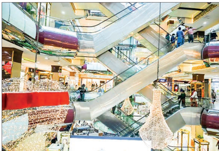
Shoppers are seen inside a shopping mall in Islamabad, Pakistan.

Pakistan's economy has crumbled alongside a simmering political crisis, with the rupee plummeting and inflation at decades-high levels, but devastating floods and a global energy crisis have piled on further