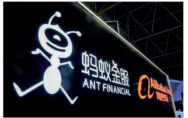
Jack Ma will cede control of Chinese fintech giant Ant Group, the company announced Saturday, following a Communist Party crackdown on the nation's tech sector that targeted the charismatic billionaire.

He will hold just 6.2 per cent of the voting rights following the adjustment, based on information in the statement. "The adjustment is being implemented to further enhance the stability of our corporate structure and sustainability of our long-term development," the Ant statement said.—AFP