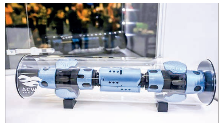
Paris-based startup ACWA Robotics won plaudits at CES for a robot dedicated to the detection and prevention of water leaks in underground pipes.

Bolsonaro, who was replaced on 1 January by leftist President Luiz Inacio Lula da Silva, triggered an international outcry during his four years in office for a surge of fires and clear-cutting in the Amazon, a key resource in the race to curb climate change.—AFP