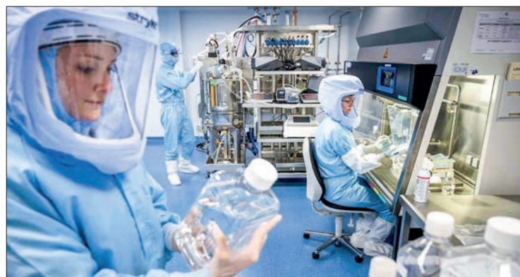
Employees in cleanroom suits test the procedures for the manufacturing of the messenger RNA (mRNA) for the COVID-19 vaccine at the new manufacturing site of German company BioNTech on 27 March 2021 in Marburg, central Germany.

GERMAN pharmaceutical company BioNTech, which developed a trailblazing Covid-19 vaccine, will trial a cancer treatment in Britain using the same mRNA technology, the company said on Friday.