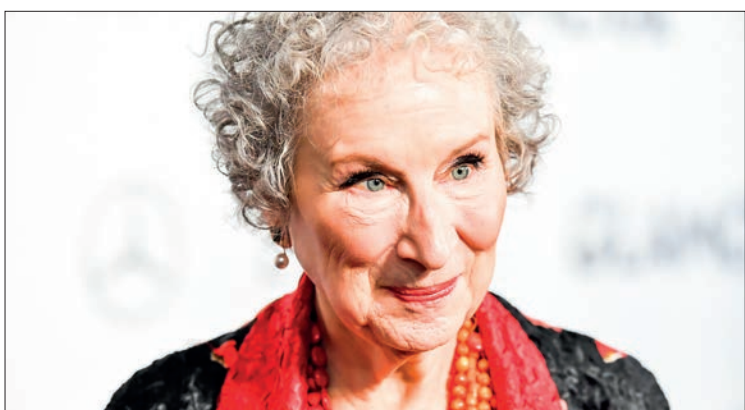
Margaret Atwood, pictured in 2019, was reportedly a target of an alleged scam to steal unpublished manuscripts.

ter battles followed by bonfires of wooden or straw puppets, and a costume parade.—AFP