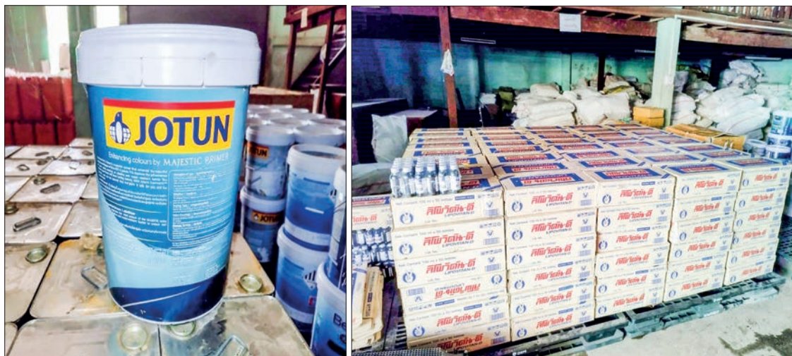
Confiscated illegal commodities in Kayin State.

A combined team led by the Kachin State Department of Mines under the supervision of the Kachin State Anti-Illegal Trade Task Force conducted inspections on 5 January, according to information.