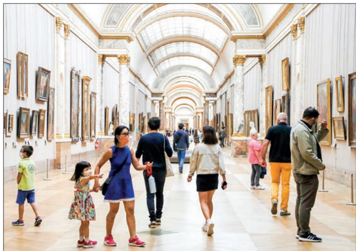
With Asian visitors still largely absent, major Paris museums struggled to regain pre-pandemic numbers in 2022, despite a huge recovery from the previous year.