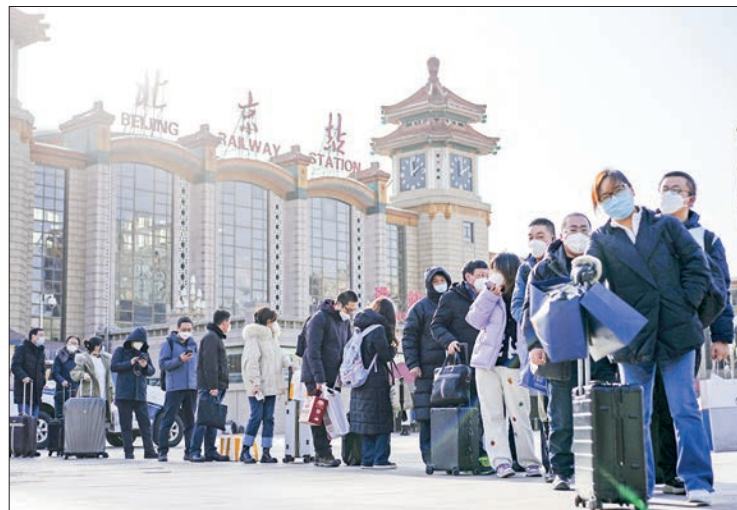
People queue for a taxi in front of Beijing Railway Station on 6 January 2023.

THE Chinese government said Friday it expects about 2.1 billion domestic journeys to be made in the country over a 40-day travel season that includes the weeklong Lunar New Year holidays beginning 21 January, amid fears the large-scale human migration could further spread COVID-19.