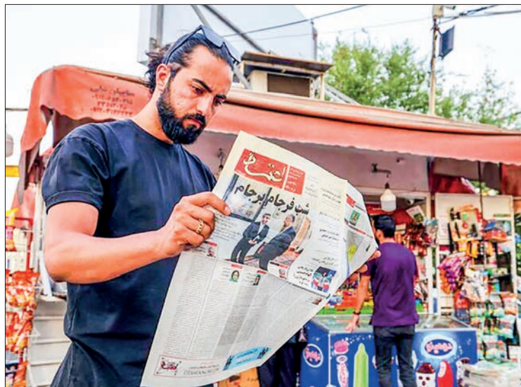
A man reads the Iranian newspaper Etemad.

Foreign-based rights groups and campaigners say dozens more protesters face charges punishable by death.—AFP