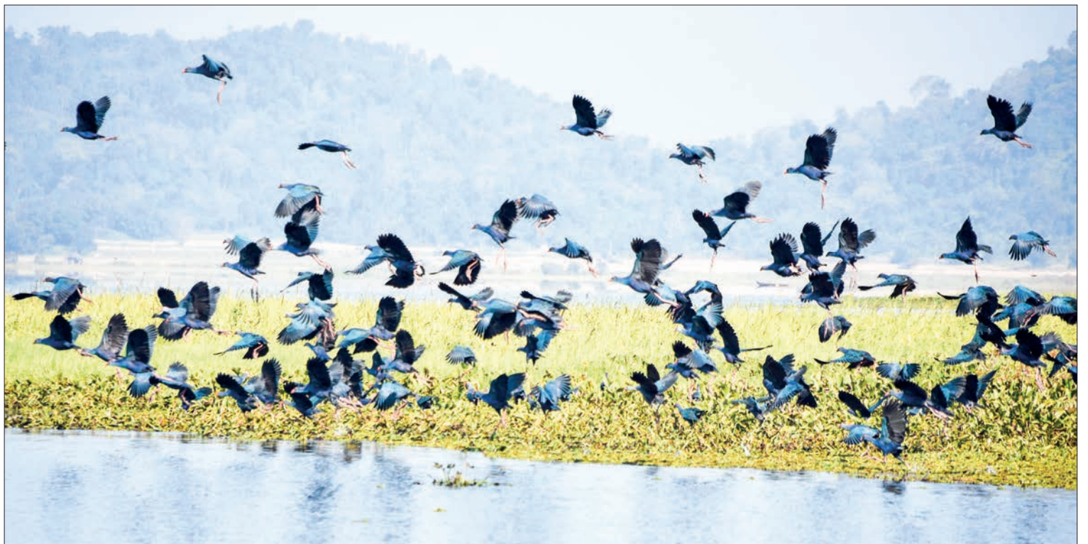
The Indawgyi Lake is the largest and most beautiful freshwater lake in Myanmar and the third largest lake in Southeast Asia.

The bird population in December is lesser than over 3,400 birds including one migratory bird species compared to the previous year. The officials also