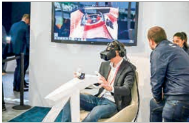
French company Valeo demonstrates the use of a virtual reality headset at the 2023 CES technology show in Las Vegas, Nevada.

One gadget on display in Las Vegas is an in-car television system, developed by French parts maker Valeo, that needs no remote. To change the channel, drivers or passengers wearing a headset make a simple swipe in