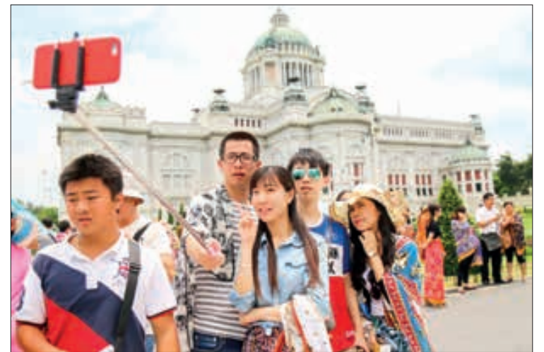
The Thai government expects about 300,000 Chinese tourists to visit Thailand in the first three months of this year.

In addition to tourism, increased economic activities with China are bound to promote trade and investment between the two countries, she said.—Xinhua