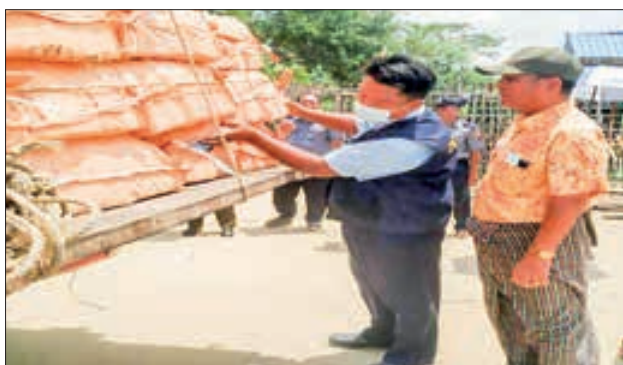
Officials inspect inbound and outbound cargo vehicles for carrying illegal goods at Pantawpyin Outpost in Alethankyaw of Maungtaw on 17 May 2022.

Mann Shwesettaw Pagoda Festival will be held from 25 January to 17 April (1 st Myanmar New Year).