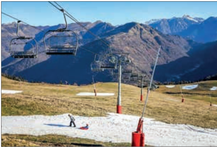
Near-bare slopes at the Luchon-Superbagnères ski resort in southwestern France on 5 January 2023.

FRANCE experienced its hottest average temperature and lowest levels of rainfall on re-