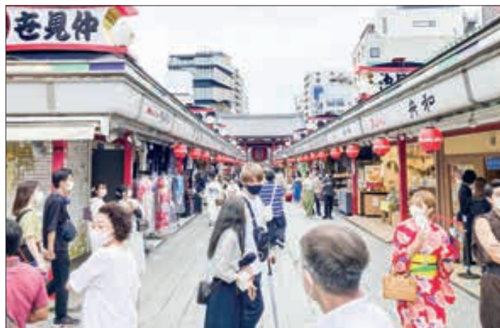
People wearing protective face masks are seen at Asakusa district in Tokyo, Japan on 25 March 2022.

After the number since Japan confirmed its first domestic case of COVID-19 in January 2020 eclipsed the 20,000 mark last February, 10,000 deaths were reported every three months until December, according to the Kyodo