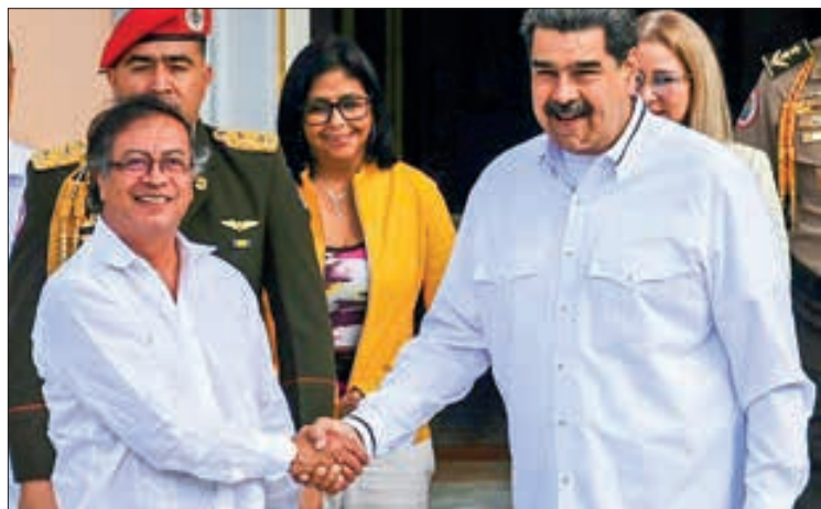
Venezuelan President Nicolas Maduro (R) and his Colombian counterpart Gustavo Petro (L) met in Caracas on 7 January 2023.

COLOMBIA’S President Gustavo Petro made a surprise trip to meet his Venezuelan counterpart Nicolas Maduro on Saturday — their second face-to-face after the thawing of a years-long diplomatic freeze.