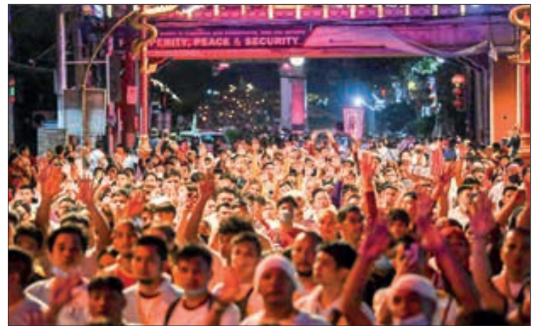
Roman Catholic devotees carrying miniature statues of the Black Nazarene and candles, walk along a street dubbed “walk of faith” as they celebrate the annual feast of the Black Nazarene in Manila on 8 January 2023. PHOTO: AFP

The original wooden statue was brought to the Philippines in the early 1600s when the nation was a Spanish colony. —AFP