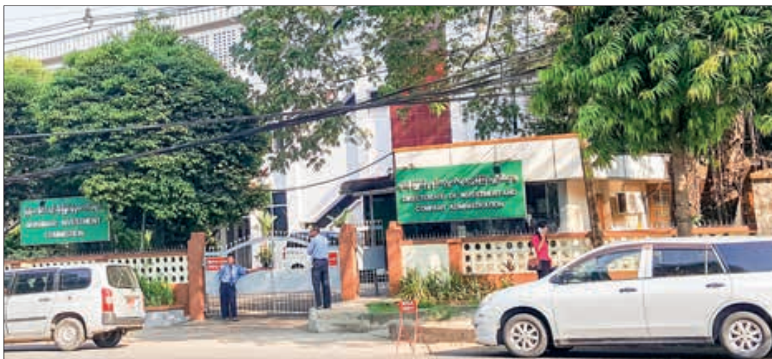
The Directorate of Investment and Company Administration manages flow of foreign investment and Myanmar citizen investment into Myanmar.

Singapore is the top source of FDI this FY, with 14 Singapore-listed enterprises pumping FDI of US$1.154 billion into Myanmar. Hong Kong SAR stands as the second largest investor this FY with an estimated capital of over $165 million drawn from