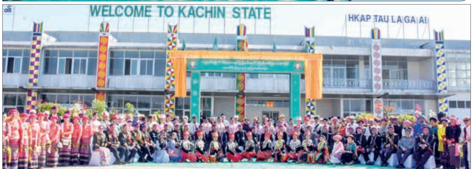
SAC members, Union ministers and officials pose for documentary photo together with ethnic national people at opening of airport park on 8 January.

The opening of Airport Park in progress in Myitkyina on 8 January.