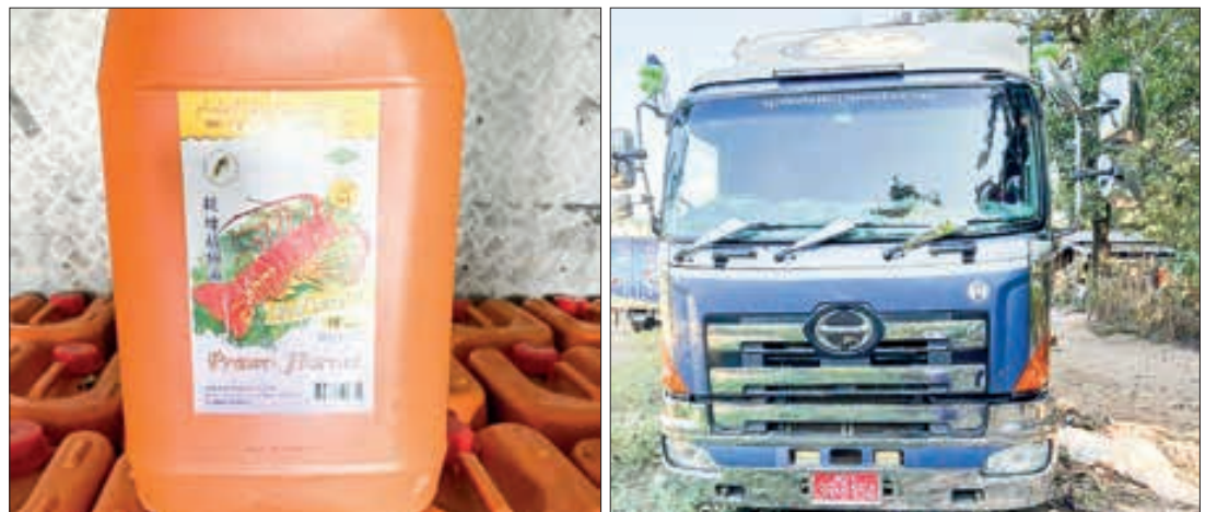
Container of RBD Palm Olein labelling Prawn Hornet seized in Bago Region with truck on 6 January.

THE on-duty teams under the supervision of the Customs Department conducted inspections on 6 January.