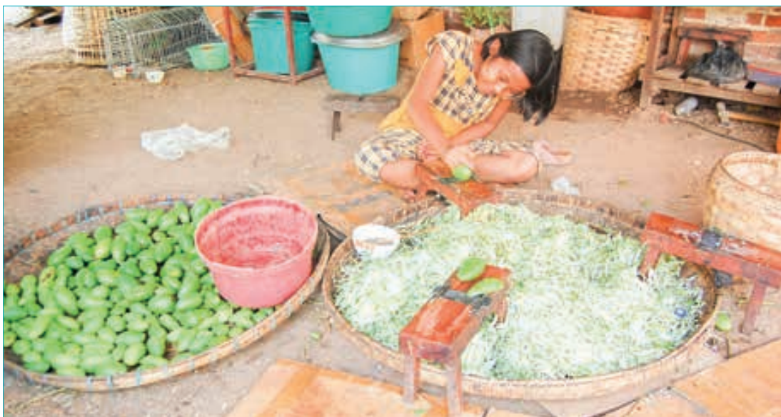
Mango juliennes are being produced to make them as pickled mango products.

Imported mangoes from Thailand are not as good as local mangoes, but since they can survive the whole year, they have an advantage in the market, explained the pickled mango makers.