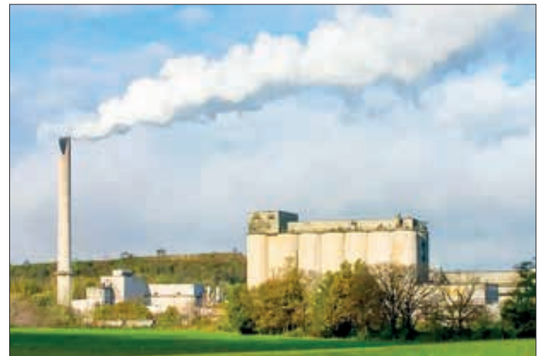
Industrial smokestacks directly emit particle pollution, but they also emit sulfur dioxide and nitrogen oxides, which react in the atmosphere to form fine particle pollution.

“This proposal will help ensure that all communities, especially the most vulnerable among us, are protected from exposure to harmful pollution.”—AFP