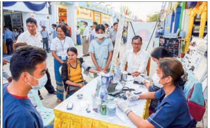
Medical team provide healthcare to visitors.