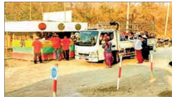
A pilgrimage vehicle paid toll gate fee during pagoda festival of Mann Shwesettaw last year.

A total of 30 buses will be operated during the Buddha Pujaniya festival of Mann Shwesettaw Pagoda to facilitate transportation of pilgrims, according to Minbu District Private Bus Lines Supervisory Committee.