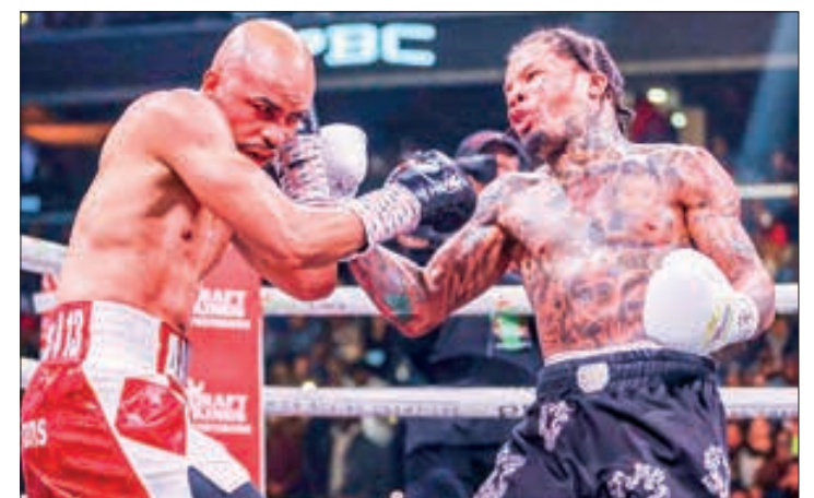
Gervonta Davis punches Hector Luis Garcia in their WBA World Lightweight Championship bout at Capital One Arena on 7 January 2023 in Washington, DC.

champion. Unbeaten Haney also holds the WBC, IBF and WBO belts, which he defended with a dominant victory over Australian George Kambosos in Melbourne in October. Saturday's bout at the Capital One arena in Washington saw Dominican Garcia push Davis in the early going. But Davis began to assert himself in the middle rounds.—AFP