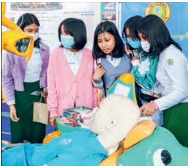
Students visit booth of Ministry of Health.

In the afternoon, Chairman of Nay Pyi Taw Council U Tin Oo Lwin and deputy ministers and council members viewed round the booths and decorated floats which were exhibited from 4 to 8 January.—Aung Ye Thein, Aye Aye Thant/TTA