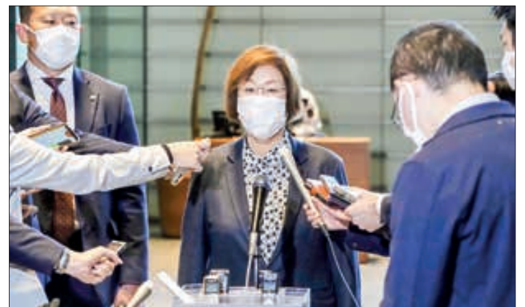
Japanese Education, Culture, Sports, Science and Technology Minister Keiko Nagaoka speaks to reporters following a meeting with Prime Minister Fumio Kishida, in Tokyo, Japan, on 17 October 2022. Kishida instructed Nagaoka to launch an investigation into the Unification Church, a religious group that has come under the spotlight in Japan for its links with the ruling party and the huge donations it has encouraged followers to make.

Following his arrest, Yamagami told investigators that he held a grudge against the Unification Church over donations made by his mother