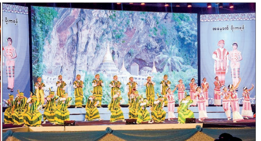
The Vice-Senior General and dignitaries watch the full-dressed rehearsal performance of ethnic cultural dance troupes.