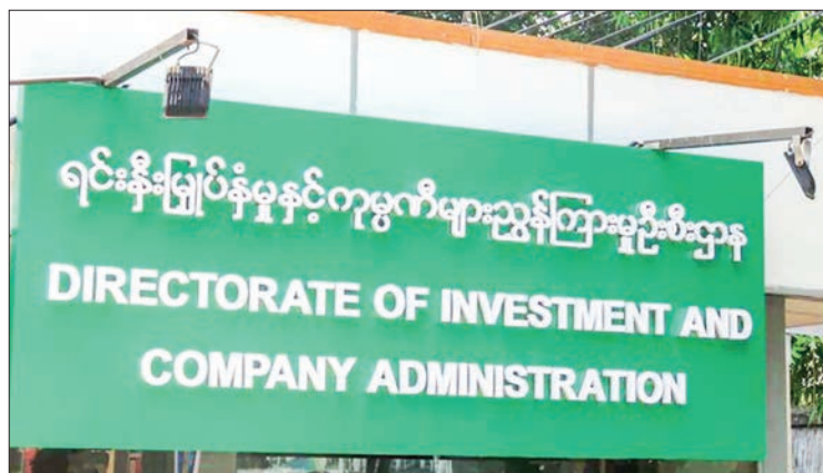
Myanmar Investment Commission nodded 70 foreign projects from eight countries in the past ten months. The country attracted a capital of US$1.476 billion this FY, including the expansion of capital by the existing enterprises.

There are 547 factories actively operated under the Myanmar Garment Manufacturing Association. The ma-