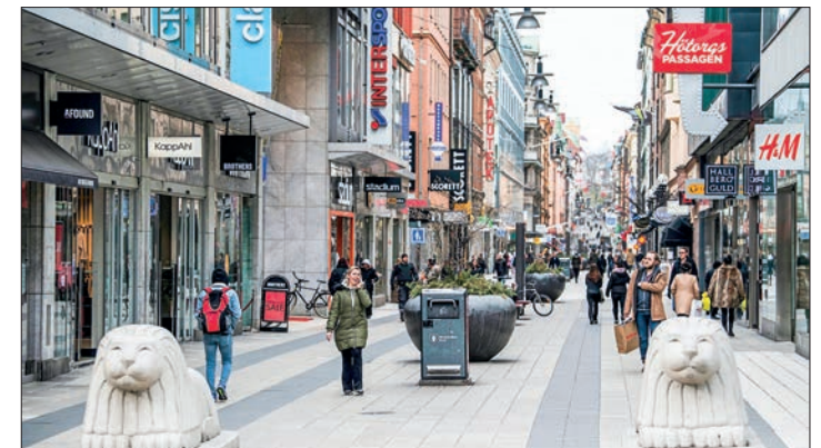
People shop in Stockholm on 24 March 2020.

The krona has also depreciated sharply against other main currencies.—AFP