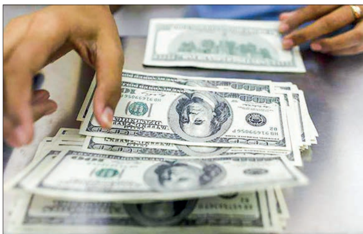
US dollars being counted at a money changer in Yangon.

There is a large price difference between the reference rate of the CBM and the unofficial market rate. However, there is no way to set the new price, as per the notification released on