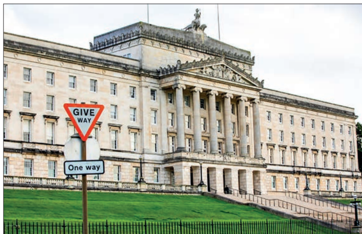
The seat of the Northern Ireland Assembly, often referred to as Stormont. Northern Ireland has been without a devolved government for almost a year because of a walk-out by the pro-UK Democratic Unionist Party.

The protocol, signed between London and Brussels as part of the UK’s Brexit divorce from the European Union, governs trade in the British province, and keeps Northern Ireland in the European single market.—AFP