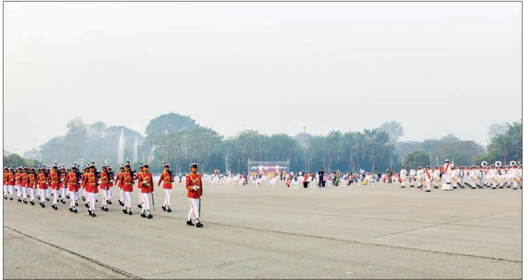
State Administration Council Vice-Chair Deputy Prime Minister Vice-Senior General Soe Win inspects preparations for the successful holding of the 76 th Anniversary of Union Day yesterday.

STATE Administration Council Vice-Chairman Deputy Prime Minister Vice-Senior General Soe Win inspected preparations for the successful holding of the 76 th Anniversary Union Day 2023 yesterday.