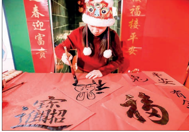
A woman writes Chinese calligraphy during "Exploring Yummy Chongqing in London" event in London, Britain, 2 February 2023.

founder of the London Export Corporation, led a