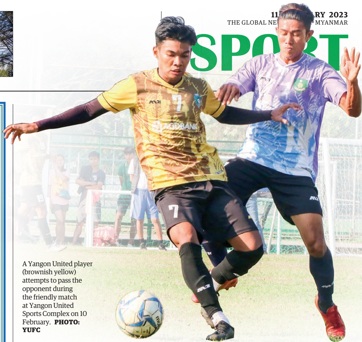
A Yangon United player (brownish yellow) attempts to pass the opponent during the friendly match at Yangon United Sports Complex on 10 February.