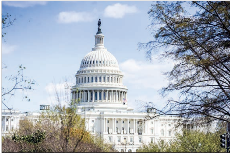
Photo taken on 2 April 2021 shows the US Capitol building in Washington DC the United States.

A group of House Democrats filed a resolution on Thursday, seeking to expel Republican lawmaker George Santos from the US Congress.