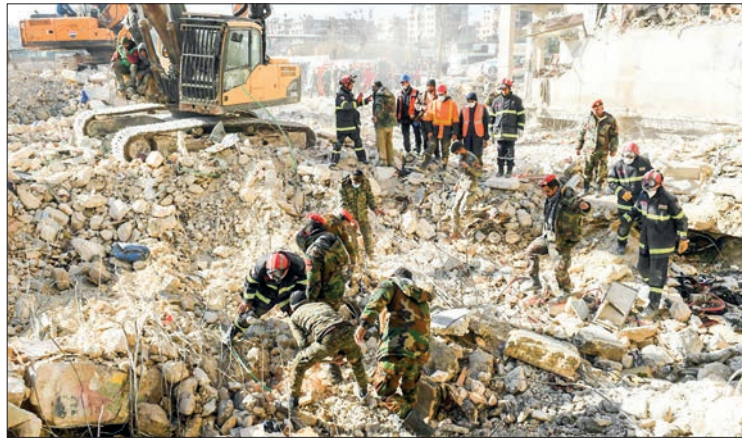
Rescue teams conduct search and rescue operations in Aleppo, Syria on 8 February.