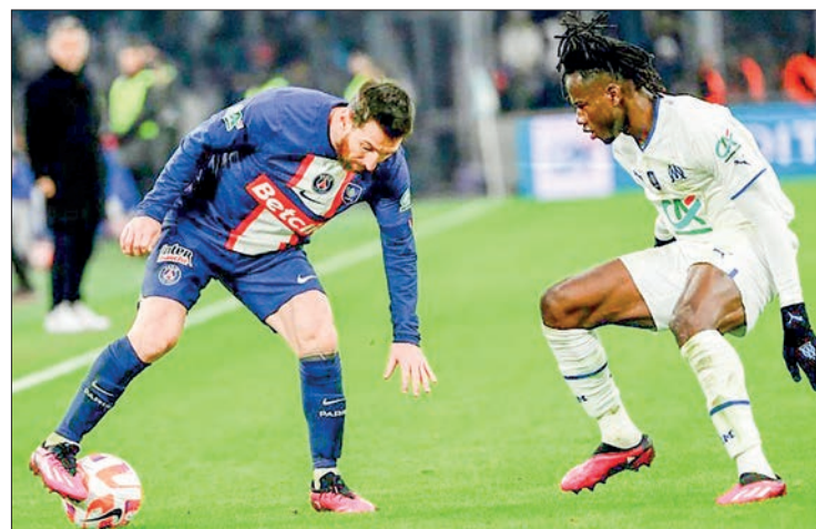
Lionel Messi (L) in action for PSG against Marseille in the French Cup on Wednesday.

LIONEL Messi will miss Paris Saint-Germain's Ligue 1 trip to Monaco on Saturday with a hamstring injury, raising concerns that he may not be fit in time for his team's Champions League showdown with Bayern