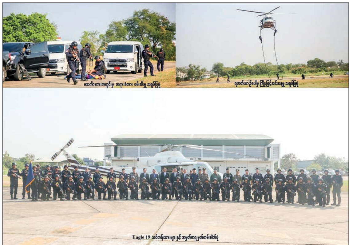
Demonstrations of the special task force Eagle 19 training (top photos). The MoHA deputy minister takes the documentary group photo together with Eagle 19 trainees.

After the ceremony, the Chief of Myanmar Police Force Maj-Gen Zin Min Htet met with Thai Legal Affairs Minister Mr Somsak Thepsutin. During the meeting, they discussed the drug cases in the region, control of illegal drugs in the golden triangle region, cooperation in seizing precursors, combatting the spread of drugs in regional and other countries, uncover of wanted suspects by two countries, plans to draft anti-drug activities at border areas, international cooperation, progresses in seizing drugs through bilateral cooperation