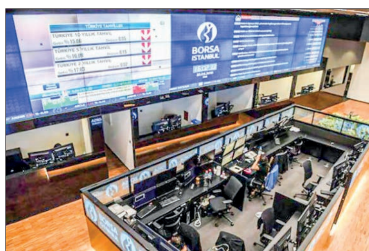
The exchange suffered sharp losses before suspending trading on Wednesday morning.

"Considering the low transaction volume that does not allow efficient price formation, all