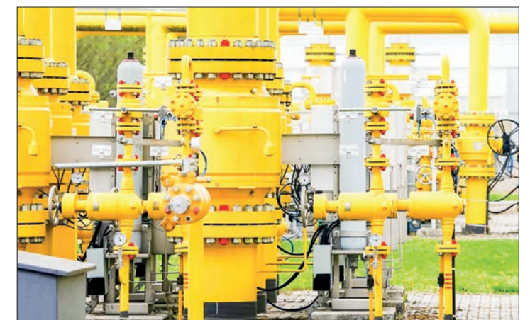
Pipes are seen at the gas transmission point in Rembelszczyna near Warsaw, Poland

That means Poland is still buying 200,000 tonnes of oil from Russia each month. —AFP