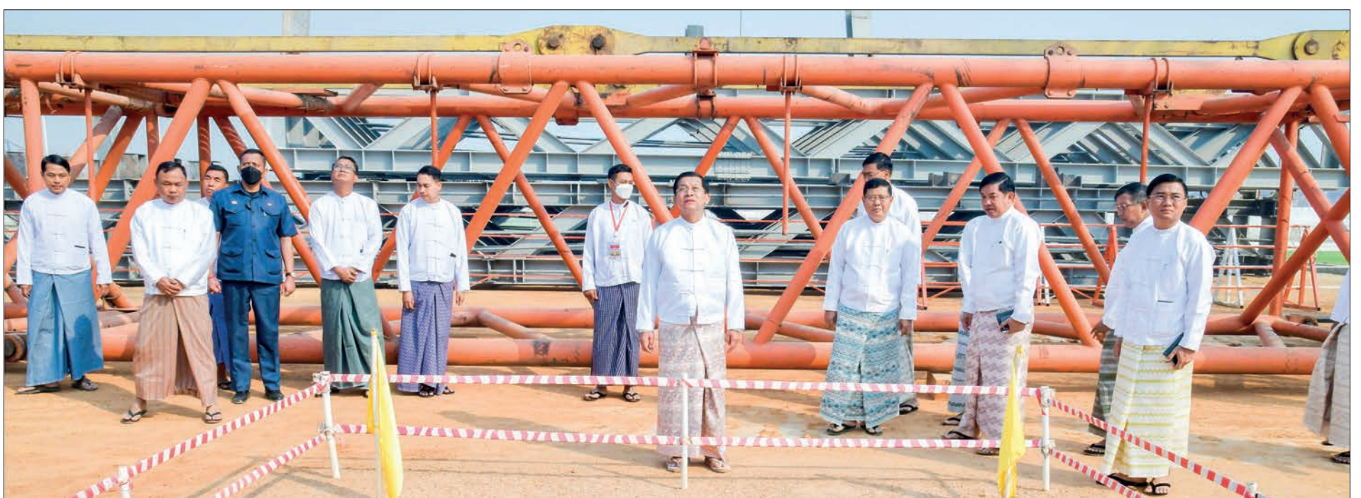
State Administration Council Chairman Prime Minister Senior General Min Aung Hlaing is pictured at the ceremony of enshrining religious objects into the jewelled throne of Maravijaya Buddha image in Nay Pyi Taw yesterday.