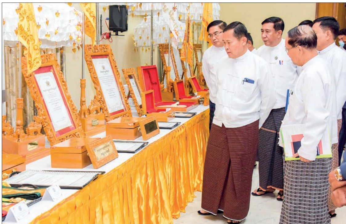
The Vice-Senior General views preparatory work for the 2023 religious title offering ceremony.

Sangha and they must be skilful in languages.