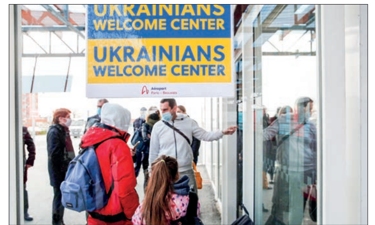
Ukrainian nationals fleeing the conflict in their country follow the direction of a “Ukrainians Welcome Centre” after their arrival at the Paris-Beauvais Airport in Tille, north of Paris, on 2 March 2022, seven days after Russia launched a military invasion of Ukraine.

The bloc is already hosting millions of refugees from conflicts in Ukraine, Syria and Afghanistan, while facing asylum claims from citizens of safer countries such as Bangladesh, Türkiye and Tunisia, many of whom end up being deemed economic migrants ineligible for asylum.—AFP