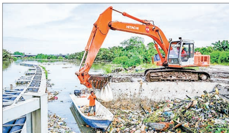
Workers clearing mounds of floating plastic waste of the Klang river, in Klang, on the outskirts of Kuala Lumpur.

Superbugs -- strains of bacteria resistant to antibiotics -- are estimated to have killed 1.27 million people in 2019, and the World Health Organization says antimicrobial resistance (AMR) is one of the top global health threats on the near-term horizon. Up to 10 million deaths could occur every year by 2050 because of AMR, the UN says.