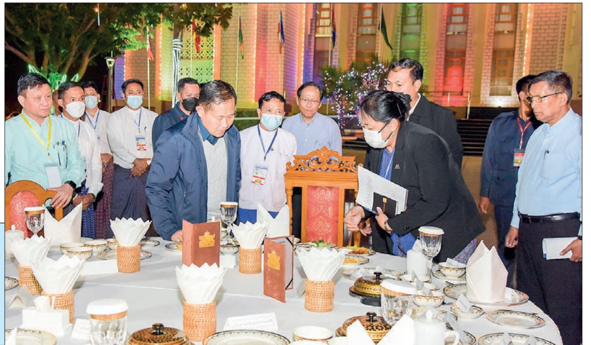
The Vice-Senior General views the seating plans for the honorary dinner.