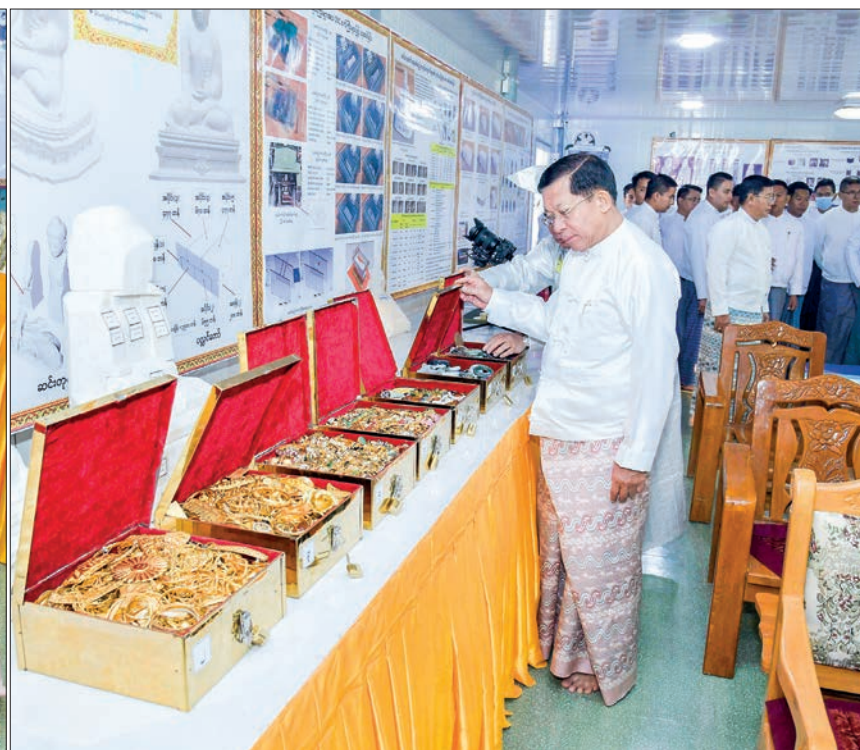
The Senior General views pieces of jewellery to be enshrined.

comprising jewellery items weighing 200 ticals, one pe and one yway, three kilogrammes of jewel stones, the horoscope of the Buddha image, silver