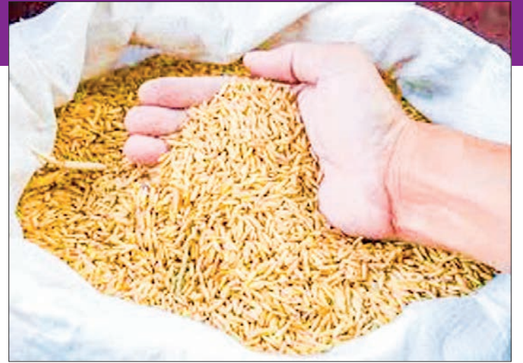
A potential customer is observing the quality of the sample paddy.

Thereafter, the prices increased again. The figures