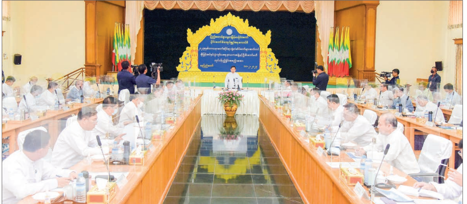
State Administration Council Vice-Chair Deputy Prime Minister Vice-Senior General Soe Win addresses the coordination meeting for offering religious titles for 2023 yesterday.

Staff from the hotel where title recipient Sayadaws would stay must have the capacity of disciples for members of the