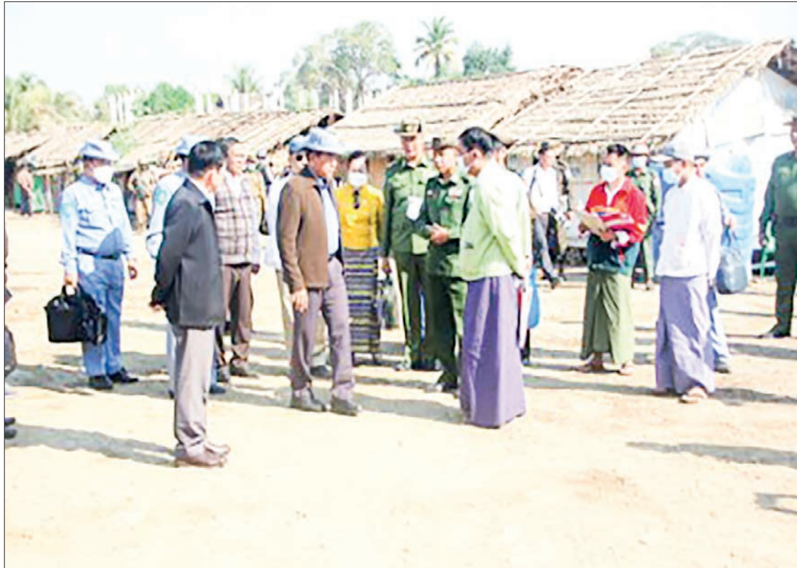
Union Minister Lt-Gen Tun Tun Naung is seen during his inspection tours of IDP camps in Rakhine State.

RAKHINE State Stability, Peace and Development Work Coordination Committee Chair Union Minister for Border Affairs Lt-Gen Tun Tun Naung and Union ministers inspected the Mahamuni temporary IDP camp in Kyauktaw township, Rakhine State, on 9 February.