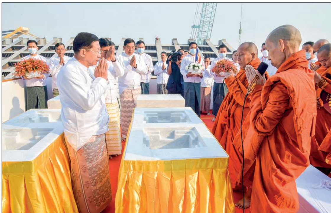
The enshrining ceremony of revered objects into the jewelled throne of the Maravijaya Buddha image is in progress yesterday in Nay Pyi Taw.

A ceremony to enshrine religious objects into the centre of the jewelled throne of the Buddha image took place on 27 January. On that day, gold wares weighing 104 ticals, 6 pe and three yway, gold wares