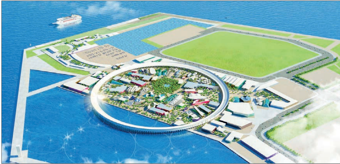
An artist's rendering shows the proposed venue for Osaka-Kansai Japan Expo 2025.

JAPAN aims to receive a record number of foreign visitors in 2025, a draft of the government's revised plan showed Thursday, with inbound tourism seeing a steady recovery since the country significantly eased border measures last October.