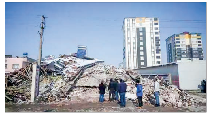
Rescue efforts underway in Türkiye.

Insured losses will be much lower, possibly around $1 billion, due to low insurance coverage in the area, it added. —AFP