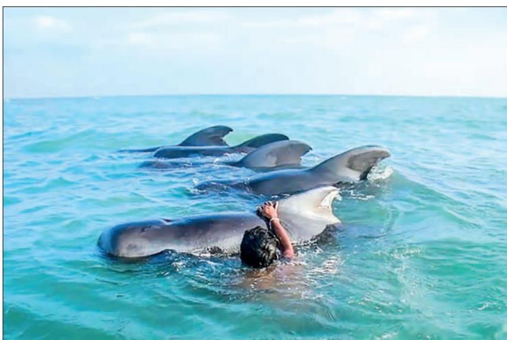
A Sri Lankan fisherman tries to push the pilot whales into deeper water off Kudawa.

Three pilot whales and one dolphin died of injuries following the mass beaching on the country’s western coast at Panadura, south of the capital Colombo.—AFP