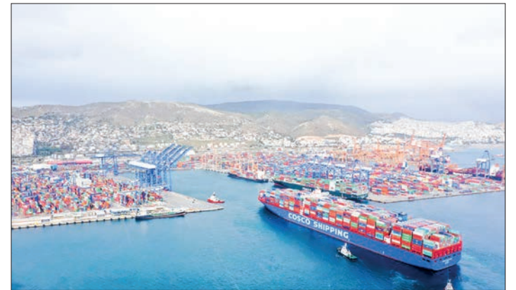
This aerial photo taken on 15 February 2019 shows a container ship of the COSCO Shipping approaching Piraeus port, Greece.