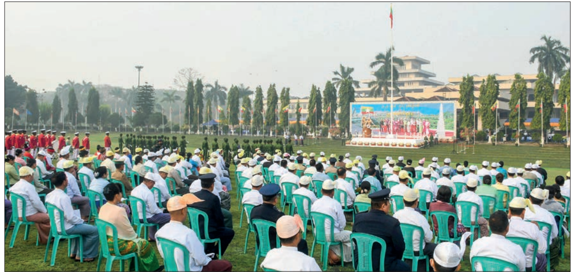
76 th Union Day celebration observed on assembly ground of the Hluttaw in Yangon on 12 February.

Next, the Yangon Region Chief Minister read the message sent by Chairman of the State Administration Council Prime Minister Senior General Tadoe Maha Thray Sithu Thadoe Thiri Thudhamma Min Aung Hlaing to the 76 th Anniversary of Union Day ceremony 2023. —Ko Ko Zaw (MNA)/KZL