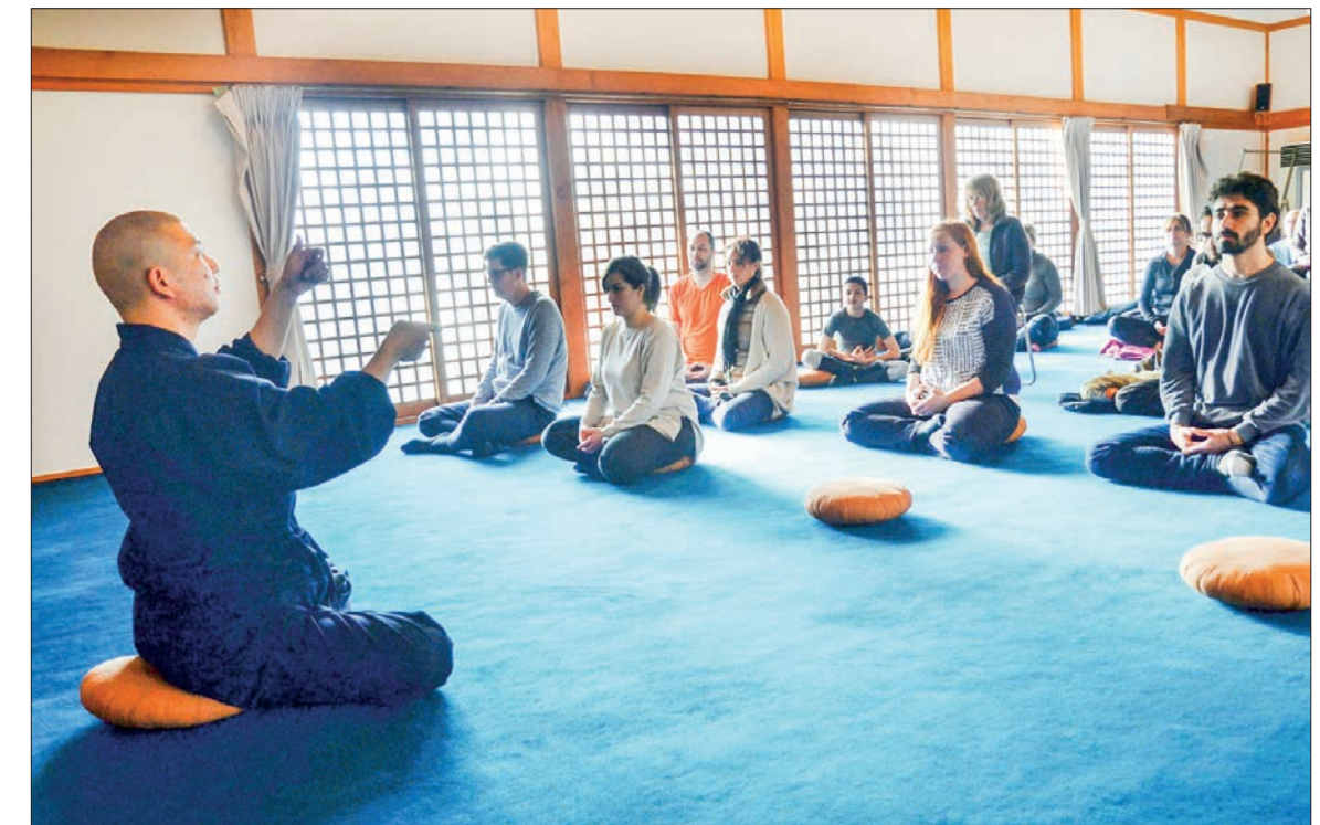
Mindfulness meditation, according to a team of researchers at Kyoto University's Graduate School of Medicine, does alleviate such worries.

However, it was unexpected to them that several global events, such as the Covid-19 pandemic and the Russo-Ukrainian war,