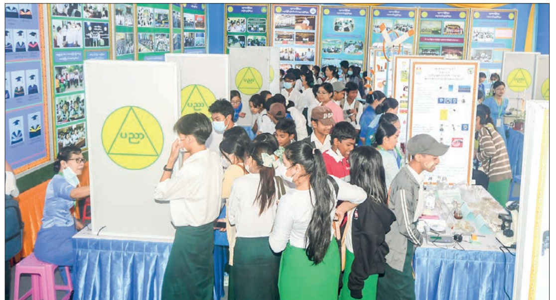
Student youths visit photo gallery of Union Day exhibition at People's Square in Dagon Township on 12 February.

Nay Pyi Taw Council, regions and states, 15 ethnic foods and 382 booths of MSME products, totalling 437 are displayed for public visits free of charge. —MNA/KZW