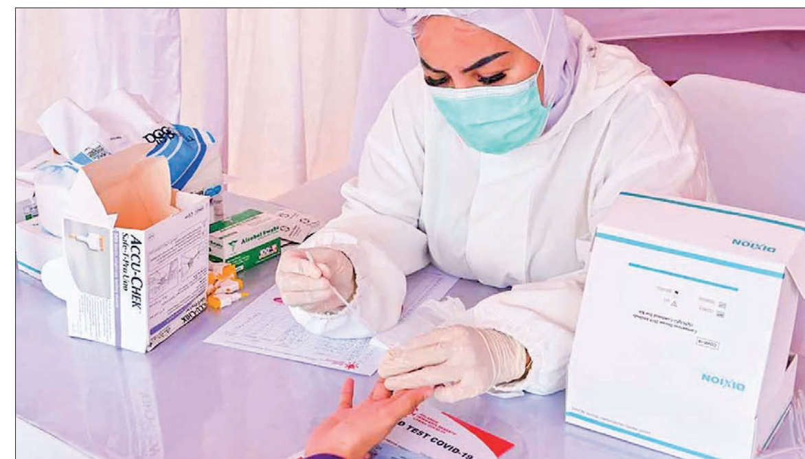
Rapid antigen tests search for protein pieces from the coronavirus.

He called for "data philanthropy", a concept which refers