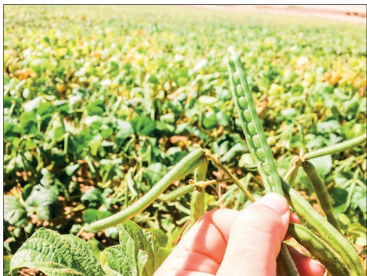
Green gram plants from Kayan and Thongwa areas are seen in the crop land.

THE prices of three types of beans and pulses are rising in the Yangon pulse market with in five consecutive days, especially the price of green gram (Kayan Shwewah variety) shoot by K360,000 per tonne.