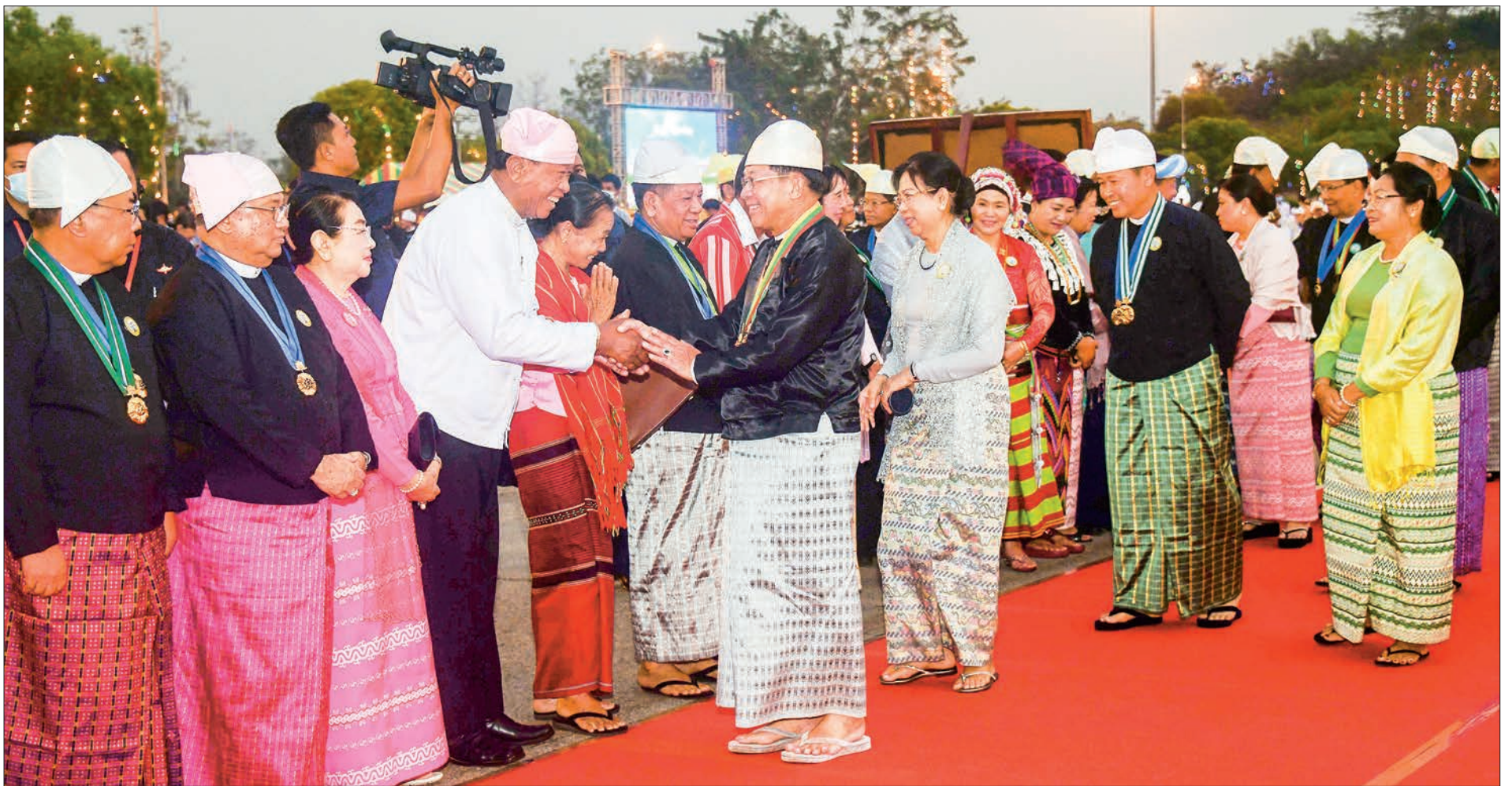
SAC Chairman Prime Minister Senior General Thadoe Maha Thray Sithu Thadoe Thiri Thudhamma Min Aung Hlaing and wife Daw Kyu Kyu Hla cordially greet the dignitaries at the dinner to mark 76 th Anniversary of Union Day 2023 on 12 February 2023.

CHAIRMAN of the State Administration Council Prime Minister of the Republic of the Union of Myanmar Senior General Thadoe Maha Thray Sithu Thadoe Thiri Thudhamma Min Aung Hlaing and wife Daw Kyu Kyu Hla hosted the dinner to mark