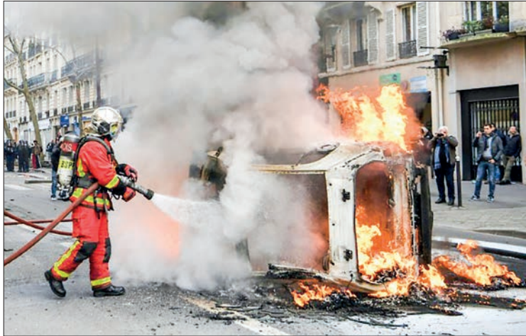
There were tensions when a car and a bin were overturned and set on fire.

HUNDREDS of thousands of people took to the streets in France on Saturday in a fourth day of action against President Emmanuel Macron's pension reform, with unions planning to ramp up strikes if the plan is not dropped.