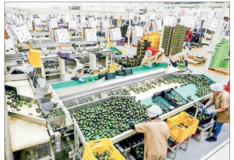
Workers sort avocados at the Los Cerritos avocado ranch in the state of Jalisco, Mexico.

But rivers of water came cascading down from higher up in the mountains surrounding his farm and scouring out ditches up to two meters deep.