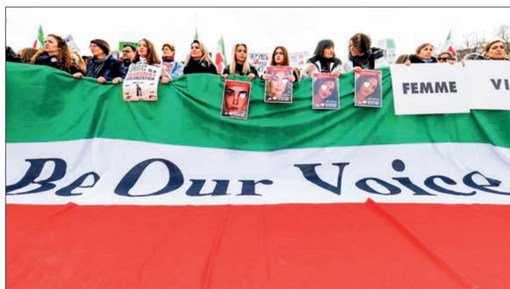
Protestors hold a giant Iranian flag during an opposition rally in solidarity with Iranian people on the 44 th anniversary of the Islamic Revolution, in Paris, on 11 February 2023.

EU ministers finally hear the voices of the Iranians," Swedish MP Alireza Akhondi, a prominent voice in the campaign, told AFP on the sidelines of the rally before giving an impassioned speech in