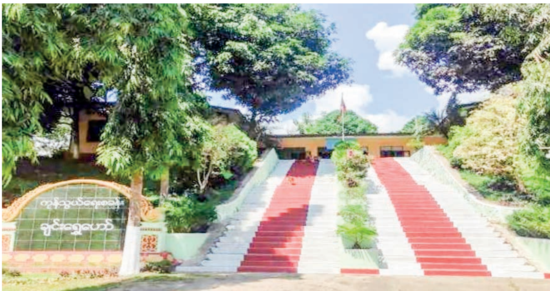
The photo shows a signboard of the Chinshwehaw border trade camp.

MYANMAR conducted trade worth US$52.455 million with neighbouring countries through the Chinshwehaw border in January 2023, statistics released by the Ministry of Commerce indicated.