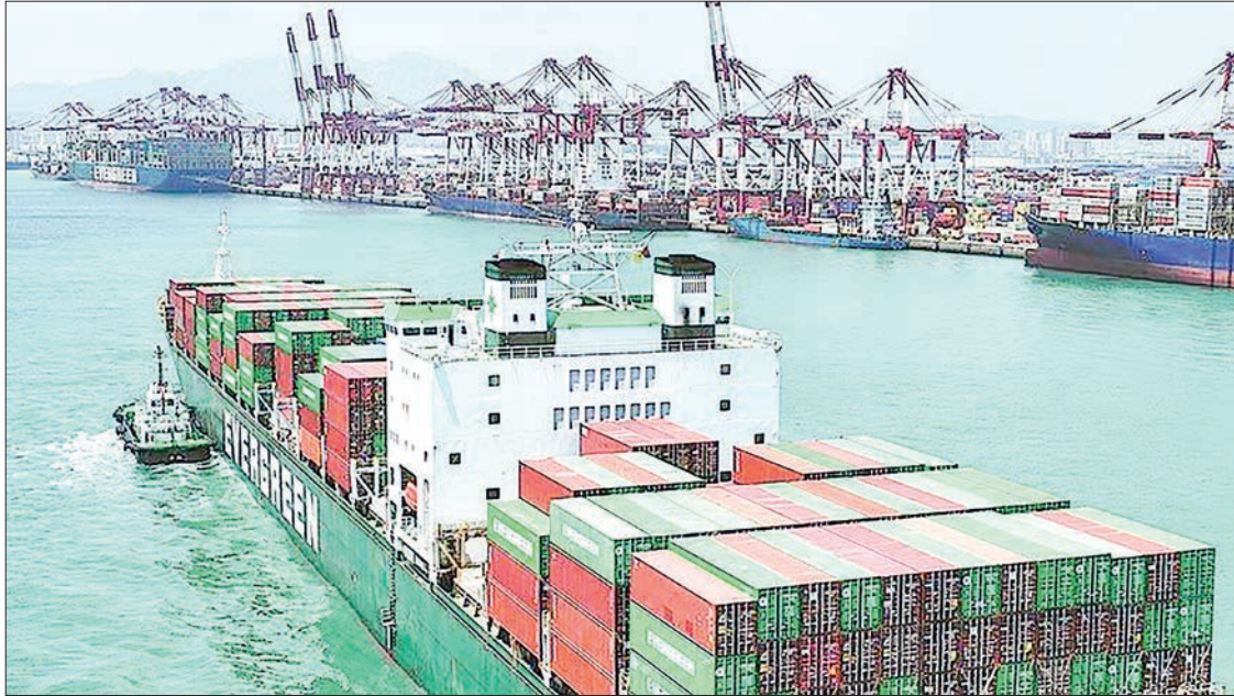
A container ship sails into the Qingdao Port on 2 June 2022.

THE booming orders at the beginning of 2023 mark a robust rebound in foreign trade in south China's Guangdong Province, a primary economic hub, injecting new impetus into the global economic recovery.