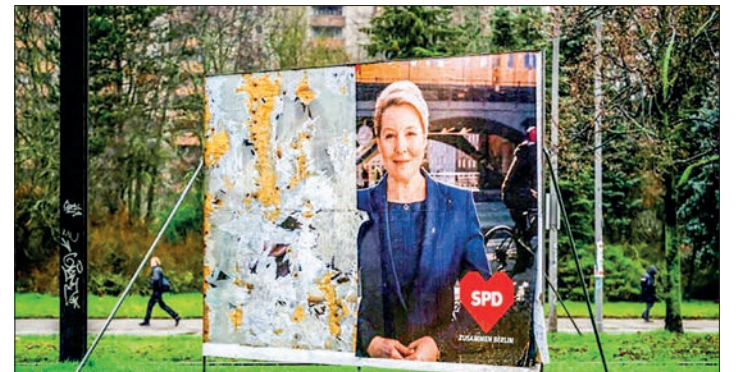
Sunday's rerun of a chaotic 2021 regional election in Berlin takes place under the watchful gaze of international election observers, invited in by the city itself to restore trust.