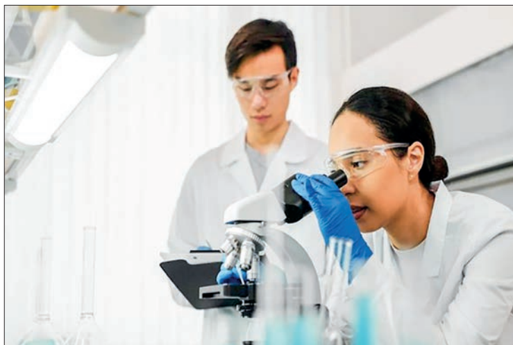
Researchers have overcome the obstacle of scale by analyzing electronic health record data.

In a new study led by Children's Hospital of Philadelphia (CHOP) and Nemours Chil-