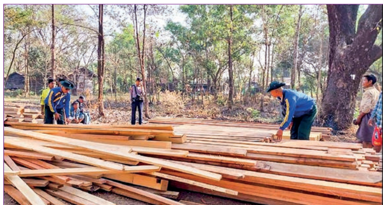
Illegal Taungthayet sawn timber seized near Shwegyin-Madauk-Nyaunglebin road on 11 February.

AN illegal special eradication task force inspected at airport cargo of Yangon International Airport on 9 February and seized 17,000 test kits of Covid-19 Ag Tests Kit estimated at K25.5 million without official documents. The action was taken under the Customs procedures.