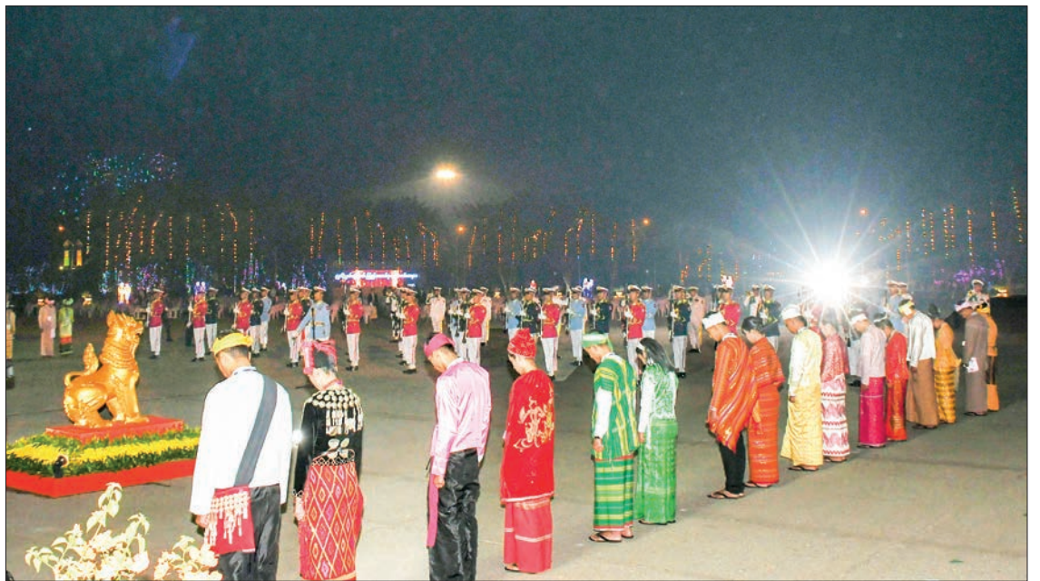
The ethnic nationals together with Guard of Honour are pictured in saluting the State Flag.

The ceremony was also attended by Union ministers, the auditor-general of the Union, the chairman of Union Civil Service Board, the chairman of Nay Pyi Taw Council, officials, cultural troupes and guests.