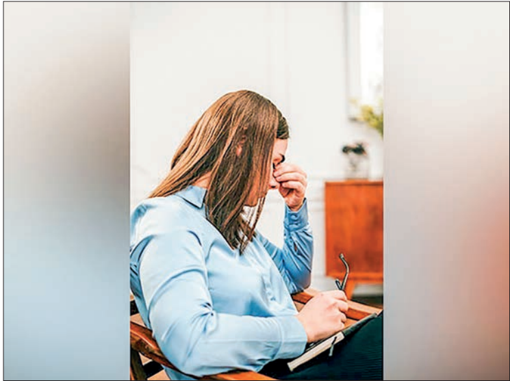
People from less affluent backgrounds are far more likely to experience mental health issues later in life than people from more affluent ones. PHOTO: REPRESENTATIVE IMAGE/ ANI