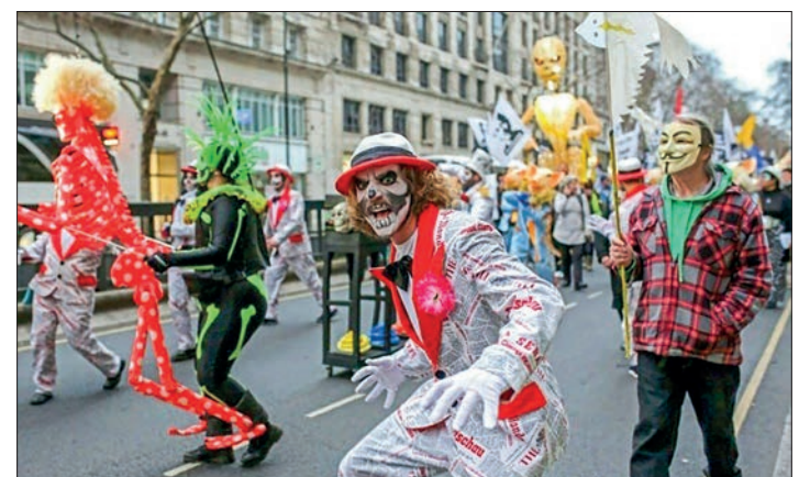
Supporters of WikiLeaks founder Julian Assange take part in a 'Night Carnival for Assange' march in London.

The Australian publisher remains in custody in Britain pending a US extradition request to face trial for divulging US military secrets about the wars in Iraq and Afghanistan.