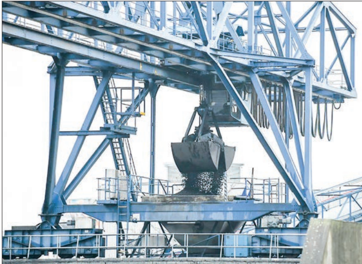
Loading equipment operates at a coal yard of a thermal power plant in Berlin, Germany, 9 January 2023.