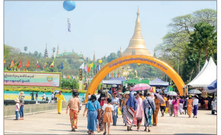
Union Day exhibition crowded with visitors at People's Square in Dagon Township on 12 February.

The exhibition to mark the 76 th Union Day including traditional food galleries is being held from 9 am to 10 pm from 10 to 14 February for five days. At the celebration, 25 ministry galleries, 15 galleries of