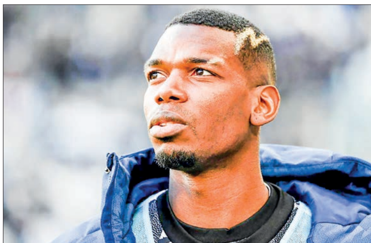
Paul Pogba has yet to play for Juventus this season.

In late January, Allegri said ahead of a game with Monza that