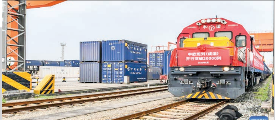
Photo taken on 30 June 2022 shows a China-Europe freight train ready for departure at the Chengdu International Railway Port in Chengdu, Southwest China's Sichuan province.

ness opportunities in the world, the customs said. —Xinhua