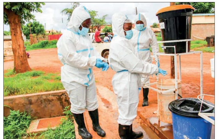
The file photo shows environmental officers disinfecting themselves after disinfecting a body at Bwaila hospital in Lilongwe, Malawi, on 17 January 2023.

Makubi was reacting to reports by the World Health Organization (WHO) on Thursday saying the deadliest cholera outbreak in Malawi's history has killed at least 1,210 people, while vaccines remain scarce as sever-