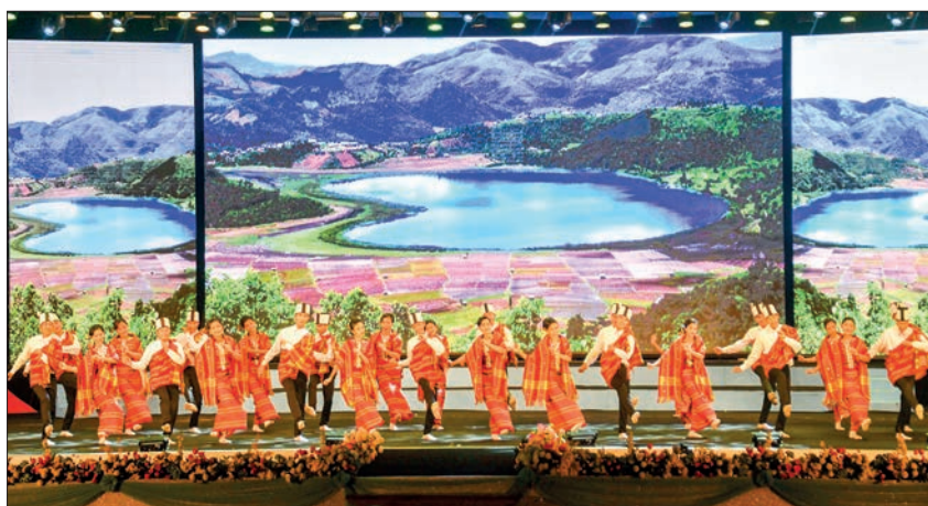
The ethnic cultural troupes perform dances at the dinner event.