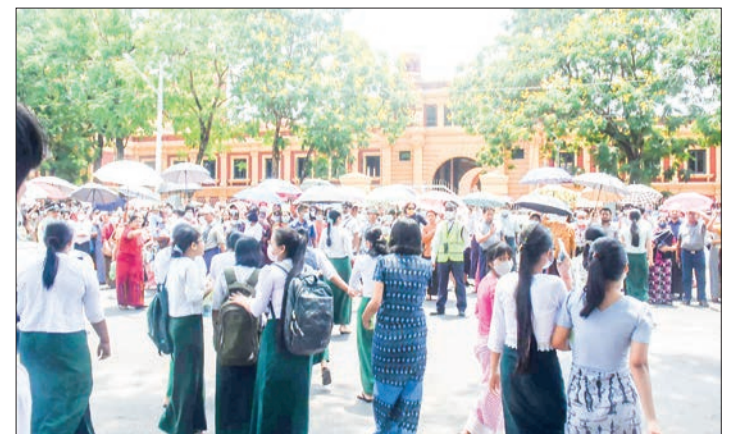
The photo shows students who took the 2022 matriculation examination.