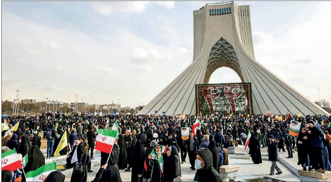
Iranians rally in front of Tehran's Azadi Tower to mark the 44 th anniversary of the 1979 Islamic Revolution.

TENS of thousands of Iranians rallied Saturday in Tehran and other major cities to mark the 44 th anniversary of the Islamic Revolution, as their president said months-long protests had been defeated.