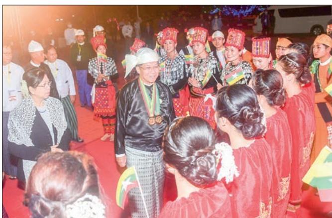
The Senior General and wife cordially greets the ethnic cultural troupes at the dinner.

The dinner was also attended by the SAC Secretary and wife, the SAC Joint-Secretary and wife, SAC members and their wives, members of the Advisory Body of SAC, retired senior military officers, Union ministers, Union level officials and their wives, senior military officers and their wives, the advisers to the SAC Chairman, the commander of Nay Pyi Taw Command, deputy ministers, region and state ethnic affairs ministers, leaders and representatives of NCA signatory EAOs, chairmen and representatives of political parties, departmental officials, ethnic cultural troupes from regions and states and guests.