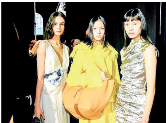
Models pose backstage at the Proenza Schouler show.

US fashion label Proenza Schouler on Saturday presented a low-key, functional collection, without its past conceptual showiness, as the brand marks its 20 th anniversary at New York Fashion Week.