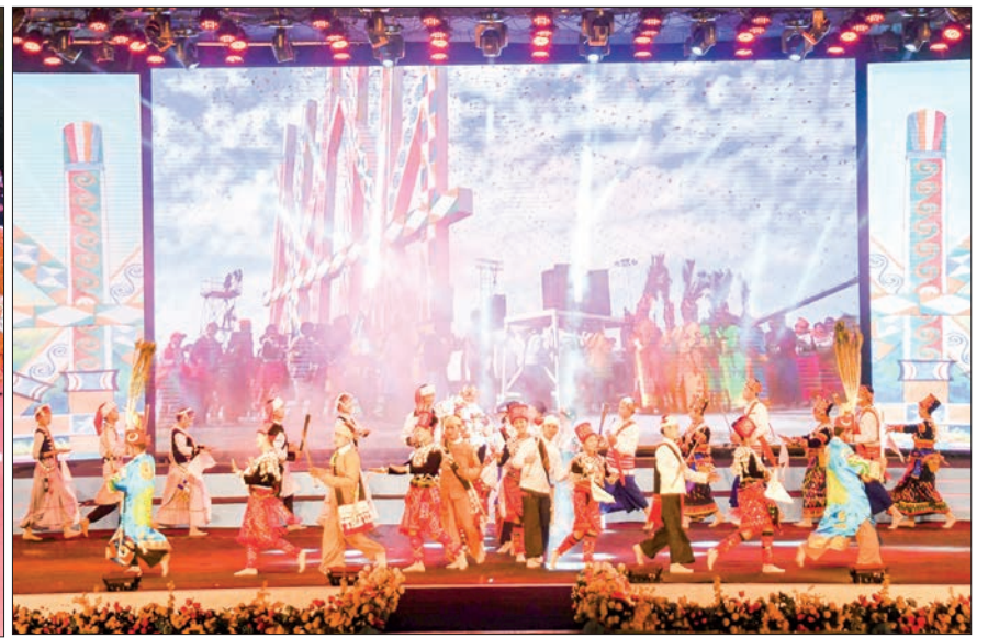
Senior General Min Aung Hlaing and dignitaries watch entertainments on ethnic traditional dances of cultural troupes and artistes of Fine Arts Department at the open-air theatre at the honorary dinner in Nay Pyi Taw on 12 February.