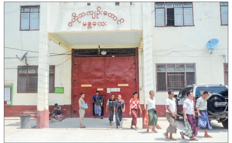
Some prisoners released from Mandalay Central Jail.

purchase the ration rice—16,308 bags for Ayeyawady Region, 32,382 bags for Bago Region, 12,210 bags for Magway Region, 17,984 bags for Taninthayi Region, 9,498 bags for Rakhine State and 17,780 bags for Kachin State. — TWA/KZW