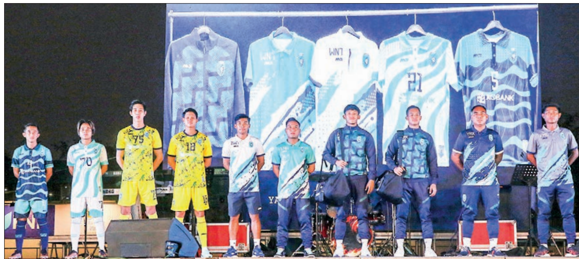
Yangon United players show off their team kits during the 2023 Kits Launching Ceremony.