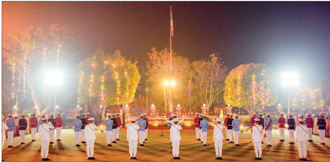
The flag hoisting ceremony to commemorate the 76 th Union Day in progress in Nay Pyi Taw.

The 76 th Anniversary of Union Day 2023 was held in line with the five point National Objectives with essence: to strive for the perpetual existence of national solidarity and perpetuity of the Union through the internal strength; to make collaborative efforts of all ethnic nationals to restore perpetual and durable peace; to join hands in harmony for ensuring the prosperity and food sufficiency of the nation as two national plans through the Union spirit; to help develop all regions and states on equal terms and increase employment opportunities with