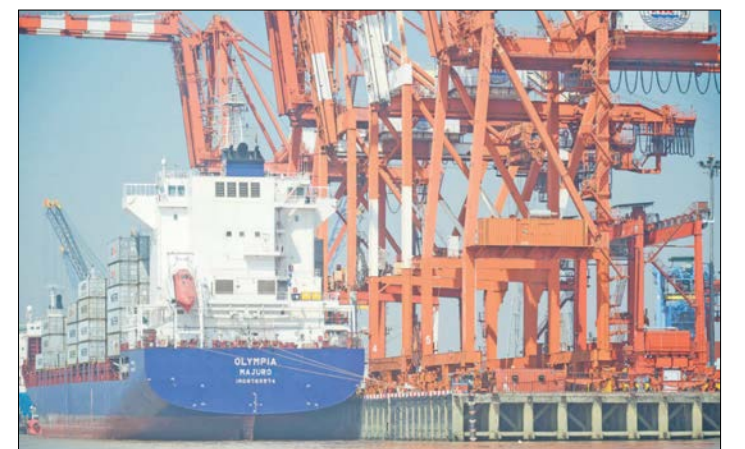
Freight handling seen at the port to export of products from Myanmar to customer countries.

Among 10 main export items of Myanmar, the export of finished garments, which is an industrial product, takes the first position. Among the finished industrial goods, sugar, including ready-made cloth, jewellery, and natural gas are included. — TWA/KZL