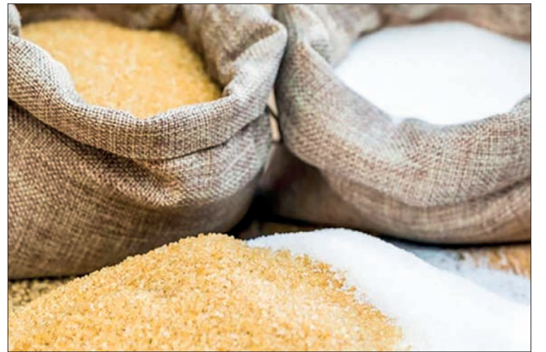
Bags sugar can be seen as samples in the market.

sugar is around 500,000 tonnes per year, and the surplus sugar from domestic consumption is around 50,000 tonnes. It is known that extra sugar is to be exported this year. — TWA/CT