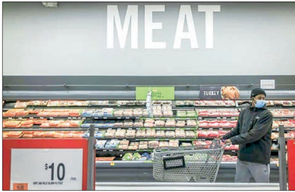
Food sanitation contractor Packers Sanitation Services hired minors at meat-processing facilities, investigators found.

A sanitation company in the United States has paid $1.5 million in penalties for hiring over 100 children in "hazardous occupations" and having them work at meat processing facilities, the Department of Labour said Friday. Officials found that the food sanitation contractor, Packers Sanitation Services, had employed at least 102 children aged between 13 and 17, and had them working