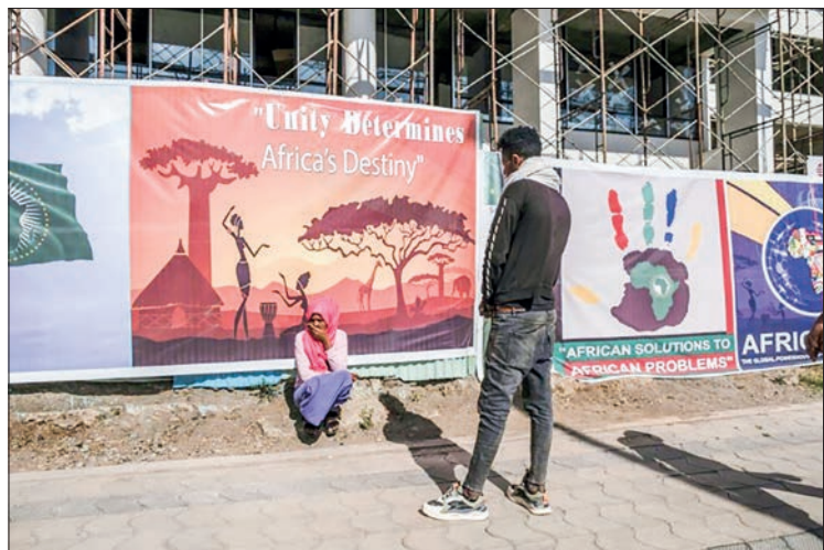
The two-day summit aims to accelerate a free-trade pact launched in 2020.

AFRICAN leaders met Saturday in Addis Ababa for an annual summit, aiming to jumpstart a faltering trade deal while also focusing on the continent's most pressing challenges, including armed conflict and a worsening