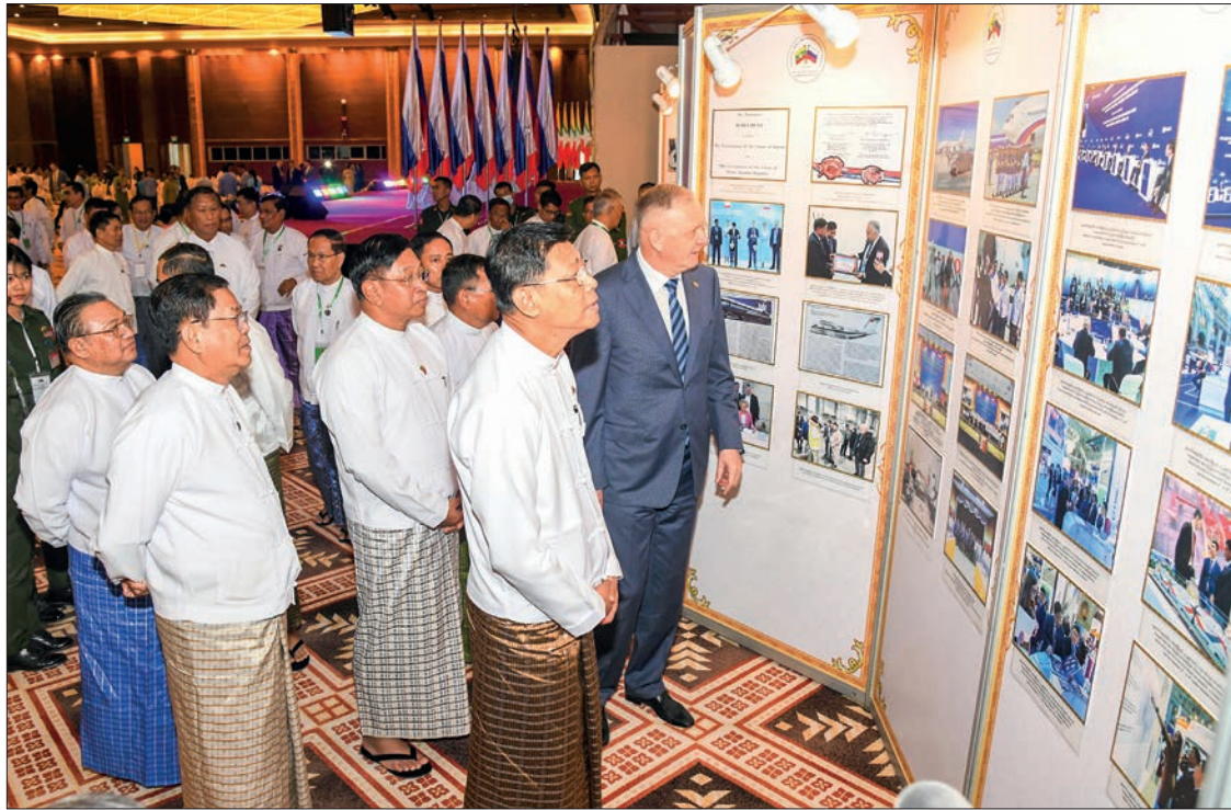
SAC members, Deputy Prime Ministers, Union Ministers, the Russian ambassador and dignitaries view round the display at the event yesterday.

A ceremony to commemorate the 75 th Anniversary (Diamond Jubilee) of the Establishment of Diplomatic Relations between Myanmar and the Russian Federation was held at the Myanmar International Convention Centre-I (MICC-1) in Nay Pyi Taw on the morning of 18 February 2023. The ceremony was attended by members of the State Administration Council, Union-level dignitaries, Deputy Prime Ministers, Union Ministers, Deputy Ministers, the Russian Ambassador to Myanmar, Ambassadors/ Heads of Diplomatic Missions in Yangon, members of the diplomatic corps, and officials from the concerned ministries.