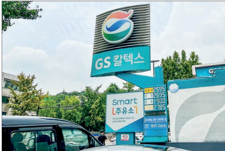
Photo taken on 5 July 2022 shows the price board at a gas station in Seoul, South Korea.

South Korea's export dropped 16.6 per cent in January from a year earlier, keeping a downward trend for the fourth consecutive month.