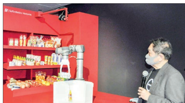
Bridgestone Corp shows to the media in Tokyo on 1 February 2023, a newly developed Soft Robot Hand that can grip and move objects even if they are soft. Ken Kutaragi, seen on the right, is CEO of Ascent Robotics Inc, the company that cooperated in the development of the robot.

The Japanese tyre maker, which unveiled a prototype to media in Tokyo on 1 February, plans for the soft robot hand to be commercially available, possibly in 2024. — Kyodo