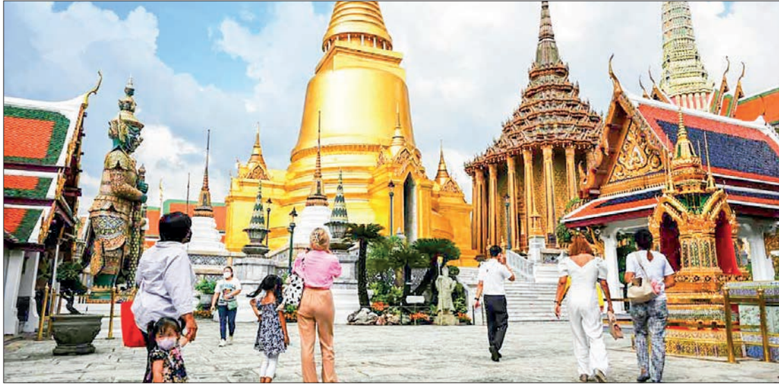
Thailand is banking on the return of tourists to boost its economy. The Grand Palace is a complex of buildings at the heart of Bangkok, Thailand.

THAILAND'S economy expanded by 2.6 per cent last year on the back of a tourism recovery and strong consumer confidence but an export slowdown dragged on growth, officials said Friday.