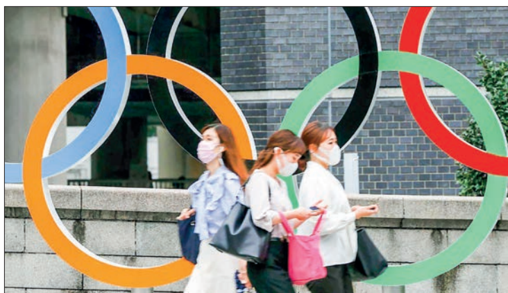
People wearing face masks walk past the Olympics Rings statue in Tokyo.