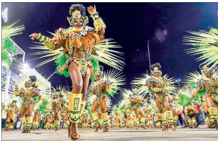
Rio's last pre-Covid carnival, in 2020. PHOTO: AFP

"Thanks to science, the public health system and those who got vaccinated, we can celebrate life again." Rio is ready to party after two pandemic-disrupted carnivals and a polarizing presidential election in October, in which veteran leftist Luiz Inacio Lula da Silva ousted incumbent Jair Bolsonaro — an ultra-conservative carnival critic accused of authoritarian tendencies who was regularly the target of protests and mockery during the festivities.—AFP