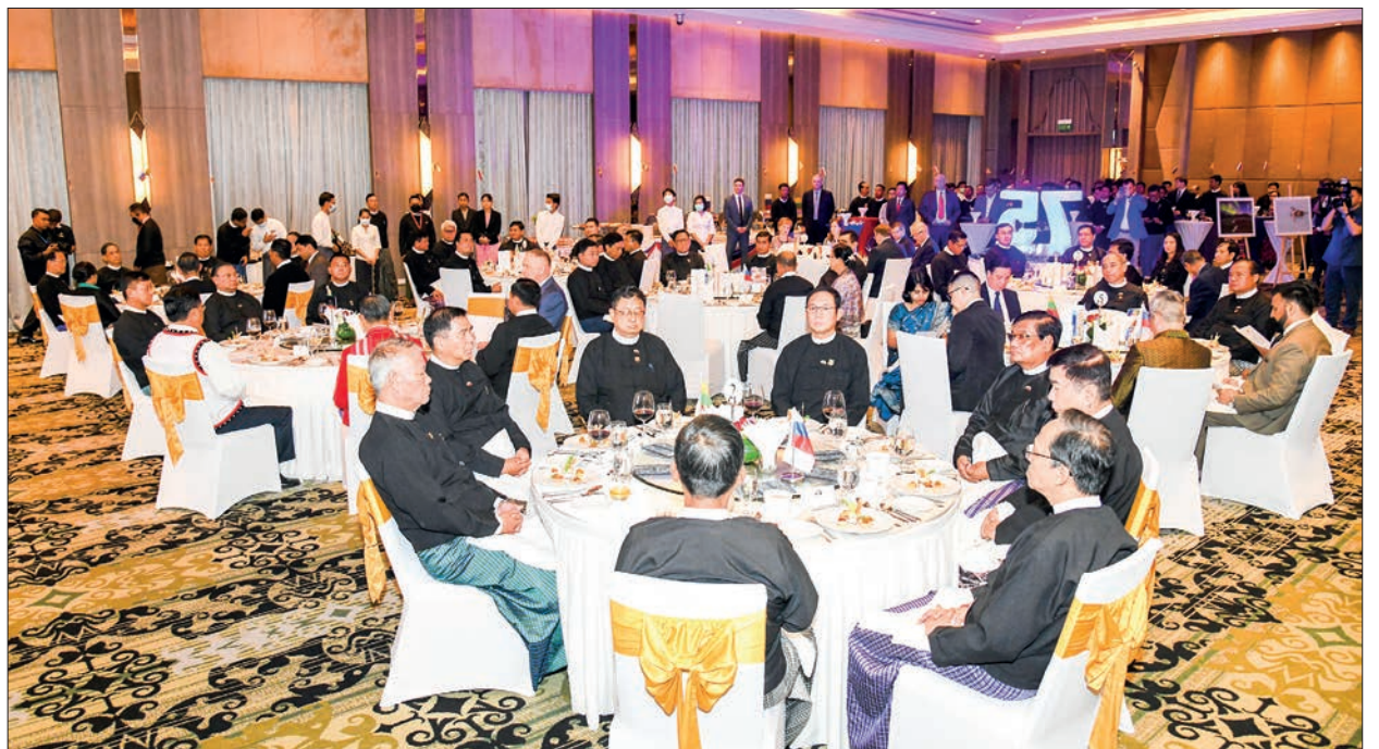
State Administration Council Vice-Chairman Deputy Prime Minister Vice-Senior General Soe Win speaks on the occasion of the reception to commemorate the 75 th Anniversary of the Establishment of Myanmar-Russia Diplomatic Relations yesterday in Nay Pyi Taw.