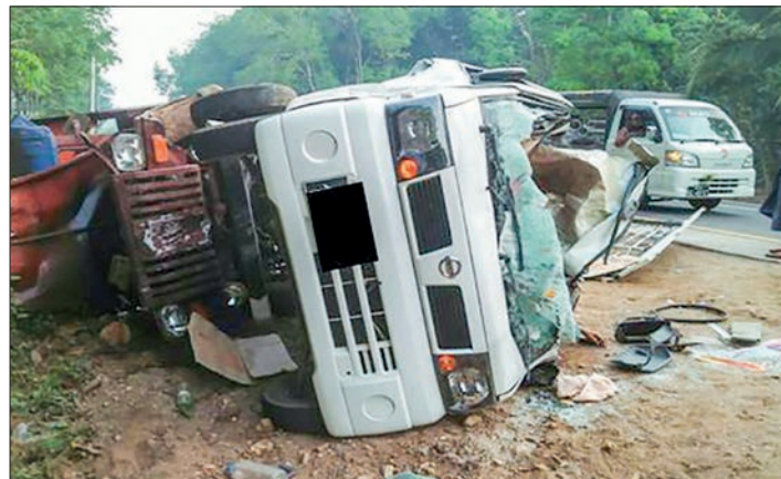
One fatal traffic accident.

IN January, there were 452 accidents with 564 injuries and 230 deaths, according to the of Road Transport Administration Department.