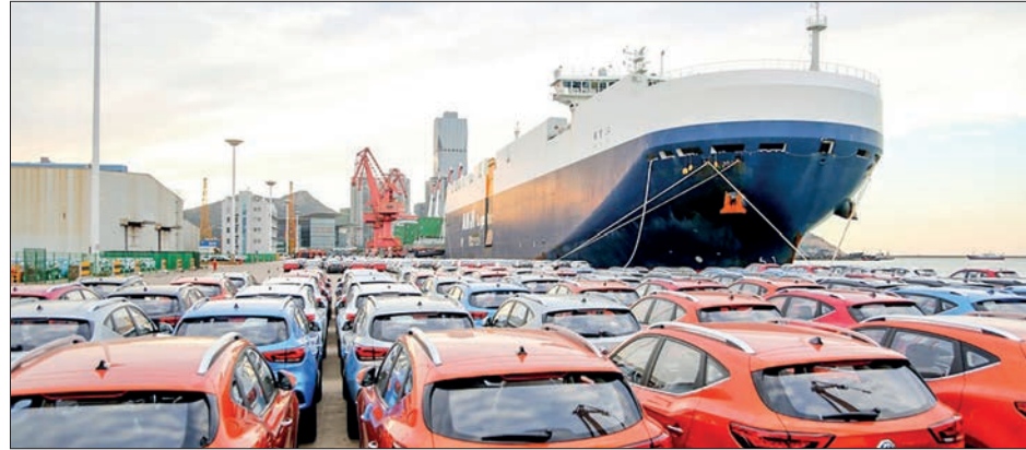
Vehicles for export are parked at a port in Lianyungang, Jiangsu province, in October.