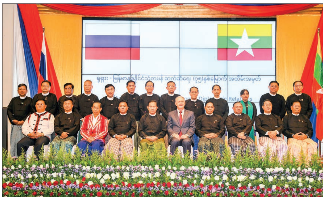
The documentary group photo of the event.

The Vice-Senior General said that he took pride in the highest relations between the two countries thanks to the far-sightedness and endeavours of both leaders. He expressed his firm belief that the potential for future cooperation between the two countries can be seen to multiply the good results for both countries. Myanmar