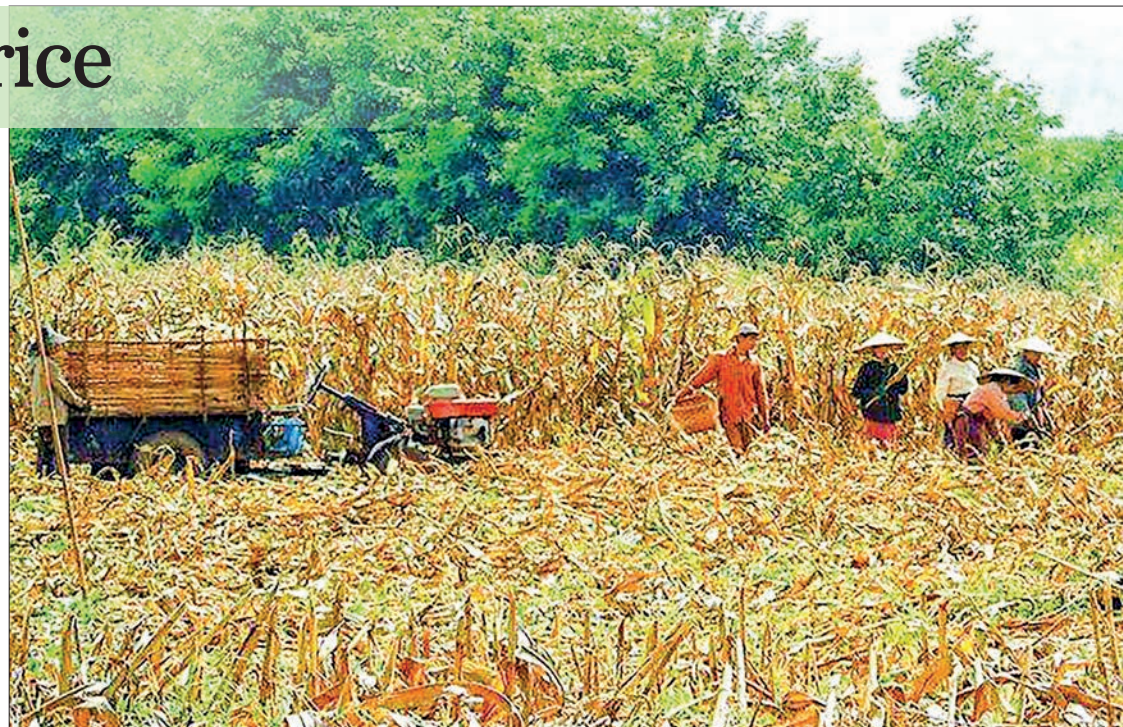
A corn plantation in a village near the border with China.

The CBM's notice dated 18 November takes effect on those export items; various pulses