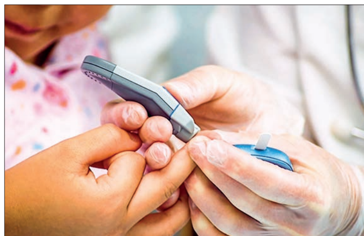
High blood sugar (hyperglycaemia) is where the level of sugar in blood is too high.

The study, recently published in the Journal of the American Medical Association, used data from the US National Health and Nutrition Examination Survey among 2,482 adults to conduct a serial, population-based, cross-sectional analysis.