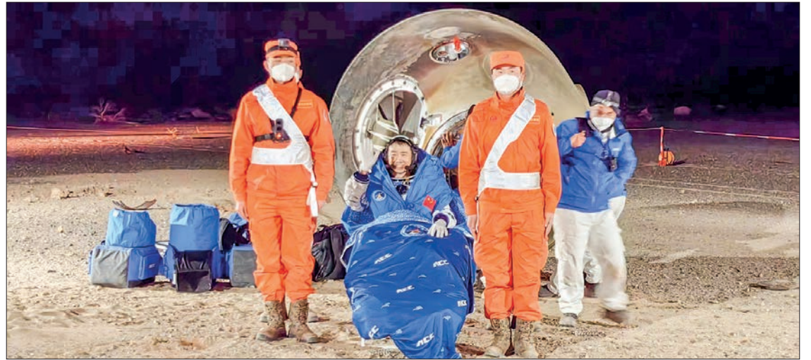
Astronaut Chen Dong is out of the return capsule of the Shenzhou-14 manned spaceship at the Dongfeng landing site in north China's Inner Mongolia Autonomous Region, 4 December 2022. The return capsule of the Shenzhou-14 manned spaceship, carrying astronauts Chen Dong, Liu Yang and Cai Xuzhe, touched down at the Dongfeng landing site safely.

THE three astronauts of China's Shenzhou-14 crewed mission met with press on Friday, in their first such appearance since returning to Earth in December.