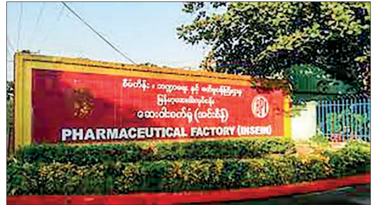
The sign of Myanmar Pharmaceutical Factory (former BPI).

Myanmar Pharmaceutical Factory (Insein) was able to produce Covid-19 vaccines worth K32.738 billion this financial year. It also fulfilled medicinal requirements and orders from the government departments concerned.