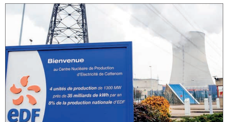
France's nuclear power stations are getting old and losing steam.