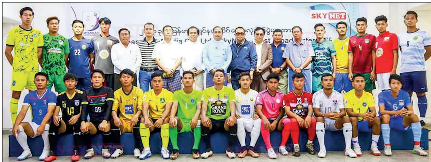
The photo shows attendees of the press conference held to announce that Myanmar National League football matches will be shown by SkyNet TV channel.

THE 2023 Myanmar National League football matches will be broadcast live by SkyNet as the host broadcaster, according to a press conference on 18 February.