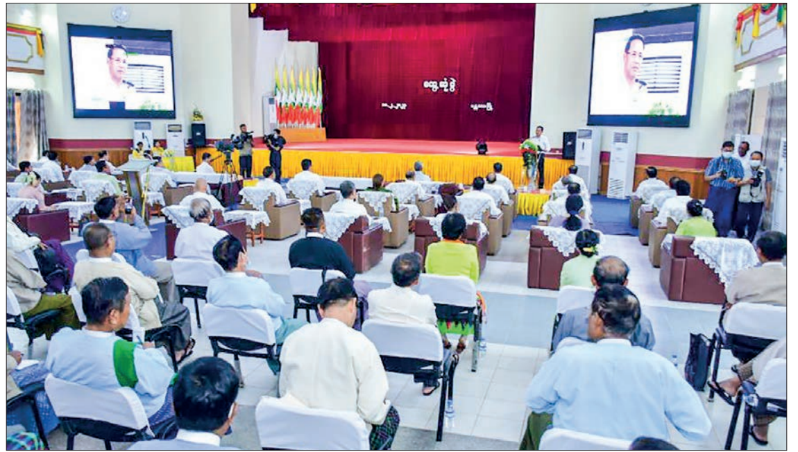
The meeting between Union Ministers and Mandalay Region Chief Minister and businesspersons and artistes is in progress yesterday in Mandalay.

In the evening, Union Information Minister U Maung Maung Ohn paid homage to 36 feet high Sitagu Sanchi pagoda