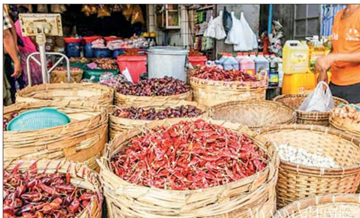
Kitchen goods are seen in a grocery.

The prices of various pulses were spiked at over K1,885,000 per tonne of black gram (Fair Average Quality/RC), K2,120,000 per tonne of black gram (Special Quality/RC), K2,132,500 per tonne of pigeon pea (red gram) RC, K4,100-4,400 per viss of chickpea in Yangon markets. — TWA/EM