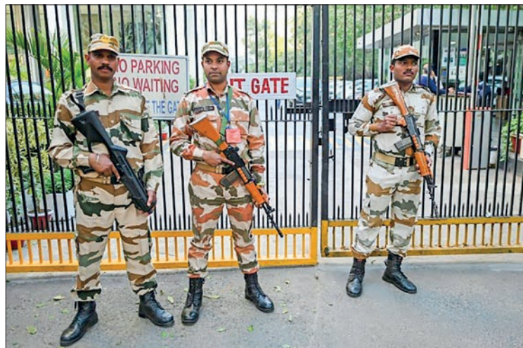
Indian tax authorities raided the BBC's offices in New Delhi and Mumbai weeks after the broadcaster aired a documentary on Narendra Modi's actions during deadly sectarian riots in Gujarat in 2002, when he was the state's chief minister.

"He actually thinks that it doesn't matter that this is a country of 1.4 billion people — we are almost that — whose voters decide how the country should run." — AFP