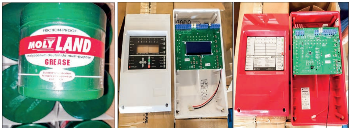
Confiscated illegal commodities (above and left below photos).

alarm panel worth K51,003,435 that were more than 60 days of valid for prior arrival (VPA) at the Yangon International Airport (Import) and four kinds of goods including 2,764.8 kilogrammes of milk powder (Gauliac) worth K164,001,096 that exceeded the