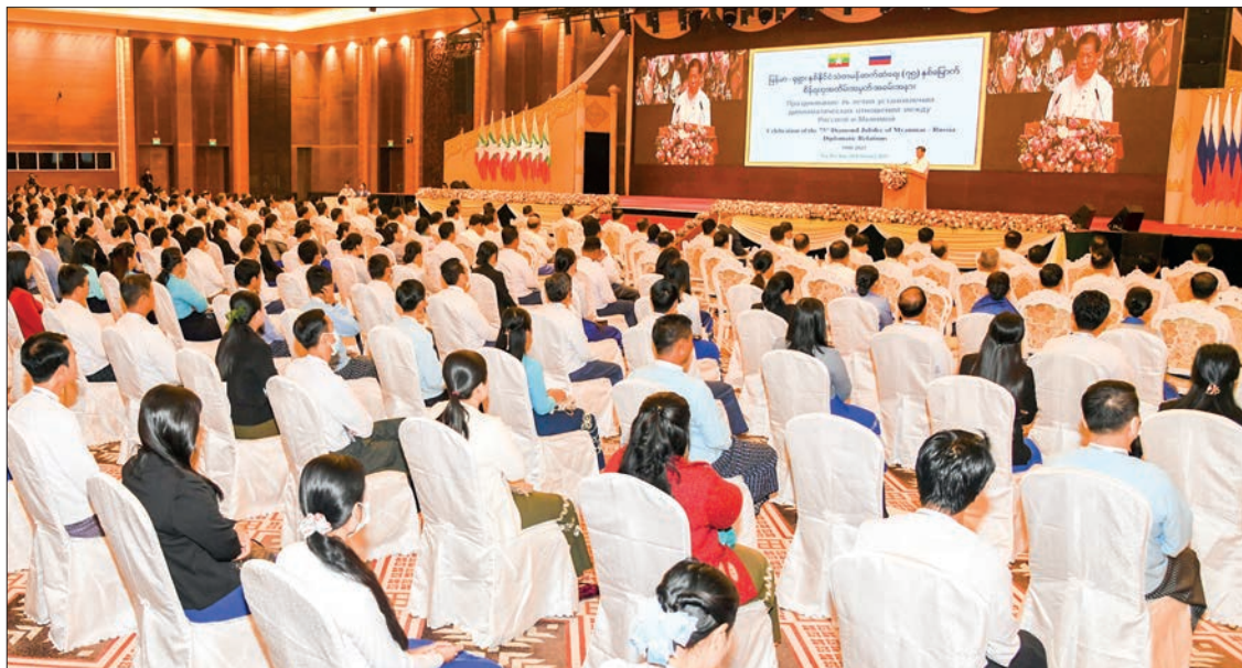
Union Minister U Than Swe reads the message of felicitation from SAC Chair Prime Minister Senior General Min Aung Hlaing to the President Vladimir Putin of the Russian Federation at the event yesterday.

During the ceremony, U Than Swe, Union Minister for Foreign Affairs read out the congratulatory message conveyed from the Chairman