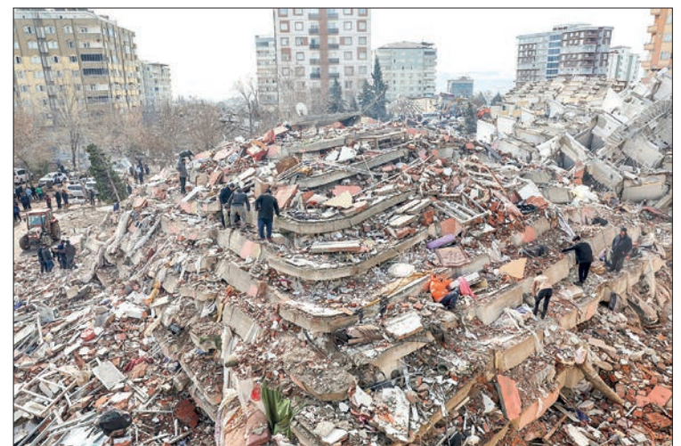
Civilians look for survivors under the rubble of collapsed buildings in Kahramanmaraş, close to the quake's epicentre, the day after a 7.8-magnitude earthquake struck the country's southeast, on 7 February 2023.

ishing coffers have been replenished by assistance from Russia and oil-rich Gulf states, which has helped Türkiye spend tens of billions of dollars propping up the lira in the past few years.