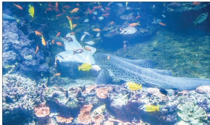
70 percent of the Salas y Gomez and Nazca ridges fall outside of Chile's exclusive economic zone.

With more than 6,400 kilometres (3,970 miles) of coastline, the South American country already has 42 MPAs covering some 150 million hectares or 43 per cent of its exclusive eco-