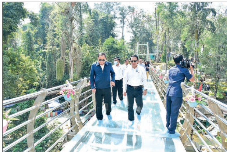
Union Minister for Information U Maung Maung Ohn visits glass bridge at Pwekawk Waterfalls on 19 February.

The project implemented as from 2012 was completed in 2015. Although all separate housings, condo apartments and housing shops have been sold, rental houses will be rented for opening offices. The hotel service started in the post-Covid-19 period. New Star Light Company gives services for security, cleaning, landscaping, health and maintenance in the project area.—MNA/TTA