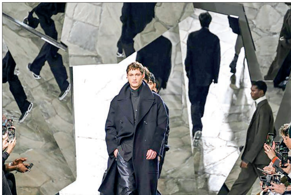
Luxury labels such as Hermes want back into the Chinese market as it opens up after the Covid crisis.

Kering, despite a tough time for its flag-