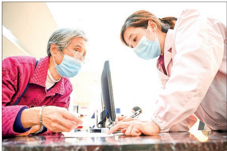
A staff member explains medical insurance policies to a resident at a hospital in Sanming, Fujian Province, 18 November 2020.

A number of Chinese cities have been implementing a reform of health insurance for urban employees and retirees, which adjusts the amounts deposited each month into their person-