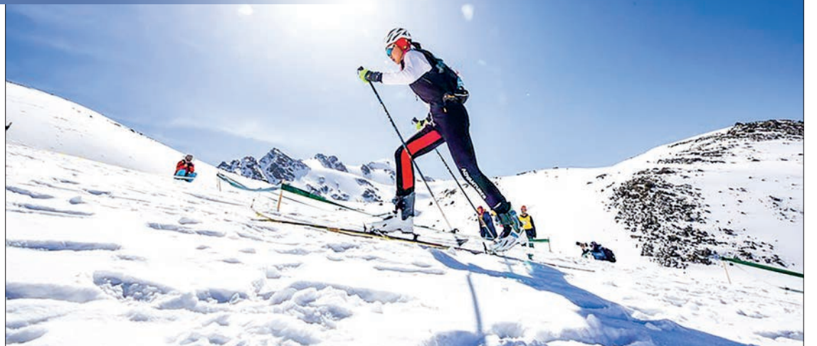
A participant in action during the 2019 World Ski Mountaineering Masters Mt. Gangshika in Menyuan County, northwest China's Qinghai Province, 24 May 2019.