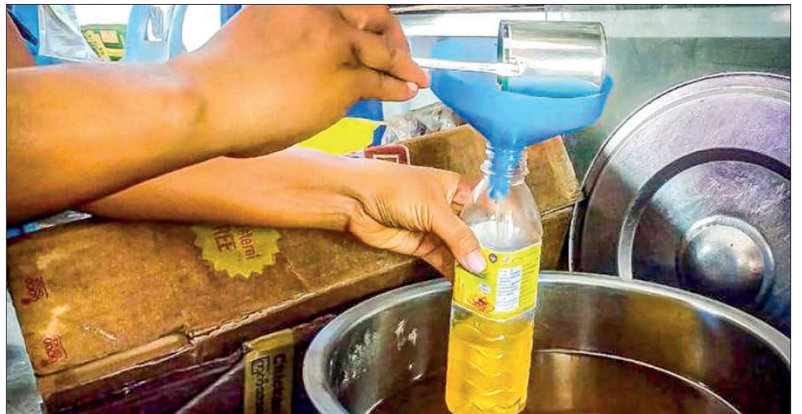
A retailer pouring palm oil into a bottle in the market.

On 16 August, the market price was exorbitantly high at K9,700 per viss when the reference price was set at K4,140 per