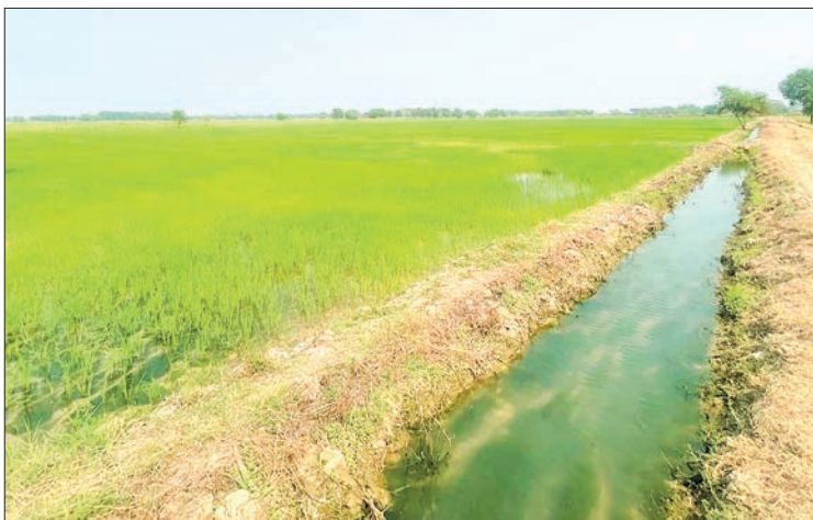
A drain seen between thriving paddy farms.

The Yangon Region Irrigation and Water Utilization Management Department is conducting water supply activities for successful thriving of summer and winter crops, drinking water supply works to Yangon, Thanlyin Township and Kyauktan Township, prevention of flooding for monsoon paddy farms and carries out maintenance of irrigation facilities on a yearly basis.—Nyein Thu (MNA)/KZL