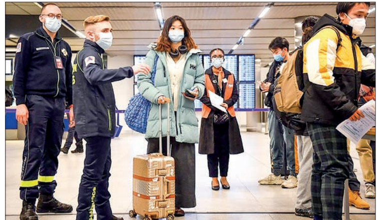
Passengers of a flight from China wait in a line for checking their Covid-19 vaccination documents as a preventive measure against the Covid-19 coronavirus, after arriving at the Paris-Charles-de-Gaulle airport in Roissy, outside Paris, on 1 January 2023.

Several countries, including Japan, South Korea and Singapore, have also eased restrictions on travellers from China in recent weeks. —AFP