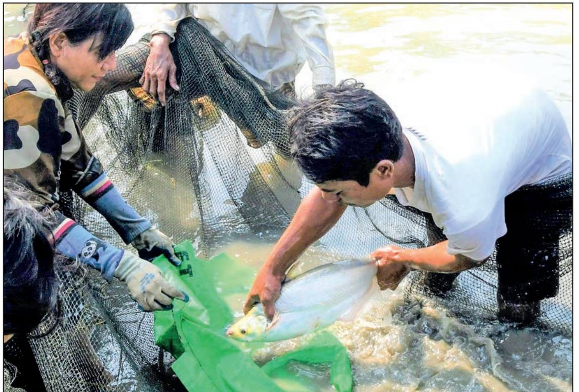
Fish farmers capture Proeutropiichthys taakree fish at the farm.

The fish is seen in the lower part of Mandalay Region and they do not exist in the Mekong River and so it is standing as a pride for the country. Bangladesh recognizes the Hilsa as its National Fish and controls the foreign market today. The Department of Fisheries and