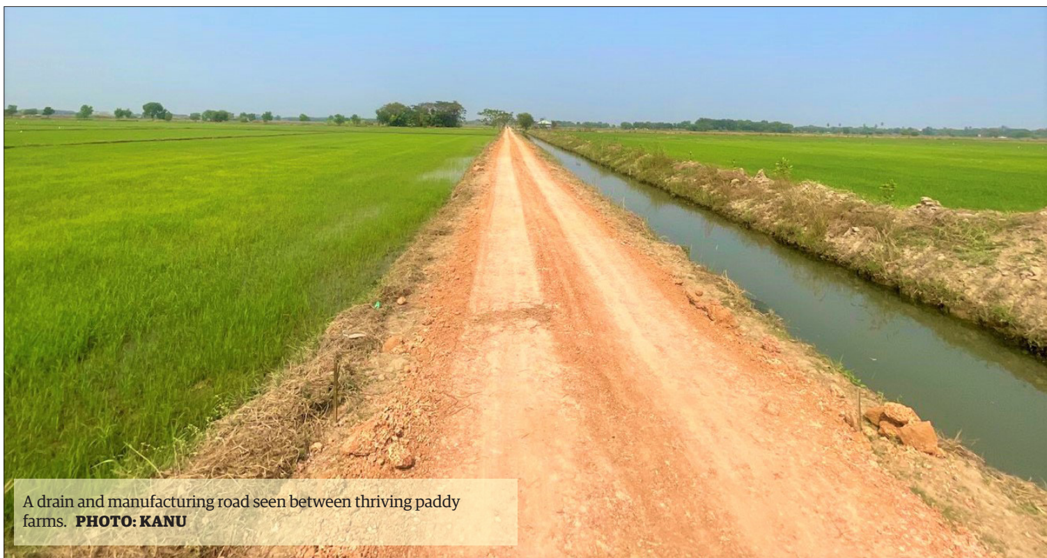
A drain and manufacturing road seen between thriving paddy farms.

YANGON Region Irrigation and Water Utilization Management Department is working on water supply and flood protection, as well as preventing saltwater entering low-lying fields.