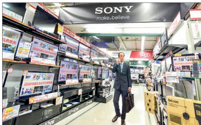
Sluggish growth in exports of electrical equipment and automobiles is cited as a factor contributing to Japan's largest ever trade deficit in 2022.

According to the Finance Ministry's trade data, exports of electronic equipment in the six months through December totaled 9.23 trillion yen, up 13.9 per cent from the first six months, while imports rose 17.2 per cent to 9.31 trillion yen. —Kyodo