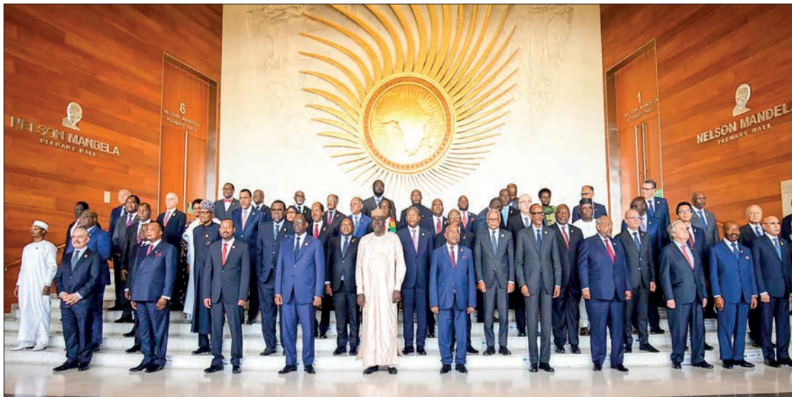
Most of the sessions were to be held behind closed doors, with more than 30 presidents and prime ministers in attendance.

ISRAEL accused arch-foe Iran of orchestrating the ejection of one of its senior diplomats from the African Union summit on Saturday, with the help of Algeria and South Africa.