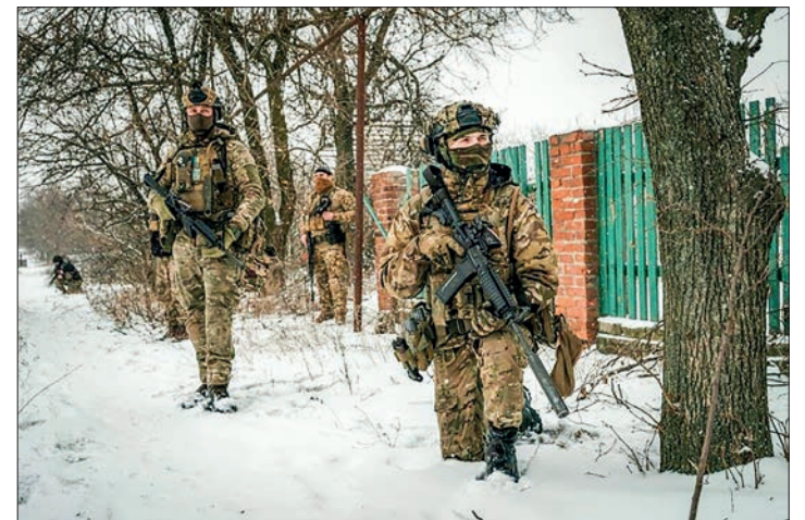
Soldiers from the 'Witcher' unit of the Ukrainian army on the front line in eastern Ukraine. PHOTO: AFP

"If you ask me, for our unit the situation hasn't changed," he said before heading out into a blizzard, hoping to take advantage of the cover of grey skies and snow drifts to scout out positions. —AFP