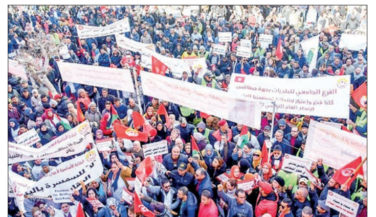
Thousands of demonstrators in Tunisia's second city Sfax listen to a speech by European Trade Union Confederation chief Esther Lynch, that prompted authorities to order her expulsion.

Earlier in the day, Lynch had given a speech to thousands of people at a demonstration organised by the UGTT in Tunisia's second city Sfax, one of several protests around the country over the faltering economy and the arrest of a top trade union official. Speaking through an interpreter, Lynch said she had come to deliver a message of "solidarity from 45 million workers around Europe". —AFP