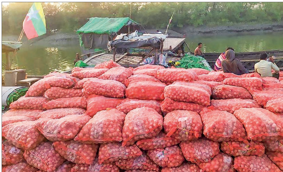
Bags of onions are stockpiled at the jetty before sending them to the market.

AN onion trader said that 100,000 tonnes of Myanmar onions will be shipped in the 2023-2024 financial year according to the Myanmar Trade Promotion Organization of Ministry of Commerce.