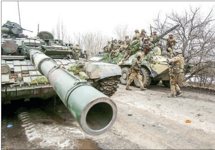
Ukrainian servicemen get ready to repel an attack in Ukraine's Lugansk region on 24 February 2022.

THE foreign ministers of the Group of Seven industrialized nations on Saturday reaffirmed their commitment to support Ukraine in its fight against