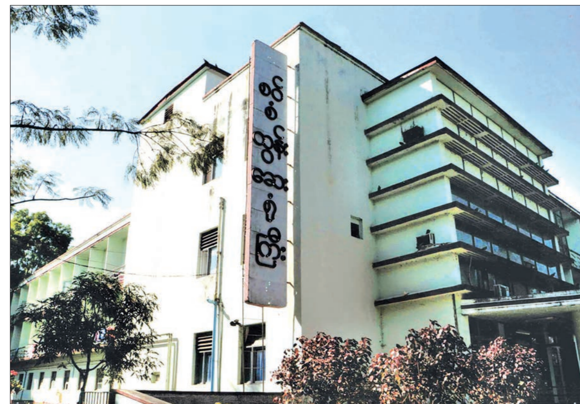
In January 1957, the Soviet Union and Myanmar signed an agreement to construct a technological institute, Inya Lake hotel and Sao San Tun Hospital in Taunggyi.