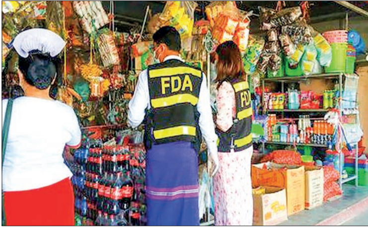
Officials of FDA inspect foodstuffs at the shop whether it sells suitable foods and snack.

THE Department of Food and Drug Administration under the Ministry of Health announced a list of 37 varieties of food that should not be consumed by the public on 18 February.