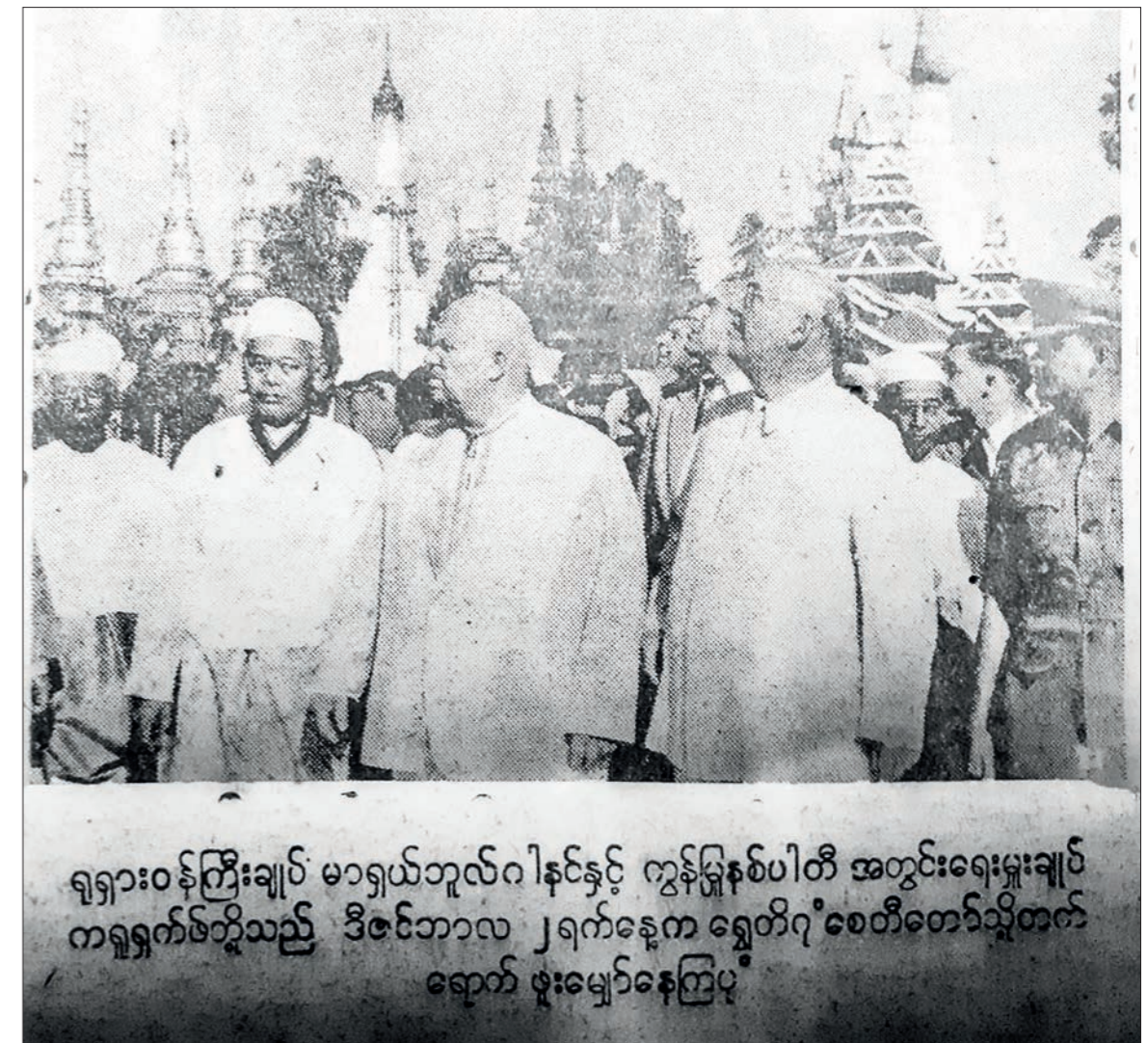
Soviet Prime Minister Communist Party First Secretary Khrushchev visited Myanmar on 1-7 December, 1955.

The trips made by Soviet and Myanmar leaders in 1955, the ties between the two countries became closer. In 1964, an agreement on airline cooperation was made. Moreover, the Russian artistes went to Myanmar to ex-