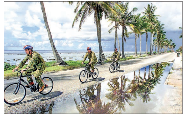
The Pacific island nation of Nauru wants to award a contract for undersea mining.

But conservation groups say the ISA has two glaringly contradictory missions: protecting the sea floors under the high seas while organizing the activities of industries eager to mine untapped resources on the ocean floor: —AFP