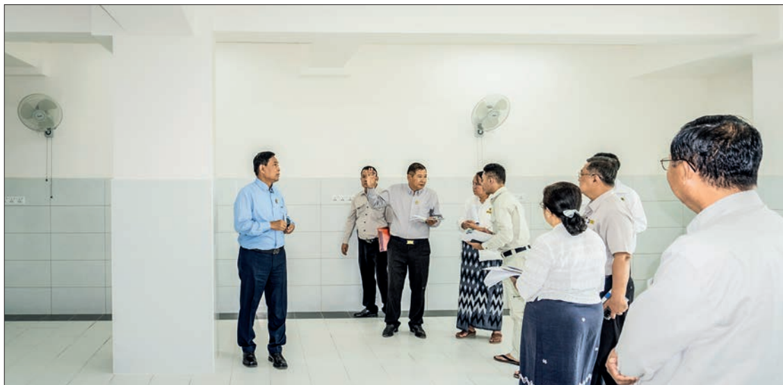
Union Construction Minister U Myo Thant inspects progress of 7-storey building at Yangon General Hospital on 18 February.

UNION Minister for Construction U Myo Thant visited the construction site of the Yangon General Hospital's 7-storey building in Latha Township, Yangon Re-