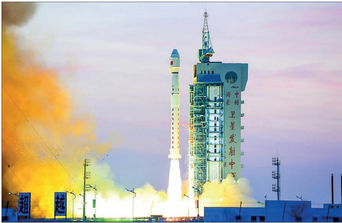
Using synthetic aperture radar (SAR) images provided by China's L-SAR 01, researchers accurately portrayed the extent of the damage caused by the earthquakes and provided important data support for post-earthquake rescue efforts in Türkiye. A Long March-4C rocket carrying L-SAR 01A satellite blasts off from the Jiuquan Satellite Launch Center in northwest China, 26 January 2022.