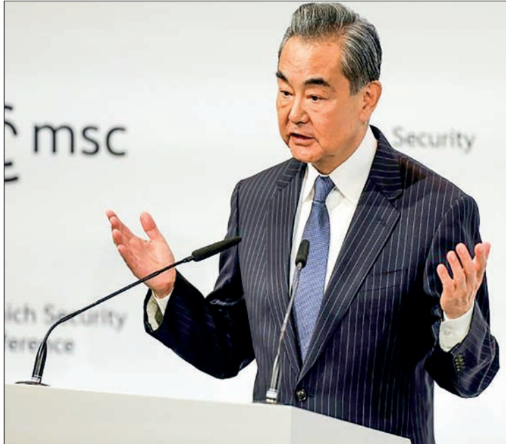
Wang Yi accused the United States of trying to "smear" China.

Wang, also a member of the Political Bureau of the CPC Central Committee, urged the US side to change course, acknowledge and repair the damage that its excessive use of force caused to China-US relations. —Xinhua