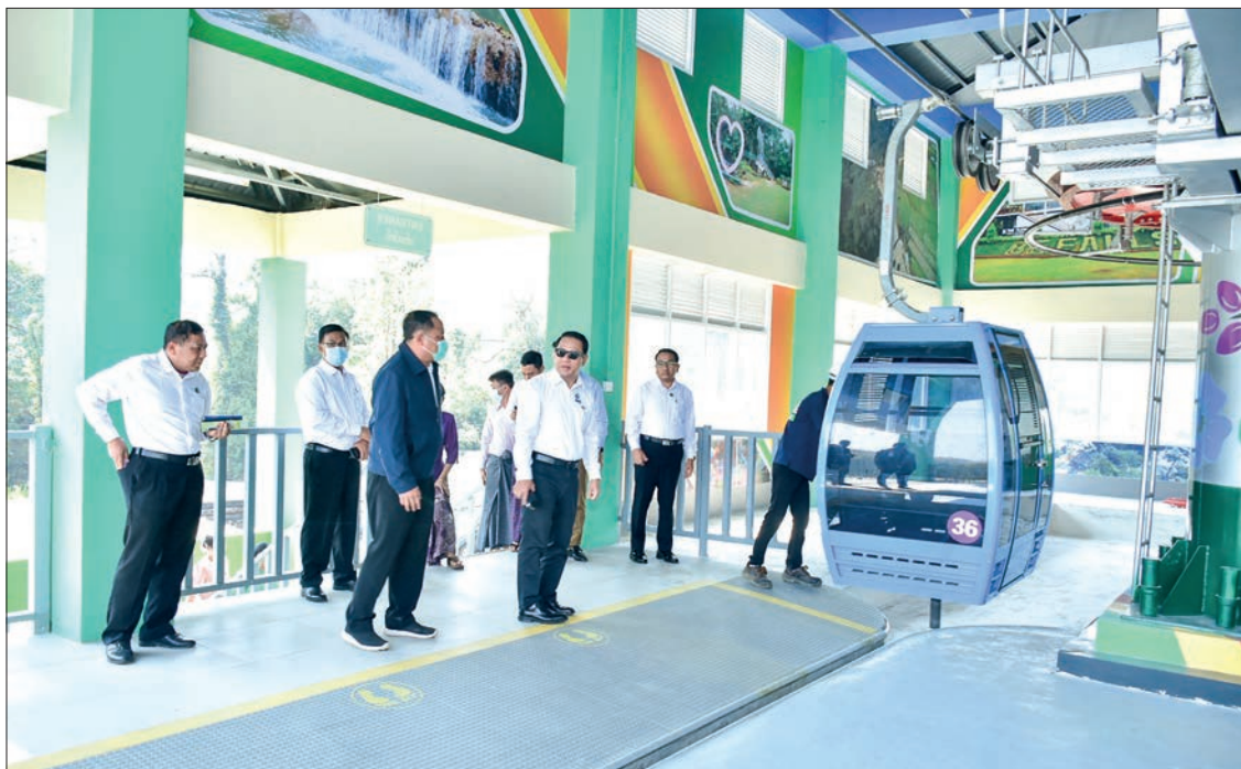
Union Minister for Information U Maung Maung Ohn views running of sky cable cars at Pwekawk Waterfalls (BE falls) in PyinOoLwin Township on 19 February.

UNION Minister for Information U Maung Maung Ohn viewed round manufacturing and sales of Smart brand shirts at the garment factory (PyinOoLwin) of Myanmar Economic Holdings Ltd yesterday afternoon.