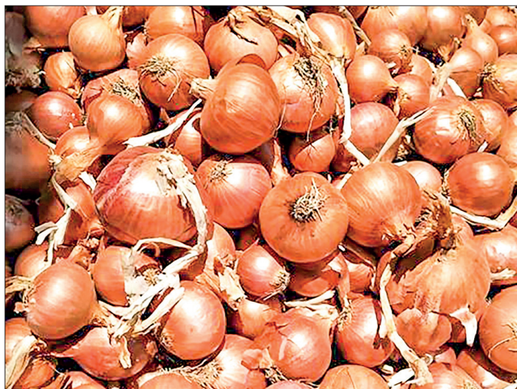
Onions in various sizes displayed at the domestic market for local consumption.

A total of 30,000 tonnes of onions will be shipped in the first quarter of 2023-2024 FY, 15,000 tonnes in the second