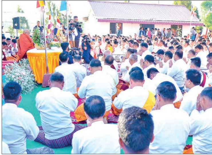
Congregation takes Five Precepts from Sitagu Sayadaw at umbrella-hoisting ceremony of Sitagu Sanchi Stupa in PyinOoLwin Township on 19 February.

After hoisting the umbrella, the pennant-shaped vane and the diamond orb atop the stupa, they performed rituals of golden and silver showers to mark the successful completion of the ceremony. The SAC member, the Union Minister and the Chief Minister planted three Bo