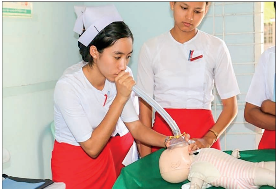
Trainees from the nursing-midwifery diploma course seen in practical works last year.

APPLICATIONS for the nursing-midwifery diploma course must be submitted by 8 March according to the Department of Human Resources for Health, Ministry of Health.