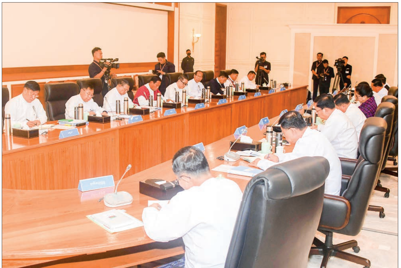
State Administration Council Chairman Prime Minister Senior General Min Aung Hlaing addresses the SAC meeting 2/2023 in Nay Pyi Taw on 23 February 2023.

THE State Administration Council held its meeting 2/2023 in the meeting hall of the office of the State Administration Council Chairman in Nay Pyi Taw yesterday afternoon, and State Administration Council Chairman Prime Minister Senior General Min Aung Hlaing delivered a speech. Present at the meeting were: SAC Vice-Chair Deputy Prime Minister Vice-Senior