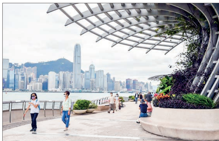
Hong Kong's leaders are keen to resuscitate the city's fortunes after posting recessions three of the past four years. People visit the Avenue of Stars by the Victoria Harbor in Hong Kong, south China, 18 May 2022. PHOTO: LO PING FAI / XINHUA

Other measures include salary tax breaks, welfare allowances and a "Happy Hong Kong" campaign aimed at making the city more enjoyable with food fairs.—AFP