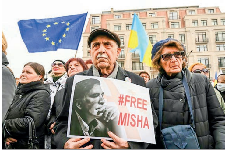
Saakashvili supporters rallied in his support earlier this week outside the prime minister's chancellery in Tbilisi.

Once a jovial, larger-than-life personality, Saakashvili has become a shadow of his former self, his lawyers and doctors say. He has lost nearly 50 kilogrammes