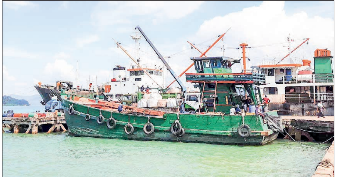
A vessel is pictured loading goods at Kawthoung port.

FROM 1 to 21 February, trade volume between Myanmar and Thailand at the Kawthoung border registered US$13.688 million, according to statistics of the Ministry of Commerce.