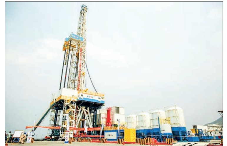
Drilling at the Kingfisher oilfields in Uganda was launched in late January.

"This construction approval marks another step forward to EACOP as it allows commencement of the main construction activities in Tanzania, upon completion of the ongoing land ac-