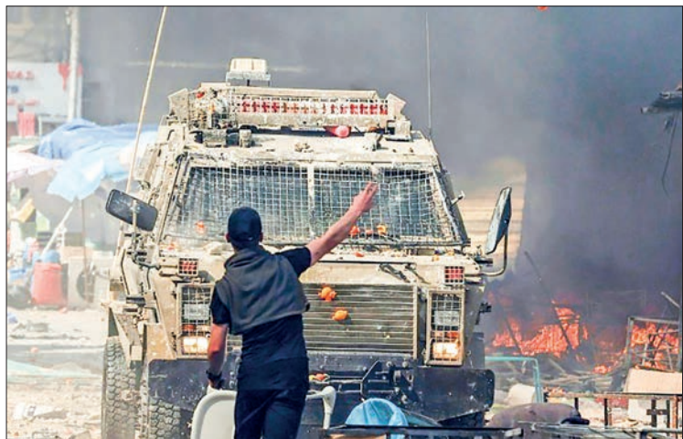
A Palestinian faces an Israeli military vehicle during a raid on the occupied West Bank city of Nablus.

The Israeli military said one of the wanted suspects who had fled the building was "neutralized", along with two others who had opened fire at the property.— AFP