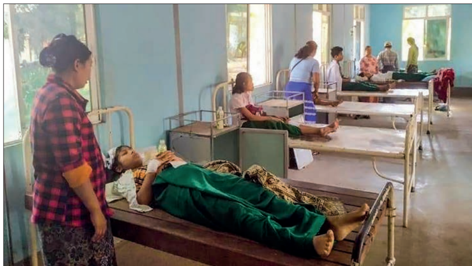
Children injured in the remote-mine attack of so-called PDF terrorists.

That was undeniably an atrocious act of terrorism deliberately targeting the students since that was the remote-mine attack on a school bus running on its route at a routine time in school days. Everyone is overcome with grief seeing the photos of the casualties of innocent students in white-and-green-coloured school uniforms. Every father and mother, in the shoes of the victims' families, is totally disgusted at the way the terrorists behaved towards the innocent children.