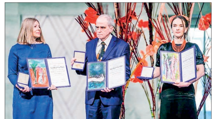
In 2022, the Nobel Peace Prize was shared by people and organizations representing the three nations at the centre of the war in Ukraine.

Also believed to be on the list this year are climate activists Greta Thunberg of Sweden and Vanessa Nakate of Uganda, Iranian women's activist Masih Alinejad and her anti-hijab movement My Stealthy Freedom, as well as the Salvation Army.—AFP