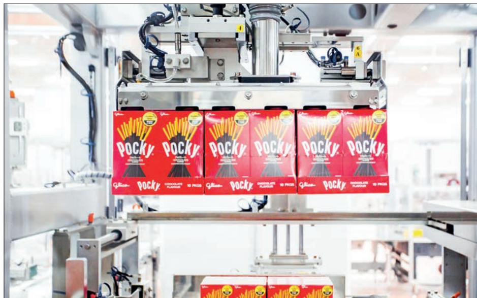
Undated photo shows products being packed in boxes at Ezaki Glico Co's new factory for its “Pocky” chocolate snack in Indonesia’s West Java Province

JAPANESE confectioner Ezaki Glico Co has opened in Indonesia what it calls its largest-ever factory for its mainstay “Pocky” chocolate snack, aiming to supply the growing Southeast Asian market as well as North America.