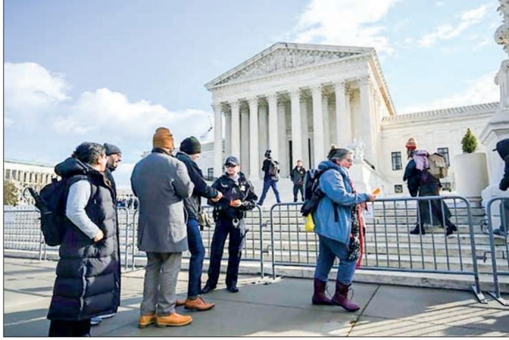
People line up outside the US Supreme Court in hopes of getting a seat in the public gallery for the Big Tech - Section 230 case.

THE US Supreme Court on Tuesday heard arguments in a landmark case that could transform the internet by scrapping decades-old legal protections for tech companies, but gave no indication that a clear majority would opt to rework the law.