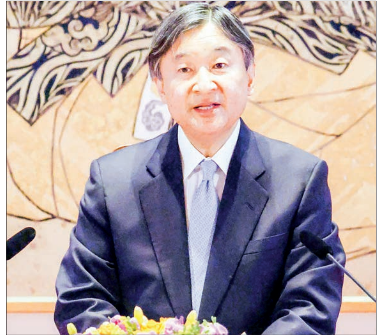
Emperor Naruhito speaks at a press conference at the Imperial Palace in Tokyo on 21 February 2023, ahead of his 63rd birthday on 23 February.

The empress "is an important presence who supports me in daily life and someone with whom I can talk regarding both public and private matters," he said. On ways to improve information dissemination by the Imperial Household Agency, the emperor said, "It is also important to communicate information about the imperial family at the right time and in a manner that is easy to understand in order to build relationships of trust with the public through repeated exchanges."—Kyodo