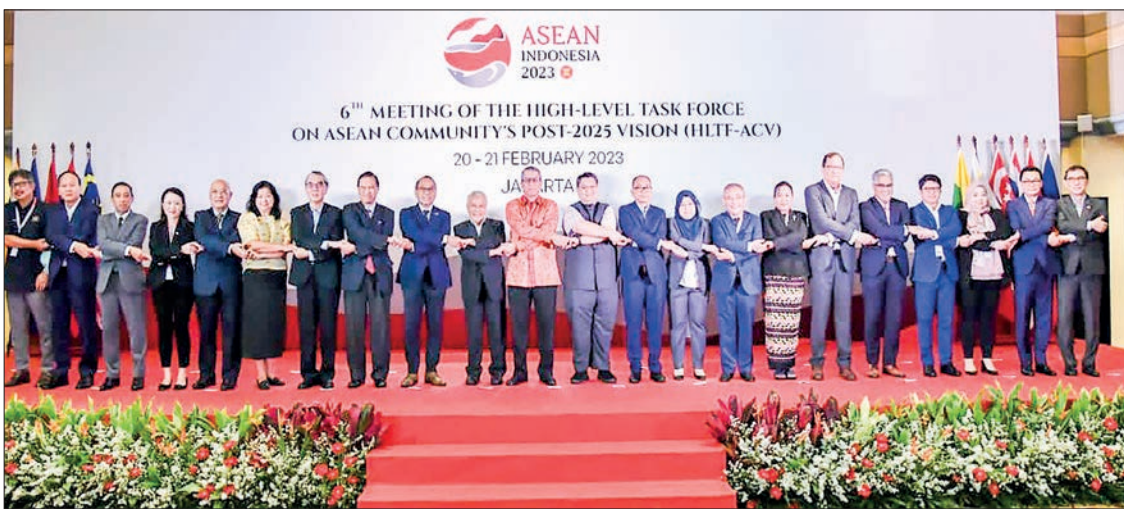
The documentary group photo of the meeting held from 20 to 21 February 2023 in Indonesia.

THE 6 th meeting of the High-Level Task Force on ASEAN Community's Post-2025 Vision (6 th HLTF-ACV) was held in Grand Hyatt Hotel, Jakarta, Indonesia from 20 to 21 February 2023.