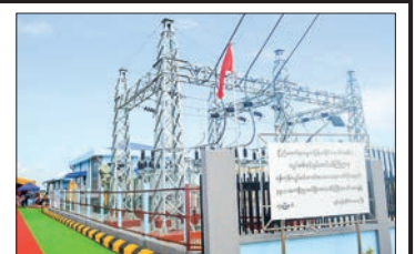
The 33/11 KV (5) MBA Dauntgyi Substation in Thongwa Township, Yangon Region.

YESC has announced that if it is found that businesses and industries operate by using electricity during the stipulated time, action will be taken against them according to the administrative rules and regulations. — TWA/CT