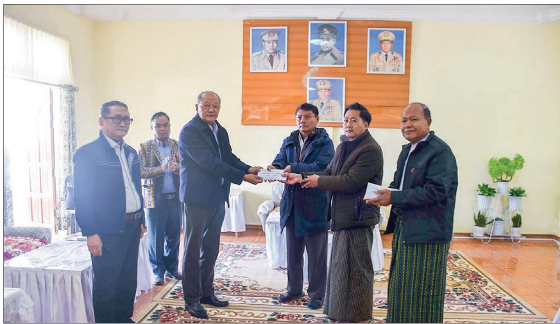
SAC Member Dr Hmu Htan and Union Minister Jeng Phang Naw Taung present cash assistance for the ethnic literature and cultural groups in Chin State.

Then, Union Minister Jeng Phang Naw Taung called on the participants to support in promoting the ethnic language, literature, arts, cultural heritage, tradition and culture and national characteristics and socioeconomic of ethnic people, to