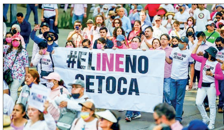
Demonstrators in Mexico City protest against the Mexican president's proposed electoral reform on 13 November 2022.

The bill is a watered-down version of more radical reforms originally sought by Lopez Obrador that sparked mass street protests against a perceived at-