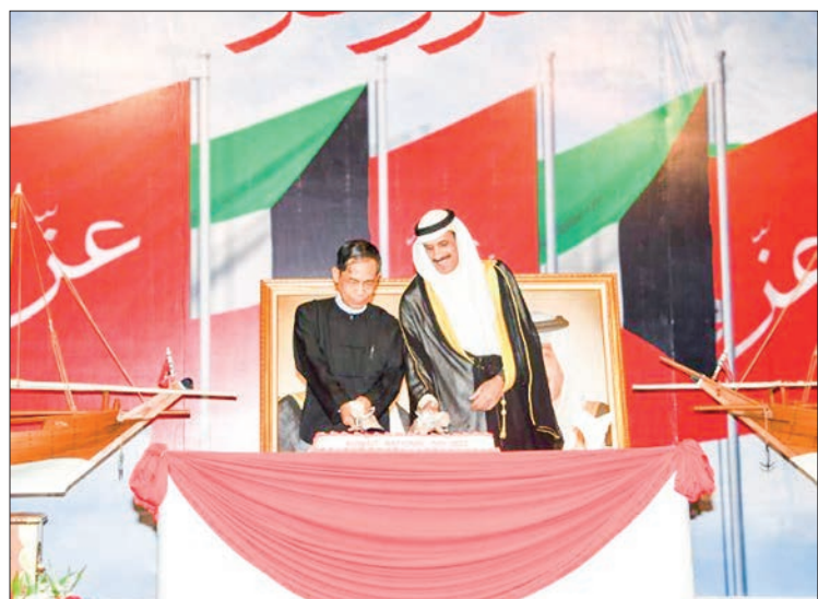
Union Minister U Ko Ko Hlaing and the Kuwaiti ambassador cut the ceremonial cake at the event yesterday.

Htan and the Union minister presented cash assistance for the ethnic literature and cultural groups in Chin State to promote literature and cultural affairs. —MNA/KTZH