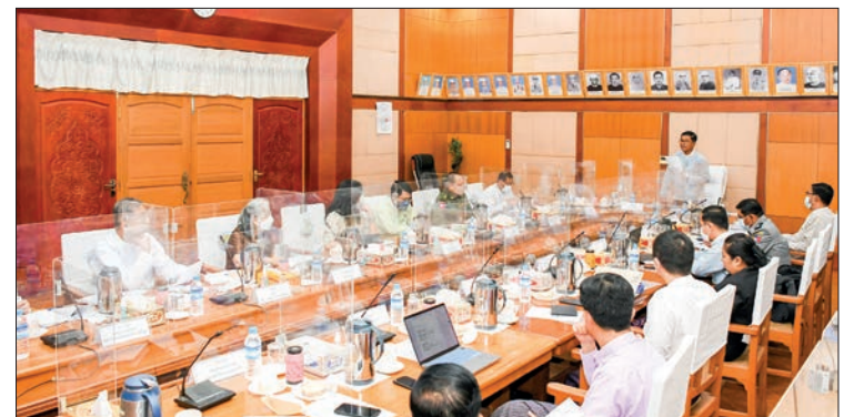
The coordination meeting of the Association of Anti-Illegal Plagiarism of Artworks is in progress in Nay Pyi Taw yesterday.

Then, a member presented about the illegal distribution of artworks through online platforms. Afterwards, attendees