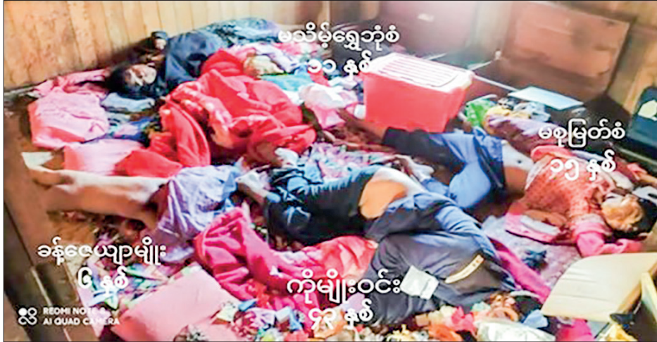
Mass killing of a whole family including children in Nga Myaung village.