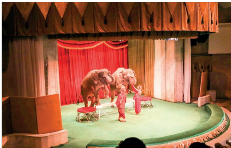
Attendees and guests watch the performance of Myanmar's elephants.