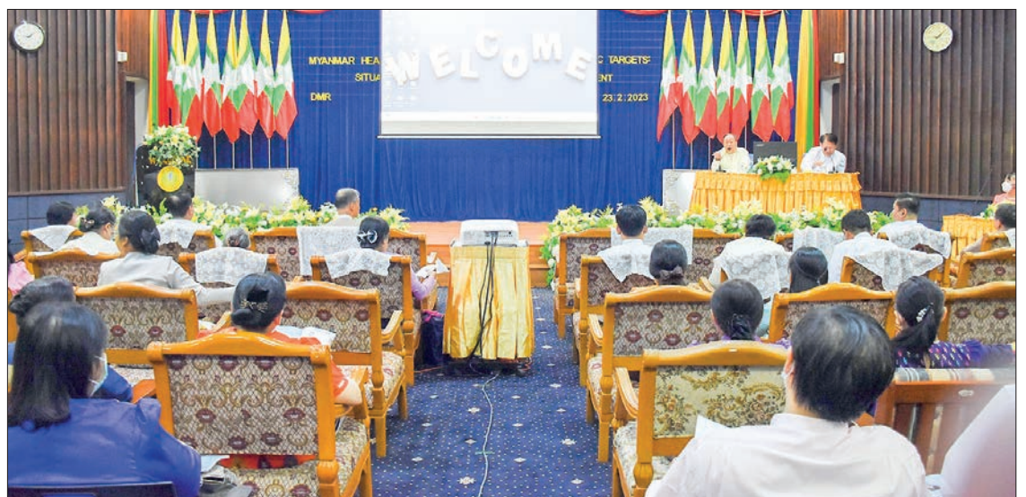
The fourth-day session of the 51 st Myanmar Health Research Congress is in progress yesterday.

The director-general of the Department of Human Resources for Health discussed the leading role of the department in the development of human resources