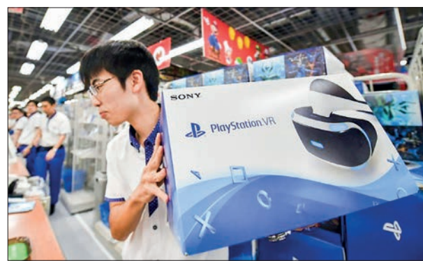
Sony’s first virtual reality headset remained a niche product for the brand.