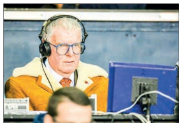
Football commentator John Motson has died at the age of 77.

FAMED British football commentator John Motson, who had a distinguished 50-year career with the BBC, has died at the age of 77, his family announced on Thursday.