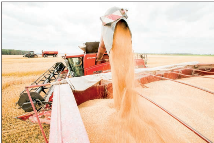
July 2019, Krasne, Ukraine: Combine reloads wheat into the bunker for further transportation during the harvest.

UKRAINE'S agricultural production will drop this year due to contamination of the farmland with landmines, the gov-