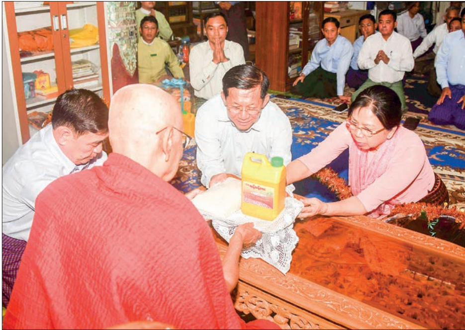
The Senior General and his wife offer donations to the Nanda Yama Sayadaw.