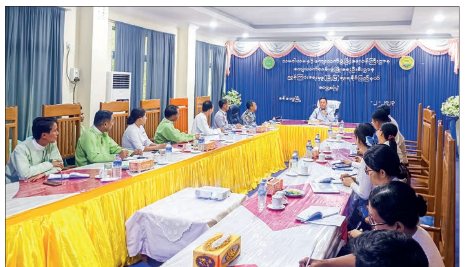
Union Minister U Hla Moe meets departmental personnel from the Rural Road Development Department in Sittway yesterday.

Afterwards, the state departmental heads explained the status of implementations in Rakhine State according to the financial year, and the Union minister coordinated the necessary things and fulfilled the needs. — MNA/KZL