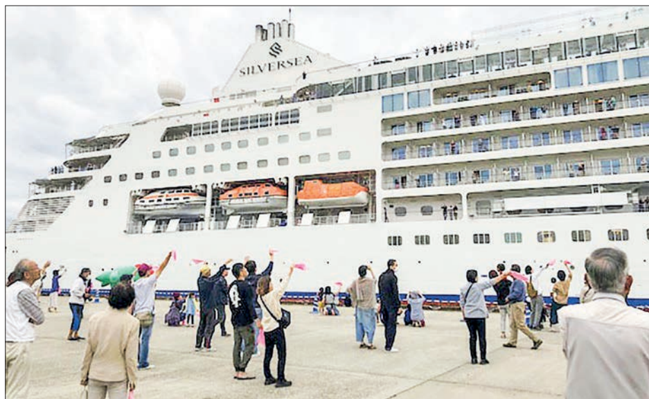
Photo shows an international cruise ship docked at the Port of Niigata in October 2019.

ARRIVALS of foreign-operated cruise ships to Japan are set to near the level seen before the coronavirus pandemic when their dockings to the country resume in March after a three-year hiatus, a Kyodo