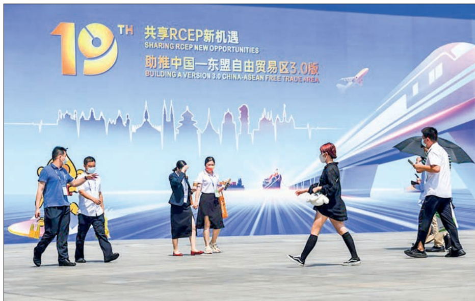
Visitors are seen at the 19th China-ASEAN Expo in Nanning, south China's Guangxi Zhuang Autonomous Region, 19 September 2022.

A company in Viet Nam, which is mainly engaged in planting and processing durian and other