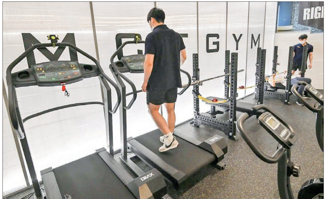
A new study suggests that physical activity is 1.5 times more effective than psychotherapy or the leading drugs in treating depression, according to experts at the University of South Australia.