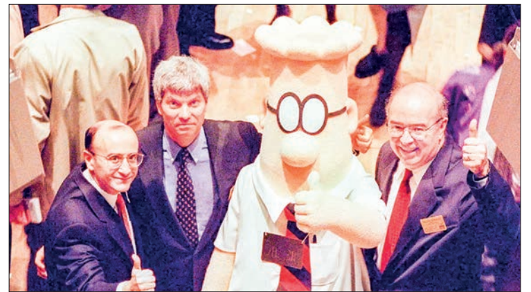
Dilbert is a fictional character and the main character and protagonist of the comic strip of the same name, created by Scott Adams.

"That's a hate group and I don't want anything to do with