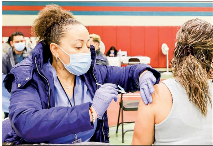
A health worker administers a COVID-19 vaccine shot to a local in Los Angeles, the United States, on 17 December 2022.

NEW research suggests that vaccination against COVID-19 is associated with fewer heart