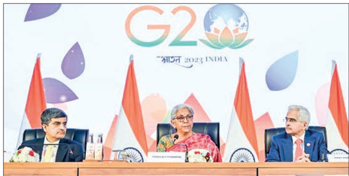
India's Finance Minister Nirmala Sitharaman (C) addresses a press conference in Bengaluru.

Besides, they recognized the urgency to address debt vulnerabilities in low and middle-income countries, and declared that strengthening multilateral coordination by official bilateral and private creditors was needed. —Xinhua