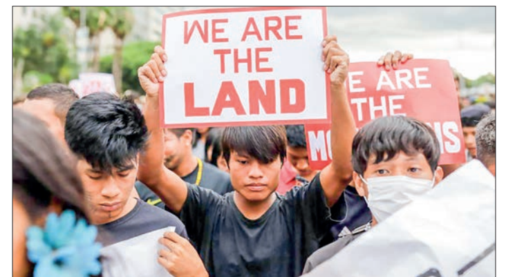
Indigenous people from various tribes taking part in the Terra Livre Indigenous Camp protest against Brazilian President Jair Bolsonaro in front of the National Congress in Brasilia, on 13 April 2022.

“A deal with countries of the Latin American continent is not possible if they don’t respect the Paris (climate) accords as we do, and if they don’t respect the same environmental and sanitary obligations that we impose on our producers,” said Macron. —AFP