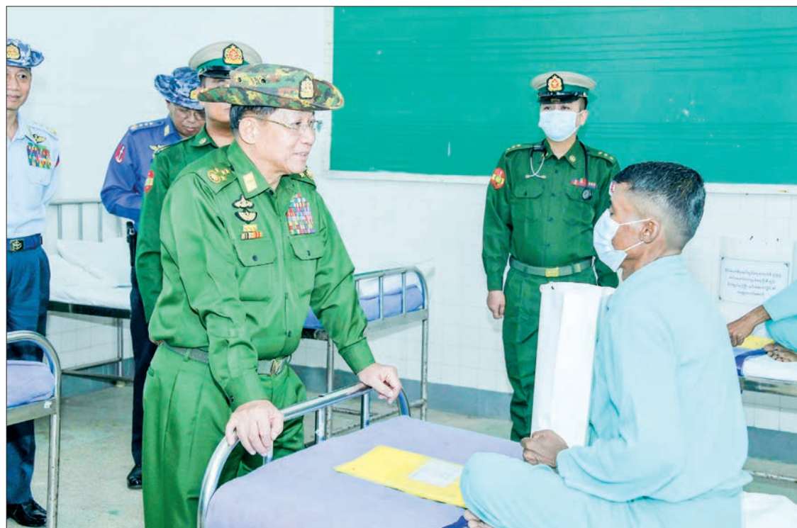
The Senior General comforts patients at the station hospital in Sittway yesterday.

On the part of the leaders, they must be fair and square in their treatment of their subordinates, free from favouritism. For the soldiers to win the battles, they must be strong enough. In this regard, the soldiers are needed to keep themselves fit, do physical exercises, eat healthy food, behaving properly. A sound mind in the sound body, it is said. For you to develop your