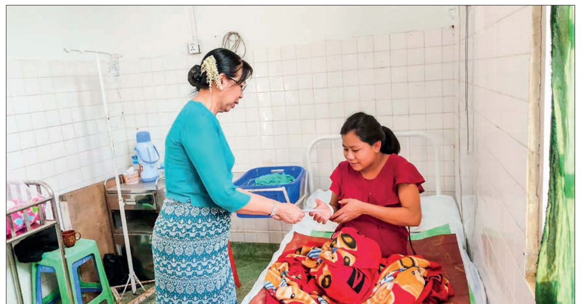
The wife of the Senior General provides foodstuffs to the patient at the station hospital yesterday.

Additionally, Tatmadaw members are needed to be engaged in agriculture and livestock breeding activities on a manageable scale as the country is being faced with the price hike. As Myanmar abounds in natural resources, land and water resources, agriculture and livestock breeding businesses are the best way out. Although we have a big size of labour force, our people are not very hard working, resulting in our country lagging in development. That's why we are making efforts to boost production in this sector for national economic development. And this is the reason why Tatmadaw has