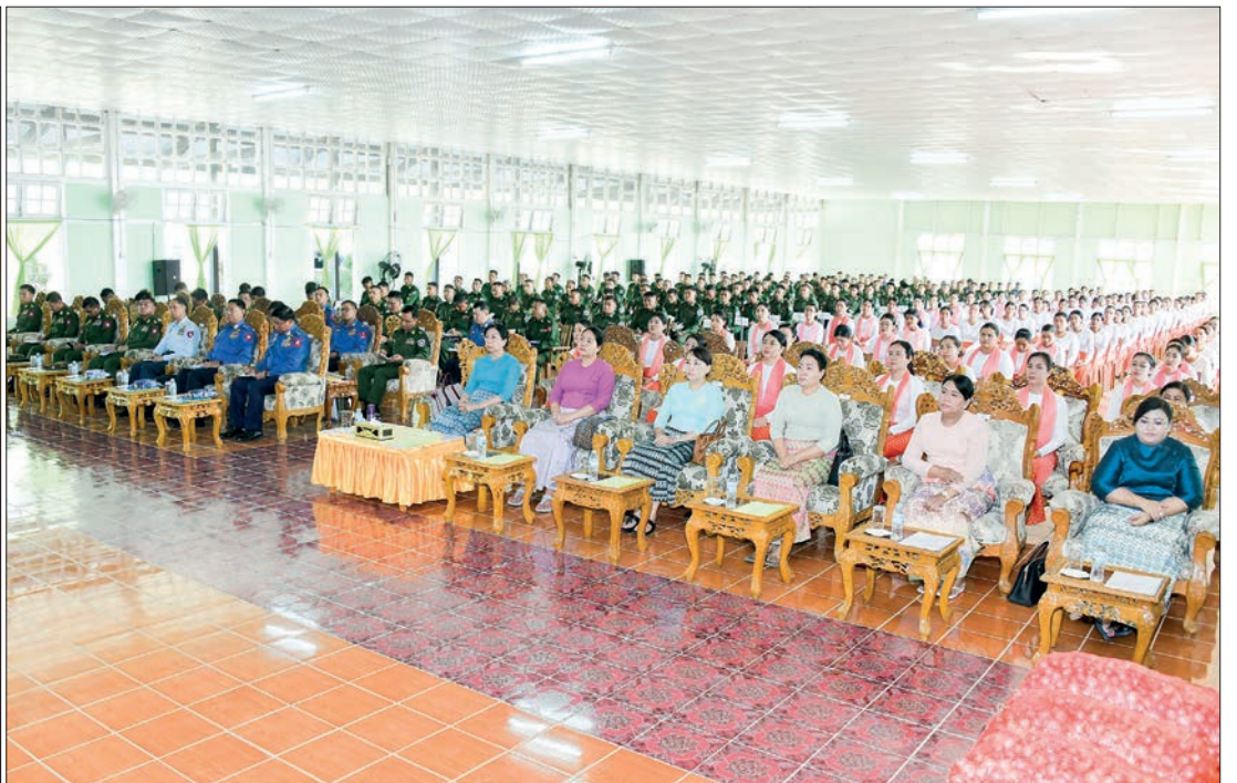
State Administration Council Chairman Commander-in-Chief of Defence Services Senior General Min Aung Hlaing addresses the meeting with Tatmadaw members and families from Sittway Station under the Western Command on 26 February 2023.

STATE Administration Council Chairman Commander-in-Chief of Defence Services Senior General Min Aung Hlaing met Tatmadaw members and families from Sittway Station under the Western Command yesterday afternoon.