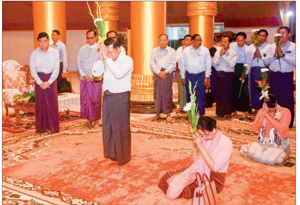
The Senior General pays homage to Lawkananda Pagoda in Sittway yesterday.