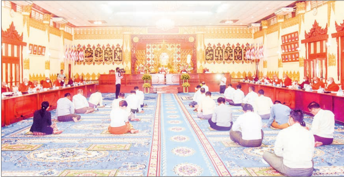
The second day of the eighth 47-member State Sangha Maha Nayaka Committee's 13 th plenary meeting is in progress yesterday.

THE second-day session of the thirteenth plenary meeting of the 8 th 47-member State Sangha Maha Nayaka Committee was administrated at the Vijaya Mangala Dhamma Thabin of Thiri Mingala Kaba Aye Hill in Yangon yesterday morning.