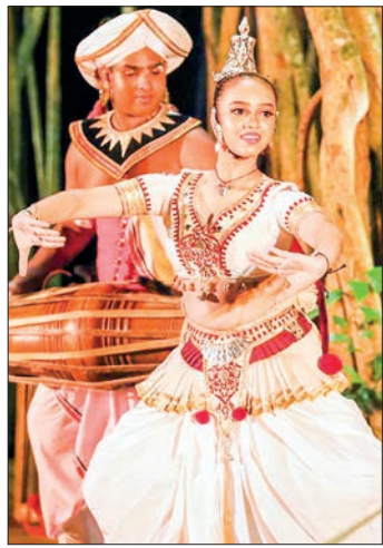
Dancers perform during a cultural dance show to promote tourism in Colombo, Sri Lanka, on 17 January 2023.

SRI Lanka is to launch a mobile app from 1 March to protect tourists, Tourism Minister Harin Fernando said on Saturday.