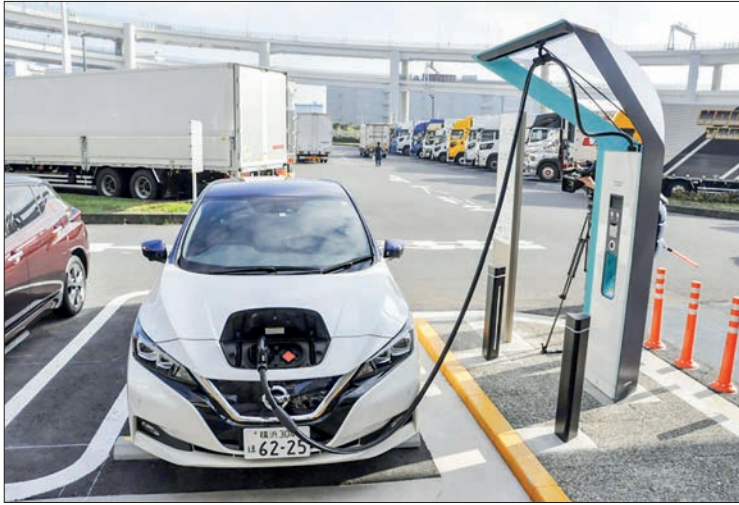
Japan could also play a leading role in the international community by advocating and investing in decarbonization technology, analysts said.

AFTER hosting a Group of Seven online summit on the first anniversary of the Ukraine crisis, Japan, the G-7 chair in 2023, faces growing expectations from other members and international organizations to increase focus on other global issues by leveraging its strengths in non-military areas.