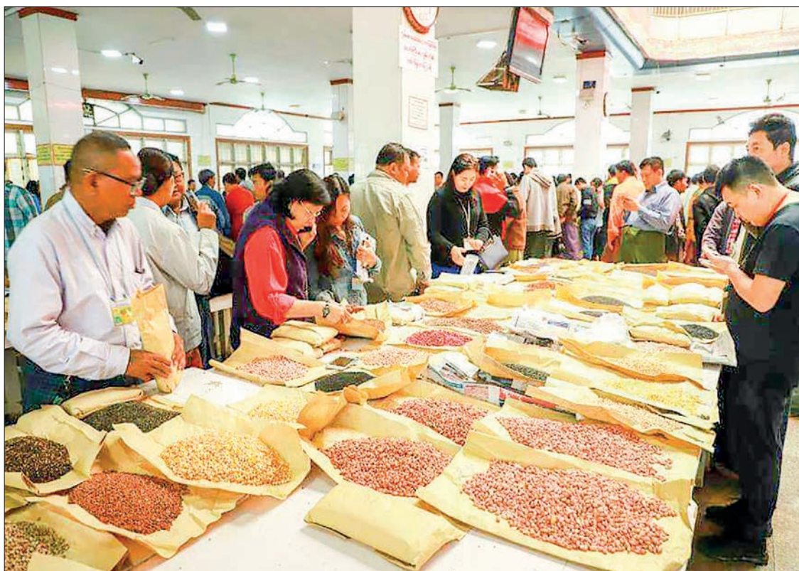
Merchants are seen evaluating beans and pulses in the Mandalay market.

ACCORDING to traders in Mandalay, the market has been flooded with a new harvest of pigeon peas from various regions and states during this year's bean season. These peas have received a good price due to their high quality and yield, which can be attributed to favourable weather conditions.