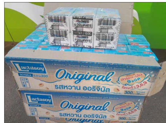
Confiscated illegal items.

On 25 February, a joint team carried out inspections at the Kawkareik (Tadakyoe) joint inspection checkpoint under the management of the Karen State Anti-Illegal Trade Special Task Force. A total of 25 Karat toilet commodes (estimated value K2.5 million) which were not declared in the import declaration (ID) were seized from a vehicle head-