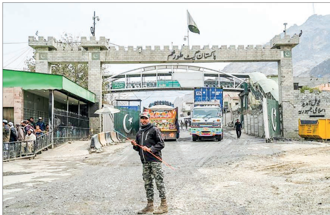
In this photo taken on 2 February 2023, a Pakistan border policeman is pictured from the zero point Torkham border crossing between Afghanistan and Pakistan, in Nangarhar province, Afghanistan.

VITAL trade resumed at a key border crossing between Afghanistan and Pakistan on Saturday as their busiest trading waypoint reopened almost a week after being shut by Taliban authorities.