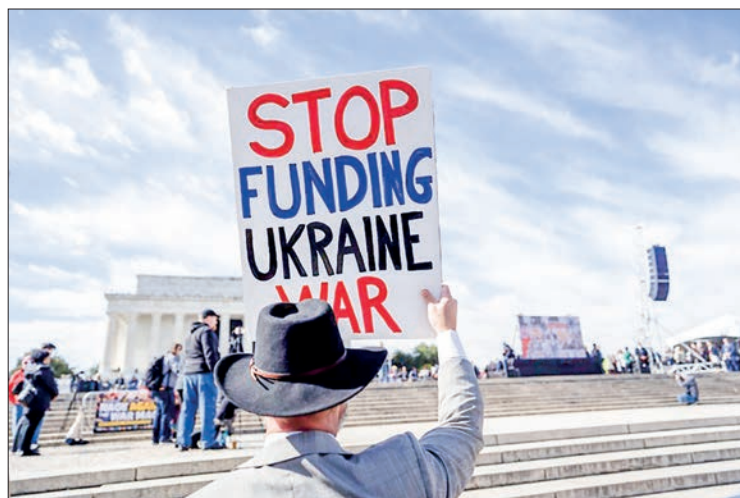
A demonstrator holds a slogan during the anti-war rally in Washington, DC, the United States, 19 February 2023.

Russia, Ukraine and European countries are neighbours that cannot be physically moved away. To realize lasting peace