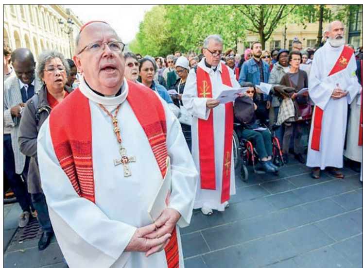
The Vatican announced its own preliminary investigation into Ricard last November.