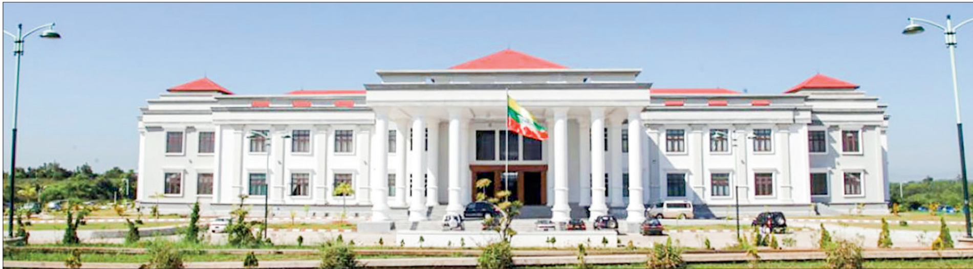
General view of the office building of the Union Supreme Court.

UNION Supreme Court passed judgements on 936 criminal cases and 1,997 civil cases including 153 cases from last year, from 1 January to 31 December 2022, according to Union Chief Justice U Htun Htun Oo.