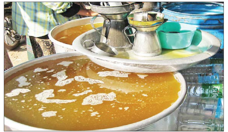
Palm oil in the market.

The wholesale price of the external market has been around one time higher than the