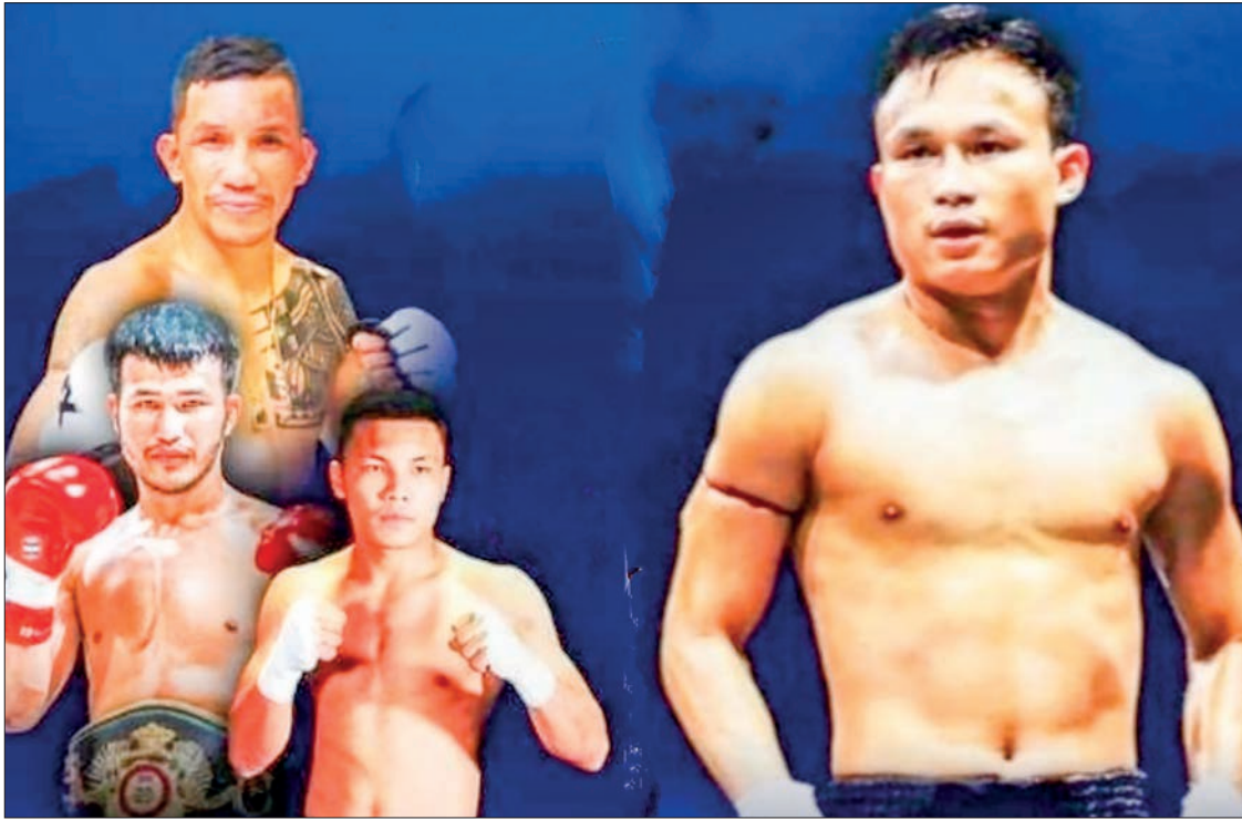
Lethwei star fighters will compete in the Myanmar-Thailand Traditional Lethwei to be held from 1 to 5 March in Kyainn Village, Hlaing Bwe Township, Kayin State.

MYANMAR-THAILAND Traditional Lethwei (Myanma traditional boxing) competition will be held from 1 to 5 March to mark the Pyi Thar Lin Aye pagoda event in Kyar Inn Village, Hlaing-bwe Township, Kayin State.