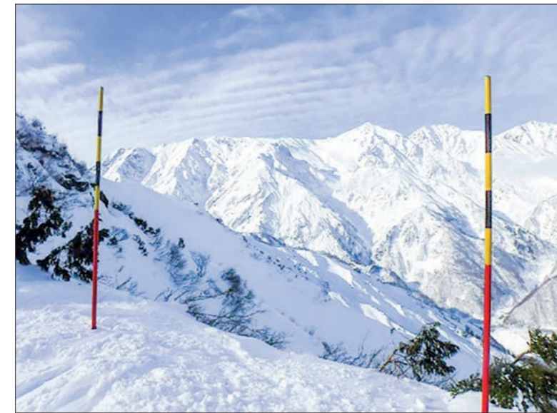
Yellow and black coloured boundary sign poles mark the ski area boundary beyond these markings outside the controlled area. The above photo is taken at Hakuba Happo-One in Nagano prefecture

Japan has some of the best ski resorts in the world. In particular, Hokkaido and Nagano prefectures, where the Olympic Games were held in the past, have many fascinating ski resorts with well-equipped facilities