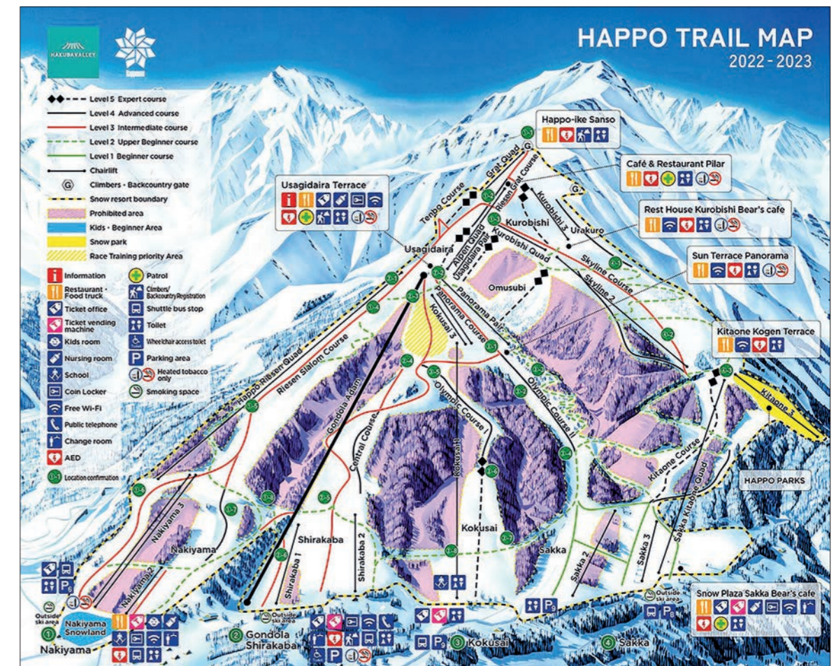
Map of Ski Trail at Hakuba Happo-One in Nagano prefecture where The Olympic Games 1999 was held. Nineteen slopes/courses are included in.

Not many industrialized countries have resort areas. In particular, there are few winter