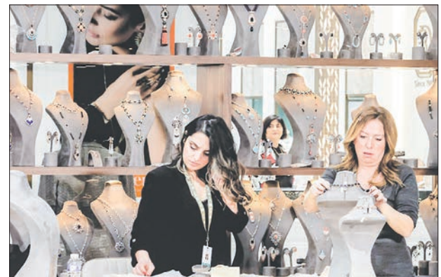
Jewellers arrange their stand at the Doha Jewellery and Watches Exhibition.

“When women saw me standing in Papillon, they were wondering whether I was Qatari or not,” she told AFP, her exhibition stand flanked by household names of the jewellery world.—AFP