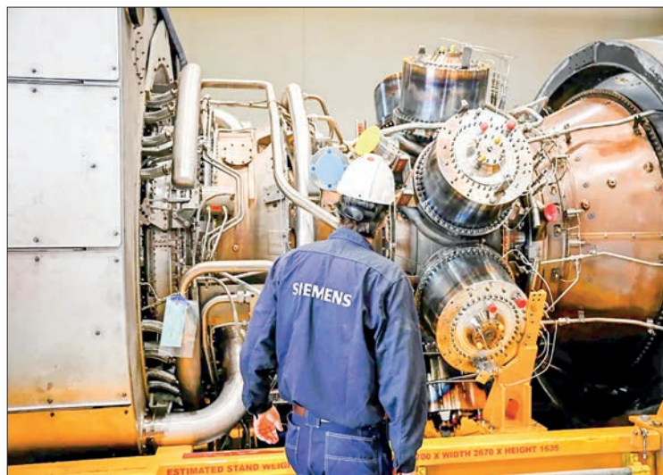
Scholz, accompanied by executives from big German firms like Siemens, met Prime Minister Narendra Modi in New Delhi and was due to head to Bengaluru to visit German software firms including SAP.

Scholz, accompanied by executives from big German firms like Siemens, met Prime