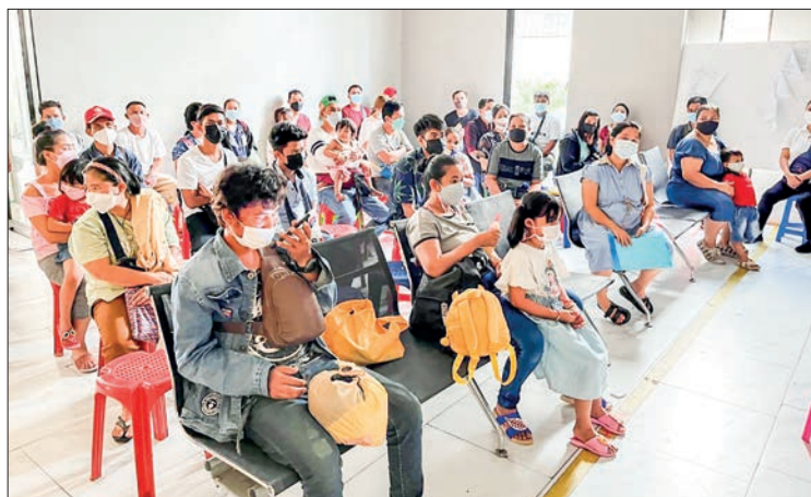
Myanmar nationals are seen queueing to get an appointment for passport renewals at the Myanmar Embassy in Bangkok, Thailand in March 2022.

Almost one-third of the average annual income of Thailand's minimum wage is re-used for expenses of the pink card, CI book, work permit and visa to apply for legal residence and work permit