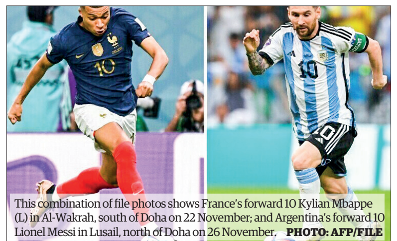
This combination of file photos shows France's forward 10 Kylian Mbappe (L) in Al-Wakrah, south of Doha on 22 November, and Argentina's forward 10 Lionel Messi in Lusail, north of Doha on 26 November.

times and claimed the FIFA award — inaugurated in 2016 following FIFA's split with Ballon d'Or organizers France Football — once in 2019. In the last two years Messi has made the podium as Robert Lewandowski has won the title, but the 35-year-old's career-crowning World Cup triumph was the defining moment of 2022. The winner is decided by a jury comprised of the coach and captain of every men's national team and one journalist from each country, but fans can also vote. — AFP