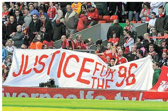
A file picture taken at Anfield stadium on 11 April 2009, shows Liverpool football fans holding a banner during a minute's silence in memory of the victims of the Hillsborough disaster.

Reforms following the report include all police forces in England and Wales signing up to a charter that states they must acknowledge when mistakes have been made and must not seek to defend the indefensible. —AFP