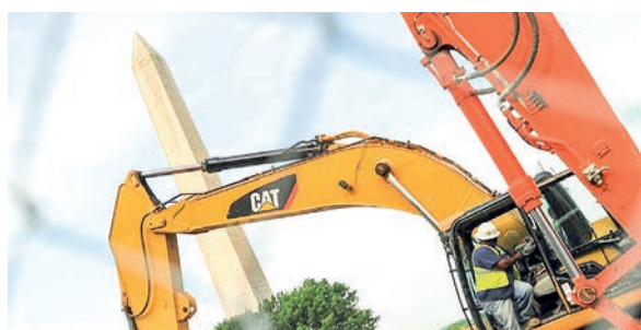
Caterpillar reported strong demand from industrial customers, but earnings fell due to cost pressures.

Net profits for the fourth quarter came in at $1.5 billion, down 31.4 per cent from the year-ago period, while revenues rose 20.3 per cent to $16.6 billion.—AFP