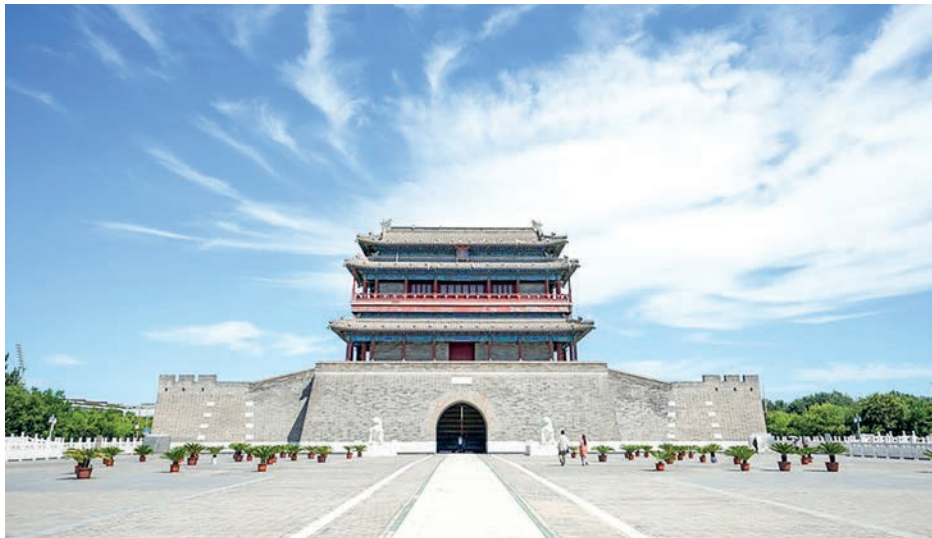
People visit the Yongdingmen Gate in Beijing, capital of China, 16 August 2022.

A local official with the office for cultural heritage application and protection said that the plan is necessary for Beijing's application for its Central Axis to be included in the UNESCO World Heritage Site list. The official also remarked that the plan marks a new step in the conservation work. First created in the Yuan Dynasty (1271-1368), the Beijing Central Axis, or