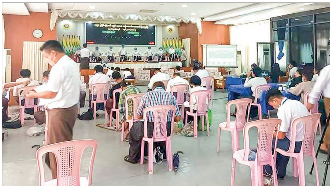
The 43 rd Aung Bar Lay Lottery.