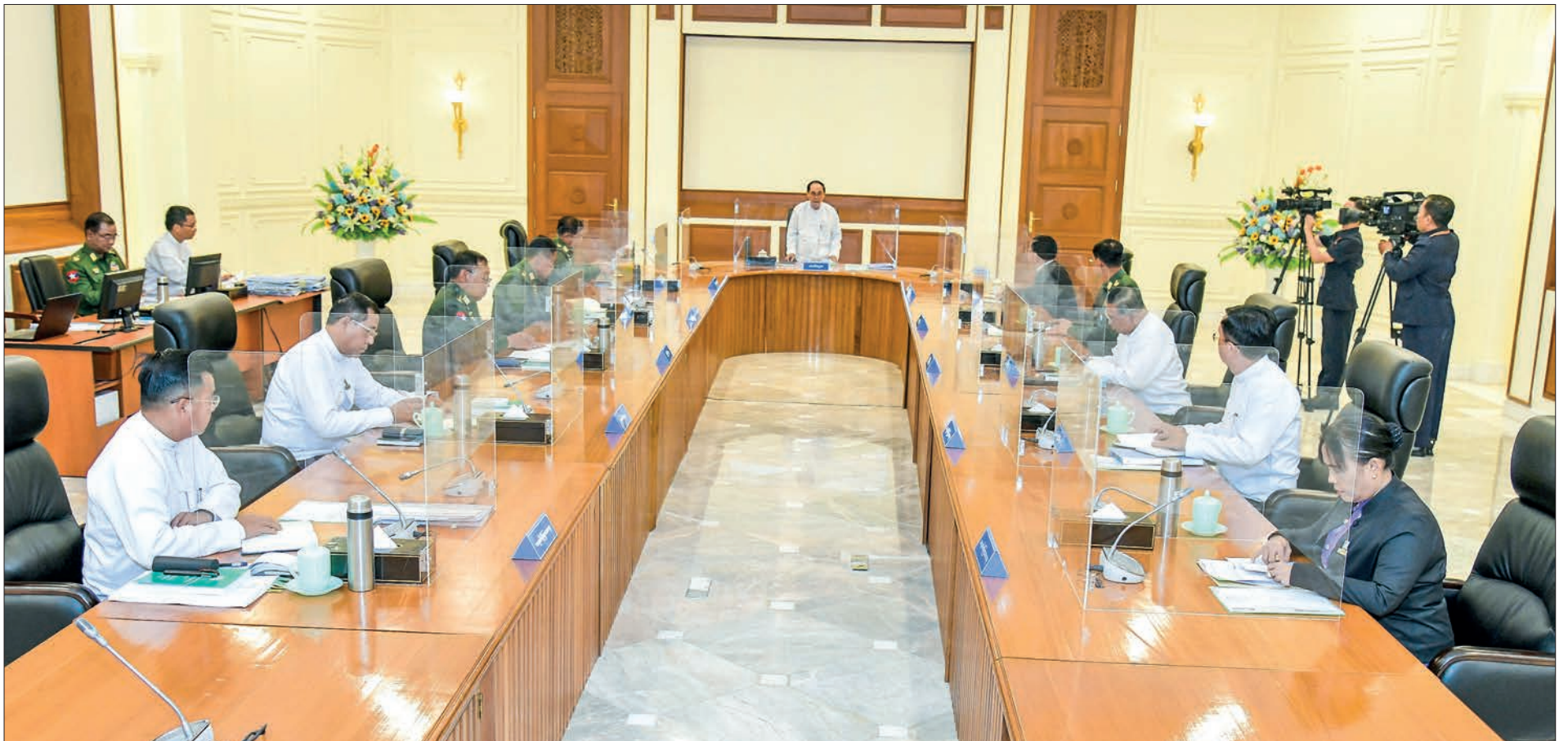
Pro Tem President U Myint Swe presides over the meeting 1/2023 of the National Defence and Security Council of the Republic of the Union of Myanmar in Nay Pyi Taw yesterday.

T HE National Defence and Security Council of the Republic of the Union of Myanmar held its meeting 1/2023 at the meeting hall of the State