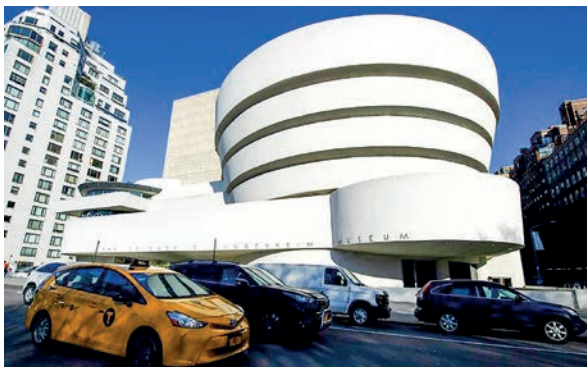
The Guggenheim Museum in New York is fighting a lawsuit that alleges it is not the rightful owner of a valued Picasso.