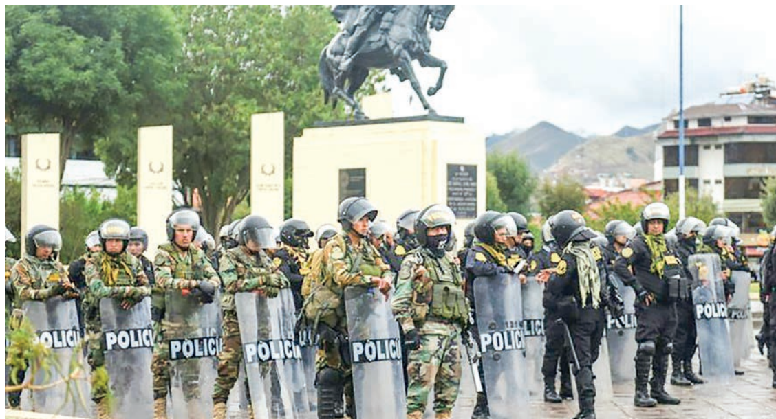
Police strike forces gather at the Tupac Amaru square, where protesters against Peruvian President Dina Boluarte meet to rally in the southeastern city of Cusco, Peru on 31 January 2023.

PERUVIAN lawmakers on Tuesday once again failed to agree on a plan to bring forward elections in a bid to end weeks of deadly protests that have brought parts of the South American country to a standstill.