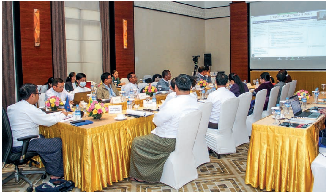
The SOME meeting and the ACE Governing Council meeting are in progress online on 31 January and 1 February.

THE Special ASEAN Senior Officials Meeting on Energy-Special SOME and the ASEAN Centre for Energy-ACE Governing Council Meeting were carried out by Cambodia as an alternate chairman through a video-conferencing system on 31 January and 1 February.