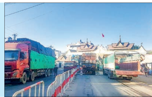
The Mang Wein checkpoint in Muse on the Sino-Myanmar border.

Between April 2022 and half of January 2023, Myanmar's trade through Muse was valued at $1762.051 million. The trade values were registered at $105.735 million on the Lweje border and $215.603 million in Chinshwehaw. The Kampaiti border earned worth $66.416 million and the Kengtung border witnessed trade worth $9.607 million.—TWA/MKKS