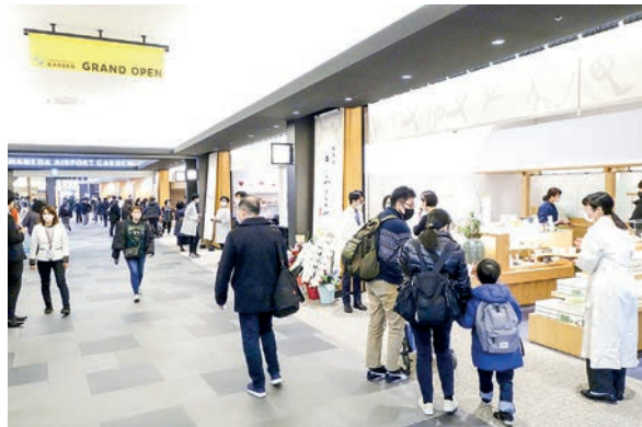
Visitors shop at the Haneda Airport Garden on its opening day in Tokyo on 31 January 2023.

A hospitality complex featuring Japan's largest airport hotel, an open-air bath and a range of shops and restaurants opened next to Tokyo's Haneda airport Tuesday after a nearly three-year delay due to the COVID-19 pandemic. The full opening of Haneda Airport Garden, a 12-story compound connected to the airport's Terminal 3, which primarily serves international flights, comes as Japan aims to welcome back