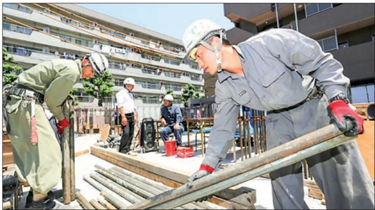
Some Myanmar workers are pictured working in Japan.

The Myanmar Embassy in Tokyo verified demand letters from 17 to 31 January 2023 and the notification for 312 job offer letters was released. A total of 312 Japanese companies have planned to recruit over 1,043 Myanmar workers, according to the notification.—TWA/MKKS