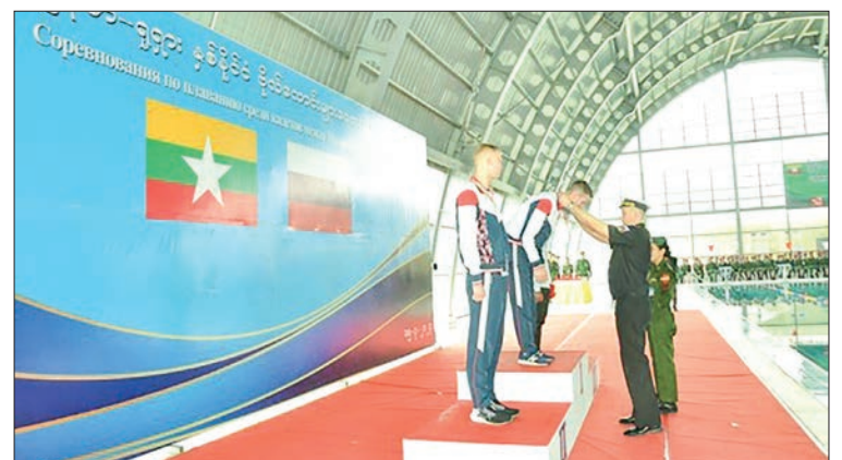
The Myanmar-Russia Cadets Swimming Competition and prize-presenting event in progress on 14 and 15 March 2023.