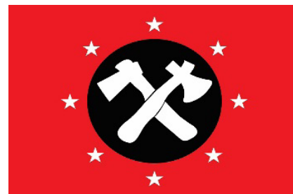
The flag design of the United Nationalities Democracy Party