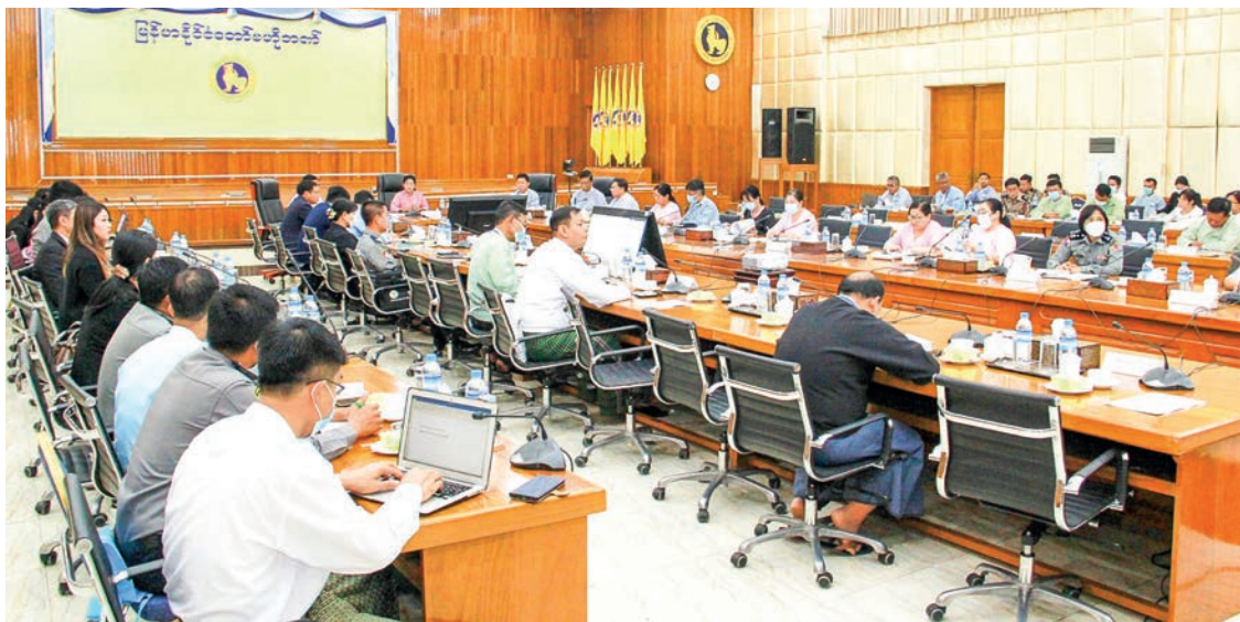
The workshop on Anti-Money Laundering and Counter-Financing of Terrorism is underway in Nay Pyi Taw yesterday.

Then, the CEO and Chief Compliance Officer of the Bank of China (Hong Kong) (Yangon branch) highlighted the further cooperation with CBM, Internal Control for Risk Management of AML/CFT, training for employees and recommendations of FATF.