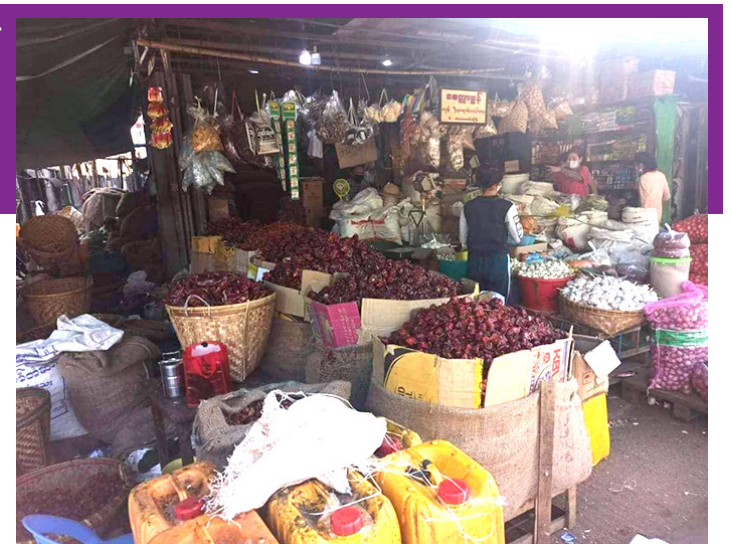
The photo shows a grocery.

The prices stood at K52,000-53,000 per bag for summer rice grown under the in-