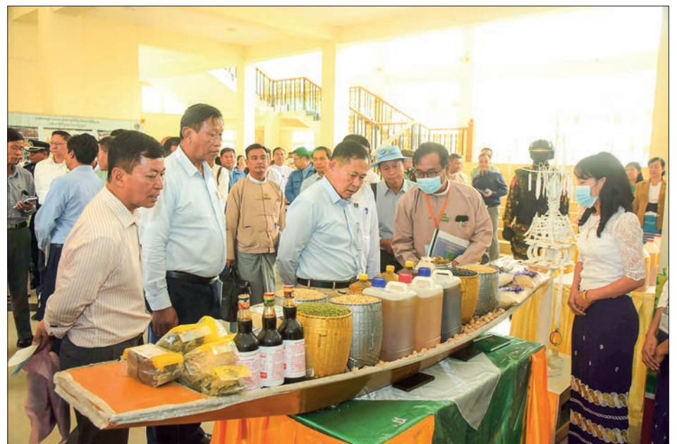
The Vice-Senior General warmly greets MSME businesspeople (left) and views domestic products displayed at the event (right).

The people are urged to receive vaccination of Covid-19 without fail as full-time vaccination of Covid-19 and receiving booster shots can effectively mitigate infection of the virus, severe suffering from the disease and increasing of death rate based on the disease.