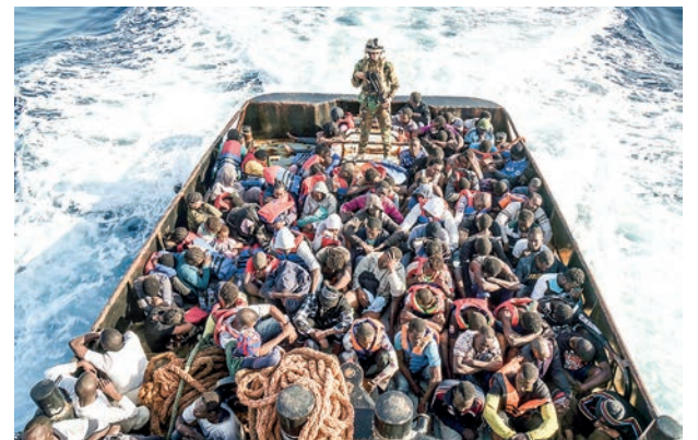
A Libyan coast guardsman stands on a boat during the rescue of 147 migrants attempting to reach Europe off the coastal town of Zawiyah, Libya on 27 June 2017.

boat. The EU's home affairs commissioner, Ylva Johansson, said the bloc had to offer legal routes to Europe after she was asked about recent shipwrecks in the Mediterranean sea that left at least 100 dead or missing in two weeks, off Italy and Libya. "This is the only sustainable solution to save lives and saving lives must always be our first priority," she told reporters in Strasbourg.—AFP