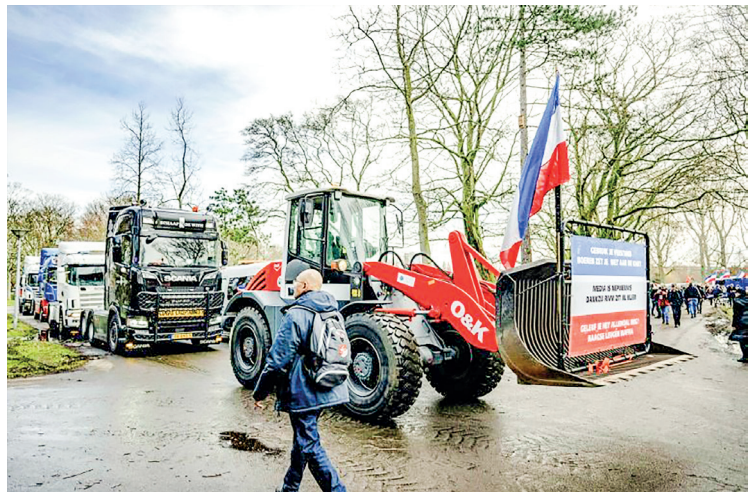
Dutch farmers held the latest in a series of protests against government climate protests in The Hague on 11 March.

DUTCH voters go to the polls in local elections on Wednesday, with a party of angry farmers posing a challenge to Prime Minister Mark Rutte and his climate change plans.