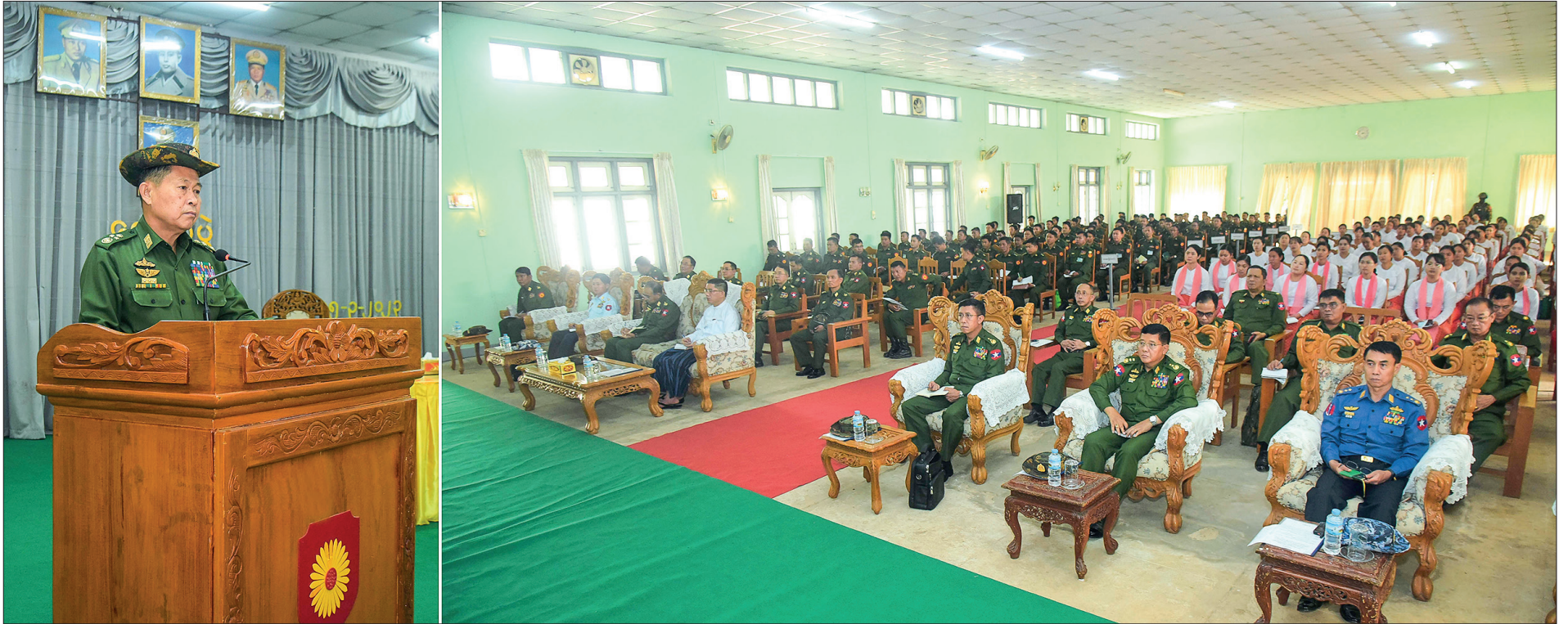
State Administration Council Vice-Chairman Deputy Commander-in-Chief of Defence Services Commander-in-Chief (Army) Vice-Senior General Soe Win meets Tatmadaw members and families of Loikaw station yesterday.

STATE Administration Council Vice-Chairman Deputy Commander-in-Chief of Defence Services Commander-in-Chief (Army) Vice-Senior General Soe Win had a cordial meeting with officers, other ranks and families of Loikaw station in Kayah State yesterday.