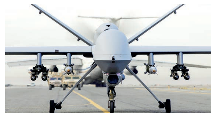
MQ-9 Reaper drone.

A Russian fighter jet on Tuesday dumped fuel on an American drone over the Black Sea and then collided with it, causing the drone to crash, the US military said, slamming the manoeuvre as “reckless”. US European Command said two Russian Su-27 fighters intercepted the unmanned MQ-9 Reaper over international waters and one clipped its propeller. “Several times before the collision, the Su-27s dumped fuel on and flew in front of the MQ-9 in a reckless, environmentally unsound and