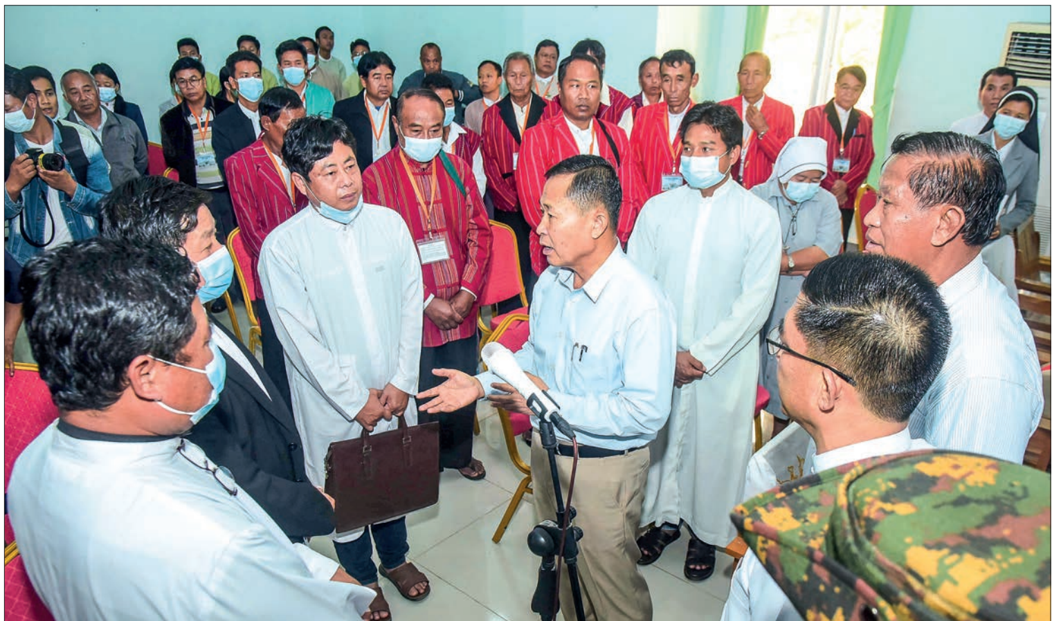
State Administration Council Vice-Chairman Deputy Commander-in-Chief of Defence Services Commander-in-Chief (Army) Vice-Senior General Soe Win cordially greets religious organization leaders from Loikaw and Kaehtobo traditional group in Kayah State on 15 March 2023.

Although the State Administration Council has invited all for restoring peace and stability and perpetual peace, some armed organizations do not have the willingness to cooperate with the government. Tatmadaw has extended the ceasefire for perpetual peace till the end of 2023. The Prime Minister himself invited all for holding peace talks without