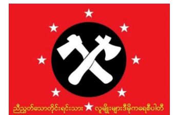
The emblem of the United Nationalities Democracy Party