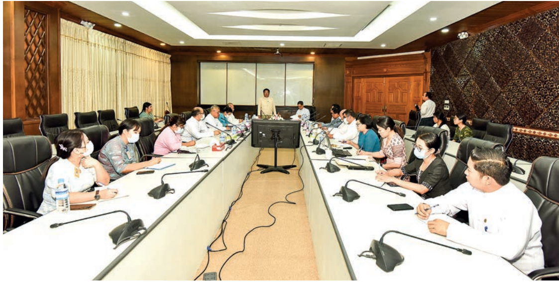
The MoFA and MoIC meeting on capacity strengthening for officials and staff in progress yesterday.

The Union minister underlined that the purpose of the meeting is to enhance capacity building and human resources for officials and staff from the Ministry of Foreign Affairs as well as for officials and staff from government organizations and other ministries related to international organizations