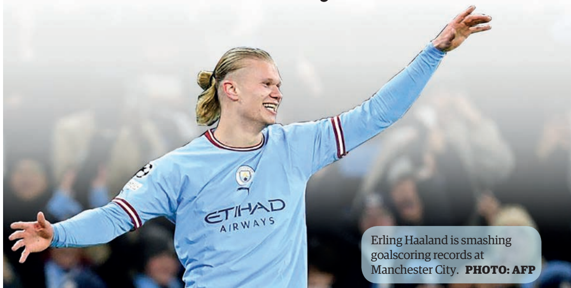
Erling Haaland is smashing goalscoring records at Manchester City.

ERLING Haaland admits he is at Manchester City to win the Champions League after smashing in five goals against RB Leipzig — and warns he can get even better.