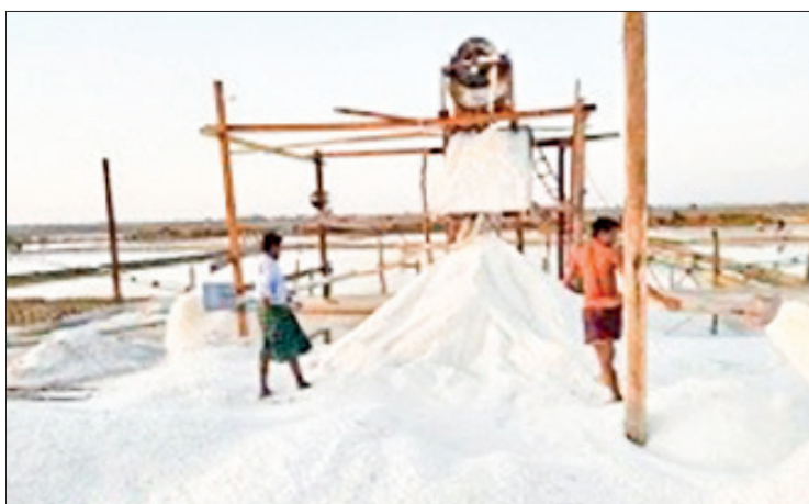
Mon State, the second largest producer in Myanmar, yearly produces 40,000 tonnes of sun-dried salt, beyond magnesium chloride (MgCl 2 ), iodized salt (I 2 ) and table salt (NaCl).

During the 2021 salt season, salt farmers were battered by losses.