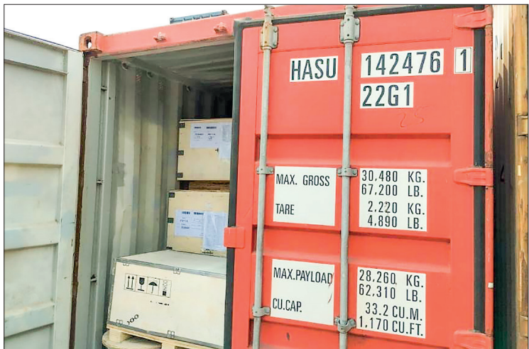
Confiscated illegal commodities at Myanmar Industrial Port.

INSEIN District Illicit Trade Eradication Task Force under the management of the Yangon Region Illicit Trade Eradication Task Force examined five container trucks near the Department of Fisheries on Bayintnaung road, according to information.