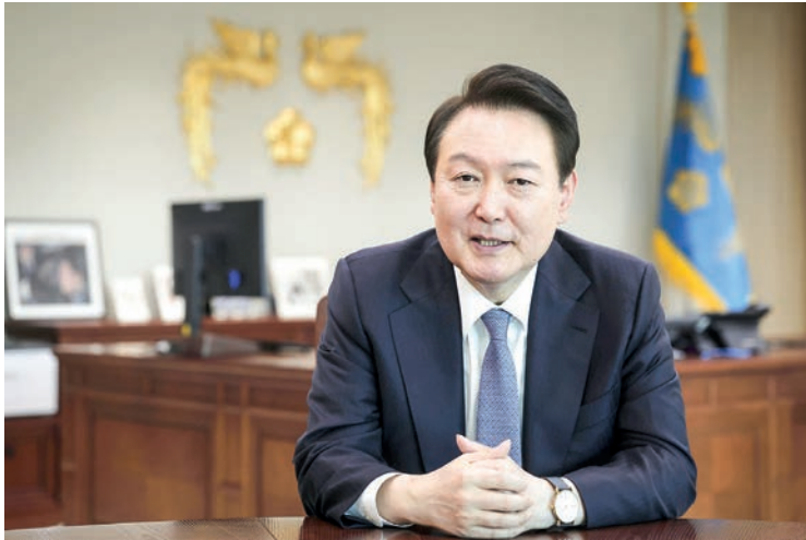
Undated photo shows South Korean President Yoon Suk Yeol in Seoul.

SOUTH Korean President Yoon Suk Yeol said Wednesday he hopes to cooperate with Japan and look “toward the future” after his government proposed a solution aimed at settling a long-running wartime labour compensation dispute with its neighbor.