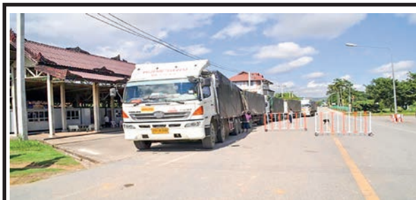
The picture shows trucks standing in line to enter the Tachilek border.