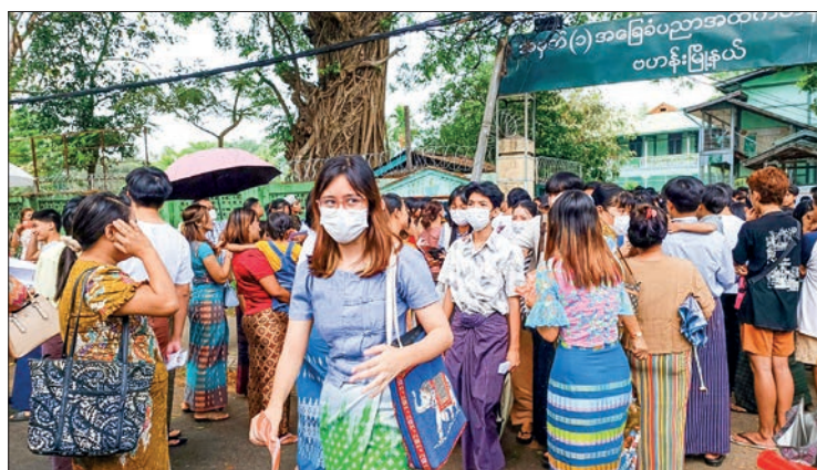
BEHS 1 Bahan Township in Yangon Region.

Three foreign exam centres and 756 local exam centres for students of science combination and three foreign exam centres and 856 local exam centres for students of art combination were opened for the 2022-2023 matriculation examinations.—MNA/MKKS