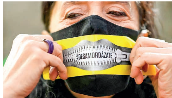
Gag law reforms fail in Spain.

But Catalan separatist party ERC and Basque pro-independence party Bildu — which usually help the government pass legislation — opposed the reform because the law would continue to allow police to use rubber bullets. — AFP