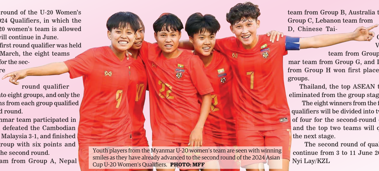
Youth players from the Myanmar U-20 women's team are seen with winning smiles as they have already advanced to the second round of the 2024 Asian Cup U-20 Women's Qualifiers.

The second round of qualifiers will continue from 3 to 11 June 2023. — Ko Nyi Lay/KZL