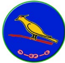
The emblem of the Khamee National Development Party