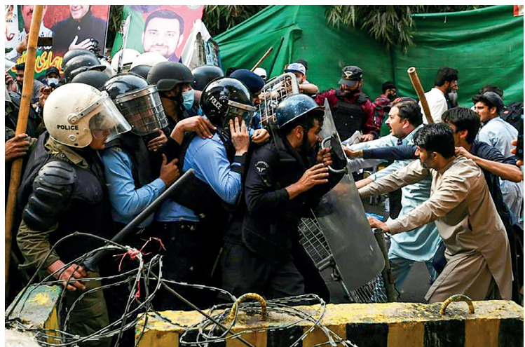
Supporters of former prime minister Imran Khan try to stop riot police from getting near his house in Lahore, eastern Pakistan.

"The way the police attack our people... there is no precedent for this," Khan said. — AFP