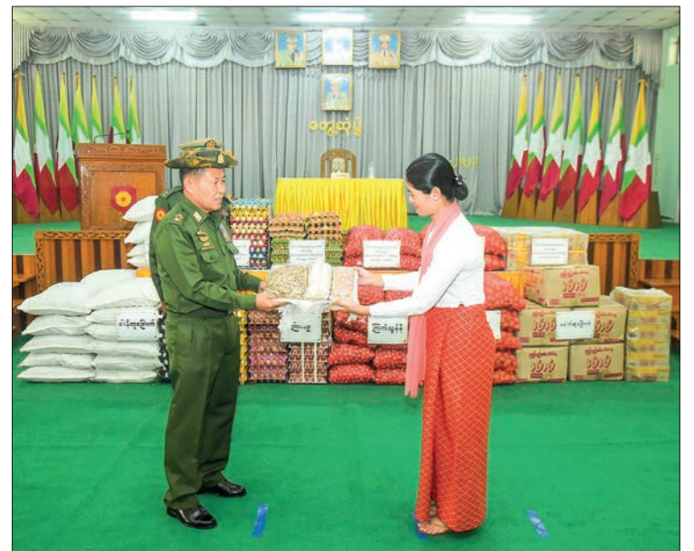
The Vice-Senior General provides foodstuffs for Tatmadaw members and families.

to take care of their health to perform the duties assigned by the higher levels.