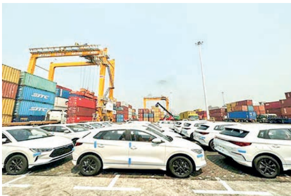
The photo taken on 3 March shows the arrival of battery electric vehicles at Hteedan port in Yangon.

The construction of EV charging stations is underway in Yangon, Nay Pyi Taw, Mandalay and along the Yangon-Mandalay Expressway, and is slated to be completed by the end of March. — TWA/KZW