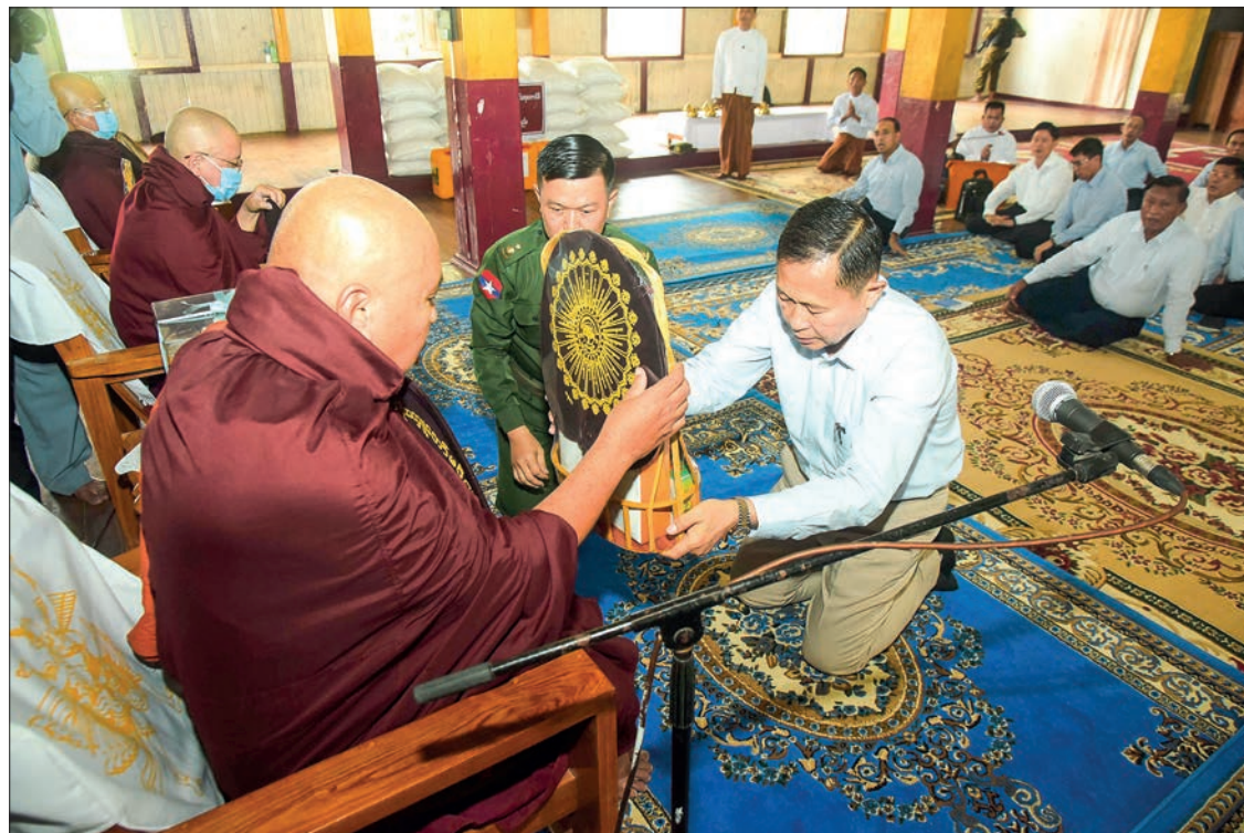
The Vice-Senior General presents offerings to the Yadana Thiri Monastery Sayadaw in Loikaw yesterday.

In his response to the discussions, the Vice-Senior General said that the formation of agencies for the development of MSMEs should not stop and they have to go forward. MSME businesspersons and other entrepreneurs need to make member cards. Such a card is important for training, marketing and staging international