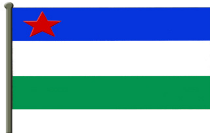
The flag design of the Khamee National Development Party