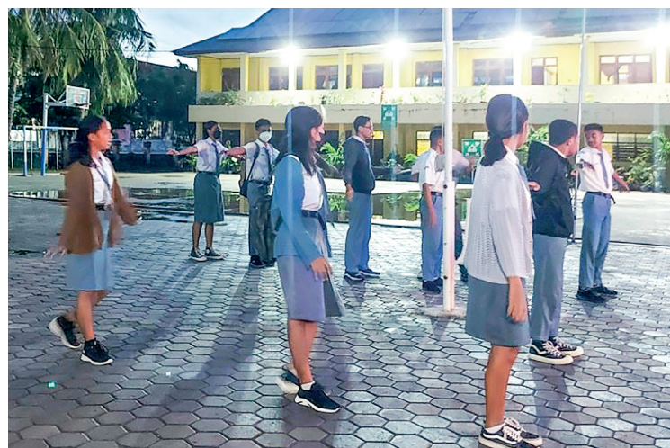
High school students gather for roll call in the Indonesian city of Kupang, where classes start at 5:30 am.

scheme, announced last month by governor Viktor Laiskodat, is intended to strengthen children’s discipline.