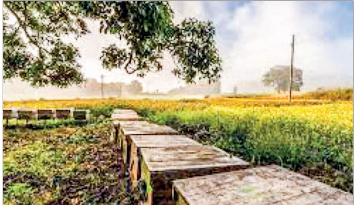
Myanmar annually produces about 7,000 tonnes of honey, with a production capacity of 70 pounds per beehive. Approximately 2,600 tonnes of honey are shipped to foreign markets every year. Myanmar's honey is priced at $1,600 per tonne.

Moreover, 2 million acres of crops yearly contribute to bee