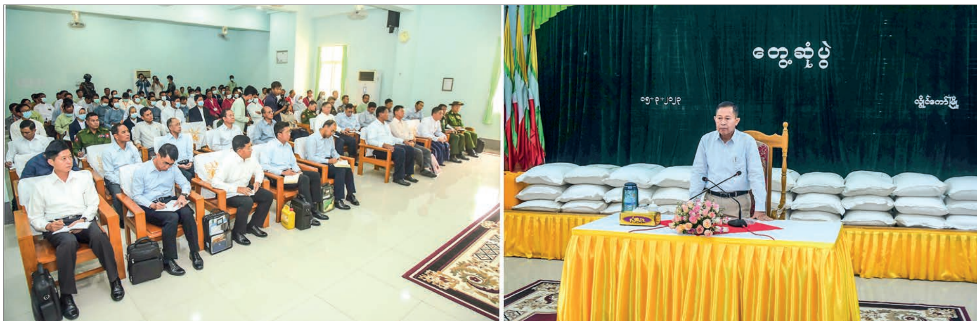
State Administration Council Vice-Chairman Deputy Commander-in-Chief of Defence Services Commander-in-Chief (Army) Vice-Senior General Soe Win meets religious organization leaders from Loikaw and Kaehtobo traditional group yesterday in Loikaw.