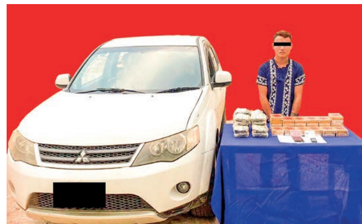
An offenders is pictured along with seized drugs and a saloon.

Offenders were prosecuted under the Narcotic Drugs and Psychotropic Substances Law.