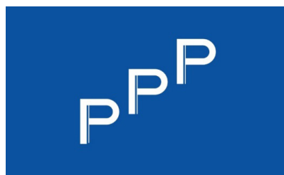
The flag design of the People's Pioneer Party