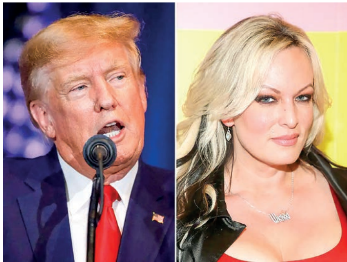
Stormy Daniels said she had an affair with Donald Trump before he was president.

UNITED States prosecutors met Stormy Daniels on Wednesday as they decide whether to charge ex-president Donald Trump over hush money paid to the porn star before the 2016 election, her lawyer said.