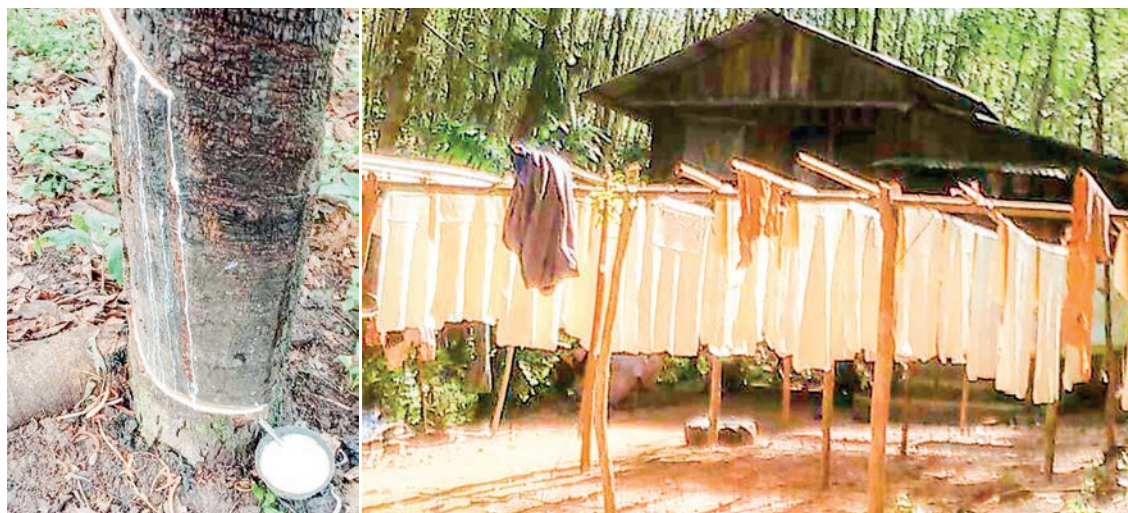
Myanmar bagged more than US$449 million in revenue from rubber exports in the previous financial year 2020-2021.

Myanmar bagged more than US$449 million in revenue from rubber exports in the previous financial year 2020-2021.