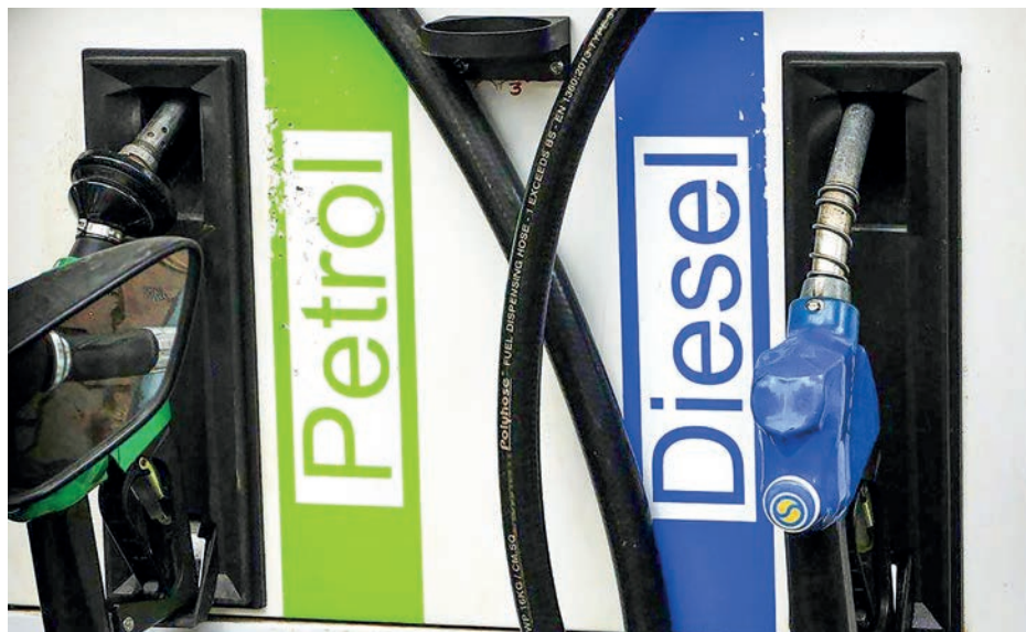
The file photo shows the oil pump for the petrol station.

In August 2022, the oil prices surged to K2,605 per litre for Octane 92 and K3,245 for diesel. The diesel price is way higher than the Octane price. The price