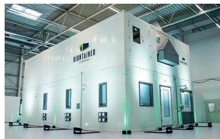
BioNTech has said vaccine production should begin within a year of delivery of the BioNTainers.

S IX mobile vaccine production units by German pharmaceutical company BioNTech arrived in Rwanda on Monday, the first such shipments to Africa as the continent seeks to boost mRNA vaccine manufacturing.