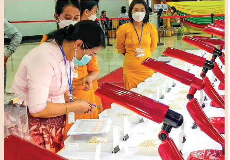
Traders viewed pearl lots in the 57 th Myanmar Gems Emporium.

At the 58 th mid-year Myanmar Gem Emporium in 2022, a total of 362 pearl lots, 55 gems lots and 1,836 jade lots were sold. — TWA/MKKS