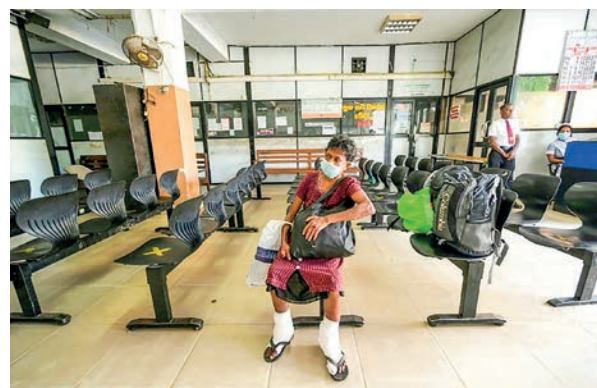
Hospital outpatient departments closed due to the work stoppage.

minimum services. Dock workers had a tense standoff with the military inside the port, but there were no reports of clashes. President Ranil Wickremesinghe's office said 20 trains operated to bring office workers to the capital, but unions said it was less than five per cent of the daily services.—AFP