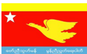
The emblem of the Mon Unity Party