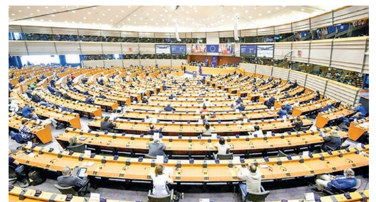
In this Sept 2020 file photo, European Union lawmakers attend a plenary session at the European Parliament in Brussels.

Lawmakers approved a non-binding resolution calling for the EU to broaden the list of those targeted over the clampdown, in a vote that followed the sentencing of Nobel Prize winning activist Ales Bialiatski to 10 years in jail.—AFP