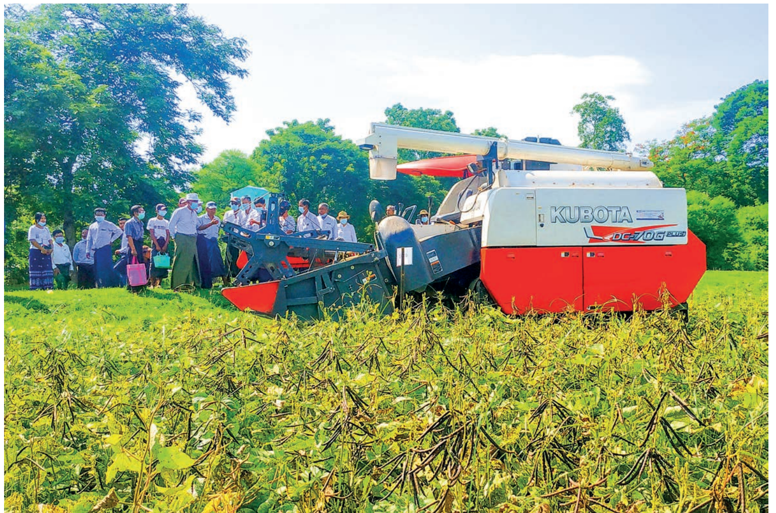
A combine harvester is used in one of the bean and pulse plantations in Minbu Township, Magway Region.

Myanmar primarily exports black grams, green grams and pi-