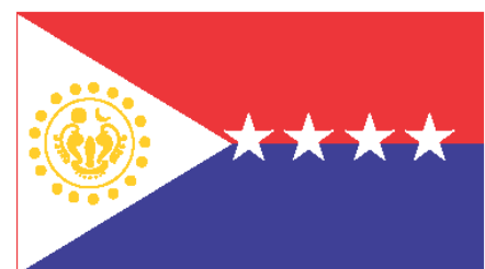
The flag design of the Rakhine State National United Party