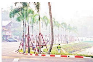
A landscape of entrance sidewalks and bike paths with foxtail palm trees to the University of Yangon (Hlaing Campus).

Road expansion and the construction of sidewalks and bike paths can make people safe around the intersection, in addition to reducing traffic jams on Parami Road. — TWA/CT