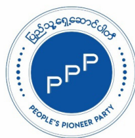
The emblem of the People's Pioneer Party