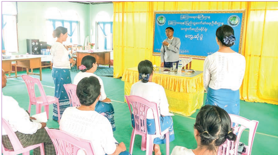
Deputy Minister U Ye Tint meets officials and staff from the Information and Public Relations Department in Kyaukse.

During the meeting, the Deputy Minister urged the staff to successfully implement the work of information and education and try to increase the number of readers. — MNA/MKKS