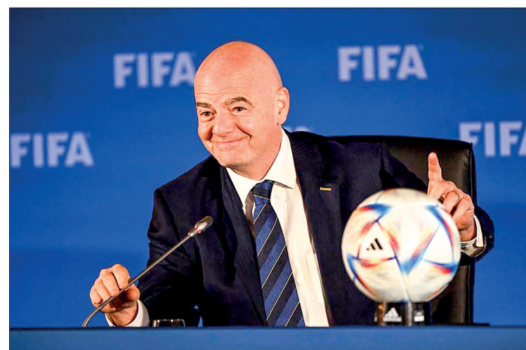
Gianni Infantino has been reconfirmed as FIFA president for a third term.

FIFA announced on Tuesday that the tournament in North America will feature 104 matches, a huge increase from the 64 at the most recent World Cup, as it will start with 12 groups of four teams.—AFP