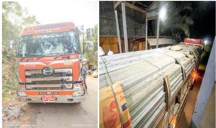
Seized illegal commodities at the Mayanchaung permanent checkpoint.

ON 9 and 10 March, an on-duty team under the management of the Customs Department made inspections at the Asia World Port Terminal container checkpoint.