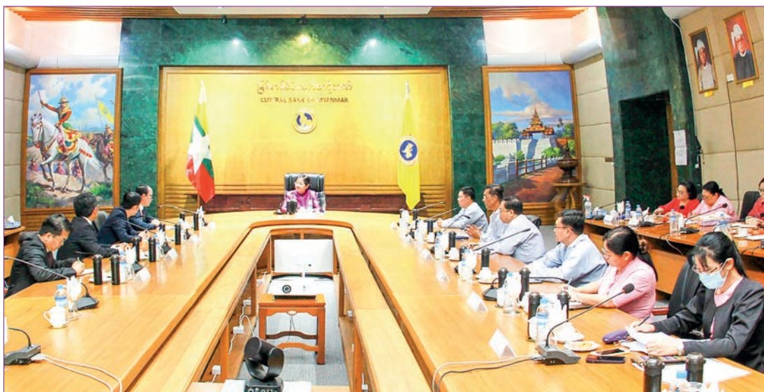
CBM Governor Daw Than Than Swe holds talks with the delegation from the Central Bank of Cambodia yesterday.

GOVERNOR Daw Than Than Swe of the Central Bank of Myanmar received the delegation from the Central Bank of Cambodia at the Central Bank of Myanmar yesterday in Nay Pyi Taw.