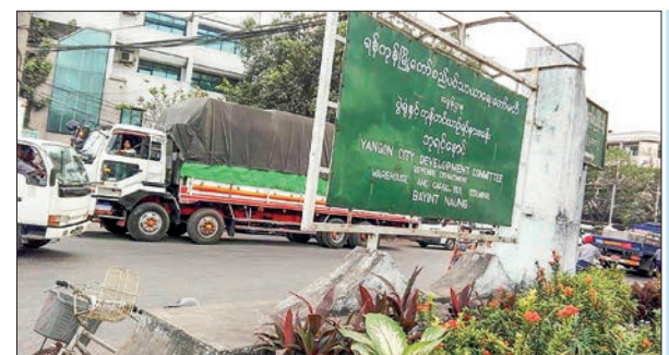
Some trucks are seen near the Bayintnaung Wholesale Centre.

In August 2022, the diesel was above K3,000 per litre and