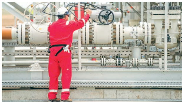
Russian oil exports fell by 500,000 barrels per day to 7.5 million bpd in February, with a big drop in shipments to the EU, but it was still near pre-war levels.

RUSSIA'S oil-export revenue sank by almost half in February compared to last year as Western powers tightened sanctions on the country, the International Energy Agency said on Wednesday.