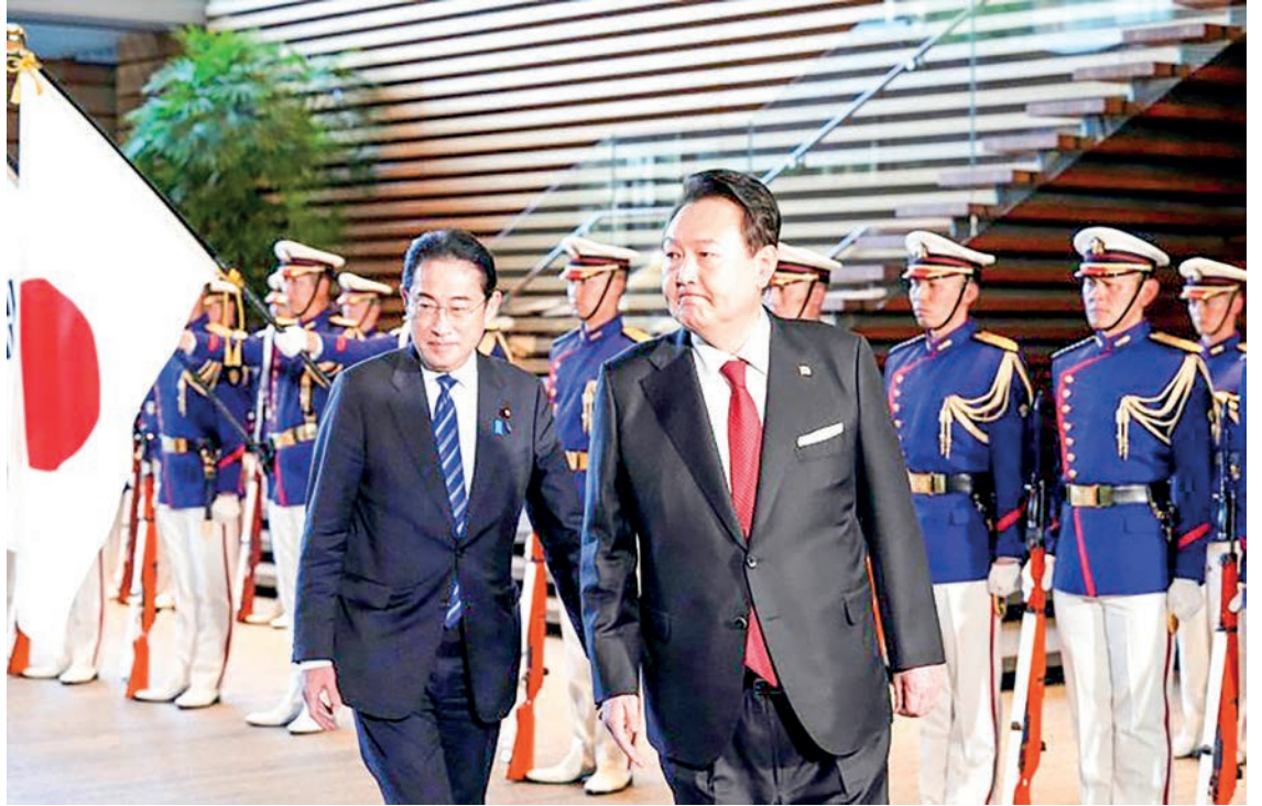
Japan and South Korea are holding their first full-scale summit in 12 years.

At the same time, South Korea announced it would withdraw