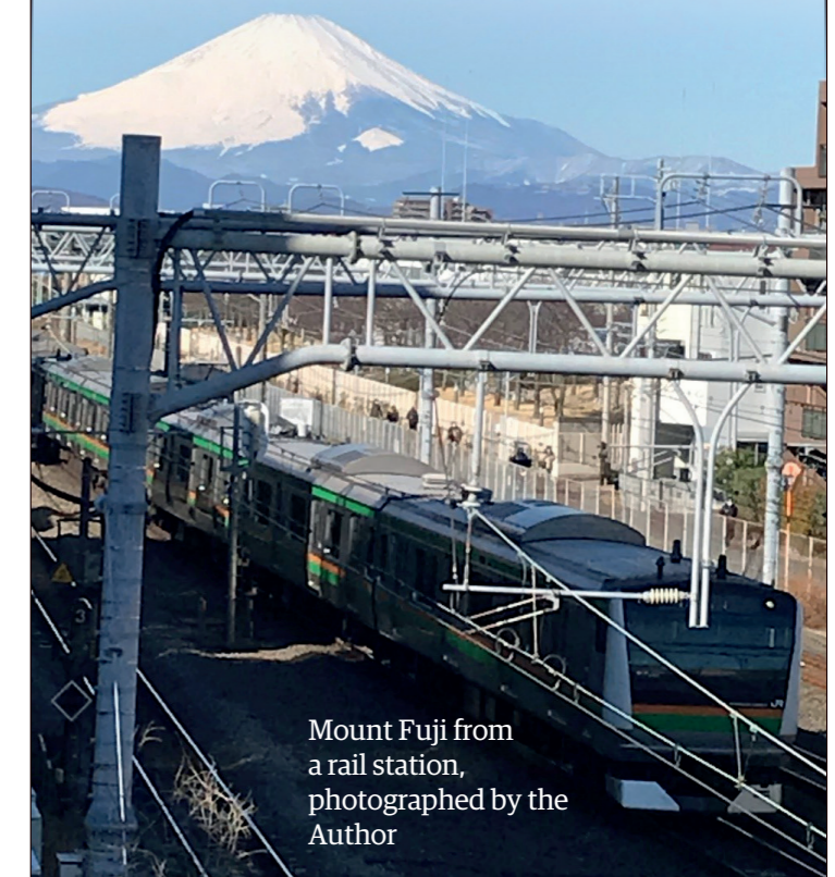
Mount Fuji from a rail station

Many foreigners are now visiting Japan and taking pictures. I want them to be interested in the nameless people behind the scenes.