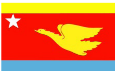
The flag design of the Mon Unity Party