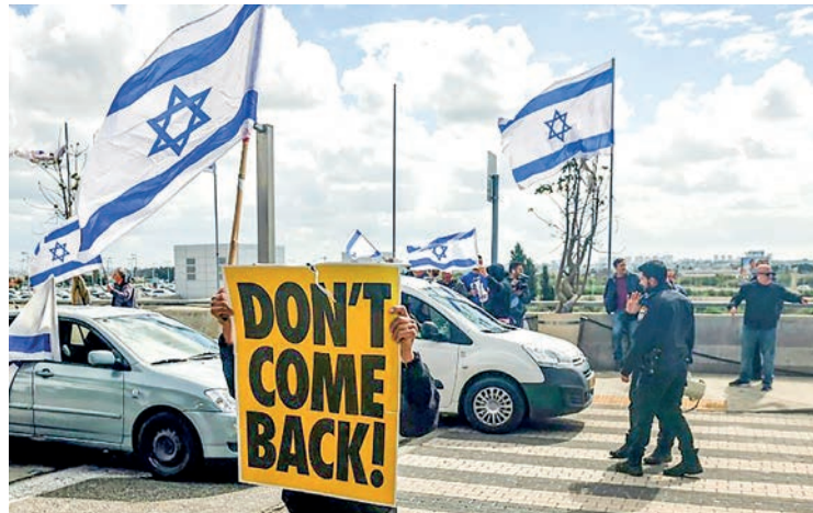
Ahead of Netanyahu's departure, critics took their protests to Ben Gurion airport.

"What I would like to see is that what we have admired about Israel... is preserved." Ne-