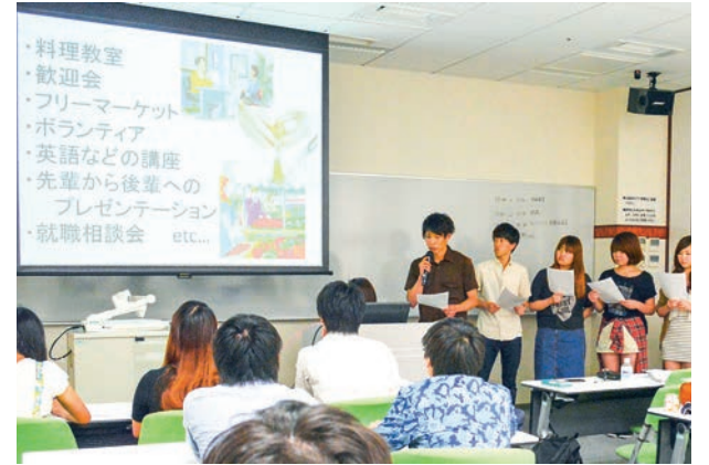
The business lobbies also plan to make it easier for South Korean students to find jobs and internships at Japanese companies. Senshu University students make a presentation in July of university dorm construction plans under an internship programme for a dormitory operator in Kawasaki.

Under the plan, recently announced by Seoul, a South Korean government-backed foundation will pay compensation to plaintiffs instead of the Japanese companies that were sued. — Kyodo