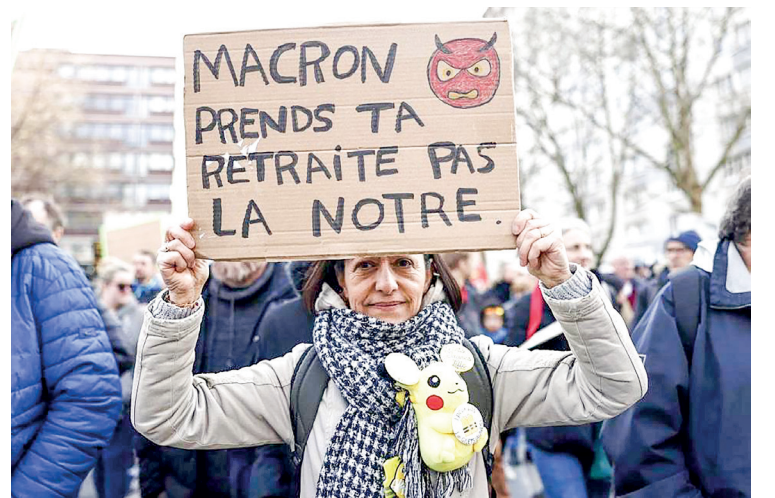
A protester poses with a placard reading "Macron, take your pension, not ours" during a demonstration against pension reform.

public sector workers and toughening criteria for a full pension are needed to prevent major deficits building up. Trade unions have led resistance to the plans since the start of the year, organizing some of the biggest demonstrations in decades, which peaked last Tuesday when an estimated 1.28 million people hit the streets.—AFP