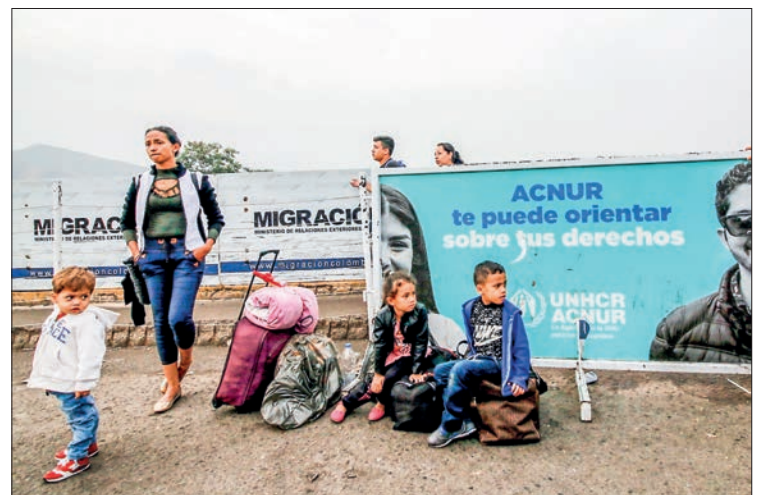
A Venezuelan family at the Simon Bolivar International Bridge in the Colombian border city of Cucuta on 10 January 2019.

Venezuelan President Nicolas Maduro's government had accused Canada and the European Union of convening a "hostile" conference that politicizes migration. — AFP