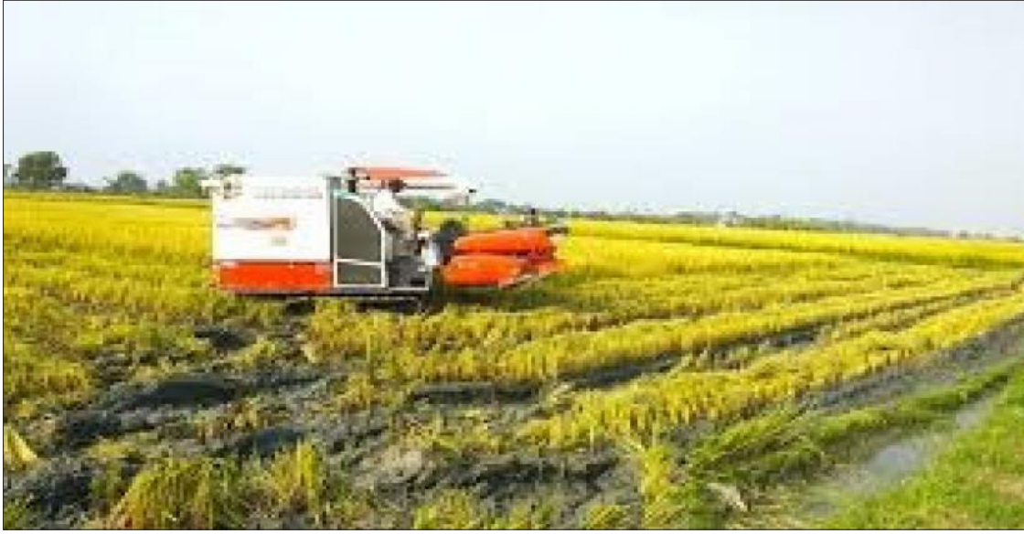
A farmer is pictured reaping summer paddy with a combine harvester in Ottwin Township, Bago Region.

THE prices of low-grade summer paddy moved up this year. Paddy prices stood at K1.55 million per 100-baskets of short-mature paddy (90 days), and K1.45 million for paddy grown under the intercropping system in recent days. The price soared to K1.6 million