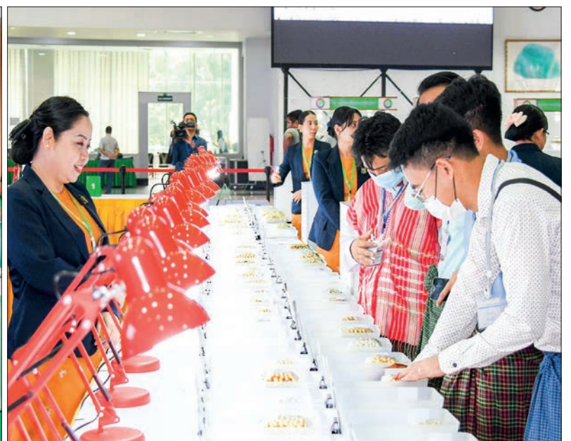
Gem traders are seen in pearl lots and gem lots displayed at the 58 th Myanmar Gems Emporium yesterday.

5 new cases of COVID-19 reported on 18 March, total figure rises to 633,991