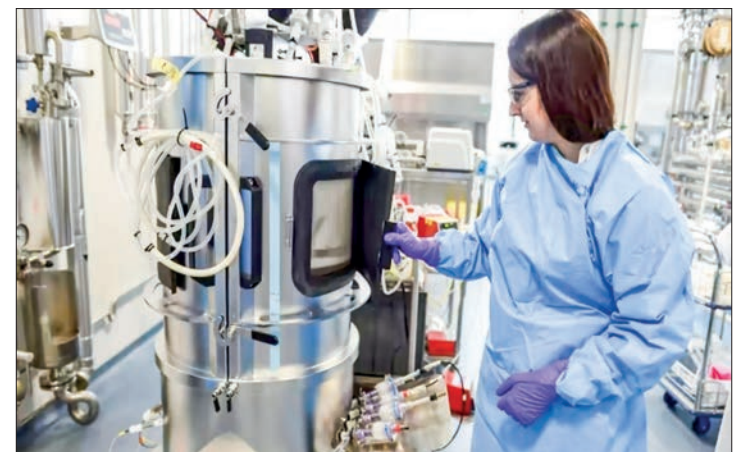
Sanofi said it would cut the list price of Lantus, its most widely prescribed insulin in the United States, by 78 per cent from January 1, 2024.

“We are proud of our continued actions to improve access and affordability for millions of patients for many years,” Bogillot said in a statement. — AFP