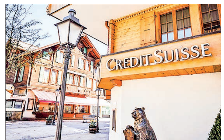
A branch of Swiss banking Credit Suisse in Gstaad, Switzerland.

Under Donald Trump's presidency in 2019, small- and mid-sized US banks were exempted from the Basel rules, he said, noting that Silicon Valley Bank and Signature Bank, which collapsed last week, were among them. — AFP