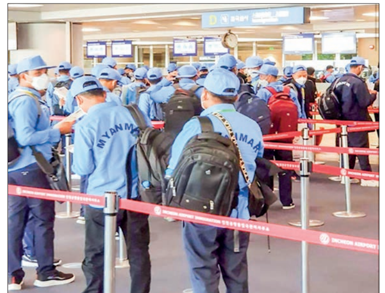
Myanmar workers despatched to Japan in 2022 were seen at Yangon International Airport.

The verification process was performed by checking whether the labour supervision company in Japan and the recruitment factories and companies are officially established in Japan, and by sending back the