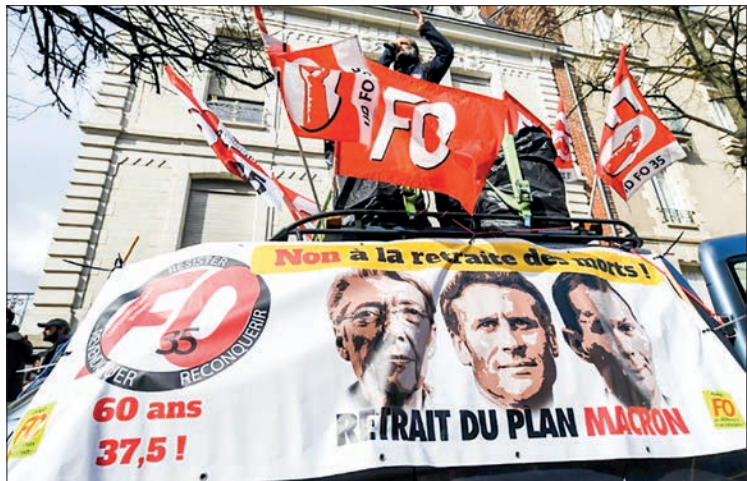
French President Emmanuel Macron on Friday faced intensified protests and a no confidence motion in parliament after pushing through a contentious pension reform without a vote in the lower house.

FRENCH President Emmanuel Macron's government on Friday faced no-confidence motions in parliament and intensified protests after imposing a contentious pension reform without a vote in the lower house.