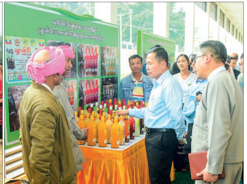
Vice-Senior General Soe Win warmly greets locals (left) and views the products displayed at the meeting yesterday.

pass at least primary level education and then middle school level education. If so, they will have the capacity to handle modern military equipment and arms. So, the KG+9 education scheme is being implemented for all school-age children. Only if they have