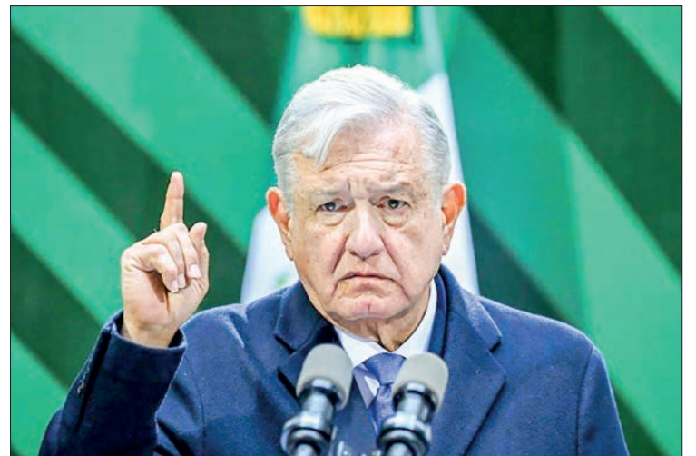
Mexican President Andres Manuel Lopez Obrador will rally his supporters at an event 18 March 2023 in Mexico City.

which were approved by the ruling party-controlled Congress last month — as an attack on democracy ahead of the 2024 presidential election. Mexican