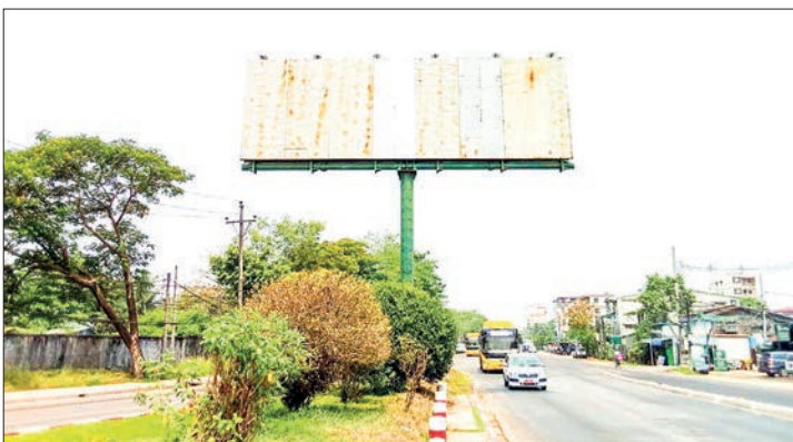
Vacant billboard advertisement is seen in Yangon Region.

Therefore, those who won the lots must submit their names for each billboard in the attached files. — TWA/KTZH