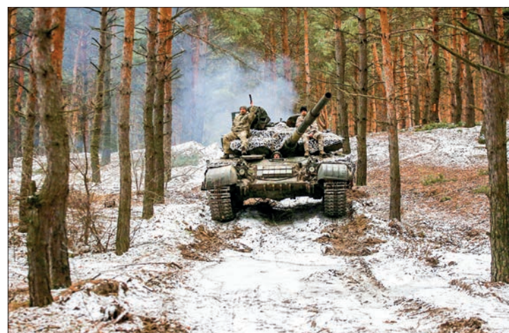
Ukrainian tankers ride a tank on a position near a front line in the Kharkiv region on 2 March amid the Russian invasion of Ukraine.

HEADS of state from the Economic and Monetary Community