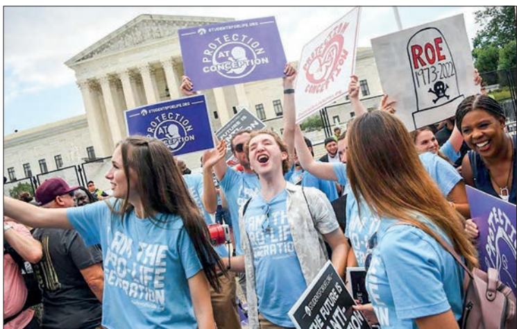
Pro-life activists celebrating outside the US Supreme Court in Washington DC on 24 June 2022, after the court overturned the landmark ‘Roe vs Wade’ decision. On 24 June 2022, the US Supreme Court overturned Roe v. Wade, the landmark piece of legislation that made access to an abortion a federal right in the United States.

But medical experts said the Covid pandemic was a significant factor, along with socioeconomic conditions and a long-standing lack of access to quality pre- and post-natal care for many Black women. — AFP