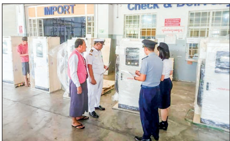
Officials check the imported EV chargers at Yangon International Airport.

FIVE Linchr-brand 60 kV EV chargers for battery electric vehicles arrived at Yangon International Airport on 18 March.