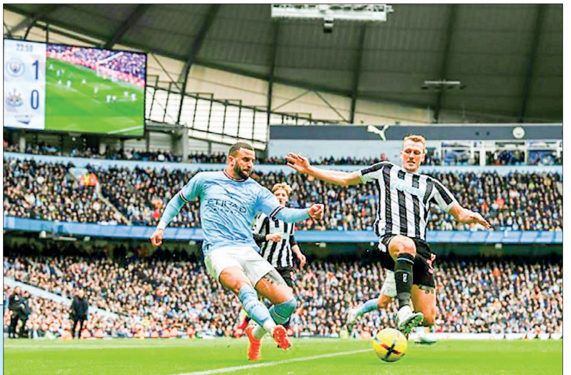
Kyle Walker (left) will face no further police action over allegations of indecent exposure. PHOTO: AFP

Walker has won four Premier League titles among nine major trophies since joining City from Tottenham in 2017 and been capped 73 times by England. — AFP