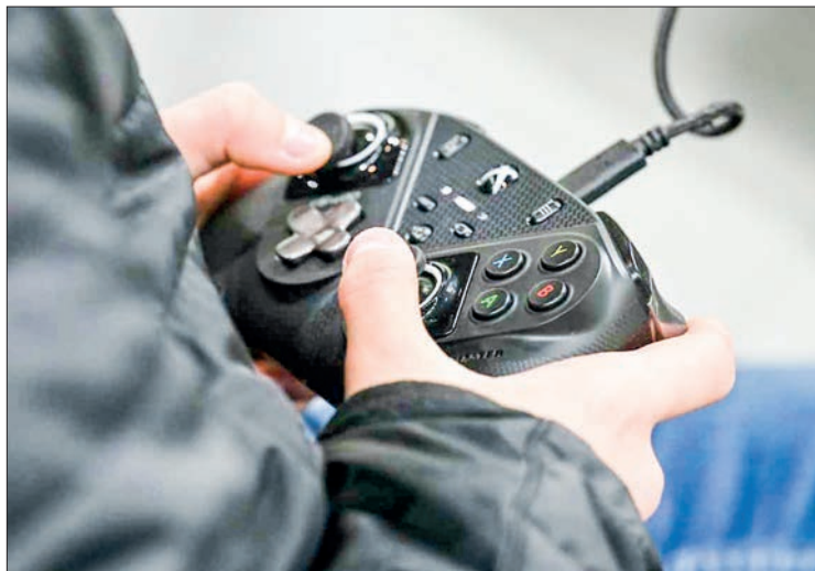
Xbox-owner Microsoft last year began a bid to takeover Activision Blizzard to create the world's third biggest gaming company by revenue.

The European Commission, EU executive and the bloc's powerful antitrust authority, had been due to make a decision before 25 April but said it will now extend this deadline until 22 May.