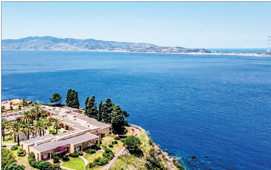
The idea of the bridge can be traced back to the ancient Romans, but modern attempts to launch the project have repeatedly failed.

ITALIAN Prime Minister Giorgia Meloni's cabinet passed a decree Thursday relaunching a controversial project to build a huge, multibillion-euro bridge linking Sicily to the mainland.