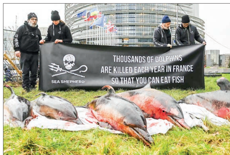
Members of the Sea Shepherd Conservation Society (SSCS) NGO hold a banner behind dead dolphins retrieved in the sea during a demonstration to denounce non-selective fishing in front of the European Parliament, in Strasbourg, eastern France, on 14 March 2023.

AT least 910 dolphins have washed up on France's Atlantic coast since the start of the winter, an oceanographic institute reported Friday.