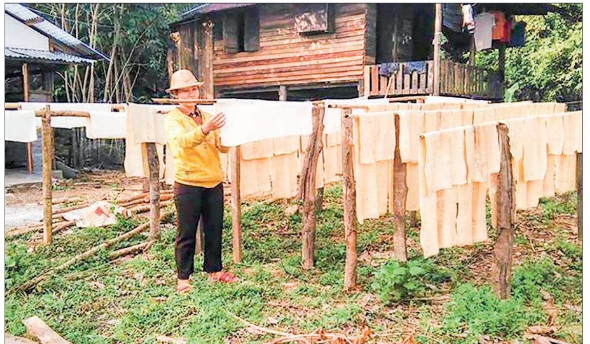
A worker hangs rubber sheets to dry.

Rubber is commonly produced in Mon and Kayin states and Taninthayi, Bago, and Yangon regions in Myanmar. As per 2018-2019 rubber season