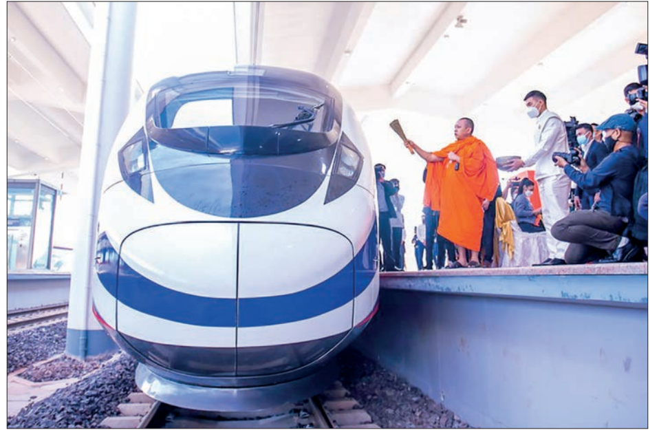
A traditional ceremony is held for the smooth operation of the China-Laos Railway at the Vientiane railway station in Vientiane, capital of Laos, 2 December 2021.

"In the past I had to stand in line for hours