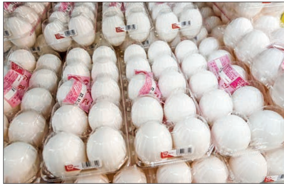
File photo taken in November 2022 shows eggs sold at Akidai supermarket in Tokyo's Nerima district.

It is expected to take at least six months until egg availability recovers to former levels. Once an infection is confirmed at a poultry farm, all its birds are culled, after which the facility is sanitized and quarantine measures are put in place. It can take between three and seven months for such farms to return to raising chickens as normal again. — Kyodo