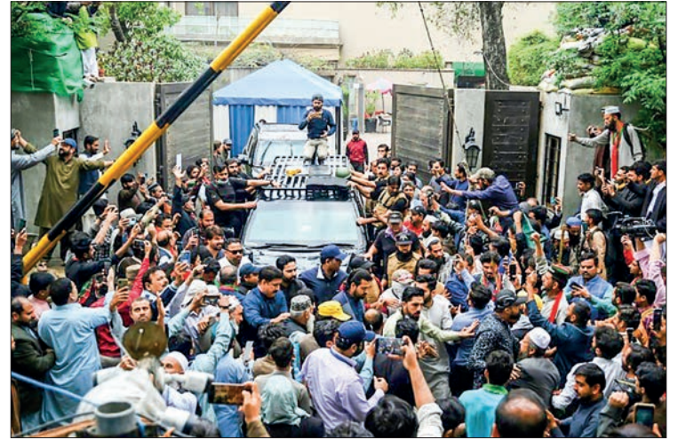
Supporters of Pakistan's former prime minister Imran Khan gather around his car as he leaves his Lahore residence to appear in court in Islamabad.

"The point of their attack on my house was not to present me