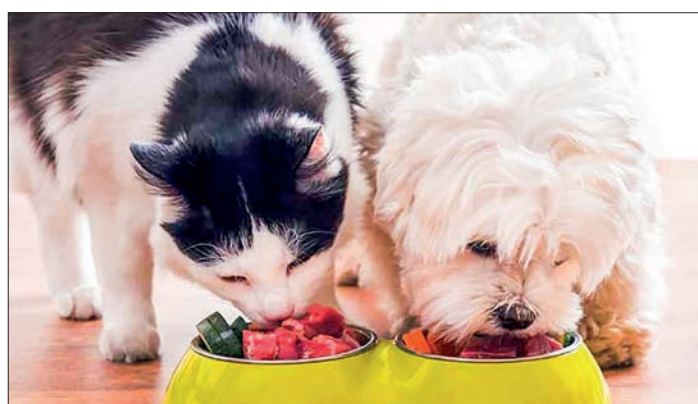
Spain outlaws cruelty to animals.

The legislation mainly relates to pets and doesn't include animals raised for slaughter. Nor does it concern hunting dogs, sparking a rift within the government. Although Podemos had wanted hunting dogs included, the Socialists of Prime Minister Pedro Sanchez did not. — AFP