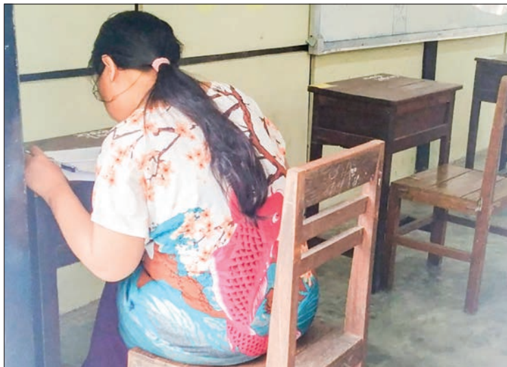
A student is seen sitting for the Optional Myanmar subject yesterday.