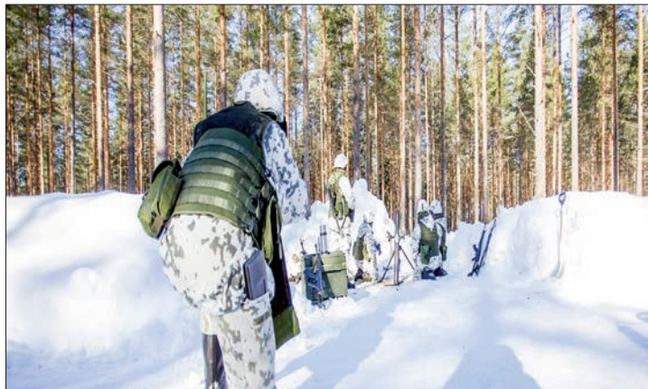
Reservists of the Karelia Brigade perform shooting drills in Taipalsaari, Finland, on 9 March 2022.

He stressed he believed that NATO will further strengthen and play a crucial role in global security with Finland's admission. — AFP