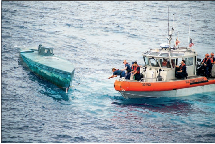
Crew from the Coast Guard Cutter Stratton intercept a homemade submarine in the eastern Pacific on 18 July 2015. The US Coast Guard said it seized $181 million worth of cocaine from the vessel, but even more drugs sank during the bust.

COCA cultivation hit a record high by soaring 35 per cent from 2020 to 2021, a UN report showed Thursday, amid new cocaine trafficking hubs emerging in south-eastern Europe and Africa. Bolivia, Colombia and Peru