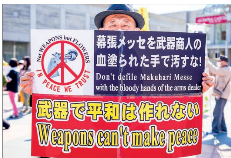
A man protests in front of the convention centre of Makuhari Messe in Chiba Prefecture, Japan, 15 March 2023.

The crowd lay on the ground after the speech, in an attempt to oppose the trade of weapons in a country that boasts of "exclusive defence" using the "body language of death".