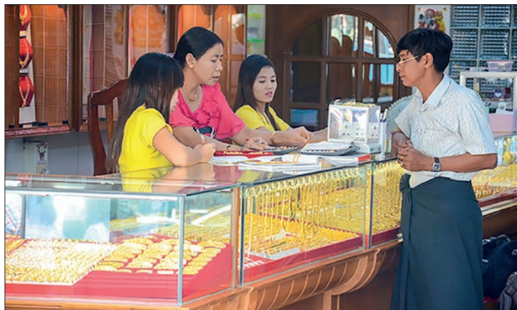
A customer buying gold necklaces at a gold shop in Yangon.

YANGON Region Gold Entrepreneurs Association hikes reference rate to over K2.34 mln per tical (0.578 ounce or 0.016 kilogramme) with the gold spot prices rising.