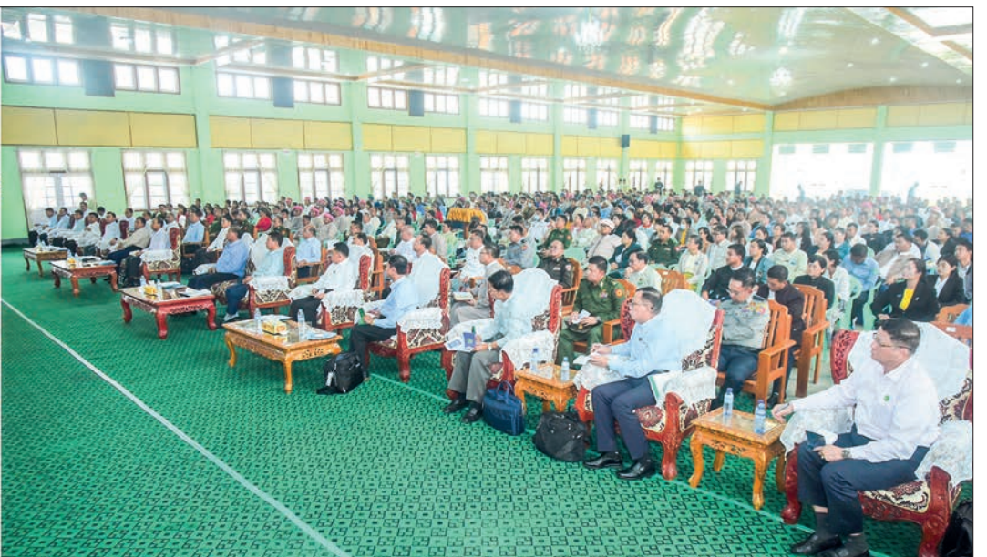
SAC Vice-Chairman Deputy C-in-C of Defence Services Commander-in-Chief (Army) Vice-Senior General Soe Win addresses the meeting with MSME businesspersons, departmental officials and local people in Pindaya of Danu Self-Administered Zone, Shan State (South) on 18 March 2023.

facturing of value-added products using domestic foodstuffs and difficulties in the work process. Deputy ministers discussed the