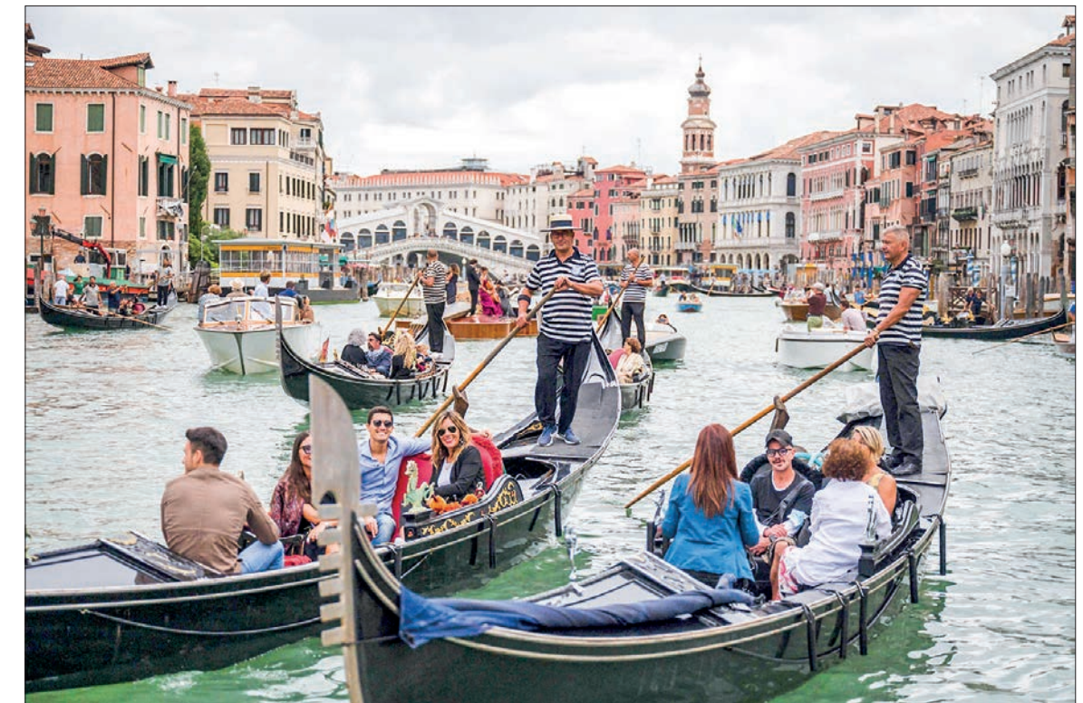
With Italy’s tourist numbers set to return to pre-pandemic levels in 2023, some towns are bringing in measures to limit the impact of over tourism. Tourists enjoy a gondola ride on the Grand Canal by the Rialto bridge in Venice, Italy, 18 September 2021.