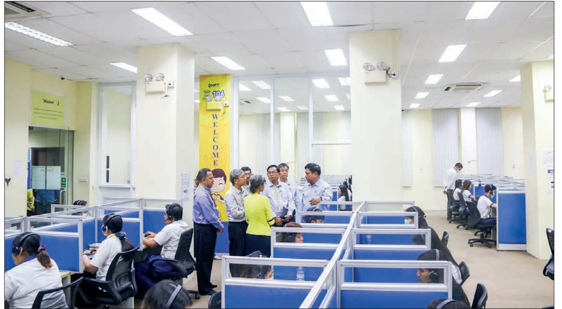
Deputy Prime Minister Union Transport & Communications Minister Admiral Tin Aung San is pictured during his inspection tours of Myanmar Posts and Telecommunications in Yangon yesterday.

Finally, the Union minister provided foodstuffs to the staff.