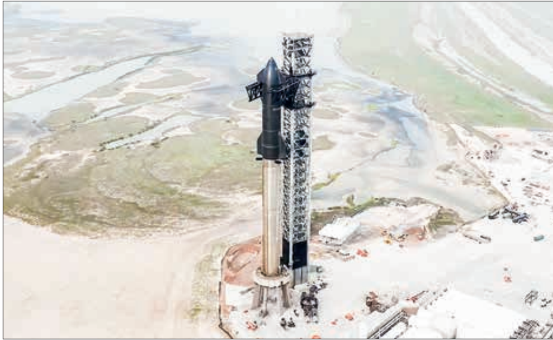
SpaceX conducted a successful test-firing of the 33 Raptor engines on the first-stage booster of Starship in February.

SpaceX plans to carry out a launch rehearsal next week of Starship, the most powerful rocket ever built, and its first test flight possibly the following week, the private space company said Thursday. SpaceX published photos of the massive Starship, which is