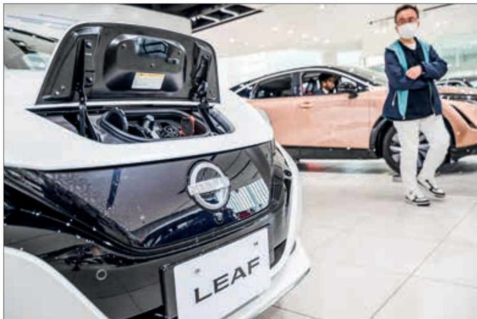
This photo taken on 30 March 2023 shows a man walking past one of Nissan's electric vehicles (EV), the Leaf, at the global headquarters of Japanese automaker Nissan Motor in Yokohama, Kanagawa prefecture. Last year, 59,000 new EVs were sold in Japan, a record and a three-fold annual increase, but still less than two per cent of sales of all cars in the country in 2022.

"I like high-performance cars," he told AFP, describing the few Japanese options on the market when he bought in 2016 as small and unattractive. — AFP