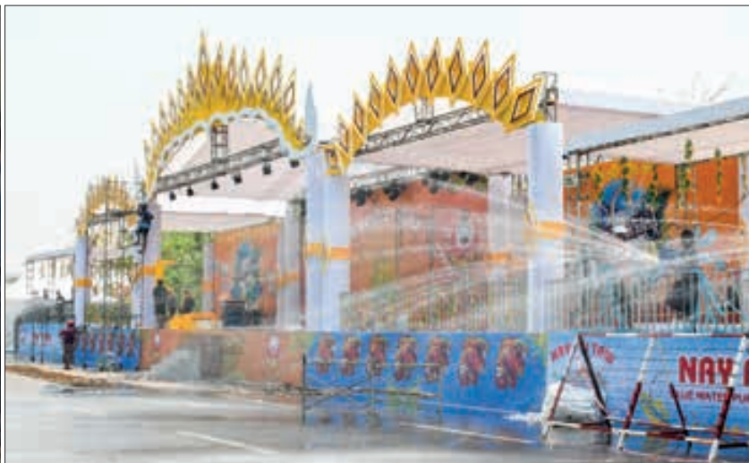
Union Minister U Maung Maung Ohn and officials inspect the preparations for the Walking Thingyan.