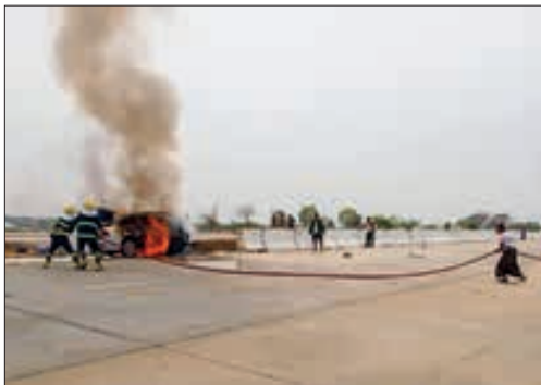
Firefighters are seen putting out the burning vehicle.