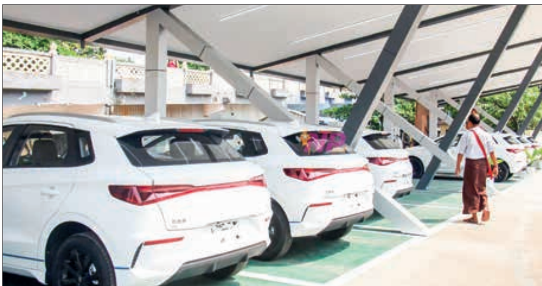
The picture shows some imported battery electric vehicles (BEVs) in Myanmar.

THE Working Committee on Special Exemptions on Electric Vehicles and Related Industries notified that the special commodity taxes for EVs will be exempted until the end of March 2024.