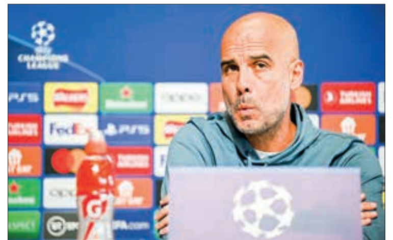
Manchester City's Spanish manager Pep Guardiola attends a press conference at Manchester City training ground in Manchester, north-west England on 10 April 2023, on the eve of their UEFA Champions League quarter-final first leg football match against Bayern Munich.

Tuchel was in charge of Chelsea when they beat City 1-0 in the final in Porto two years ago.