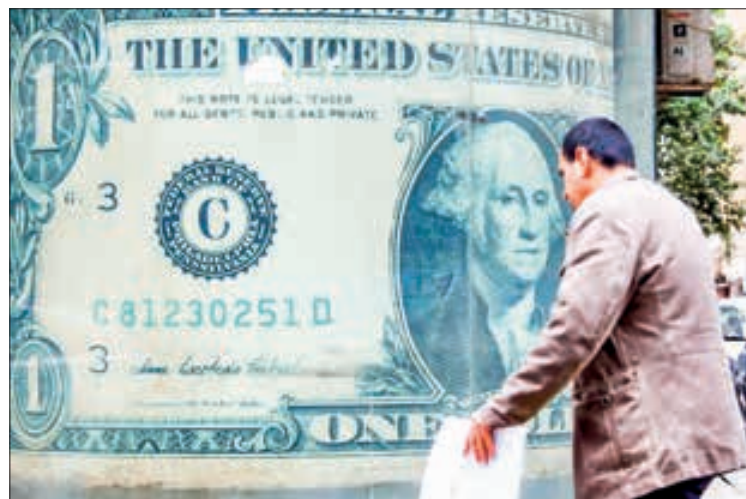
A man passes a foreign exchange office in Cairo, Egypt, 25 December 2022. PHOTO: XINHUA

For his part, Levitin said Moscow is ready to make investments in different Iranian economic sectors, including those pertaining to the steel, oil and petrochemical industries. — Xinhua