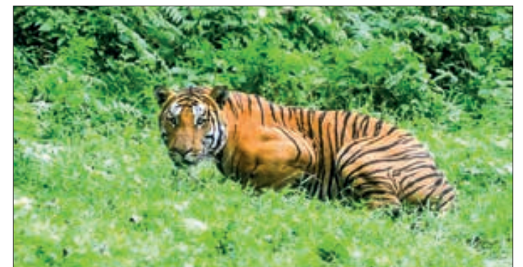
The largest of all cats, tigers once roamed throughout central, eastern and southern Asia. PHOTO: AFP

"Our family is expanding," he said at a ceremony in the southern city of Mysuru. "This is a matter of pride not only for India but the entire world." — AFP