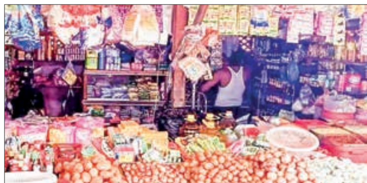
The photo shows a dry groceries outlet.

The rice supply to the Yangon market this week declined. Both large rice depots were temporarily suspended from 8 April during the Thingyan holidays. Only high-grade rice is highly demanded in the retail market. The prices spiked. The Pawsan prices were K84,000 per bag from the Pyapon area, K86,000 for the Myaungmya area and K120,000 per bag from the Shwebo area.