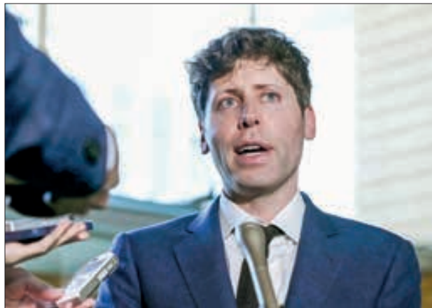
Sam Altman, chief executive of US-based OpenAI, speaks to reporters after meeting Japanese Prime Minister Fumio Kishida at the premier's office in Tokyo on 10 April 2023.

A developer of ChatGPT said Monday that his company plans to open an office in Japan amid growing concerns about the chatbot's unauthorized collection of personal data and impact on learning environments.