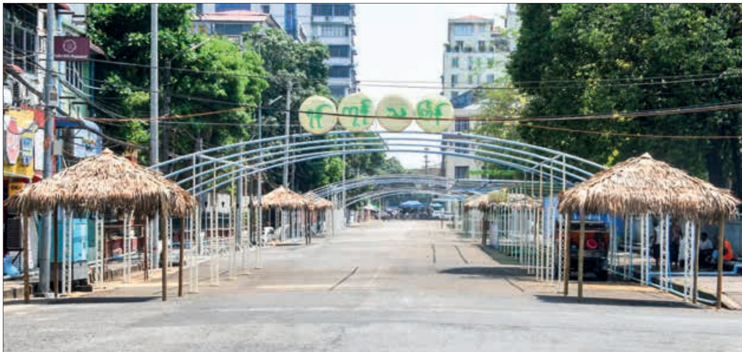
The photo shows the venue for the Walking Thingyan alongside the Yangon Mayor Maha Thingyan Pandal.

Entertainment and water-throwing pavilions such as NwayU Kabyar, Hnitthit Chit Oo, Padauk Letsaung, Padauk Yeik, Thingyan Moe, Nway Ahla, Tupoh Tupoh, Padauk Myethna, Hnitthit Mingalar and Panmyo Tayar in addition to the pavilions to serve the people with refreshments and restaurants have been constructed for the Walking Thingyan Festival.