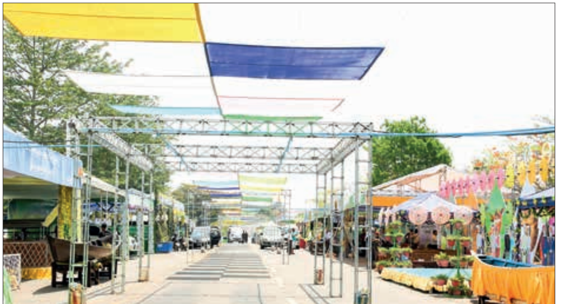
Preparations are underway for the Nay Pyi Taw Walking Thingyan including the Thanaka Thingyan, the Ethnic Thingyan, the ministries' pandals, fun programmes for adults and youths, the soft play area for children, food stalls, water skiing, and entertainment programmes among others (above and below photos).

"Starting Thingyan Akyo Day, we will launch Walking Thingyan at 9 am. After a break at noon, there will be entertainment programmes and other programmes from 3 pm to 7 pm. Visitors will also play games. In addition, we must be able to enjoy our favourite foods in the