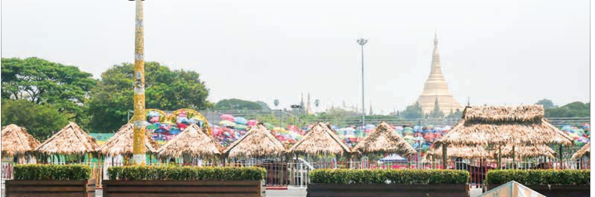
Preparations are seen for the Myanmar Traditional Thingyan Festival in Yangon.

T HE Yangon Region government and the Yangon City Development Committee are jointly making arrangements for holding the Walking Thingyan festival with many programmes in the Yangon City Maha Thingyan festival for 1384 ME on a grandeur scale more than in previous years.