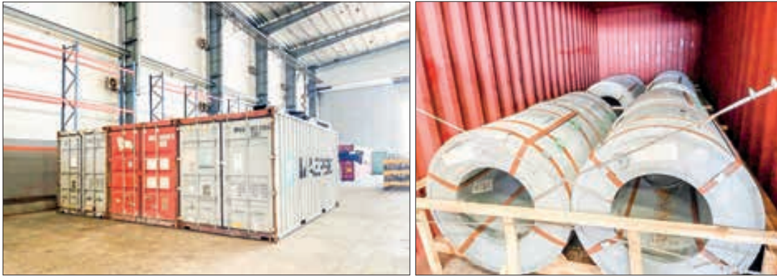
Confiscated illegal commodities at the Asia World container checkpoint.

ON 6 and 8 April, the Unregistered Vehicles Seizure Team of No 2 Traffic Police Force captured an unregistered Toyota Corolla car (estimated value of K3.5 million) near the traffic light of an industrial zone in Hlinethaya township and an unregistered Toyota Crown car (approximately K4.5 million) near Kyatbezey traffic light in Thingangyun township. The action was taken under the Law.