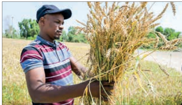
One challenge is a lack of adequate water for irrigation.

Supply chain problems, rising grain prices and inflation