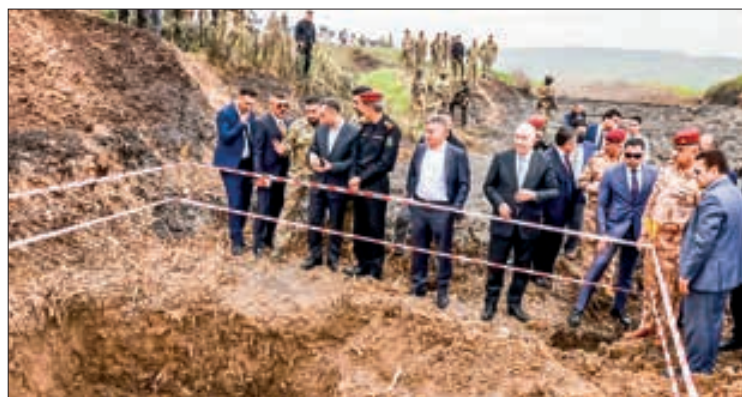
This handout picture released by the office of Iraq's national security adviser Qassem al-Aaraji dated 8 April 2023 shows him (R) and other top Iraqi advisers standing by an impact crater during a visit to the site of an attack that took place the previous day near the airport of Sulaimaniyah in the autonomous Kurdish region of northern Iraq.

Around 400 protesters, many of them middle-aged, walked in