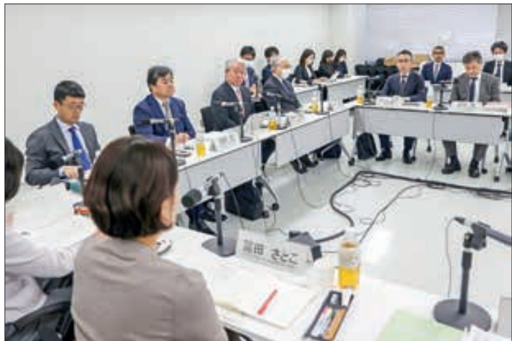
A Japanese government panel tasked with reviewing the country's foreign technical intern programme holds a meeting in Tokyo on 10 April 2023.

Speaking to reporters, Japan International Cooperation Agency President Akihiko Tanaka, who heads the panel, said as many businesses have "no choice but to rely heavily on the labour of foreign trainees," it is important to "create a new system that takes the good parts of the programme, rather than scrapping the entire thing." — Kyodo