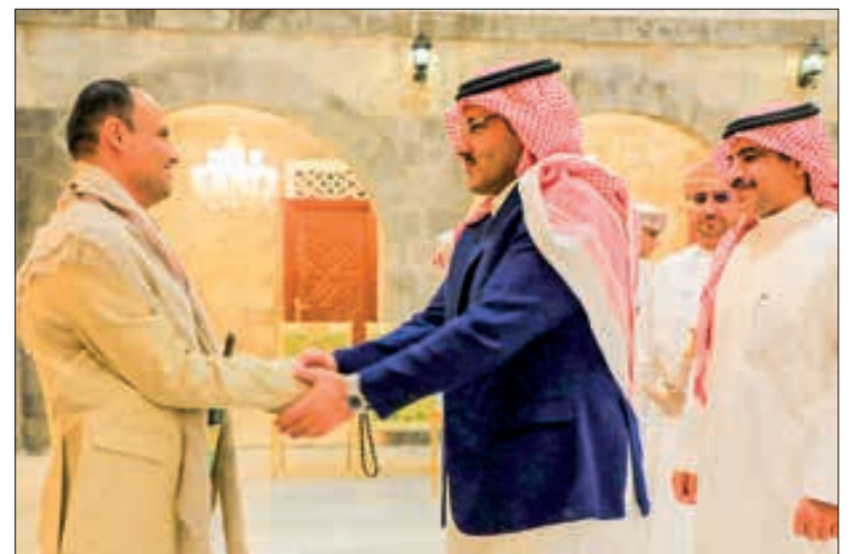
A handout picture released by the Huthi-affiliated branch of the Yemeni News Agency SABA on 9 April 2023 shows the Huthi group's political leader Mahdi al-Mashat (L) welcoming the Saudi ambassador to Yemen Mohammed Al Jaber and a delegation in Sanaa.

The Saudi officials are "in Sanaa to discuss moving forward to create peace in Yemen," said a Yemeni diplomat based in the Gulf region, information that was confirmed by a second dip-