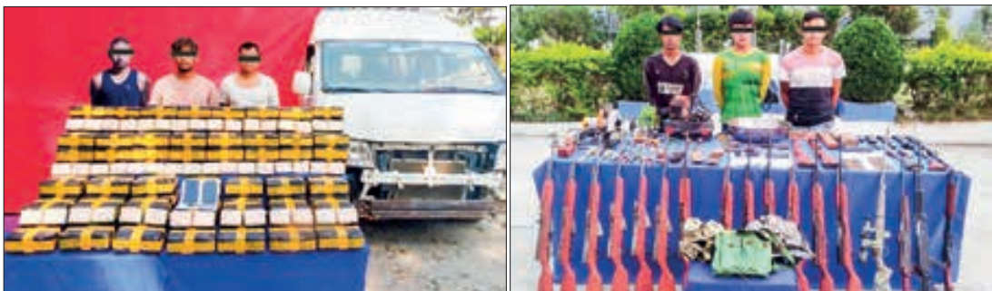
Arrestees are pictured along with seized drugs, arms and ammunition.

K1.1 billion worth of 22 kilogrammes of heroin were captured in Kalay township of Sagaing Region and drugs and ammunition were seized in Shan State, Myanmar Police Force stated.