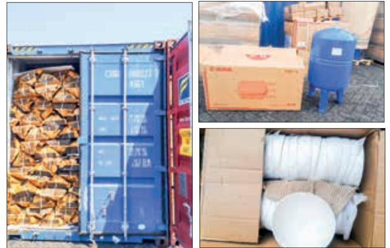
Seized illegal items at the Myanmar Industrial Terminal.

Therefore, 17 arrests (estimated value of K408,442,216) were made on four consecutive days from 6 to 9 April, according to the Illegal Trade Eradication Steering Committee. — MNA/MKKS