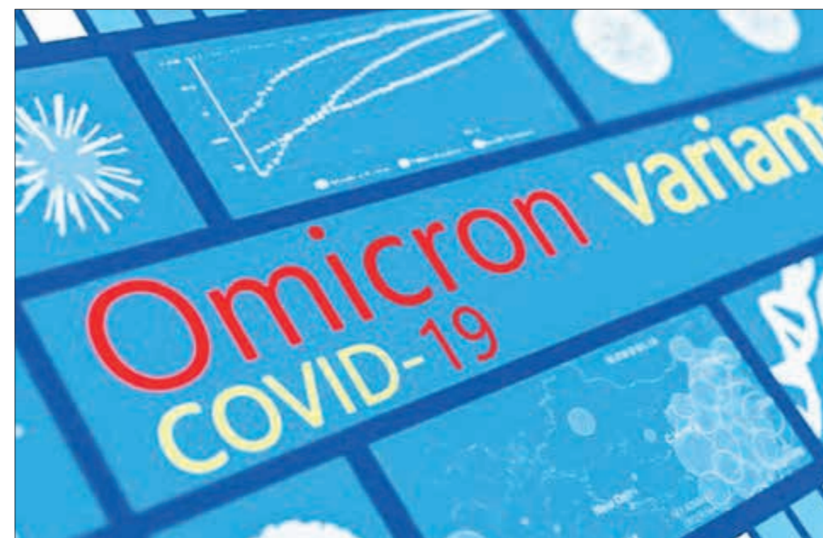
The WHO classified XBB.1.16 as a variant under monitoring on 30 March 2023. PHOTO: REPRESENTATIVE IMAGE/ANI