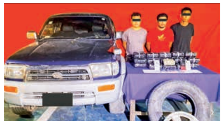
Three offenders are seen together with seized drugs and a vehicle.

Police Force seized a total of 282,750 stimulant tablets worth over K420 million from the car and the offenders admitted the seized drugs to carry from Shan State (South) to Yangon Region to be distributed during Thingyan Festival. Police have taken legal action against the offenders and an investigation is underway to identify the perpetrators of the crime chain. — MNA/MKKS