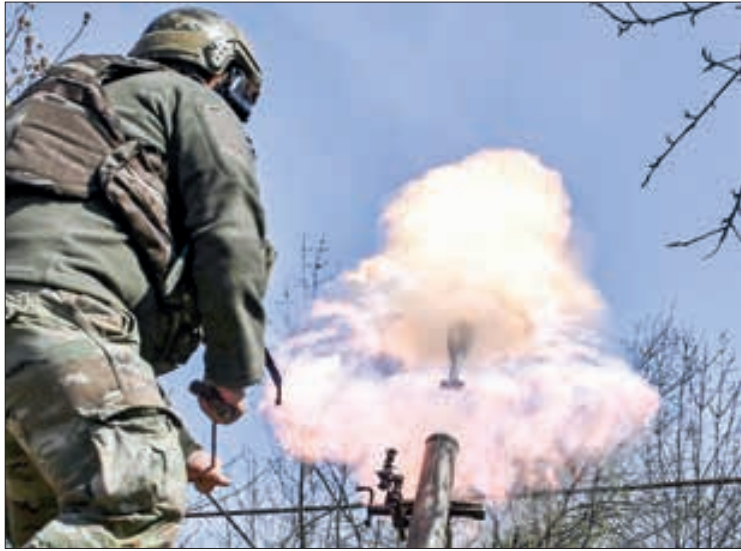
A Belarusian volunteer soldier from the Kastus Kalinouski regiment, a regiment made up of Belarusian opposition volunteers formed to defend Ukraine, fires a 120mm mortar round at a front line position near Bakhmut in the Donetsk region, on 9 April 2023, amid the Russian invasion of Ukraine.