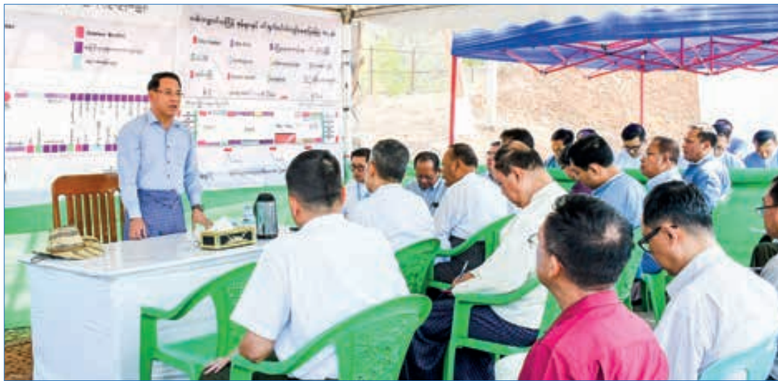
Union Minister U Maung Maung Ohn meets responsible personnel for the Nay Pyi Taw Walking Thingyan yesterday.

Union Minister for Information U Maung Maung Ohn, who is also the chairman of the Nay Pyi Taw Walking Thingyan Organizing Committee, Permanent Secretary U Myo Myint Maung and officials checked the preparations of the Nay Pyi Taw Walking Thingyan. The Union minister then met officials from