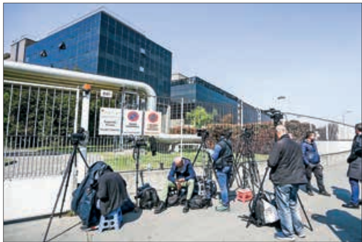
Reporters work outside the San Raffaele hospital on 8 April 2023 in Milan, where former Italian prime minister Silvio Berlusconi is hospitalized for leukaemia and a lung infection.

The three-time premier — who currently serves as a senator and leader of the Forza Italia far-right party — has been in declining health in recent years, marked by frequent hospital stays. He is rarely seen in public. — AFP