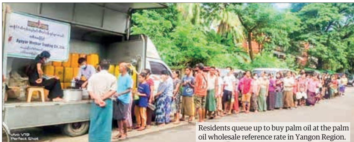
Residents queue up to buy palm oil at the palm oil wholesale reference rate in Yangon Region.

trucks operated by oil importing companies, in coordination with Myanmar Edible Oil Dealers' Association, were back to business in some townships on 17 July to offer palm oil at a subsidized rate. They offer palm oil at a fairer price to the consumers directly depending on the reference price. However, there are limited sources of supply although they directly sell palm oil at a reference rate depending on the volume quota. The domestic consumption of edible oil is estimated at 1 million tonnes per year. The local cooking oil production is just about 400,000 tonnes. To meet the oil sufficiency in the domestic market, about 700,000 tonnes of cooking oil are yearly imported through Malaysia and Indonesia. — NN/EM