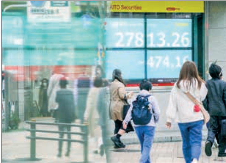
Pedestrians walk past an electronic quotation board displaying the closing numbers of share prices of the Tokyo Stock Exchange in Tokyo on 5 April 2023.

ASIAN equities were mixed Monday in holiday-thinned trade after US jobs data indicated the Federal Reserve would likely have to hike interest rates again but soothed recent worries about a possible recession.