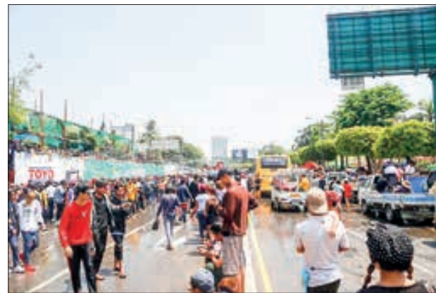
General view of the Thingyan festival in front of Inya Lake on Pyay Road, Yangon, in 2020.

DURING the Thingyan Festival, effective action will be taken against those who drink and drive recklessly, according to a statement from the Yangon Region government.