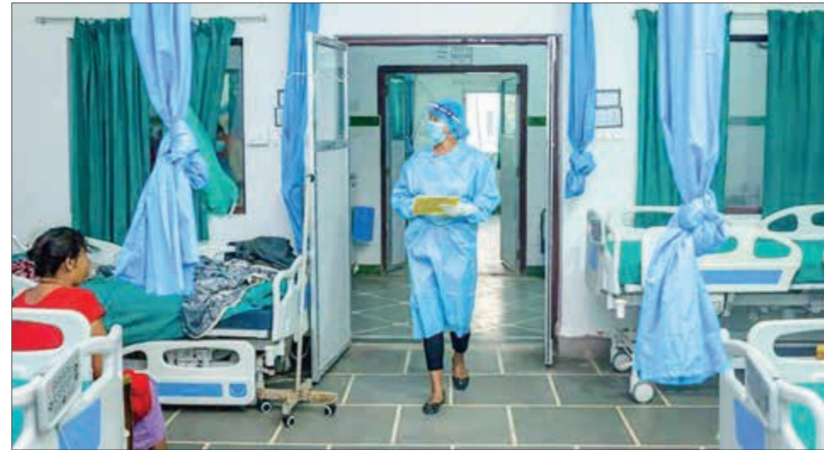
A nurse walks into a hospital ward in Janakpur in Dhanusha District in southern Nepal.

T HE world has witnessed extraordinary health gains since the UN agency was established, including smallpox eradication, the near elimination of polio, and declines in maternal mortality. Millions of young lives have also been saved