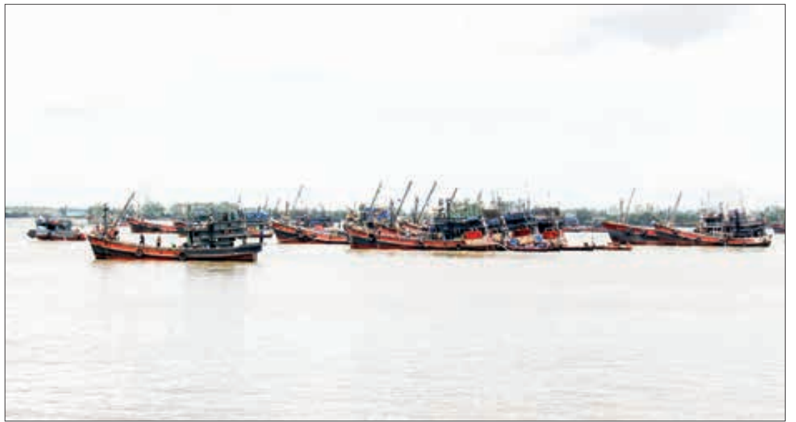
Myanmar ships fishery products to over 40 countries, mostly to Thailand and China. A fleet of fishing vessels and one of the thriving fishery markets are pictured (above and left photos.)

neighbouring countries through Muse, Myawady, Kawthoung, Sittway, Myeik and Maungtau borders.