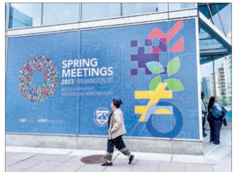
A woman walks past a sign for the 2023 Spring Meetings of the World Bank/International Monetary Fund on the IMF building in Washington, DC, on 5 April 2023. The Spring meetings will take place in person from 10 April to 16 April.

Close to 90 per cent of the world's advanced economies will experience slowing growth