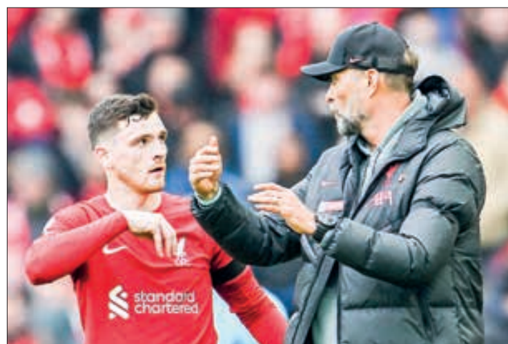
Liverpool's German manager Jurgen Klopp (R) gives instructions to Liverpool's Scottish defender Andrew Robertson during the English Premier League football match between Liverpool and Arsenal at Anfield in Liverpool, north west England on 9 April 2023.

ASSISTANT referee Constantine Hatzidakis will not be involved in any matches while the Football Association investigate whether he elbowed Liverpool's Andrew Robertson.