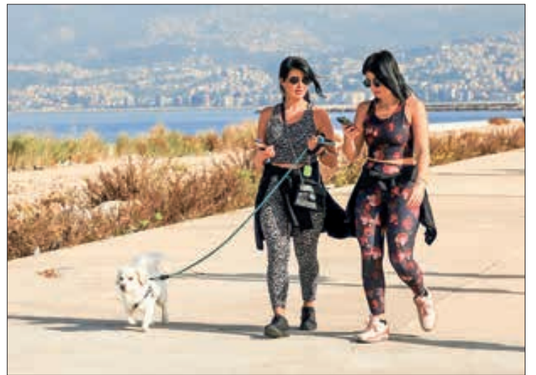
Two young women walk a dog on the coast of the Mediterranean Sea in Beirut, Lebanon, 3 December 2022.