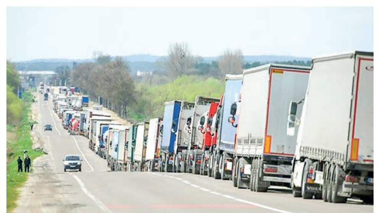
The export of Ukrainian grain and other food products is causing tension in certain eastern European nations as farmers feel the pinch of competition. PHOTO: AFP

The EU was under pressure to act fast after three US banks failed last month and the merger of Swiss investment banking giant Credit Suisse with its regional rival UBS.—AFP