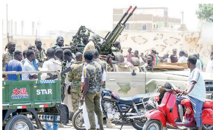
Sudanese greet army soldiers, loyal to army chief Abdel Fattah al-Burhan, in the Red Sea city of Port Sudan on 16 April 2023.

During a four-hour stopover in Managua, Lavrov met with Ortega and his wife, Rosario Murillo, who is also vice-president. The issue of sanctions arose after the US Treasury Department announced that three Nicaraguan judges who played a role in stripping 316 Ortega opponents of their citizenship in February had been placed on a sanctions blacklist. "Today, the United States sanctioned three judges because they have applied justice against terrorists. We already have hundreds of fellow state officials sanctioned, but we are no longer afraid of that," Ortega said in a dialogue with Lavrov broadcast on state television.—AFP