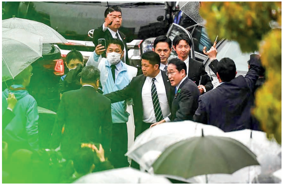
Japan's Prime Minister Fumio Kishida is escorted by security officers at an election campaign event in Chiba prefecture on 15 April, hours after being evacuated unharmed from the scene of an apparent "smoke bomb" blast at another event earlier that day.

Nakagawa was standing close to Abe when he was fatally shot last July during a stump speech in the city of Nara last July ahead of the upper house elections. "There may have been