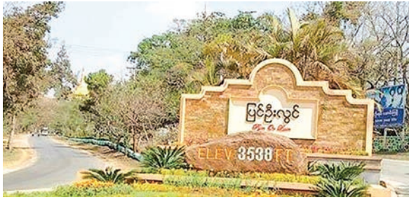
The entrance sign of PyinOoLwin.