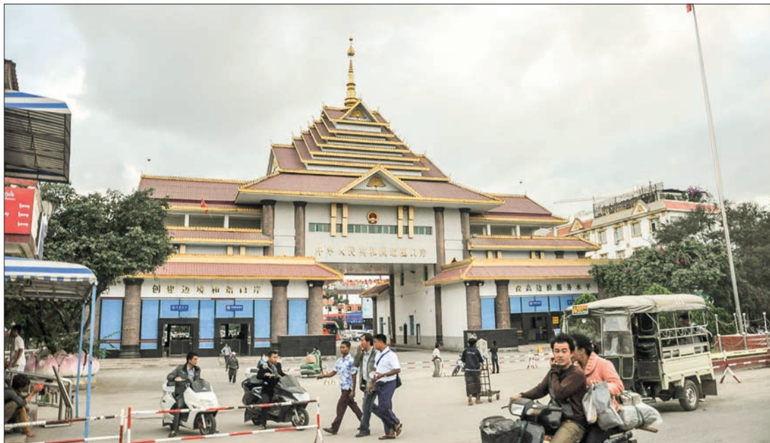
People walk past the Sino-Myanmar border.

The forms can be downloaded on https://www.doa.gov.mm , https://ppd.doa.gov.mm and www.umfcci.com.mm . Additionally, they can contact the