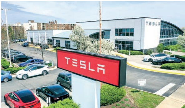
A sign marks the location of a Tesla dealership on 19 April 2023 in Schaumburg, Illinois.

Japan had a trade surplus of 6.65 trillion with the United States but ran a record deficit of 6.81 trillion yen with China. —Kyodo