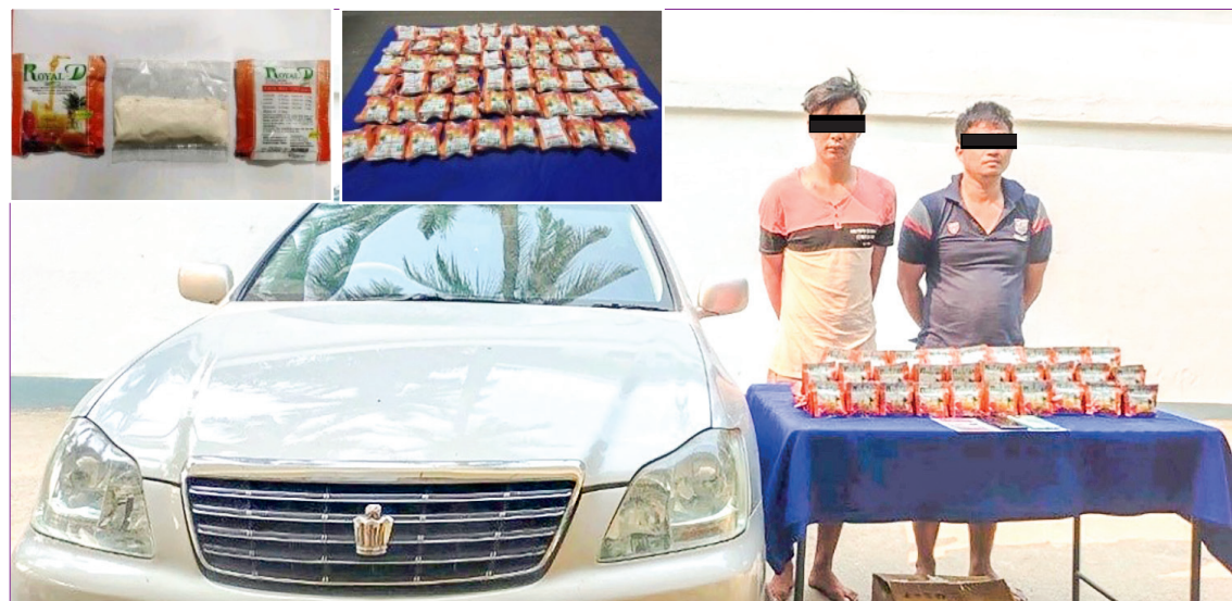
Two offenders are seen together with seized drugs and a saloon.

A total of 10.03 kilogrammes of Happy Water worth over K1.1 billion were carried in 295 plastic bags in the car. Police have taken legal action against the offenders and an investigation is underway to identify the perpetrators of the crime chain. — MNA/MKKS