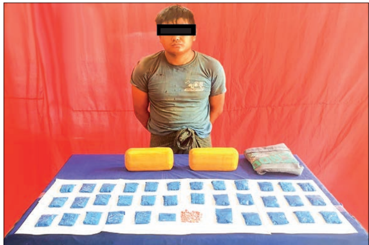
An arrestee is pictured along with confiscated drugs.

A combined team consisting of members of the Anti-Drug Police Force stopped and searched a motorbike driven