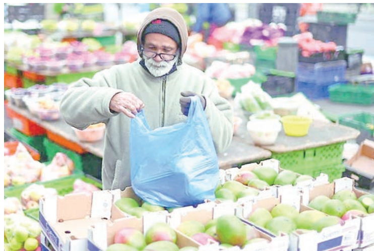
UK food price inflation rocketed in March to 19.1 per cent, hitting the highest level since August 1977. A man purchases fruit on a market stall in London.

Despite the efforts, official data this week showed that pay continues to grow more slowly than prices.—AFP