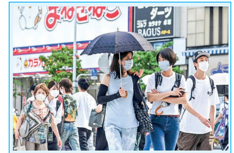
People cross a street in the Shinjuku district of Tokyo on Tuesday.

As at its previous meetings, it will decide whether the virus still constitutes a public health emergency of international concern (PHEIC) — the highest level of alert that the UN health agency can sound.