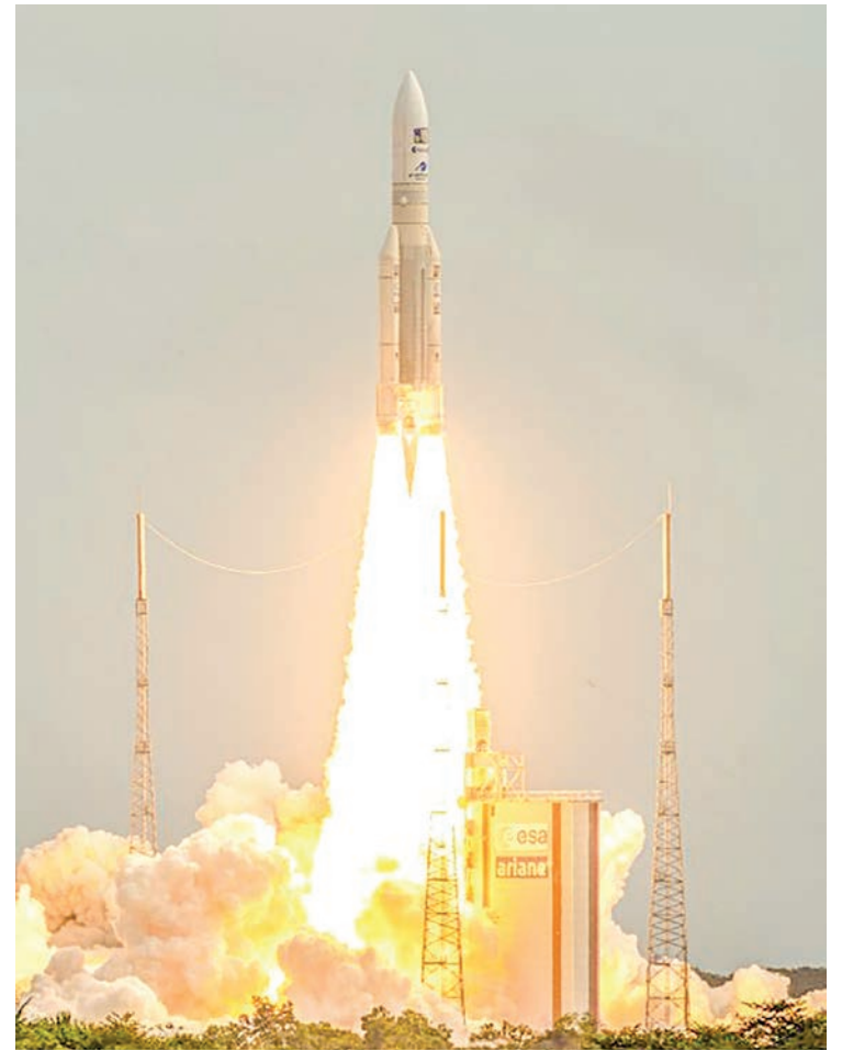
The European Space Agency's JUICE probe blasts into space on 14 April 2023 aboard an Ariane 5 rocket from Europe's spaceport in Kourou, French Guiana, on a mission to explore Jupiter's icy moons.

Towards the space summit at the end of the year, I think