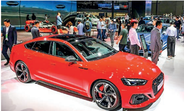
People visit a booth at the Shanghai Auto Show.

The company announced on Tuesday that its core operations would be carbon neutral by 2025, with the rest following in 2035.—AFP