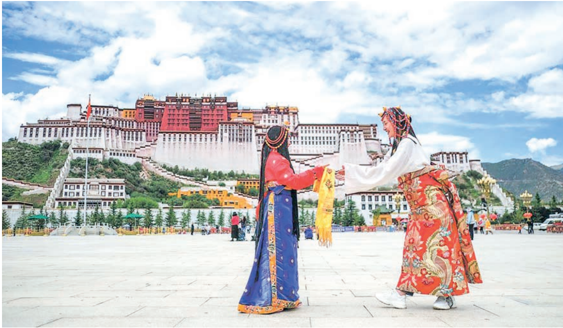
Tourists visit the Potala Palace in Lhasa, Tibet autonomous region.