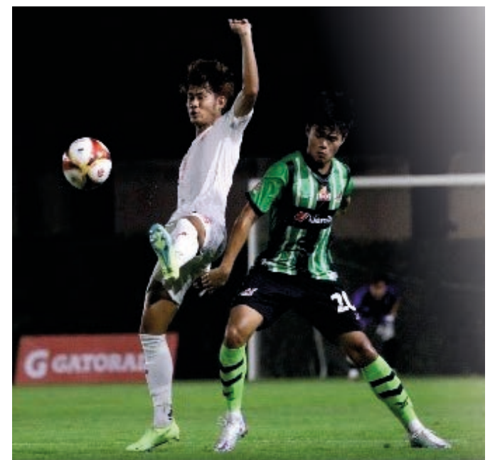
A Myanmar U-22 team player (white) prepares to control the ball during the previous friendly match against the Thai Club in Thailand.

The Myanmar U-22 team is currently preparing for training with 27 preliminary players. — Ko Nyi Lay/KZL