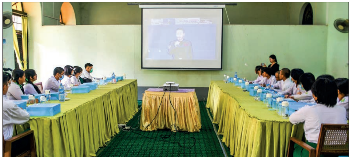
The SCO Students Talk Taikonauts of Shenzhou 15 is underway, attended by Myanmar students virtually yesterday.

Students from countries such as Russia, China, India, Kazakhstan, Kyrgyzstan, Pakistan, Tajikistan, Uzbekistan, Iran, Belarus, and Mongolia participated in the Shanghai