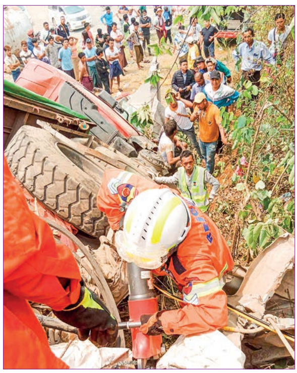
An overturned 22 wheeler truck was seen on the Muse-Kyinsankyawt Road on 16 April 2023.

In the 2022 Thingyan period, 37 traffic accidents occurred across Myanmar, leaving 11 dead and 65 hurt.