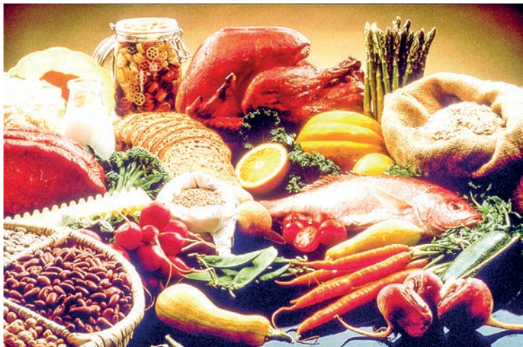
Vitamin D helps the body absorb calcium, which is essential for bone health, but it also helps stimulate the maturation of cells, Campbell said.

A study has found that vitamin D can play role in prostate cancer disparities.