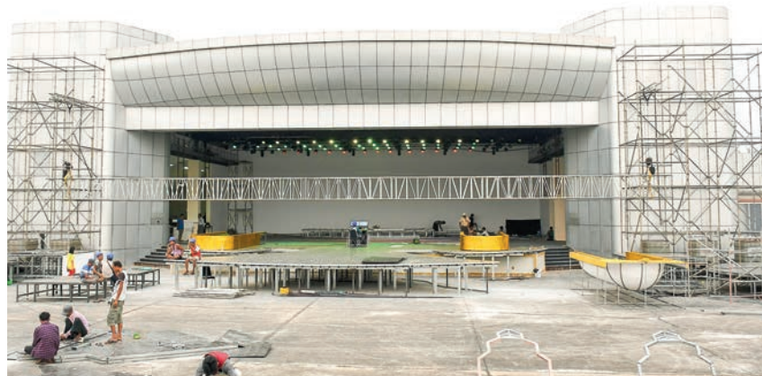
Union Minister U Maung Maung Ohn inspects preparatory work for the Myanmar Motion Picture Academy Award Event yesterday.

During the meeting, Union Minister for Information U Maung Maung Ohn, in his capacity as Chairman of the Organizing Committee on Myanmar Motion Picture Academy Award Event said the ceremony for 2019, 2020 and 2022 is a sign of drive to revive the development of fine arts. It also lures the public interest most. Moreover, the preparations are being made in accordance with the wishes of outstanding artistes. All the artistes should join the event and the Fashion Award will be selected among the attendees.