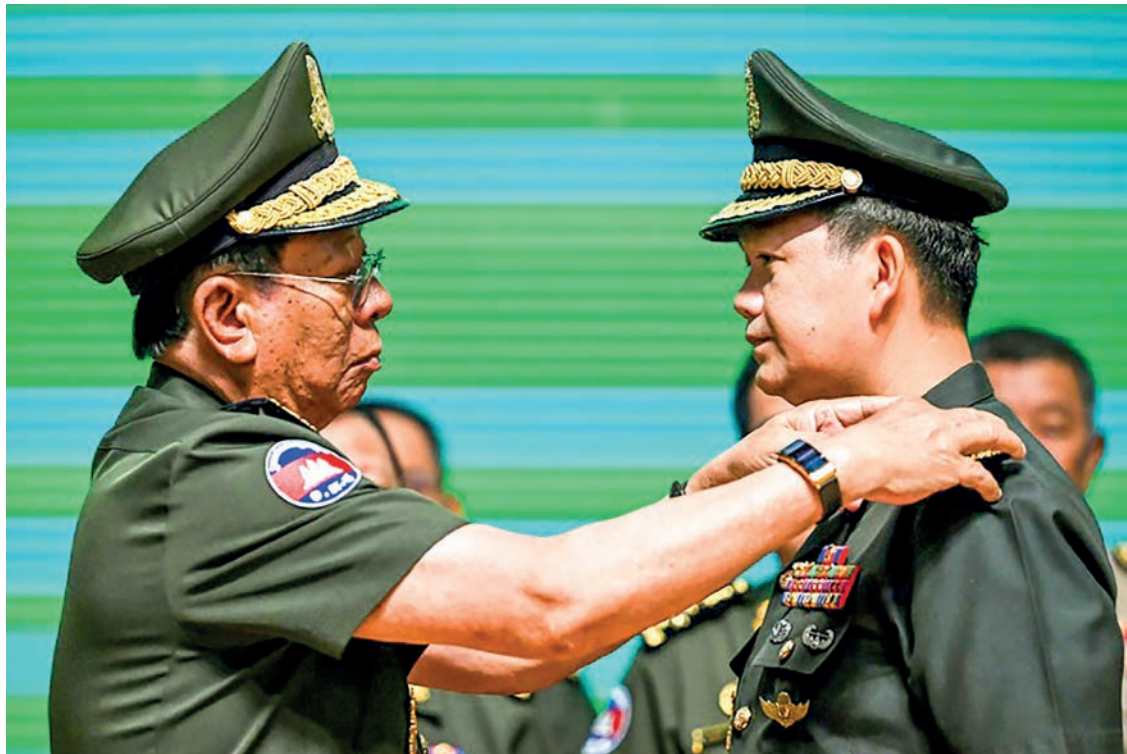
Tea Banh (left) said Hun Manet (right) has strived 'to serve the nation, military and Cambodian people'.

Hun Sen, who has ruled the country for 38 years, has repeatedly hinted at stepping down but has said he will run for office again in the coming election.