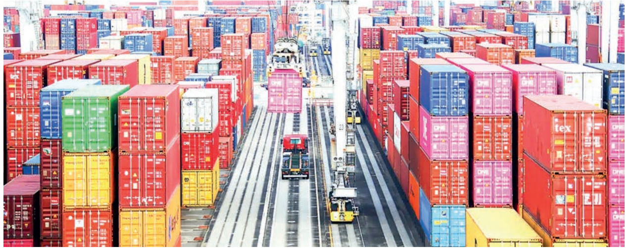
Container port in operation in Nagoya, Japan.

JAPAN'S trade deficit roughly quadrupled to a record 21.73 trillion yen ($160 billion) in fiscal 2022 ended March, as increased energy costs and a weaker yen led imports to grow far more than exports, the Finance Ministry said Thursday.