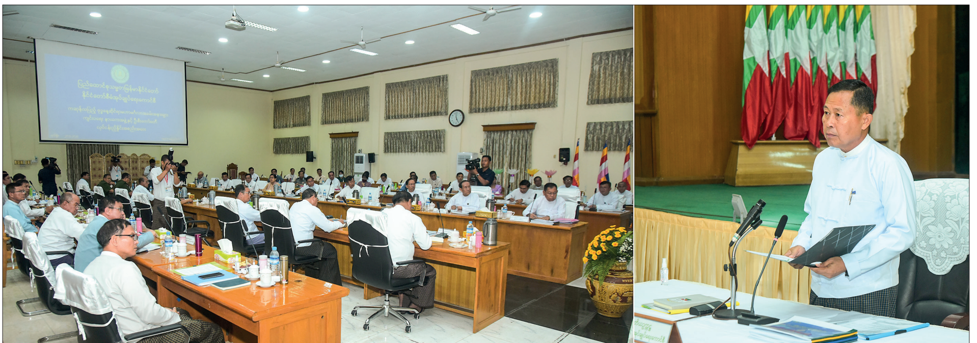
State Administration Council Vice-Chair Deputy Prime Minister Vice-Senior General Soe Win presides over the coordination meeting for the Buddha Day Gala Ceremony on the full moon of Kason in Nay Pyi Taw on 20 April 2023.

V ICE-CHAIRMAN of the State Administration Council Deputy Prime Minister Vice-Senior General Soe Win who is also serving as Chairman of the Patron Committee of the Organizing Buddha Day Gala Ceremony on Kason Full Moon Day delivered an address at the coordination meeting between the patron committee and the leading committee at the Ministry of Religious Affairs