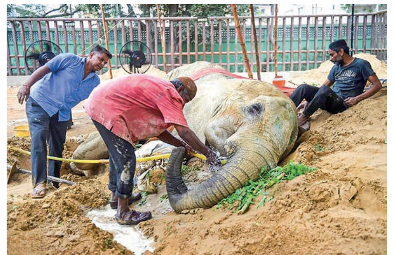
The elephant Noor Jehan may have to be euthanized after collapsing in her pen at Karachi Zoo and failing to stand for days.

Pakistan's zoos are frequently accused of disregarding animal welfare, and in 2020 a court ordered the only facility