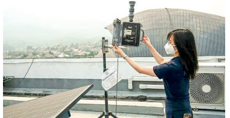
A searcher checking an air quality sampler atop the National Astronomical Research Institute of Thailand (NARIT) in Chiang Mai.

Smoke from forest fires and farmers burning crop stubble have polluted the air in parts of the country, according to experts. Thailand is home to more than 70 million people and its poor air quality has become a hot button issue ahead of the country's 14 May election, with the incumbent government accused of not doing enough to tackle the problem.—AFP