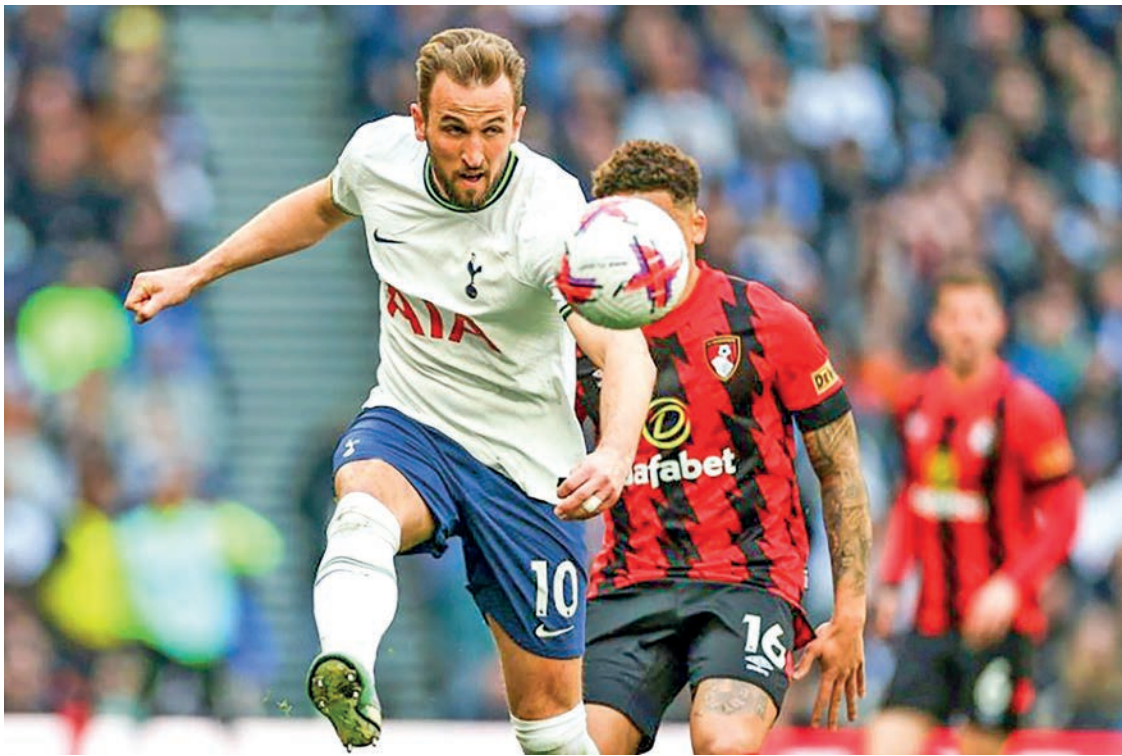
Harry Kane has scored 23 Premier League goals this season.

TOTTENHAM chairman Daniel Levy says Harry Kane can still fulfil his ambition of winning a trophy with the club but believes being a “legend” is also important.