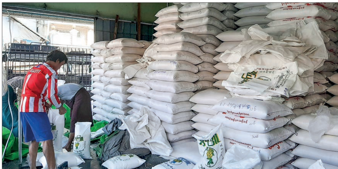
Workers organize rice bags at the rice depot.

Each household can buy only one bag. The traders and retailers are not entitled to buy them. — NN/EM