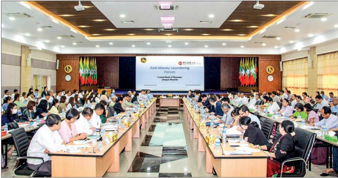
The Anti-Money Laundering and Counter-Financing of Terrorism Forum in progress yesterday in Yangon.

JOINTLY organized by the Central Bank of Myanmar and Bank of China (Hong Kong) Yangon Branch, the Anti-Money Laundering and Counter-Financing of Terrorism Forum was held at the Central Bank of Myanmar in Yangon yesterday.