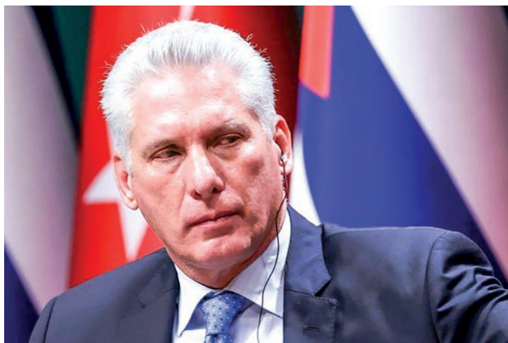
Cuban President Miguel Diaz-Canel has clinched a second five-year term at the helm of the communist island.

CUBA'S President Miguel Diaz-Canel vowed to "resolve inefficiencies" after clinching a second five-year term on Wednesday in a parliamentary vote for which