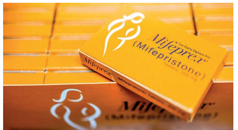
Mifepristone is one component of a two-drug regimen that can be used through the first 10 weeks of pregnancy. It has a long safety record, and the FDA estimates 5.6 million Americans have used it to terminate pregnancies since it was approved.

Those efforts bore fruit earlier this month when a federal judge said the FDA approval was flawed and the drug should be withdrawn. An appeals court blocked any ban on the pill, but imposed tough restrictions on access, after which the baton was handed to the Supreme Court which has until midnight Wednesday to step in.—AFP