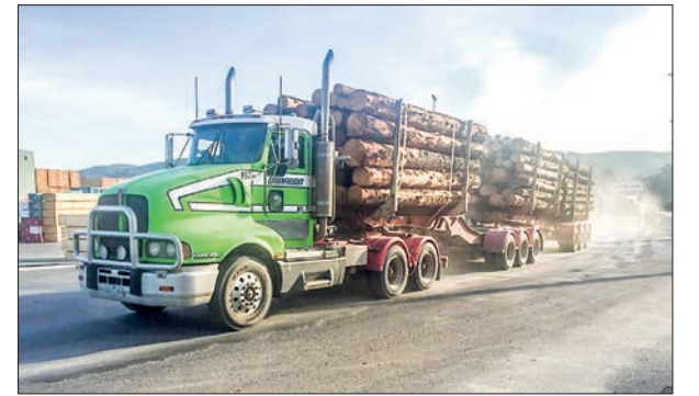
The timber industry in Australia is an important sector that supports both domestic consumption and international trade.

"Yesterday, the Chinese Customs have formally notified the Australian Minister of Agriculture that starting from today, China will resume import of Australian timber," Xiao said at a press conference in Canberra. — AFP