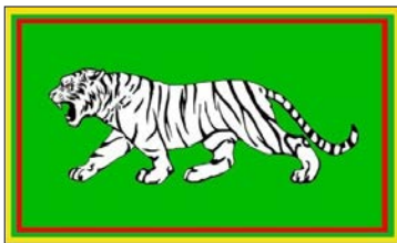
Flag of Shan and Ethnic Democratic Party (White Tiger Party)

(White Tiger Party), with its headquarters located at No 43-44 (8-A), MMM Condo, Strand Road, Ahlon Township, Yangon Region, submitted an application to the Union Election Commission on 18-5-2023 that the party's name, flag and emblem will be used as described.