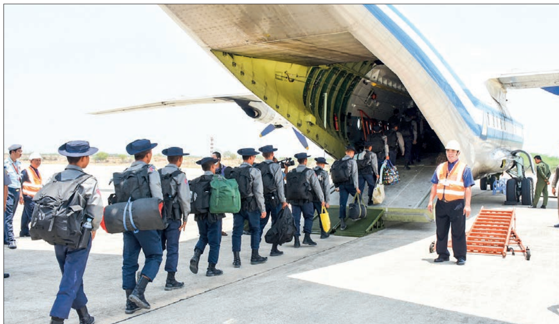
MPF members are pictured lining up for boarding the Tatmadaw plane.