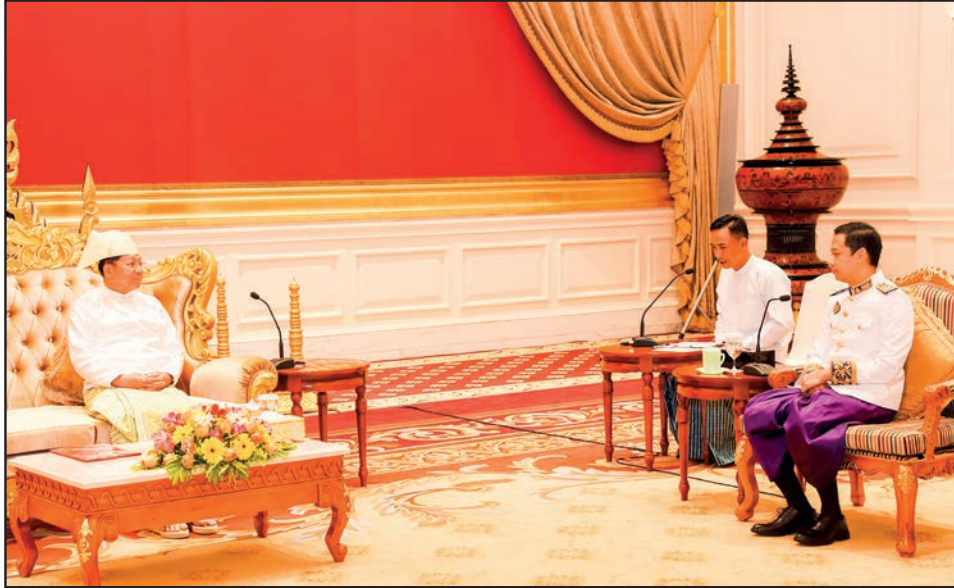
The Senior General receives the Cambodian Ambassador.