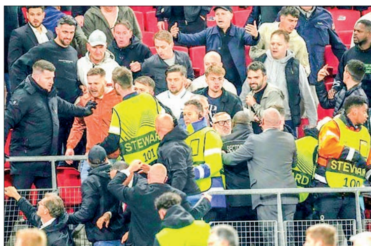
Supporters of Dutch club AZ Alkmaar clashed with riot police and West Ham fans.

West Ham stars including Michail Antonio, Said Benrahma, Aaron Cresswell and Flynn Downes climbed over the advertising hoardings in a bid to stop the trouble. Moyes, whose 87-year-old father was at the match, said: "I can't explain what happened and why it happened.