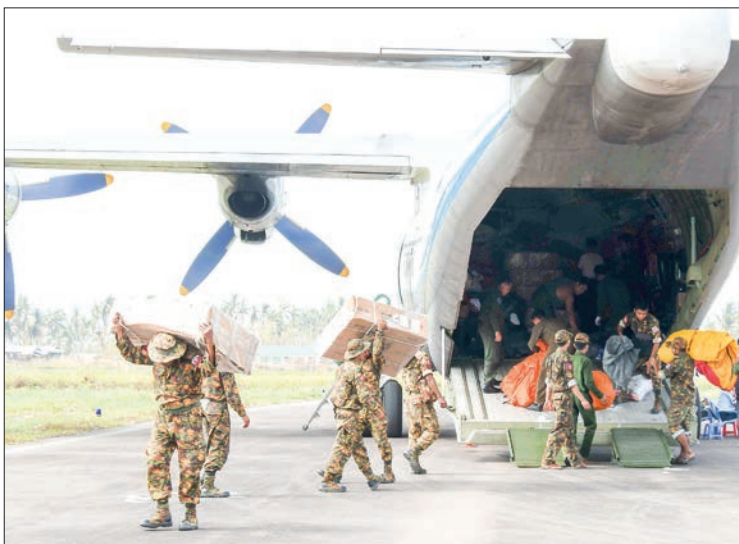
Relief goods are loaded onto the Tatmadaw aircraft.

Plans are underway to distribute the items to cyclone victims as quickly as possible. — MNA/KTZH