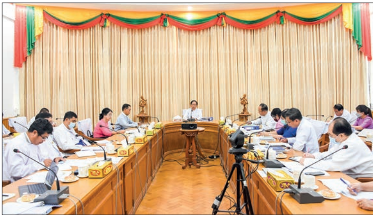
Union Minister Dr Thet Khaing Win chairs the coordination meeting on healthcare services for storm-hit areas in Nay Pyi Taw.

UNION Health Minister Dr Thet Khaing Win inspected the damage after Cyclone Mocha and repairing works at Food and Drugs Administration Department Office in Sittway Township together with relevant officials yesterday.