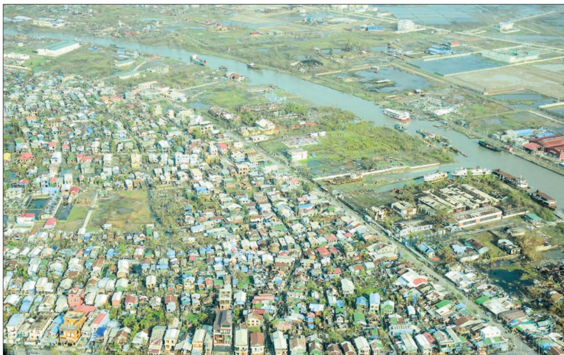
An aerial view of Mocha-hit areas in Rakhine State.

departments concerned should collect the correct data in respective townships to distribute the relief items systematically. The SAC released the announcements declaring disaster-hit regions according to Section 11 of the Natural Disaster Management Law. Moreover, the senior military officers were assigned duties in these areas to carry out the rehabilitation processes. The people of respective townships should work together to be better than the original situation.