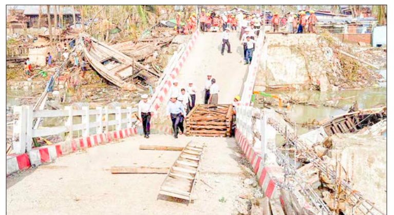
Union Construction Minister U Myo Thant views the temporary Bailey bridge.

Subsequently, the Union minister and party proceeded to the construction site, located at milepost No 2/4 along the Sittway-Palinpyin Road, where the construction of a 140-foot-long and 18-foot-wide temporary Bailey bridge was underway to replace the Thechaung bridge that had suffered damage in the storm. — MNA/KZW