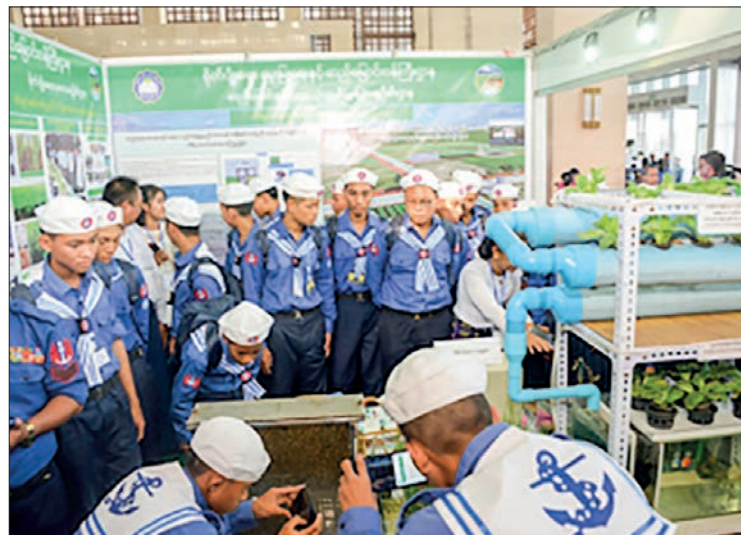
Trainees are seen paying observation tours round the exhibition booths at the conference (above and below photos).