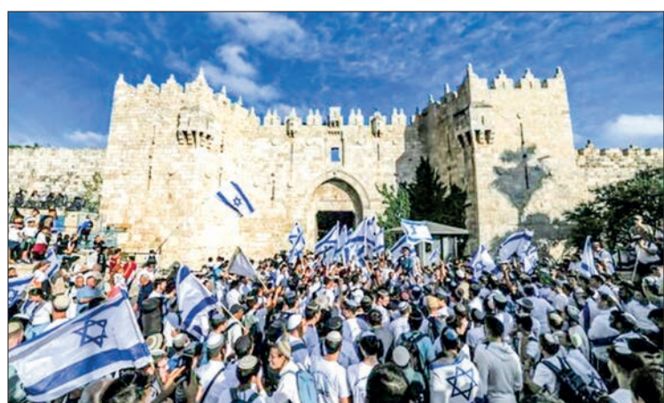
Thousands of Israeli nationalists took part in the annual flag march.

summit would give the tourism sector a much-needed boost and help youth to earn their livelihood. — ANI