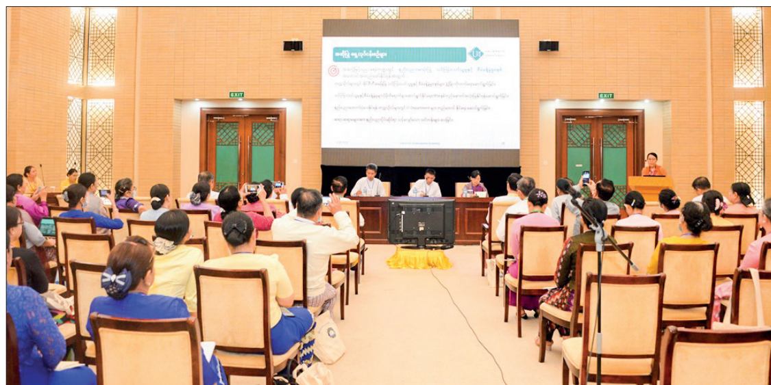
The paper-reading session of the Myanmar National Education Conference 2023 in progress for the second day yesterday.

Resource persons also read their papers on the enhancement of public awareness to know learning opportunities for technical vocation and training, the extended opening of training schools to give technical, vocational and training in post-KG+9 education, appointment of teachers for post-KG+9 education and enhancement of capacity, further strengthening of curriculums, assessment, qualification guarantee and management in the technical sector of the post-KG+9 education, further strengthening of curriculums, assessment, qualification guarantee and management in agriculture and livestock sector of the post-KG+9 education, and recognition certification for basic education high school by the Ministry of Education and creation of opportunities for those who completed technical, agriculture and livestock breeding high schools and vocational training schools to learn