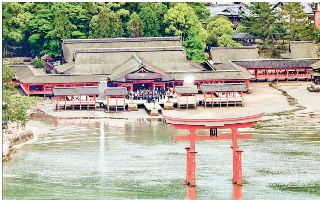
Photo taken from a helicopter on 19 May 2023, shows the World Heritage-listed Itsukushima Shrine on Hiroshima Prefecture’s Miyajima Island.

The leaders posed for the traditional summit family photo before the large “torii” gate of the Itsukushima Shrine. “Gagaku” music traditionally performed there was played as they listened to a briefing on the history of the shrine, which, according to its website, was established on the site in 593.