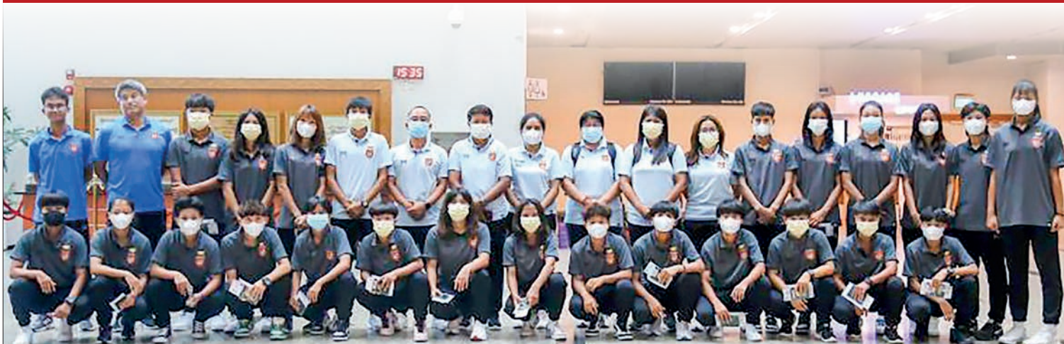
The Myanmar U-20 Women's Football squad is seen at Yangon International Airport before departure for Japan.

THE Myanmar Women's U-20 team will travel to Japan for 10 days of training with the support of AYA Bank to prepare for the second-round qualifiers of the 2024 Asian Women's U-20 Championship, according to the Myanmar Football Federation.