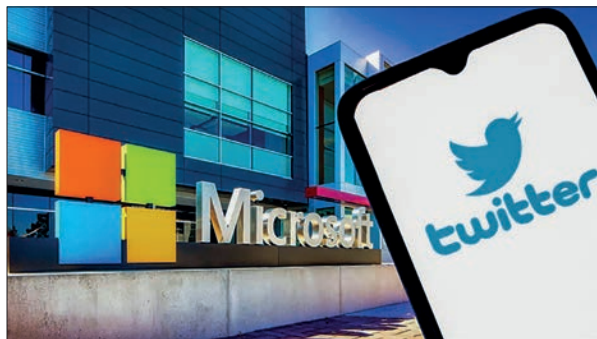
Twitter on Thursday accused Microsoft of breaking the social network's rules for developers who access the platform's data. PHOTO: AFP

Microsoft stopped accessing Twitter data in April, opting not to pay fees Musk demanded developers pay for APIs (application programming interfaces) that engage with the platform, according to the letter. — AFP