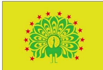
Flag of Democratic Party.