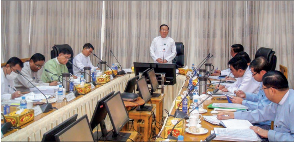
Deputy Prime Minister U Win Shein chairs the third National Economic Promotion Fund Management Committee meeting yesterday.

THE 3/2023 meeting of the National Economic Promotion Fund Management Committee was held at the meeting hall of the Ministry of Planning and Finance in Nay Pyi Taw yesterday morning.