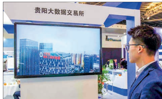
A visitor checks out a promotional video of the Global Big Data Exchange, China's first such facility, during a high-tech expo in Shanghai.

held in Guiyang since 2015 and is the first of its kind in China, serving as a communication platform for vital achievements in the big data industry. — Xinhua