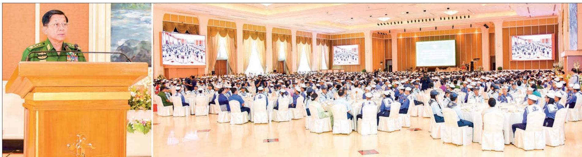
State Administration Council Chairman Commander-in-Chief of Defence Services Senior General Min Aung Hlaing meets trainees from basic and advanced maritime youth course 1/2023 and basic senior and junior aviation youth course 1/2023 in Nay Pyi Taw on 19 May 2023.

THE government of the State Administration Council in its tenure has adopted a point of the social objectives: To comprehensively promote the education sector to make it capable of producing the human resources necessary for building a modern, developed, and progressive democratic nation. The government is striving for strengthening the human resources of the State to secure achievement in all sectors so as to ensure high morality of youths, vitalize patriotic spirit and forge a cooperative spirit through the team spirit. If so, the future State will have continuous progress with utmost efforts of the human resources, said Chairman of the State Administration Council Commander-in-Chief of Defence Services Senior General Min Aung Hlaing at the meeting with trainees and instructors from basic and advanced maritime youth course 1/2023 and basic senior and junior aviation youth course 1/2023 at Zeyathiri Beikman in Nay Pyi Taw yesterday afternoon.