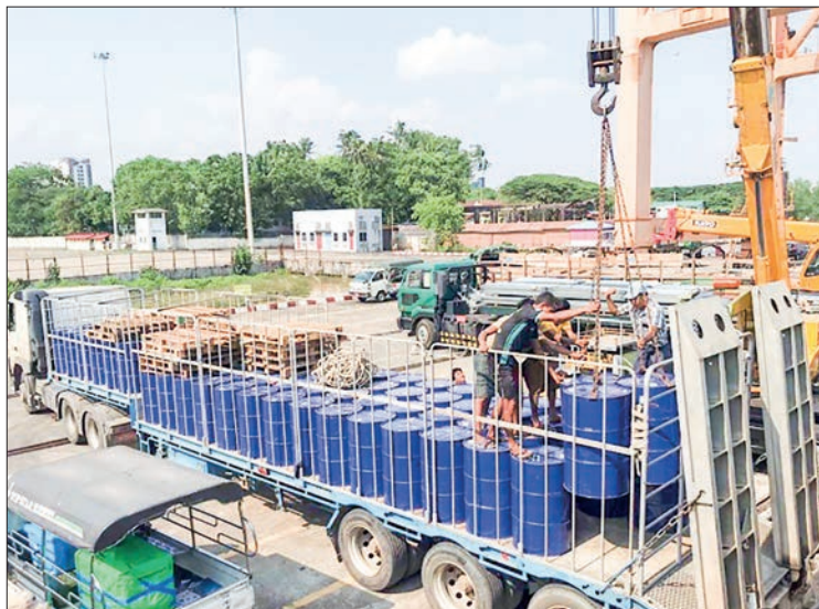
Various kinds of relief and rehabilitation materials and equipment are seen being loaded onto the vessels to transport them to Rakhine State (above and below photos).

FOR use in Rakhine state disaster relief operations, the Ministry of Defence, the Ministry of Transport and Communications, the Ministry of Cooperatives and