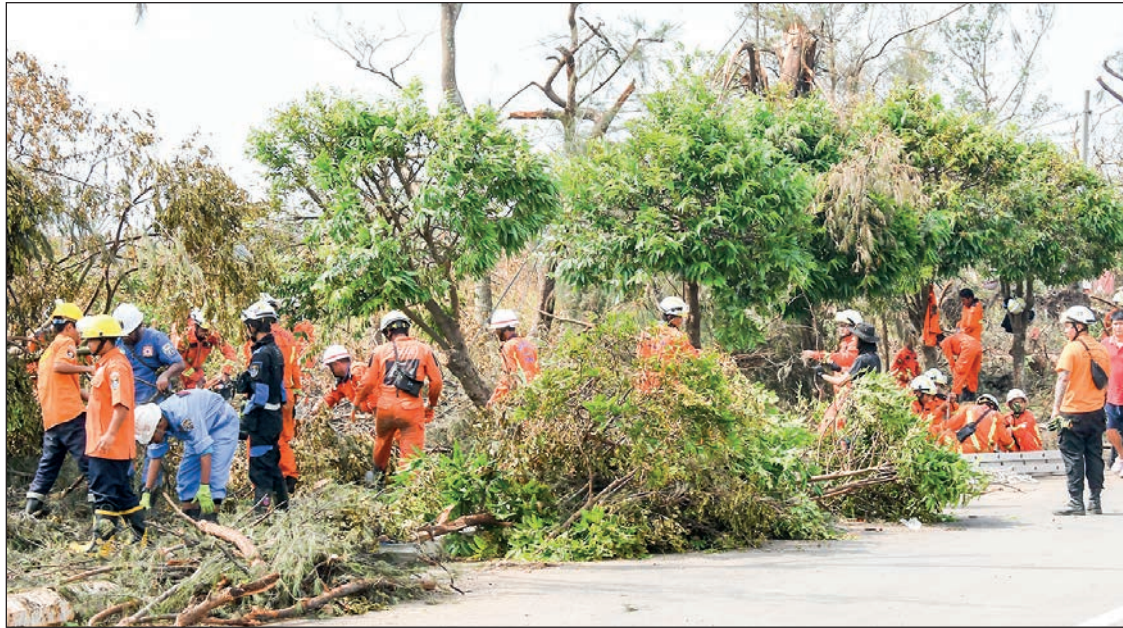
Collective cleanup is underway on roads in Sittway.

In repairing damaged buildings in Sittway, schools and universities are being restored as a high priority before the opening of schools on 1 June. The 500-bed general hospital and religious buildings have also been re-