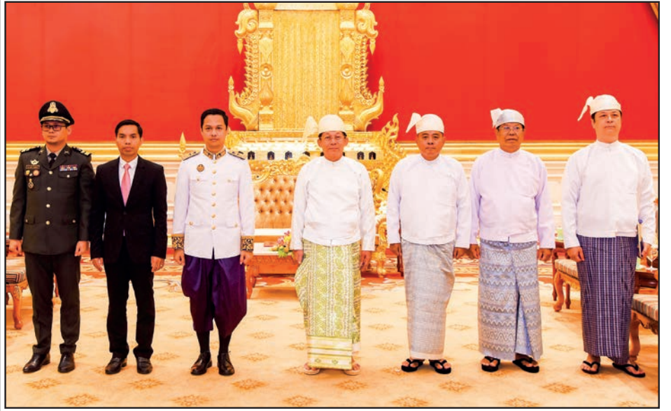
The Senior General poses for the documentary group photo.