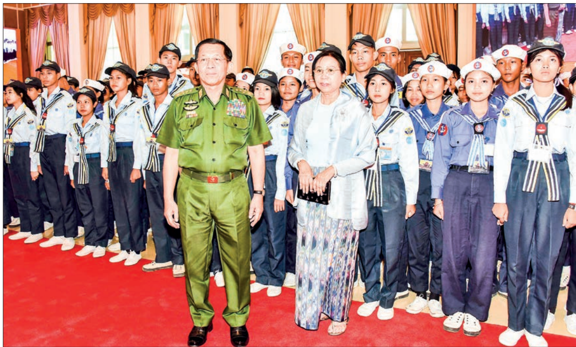
The Senior General and his wife pose for the documentary photo with trainees.

The Senior General urged all trainees to apply experiences