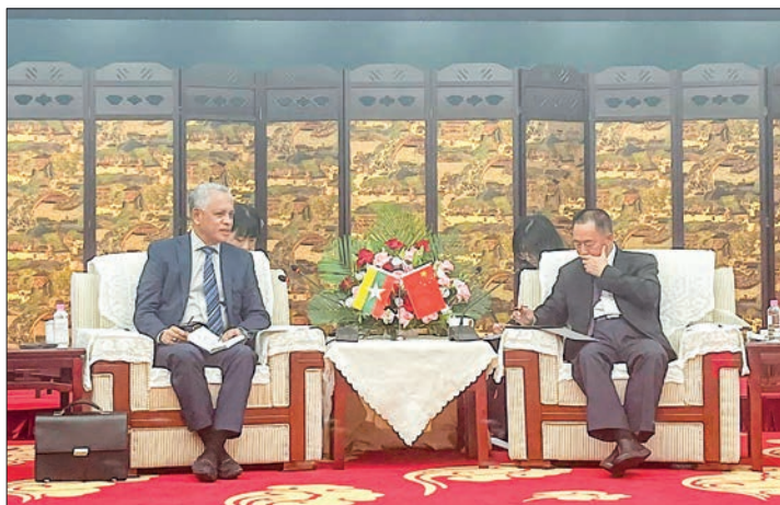
Union Minister U Aung Naing Oo meets Lincang Mayor Mr Du Jianhui.

In addition, the Union minister and the delegation met CPC Lincang Municipal Committee Secretary Mr Zhang Zhizheng and Lincang Mayor Mr Du Jianhui together with officials and openly discussed matters on border trade development, increasing investment, promotion of the