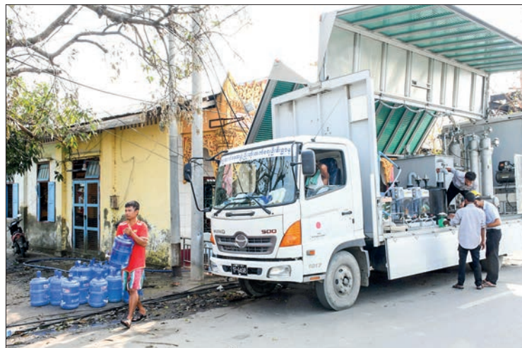
Drinking water is distributed to residents in Sittway.

as soon as possible, the employees of the relevant ministries replaced and erected the lamp posts that had fallen due to the storm using large machines, performed transmission of electric cables, cleared dangerous power lines, replaced and installed new communication cables to restore communication and re-installed