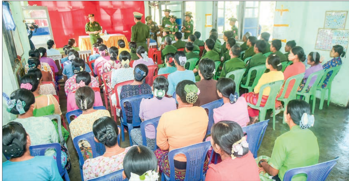
The Vice-Senior General meets Tatmadaw members and families of Kyauktaw station (above and below photos).

During the meeting, the Vice-Senior General said he came to the disaster-affected areas to check the rehabilitation activities in person according to the directive of the Prime Minister. It is such as glad case as the residents conducted rehabilitation processes for their townships,