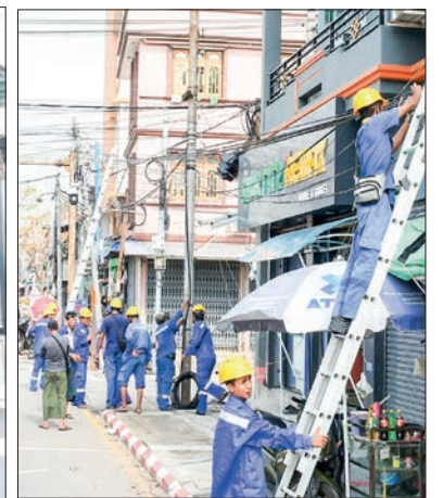
Communication cables are re-installed.