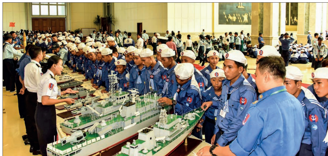
Trainees are keen on the scale models of navy ships.

Before the ceremony, the trainees viewed round arms produced by the Myanmar Tatmadaw, uniforms and communication devices used in Tatmadaw (Army, Navy and Air), scale models of naval vessels of the Tatmadaw (Navy), naval equipment, scale models of aircraft and helicopters used by the Tatmadaw (Air), pilot uniforms and equipment, and flying of planes with the use of simulators. — MNA/TTA