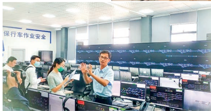
A faculty member lecturing at Kunming Railway Vocation and Technical College.

I went on my journalism field trip on the China-Laos Railway in June at the invitation of the People's Republic of China, thereby having a great opportunity to visit the Kunming Railway Vocational and Technical College.