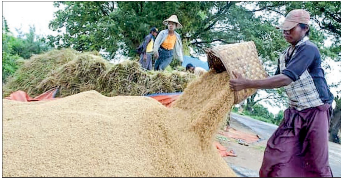
A photo shows harvested monsoon paddy being winnowed in the farm.

Trial operations of warehouse storage situations in the