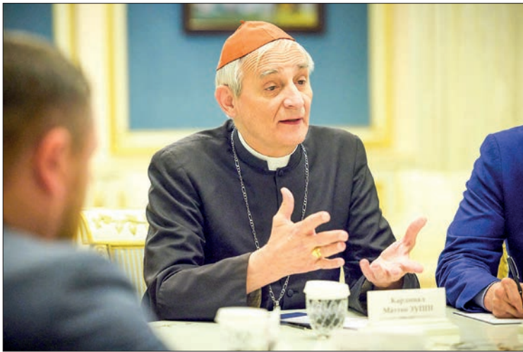
This handout picture taken and released by the Ukrainian Presidential press service on 6 June 2023, shows Pope Francis' peace envoy to Ukraine, Cardinal Matteo Zuppi, speaking as he attends a meeting with Ukraine's president (not pictured) in Kyiv, amid the Russian invasion of Ukraine.

POPE Francis' peace envoy to Ukraine will visit Moscow on Wednesday and Thursday, just weeks after visiting Kyiv, the Vatican said. It will be the first visit to Moscow by a senior Vatican official since Russia invaded Ukraine in February 2022.