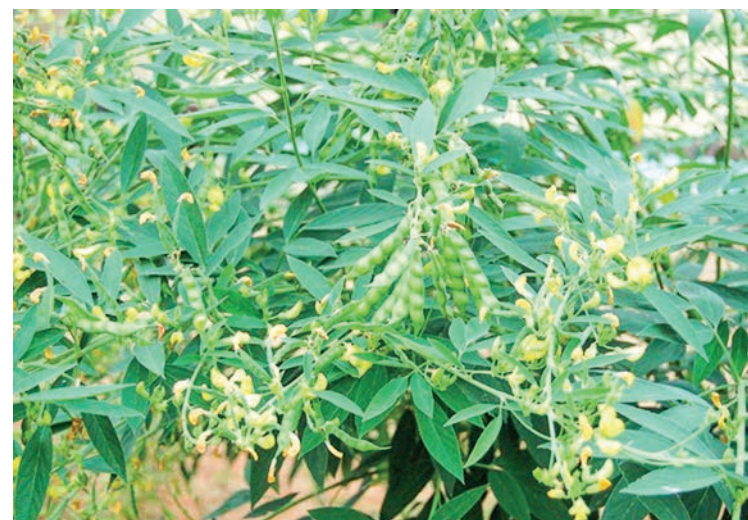
Pigeon pea plants bearing beans.

India has growing demand and consumption requirements on black gram and pigeon peas. According to a Memorandum of Understanding between Myan-