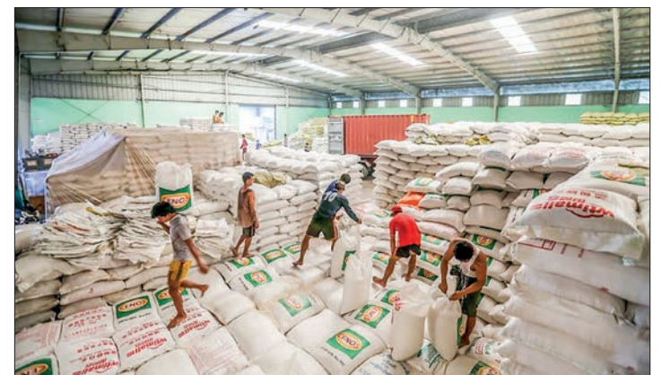
Workers carry packages of rice at a warehouse in Yangon, Myanmar, 8 March, 2023. Myanmar exported 106,855 tonnes of rice in February this year, as compared to 171,811 tonnes of rice exported in January.

Myanmar has been exerting concerted efforts to increase 10 per cent yearly in the rice export sector. To raise income of foreign currency, it has been prioritizing exportation of high-grade rice and boosting export volume, MRF stated.—NN/EM