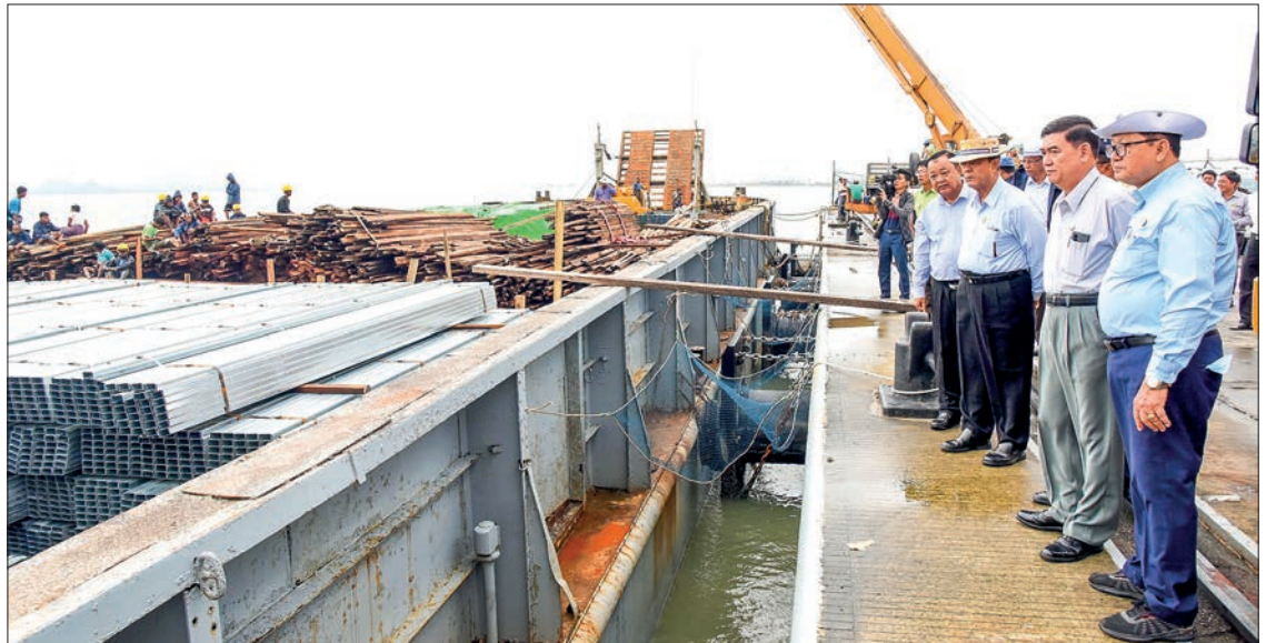
Union Minister for MoCRD U Hla Moe views unloading of construction materials from vessels at port of Sittway in Rakhine State on 27 June.

He attended the coordination meeting at Rakhine State government office and discussed the rehabilitation processes.