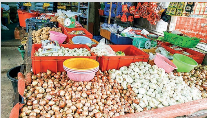
Kitchen food products are displayed at grocery store.

During the last week of June 2023, due to the instability of financial market, commodity prices fluctuated rapidly. — TWA/CT