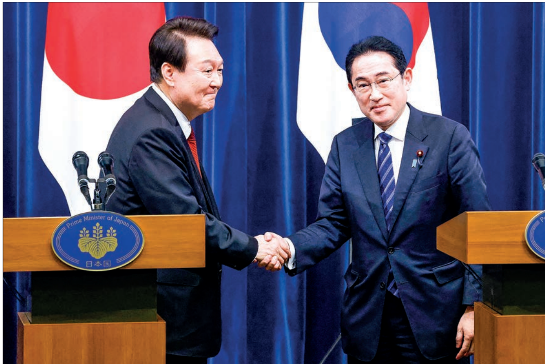
South Korean President Yoon Suk Yeol (L) and Japanese Prime Minister Fumio Kishida shake hands following a joint news conference at the prime minister's official residence in Tokyo on 16 March 2023.

Though widely seen as a retaliatory step, Japan at the time said it had concerns over Seoul's export system and needed to confirm whether it was effective in preventing exported goods