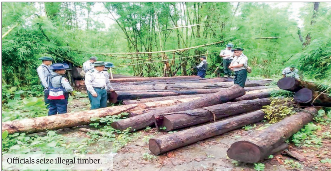
Officials seize illegal timber.

A combined team led by Township Forest Department under the supervision of Sagaing Region Illegal Trade Eradication Task Force captured a total of 5.914 tonnes of illegal timbers worth K887,220 in Shwebo township on 24 June. The action was taken under the Forest Law.