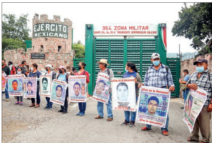
Relatives of the disappeared students in Iguala on 2014 take part in a demonstration held by students of Ayotzinapa's Normal Rural School outside the Chilpancingo's 35 th Military Zone in Chilpancingo, Mexico, on 13 September 2022.

The students, from the Ayotzinapa Rural Normal School, disappeared between the night of 26 September and the early morning of 27 September 2014, when they were traveling via bus to participate in demonstrations in Mexico City.