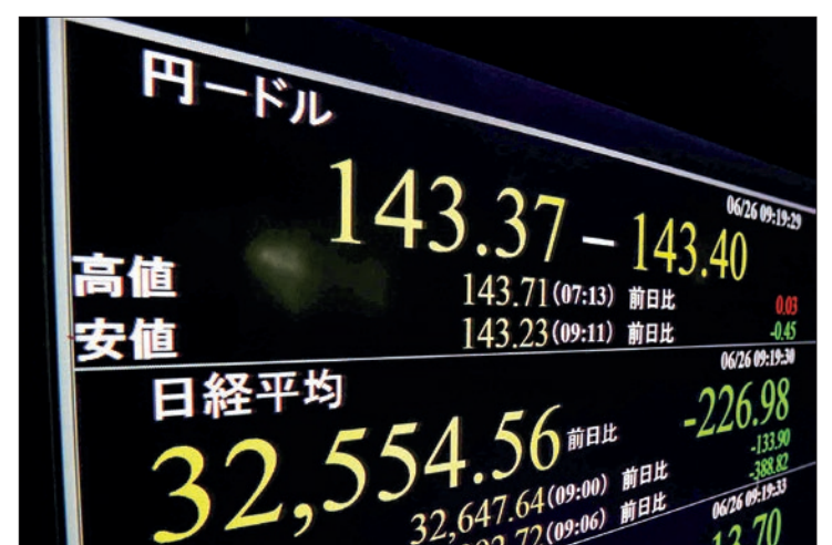
A financial data screen in Tokyo shows the dollar trading in the 143 yen range on 26 June 2023.

retary of State Antony Blinken's trip to the country, where he spoke to his opposite number and President Xi Jinping.