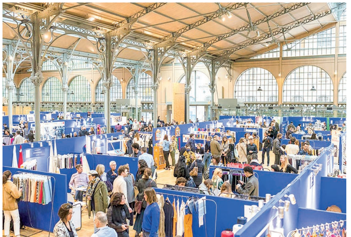
Fashion Weeks, textile shows, showrooms... Here are the dates and locations of the fashion events that will take place in Paris in the first quarter of 2023.

SOME 20 Myanmar garment manufacturers will participate in the 4 th International trade fair for the textile and fabric industry in Paris, France, according to the Myanmar Garment Manufacturers Association-MGMA.