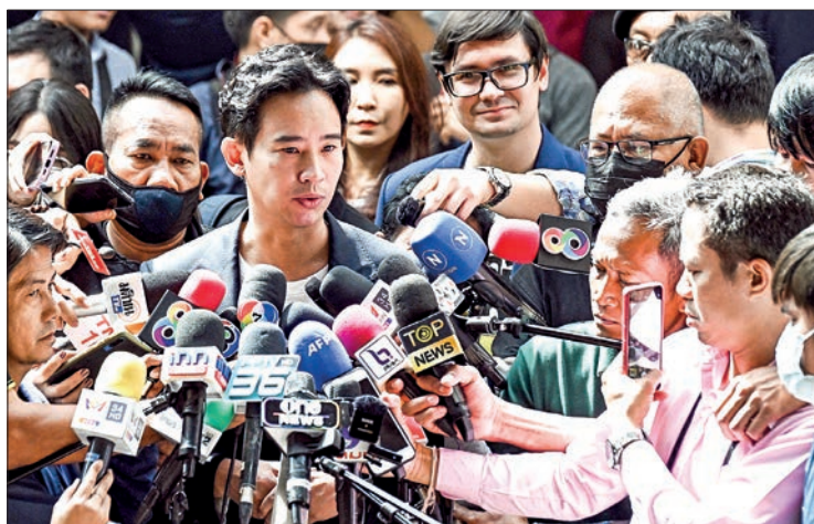
Move Forward Party leader and prime ministerial candidate Pita Limjaroenrat (L) talks to mediapersons after accompanying his party's newly elected House of Representatives members to report to the Parliament in Bangkok on 27 June 2023.

Pita dismissed speculation that his party's stance on reforming royal defamation laws could be a barrier to forming a