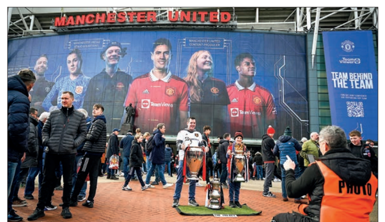
Fans pose for photos outside of Old Trafford stadium in Manchester north west England, ahead of the English Premier League football match between Manchester United and Leicester City, on 19 February 2023.

Reports have suggested Sheikh Jassim's bid, which is for 100 per cent of the club, is now