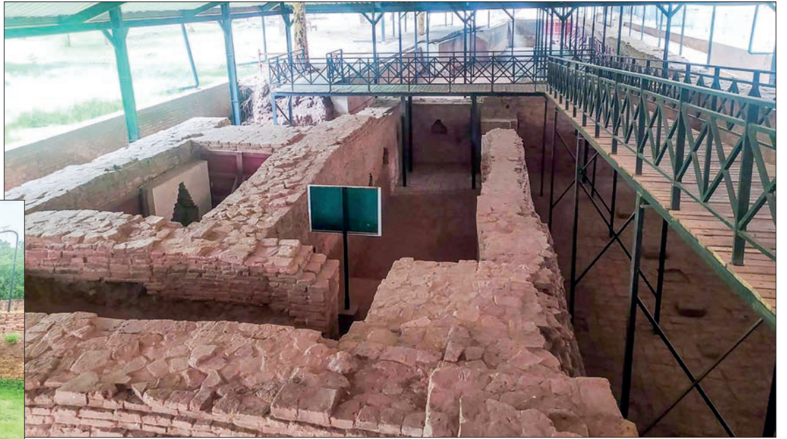
Excavated parts of structures under maintenance at ancient Bagan Palace in Bagan ancient cultural region.

According to the explored land, building system and ancient objects, the kings expanded and repaired the orig-