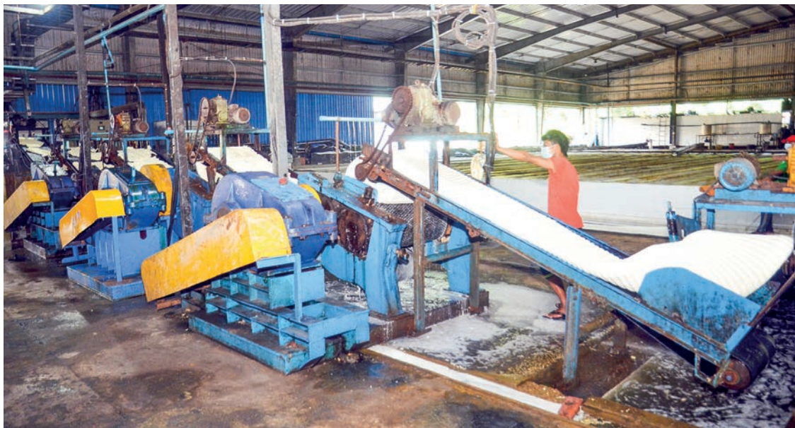
A rubber industry functioning rubber sheets.

Myanmar bagged more than US$449 million revenue in rubber exports in the previous financial year 2020-2021. — NN/EM