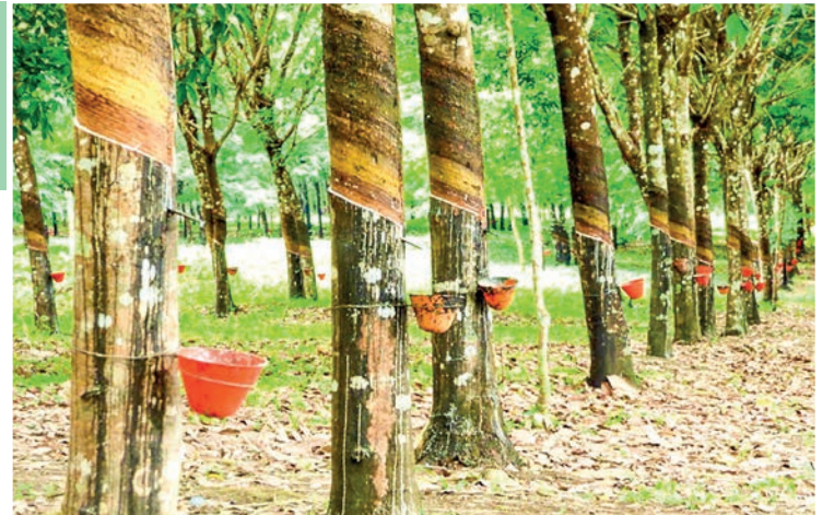
Rubber plants seen at the age of collecting rubber latex.