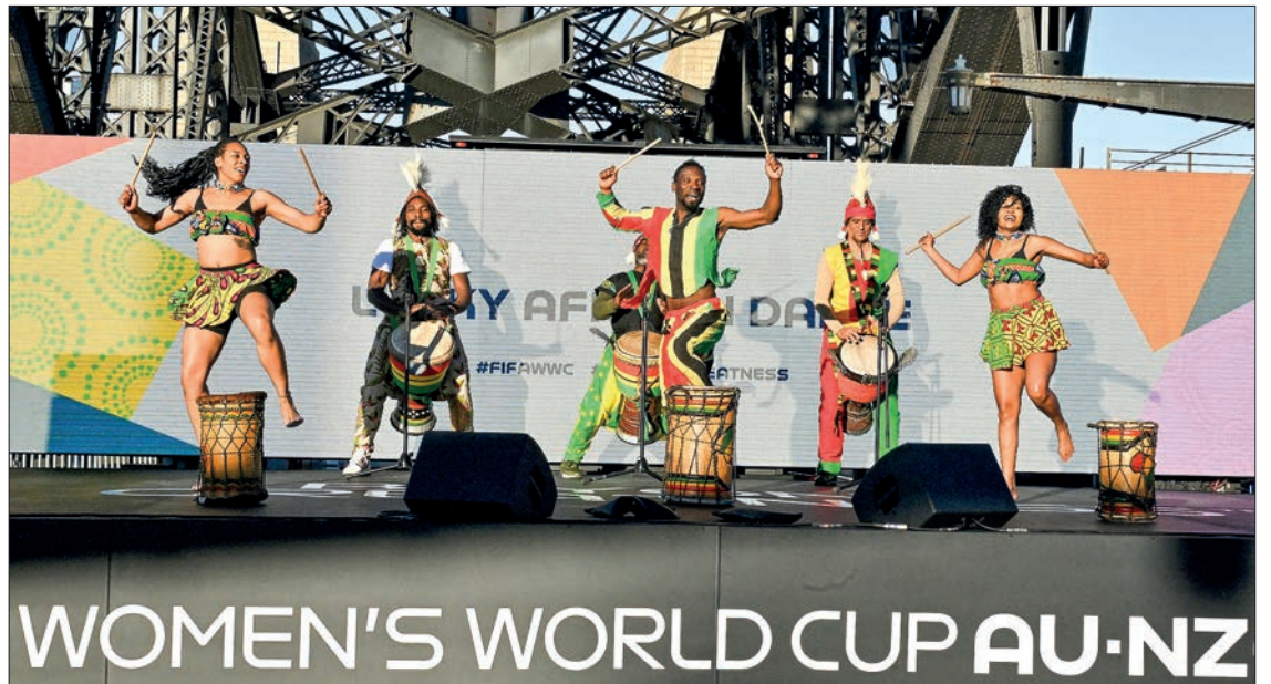
Artists perform during the "Unity Celebrations", an event marking the 25-day countdown until the start of the Australia and New Zealand FIFA Women's World Cup 2023, on the Sydney Harbour Bridge in Sydney on 25 June 2023.