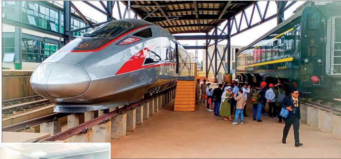
A modern train seen in Kunming.

KUNMING (Kunming) is the capital of the Yunnan Province, China. It is well known as Spring City or City of Eternal Spring for its spring-like weather throughout the year. It is also the centre of the politics, economics, communications and culture of Yunnan. Head offices of the businesses in Yunnan Province are located in Kunming. Moreover, there is a Kunming Railway Vocational and Technical College.