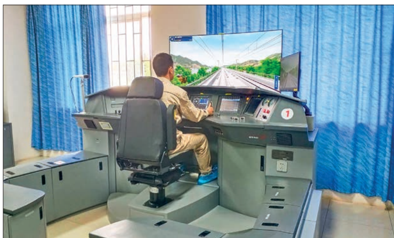
Trainees under training to operate train and solve traffic problems with the use of modern technologies.