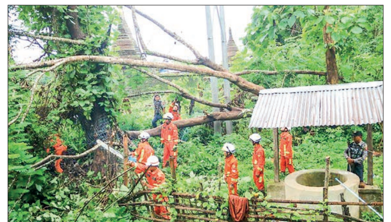
Relief team members clear debris in Rakhine State.

The relief teams in Rathedaung cooperated with mobile medical teams in providing healthcare services to the locals at the Sasana Beikman monastery. —MNA/KZW