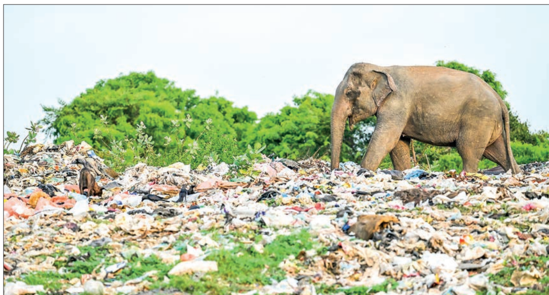
In this picture taken on 3 June 2023, a wild elephant eats rubbish mixed with plastic waste at a dump in Ampara. Heart-wrenching images of revered elephants and cattle eating plastic in Sri Lanka have prompted politicians to toughen pollution laws, but sceptical conservationists warn past bans were repeatedly ignored.

HEART-WRENCHING images of revered elephants and cattle eating plastic in Sri Lanka have prompted politicians to toughen pollution laws, but sceptical conservationists warn past bans were repeatedly ignored.