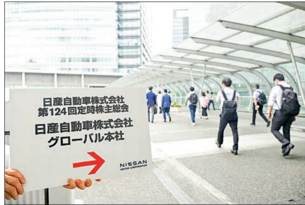
A person holds a board showing the way to Nissan's general meeting of shareholders in Yokohama on 27 June 2023.

The decision came as Nissan tries to gain more independence from Renault, which currently