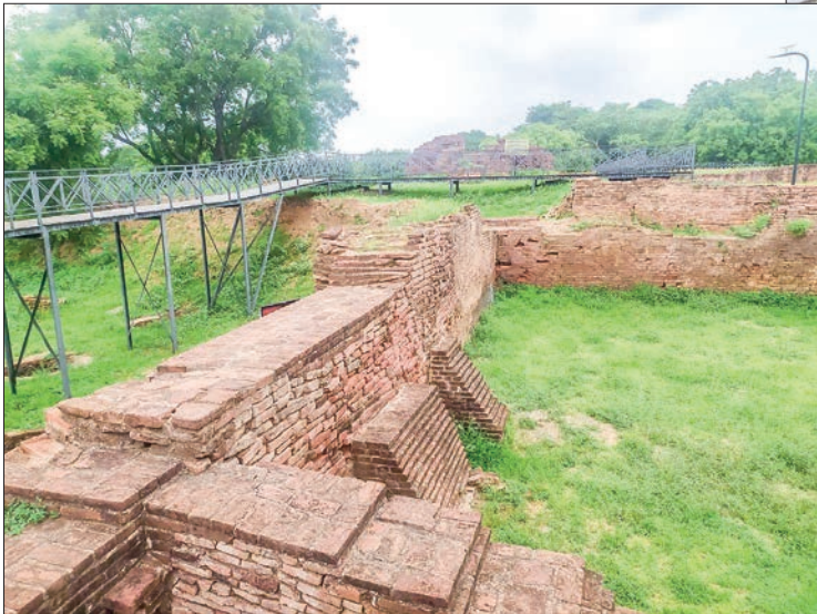
Ancient building made of bricks seen at ancient Bagan Palace site.

inal palace buildings after the establishment of fourth palace. It also conducted research with Magnetometer of Non-Invasive Method in 2016.