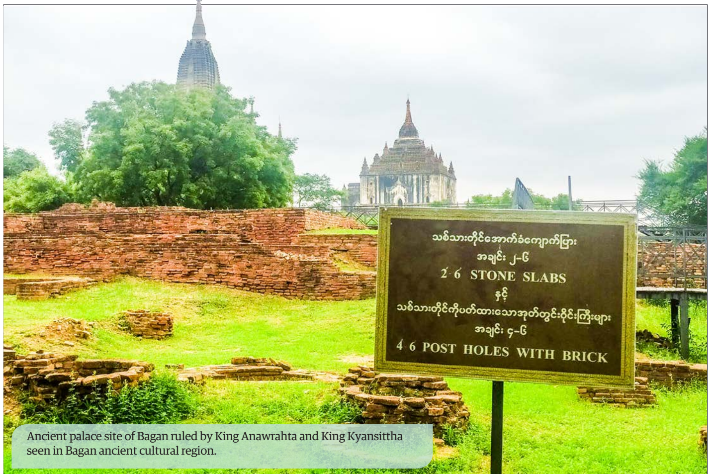
Ancient palace site of Bagan ruled by King Anawrahta and King Kyansittha seen in Bagan ancient cultural region.