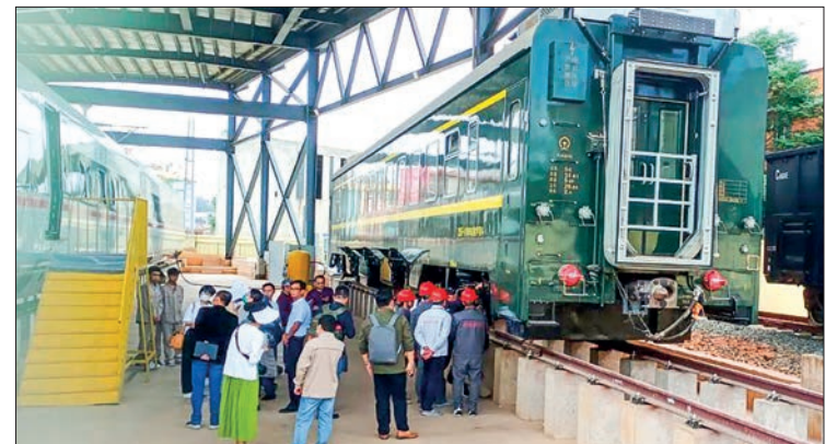
Journalists observe on electric locomotive to be run between China and Thailand.

Trains to run on China-Laos railway and electric locomotives that will operate on China-Thailand railway are also demonstrated at the rail maintenance department.