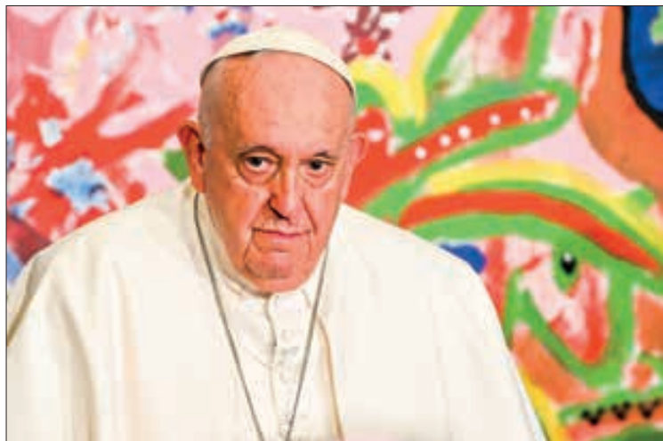
(FILES) In this file photo taken on 25 May 2023 Pope Francis arrives to take part in the "Eco-Educational Cities" conference organized by Scholas Ocurrentes and aimed at promoting education and sustainability on 25 May 2023 at the Augustinian Patristic Pontifical Institute in Rome.

POPE Francis visited a Rome hospital for a medical check-up