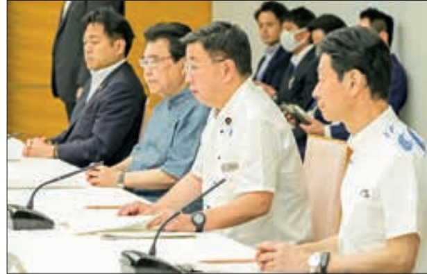
Japanese Chief Cabinet Secretary Hirokazu Matsuno (2 nd from R) speaks at a ministerial meeting on the government's hydrogen policy in Tokyo on 6 June 2023.

Under the revised Basic Hydrogen Strategy, approved at a meeting between relevant ministers, the country also plans to increase its hydrogen supply sixfold from the current level of two million tonnes to around 12 million tonnes by 2040.