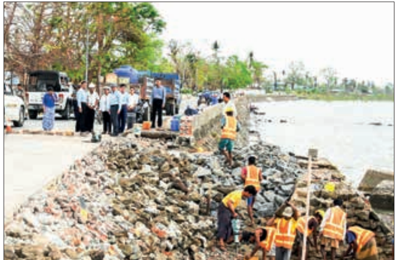
Union Ministers inspect the repair work along the strand road in Sittway yesterday.

Furthermore, the relief and rehabilitation-related materials are transported to Rakhine State by Tatmadaw vessels and planes. Between 15 May and 5 June, the Tatmadaw planes transported 381.928 tonnes of materials 114 times, Tatmadaw vessels for 11 times and private vessels nine times, totalling 16,298.6 tonnes. These materials are also transported to disaster-hit areas by Tatmadaw vessels 17 times with 815.24 tonnes while 1,487.63 tonnes by trucks and vessels of inland water transport. — MNA/KTZH