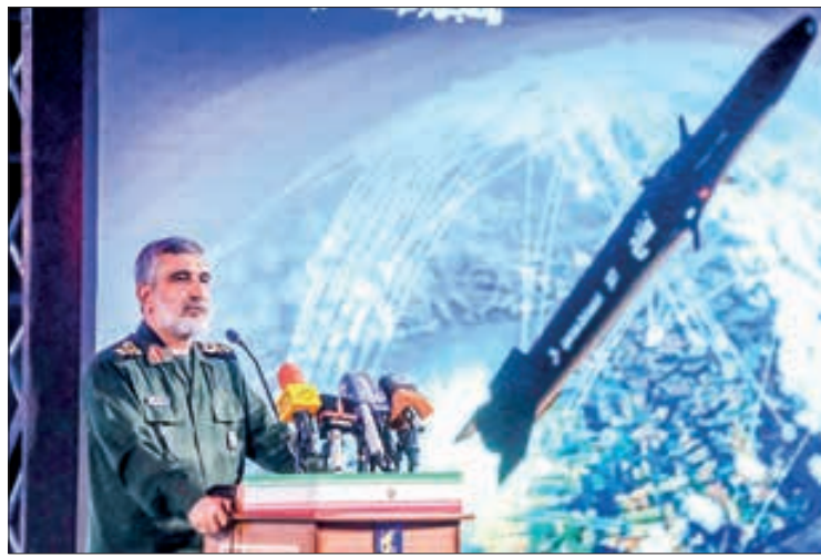
This handout photo provided by Iran's Revolutionary Guard Corps (IRGC) official website Sepah News on 6 June 2023 shows the head of the Revolutionary Guard's aerospace division General Amir Ali Hajizadeh speaking during the unveiling ceremony of the 'Fattah' hypersonic missile in Tehran.

"The range of the Fattah missile is 1,400 kilometres (870