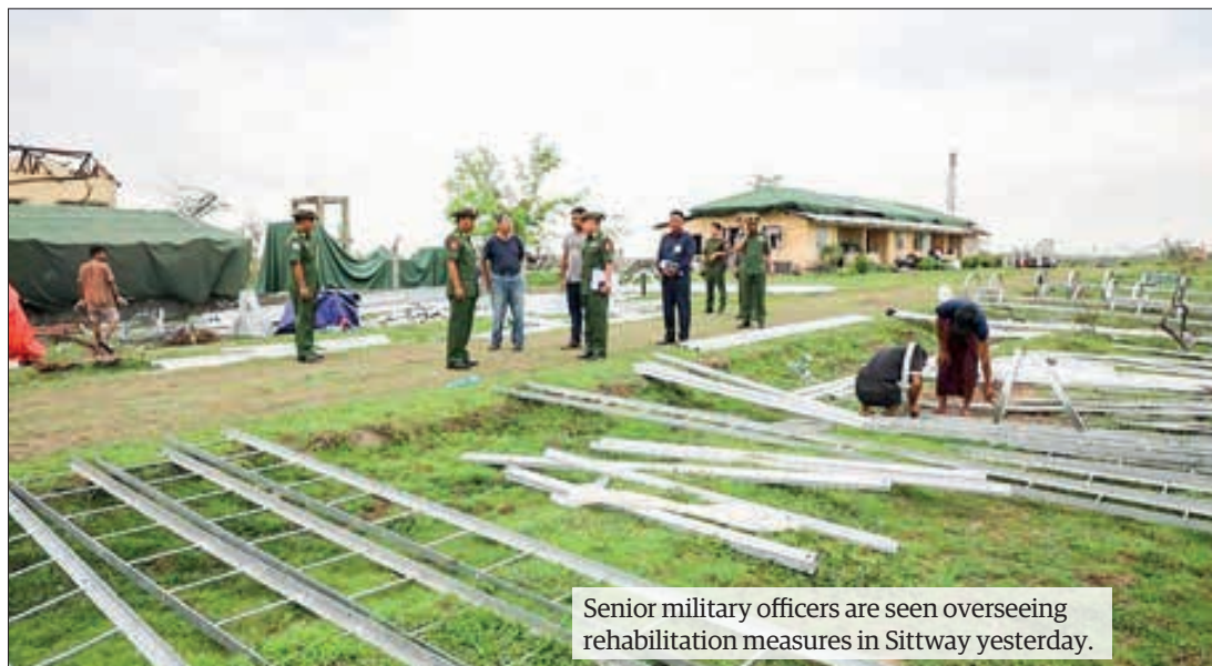
Senior military officers are seen overseeing rehabilitation measures in Sittway yesterday.