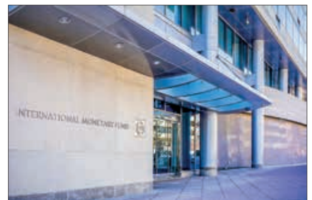
The International Monetary Fund (IMF) headquarters building is seen in Washington, DC on 11 March 2022.

China's squeeze on civil rights in Hong Kong, which led to the UK relaxing entry rules for holders of British overseas passports, also had an impact. — AFP