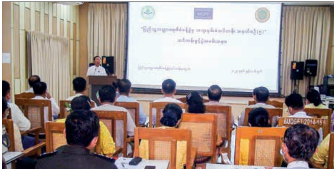
Deputy Prime Minister U Win Shein opens the Public Financial Management Special Refresher Course No 5 yesterday.

The No 5 Public Financial Management Special Refresher Course was attended by planning and finance in-charge persons at the central level and ministerial level totalling 40 trainees and training will last four weeks. — MNA/TS