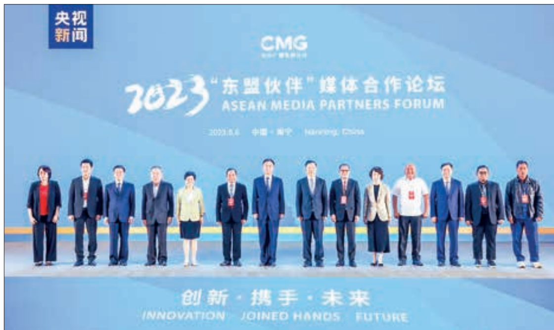
The documentary group photo of the 2023 ASEAN Media Partners Forum held in China yesterday.