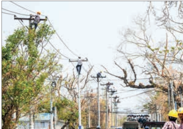
MoEP staff are seen repairing cables yesterday.

Construction materials are allotted to repair the destroyed school buildings, hospitals and religious buildings and provided to the public. Moreover, logs of teak to be sawn are also transported by boats and vessels to