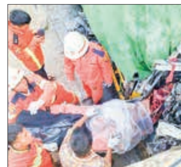
Rescue efforts seen at the accident on the Yangon-Mandalay Highway on 31 May.

During the period from April to May, action was taken against a total of 5,597 drivers for speeding. — TWA/MKKS