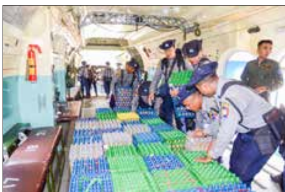
Relief goods are transported by Tatmadaw planes and vessels to Rakhine State yesterday.