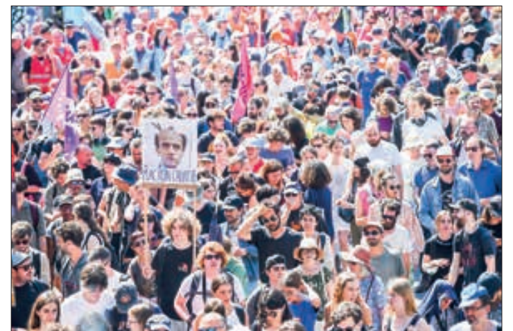
Protesters march, holding a placard depicting French President and reading “Macron, baldness”, during a demonstration on the 14 th day of action after the government pushed a pensions reform through parliament without a vote, using the article 49.3 of the constitution, in Nantes, western France on 6 June 2023.

Opponents are pinning their hopes on a motion put forward by the small Liot faction in parliament — broadly backed by the left — to repeal the law and the increased retirement age. — AFP