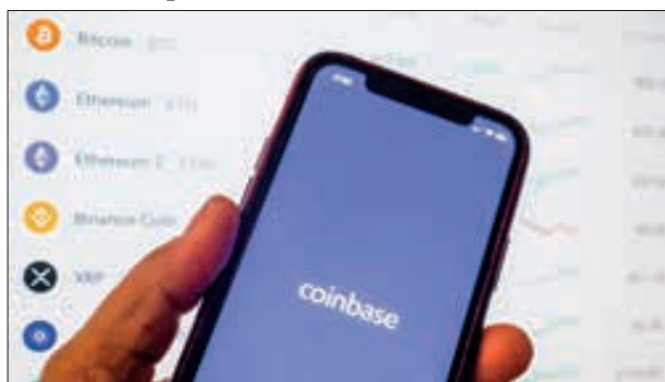
(FILES) This illustration file photo shows the Coinbase logo on a smartphone in Los Angeles on 13 April 2021.

In filing a complaint in federal court, the SEC said Coinbase's failure to register "has deprived investors of significant protections, including inspection by the SEC, record-keeping requirements, and safeguards against conflicts of interest, among others," the US agency added. — AFP