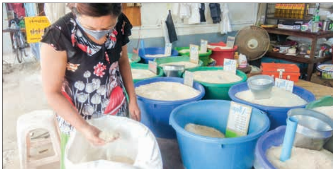
Varieties of rice are organized for sale at the rice outlet in Yangon.

THE price of Shwebo Pawsan rice continued to surge to K110,000 per bag following the rise in paddy price, according to the Wahdan Rice Wholesale Centre. Shwebo Paddy's price climbed to K3 million per 100 baskets.