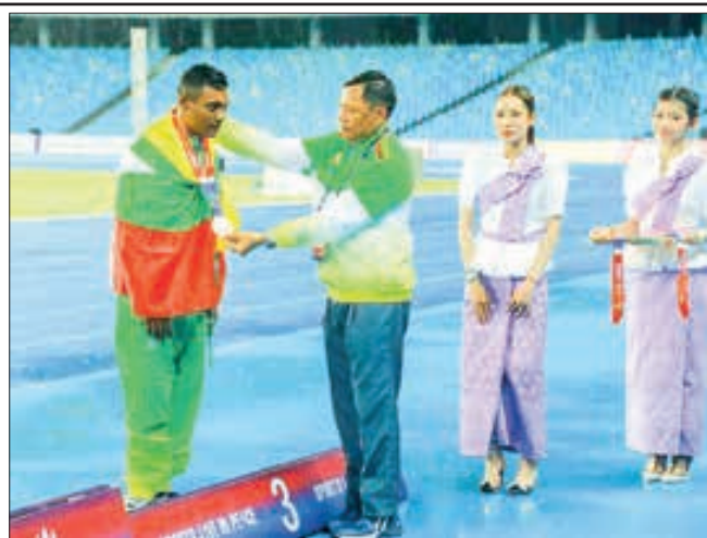
One of the Myanmar's gold medallists receives the medal in the XII ASEAN Paralympic Games.