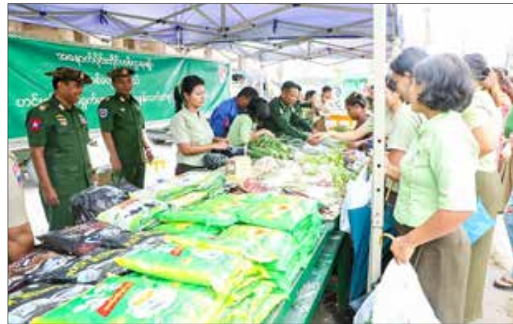
Sittway locals seen purchasing foodstuffs at fairer prices yesterday.

Lt-Gen Phone Myat from the office of the Commander-in-Chief (Army) and Commander of the West Command Maj-Gen Htin Latt Oo personally viewed the sale. — MNA/KZW