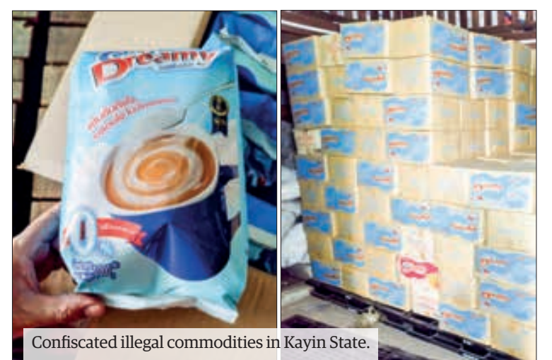
Confiscated illegal commodities in Kayin State.

Therefore, seven arrests (estimated value of K1,087,825,000)