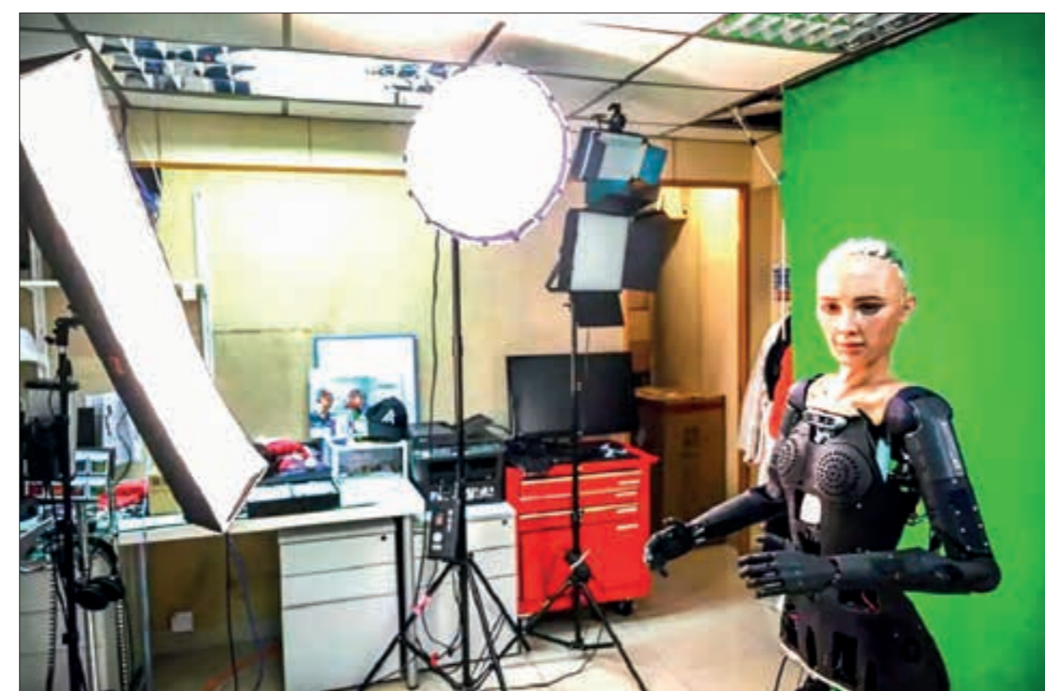
This photo taken on 10 May 2023 shows the latest version of a robot called Sophia being tested at Hanson Robotics, a robotics and artificial intelligence company which creates human-like robots, in Hong Kong.

In March, alarmed that ChatGPT creator OpenAI was