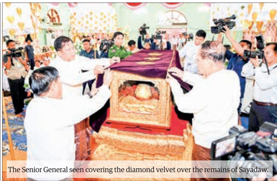
The Senior General seen covering the diamond velvet over the remains of Sayadaw.