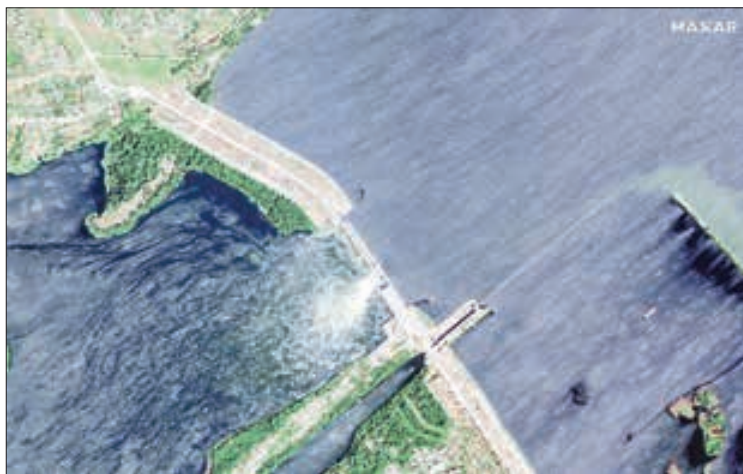
This handout satellite image shows an overview of the Nova Kakhovka dam in south Ukraine, on 5 June 2023.