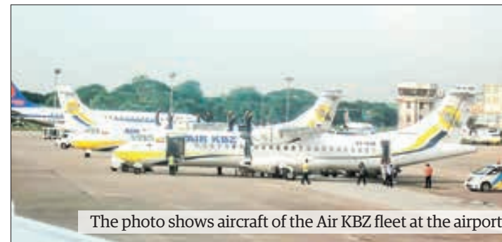
The photo shows aircraft of the Air KBZ fleet at the airport.

Air KBZ also operates 11 flights for passengers such as Yangon, Mandalay, Hehoe, Tachilek, Thandwe, Kawthoung, NyaungU, Lashio, Nay Pyi Taw, Khamti, and Kalay. — TWA/CT