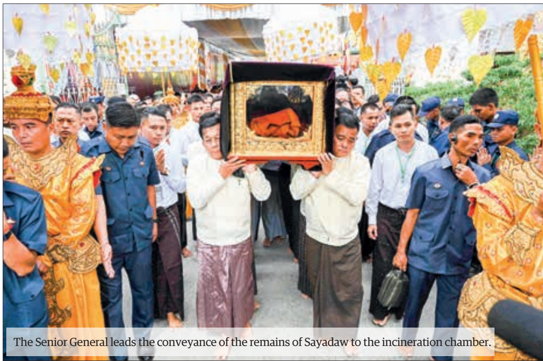
The Senior General leads the conveyance of the remains of Sayadaw to the incineration chamber.

The Secretary Sayadaw read the message of Samvega sent by the SSMNC. The Union Minister for Religious Affairs and Culture read the message of condolences of the ministry. An official from the region government read the messages of condolences sent by the Sri Lankan Prime Minister and the Chairman of Sri Lankan Amara-pura Sangha Council. Yangon Catholic Archbishop Cardinal