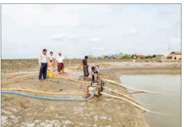
Relief and rehabilitation measures such as the repair of electric cables, distribution of purified water and desalination process at lakes are underway in Sittway Township yesterday.