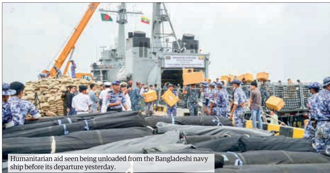
Humanitarian aid seen being unloaded from the Bangladeshi navy ship before its departure yesterday.