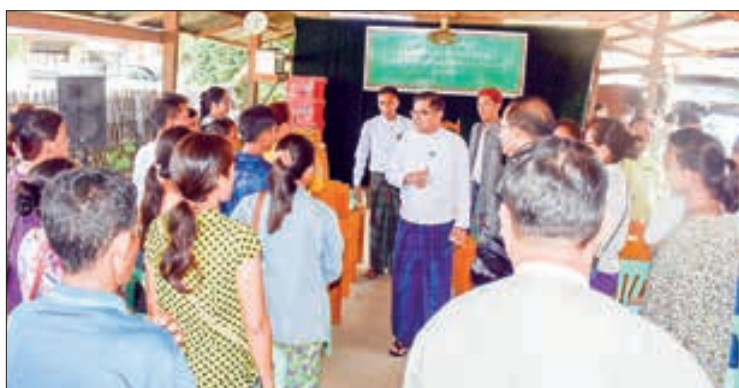
The Kachin State chief minister meets internally displaced persons at the IDP camp in Myitkyina yesterday.

At the coordination meeting of the members of the state-level committee on the