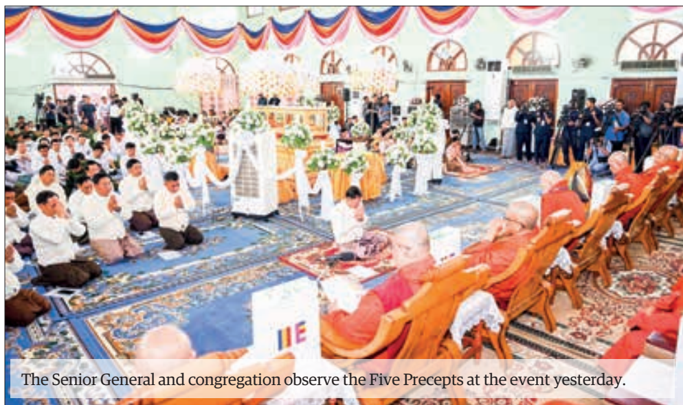
The Senior General and congregation observe the Five Precepts at the event yesterday.