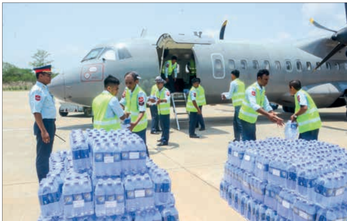
Relief goods are loaded aboard the Tatmadaw aircraft to deliver them to Mocha-hit areas yesterday.

Officials in the respective areas received relief items and will distribute them to storm victims. — MNA/KZW