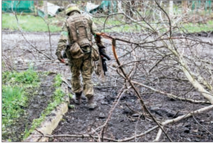
A Ukrainian soldier of the Aidar battalion walks at a front line position near Bakhmut, in the Donetsk region, on 22 April 2023 amid the Russian invasion on Ukraine.

Defence announced on Tuesday that their armed forces repelled a new attack by the Ukrainian Armed Forces (UAF) on the