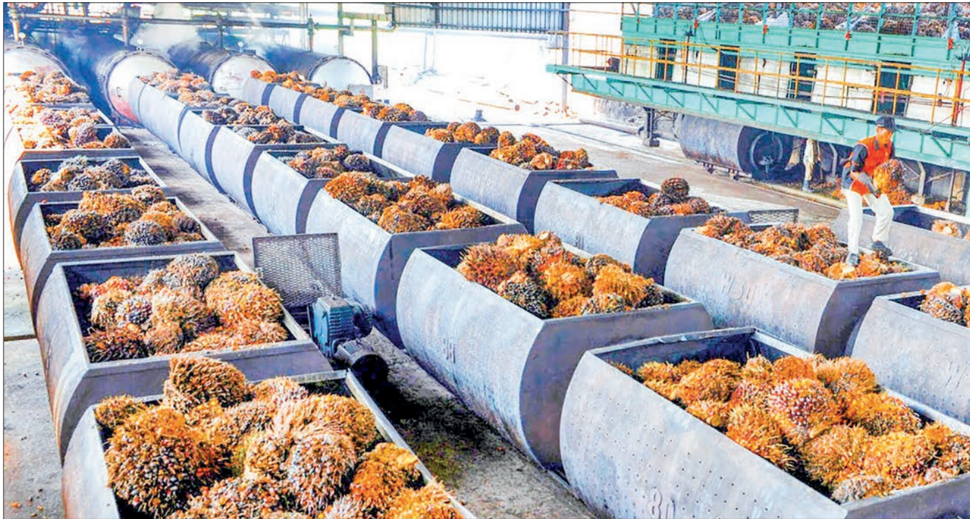
Bunches of oil palm fruits seen in lines to palm oil crude oil mill (above) and containers of cooking oil in production belt.