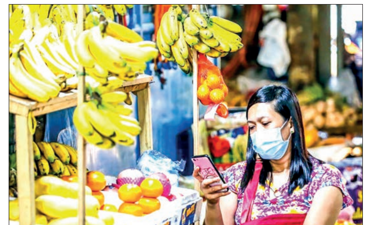
A woman wearing a face mask is seen inside her fruit stall at a market in Manila, the Philippines on 26 March 2021.

The core inflation, excluding selected food and energy items in the headline inflation, slowed to 6.7 per cent in July, added Mapa. — AFP