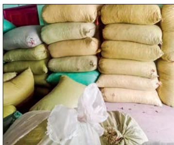
Bags of chilli stockpiled.