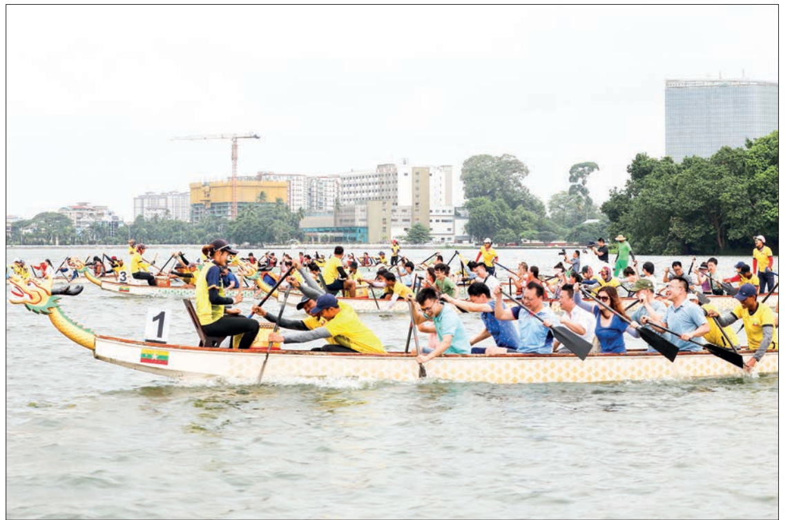
A friendship rowing competition is held with the participation of Chinese embassy family members, guests and athletes in Yangon's Inya Lake.

The Union Minister visited the Myanmar Yachting Federation and urged the federation officials to participate in the 33 rd Southeast Asian Games to be hosted by Thailand in 2025 in all sports events specified by the organizing committee.