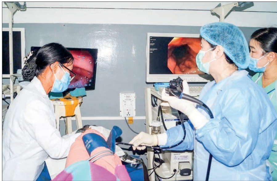
A specialist medical team pays treatment to a patient in Taunggyi.