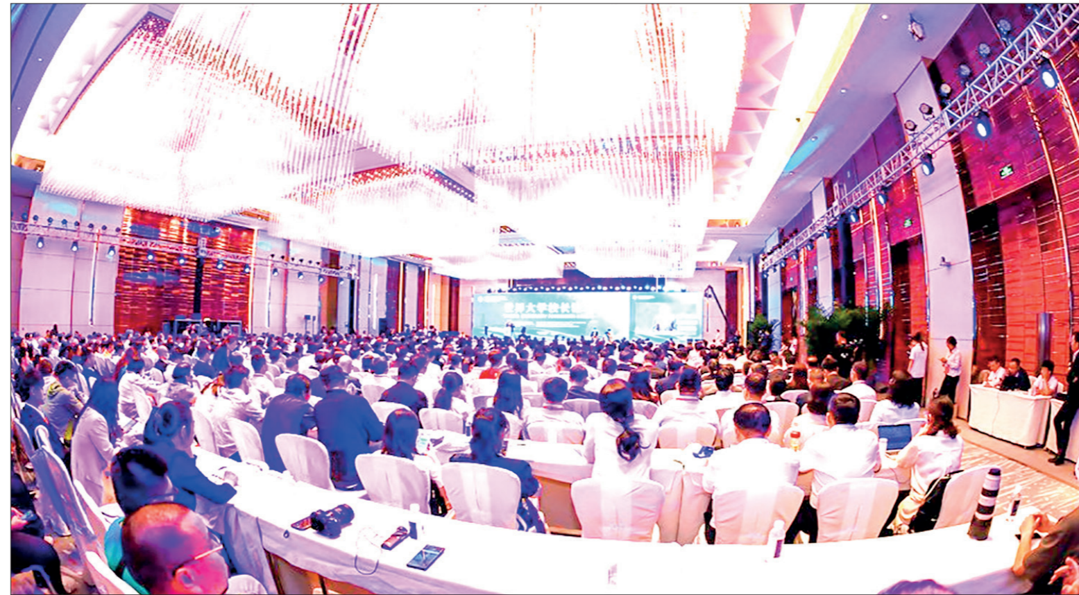
This photo taken on 30 July 2023 shows the opening ceremony of the World University Presidents Forum in Beijing, capital of China.