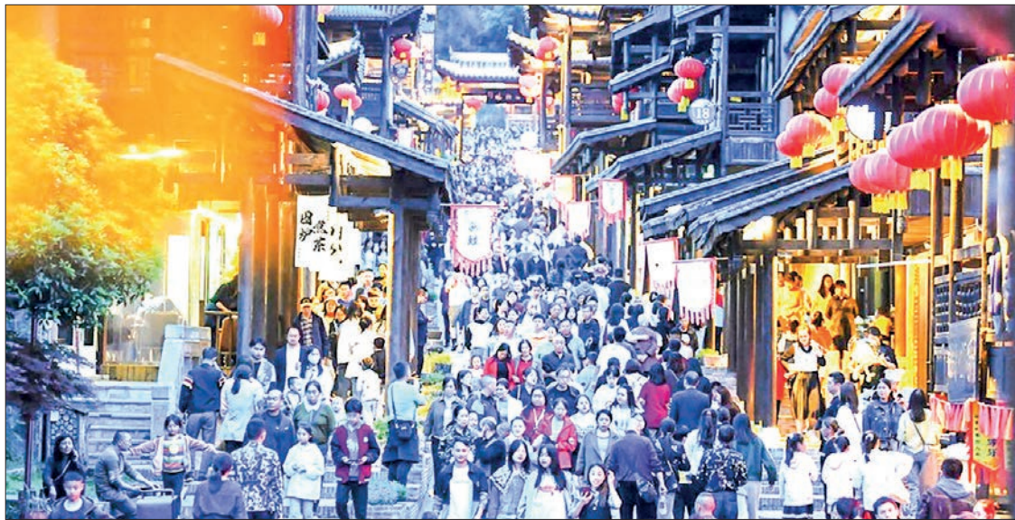
Tourists visit the Youzhou ancient town in Youyang Tujia and Miao Autonomous County, southwest China's Chongqing Municipality, 1 May 2023.