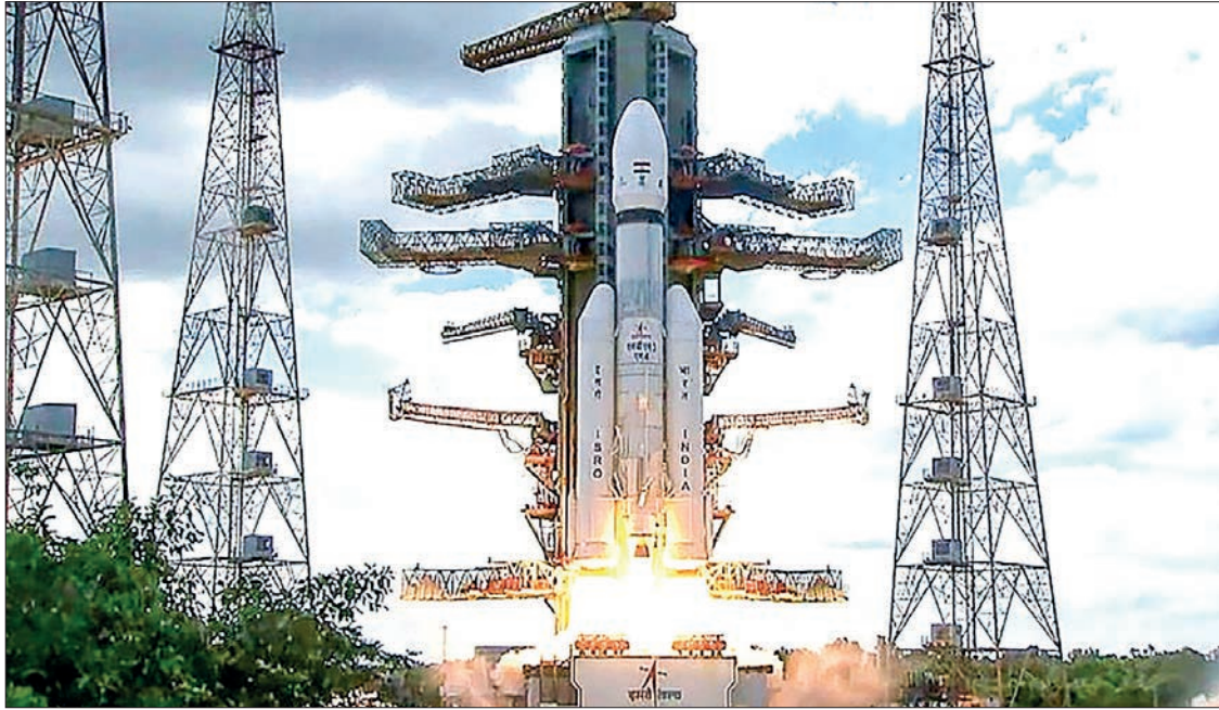
India's space programme has grown considerably in size and momentum since it first sent a probe to orbit the Moon in 2008.

LATEST space mission entered the Moon's orbit on Saturday ahead of the country's second attempted lunar landing, as its cut-price space programme seeks to reach new heights.