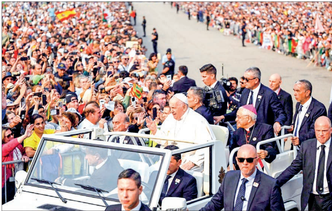
Pope Francis waves from the popemobile prior to presiding over the Holy Rosary prayer with sick young people at the Chapel of Apparitions in the Sanctuary of Our Lady of Fatima, in Fatima, on 5 August 2023.

Drones formed the words "rise up" and "follow me" in the sky above the stage as the