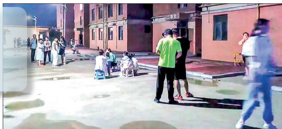
People gather on a street in Liaocheng, China's eastern Shandong province, early on 6 August 2023, following a 5.4-magnitude earthquake that shook eastern China.

AS of 7 am Sunday, a total of 21 people have been injured in the 5.5-magnitude earthquake that struck the county of Pingyuan, in Dezhou City of east China's Shandong Province at 2:33 am Sunday.