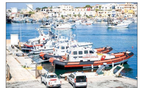
A general view shows speed boats of Italian law enforcement agency Guardia di Finanza (GdF) and of the Italian Coast Guards on 7 June 2023 in the harbour of Lampedusa.

"Whoever allowed them, or forced them, to leave with this sea is an unscrupulous criminal lunatic," he told Italian media. "Rough seas are forecast for the next few days. Let's hope they stop. It's sending them to slaughter with this sea," he said. — AFP