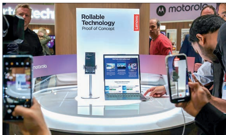
This photo taken on 28 February 2023 shows a product from Lenovo at the 2023 Mobile World Congress (MWC) in Barcelona, Spain.

Ferroelectricity is a characteristic of certain insulating materials that have a spontaneous electric polarization that can be reversed by the applica-