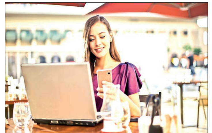
The traditional belief that social media directly influences purchasing behavior is questioned by the research, which suggests that the real influence comes from the spread of content by followers and user-generated word of mouth.

New research from the University of Notre Dame analyzes data from the motion picture industry, which often relies on social media promotion, in an effort to understand how marketers could better promote other new products. — ANI