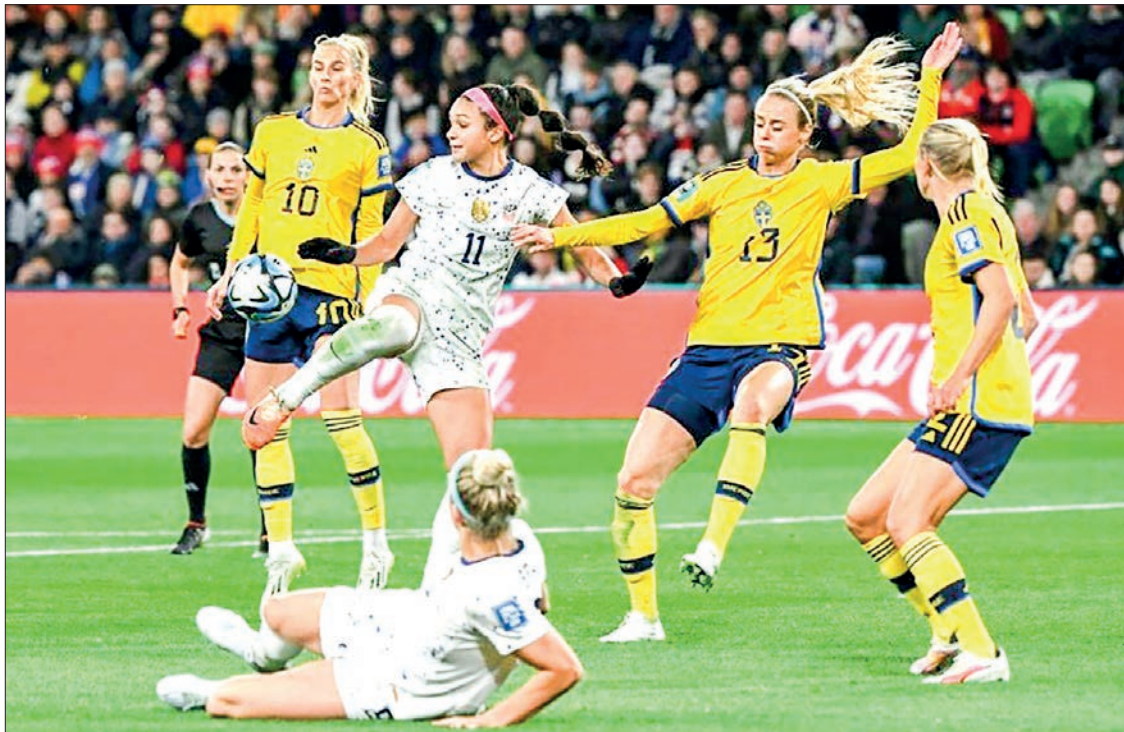
The USA's Women's World Cup round of 16 match against Sweden went into extra time.