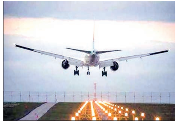
India is a developing country and passengers are price-conscious. In our national civil aviation policy, affordability and sustainability have been emphasized by the government.

The Committee, therefore, recommends to the Government to develop world-class standards but at the same time ensure that they are cost-effective and user charges remain affordable and competitive as compared to other airports in the Asia Pacific region," reads the report. — ANI