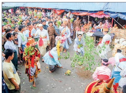
A traditional ritual is seen holding at the Taungbyone Festival.

It is also a festival in which worshippers from all over Myanmar gather together to offer various programmes to the gods. — TWA/KZL