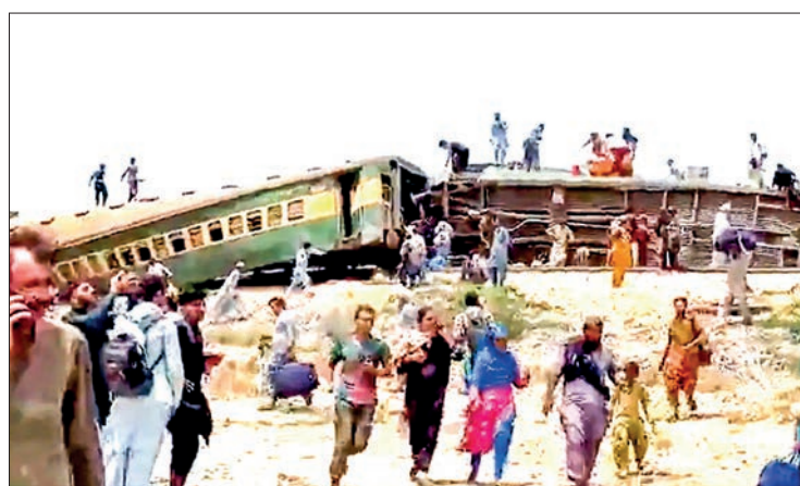
A train derailed in southern Pakistan, resulting in a tragic incident.

AT least 15 people were killed when a train derailed in southern Pakistan on Sunday, according to local media.