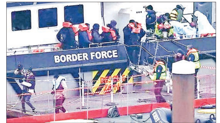
Migrants are escorted ashore from the UK Border Force vessel 'BF Ranger' in Dover, southeast England, on 6 March 2023, after having been picked up at sea while attempting to cross the English Channel.

The source told The Times these figures called into question the government's policy of reducing illegal immigration, which Prime Minister Rishi Sunak has identified as one of his five priorities for restoring the country to prosperity in 2023. — SPUTNIK