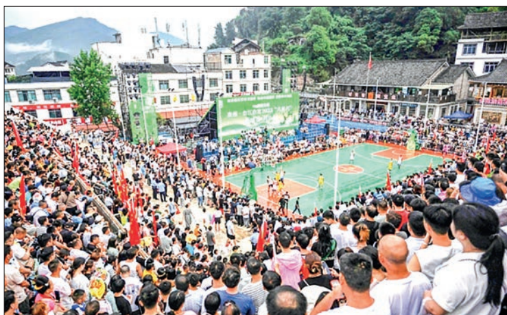
This photo taken on 30 July 2023 shows a general view of spectators watching a game of the grassroots basketball competition CunBA in Taipan village, Taijiang county, in southwestern China's Guizhou province.

Basketball is hugely popular in the country, but wide-