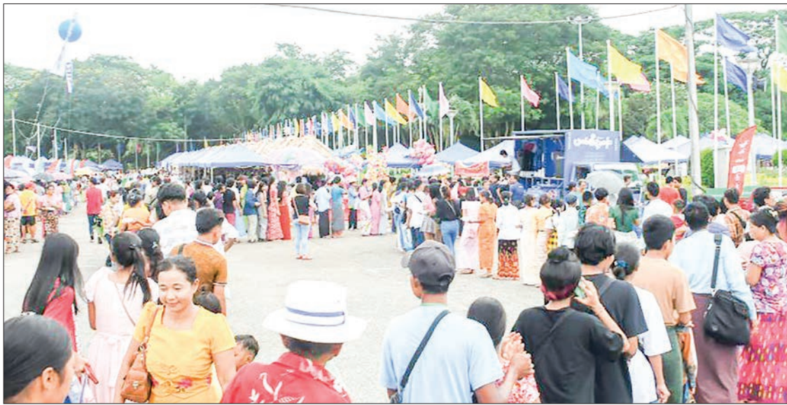
Crowds are seen at the 2023 Monsoon Market Fair showcasing industrial products and electric vehicles (EVs) at People's Square in Yangon yesterday.

PEOPLE flocked to the last-day exhibition of 2023 Rainy Market Fair, Industrial Product Exhibition and Electric Vehicle (EV) Exhibition held in the People's Square in Yangon yesterday. E-Sport Game booths and Entertainment Zone and Water Fountain Garden were mostly packed with visitors while others went to EV booths. The visitors to the fair also bought industrial goods.