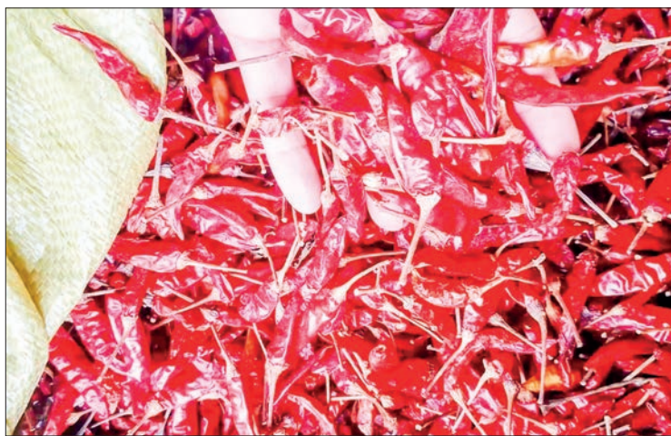
Arriving of Dried Moehtaung chilli peppers at a brokerage house in the last week of July.