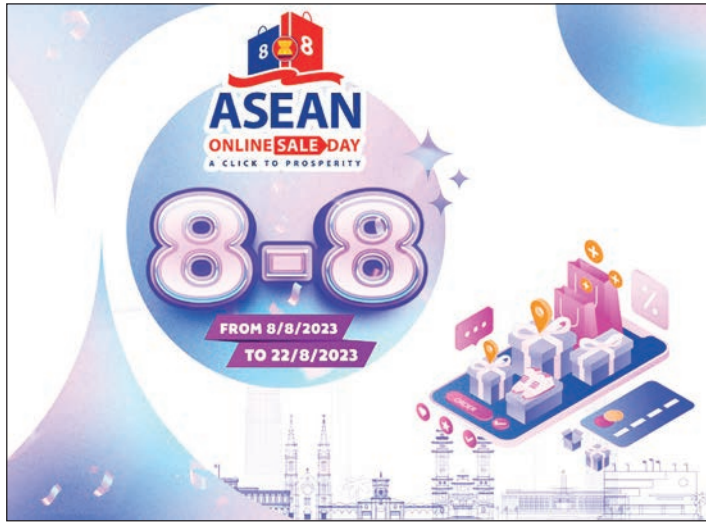
An advertisement is seen featuring the ASEAN Online Sale Day-AOSD 2023.

The main purpose of AOSD is to promote cross-border e-Commerce in the region, increase consumer trust in e-Commerce, and reinforce the role of e-Commerce as one of the main drivers of regional economic development. The event is benefiting the e-Commerce businesses of ASEAN countries, SMEs or