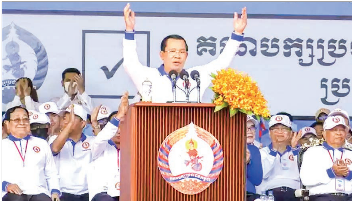
The ruling party's landslide victory means it has become certain that a new Cabinet, led by Hun Sen's eldest son Hun Manet as the new prime minister, will be launched.

THE ruling Cambodian People's Party of Prime Minister Hun Sen won 120 out of the 125-seat lower house in the country's parliament, according to official results of last month's general election released Saturday by Cambodia's National Election Committee.