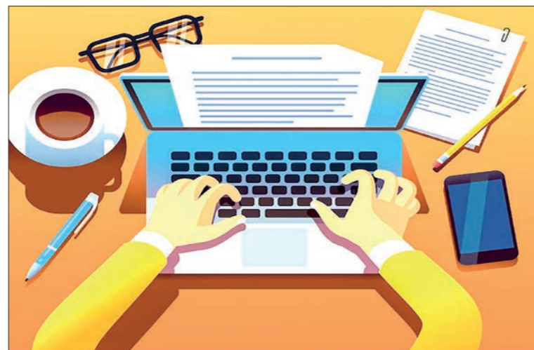
If you use the same words too much, your writing might sound fancy, bossy, and too long. It's not that you can never use those words, but using different words can make your writing shorter, simpler, and more like a conversation. ILLUSTRATION FOR VISUAL PURPOSE/FREEPIK