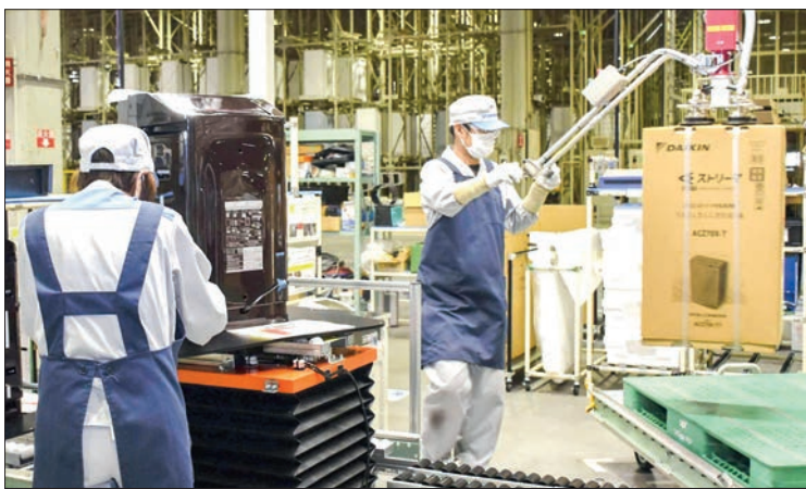
Workers manufacture air purifiers at a Daikin Industries factory in Kusatsu, Shiga Prefecture, in July 2021.

LISTED Japanese manufacturers logged a 23.1 per cent jump in their combined net profit for