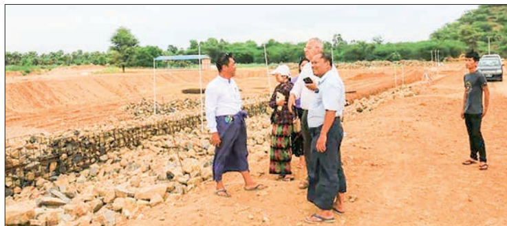
The team of Italy and Myanmar archeologists conduct research on water supply, drainage systems in Bagan.

"Additionally, we are maintaining the water supply and drainage networks that we discovered during our field research. The Department of Irrigation and Water Utilization Management, under the Ministry of Agriculture, Livestock and Irrigation, is also