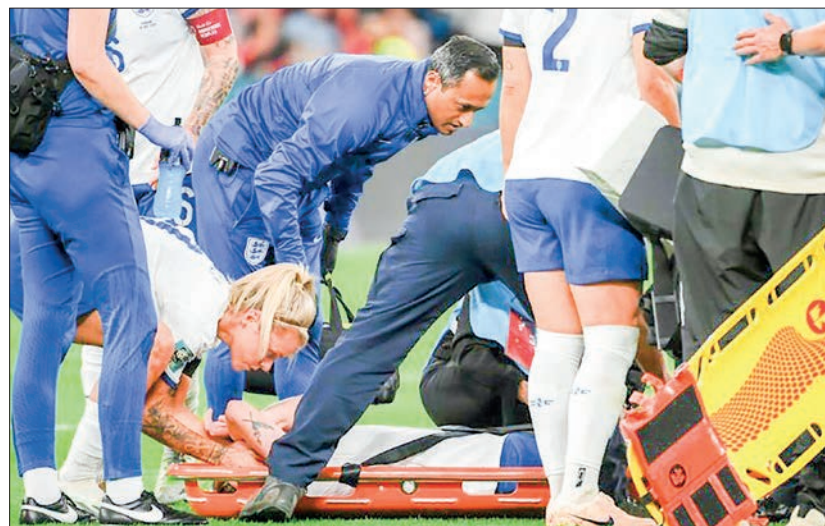
England midfielder Keira Walsh was stretchered off against Denmark.

"Now we'll wait to see how she recovers from that training session and if she does well then she's available for tomorrow." Wiegman switched England's usual 4-3-3 formation to 3-5-2 against China because of Walsh's absence and it paid off with a handsome 6-1 win. — AFP