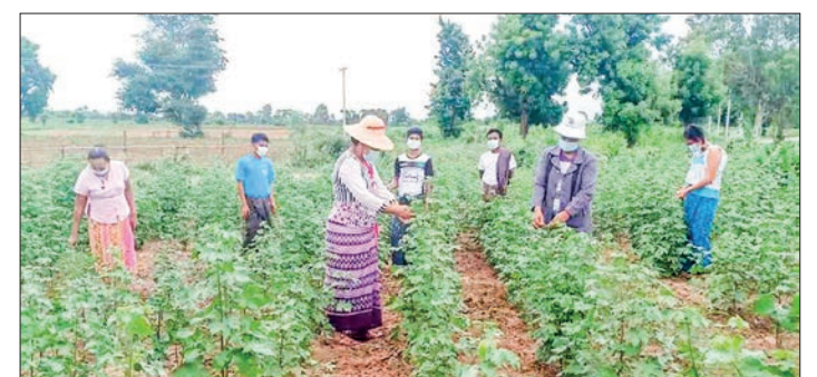
A plot of cotton plantation in ChaungU, Sagaing Region.

The prices are K3,600-K3,800 per viss for undressed cotton, K8,500 per viss for cotton wool, K1,500-K1,600 per viss for cottonseed and cottonseed paste, and K7,300 per viss for cottonseed oil. The cotton crop is being exported to Mandalay Region and the state-owned textile factories, so it is said that cotton crop should be grown more because they are very profitable. — TWA/CT