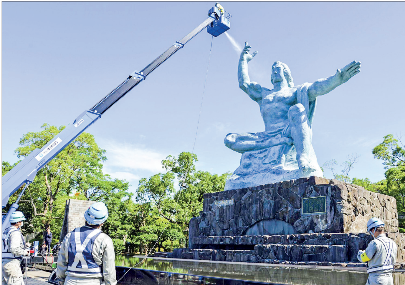
The Peace Statue in Nagasaki Peace Memorial Park gets cleaned on 10 July 2018 in preparation for the annual ceremony held to mark the US atomic bombing of the city on 9 August.