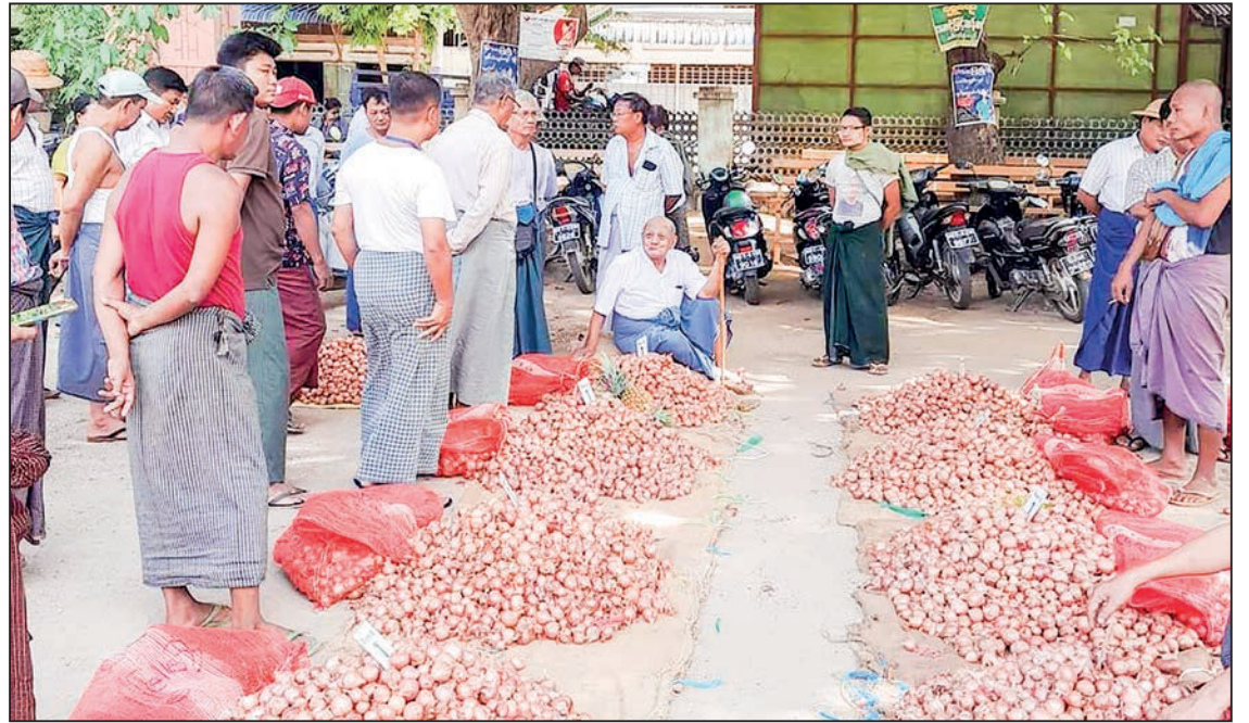
The photo shows Pakokku's onion market on 5 August.

A robust foreign demand drove the onion prices to K3,700 per viss in 2015 and 2019 and K4,900-5,100 in early December 2022. — TWA/EM