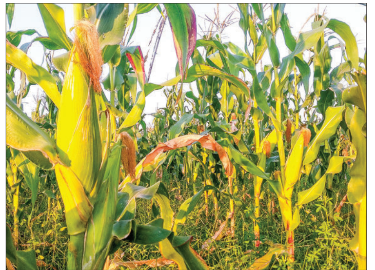
A thriving corn plantation.

The corn is cultivated in Shan, Kachin, Kayah and Kayin states and Mandalay, Sagaing and Magway regions. Myanmar has three corn seasons – winter, summer and monsoon. The country produces 2.5-3 million tonnes of corn every year. — NN/EM