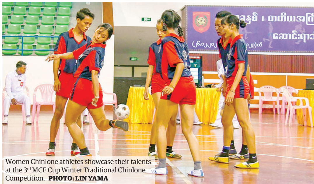
Women Chinlone athletes showcase their talents at the 3 rd MCF Cup Winter Traditional Chinlone Competition.

THE 3 rd Myanmar Chinlone Federation-MCF Cup Winter Traditional Chinlone (cane ball) competition was opened at Thuwunna Stadium in Yangon yesterday.