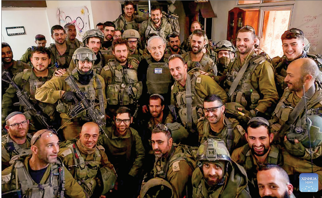
Israeli Prime Minister Benjamin Netanyahu (C) poses for a photo with Israeli troops in the northern Gaza Strip, on 25 December 2023. Netanyahu toured the northern Gaza Strip on Monday and vowed to continue the fight, the prime minister's office said.

ISRAELI Prime Minister Benjamin Netanyahu toured the northern Gaza Strip on Monday and vowed to continue the fight, the prime minister's office said.