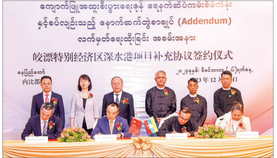
The signing ceremony of the Addendum to Concession Agreement on the Kyaukpyu Deep Seaport Project in progress yesterday in Nay Pyi Taw, addressed by SAC Member Deputy Prime Minister Union Minister for Transport and Communications General Mya Tun Oo.

S TATE Administration Council Member Deputy Prime Minister Union Minister for Transport and Communications General Mya Tun Oo addressed the signing ceremony of the Addendum to Concession Agreement on the deep seaport project in Kyaukpyu Special Economic Zone held in Nay Pyi Taw yesterday.