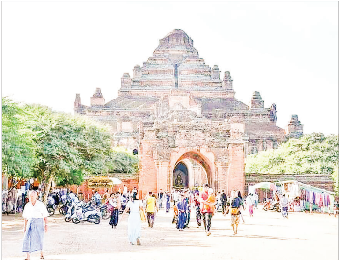
Flocks of visitors enjoy the Christmas holidays in the Bagan Ancient Cultural Heritage Zone.

The zone is renowned for its unspoiled ancient religious buildings and attracts domestic and international travellers. — ASH/NT