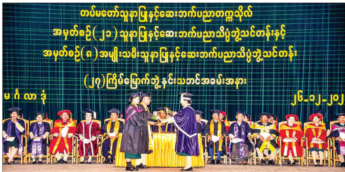
The 27 th Convocation of the Defence Services Institute of Nursing and Paramedical Sciences in progress yesterday.

Afterwards, the graduates took the oath of education and were brought to the rector according to the programme. Next, the rector awarded the degree certificates. The commandant