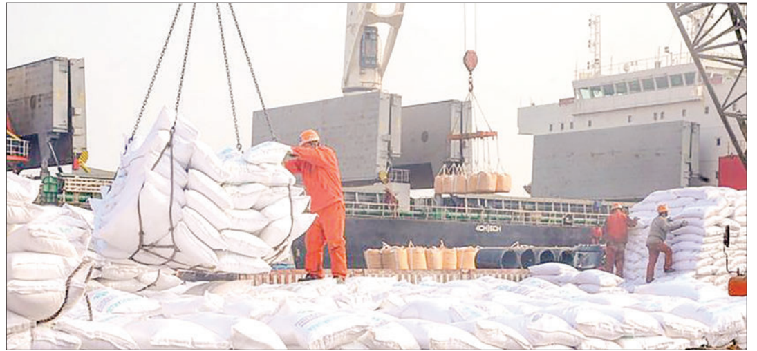
The photo shows the unloading procedure of fertilizer bags imported from abroad.

MYANMAR imported 66,410 tonnes of fertilizer by sea and via land borders in November 2023 to increase productivity in agriculture, according to the Ministry of Commerce.