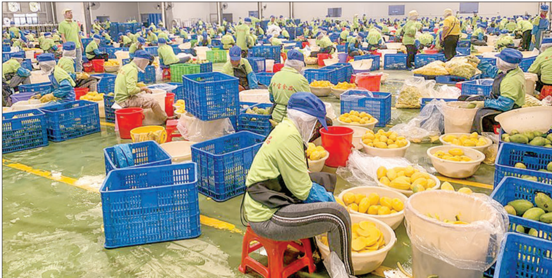
Workers slice ripe mangoes at the Zhong Bao (Cambodia) Food Science & Technology Co Ltd in Kampong Speu province, Cambodia, on 7 March 2023.

CAMBODIA exported 7.21 billion US dollars worth of products to the Regional Comprehensive Economic Partnership (RCEP) members in the first 11 months of 2023, up 27 per cent from 5.67 billion dollars in the same period last year, a Ministry of Commerce report said on Tuesday.