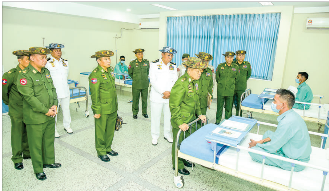
SAC Vice-Chair Deputy C-in-C of Defence Services C-in-C (Army) Vice-Senior General Soe Win encourages the patients at Tatmadaw Hospital (1,000-bedded) yesterday.

Initially, Vice-Senior General Soe Win arrived at the special treatment centre of the Tatmadaw Hospital, where the commandant of the military hospital and officials warmly welcomed them. Following the