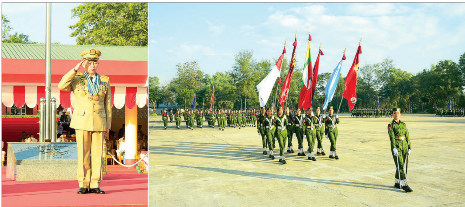
State Administration Council Vice-Chairman Deputy Commander-in-Chief of Defence Services Commander-in-Chief (Army) Vice-Senior General Thiri Pyanchi Maha Thray Sithu Soe Win returns the salute of the graduation companies yesterday.

THE Defence Services Institute of Nursing and Paramedical Sciences held the passing-out parade for the 21 st intake of the institute and the 8 th intake of the female nursing and paramedical sciences at its parade ground in Yangon yesterday morning, with an address by Vice-Chairman of the State Administration Council Deputy Commander-in-Chief of Defence Services Commander-in-Chief (Army) Vice-Senior General Thiri Pyanchi Maha Thray Sithu Soe Win, on behalf of the SAC Chairman Commander-in-Chief of Defence Services Senior General Thadoe Maha Thray Sithu Thadoe