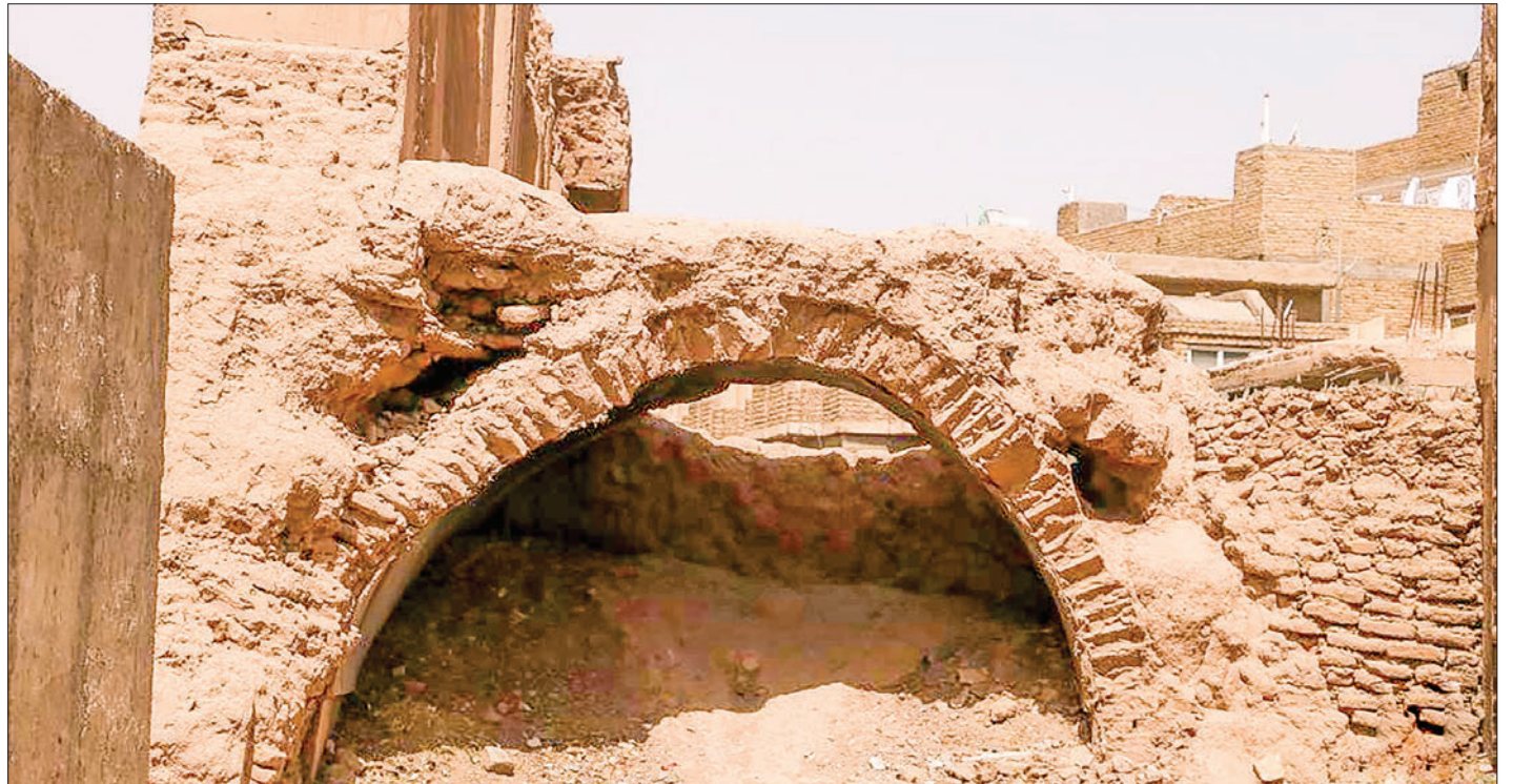
This photo taken on 15 July 2023 shows a damaged building where the US forces dropped cluster bombs in 2001 in Herat Province, Afghanistan.

According to Aziz, the United States did nothing good to Afghans. "The Americans dropped bombs on people, on children and even on weddings," he said.