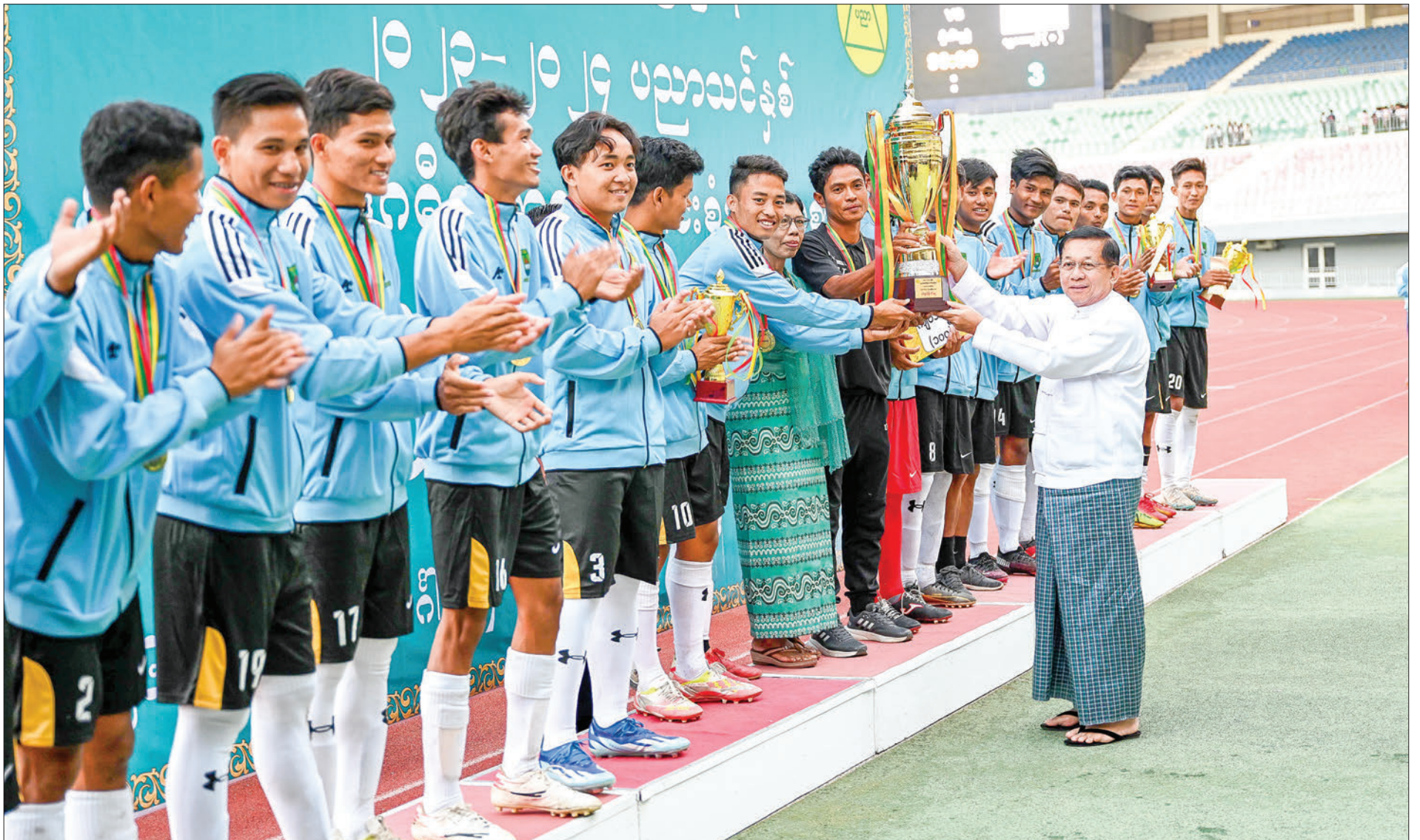
State Administration Council Chair Premier Senior General Min Aung Hlaing awards the championship trophy to the Mandalay Zone B team yesterday in Nay Pyi Taw.

C HAIRMAN of the State Administration Council Prime Minister Senior General Min Aung Hlaing watched the final match of the men's football tournament of the Inter-Education Degree Colleges for the 2023-24 academic year. He awarded prizes to the relevant teams at the awarding ceremony at Wunna Theikdi Stadium in Nay Pyi Taw yesterday.