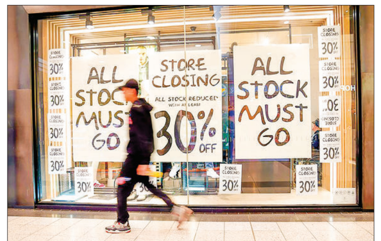
A man walks past a shop in Manchester, Britain, 11 May 2023.

AT risk of recession, the United Kingdom (UK) has witnessed a year of poor economic performance in 2023, and next year does not look promising either.