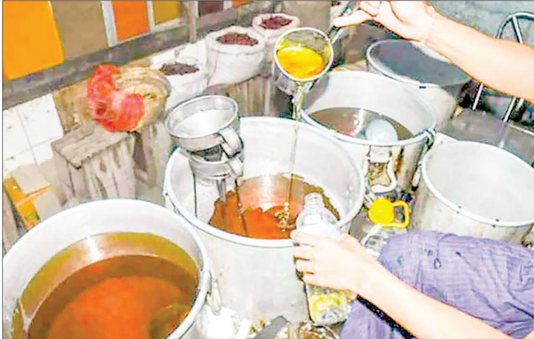
A vendor seen organizing cooking oil for sale in the market.

THE wholesale reference rate of palm oil for the Yangon market this week ending 31 December 2023 was set higher to K4,955 per viss from K4,810 per viss registered last week, according to the Supervisory Committee on edible oil import and distribution.