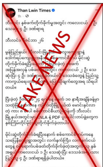
Screenshot validates false claims.

In preparation for the Academy Awards ceremony, the names of actors and actresses from movies shown in cinemas during 2023 and the names of the respective movie producers were requested by the 8 December deadline. Nay Pyi Taw will host the 2023 Myanmar Academy Awards Ceremony. — ASH/TRKM