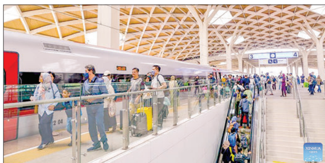
Passengers walk on the platform of Halim Station in Jakarta, Indonesia, 25 December 2023. The Jakarta-Bandung High-Speed Railway (HSR), the first HSR in Indonesia and Southeast Asia, has handled more than one million passenger trips since its commercial operation was officially launched on 17 October, according to the China State Railway Group Co Ltd on Monday.

As the year-end is approaching, the rapidly growing passenger flow has prompted PT Kereta Cepat Indonesia-China (KCIC), a