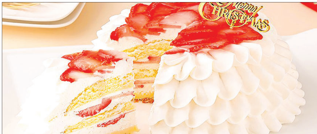
Supplied file photo shows the "strawberry frill shortcake" sold by Japanese department store operator Takashimaya Co.

JAPANESE department store operator Takashimaya Co is in damage-control mode after revealing Monday that around 900 customers have complained that a cake it sold online for Christmas arrived damaged, adding that it is urgently investigating why and working on issuing refunds.