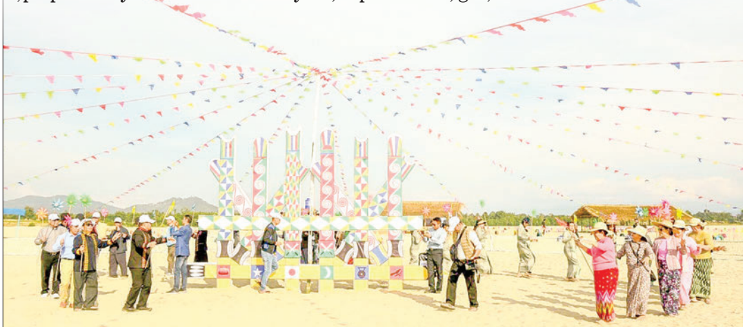
The opening event of the Naungtalaw sandbank resort underway on 23 December 2023 in Kachin State.

Last year, approximately one hundred visitors on weekdays and two hundred on weekends visited the beach.