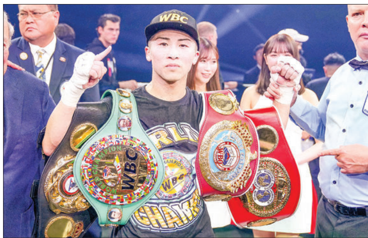
Japanese boxer Naoya Inoue poses after defeating Marlon Tapales of the Philippines in their four-belt world super bantamweight title unification match at Ariake Arena in Tokyo on 26 December 2023.

Inoue praised his 31-year-old opponent for putting on a tough battle at the same venue where the Japanese power puncher made his super bantam debut in