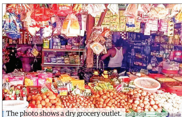
The photo shows a dry grocery outlet.

On December 26, one ton of black gram RC was priced at K2,994,000, one ton of SQ/RC at K3,304,000, red pigeon pea at K3,275,000 per ton, green gram at K3,750 per viss, while chicken pea was priced at K6,025 to K6,200 per viss. — TWA/TMT