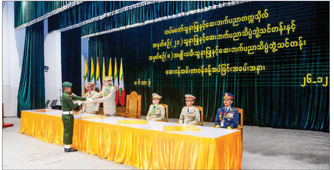
The commissioning ceremony for the 21 st and 8 th intakes (female) of the Defence Services Institute of Nursing and Paramedical Sciences in progress yesterday.

A ceremony to commission the trainees of the 21 st Intake and the 8 th Intake (female) of the Defence Services Institute of Nursing and Paramedical Sciences was held at the convocation hall of the institute in Mingaladon Township, Yangon Region, yesterday morning.