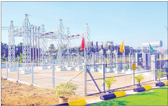
The Gyophyu substation in Yangon.

In light of these circumstances, YESC has announced a reduction in electricity production during the gas pipeline repairs. Consequently, emergency load reduction measures will be implemented, resulting in temporary power outages in specific townships within Yangon Region. — TWA/KZW