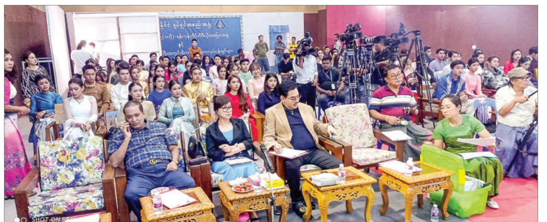
The selection process for receptionists underway.