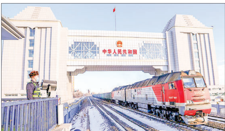
This photo taken on 17 March 2023 shows a freight train at the railway port in Manzhouli, north China's Inner Mongolia Autonomous Region.

MANZHOU LI, China's largest land port, handled 4,681 China-Europe freight trains in the