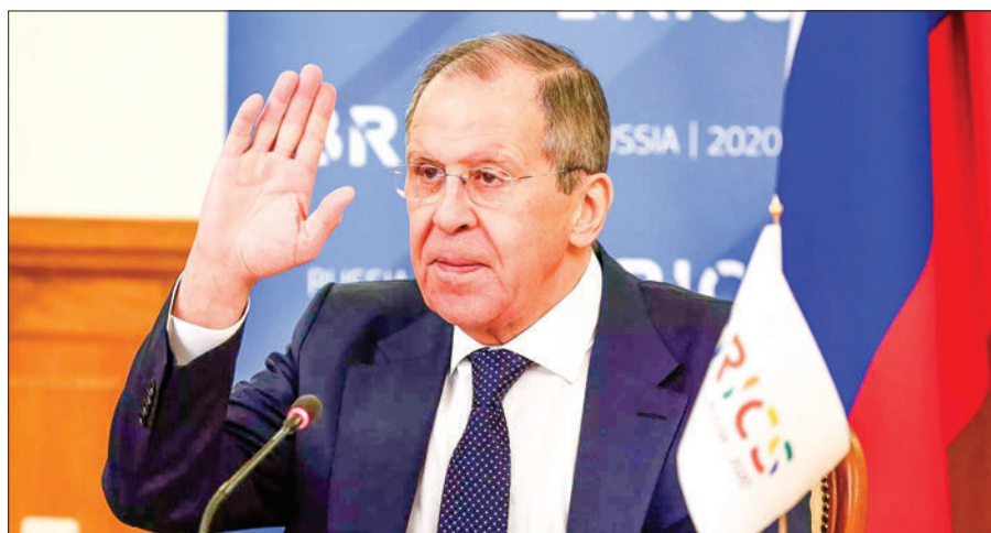
In this handout photo released by Russian Foreign Ministry, Russian Foreign Minister Sergey Lavrov greets his colleagues during a video conference session of the BRICS Foreign Ministers Council dedicated to the coronavirus pandemic, in Moscow, Russia.

Lavrov said that Russia would continue strengthening BRICS' position as a pillar of a fledgling multipolar world. Russia will hold the group's rotating