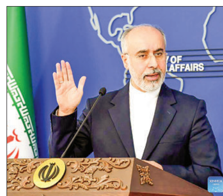
Iranian Foreign Ministry spokesman Nasser Kanaani speaks at a press conference in Tehran, Iran, on 8 January 2024. Kanaani said on Monday that many of the insecurities, instabilities and tensions in West Asia have roots in the US military presence and interventions in the region.

Iraqi Prime Minister Mohammed Shia' al-Sudani said on Friday his government would soon start talks with the US-led coalition in Iraq through a committee to arrange the withdrawal of foreign troops, a move he said was "a commitment that the government will not back down from". The time has come for the US military forces' pullout