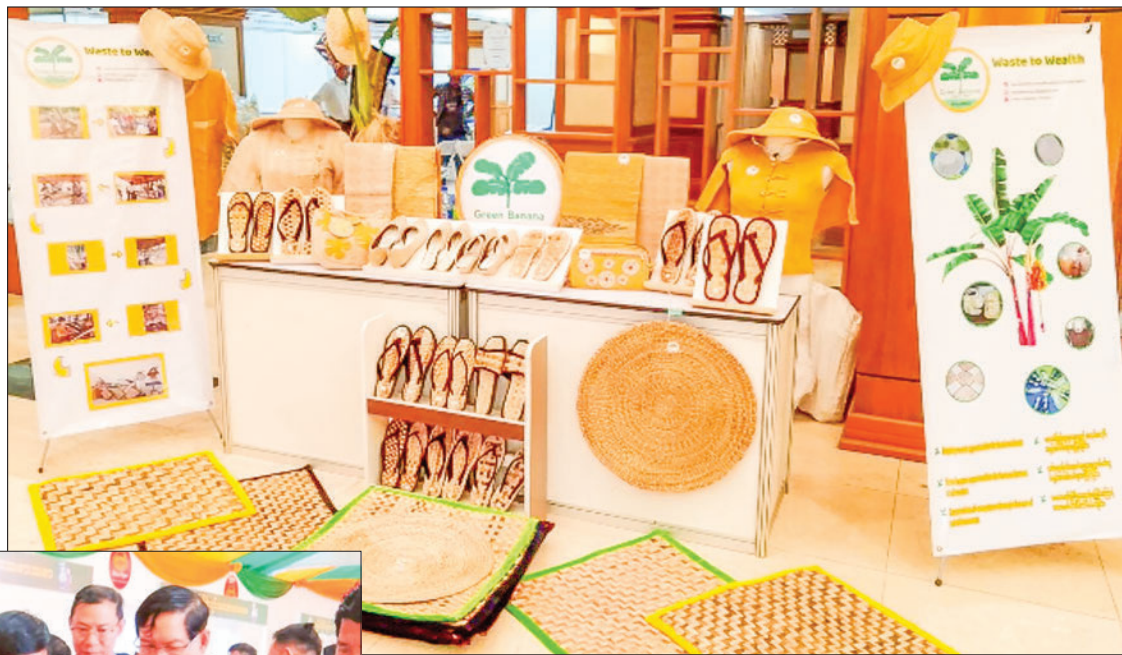
Products made of banana fibres are displayed to attract visitors.