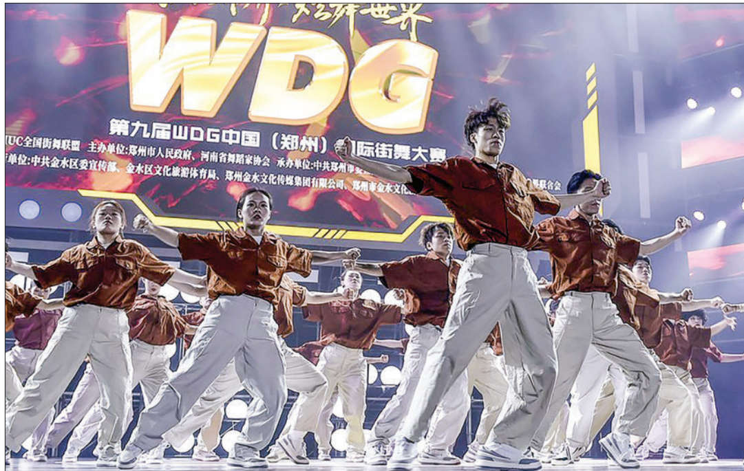
Dancers compete during the final of a street dance competition in Zhengzhou, central China's Henan Province, 16 October 2023.

IN the summer of 2023, a domestic film titled "One and Only" captivated the interest of Chinese audiences, making waves at the box office.