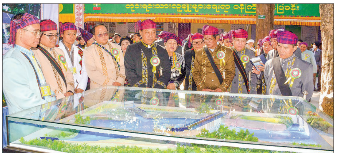
SAC members and Union Ministers visit booth of Border Affairs Ministry displayed at Kachin State Day ceremony yesterday.