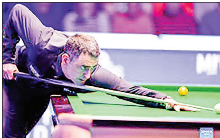
Ronnie O'Sullivan competes during the round 1 match between Ding Junhui of China and Ronnie O'Sullivan of England at Snooker Masters 2024 in London, Britain, 8 January 2024.

However, the 48-year-old O'Sullivan was too sharp to surpass. The Rocket then played two centuries to seal his victory 6-3. — Xinhua