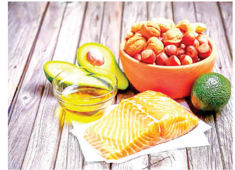
The findings suggest the need for clinical trials to evaluate the efficacy of therapies increasing omega-3 levels in individuals with pulmonary fibrosis and other chronic lung disorders.

Now, there is a query. Is sleep poetic or biological? Reference: New Scientist 25 Nov 2023