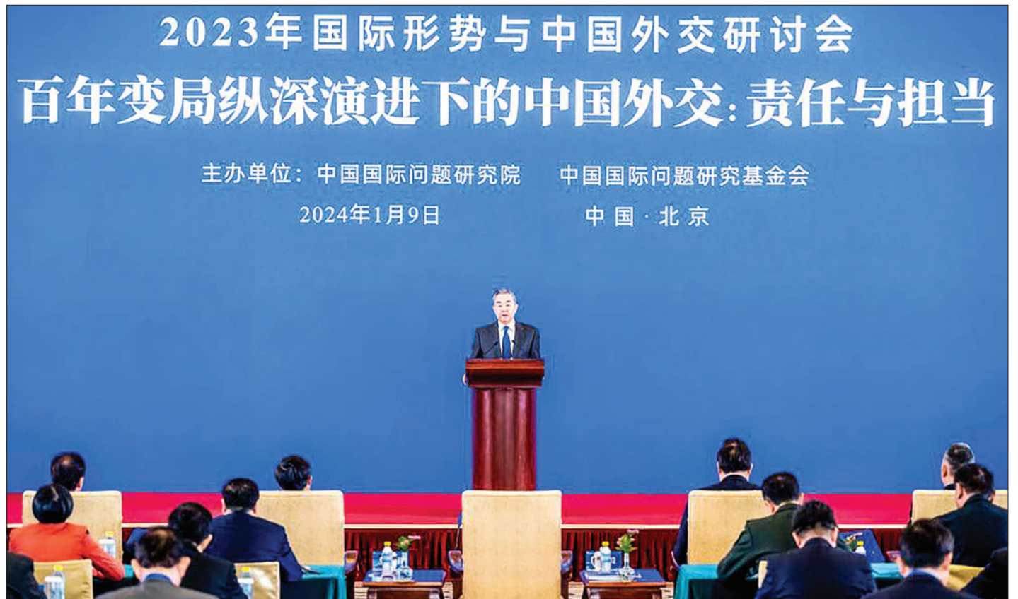
Chinese Foreign Minister Wang Yi, also a member of the Political Bureau of the Communist Party of China Central Committee, addresses the symposium on the international situation and China's foreign relations in 2023 in Beijing, capital of China, 9 January 2024.

Xi and Putin met twice during the year. At the end of 2023, when Russian President Vladimir Putin sent New Year's greetings to Chinese President Xi Jinping,