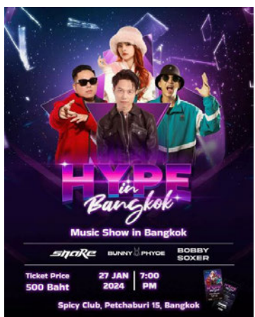
An advertising poster for Hype in Bangkok Music Show.

It is also known that the music show will start at 7 pm at Spicy Club in Phetchaburi 15 of Bangkok. — ASH/ TRKM