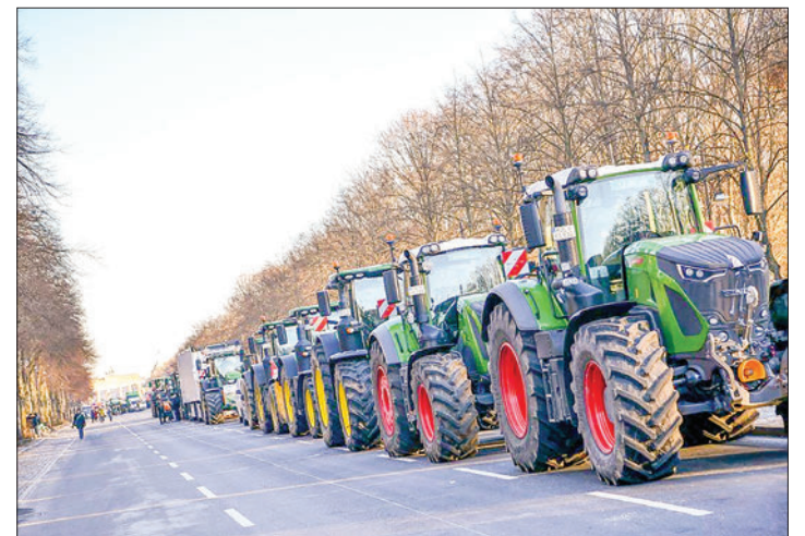
Tractors are seen during a protest near the Brandenburg Gate in Berlin, Germany, 8 January 2024.