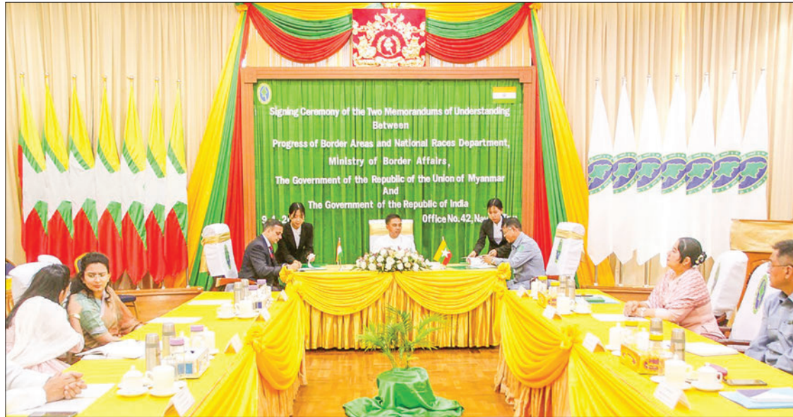
MoU signed between Progress of Border Areas and National Races Department and Indian Government yesterday.

The MoUs will contribute to the construction of a 60 by 30 by 12 feet multi-purpose hall in Taikyan village of Lahe Township of Naga Self-Administered Zone, a 20 feet double-layer one-floor bailey bridge between Lahe-Nanyun (three miles and six furlongs) and a Laung Kyan Naut Gone-Taikyan-Lanhtein route and four 5 by 5 by 26 feet Box Culverts. — MNA/KTZH