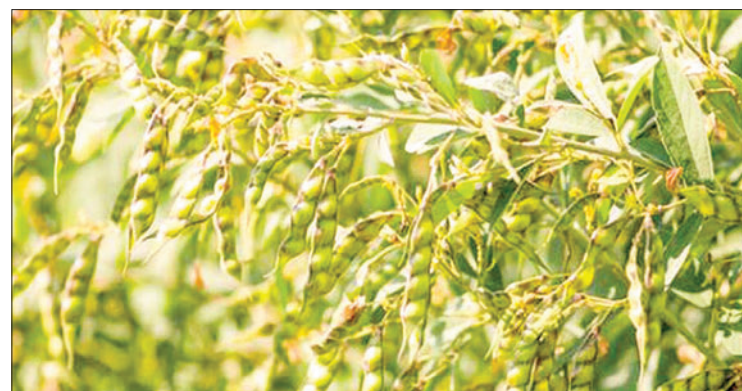
Pigeon pea plants bearing ripening fruits.

Myanmar exported around 1.15 million tonnes of pulses worth over $978 million to foreign trade partners over the past nine months of the current 2023-2024 financial year, the Ministry of Commerce's statistics showed. Myanmar's pulses exports bagged US$1.47 billion from over 1.9 million tonnes in the previous FY 2022-2023, the Ministry of Commerce's statistics indicated. — NN/EM