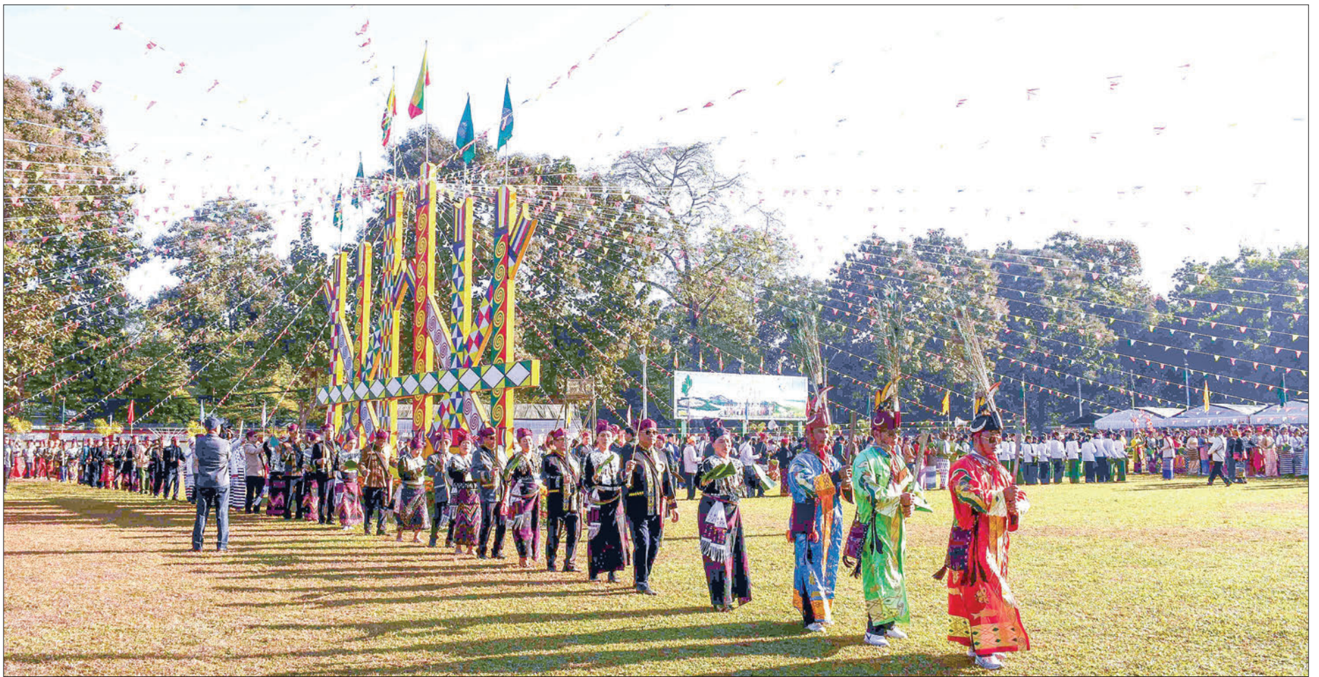
76 th Anniversary of Kachin State Day celebrated with Kachin Manaw Dance on the lawn of Kachin State Government Office yesterday.

T HE ceremony of the 76 th Anniversary of Kachin State Day was organized with Manaw Dance on the lawn in front of the Kachin State