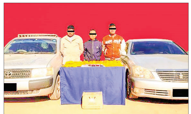
Offenders were seen with the seized drugs and vehicles.

Legal action has been taken against the offenders, and an ongoing investigation aims to arrest the perpetrators involved in the case. — MNA/MKKS