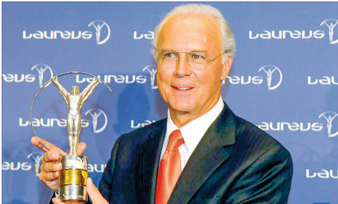
German football legend Franz Beckenbauer has died at 78, according to German Football Association (DFB) on 8 January 2024. This file photo taken on 2 April 2007 shows Franz Beckenbauer posing after winning the Lifetime Achievement Award as the 2007 Laureus World Sports Awards unveiled in Barcelona, Spain.

Beckenbauer's illustrious playing career included winning the European Championship title in 1972. He was the first German footballer to make over 100 international appearances. His successes with the national team include being the runner-up in the World Cup in 1966 and runner-up in the Eu-