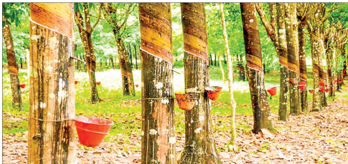
Collection of rubber latex seen at young rubber farm.

Global demand for rubber, rubber production of the South-east Asian nations and the market supply weigh on Myanmar's rubber prices.