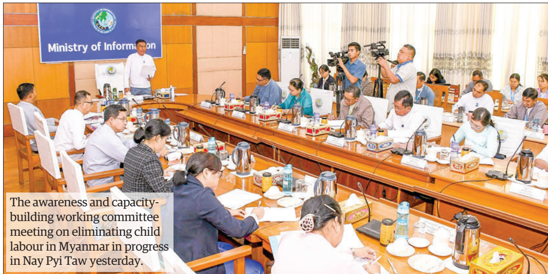
The awareness and capacity-building working committee meeting on eliminating child labour in Myanmar in progress in Nay Pyi Taw yesterday.

THE awareness and capacity-building working committee meeting on eliminating child labour in Myanmar was held yesterday at the Ministry of Information assembly hall in Nay Pyi Taw.