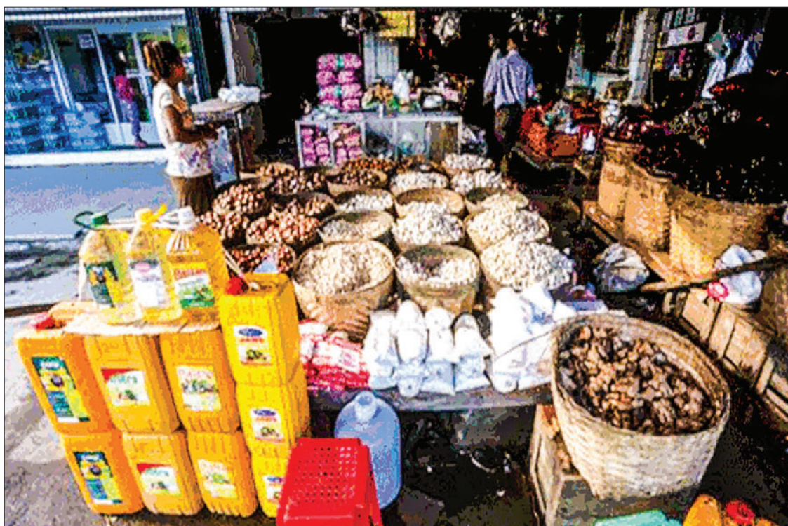
The photo depicts a kitchen grocery outlet in the market.

The price of Kyukok garlic fell on 9 January to K9,300-9,500 per viss. The price of Shan Aungban garlic ranged between