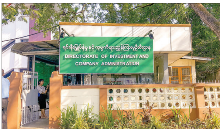
Photo shows Directorate of Investment and Company Administration in Yangon.

All registered companies need to submit AR on the MyCO registry system within two months of incorporation and at least once every year