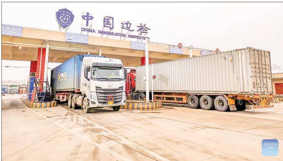
This photo taken on 12 April 2023 shows cargo trucks passing through an immigration inspection checkpoint at Dongxing port in Dongxing, south China's Guangxi Zhuang Autonomous Region.

As the world's largest free trade agreement, the RCEP includes 10 ASEAN members, China, Japan, the Republic of Korea, Australia and New Zealand. The 15 states' total population, gross domestic product and trade all account for about 30 per cent of the world total. According to China's General Administration of Customs, ASEAN remained China's largest trading partner in the first 11 months of 2023, with the total trade between the two sides reaching 5.8 trillion yuan (about 816.9 billion US dollars), up 0.1 per cent year on year. — Xinhua