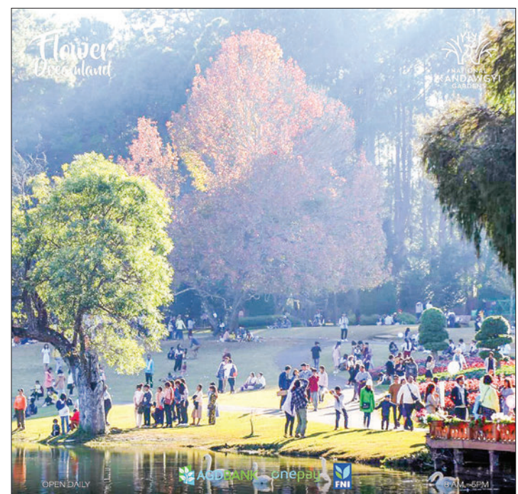
The visitors seen at the PyinOoLwin Flower Festival.

garden has been leased to the Htoo Group of Companies for 15 years starting from 2010. — ASH/TRKM