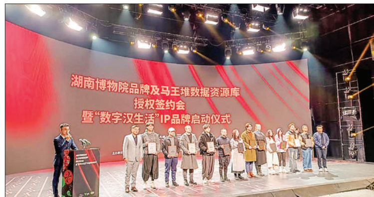
This photo taken on 8 January 2024 shows a scene at the launch ceremony in Changsha, central China's Hunan Province. The Hunan Museum made the digital database on the world-famous Mawangdui Tombs available to colleges and companies on Monday, becoming the latest Chinese museum aiming to turn archaeological finds into popular cultural brands. PHOTO: XINHUA

The site gained international attention in the 1970s when researchers opened a coffin and found a female corpse that showed no signs of decay. The corpse, now preserved in the museum, is said to be that of a woman named Lady Xin Zhui, the wife of the Marquis of Dai. — Xinhua