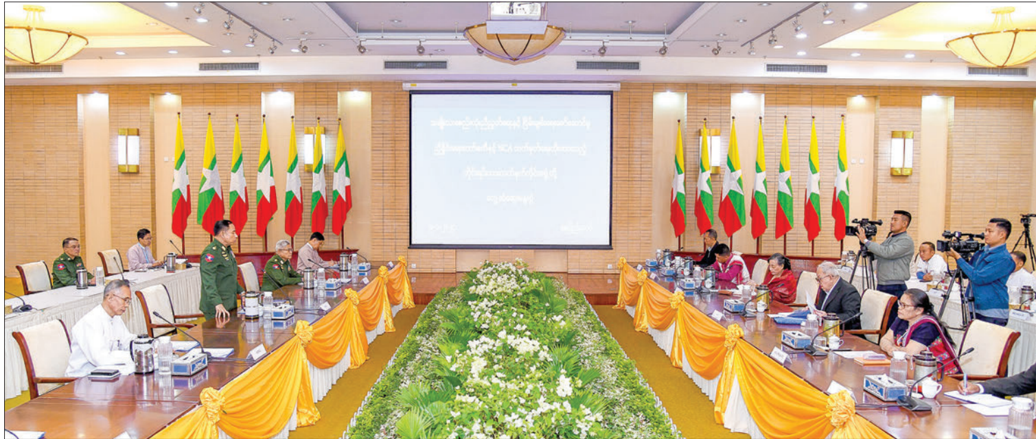
NSPNC meets seven NCA signatory ethnic armed organizations in Nay Pyi Taw yesterday.

A meeting between the National Solidarity and Peacemaking Negotiation Committee and seven NCA-signatory EAOs took place at the NSPNC centre in Nay Pyi Taw yesterday morning.