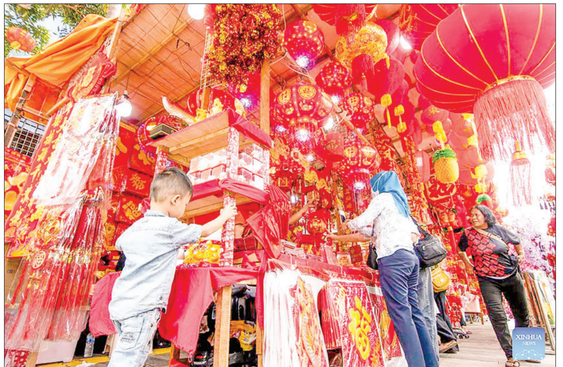
People shop for decorations at Pancoran Glodok in Jakarta, Indonesia, 9 January 2024.

Memorandums of Understanding are in the process of being signed to initiate the study and possible construction of 28 hydro stations. Project Development Agreements are being signed on another 15 schemes, while 11 more hydro plants are at the concession agreement stage. — Xinhua