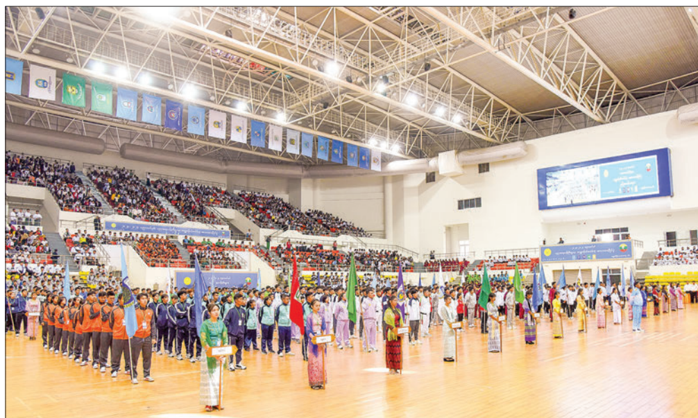
SAC Vice-Chairman Deputy Prime Minister Vice-Senior General Soe Win addresses opening of Inter-University Sports Competitions for the 2023-24 academic year in Nay Pyi Taw.

He recounted that the Myanmar sports contingent comprising university students participated in the 5 th SEAP Games hosted by Myanmar in Yangon from 6 to 13 December 1969, sweeping 57 gold, 46 silver and 43 bronze medals on the chart's top position. Of them, he contin-