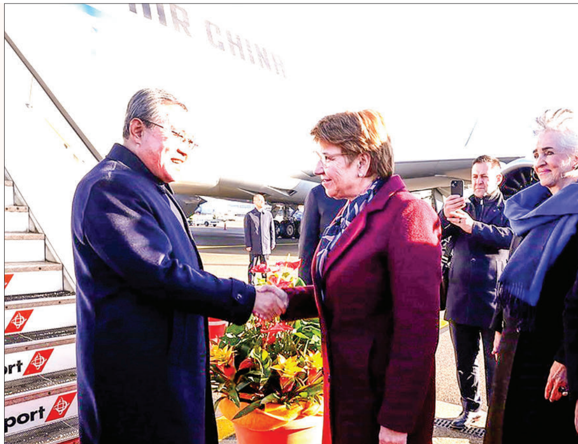
Chinese Premier Li Qiang is greeted by Viola Amherd, president of the Swiss Confederation, upon his arrival at Zurich international airport in Zurich, Switzerland, 14 January 2024.

Ireland wants to have "a very strong and constructive relationship with China", said Varadkar, "one based on trust and respect,