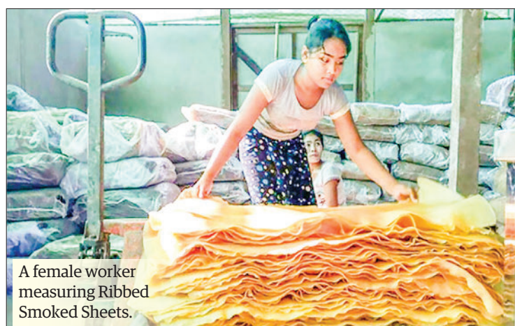
A female worker measuring Ribbed Smoked Sheets.

and 200 to the Republic of Korea, with over 120 to Japan. China constitutes 75 per cent of Myanmar's rubber exports, while the rest is distributed among Singapore, Malaysia, Indonesia, the ROK, and Japan. At borders, Myanmar exported over 3,540 tonnes of rubber valued at $4.84 million, with 2,539 tonnes going to China and 1,008 to Thailand. In December, rubber exports through maritime and border channels amounted to $20.97 million from over 15,650