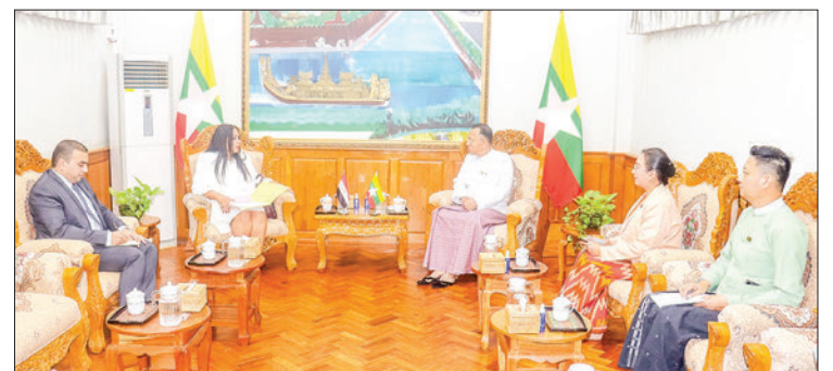
Union Minister for Investment and Foreign Economic Relations Dr Kan Zaw receives Mrs Aya Saad Mohamed Abdelkarim, Ambassador of the Arab Republic of Egypt to Myanmar in Nay Pyi Taw yesterday.

of the Arab Republic of Egypt to the Republic of the Union of Myanmar. They cordially exchanged views on measures to boost the bilateral economic cooperation between Myanmar and Egypt. The meeting was also attended by the Deputy Minister and senior officials from the Ministry of Investment and Foreign Economic Relations. — MNA