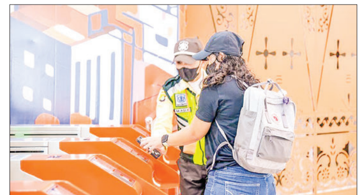
A staff member helps as a passenger checks in at the Halim Station in Jakarta, Indonesia, 17 January 2024.

The Jakarta-Bandung High-speed Railway (HSR), the first of its kind in Indonesia and Southeast Asia, aims to serve 31,000 passengers per day in 2024.