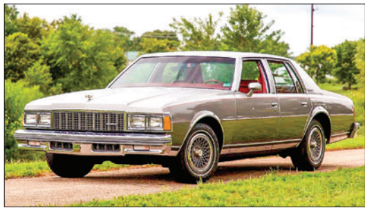
A 1979-1980 Chevrolet Caprice car is seen.

THE Ministry of Transport and Communications in Myanmar is planning to re-register cars manufactured in 1980 and earlier, which had their registrations cancelled, as classic vehicles. This initiative aims to officially preserve the value of ancient classic vehicles, allowing old classic vehicles with cancelled registrations to be registered again with a specific fine.