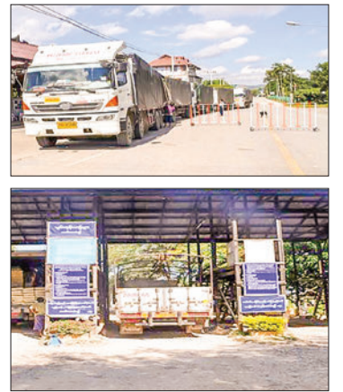
Some trucks are seen entering Tachilek checkpoint.

Furthermore, Myawady border trade crossed $24.518 million in December 2023, comprising exports worth $6.819 million and imports worth $17.699 million. The trade witnessed a drop of