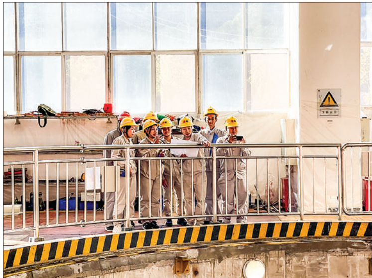
Engineers and technicians seen at successful lifting of the rotor of 2# generator set at Dapein (1) Hydropower Station in Myanmar.