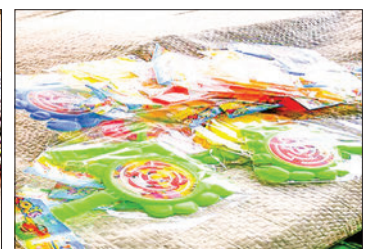
Smuggled toys seized in Yangon Region on 17 January.

(approximately worth K100 million) carrying six kinds of goods worth K11.906 million, including 21 toy cars and 4,000 kilogrammes of toys that were not declared in the Import Declaration (ID), at the Ywathagyi Dry Port on 17 January. The action was conducted under the Customs procedures.