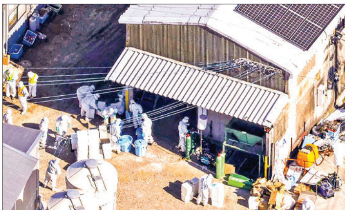
Photo taken from a Kyodo News helicopter on 25 November 2023, shows officials in protective suits working to cull about 40,000 chickens at a poultry farm in Kashima in Saga Prefecture, southwestern Japan, after the season's first outbreak of bird flu across the country was confirmed there.

be allowed entry to the Philippines,” it said. — Xinhua