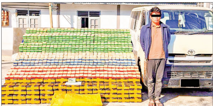
Heroin seized in Pyigyidagun Township.

A total of 44 kilogrammes of heroin, valued at K1.1 billion, was seized in Pyigyidagun Township of Mandalay Region, as reported by the Myanmar Police Force.