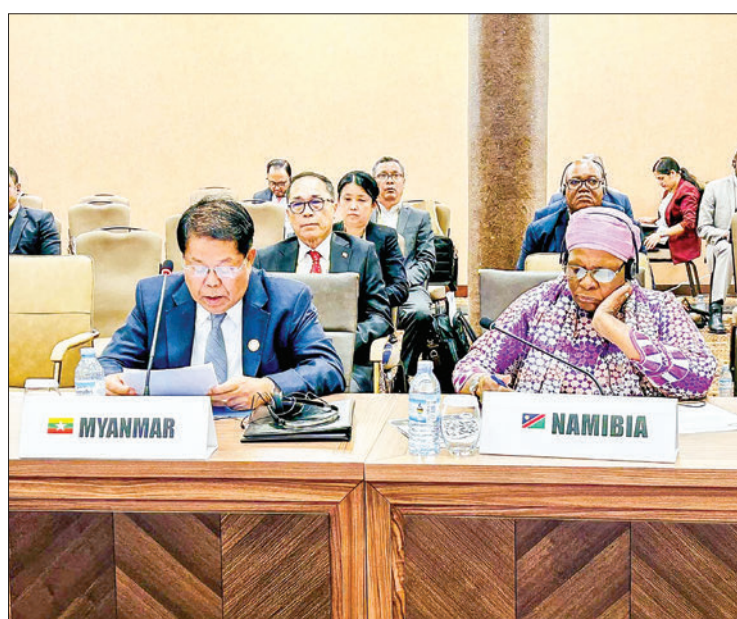
Deputy Prime Minister and Union Minister for Foreign Affairs U Than Swe delivers his statement at the Ministerial Meeting of the Non-Aligned Movement.

today is confronting with multi-faceted international security environment and daunting challenges, the NAM must remain as the most relevant platform for the common interest of developing countries. He mentioned that as a founding member of the NAM, Myanmar has been strictly following the principles of NAM. He also stressed the need for NAM to continue to maintain its solidarity in consistent with its established rules and norms. The Deputy Prime Minister also assured Myanmar's commitment to work hand-in-hand with other NAM member countries towards achieving peace, prosperity, justice, equality and development of the developing countries and beyond. In his statement, the Deputy Prime Minister also apprised the meeting of the Myanmar Government's efforts to ensure peace, development and democracy in the country and the