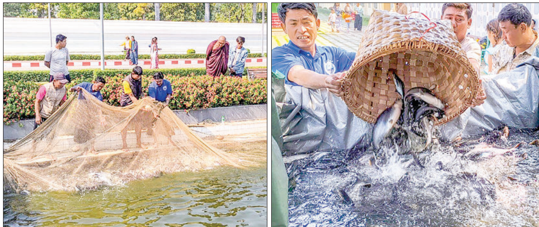
Netting fish in the ponds.