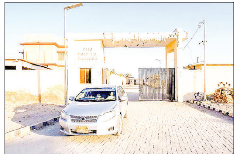
A car leaves the district headquarter hospital (DHQ) in Panjgur town of Balochistan province where victims of an Iranian air strike were moved.

Terming Iran as a brotherly country, the ministry said Pakistan always emphasized dialogue and cooperation in confronting common challenges including the menace of terrorism and would continue to endeavor to find joint solutions. — Xinhua