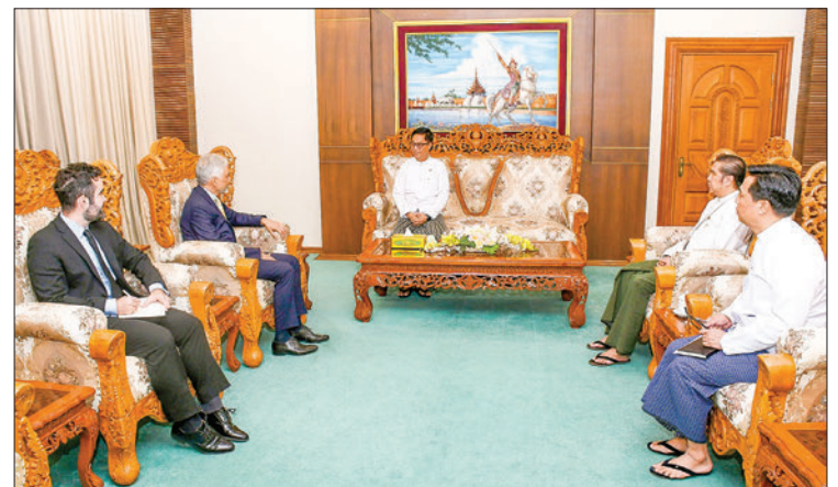
Deputy Minister for Foreign Affairs U Lwin Oo receives Brazilian Ambassador Mr Gustavo Rocha de Menezes yesterday.

anmar and they cordially exchanged views on enhancement of Myanmar-Brazil bilateral relations and potential areas of communication for mutual benefit, including the technical cooperation in the production of snake anti-venom in Myanmar, as well as the expansion of bilateral cooperation in the fields of aviation, agriculture, trade, health, sports and technology and the holding of political consultations between Myanmar and Brazil as well as closer collaboration in the international arenas.— MNA