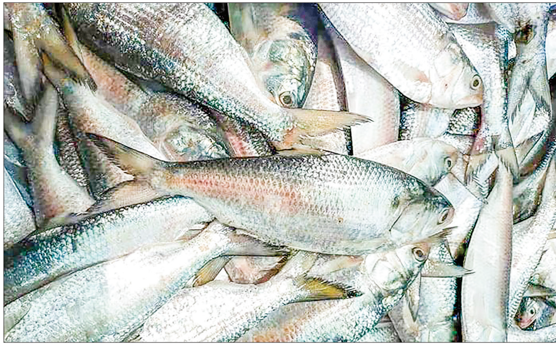
Myanmar's Hilsa shad.

"While Bangladesh and India export hilsa at rates of 65 per cent and 32 per cent, respectively, Myanmar struggles with a mere three per cent export capacity. Rakhine State, contributing only 0.5 per cent, faces particular chal-