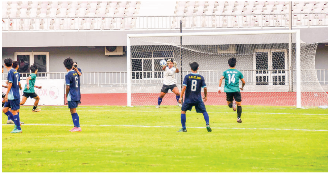
SAC Chairman Prime Minister Senior General Min Aung Hlaing watches the final match between Mawlamyine and Myitkyina zone teams in Inter-University football Tournament at Wunna Theikdhi Stadium in Nay Pyi Taw yesterday.

MAWLAMYINE Zone team clinched the championship trophy with a 5-3 win over Myitkyina Zone team in the inter-university football tournament for 2023-24 academic year yesterday.