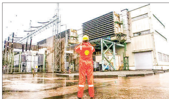
Shell is selling its onshore facilities in Nigeria to focus on offshore production.

"Shell has reached an agreement to sell its Nigerian onshore subsidiary The Shell Petroleum Development Company of Nigeria Limited (SPDC) to Renaissance,