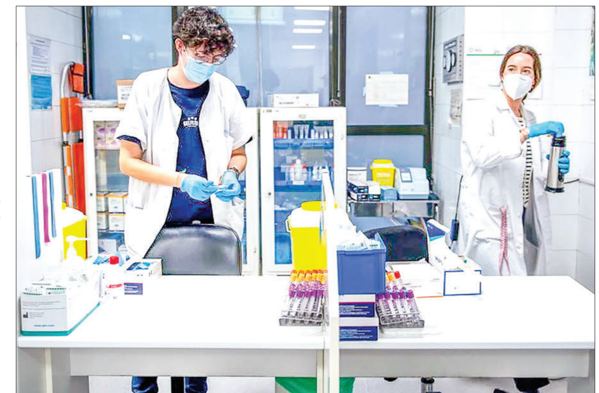
Medical staff work at a clinic in Madrid, Spain, 15 January 2024. Spain reported a sharp rise in respiratory illnesses, with the infection rate soaring to over 952 cases per 100,000 inhabitants. The peak of infections was set to arrive, Health Minister Monica Garcia warned last week.