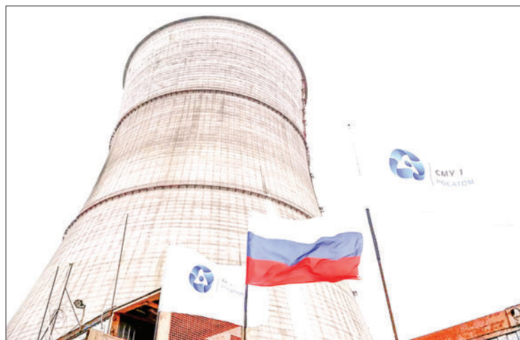
A Russian national flag and flags with the logo of Rosatom flutters at the construction site of a cooling tower at the Kursk II nuclear power plant near the village of Makarovka outside Kurchatov, Kursk region, Russia. PHOTO: MAKSIM BLINOV / SPUTNIK

The BN-1200M, equipped with a fast neutron nuclear reactor, is set to be the first of its kind in commercial installations. Director Ivan Sidorov confirmed that the construction is scheduled to begin in 2027. — SPUTNIK