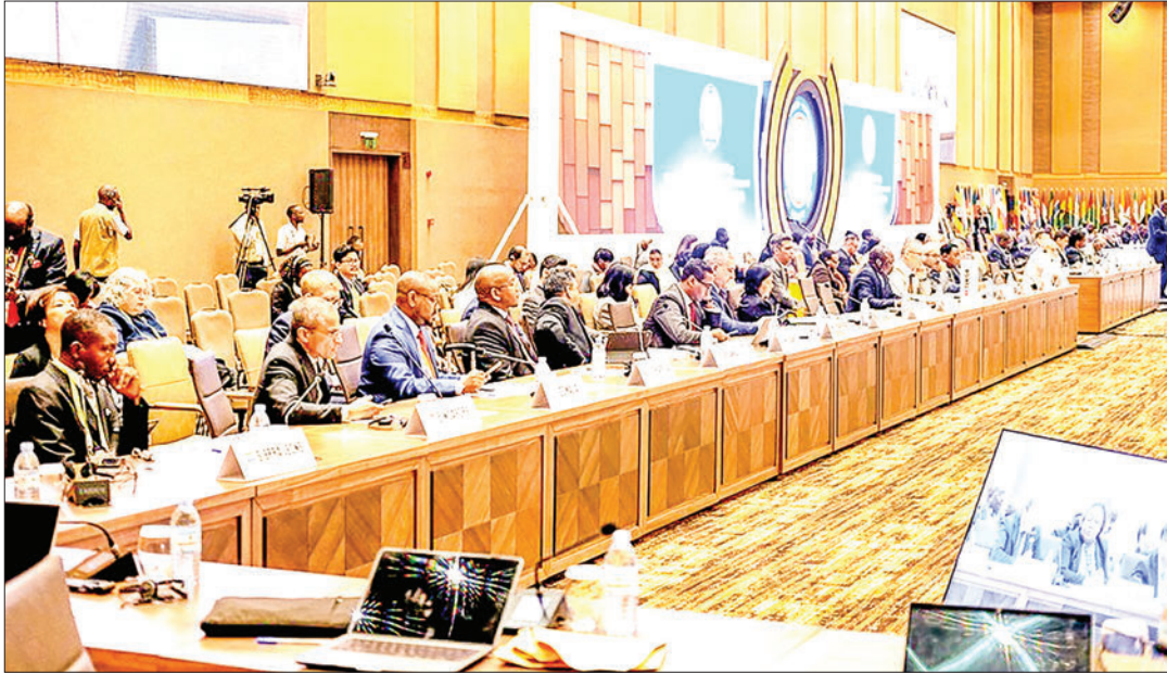
Senior officials from members of the Non-Aligned Movement (NAM) attend a meeting in Kampala, the capital of Uganda, on 15 January 2024.

NON-ALIGNED Movement (NAM) member states meeting here are coalescing positions to ensure that the 120-member state organization has a greater say in international affairs.