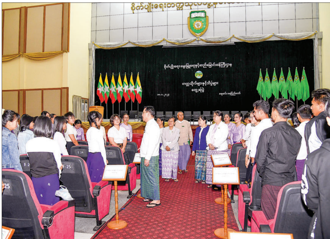
Union Minister for Information U Maung Maung Ohn cordially greets students and faculty members at Yezin University of Agriculture yesterday.

Speaking at the event, the Union Minister stated that malicious media outlets are deliberately spreading misinformation through social media platforms with the malicious intention to mislead the public and harm the peace and stability of the nation. Therefore, people should read the newspaper published by the ministry and access the website. Moreover, everyone should believe in the real situation of the country and stand with the