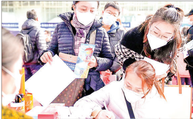
A job seeker fills in a form for employment at a job fair in Harbin, northeast China's Heilongjiang Province, 18 March 2023.

The surveyed unemployment rates of the 16-24, 25-29 and 30-59 age groups, excluding students, were 14.9 per cent, 6.1 per cent and 3.9 per cent, respectively. — Xinhua