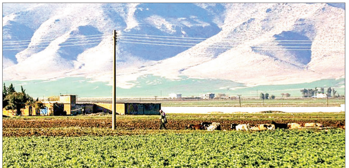
Agriculture was once a pillar of northeast Syria's economy, but years of war and the effects of climate change have dealt a blow to farmers. PHOTO: AFP

lamic State group's brutal "caliphate" in Syria until their ouster from the city in 2017. — AFP