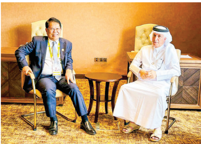
Deputy Prime Minister and Union Minister for Foreign Affairs U Than Swe meets with the State Minister for Foreign Affairs of Qatar.

ON the sidelines of the Ministerial Meeting of the Non-Aligned Movement (NAM) being held in Kampala, Uganda,