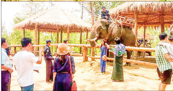
Travellers and elephants are seen in Ngalaiktha elephant protection camp.