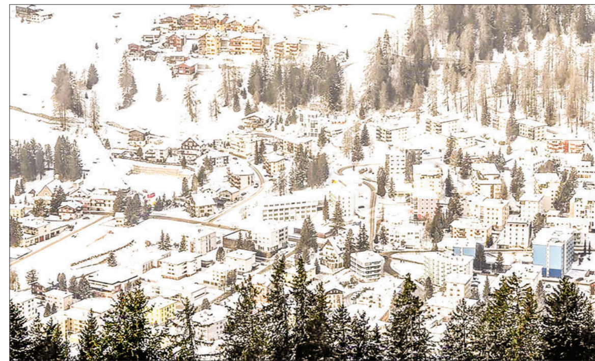
This file photo taken on 20 January 2023 shows a view of the snow-covered Davos in Switzerland.

The annual World Economic Forum (WEF) in Davos is set to bring together global dignitaries, focusing on discussions to revive the world economy.