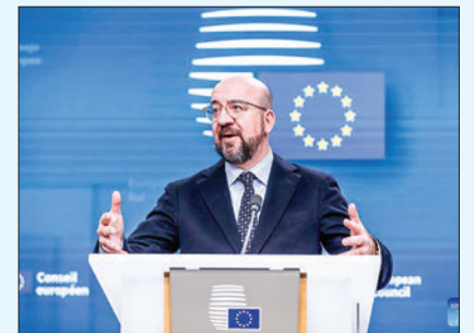
This file photo taken on 15 December 2023 shows European Council President Charles Michel speaking at a press conference during the European Council meeting in Brussels, Belgium. European Council President Charles Michel has informed Belgian media of his decision to run for the election of the Member of European Parliament (MEP) in June, leading to his early departure from the Council presidency in July.

The Palestinian death toll from the ongoing Israeli attacks on the Gaza Strip rose to 22,835, and the injuries have reached 58,416, the Gaza-based Health Ministry said Sunday. Additionally, around 1,200 people in Israel have lost their lives due to the Hamas attack. — Xinhua