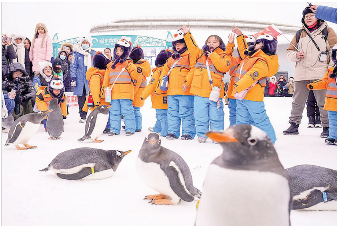
Children from south China’s Guangxi Zhuang Autonomous Region meet with penguins as they visit the Harbin Polarpark in Harbin, northeast China’s Heilongjiang Province, 6 January 2024.

As Guangxi is closely linked with sugar oranges, which has a peel colour exactly the same as the down jackets worn by the