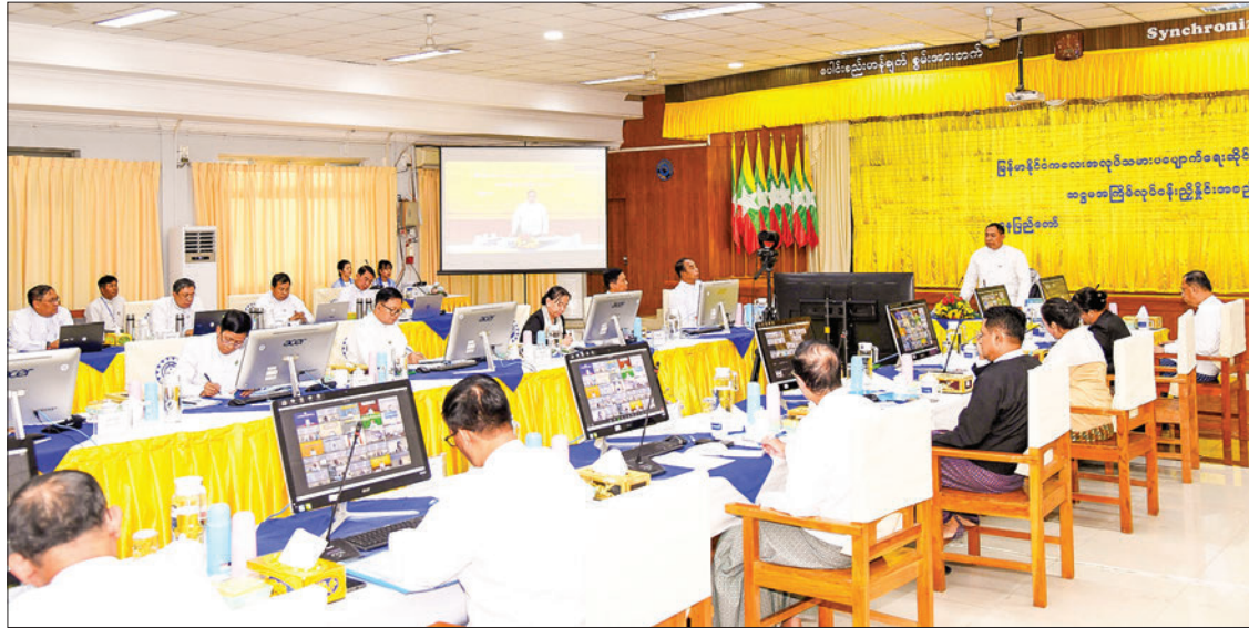
Myanmar National Committee on Child Labour Elimination in progress in Nay Pyi Taw yesterday.

He continued that the child labour elimination activities aim to promote awareness and knowledge concerning child labour, ensure the qualification of Union and regional/state-level organizations to settle child labour problems, designate responsibilities, and implement child labour elimination long-term plans through progress assessment.