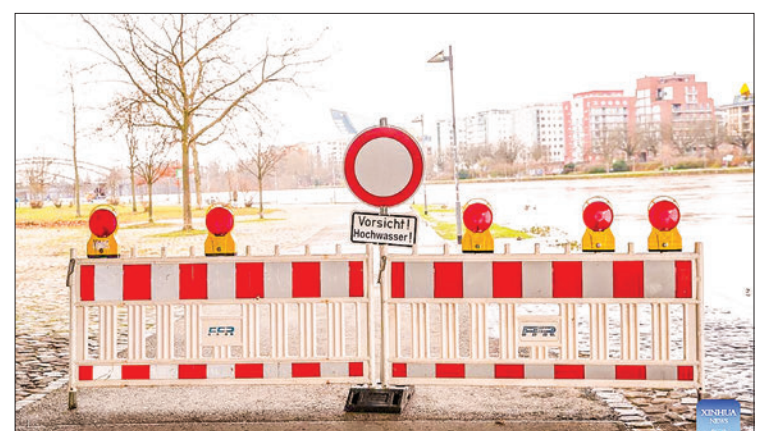
A warning sign of floods is seen in Frankfurt, Germany, 7 January 2024. Some areas in Frankfurt were flooded due to continuous rainfall and rising water level of the Main River.

The meteorological department has issued warnings of heavy rains due to the northeast monsoon, which typically lasts from October to March, with strong winds and rough seas expected in northern states and the east coast of the Southeast Asian country. — Xinhua