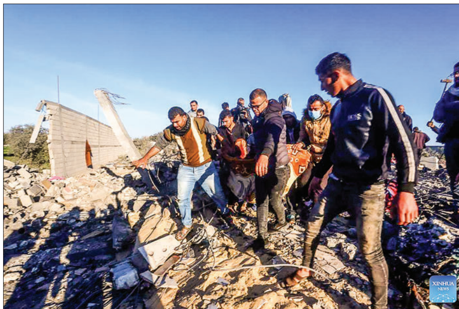
Rescue work is underway after Israeli attacks in the southern Gaza Strip city of Rafah, on 7 January 2024.

Halevi also said the IDF would increase "the pressure it exerts" on Israel's northern border with Lebanon, where it has traded fire with Hezbollah,