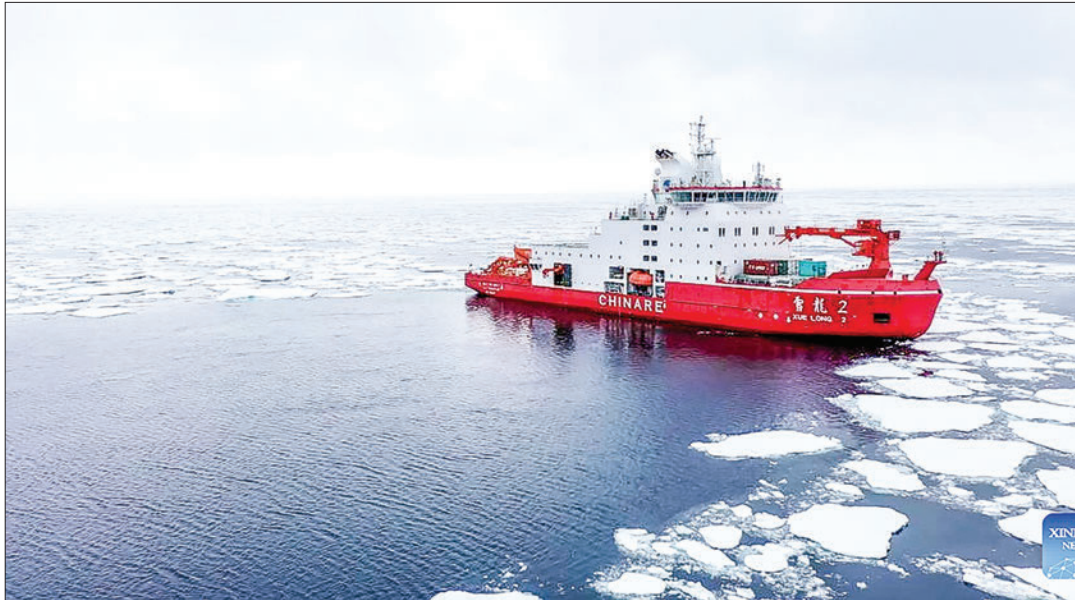
This aerial photo taken on 6 January 2024 shows China's research icebreaker Xuelong 2 conducting scientific expedition in the Amundsen Sea. Members of China's 40 th Antarctic expedition team have recently conducted scientific work aboard China's research icebreaker Xuelong 2 in the Amundsen Sea.