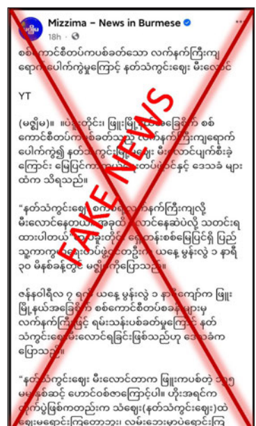
A screen-shot of misinformation.

information on social media through malicious news media. — MNA/KZW