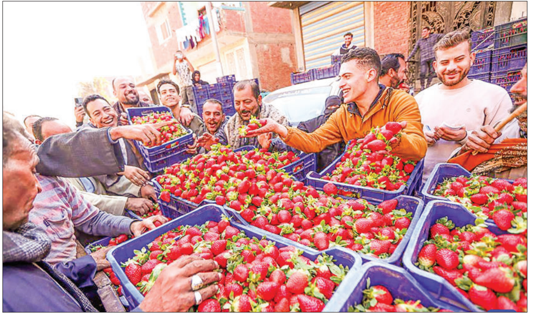
People buy freshly harvested strawberries at a market in Qalyubia Governorate, Egypt, 6 January 2024.

This year marks the 45 th anniversary of the establishment of a sister city relationship between Dalian and Kitakyushu. The resumption of the air route will help strengthen personnel, economic and trade exchanges between northeast China and Kitakyushu, according to sources with the Dalian international airport. — Xinhua