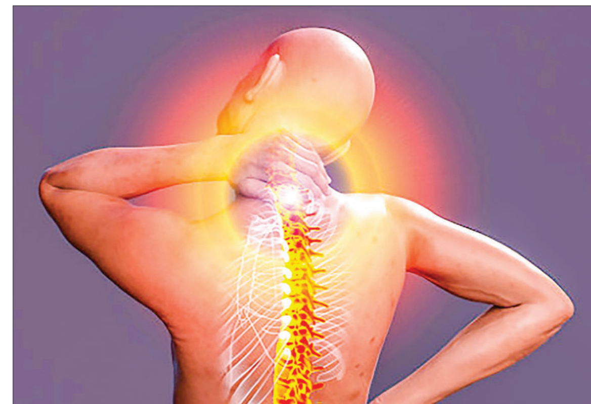
Fibromyalgia, characterized by widespread pain, exhaustion, and stiffness, lacks a known cure, and current medications often prove insufficient in efficacy.

A study from the Karolinska Institutet finds no substantial differences in treating fibromyalgia between exposure-based Cognitive Behavioral Therapy (CBT) and standard CBT, both significantly reducing symptoms in affected individuals.