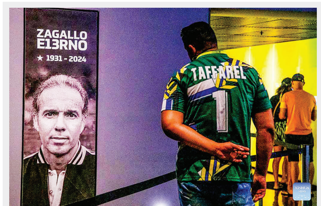
A fan walks past the poster in tribute to Brazilian football legend Mario Zagallo at the museum of the Brazilian Football Confederation (CBF), in Rio de Janeiro, Brazil, 7 January 2024. Mario Zagallo died on 5 January at the age of 92.

In other fixtures, Roma tied with Atalanta 1-1, Lazio beat Udinese 2-1 away. — Xinhua