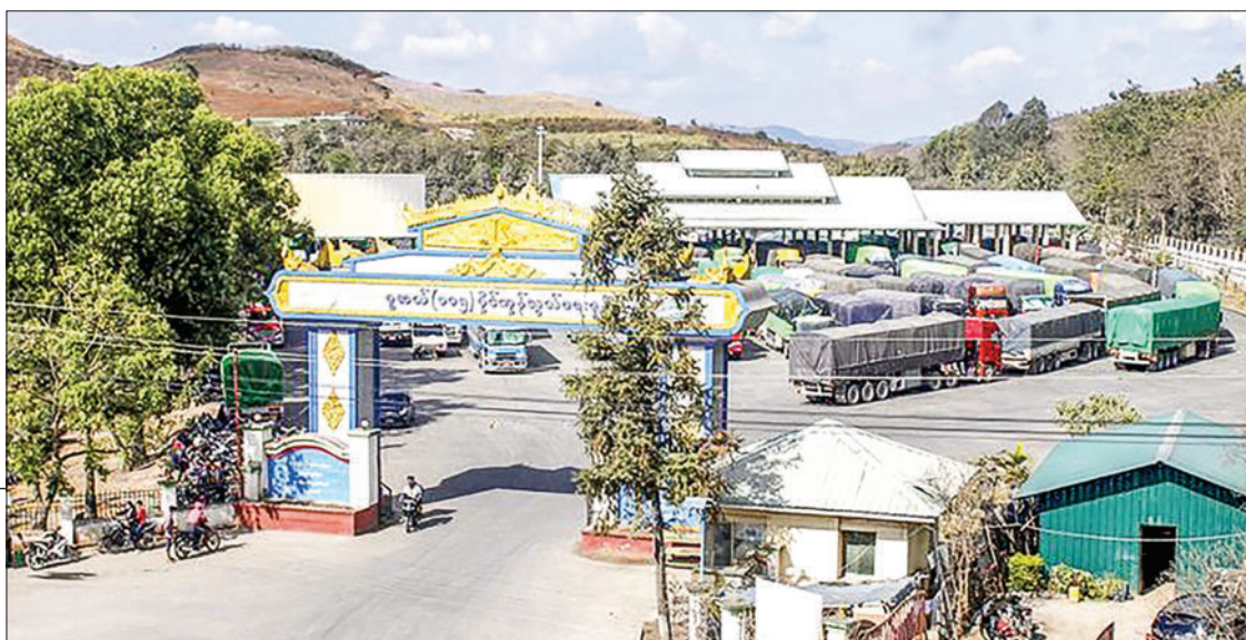
Muse 105 th -Mile Trade Zone.

On 8 November 2023, similar events occurred at the Muse and Chinshwehaw borders, and goods were relocated to other posts. — NN/EM