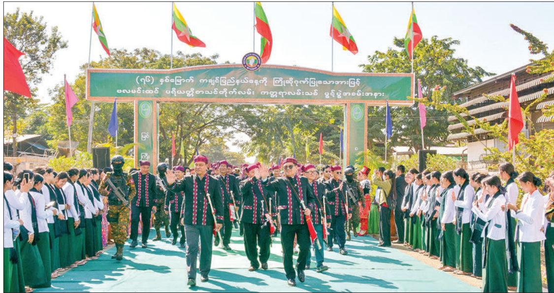
State Administration Council Member Deputy Prime Minister Union Minister for Defence Admiral Tin Aung San warmly greets local people at the opening ceremony of Pariyatti Monastery tar road yesterday in Myitkyina, Kachin State.

SAC Member Daw Dwe Bu, Union Minister for Border Affairs Lt-Gen Tun Tun Naung, Union Minister for Agriculture, Livestock and Irrigation U Min Naung, Union Minister for Information U Maung Maung Ohn