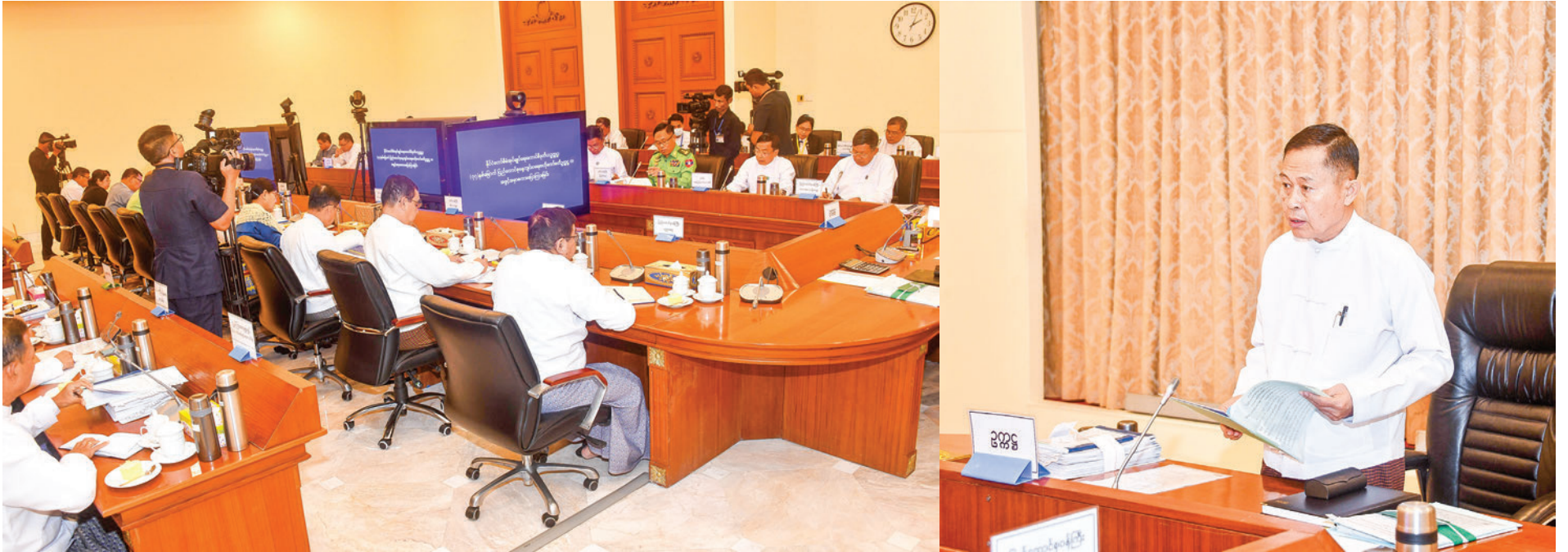
SAC Vice-Chairman Deputy Prime Minister Vice-Senior General Soe Win addresses the meeting of the Central Committee on Organizing 77 th Anniversary of Union Day yesterday.