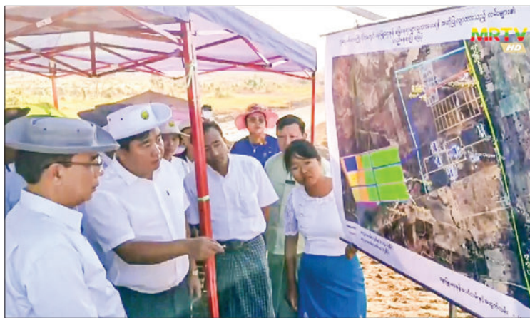
Officials observe the map of the zone and land allocation.

The three-storey cold storage building can store the normal vaccines, COVID-19 vaccines and related devices at different temperatures. — MNA/KTZH