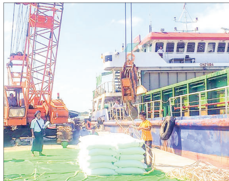
Bags of rice being loaded aboard cargo vessel at Patheingyi Port for exporting rice to Bangladesh.

Myanmar has implemented the National Export Strategy (NES) 2020-2025 to boost exports. The priority sectors of the NES consist of agricultural production, garment and apparel, industrial and electronic device, fishery business, forest product, digital manufacturing and service, logistic service, quality management, trade information service, innovation and entrepreneurship sectors. — NN/KK