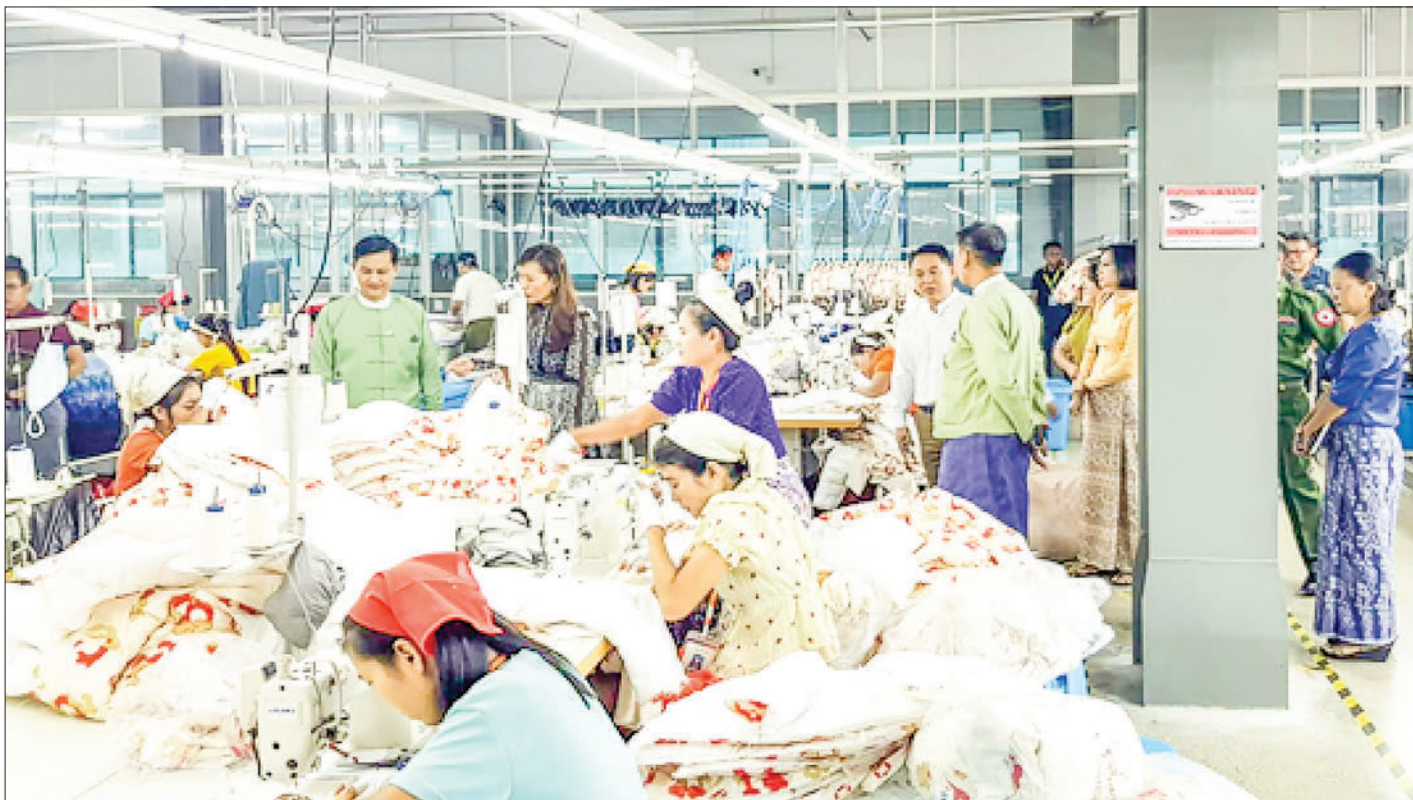
The Yangon Region Investment Monitoring Team inspects a garment factory working on the CMP basis on 11 October 2023.