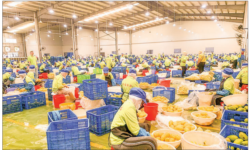
Workers slice ripe mangoes at the Zhong Bao (Cambodia) Food Science & Technology Co., Ltd in Kampong Speu province, Cambodia on 7 March 2023.

Key agricultural items for exports included rice, rubber, cassava, mangoes, fresh bananas, pepper, cashew nuts, longan, corn, and palm oil, among others.