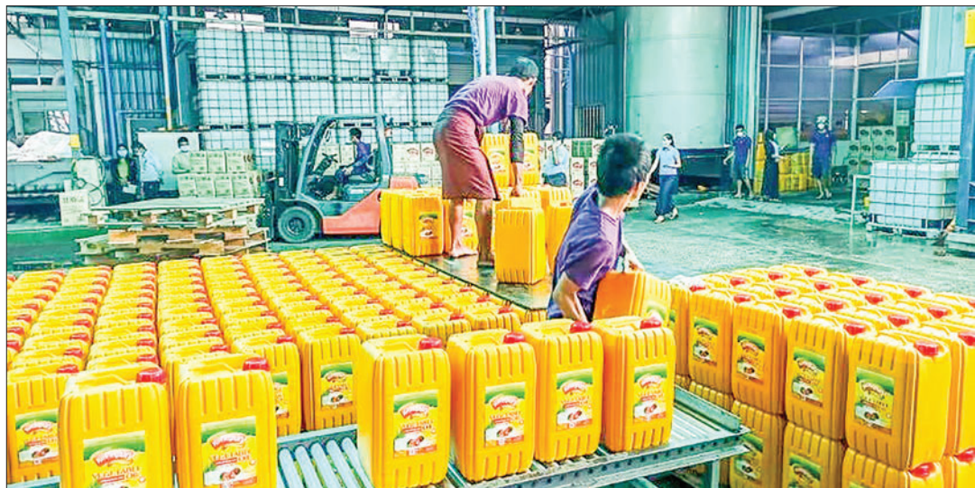
Palm oil production in Taninthayi Region.

ACCORDING to the Supervisory Committee on edible oil import and distribution, the wholesale reference rate of palm oil for the Yangon market has stayed the same for three weeks.