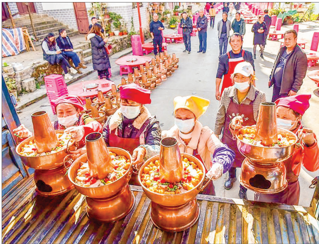
Staff members prepare for a copper hot pot banquet in Wenshan Zhuang and Miao Autonomous Prefecture, southwest China's Yunnan Province, 6 January 2024. Yunnan has attracted legions of tourists this winter due to its mild climate.