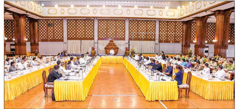
Patron of Yangon Region Child Labour Elimination Committee Yangon Region Chief Minister U Soe Thein addresses the coordination meeting of the committee.

Yangon market sees a daily supply of 200,000 visses of onions. With 22,000 visses of onions entering the Pakokku market that day, the price hit the highest of K2,500 per viss only. The highest prices were K1,500-2,900 per viss in the Myingyan market, with an influx of 190,000 visses of onions. — TWA/EM