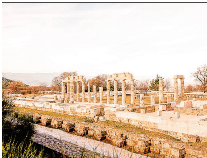
This photo taken on 5 January 2024 shows a view of the site of a palace of the ancient kingdom of Macedonia at the archaeological site of Aigai in Vergina, Greece.

GREECE is ready to reopen on Saturday a palace of the ancient kingdom of Macedonia where Alexander the Great (356 B.C.-323 BC) was declared king.