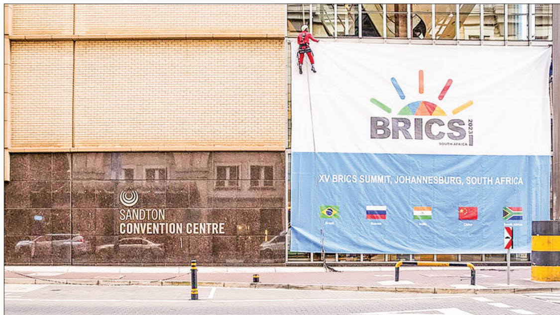
A worker arranges a signboard of the 15 th BRICS summit outside the Sandton Convention Centre in Johannesburg, South Africa, 17 August 2023.

Originally comprising Brazil, Russia, India, China, and South Africa, the BRICS group welcomed Egypt, Ethiopia, Iran, Saudi Arabia and the United Arab Emirates as new members during the bloc’s summit in August 2023. Their membership has