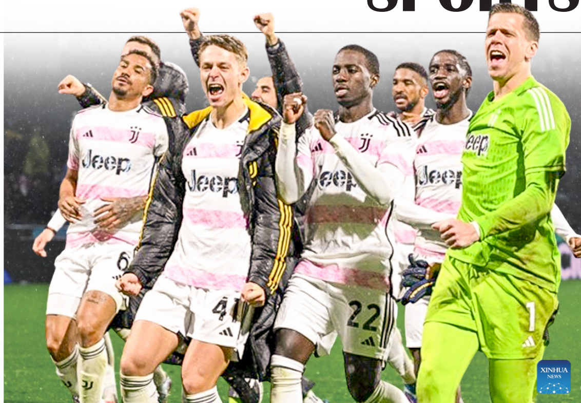
FC Juventus players celebrate at the end of the Italian Serie A football match between Salernitana and FC Juventus in Salerno, Italy, 7 January 2024.

The Rossoneri put their nose ahead in the 11 th minute when Rafael Leao collected the ball on the left side and out-