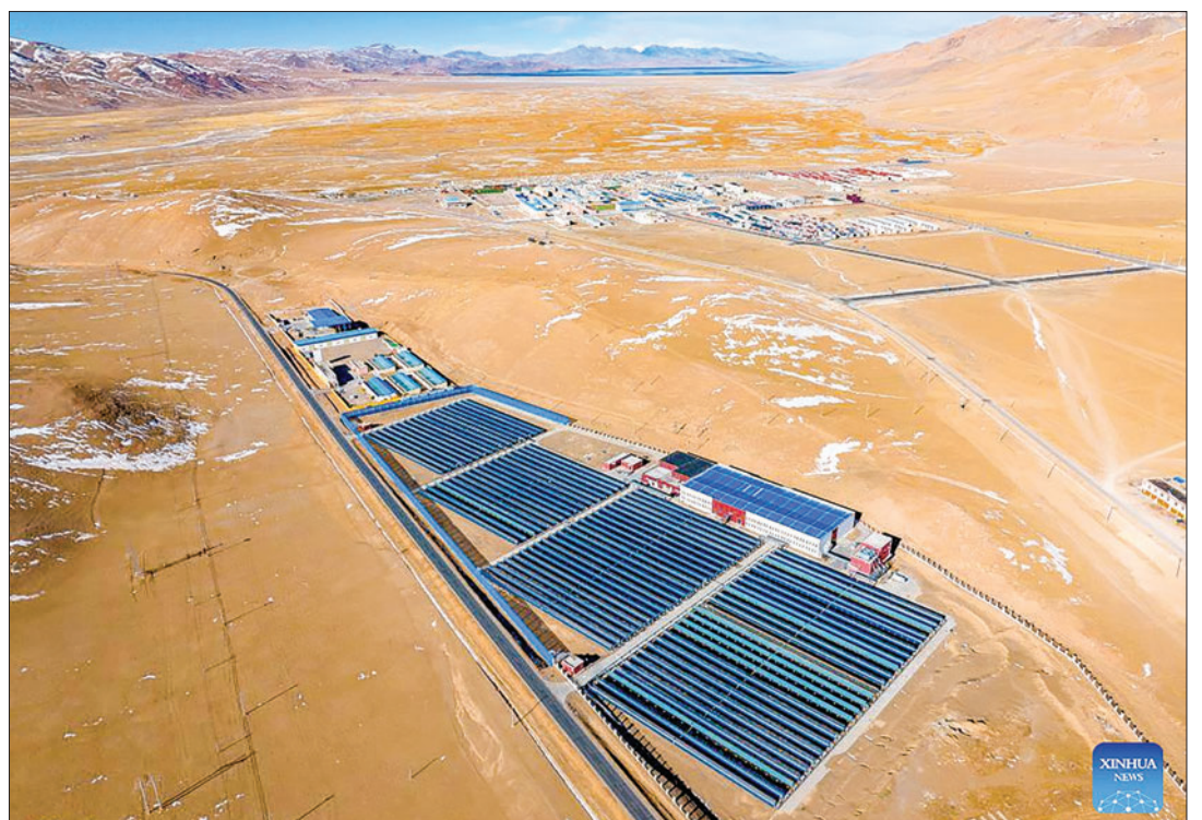
This aerial photo taken on 6 January 2024 shows solar thermal collectors at a heating plant in Xainza County, southwest China's Xizang Autonomous Region. Xainza situated at an average elevation of 4,700 metres deep in the Qinghai-Tibet Plateau has fiercely cold weather in winter, when locals used to keep themselves warm by burning cow dung. The situation was ended for good when a central heating system powered by solar energy was put into operation in the county in 2019, which ensures warmer indoor space while reducing carbon dioxide emissions during winters.