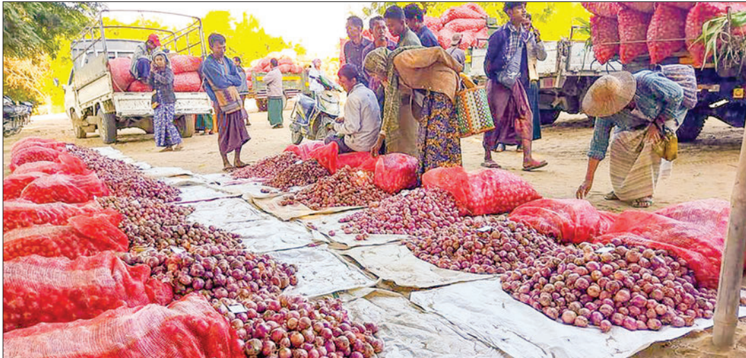
Monsoon onions are displayed at the Seikphyu market on 7 January 2024.

The prices of new monsoon onions are on a downward trend.