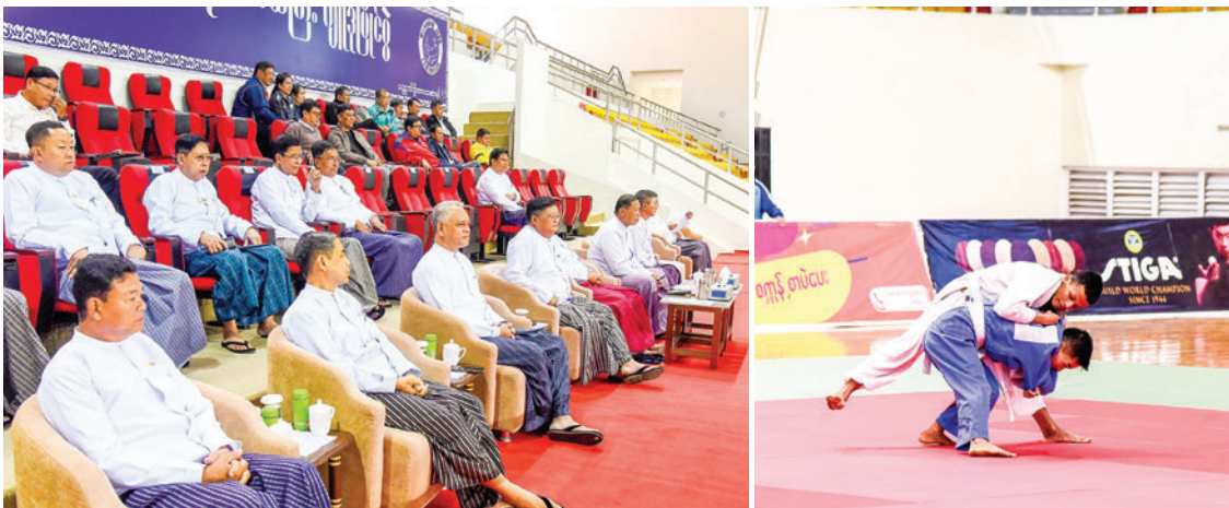
SAC members watch competition of athletes in IRS Judo competition 2023-2024.

TO foster the development of the next generation of athletes and elevate the standards of Myanmar Judo sports, the