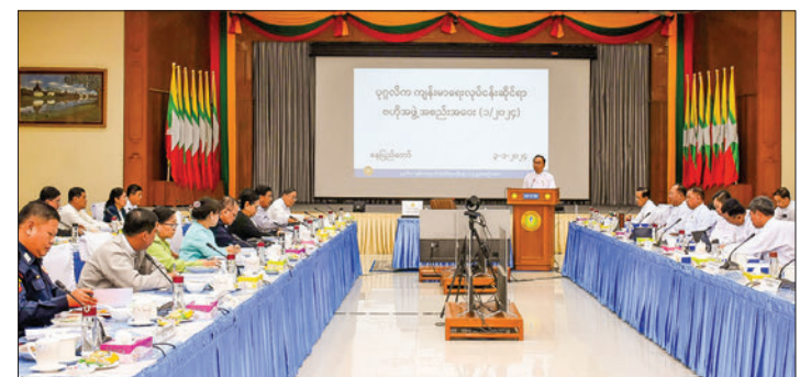
The meeting 1/2024 of the Central Committee on Private Healthcare Services held on 3 January.

Moreover, to enhance the private healthcare service industry, kidney blood purification and kidney transplant