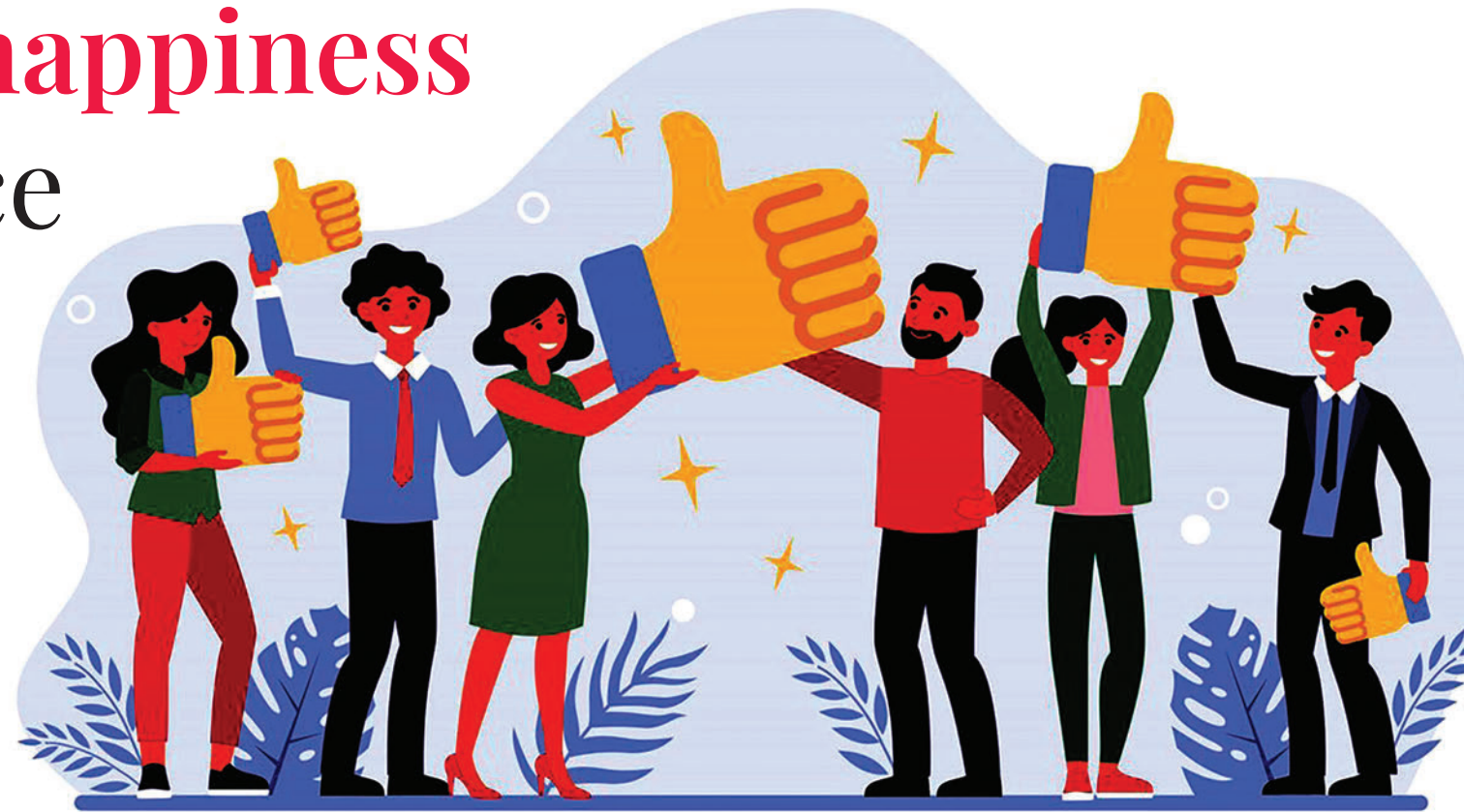
Enhancing workplace happiness is crucial for a positive and productive environment. Employees should feel joyful at work and leave satisfied. ILLUSTRATION:

❖ Work-life Balance: Promote a healthy work-life balance to prevent burnout and ensure well-being. Offer flexible work arrangements or