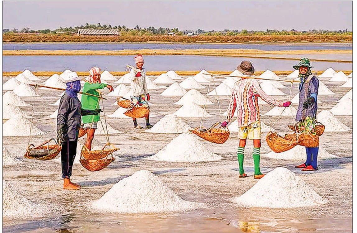
The photo shows salt farmers harvesting salts at a salt farming pond in Mon State.

Mon State is the second-highest salt-producing state