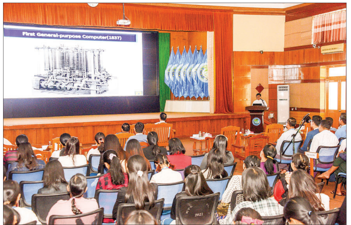
Union Minister for Information U Maung Maung Ohn attends the knowledge-sharing seminar on Artificial Intelligence (AI) in Nay Pyi Taw yesterday.