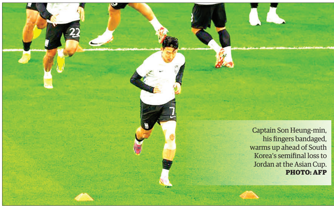
Captain Son Heung-min, his fingers bandaged, warms up ahead of South Korea's semifinal loss to Jordan at the Asian Cup.

Tottenham Hotspurs captain Son Heung-min injured his finger in a brawl with a teammate before South Korea's loss to Jordan at the Asian Cup, according to the Korean football body.