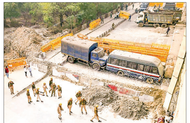
Police guard a barrier blocking a road to prevent farmers demanding minimum crop prices from marching towards India's capital.

phere is peaceful. Traffic has been diverted. The movement of the pedestrians is normal,” DSP Kumar told ANI.