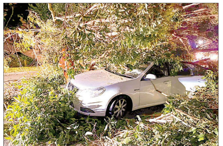
The wild weather hit large swathes of Victoria on Tuesday, dumping torrents of rain and unleashing gusts of more than 150 kilometres per hour.

At its peak, 530,000 homes and businesses lost power, the Australian Energy Market Operator said in an update. — AFP