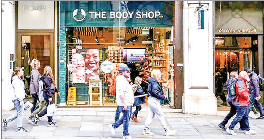
The iconic British brand has been under various foreign owners since founder Anita Roddick sold it to French cosmetics giant L'Oreal in 2006.