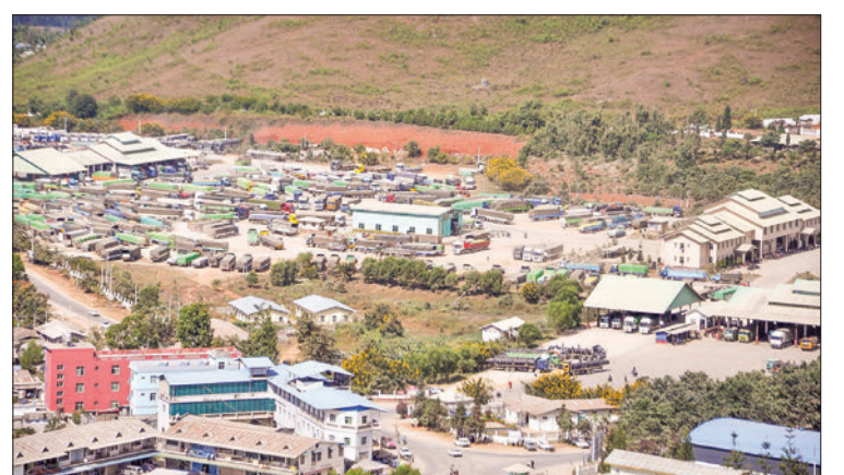
Cargo trucks are seen at the Muse 105 th -mile border trade zone along the Myanmar-China border.

The trade values stood at $703.066 million via Chinshwehaw, $36.266 million via Kampai-