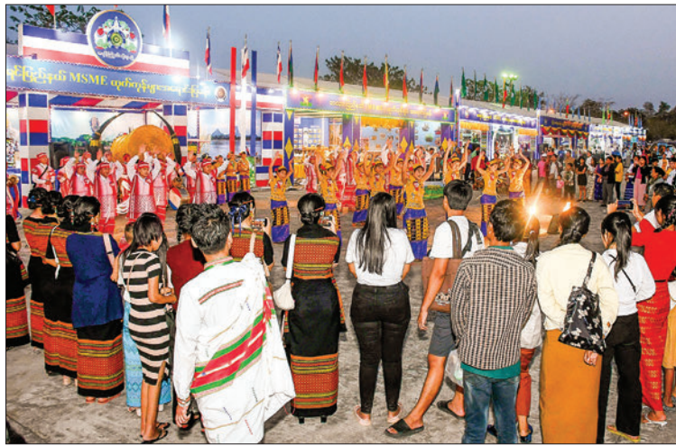
Crowds of visitors join the performance of ethnic dance troupes at the MSME products show and traditional food sale in Nay Pyi Taw yesterday.

AS a gesture of hailing the 77 th Anniversary of Union Day, the MSME products show and tradi-