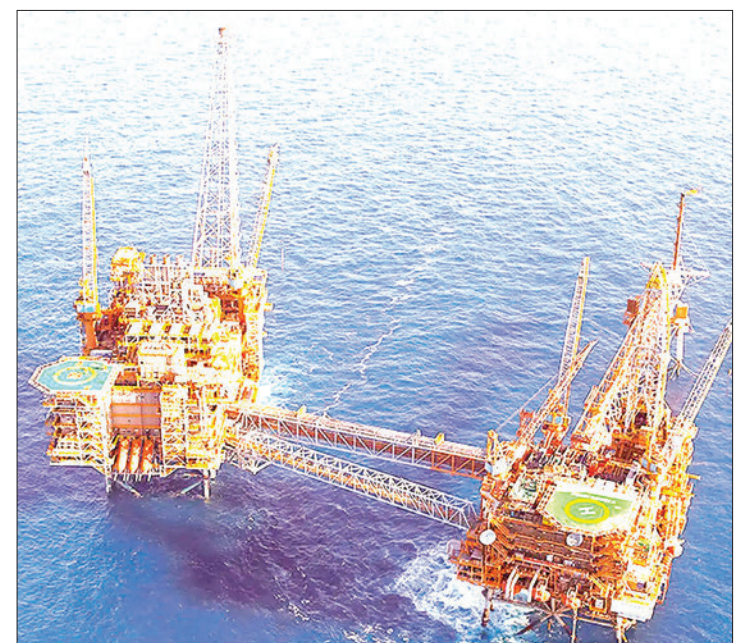
Several multinationals appear to be prepared to ride out the storm, with British oil and gas giant BP and Australia’s Woodside both developing new oil fields off the Senegalese coast.

A planned protest march against the delayed election was postponed, but the crisis persists, drawing international attention and raising uncertainties. — AFP