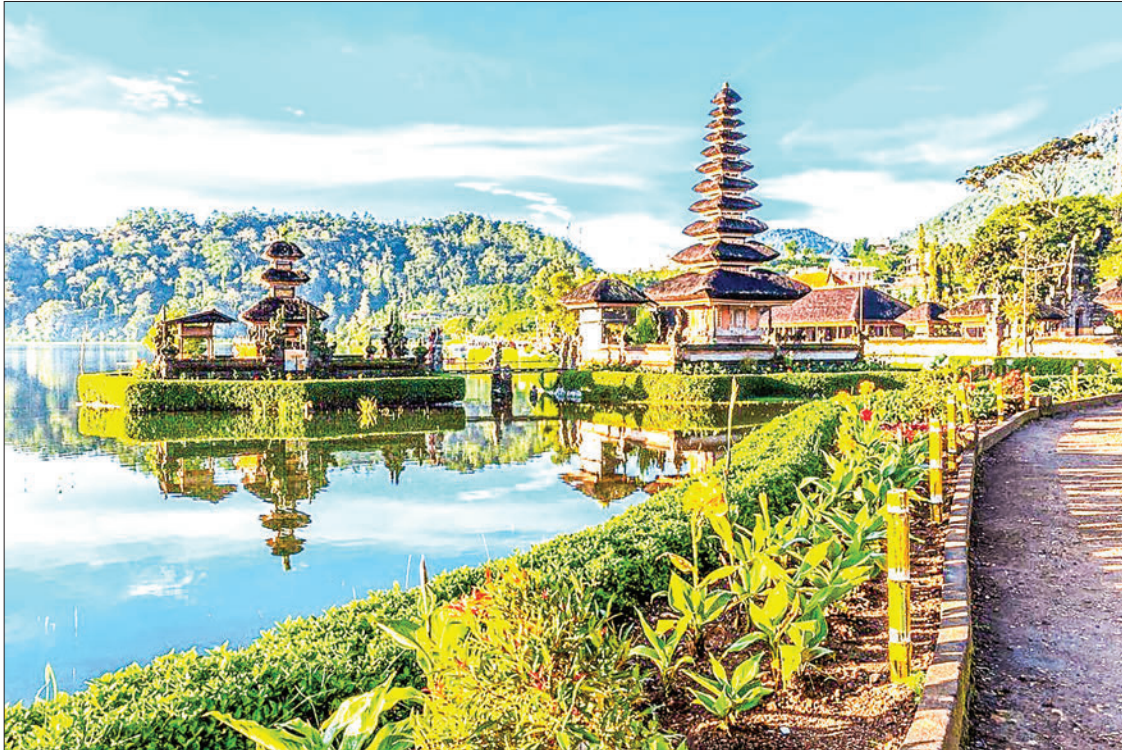
Domestic tourists are exempt from the levy. Bali, heavily reliant on tourism, hopes to use the tax to boost revenue and maintain its tropical allure.

The tax, payable electronically through the “Love Bali” online portal, applies to foreign tourists entering Bali from abroad or other parts of Indonesia.