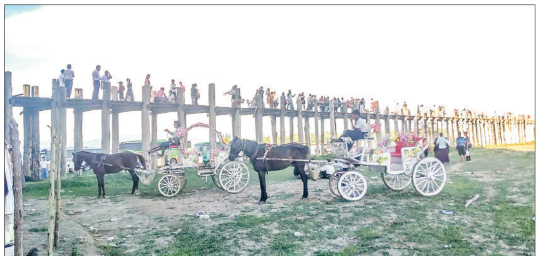
The photo shows decorated horse carts and boats at the Taungthaman Lake.

"The number of visitors to Taungthaman Lake, both domestic and international, has significantly surged in February. Since 1 February, the daily influx of both domestic and international visitors has been on the rise. Over 10,000 people per day, including both domestic and international tourists, visited on 10, 11, and 12 February. Similarly, there is an increasing number of tourists arriving to enjoy the serene sunsets at Taungthaman Lake," said U Soe Win. — ASH/MKKS