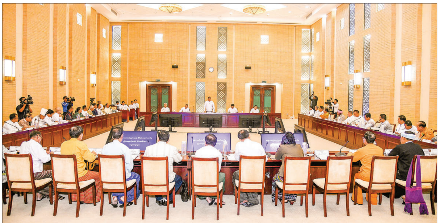
The meeting between the National Solidarity and Peacemaking Negotiation Committee and representatives from registered political parties in progress yesterday in Nay Pyi Taw.

At the meeting, Lt-Gen Tun Tun Naung discussed holding the meeting with the previous group of political parties, seeking positive suggestions from political parties, future processes, the vital role of political parties in the peace processes, the implementation of the peace processes, negotiations for the amendment of essential sections of the Constitution and plans.