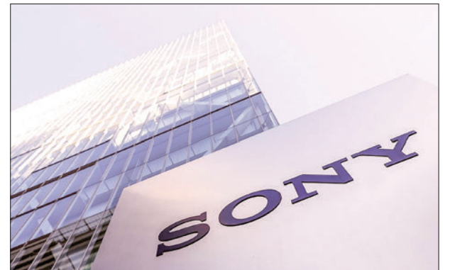
The planned spinoff and listing of its financial unit are set for 2025.

The downgrade brought its gaming business's annual sales forecast down to 4.15 trillion yen from 4.36 trillion yen, the company said, adding that console sales will continue to slow in the next fiscal year onward. — Kyodo