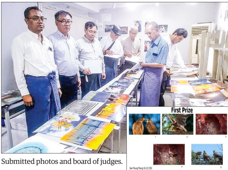
Submitted photos and board of judges.

THE Myanmar Photographers Association has officially revealed the initial roster of winners for the 57 th Nationwide Photography Competition in 2024. The association has been accepting photo submissions for the competition since December and has received 780 photos from 58 photographers across six categories.