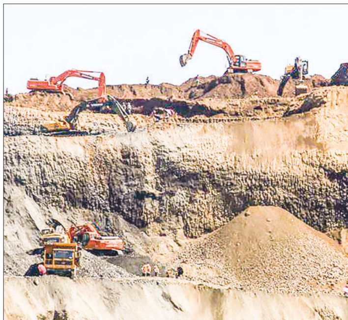
A mining project area in Myanmar.

minerals include jade, diamond, gold, pearl, lead, tin, tungsten, copper, silver, coal, and zinc. — TWA/ TMT