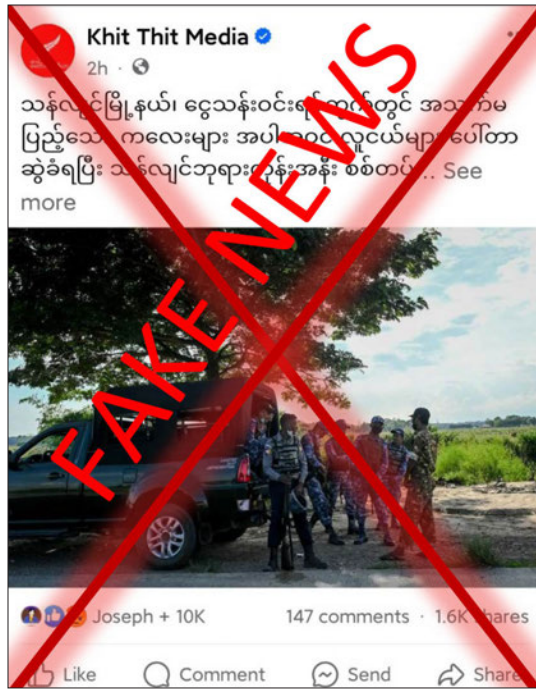
Screenshot validates the spreading of false news.

THE rebellious Khit Thit media deliberately concocted false news alleging that Tatmadaw, police, and administrative body forcibly conscripted