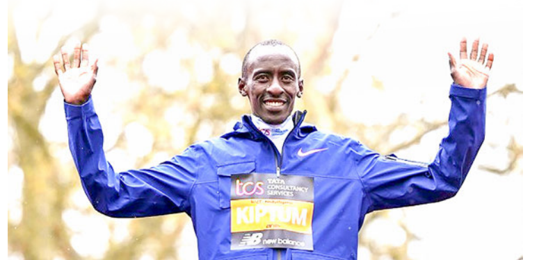
The funeral for Kenya's men's marathon world record holder Kelvin Kiptum will be held on 24 February.

Grealish was making his first start in six games in what has been a difficult campaign for the England star. The 28-year-old had a spell out with a dead leg earlier in the season and has been kept out of the side by the fine form of Jeremy Doku and Phil Foden. — AFP