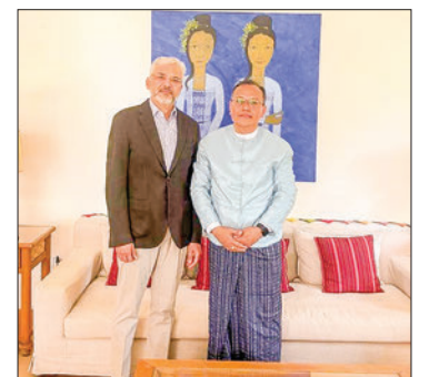
Brazilian Ambassador Mr Gustavo Rocha de Menezes and Myanmar Ambassador U Aung Kyaw Zan met.

in bilateral trade, investment, health, agriculture, sports and culture, renewable energy, natural environment conservation, climate change, and the enhancement of mutual understanding not only between the peoples but also between the governments of the two countries. — ASH/TMT