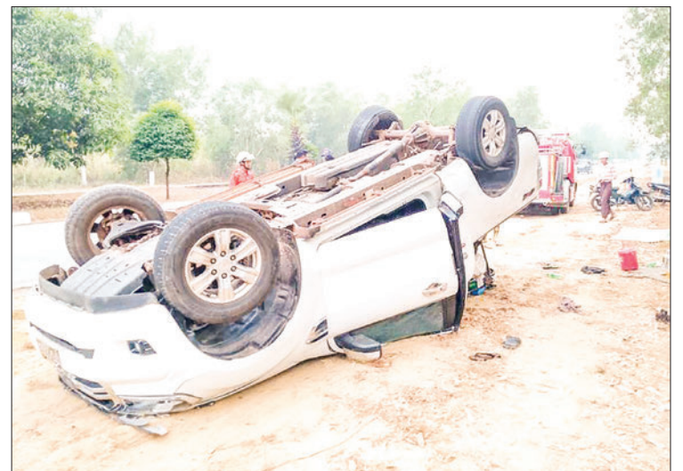
The photo shows the vehicle crashed between the 35/5 Milepost and 35/6 Milepost on the Yangon-Mandalay Expressway on 26 January 2024.