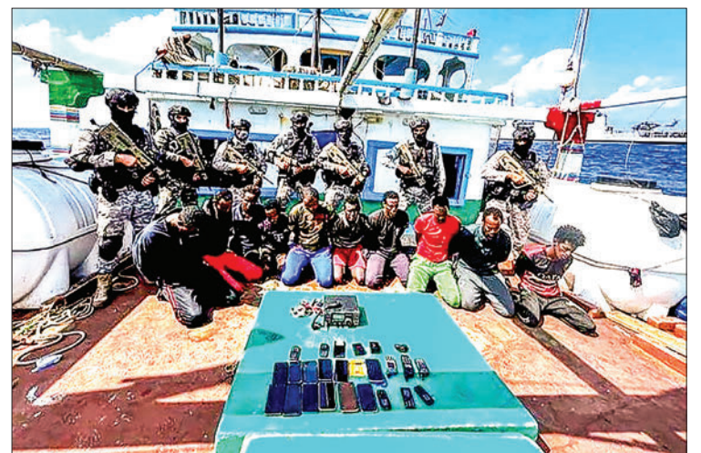
Indian commandos stand guard over Somali pirates who kidnapped an Iranian fishing vessel off the Somali coast, on 30 January.

Analysts caution that Somali piracy poses nowhere near the threat it did in 2011, when navies around the world had to deploy warships to beat back the scourge and restore order at sea. — AFP