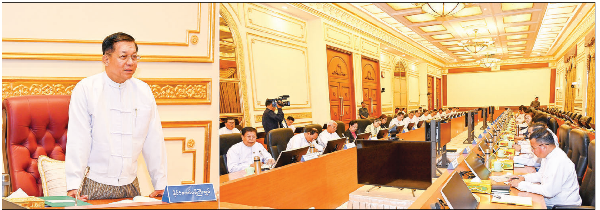
State Administration Council Chairman Prime Minister Senior General Min Aung Hlaing addresses the meeting with ambassadors and chargés d'affaires ad interim who serve diplomatic duties abroad yesterday in Nay Pyi Taw.

S ENIOR General Min Aung Hlaing said diplomats have to effectively utilize their endeavours in relevant arenas to enhance political, economic and cultural exchanges in assigned countries.