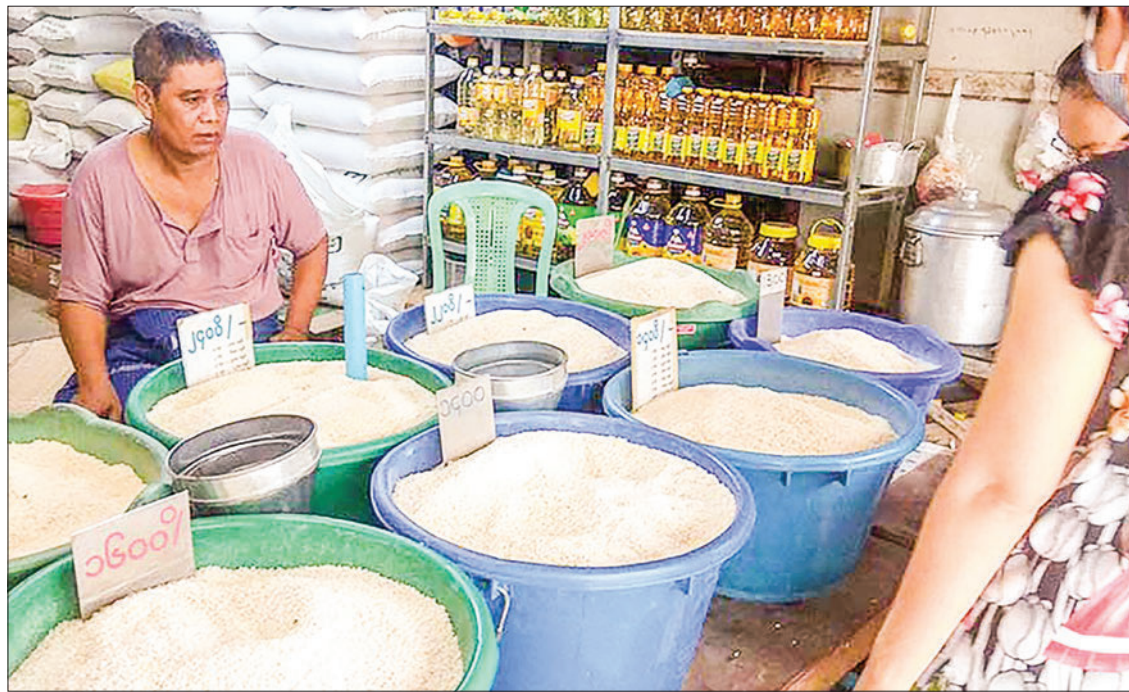
File photo shows that a vendor sells rice to customers at a market in Yangon.

At present, rice prices are surging. The non-premium rice moved between K72,000 and K84,000 per sack depending on varieties (Aemahta, rice grown under the intercropping system). Premium Pawsan wholesale prices are K100,000-K135,000 per sack depending on producing