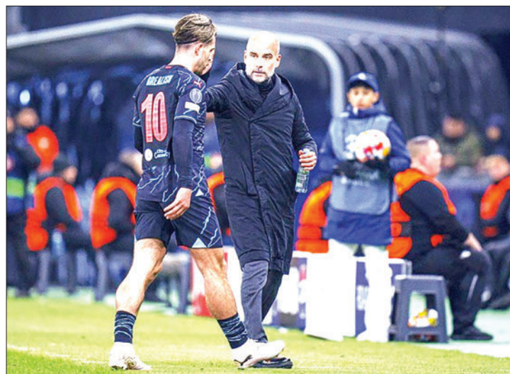
Manchester City's Jack Grealish limped off against FC Copenhagen.

Guardiola expressed more worry about Grealish's injury, stating that tests will be conducted on Wednesday to assess the extent of the damage.