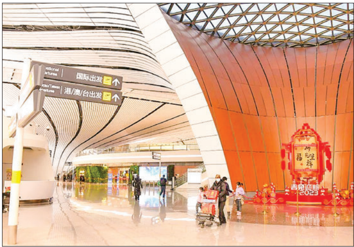
This photo taken on 17 January 2023 shows an interior view of the Beijing Daxing International Airport in Beijing, capital of China.