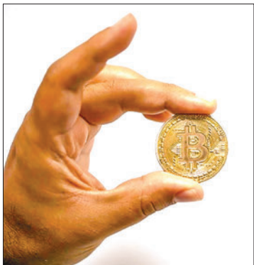
Bitcoin has broken US$50,000 but is still well off its record high of nearly $69,000 seen in 2020.

BITCOIN spiked above US$50,000 Tuesday for the first time in more than two years as investors grow optimistic that US approval of broader trading in the unit will ramp up demand.