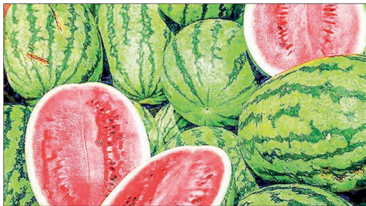
Watermelon seen at a fruit shop.

The more extreme watermelons are damaged, the more significant the loss.