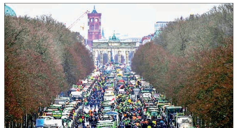
Tractors and trucks besieged Berlin's landmark Brandenburg gate in January as farmers protested at the elimination of fuel subsidies.

The situation was "dramatically bad", he added. — AFP