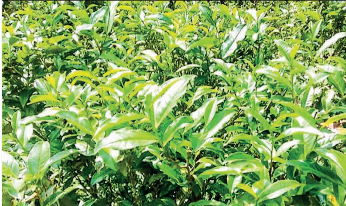
Tea plants are thriving in the farm.

In the southern Shan State, the price of dried tender tea leaves is rising up to around