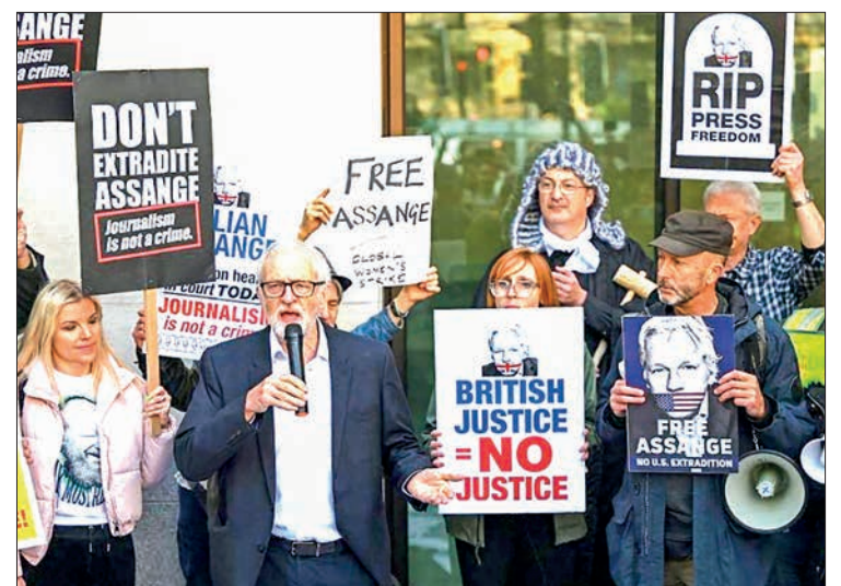
Former leader of Britain's opposition Labour party Jeremy Corbyn addresses supporters of WikiLeaks founder Julian Assange outside Westminster Magistrates court in London on 20 April 2022.