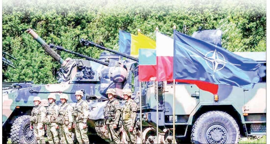
Polish and Romanian soldiers stand next to military vehicles and a NATO flag near Szypliszki village, located in the so-called Suwalki Gap.

Belarusian President Alexander Lukashenko stated that approximately 32,000 NATO soldiers, over 1,000 armoured vehicles, and 235 airplanes and helicopters are deployed near Russia's and Belarus's borders.