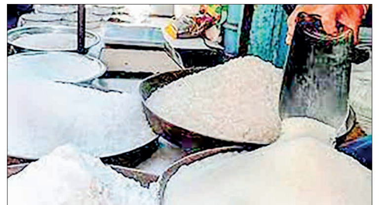
Quality sugar seen in depot.

Sugarcane is commonly found in the upper Sagaing Region, followed by northern Shan State. It is also found in the western and eastern Bago Region, Yangon Region and Mandalay Region. The sugarcane is grown in December-January. It can be harvested from November to February of the following years. The sugarcane growing rotation cycle lasts four years in Myanmar. — NN/EM