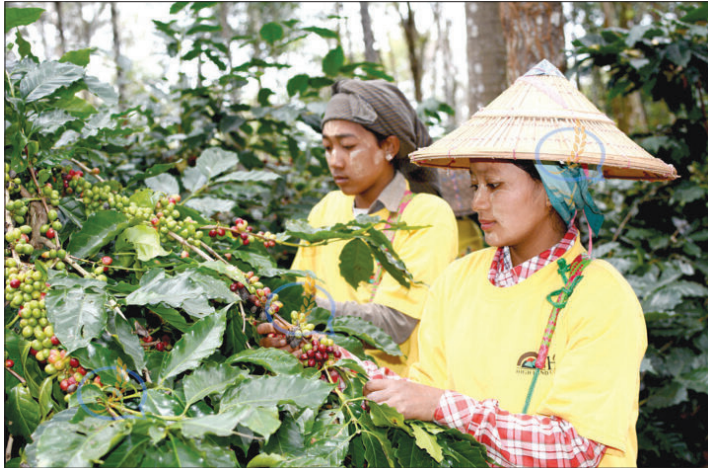
File photo by MOI shows workers collecting coffee berries from the coffee plants.

"In export market, demand from Vietnam has been good. According to the