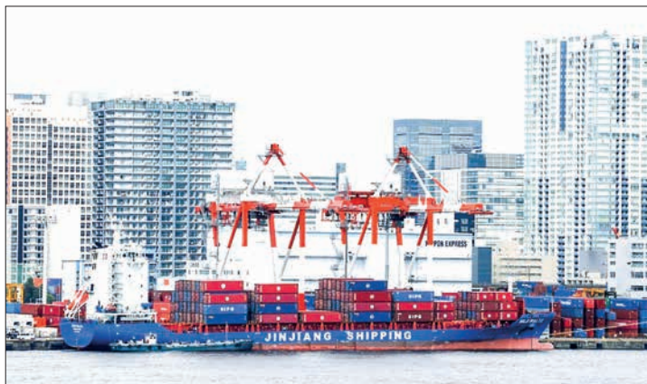
Despite concerns about slowing global demand, exports increased by 11.9 per cent to 7.33 trillion yen, marking the second consecutive month of growth.

Japan's exports surged to a record high in January, driven by robust shipments of autos to the US, helping the nation cut its trade deficit by half from a year earlier to 1.76 trillion yen ($11.74 billion).