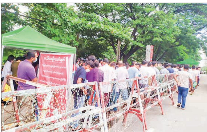
Applicants are seen lining up to get their passport at Myanmar Passport Office (Yangon).

THE Myanmar Passport Office stated on 20 February that passport applications are being