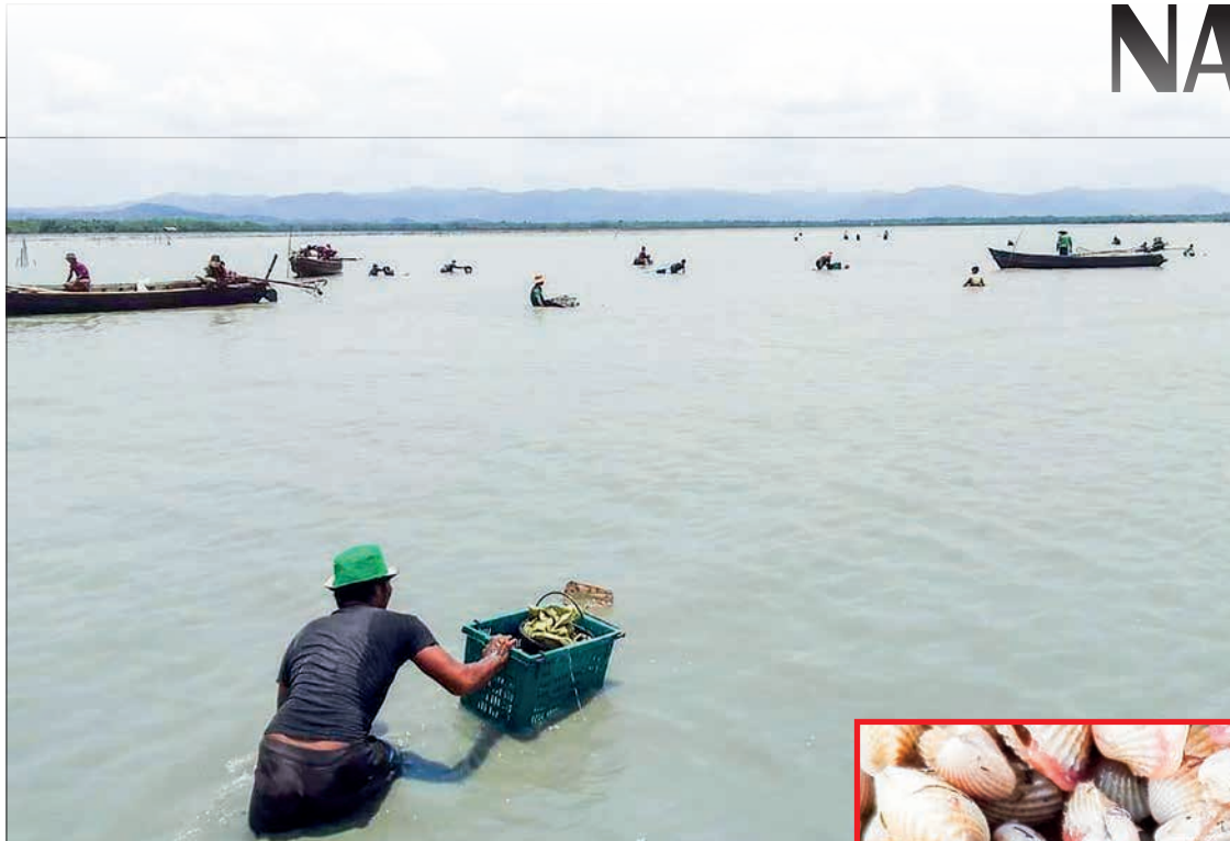
Fishermen search blood clams in Kyunsu Township, Taninthayi Region.

W hen one hears Gin, it might be considered as ginger (locally called Gin in upper Myanmar regions) that is utilized in traditional medicine as well as in cooking. Meanwhile, locals in Taninthayi Region realize the term Gin as a blood clam. The blood clam has two shells. Some called them the blood cockles. The residents in Taninthayi widely called them Gin. The blood clam from the region is primarily exported to Thailand, generating foreign earnings and creating jobs for the local community.