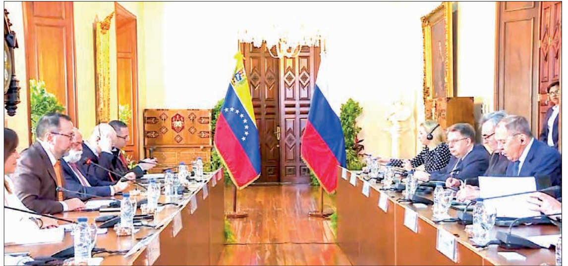
Russia considers the development of cooperation with Venezuela on the use of peaceful nuclear energy promising.

On 19 February, Lavrov kicked-off his Latin American