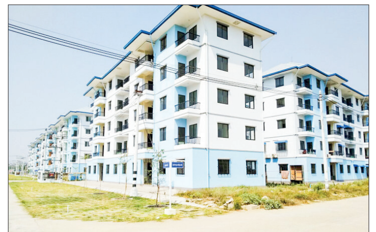
Photo shows completion of housings.