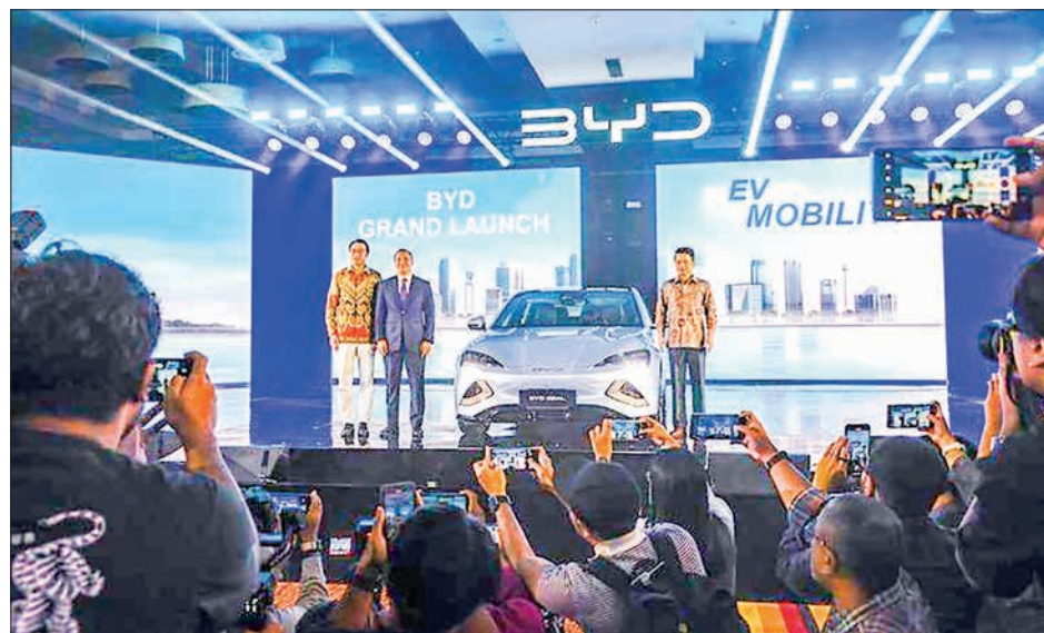
Guests pose for photos with a BYD new electric car during BYD grand launch in Jakarta, Indonesia, 18 January 2024.

It will also lower value-added tax to 1 per cent from 11 per cent for EV buyers this year, extending a tax break that had expired at the end of 2023.