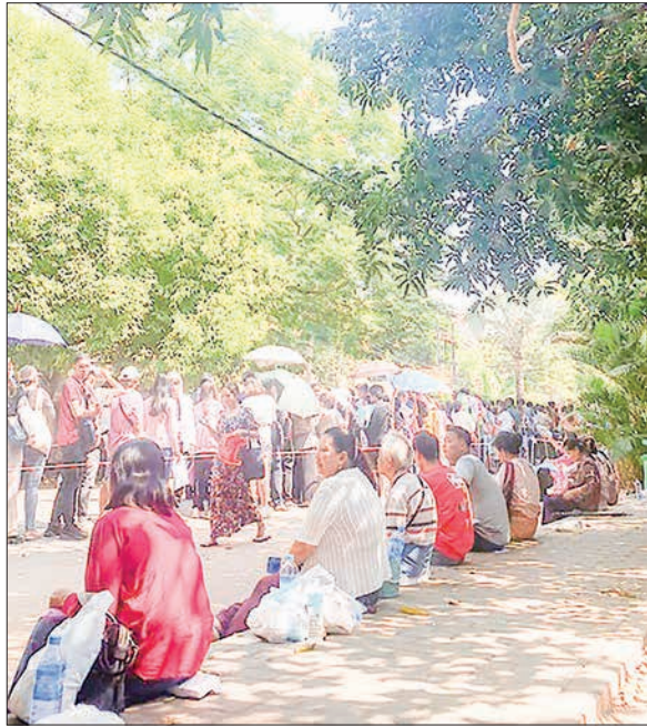
People queue for visa. The Royal Thai Embassy in Yangon announced on 20 February that visa application appointments can now be made online.