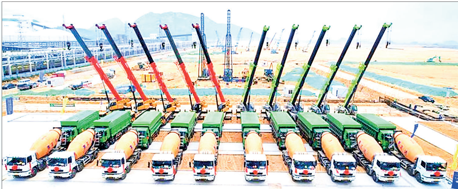
A view of the construction site of the China-Saudi Arabia Gulei ethylene project in Zhangzhou City, Fujian province.

Situated in the Gulei petrochemicals base in Zhangzhou city, it is anticipated to be the largest single Sino-foreign joint venture in Fujian Province. The project is slated for completion in 2026 and will have a maximum annual production capacity of 1.8 million tonnes of ethylene.