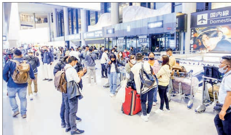
Travellers gather in the international arrivals lobby at Narita airport near Tokyo on 7 April 2022.

Despite a powerful earthquake on New Year's Day, its impact on tourism has been limited.