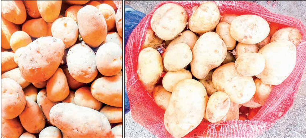
Shan potato flooding the domestic market.

The wholesale price of Shan potato is K500 lower than Chinese potato.