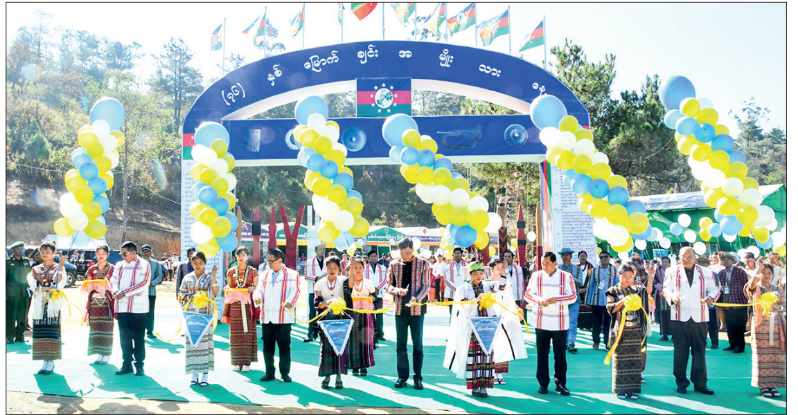
SAC Member Deputy Prime Minister General Mya Tun Oo cuts the ribbon to open Chin National Day ceremony in Haka on 20 February 2024.

In the evening, they all enjoyed a bonfire to mark the Chin National Day together with Chin traditional dance troupes. — MNA/KTZH