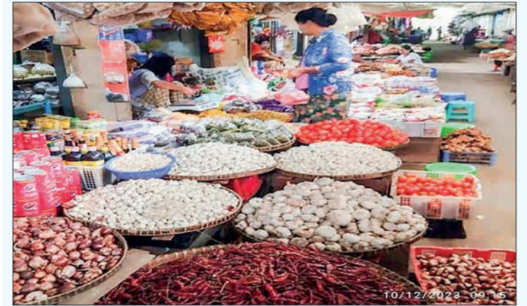
A consumer is seen buying dry grocery at a retail shop.

For a week from 19 to 25 February 2023, the wholesale reference price of Yangon Re-