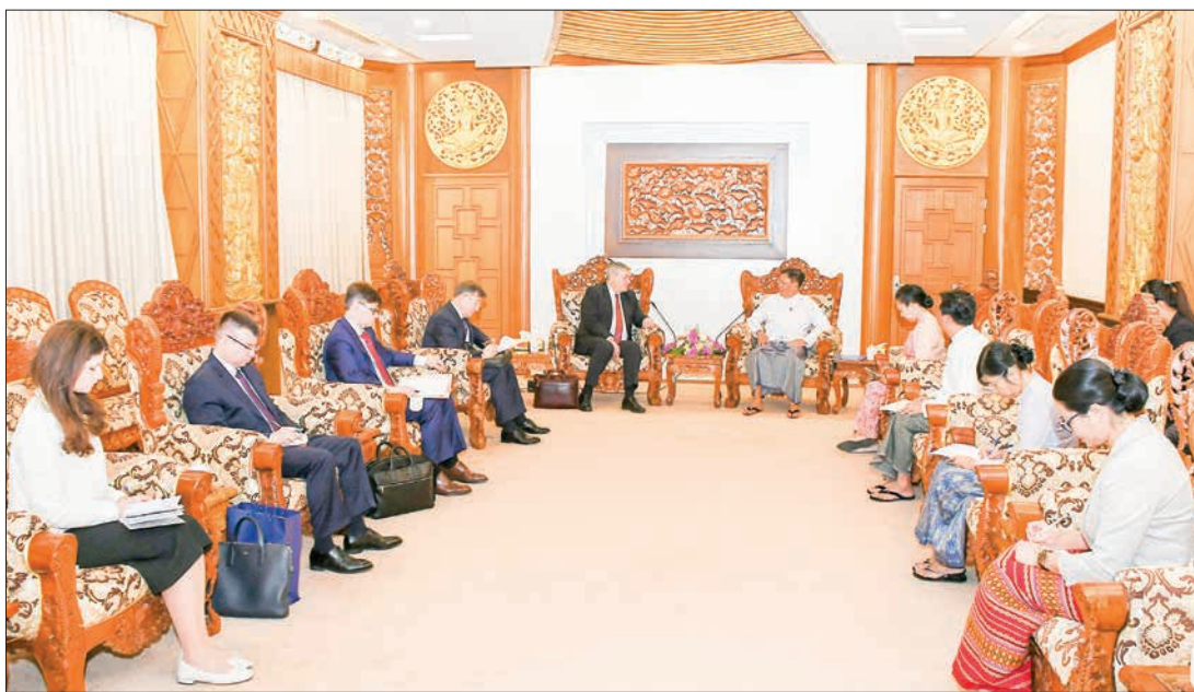
Deputy Prime Minister Union MoFA Minister U Than Swe receives Mr Andrey Rudenko, Deputy Minister of Foreign Affairs of the Russian Federation yesterday.

U Than Swe, Deputy Prime Minister and Union Minister for Foreign Affairs of the Republic of the Union of Myanmar, received Mr Andrey Rudenko, Deputy Minister of Foreign Affairs of the Russian Federation, on the morning of 21 February 2024 at the Ministry of Foreign Affairs in Nay Pyi Taw.