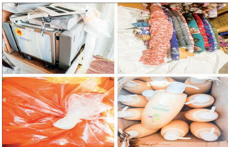
Various items of consumer goods seized at Asia World Port Terminal in Yangon.

On the same day, a Mitsubishi Fuso truck carrying 6,500 kilogrammes of East Hope PVC powder, undeclared in the Import Declaration (ID), was impounded at Ywathagyi Dry Port. Additionally, 600 gallons of smuggled diesel were confiscated from a motorboat in Ye township, and 95 gallons of illegal crude oil and a XIAOMI phone valued at K932,500 were seized at the Htaukshapin-Htankaik-Yenanma oil field in Minbu township. Action was taken under the Petroleum and Petroleum Products Law and the