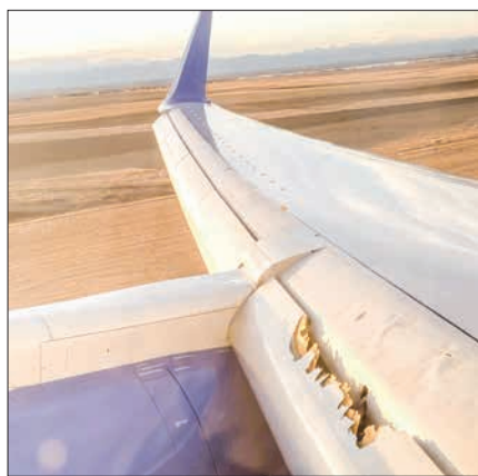
A screenshot of a video taken from a United Airlines Boeing plane shows a piece of the wing's flap missing.

UNITED Airlines confirmed on Tuesday that its flight 354 from San Francisco to Boston made an emergency landing on Monday due to a damaged wing.