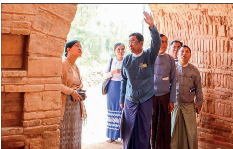
Officials tour the ancient buildings in Sri Ksetra World Heritage site.