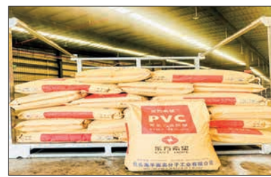
East Hope PVC powder packages seized in Yangon Region.

Public Property Protection Law. During inspections on 20 Feb-