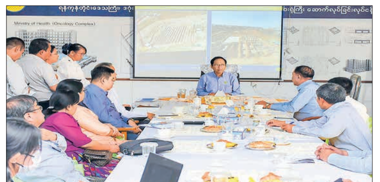
Union Minister Dr Thet Khaing Win talks about the construction of National Cancer Treatment Centre in Dagon Myothit (Seikkan) Township on 18 February.

Additionally, the government has already approved a fund of K12 billion for the purchase of cancer drugs this year. In 2023, the aforesaid general hospitals provided radiotherapy treatment for patients 110,367 times at general military hospitals and private hospitals in Yangon and Nay Pyi Taw. —ASH/MKKS