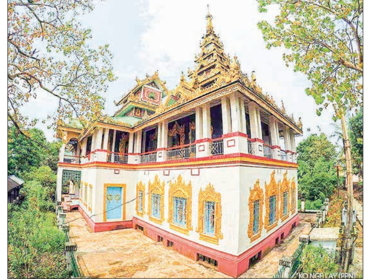
The photo portrays Konbaung era's Minkyaungtawgyi and upside-down star-flower tree.

The monastery was built in 1208 ME (1846 AD) during the reign of the Konbaung dynasty's King Bagan. When the land was selected for the