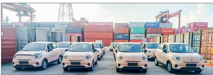
Various sorts of cars at Yangon port.

trading at the end of 2023 and became slow again in mid-February. "Especially, the price of SKD cars worth less than K 100 million increased by K 7 million. It was almost three days. During these days, the market has slowed down again. The market is in a wait-and-see mode with few buyers and many sellers," he said. The price of left-hand drive cars worth K 100 million increased by 10 per cent and those worth K100-200 million by 7 per cent, he said. However, the price of K400-K 500 million cars hasn't increased at all, he added. — MT/ZN