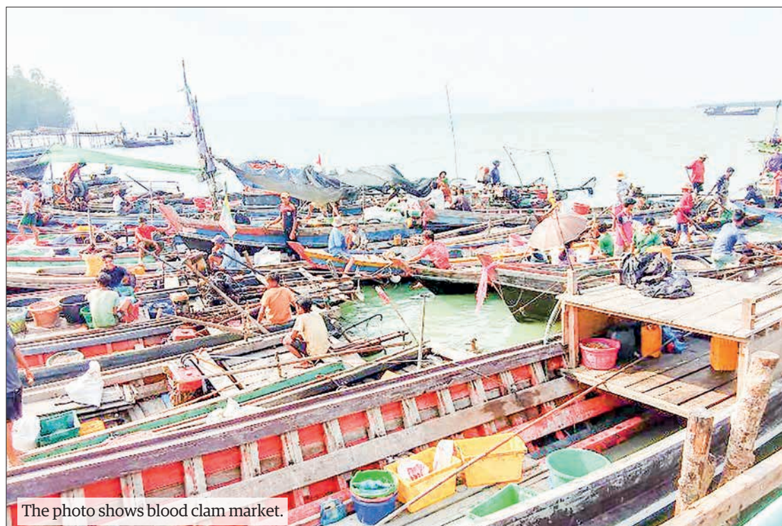
The photo shows blood clam market.