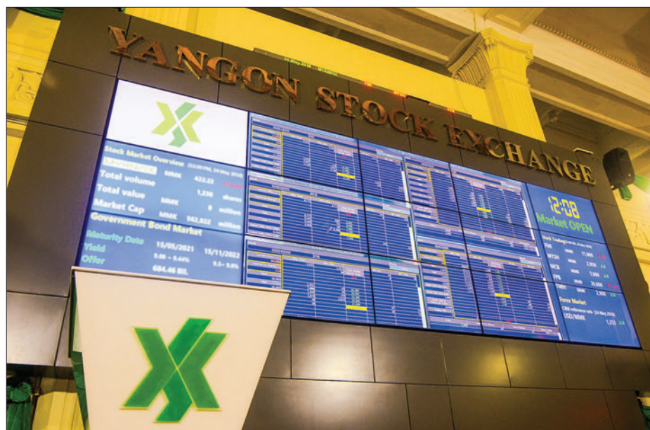
The image captures the share indexes displayed on the panel board at Yangon Bourse.

The closing share prices per unit were K8,700 for FMI, K2,900 for MTSH, K8,000 for MCB, K1,550 for FPB, K2,450 for TMH, K1,950 for EFR and K4,700 for AMATA and K1,750 for MAEX in January.