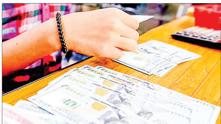
A staff is counting greenbacks at the authorized money exchange counter.

THE Central Bank of Myanmar (CBM) injected US$11 million and 200 million Thai baht into the financial market on 5 February 2024.