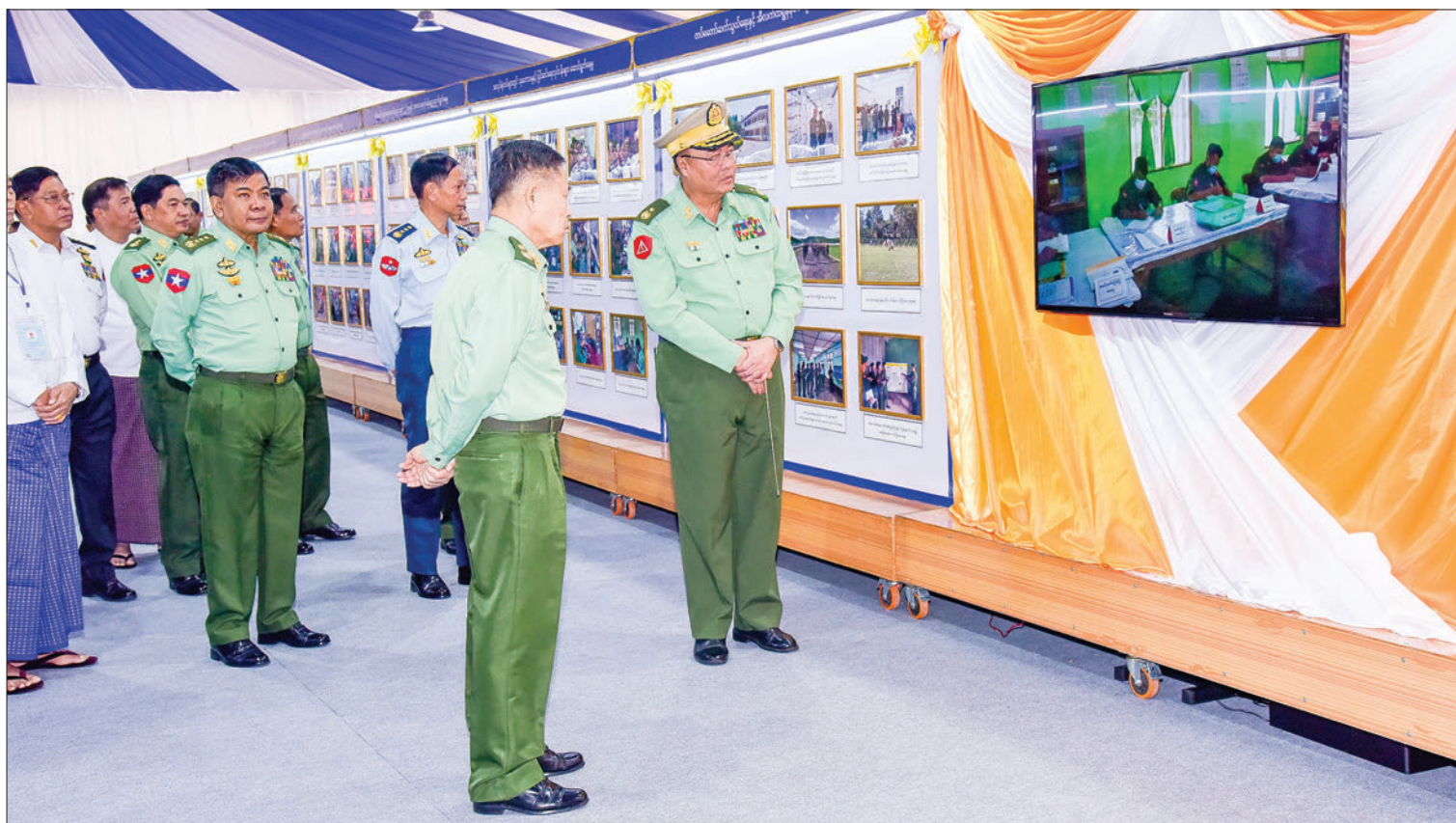
State Administration Council Vice-Chairman Deputy Commander-in-Chief of Defence Services Commander-in-Chief (Army) Vice-Senior General Soe Win observes the display at the booths yesterday in Nay Pyi Taw.

VICE-SENIOR General Soe Win said the Signals Corps serves its primary duties of not only communications but contributes to the TV transmission sector as well whenever the country faces a state of emergency.