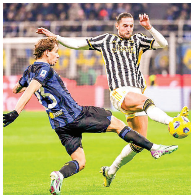
FC Inter's Nicolò Barella (L) vies with FC Juventus' Adrián Rabotić during a Serie A soccer match between FC Inter and FC Juventus in Milan, Italy, 4 February 2024.