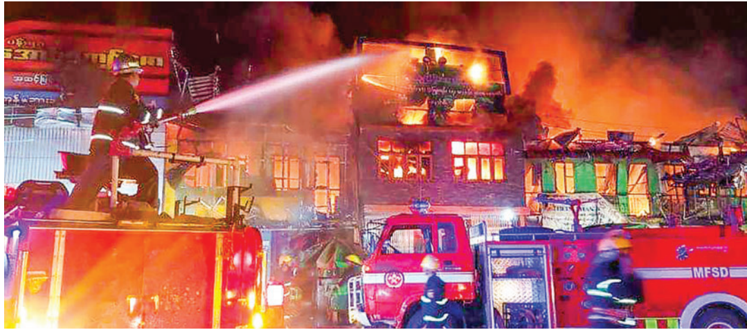
Firefighters are extinguishing fire at the Aung Mingala Highway Bus Terminal.