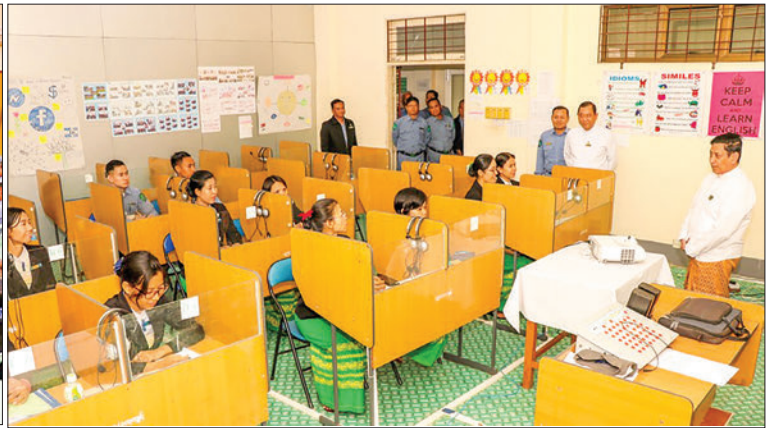
Union Minister Lt-Gen Tun Tun Naung speaks on the opening occasion and observes the courses yesterday.

attend the advanced English course to study and learn to be more outstanding than before based on the essential foundation they have gained from the previous English Proficiency