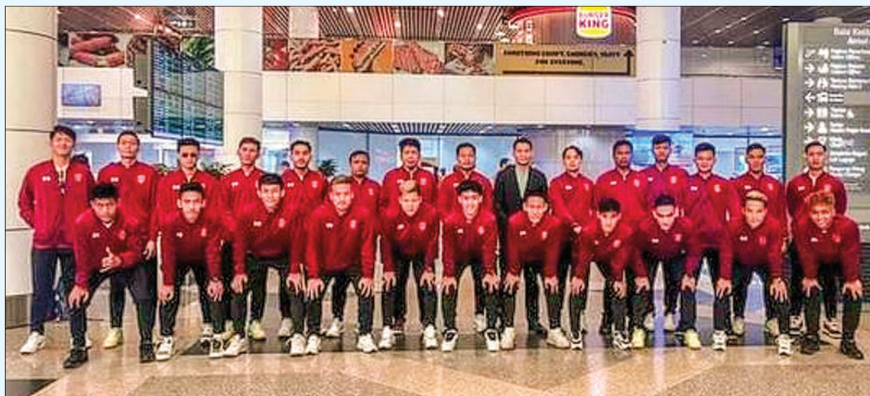
Players of the Myanmar national futsal team pose for a group photo.

The Myanmar team will play three warm-up matches with Indonesian clubs during the trip from 5 to 10 February. Team Myanmar will play against Indonesia's Futsal League Champion Bintang Timur Futsal Club on 7 and 9 February and the Regional East Java Team on 10 February. — Ko Nyi Lay/TTA