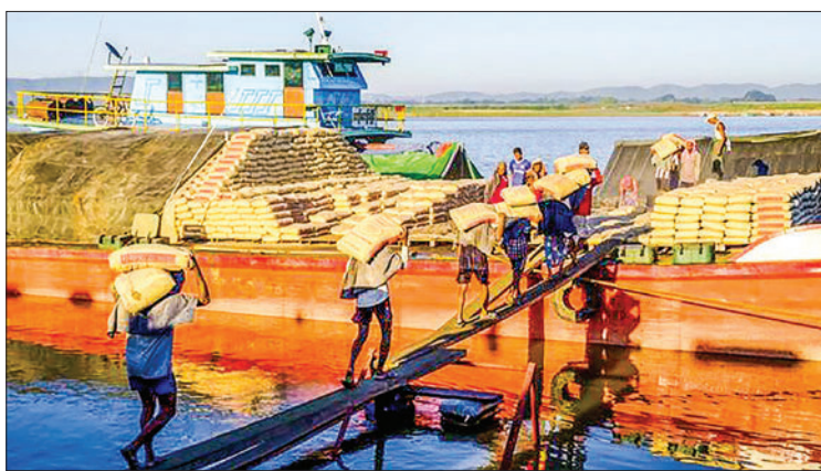
Workers are seen loading cargo onto a vessel at Mandalay port.