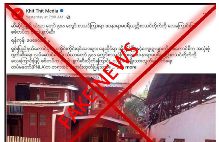
Screenshot validates false claims.

According to the regional security official, the insurgents launched attacks on security