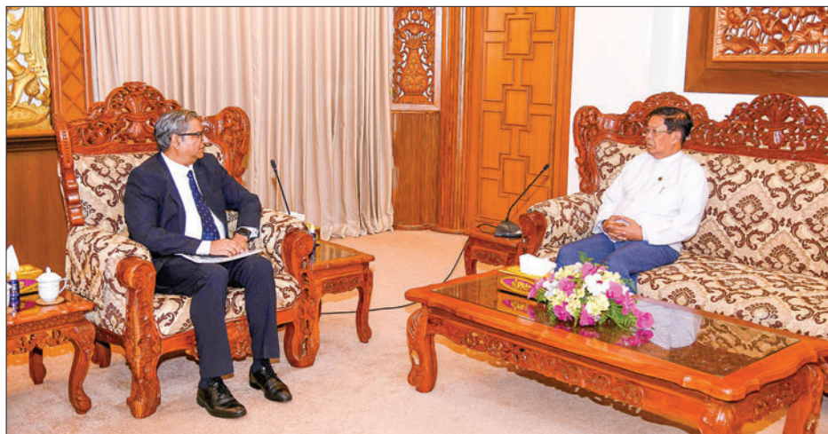
The UNOCHA head calls on Deputy Prime Minister Union Minister for Foreign Affairs U Than Swe yesterday in Nay Pyi Taw.

Also present at the meeting were senior officials from the Ministry of Foreign Affairs, Ms Danielle Parry and Ms Kyoko Ono, Deputy Heads of Office for UNOCHA. — MNA