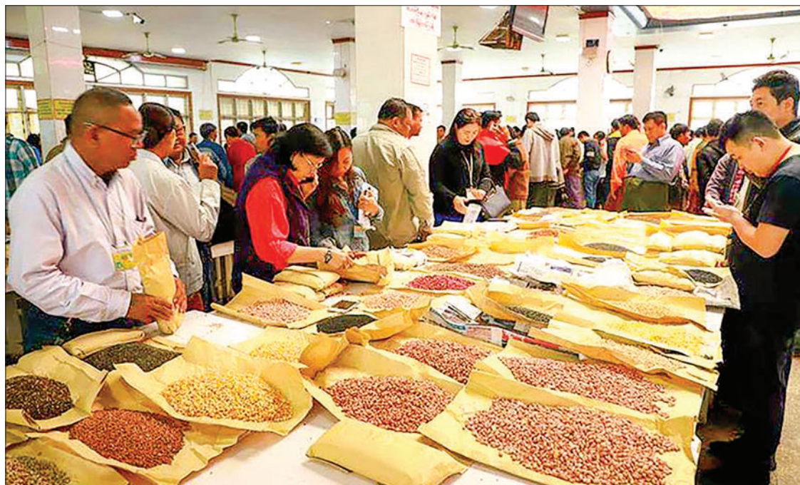
Traders are evaluating beans and pulses at the Mandalay market.

Myanmar shipped over 1.277 million tonnes of various pulses worth over US$1 billion over the past nine months of the current financial year 2023-2024, the Ministry of Commerce