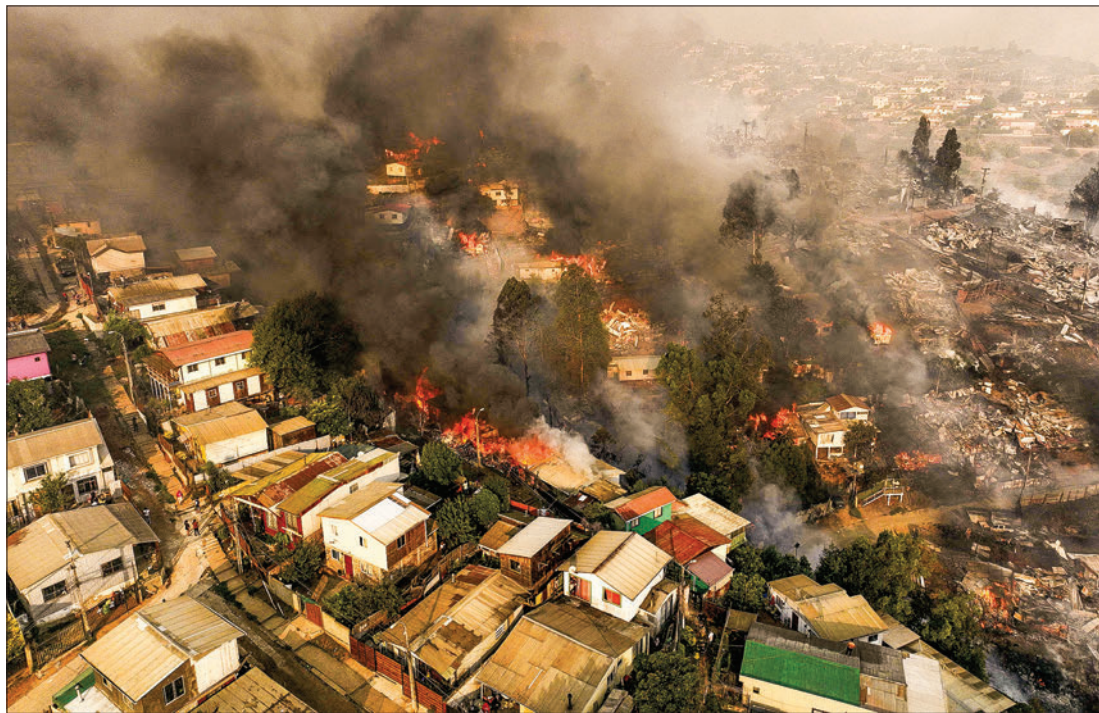
Aerial view of the forest fire that affects the hills of the city of Viña del Mar in the Las Pataguas sector, Chile, taken on 3 February 2024.