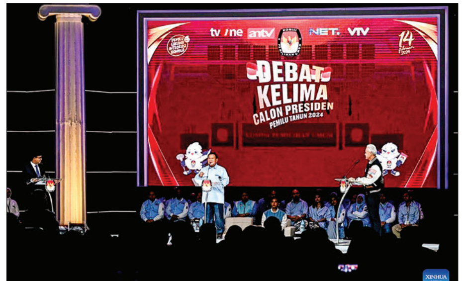
Indonesian presidential candidates Anies Baswedan, Prabowo Subianto and Ganjar Pranowo (L-R) attend the fifth presidential candidates' debate at Jakarta Convention Centre in Jakarta, Indonesia, on 4 February 2024. Indonesia will hold presidential and legislative election on 14 February 2024.

"Which is more important, free internet or free food for those who are