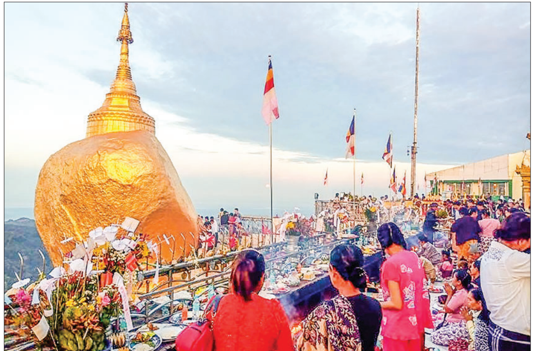
Travellers seen at the Kyaiktiyo Pagoda under arrangements to be involved in the World Heritage Sites.