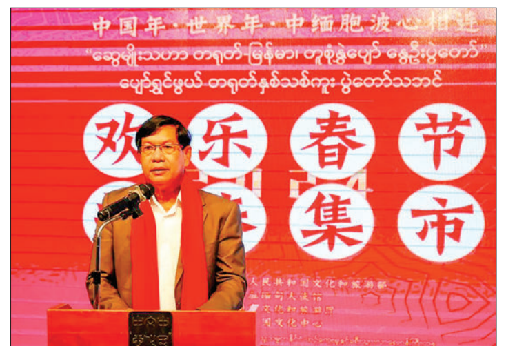
Yangon Region Chief Minister U Soe Thein remarks at the opening event on 4 February 2024.

Visitors had the opportunity to view a photo exhibition