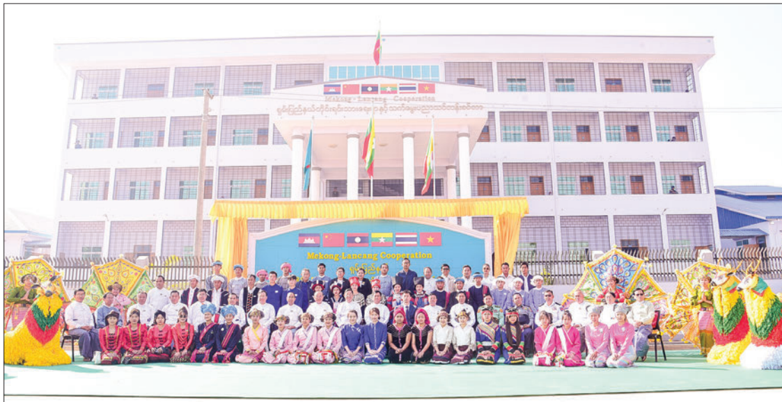
The inaugural event of the Shan State Ethnic Community and Vocational Training Centre in progress yesterday in Taunggyi.