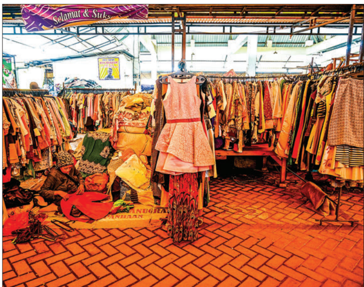
A cloth vendor waits for customers at a market in Surabaya on 31 January 2024.

"We think the economy is set to struggle over the coming quarters." — AFP