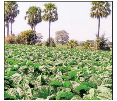
The photo shows a tobacco plantation.

Although tobacco is less popular among Myanmar people, it has medicinal benefits. Domestic cigar businesses use a lot of tobacco, and it is also used as an antiseptic for curing skin irritations. — TWA/TMT