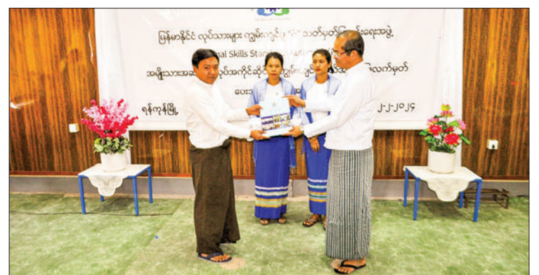
The NSSA official presents an excellent award certificate during the award ceremony.

types of jobs, exceeding the financial year 2022-2023 target. In the 2023-2024 financial year, 3,500 workers were targeted for inspection and evaluation. So far, there have been 2,735 respondents for 29 types of jobs, and 2,534 qualified workers were recognized as skilled workers. — TWA/KZL