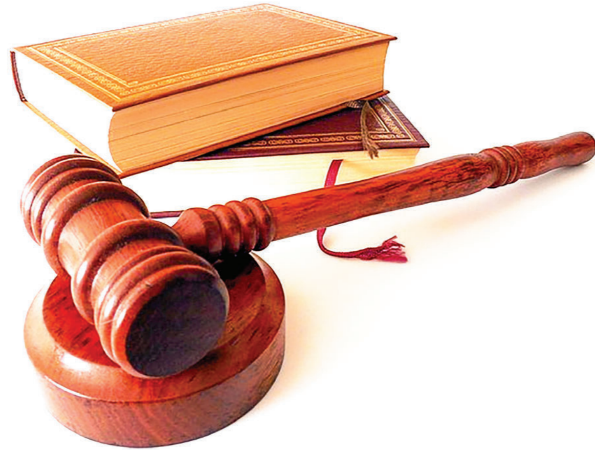
Obtaining a clear and unbroken title is crucial when purchasing a home, and the associated legal document, the title document, outlines key details about property ownership.

When buying, selling or licensing real estate property rights, be sure to make sure the chain of title is clean and