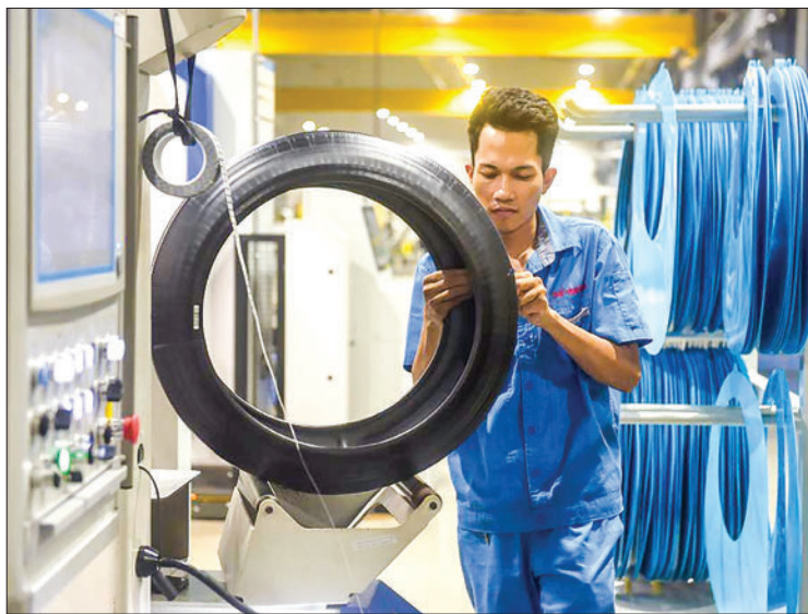
A man works at the General Tyre Technology (Cambodia) factory in the Sihanoukville Special Economic Zone (SSEZ) in Sihanoukville, Cambodia on 21 November 2023.

The 11-square-kilometre economic zone has attracted a cumulative investment of 2.27 billion dollars, accommodat-