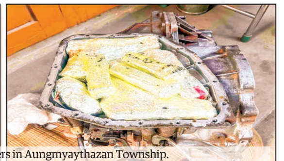
Arms and munitions captured alongside two offenders in Aungmyaythazan Township.

The people are urged to receive vaccination of Covid-19 without fail as full-time vaccination of Covid-19 and receiving booster shots can effectively mitigate infection of the virus, severe suffering from the disease and increase of death rate due to the disease.