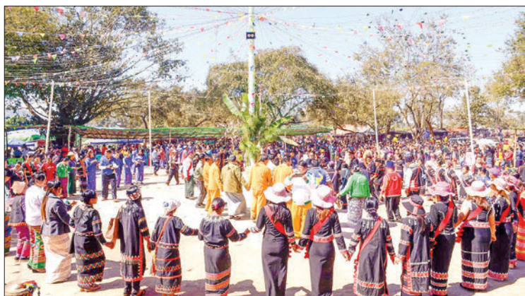
Lahu traditional dancers entertain the audiences with traditional dances.

Other festival highlights include the pine-growing demonstration, pounding khawpoko (dried sticky rice), games of spinning tops, courtship rituals among bachelors, and dodge ball matches. — ASH/NT