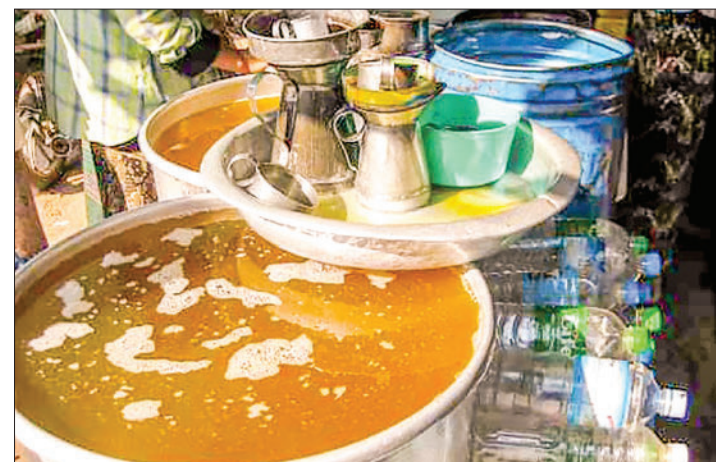
Palm oil is organized for sale at the shop.

To control overcharging, the Consumer Affairs Department under the Ministry of Commerce informed consumers of lodging the complaints for overcharging through the