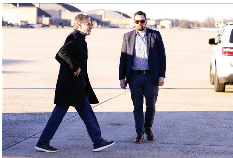
US Secretary of State Antony Blinken walks to board a plane at Joint Base Andrews, Maryland on 4 February 2024 en route to Saudi Arabia as part of his fifth urgent trip to the Middle East since the war between Israel and Hamas in Gaza erupted in October.

Dubbed a "pressure cooker of despair" by the United Nations, Rafah now hosts more than half of Gaza's population,