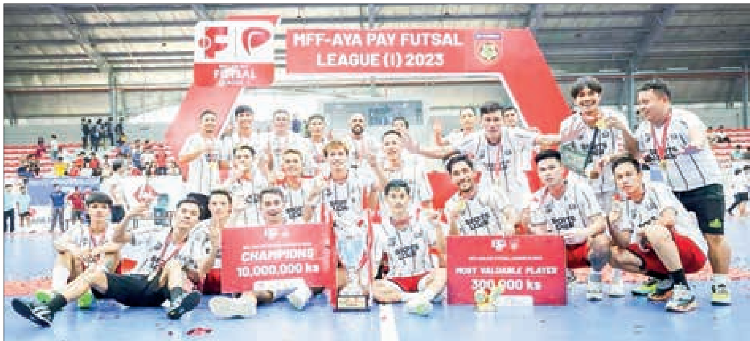
Champion VUC celebrates their victory for winning the championship trophy in MFF Futsal League 1.