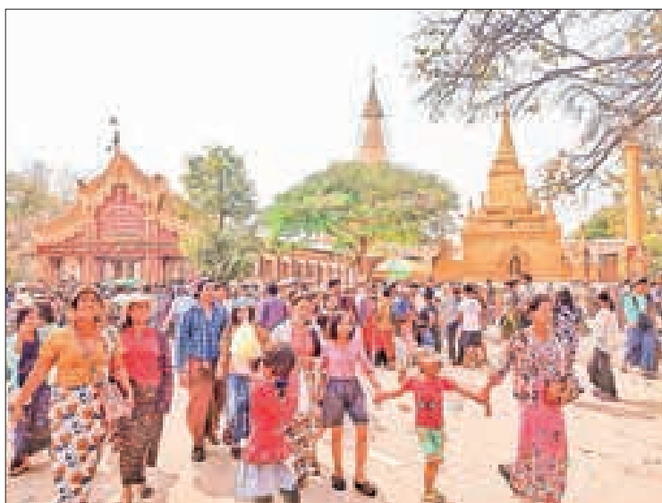
Photos depict the festival at the Shwesayan Pagoda in the previous year and a local souvenir stall.

Legend has it that big river fish swim upstream of the Doht-