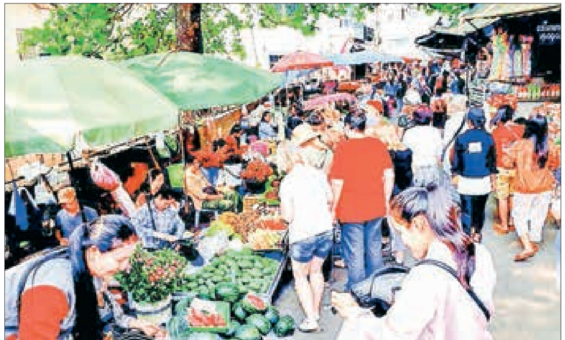
International travellers seen shopping, among others, in the Tachilek market.

Myanmar's watermelon exports struggle for market share in China