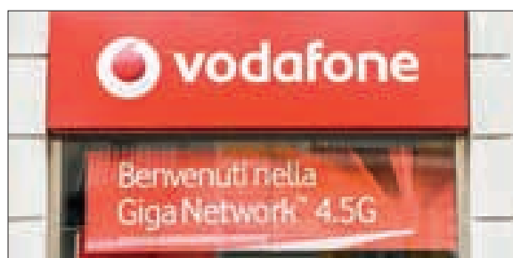
Vodafone has finalized the sale of its Italian unit to Swisscom for eight billion euros, concluding its efforts to restructure its European operations. PHOTO: AFP

Vodafone chief executive Margherita Della Valle said the deal with Swisscom marked the "third and final step in the reshaping of our European operations". — AFP