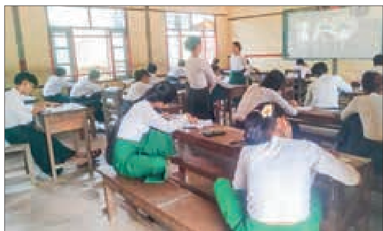
Kyaukkyi Township, Bago Region.