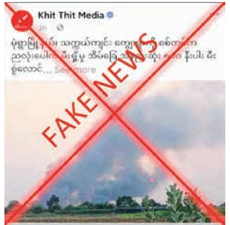
The screenshot validates misinformation.

THE subversive media outlet Khit Thit is spreading fake news on social media platforms, alleging that security forces set fire to and destroyed Thetkeyyin village in Monywa Township, Sagaing Region, on 14 March without engaging in clashes.