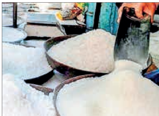
Photos show sugar being arranged neatly for sale at the market.