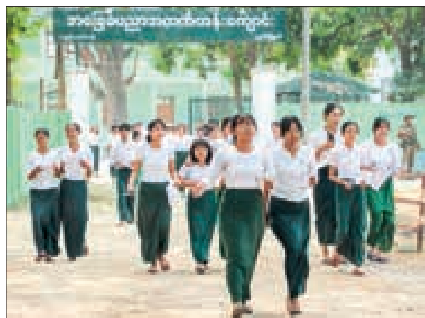
Nay Pyi Taw.

The number of students sitting for exams accounted for 83.32 per cent, according to the figures of the Ministry of Education. — MNA/KTZH