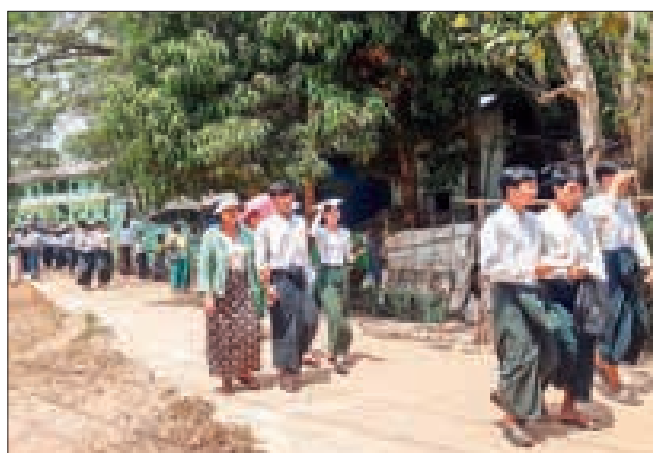
Thaboung, Ayeyawady Region.