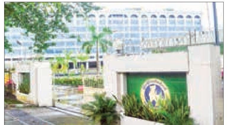
The office of the Central Bank of Myanmar (CBM) in Yangon.

Additionally, the outward remittance procedures must adhere to the rules and regulations specified by the Foreign Exchange Supervisory Committee. — NN/EM