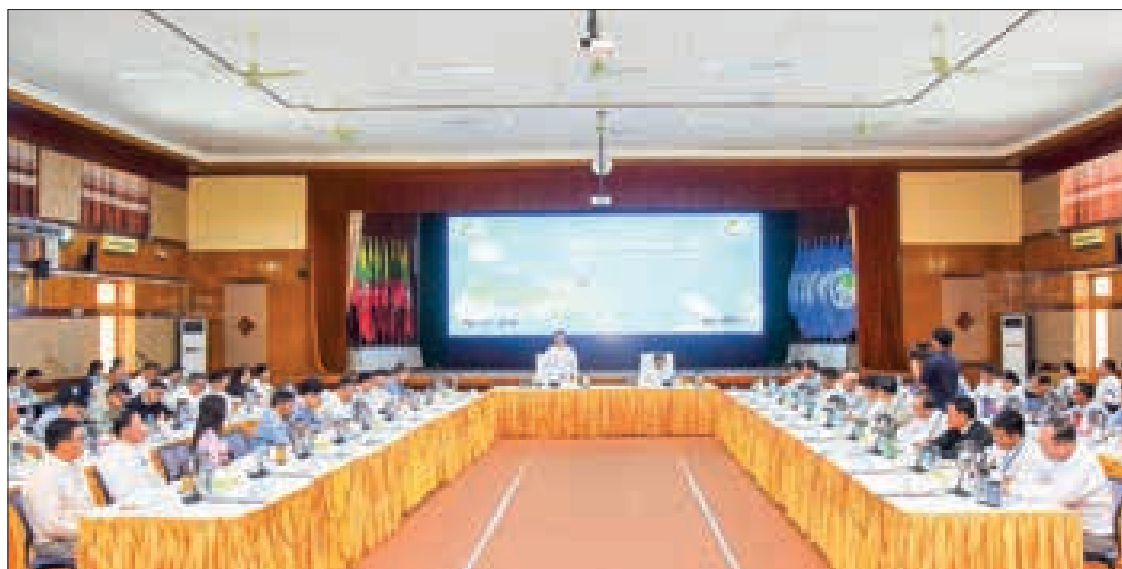
Union Minister U Maung Maung Ohn presides over the coordination meeting for the Nay Pyi Taw Walking Thingyan yesterday.

He also highlighted the intention of holding walking Thingyan and added that systematic arrangements would be conducted by cooperating