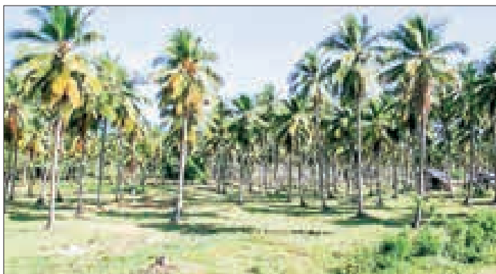
A coconut farm in Ayeyawady Region.

Because of the demand from foreign markets, coconuts have been rare in local markets, and consumers have to buy them at a higher price. In the Yangon market, the cost of a dried coconut is now around K1,500-K2,000, said a housewife. — MT/ZS