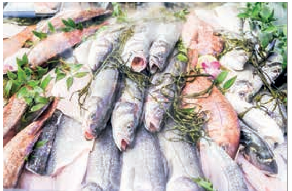
Seafood samples are displayed at the 2024 Seafood Expo North America in Boston, Massachusetts, the United States, 10 March 2024.

China has full-fledged industry chains for tilapia, and tuna and other aquatic products that are a kind of necessity in people's daily life, Deng said, adding that quite a number of poten-