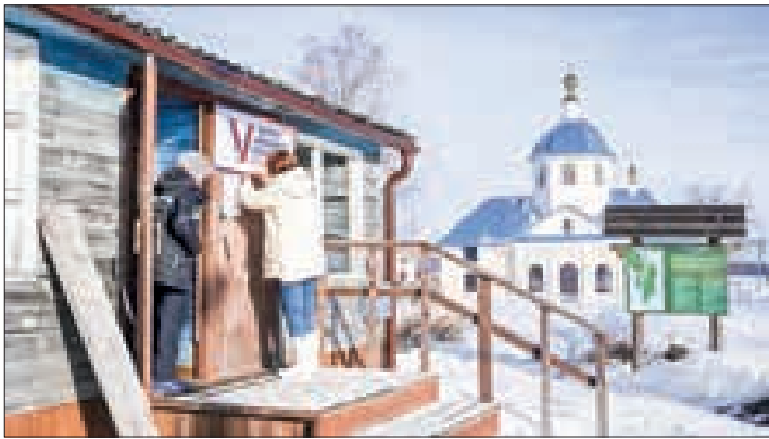
A polling station during early voting for Russia's presidential election in the village of Sennaya Guba, republic of Karelia.

Over 110 million eligible voters out of the country's 145+ million citizens can cast their votes at over 100,000 polling stations, with remote voting options available.