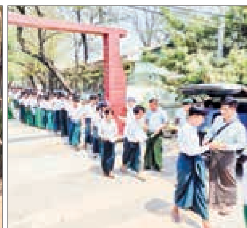
Madaya, Mandalay Region.