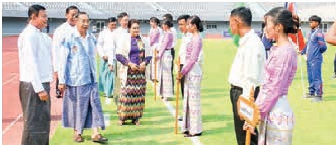
SAC members, Union ministers and officials open the 2023-2024 Inter-State and Region U-25 Men's Football tourney yesterday.

AN opening ceremony of the 2023-2024 Inter-State and Region U-25 Men's Football Tournament was held at Wunna Theikdhi Stadium in Nay Pyi Taw yesterday.