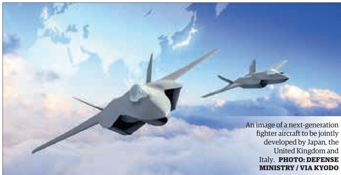
An image of a next-generation fighter aircraft to be jointly developed by Japan, the United Kingdom and Italy.

Street before the UK general election — which must be held by 28 January next year. The plot hinges on who could replace Sunak and cut the opposition Labour Party's 20-point poll lead in a few months, sources acquainted with the matter said. — SPUTNIK