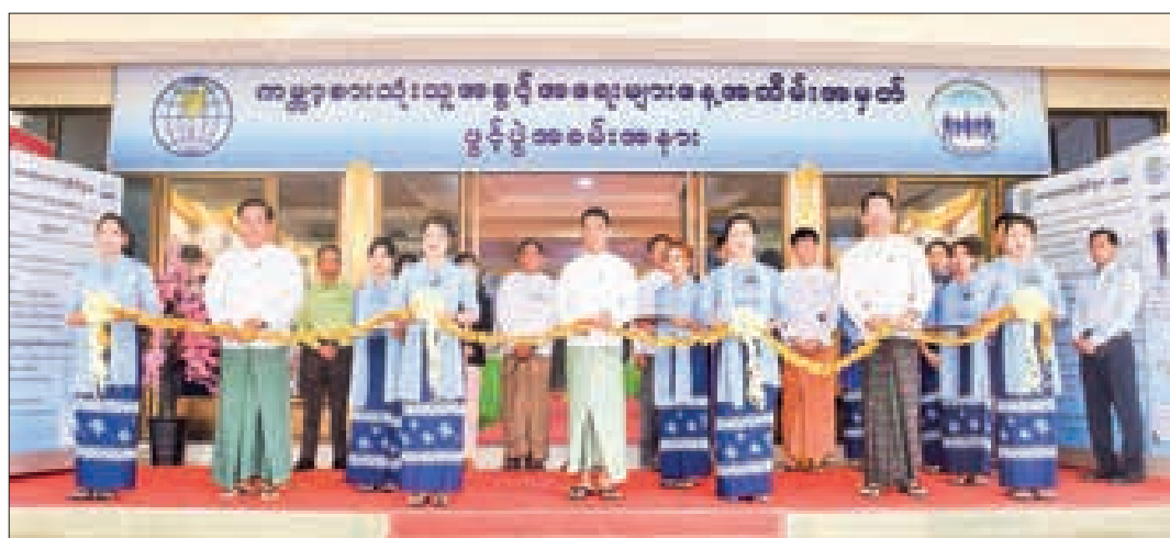
The photo shows the celebration of the World Consumer Rights Day ceremony.

Additionally, the Union minister, the deputy minister, and officials awarded the winners of the competitions held in commemoration of World Consumer Rights Day and presented gifts to the performers. — MNA/TRKM