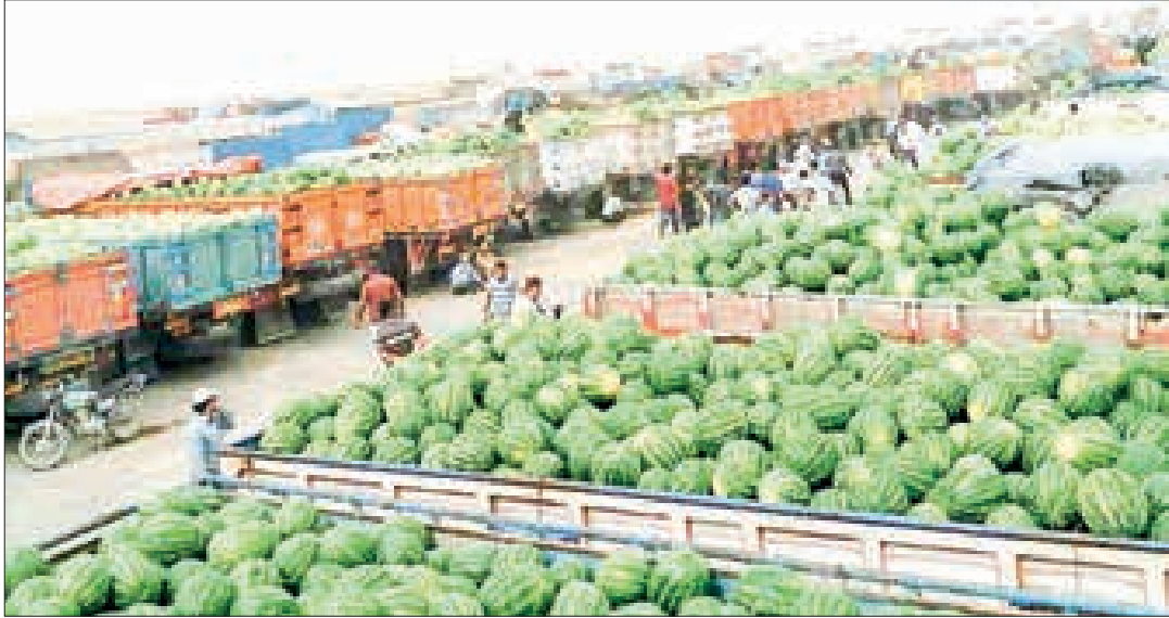
The photo showcases Myanmar watermelons that are to be exported to China.

WATERMELON exports from Myanmar to China are struggling to gain market share due to the conditions of transport routes, according to fruit depots.