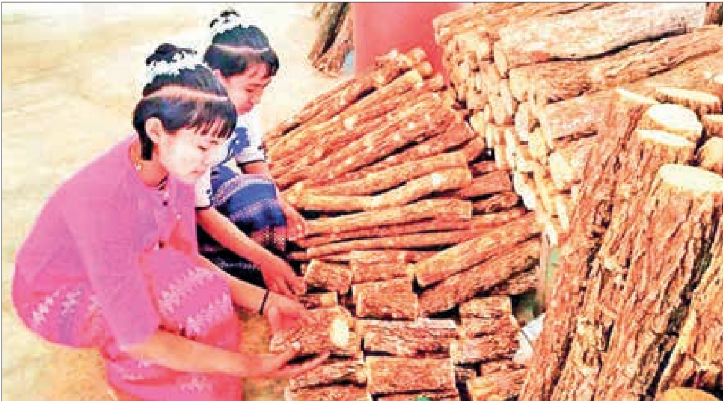
The photo depicts Myanmar Thanaka and Myanmar damsels sorting out Thanaka barks.

M yanmar Thanaka will be processed into ready-to-apply products for export to the ASEAN market, as announced by the Myanmar Thanaka Growers and Exporters Association.