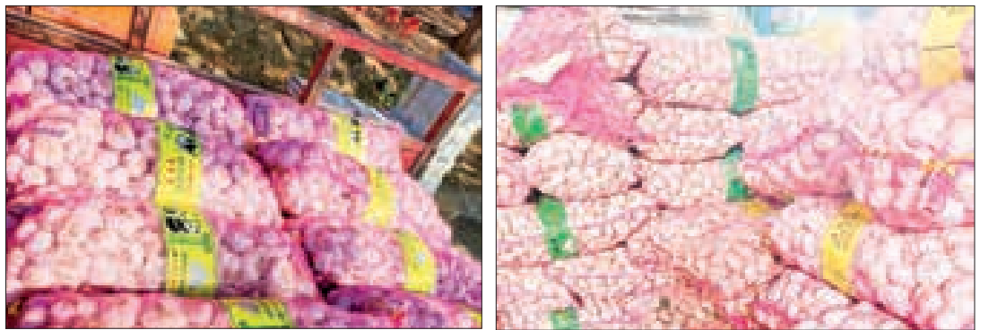
Photos show stacked Kyukok garlic sacks at a warehouse.

THE price of Shan garlic drastically dropped while the cost of Kyukok garlic rose in the Yangon market.