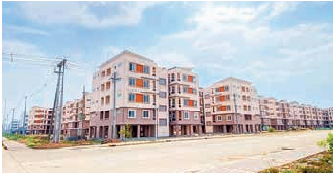
The Thukha Dagon public rental housing.

“When some are actually struggling to obtain living permits, the house owners involve in the drawing-lots system. At