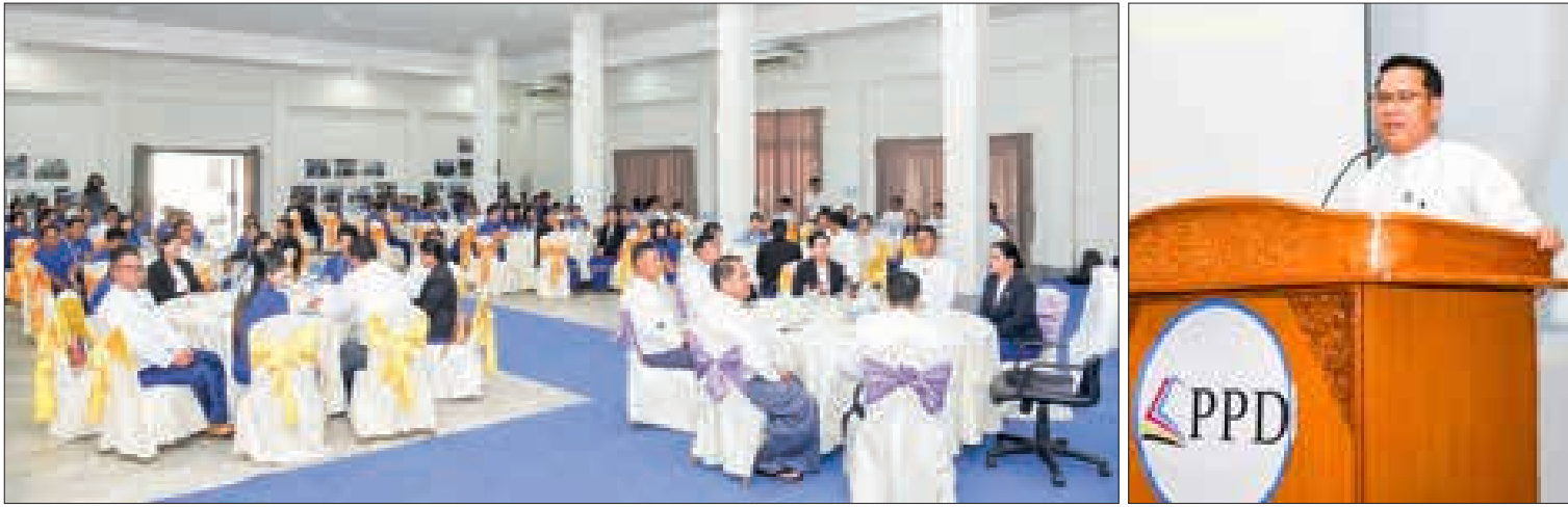
Union Minister U Maung Maung Ohn speaks on the occasion of the 52 nd anniversary of the Printing and Publishing Department yesterday.

THE 52 nd -anniversary ceremony of the Printing and Publishing Department (PPD) under the Ministry of Information took place in Nay Pyi Taw yesterday morning.