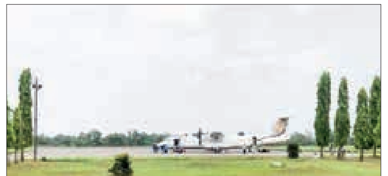
An aircraft parked at Bhamo Airport last year.

AEROPLANES resumed landing at Bhamo Airport after it was closed for several days, according to communication with locals.