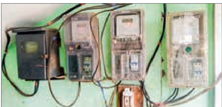
The photo depicts household electricity meter boxes.

nected with fifteen banks and financial services, can be used if transportation is difficult. Nearly nine per cent of the electricity arrears remain in regions and states where collection is challenging. The collection of electricity bills is ongoing in some villages, and security plans are in place. Arrears for FY 2023–2024 will be collected before April 2024. Electricity supply will be cut for those who fail to pay their bills, and it will be restored upon payment. — TWA/TRKM