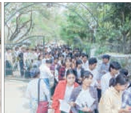
Singaing, Mandalay Region.