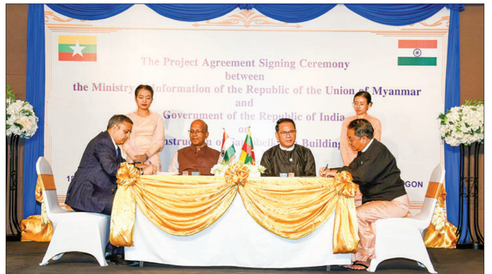
The signing ceremony for the Sarsobeikman construction project agreement in progress yesterday in Yangon.

The Union Minister underscored that the proposed building aims to celebrate accomplished Myanmar writers and literature itself. In this building, historical, literary materials that everyone can study the history of Myanmar literature will be displayed. Moreover, palm-leaf inscriptions (Pe and Parabaik), hand-written scripts of famous Myanmar writers, their photographs and biographies, rare books, literary prize medals, and photographs of various types of printing presses that have been used for generations throughout the history of Myanmar printing will be showed as a gallery. Likewise, literary events such as literary conferences and seminars, literary award ceremonies, literary talk