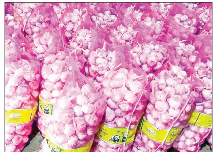
The photo depicts Chinese garlic being sold in the market.

In the second week of February, the price of locally-produced garlic dropped below K10,000, but due to high demand, the price is now K12,000-K13,000 per viss. In previous years, garlic prices were regularly around K5,000, and this year, they have increased. — Thit Taw/ZS