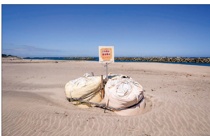
This photo taken on 22 August 2023 shows a "No Swimming" warning sign at Tsurishihama beach in Shinchi town, Fukushima prefecture, Japan.

As per the initial plan, approximately 31,200 tonnes of wastewater, containing radioactive tritium, was released into the ocean since the discharge started in August 2023, with each round of discharge carried out for about