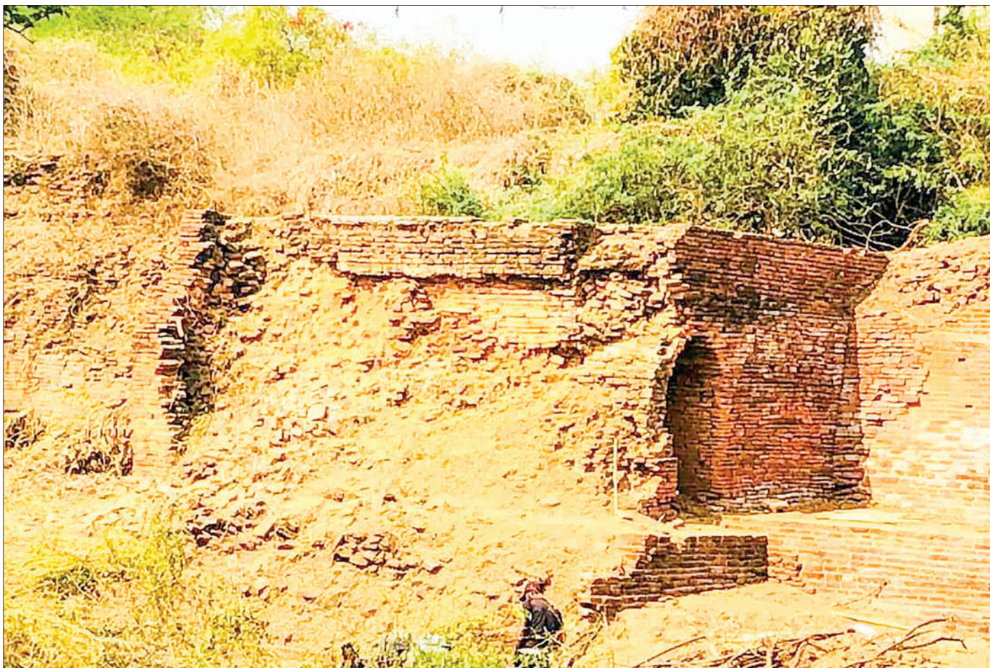
A small, human-sized entrance to the Bagan Palace, buried under bushes for ages, was discovered during the dredging of an ancient lake.