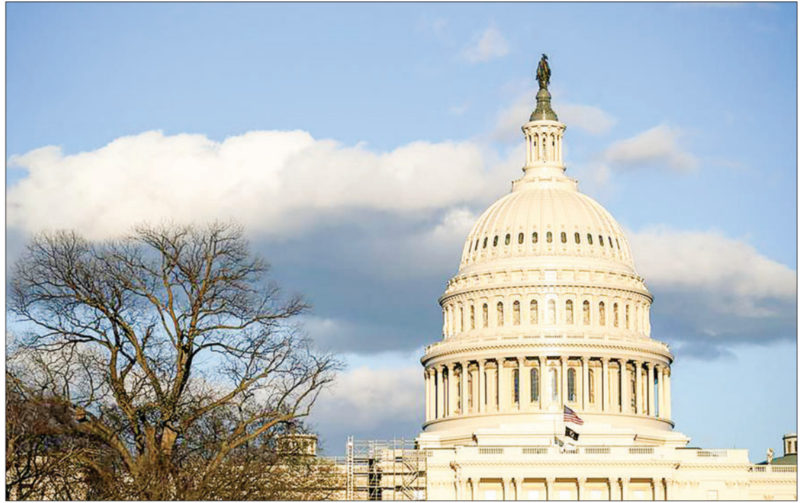
Photo taken on 28 March 2022 shows the Capitol building in Washington, DC, the United States.

Little wonder, the list of challenges troubling US socie-