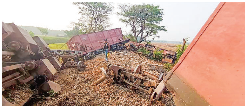
Photos show debris and damage left in the wake of the mine blast perpetrated by terrorists.

THE No 686 Down train, which ran for the Thaephyugon-Kali section on the Bago-Mawlamyine railway, derailed between mileposts 123/1-122/2 of Theinseik and Donwun stations after hitting a mine at 7:10 am yesterday. The mine was planted by insurgent groups.