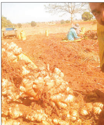
Ginger bags being loaded onto trucks to transport to wholesalers.

In the summer 2022, ginger prices dropped but climbed up again last year, and the number of ginger farmers increased again. — Thit Taw/ZS