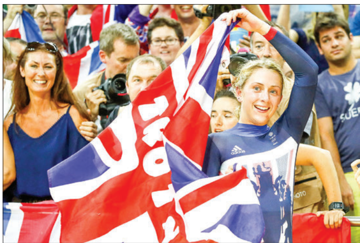
(FILES) Britain's Laura Trott holds up a flag as she celebrates after winning the Women's Omnium Points race to win the Omnium track cycling event at the Velodrome during the Rio 2016 Olympic Games in Rio de Janeiro on 16 August 2016. Laura Kenny, Britain's most successful female Olympic athlete, has announced her retirement from competitive cycling.

"I always knew deep down I would know when the right