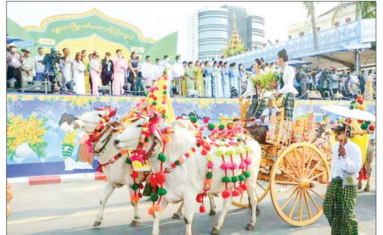
The photo shows a Thingyan decorated bullock cart representing the township at the opening of the Mandalay Thingyan Festival in 2022.

Additionally, festivities will be held in front of Mingala Mandalay, with walking Thingyan and