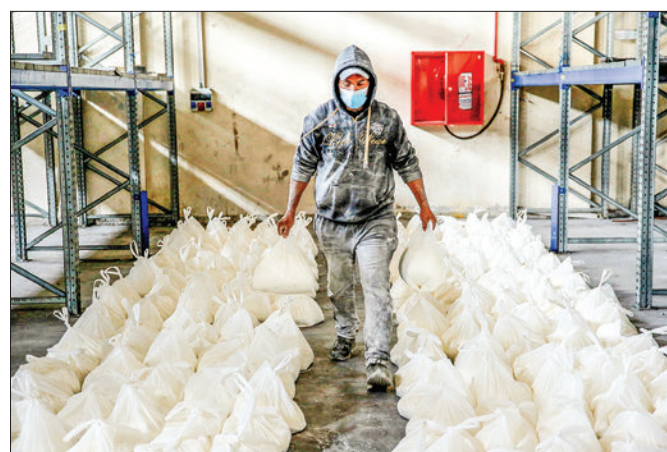
A worker sorts flour bags during the distribution of humanitarian aid in Gaza City on 17 March 2024 amid ongoing battles between Israel and the militant group Hamas.

The IPC hunger monitoring system, carried out by