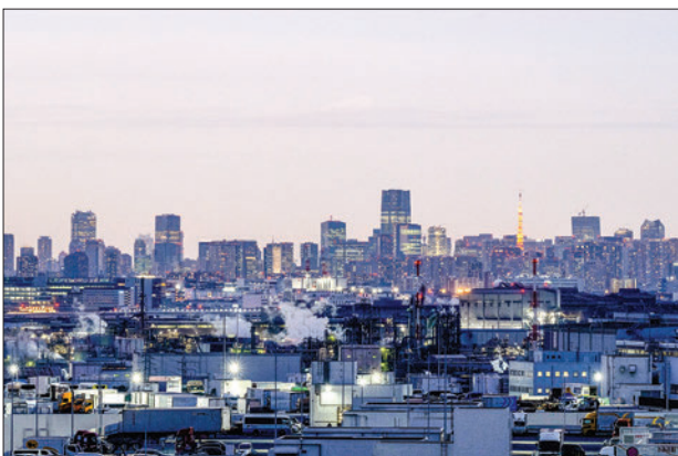
Tokyo's Skyline is seen among the Keihin Industrial Zone from the observation deck of Kawasaki Marien in Kawasaki on 17 January, 2023.

can be registered using mobile phone numbers and regions, according to the central bank statement. — Xinhua