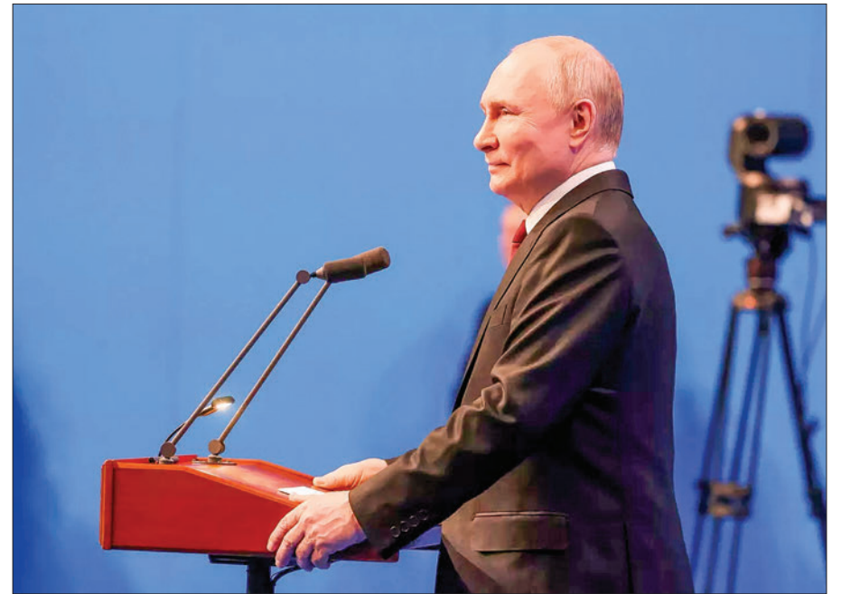
Russia's incumbent President Vladimir Putin speaks to reporters in Moscow on 18 March 2024.

She also thanked all the international observers who visited Russia "and wanted to see for themselves how the election process is held" in the country.