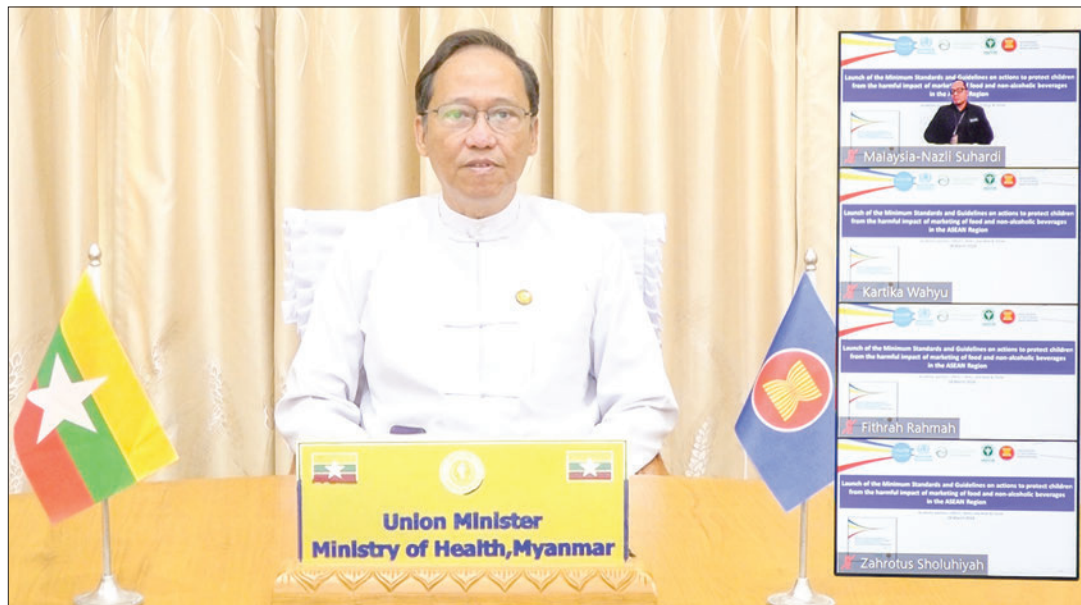
Union Minister Dr Thein Khin Win virtually participates in yesterday's launching event.

A virtual ceremony was held in Bangkok, Thailand, to launch instructions and basic standards aimed at preventing the sale of food and alcoholic drinks harmful to children in the ASEAN region.