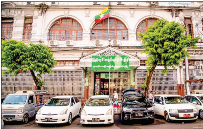
The Yangon Region Internal Revenue Department.

Upon presenting proof of tax payment, the office will issue the certificate containing approved security clearance from the system. If additional taxes are owed as per Myanmar's tax laws or the laws of the taxpayer's destination country, the agreed amount will be adjusted accordingly. The bank will issue receipts for future payments.