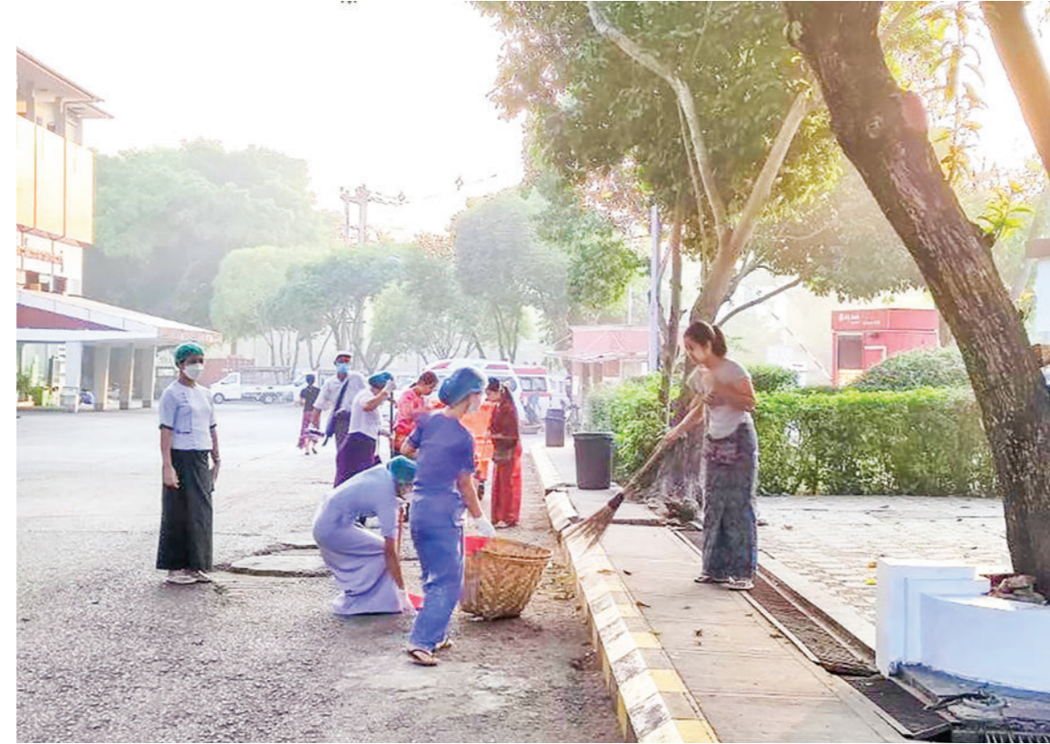
Hospital Environment Cleaning

Hospital management is the field of managing the administrative and operational aspects of healthcare facilities, such as hospitals, clinics, nursing homes, etc. Hospital management professionals are responsible for ensuring the quality of patient care, the efficiency of processes, the safety of staff and patients, the financial