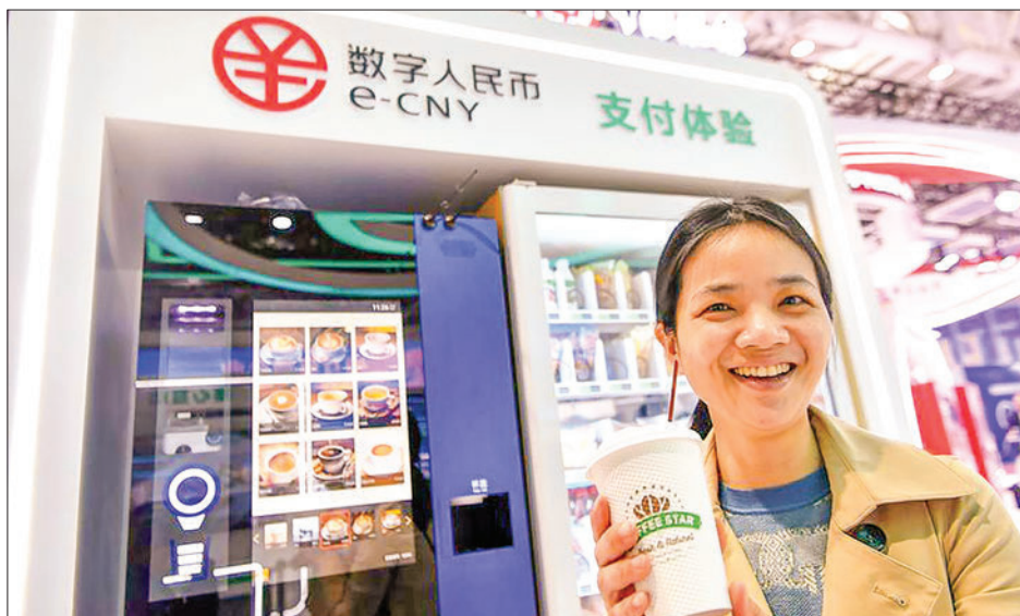
A visitor displays a cup of coffee purchased with China's digital yuan, or the e-CNY, at an exhibition of the 6th Digital China Summit in Fuzhou, southeast China's Fujian Province, 26 April 2023.

Next, click "Open/Add e-CNY Wallets" and select any authorized operator that supports international services to complete the registration process and start using