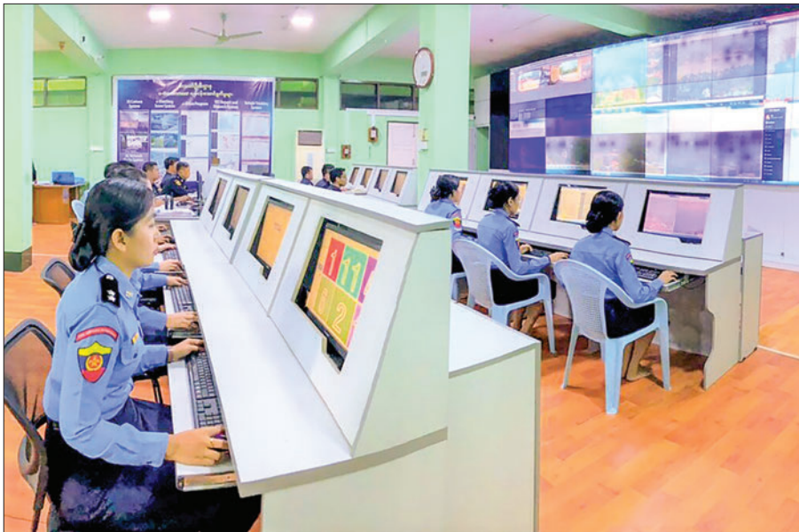
The 24/7 fire surveillance with the Command-and-Control Centre is functioning.

DIRECTOR U Thein Tun Oo of the Myanmar Fire Brigade HQ has announced the installation of CCTV cameras on high-rise towers throughout the Yangon Region. The Command-and-Control Centre is actively monitoring these cameras as a preventive measure against