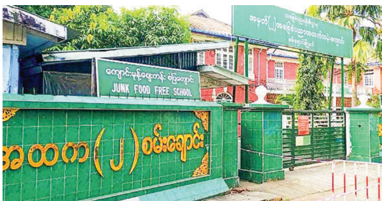
One of the examination centres in Yangon Region – BEHS 2 Sangyoung.

ACCORDING to the Ministry of Education, one of two registered examinees—one male student in Mandalay and one female student in Yangon region — sat for the social science subject on the seventh day of the 2024 (new curriculum) matriculation examination. Yesterday, a female student from Yangon Region took the social science subject in the matriculation examination. — MNA/TTA