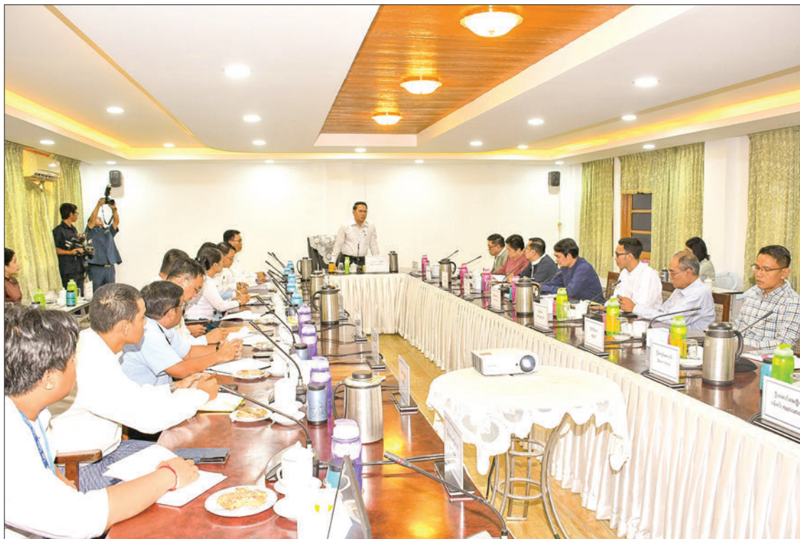
Union Information Minister U Maung Maung Ohn presides over the meeting to establish the Myanmar Digital Media Association yesterday in Yangon.

During the meeting, the Union minister highlighted the increasing use of digital media, including social media and creative broadcasting in Myanmar, which has become prevalent in society. He emphasized the importance of maintaining and enhancing the role of digital media, not only for widespread dissemination of information to the public but also for contributing to economic growth. He noted the rapid development of digital media usage in Myanmar in recent years, especially with the proliferation of mobile phones and internet access,