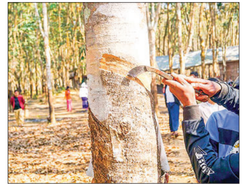
A worker diligently working on the sap from a rubber tree.

Myanmar's annual rubber production is estimated at 300,000 tonnes. Sev-