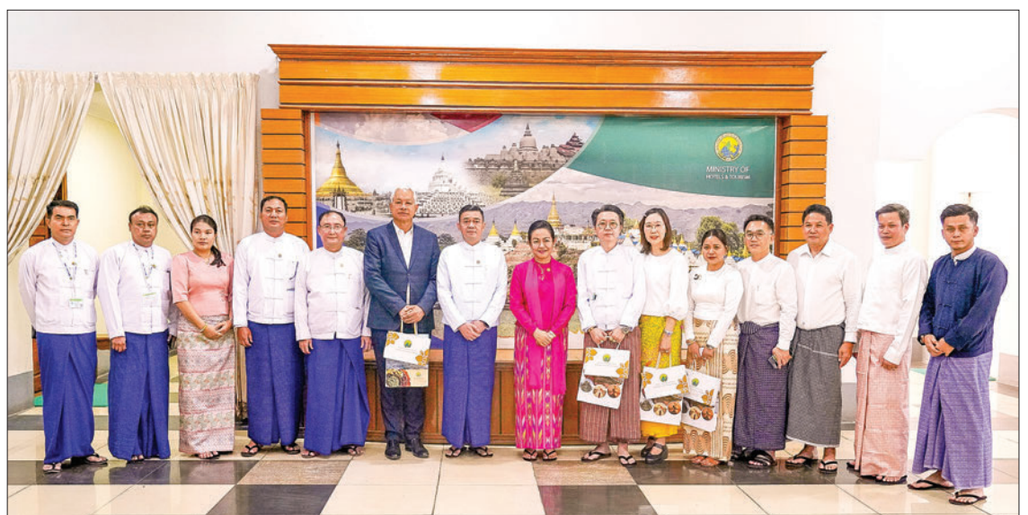
Union Minister Dr Thet Thet Khine poses for the group documentary photo at yesterday's event.

devised to attract tourists from Thailand and beyond, including discussions on Kachin State's snow-capped mountain region, a renowned ASEAN travel destination. Initiatives include inviting Thai business people to explore the area, promoting tourism investment, creating promotional videos, and boosting cooperation with foreign travel documentaries through extensive social media promotion.