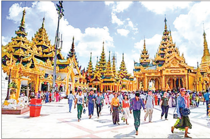
Some pilgrims seen at the Shwedagon Pagoda.