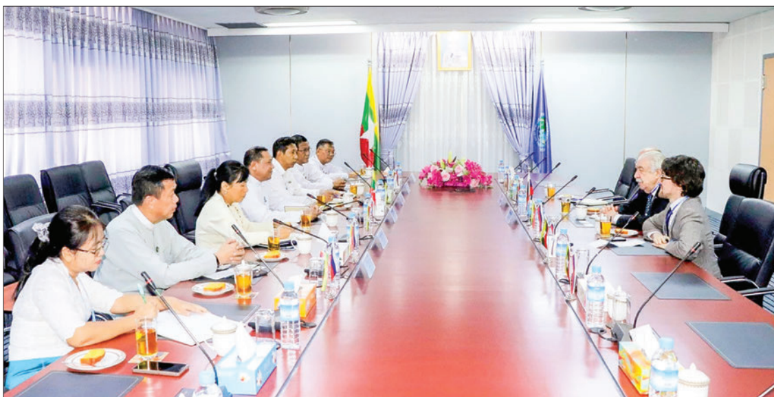
Discussions on the media sector collaboration in progress yesterday at MRTV in Yangon.

MYANMAR and Russia engaged in a cordial and open discussion regarding cooperation in the media sector, aiming to foster friendship and cultural exchanges between the two nations. The meeting took place at Myanmar Radio and Television (MRTV) in Yangon.