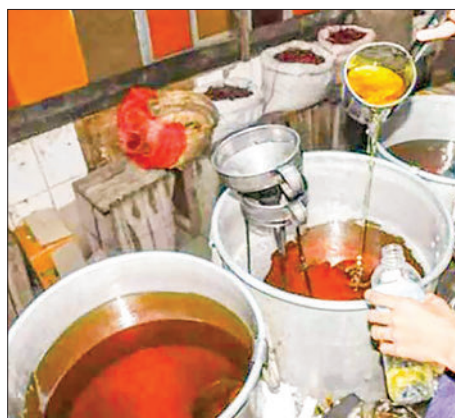
A vendor meticulously arranges edible oil for sale at the outlet.

To control overcharging, the Consumer Affairs Department under the Ministry of Commerce informed the