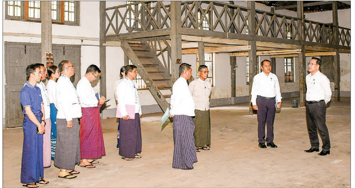
Union Minister U Maung Maung Ohn views round the warehouse of the Printing and Publishing Department yesterday in Yangon.

He continued that government employees should make efforts for the interest