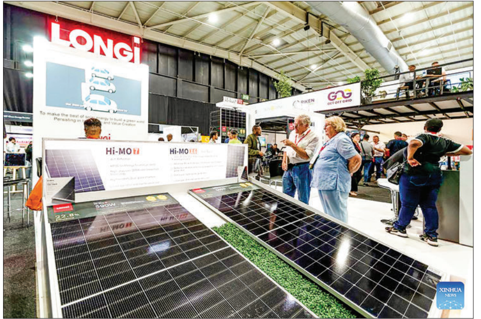
Visitors are seen at the booth of LONGi Green Energy Technology during the Solar & Storage Live Africa 2024 in Johannesburg, South Africa, 18 March 2024.

During the show, there will also be forums and conferences with attendees from governments and leading players in the energy sector across the region to focus on the most pressing issues in Africa’s energy sector, according to Bester. — Xinhua