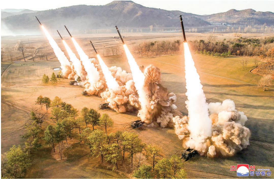
This picture taken on 18 March 2024 and released from North Korea's official Korean Central News Agency (KCNA) on 19 March 2024 shows North Korea's Western Region Artillery Unit's ultra-large rocket salvo firing drill, at an unconfirmed location in North Korea. North Korean leader Kim Jong Un oversaw a series of firing drills by artillery units in the west of the country, the country's state-run news agency said on 19 March.