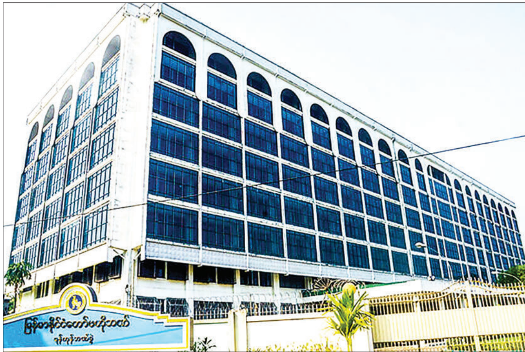
The photo depicts Yangon branch of Central Bank of Myanmar.

TWO money changers (Update Forever and Ngwe Boom) got their licence suspended for up to three months as they failed to comply with the rules and directives issued by the Central Bank of Myanmar (CBM), as per its notification dated 18 March.