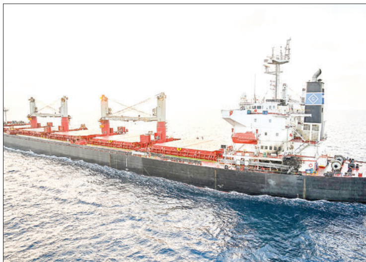
This handout photograph released on 18 January 2024 by the Indian Ministry of Defence shows the Marshall Island flagged MV Genco Picardy vessel following a drone attack in the Gulf of Aden.

have been at least 47 separate Houthi attacks on commercial vessels and one ship was seized, the authority estimated.