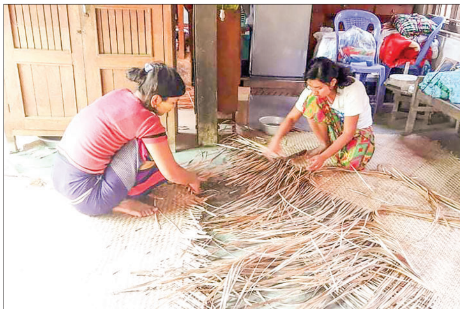
Female artisans skillfully craft mats with meticulous attention to detail.

Almost all villagers from Latsaungyu Village in TadaU Township, Mandalay