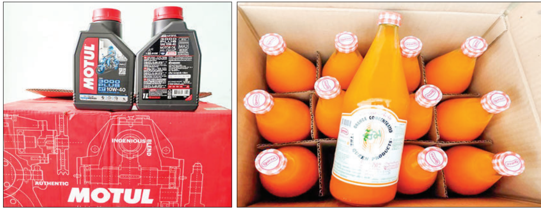
Photos show seized commodities in Bago and Yangon regions.

THE on-duty team under the Magway Illegal Trade Eradication Special Task Force confiscated illegal goods in various locations over several days.