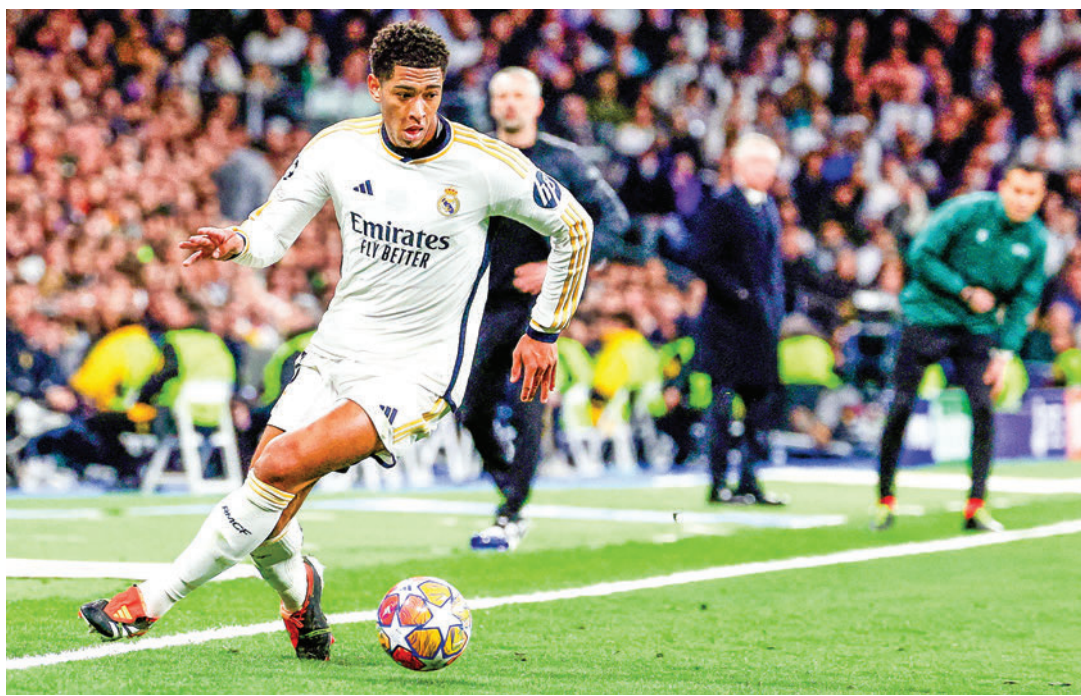
Real Madrid's English midfielder (5) Jude Bellingham controls the ball by the touchline during the UEFA Champions League last 16 second leg football match between Real Madrid CF and RB Leipzig at the Santiago Bernabeu stadium in Madrid on 6 March 2024.