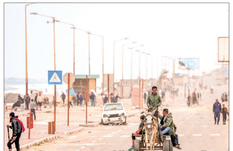
Displaced Palestinians fleeing from the area in the vicinity of Gaza City's al-Shifa hospital arrive via the coastal highway at the Nuseirat refugee camp in the central Gaza Strip on 18 March 2024 amid the ongoing battles between Israel and the militant group Hamas.

A total of 20 militants were killed and dozens of "suspects" were arrested and are undergoing interrogation, according to the military. — Xinhua