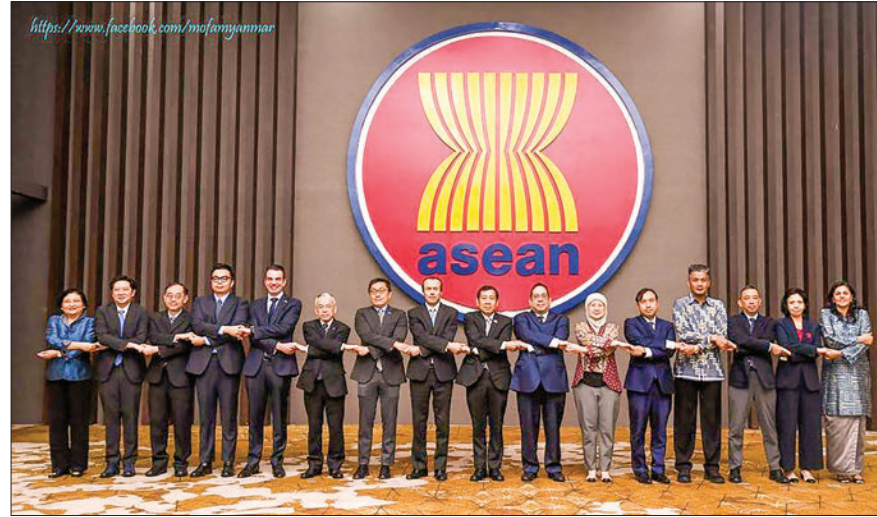
Delegates pose for a group photo at the ASEAN-UN Interface.

MYANMAR'S representative participated in the interface meeting between the Committee of Permanent Representatives to ASEAN (CPR) and the