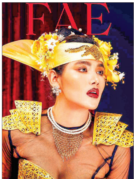
Image of the contestant.

THE Myanmar Theatrical Association (Central) has strongly criticized the decision to pair the traditional dancer turban, a traditional head wrap worn by male dancers in theatrical performances, with the gown intended for the Myanmar representative at the Miss Universe 2024 pageant in Mexico.