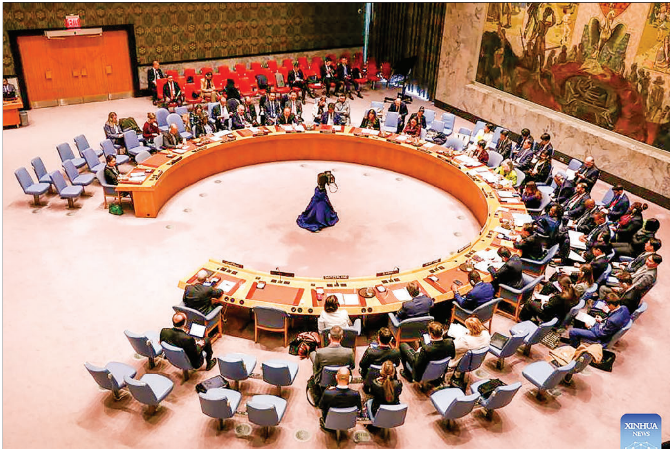
The United Nations Security Council holds a meeting on nuclear disarmament and non-proliferation at the UN headquarters in New York on 18 March 2024.

UN Secretary-General Antonio Guterres on Monday called on nuclear weapon states to lead the way toward nuclear disarmament, including an agreement on no first use.