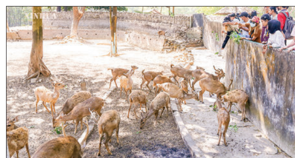
The photo shows visitors feeding animals in Yangon Zoo.

THE Yangon Zoo offers feeding packages for over 1,360 animals, comprising 43 types of mammals, 19 types of reptiles, and 69 types of bird species.