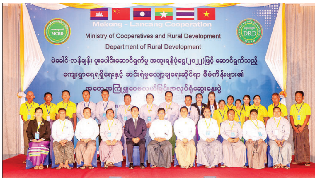
The rural development workshop on Mekong-Lancang Cooperation projects in progress yesterday in Nay Pyi Taw.

THE Department of Rural Development under the Ministry of Cooperatives and Rural Development held a workshop at MGallery Hotel in Nay Pyi Taw yesterday. The session focused on sharing experiences related to poverty alleviation and rural water access projects funded through special funds from the Mekong-Lancang Cooperation.