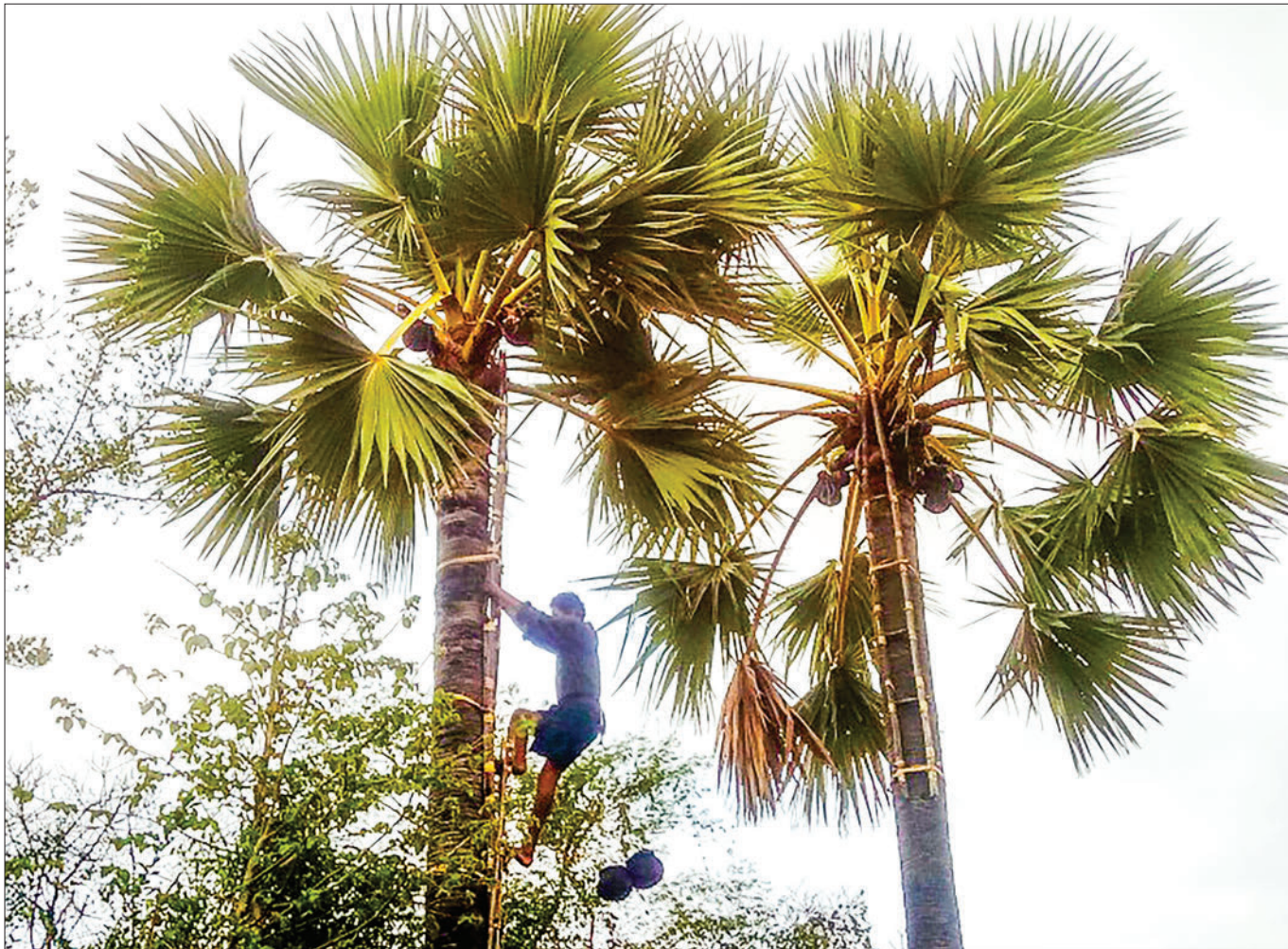
The picture shows a palm tree climber diligently working for the palm syrup.