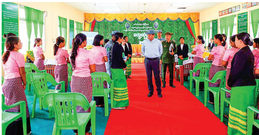
Union Minister Lt-Gen Tun Tun Naung (C) is pictured during his inspection tour in Mon State yesterday.

MINISTRY of Border Affairs Union Minister Lt-Gen Tun Tun Naung accompanied Mon State Government Minister of Security and Border Affairs Col Kyaw Myint, and officials arrived at the Women's Domestic Vocational Training School in Mudon, Mon State, yesterday morning, and the