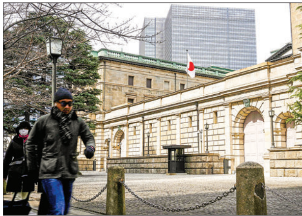
Photo taken on 19 March 2024, shows the Bank of Japan headquarters in Tokyo.

THE Bank of Japan on Tuesday ended unorthodox monetary easing steps of the past decade, scrapping its negative interest rate policy and yield cap program, convinced by robust wage growth leading towards its long-elusive two per cent inflation goal.