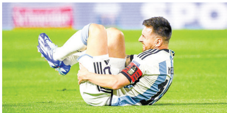
(FILES) Argentina's forward Lionel Messi lies on the field during the 2026 FIFA World Cup South American qualification football match between Argentina and Uruguay at La Bombonera stadium in Buenos Aires on 16 November 2023.

Argentina will meet El Salvador in Philadelphia on Friday and Costa Rica in Los Angeles four days later. — Xinhua