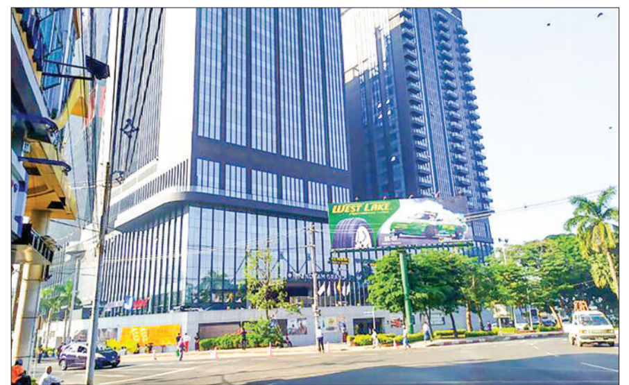
Yangon hotel zone sees resurgence as small hotels reopen amid domestic tourism hikes.

According to data from the Ministry of Hotels and Tourism, there are guesthouses distributed as follows: 43 in Kachin State, 24 in Kayah State, 48 in Kayin State, nine in Chin State, 50 in Mon State, eight in Rakhine State, 93 in southern Shan State, 76 in northern