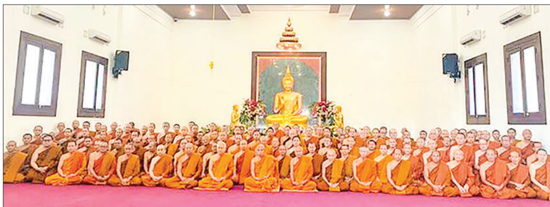
Myanmar's ambassador to Indonesia attends the ceremony of laying the foundation stone at the Vihara Vipassana Giri Yadana Temple in Indonesia.

THE ceremony for laying the foundation stone of the new religious building and the ordination of 50 monks took place on 16 March at the Vihara Vipassana Giri Yadana Temple in Bogor, Indonesia, attended by the Permanent Representative of Myanmar to ASEAN and the Ambassador of Myanmar to Indonesia, according to the