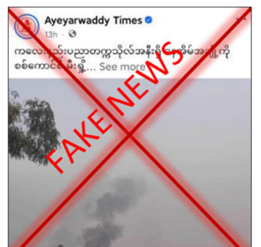
The screenshot validates false claims.

The attacks, reportedly carried out by PDF terrorists, involved artillery and drone bombings, resulting in fires and civilian casualties. Addi-