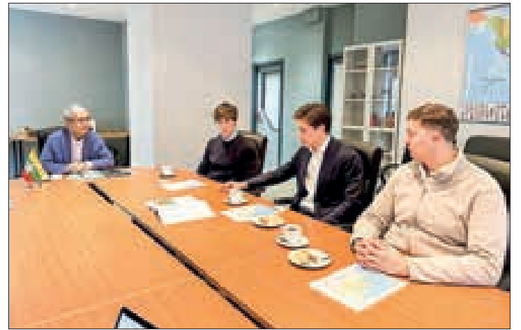
Myanmar Ambassador U Soe Lin Han receives the student delegation in the Netherlands on 12 March 2024.

Myanmar Ambassador U Soe Lin Han received the student delegation in Brussels. During the meeting, the ambassador provided insights into Myanmar’s progress, highlighting aspects not covered by the international media. He also discussed Myanmar’s strategic geopolitical position, its relationships with neighbouring countries, current political