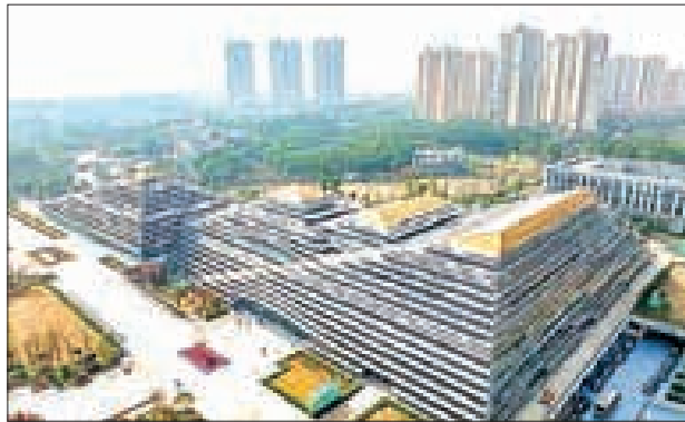
An aerial drone photo taken on 19 March 2024 shows the permanent venue of the 7 th China-France Forum on Urban Sustainable Development in the Sino-French Wuhan Ecological Demonstration City, in Wuhan, central China's Hubei Province.

The forum was hosted to mark the 10 th anniversary of China and France's signing the joint agreement to build the Sino-French Wuhan Eco-