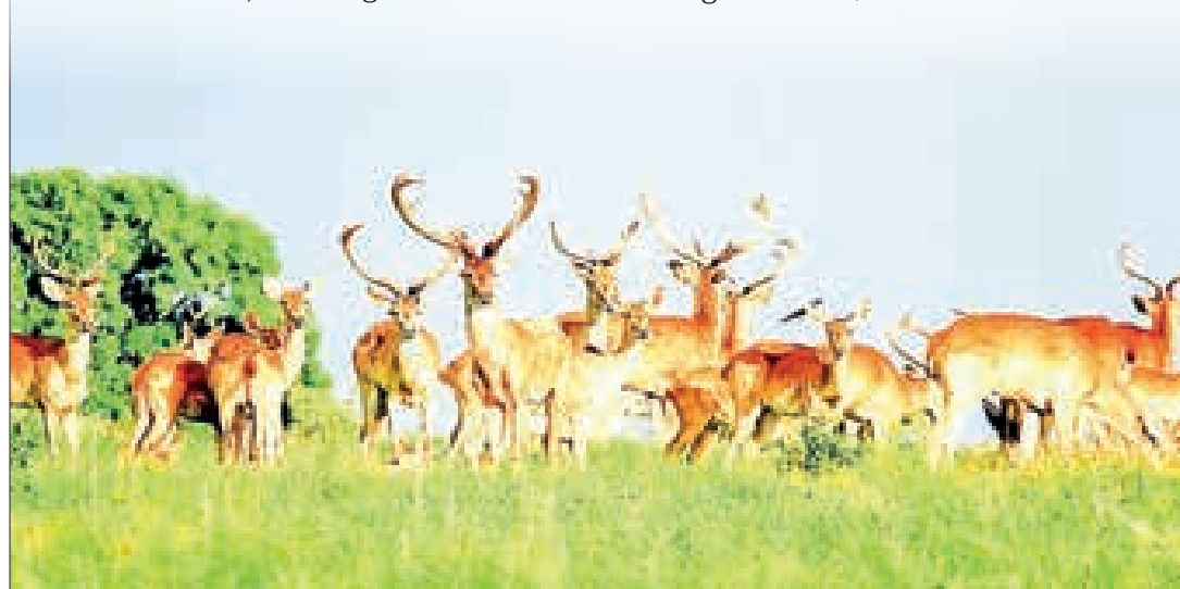
Captivating view of Myanmar's rare golden deer in enclosed herd at Shwesettaw Wildlife Sanctuary.

species. Additionally, the Myanmar golden deer is unique to our country. Therefore, it is imperative to conserve them to prevent extinction and promote population growth. Visitors to well-known tourist areas in Minbu (Sagu), during the Shwesettaw pagoda festival and open season, can also observe the golden deer at Shwesettaw Wildlife Sanctuary," stated U Thein Hlaing, vice-chair of the pagoda board of trustees. — Zeya Htet (Minbu)/TKO