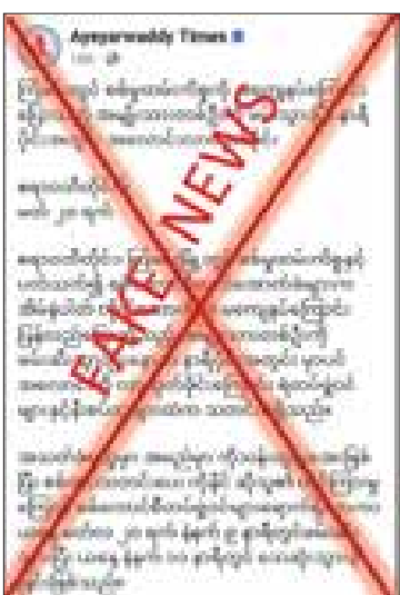
The screenshot validates false reports.

MALICIOUS new media are spreading false information on social media that a man who expressed dissatisfaction with the People's Military Service Law died within hours of his arrest in Shwetaungsu Ward, Kyangin. The true incident is that a group of administrative officials was collecting population censuses on 7 th Street in