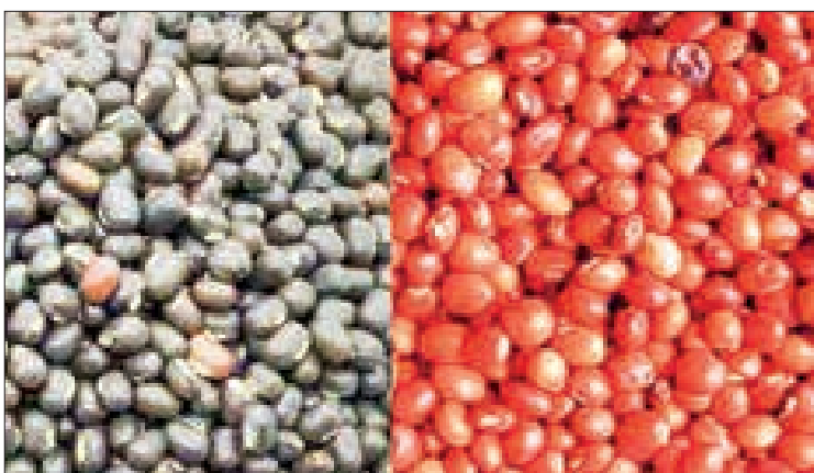
Pulses seen being neatly organized for sale at the market.

The demand by the leading buyer, India, heavily influences Myanmar's pulse prices. Wholesalers buy other profitable crops to store during harvest time. A total of 270 containers (6,480 tonnes) of black grams and 70 pigeon peas (1,680 tonnes) were traded in the 15 trading days this month. — TWA/KK