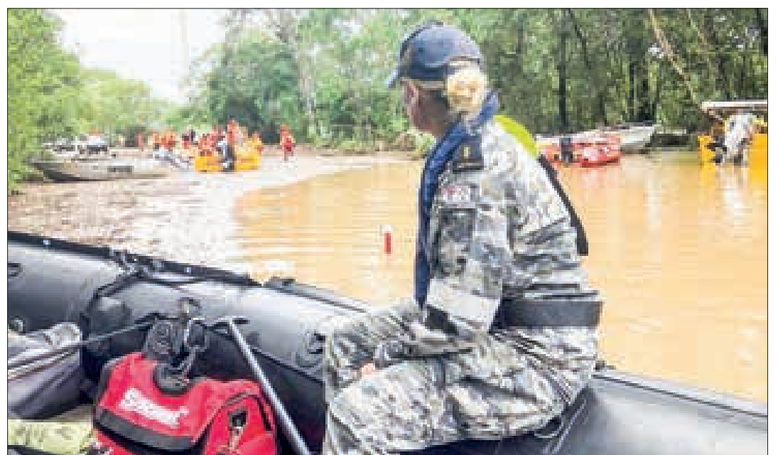
Royal Australian Navy personnel work with civilian emergency services to evacuate members of the public in Cairns, Australia, 18 December 2023.

A peak of 18 metres would be the highest water level in recorded history for the river, surpassing the 15 metres that caused significant flooding in 2001. NT Police Commissioner Michael Murphy said at a press conference that previous modelling had underestimated the impact of the rainfall, predicting a 15.3 metre peak. — Xinhua