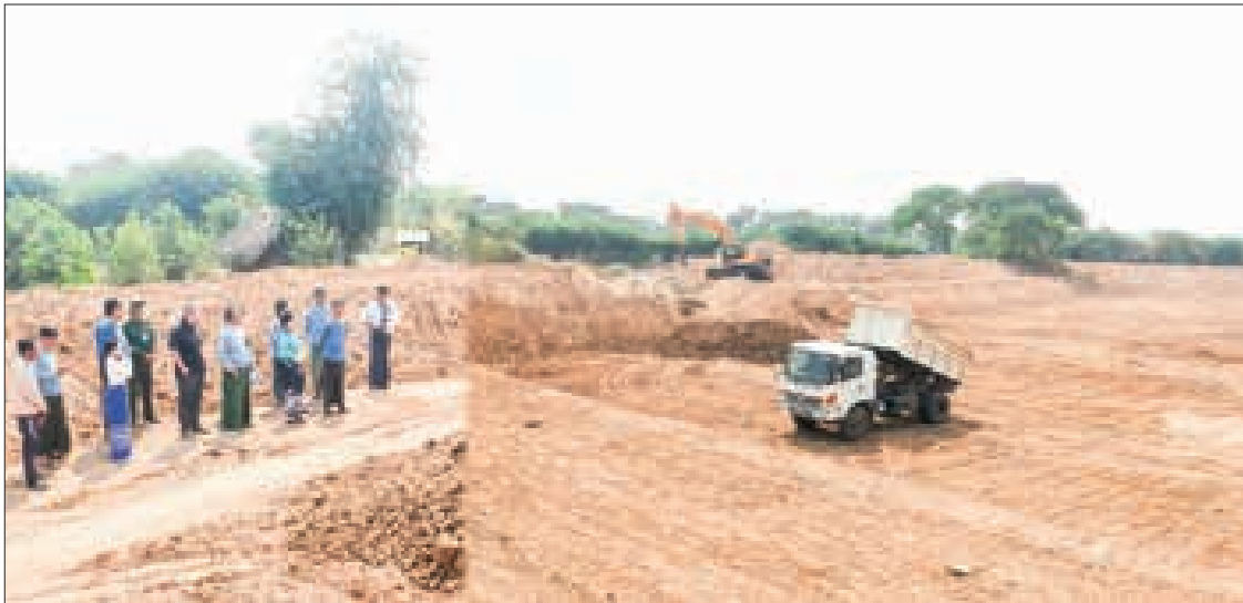
Restoration efforts in progress in the Bagan Ancient Cultural Heritage Zone.

THE Ministry of Religious Affairs and Culture enlisted an Italian hydrologist to assist in retracing water distribution networks from the Bagan era and dredging ancient water res-