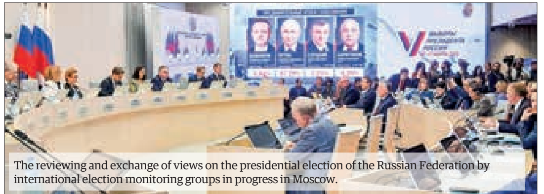
The reviewing and exchange of views on the presidential election of the Russian Federation by international election monitoring groups in progress in Moscow.