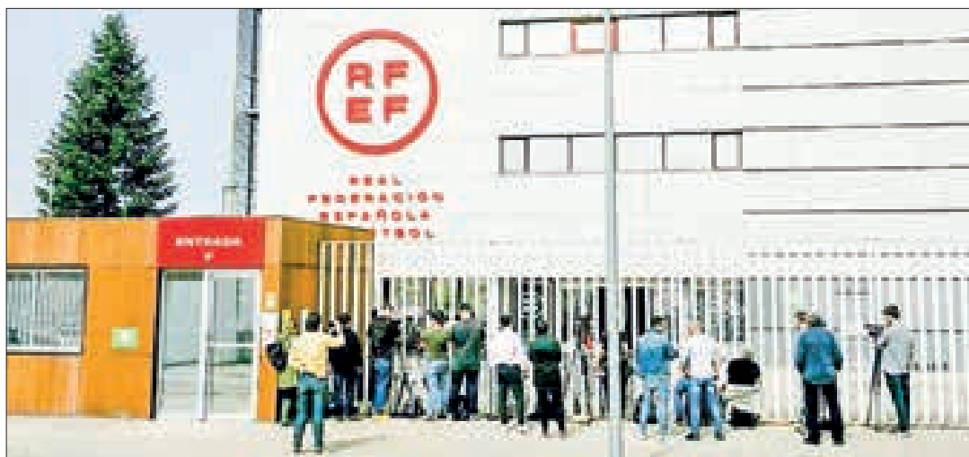
The Spanish football federation's headquarters at Las Rozas was searched by police as part of a corruption investigation.

Murray made just 20 unforced errors while Berrettini committed 44, as the Scot clinched his fourth consecutive first-round win. "There is life in the old dog yet," wrote Murray on the television camera lens at the end of the game and he was pleased with the manner of his win. — AFP