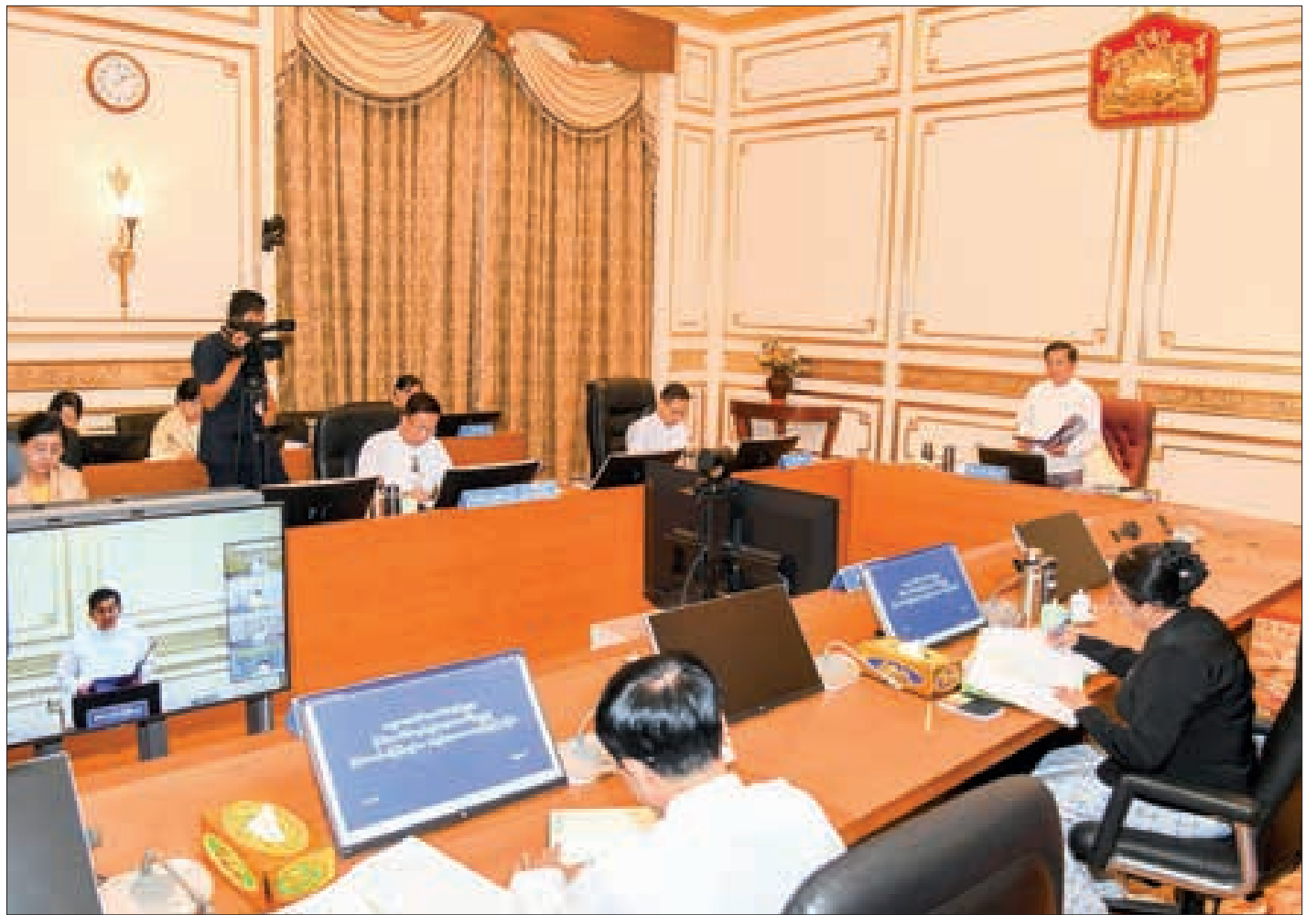
State Administration Council Chairman Prime Minister Senior General Min Aung Hlaing addresses the meeting 1/2024 of the Financial Commission yesterday in Nay Pyi Taw.

It is necessary to manufacture mass products in the agriculture, meat and fish sectors. Successful production of