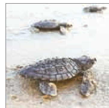
Sea turtles at the Thameehla Island.

The department not only educates residents about the life and habits of marine turtles and the environmental effects