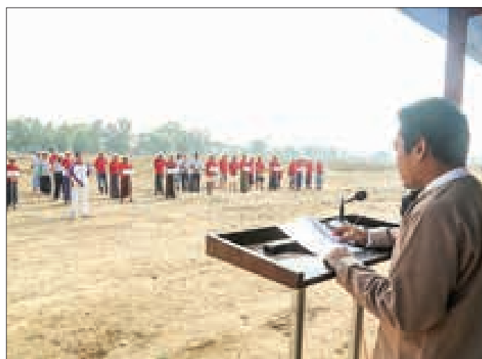
The opening event of the Myanmar Traditional Kite Flying Competition 2018 seen at the Equestrian Stadium in Yangon.

MYANMAR traditional kite flying competitions will be held for two days in the first week of April.