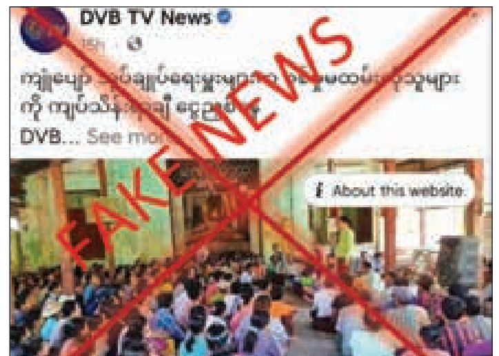
The screenshot validates misinformation.

SUBVERSIVE media outlets are circulating false information and propaganda, aiming to mislead the public regarding the military service law. They claim that village and ward administrators in Kyonpyaw Township, Ayeyawady Region, have convened meetings with young people and their parents, demanding extortion money from those unwilling to serve in the military. These malicious elements, along with terrorists, seek to obstruct various initiatives, fearing the public's compliance with military training and national defence obligations.