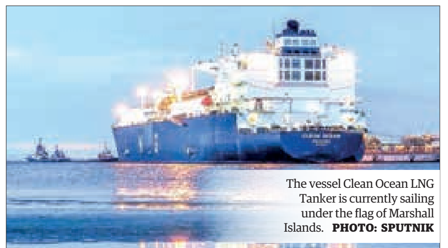
The vessel Clean Ocean LNG Tanker is currently sailing under the flag of Marshall Islands.

Last December, French imports of Russian LNG exports were estimated to be €244 million, marking an increase of almost €50 million over the month. Spain's LNG from Russia amounted to €274 million, 1.7 times higher than in