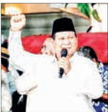
Prabowo Subianto attends a gathering with media and his supporters in Jakarta, Indonesia, on 20 March 2024.

Defence Minister Prabowo and his vice-presidential running mate, Gibran Rakabuming Raka, secured over 96 million votes, or 59 per cent, in the first round of the 14 February elections.