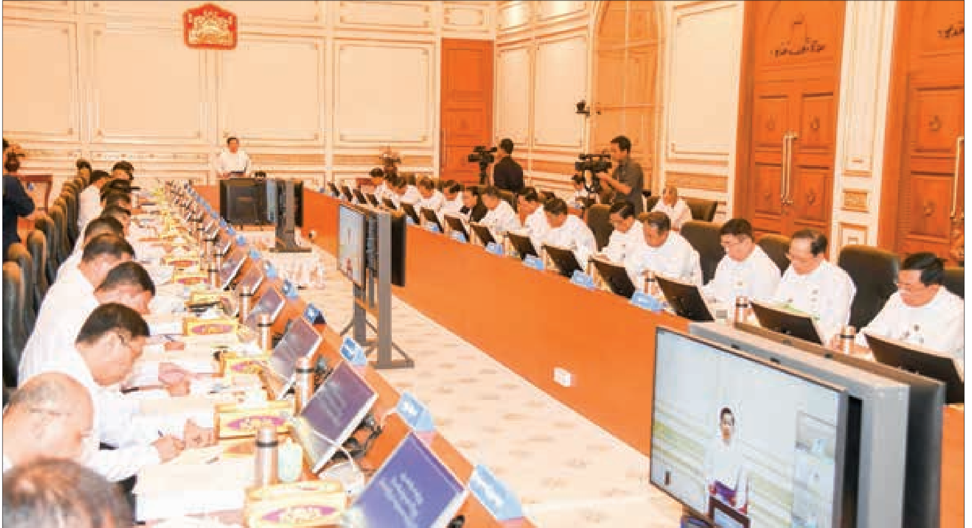
State Administration Council Chairman Prime Minister Senior General Min Aung Hlaing presides over the meeting 1/2024 of the National Planning Commission yesterday.