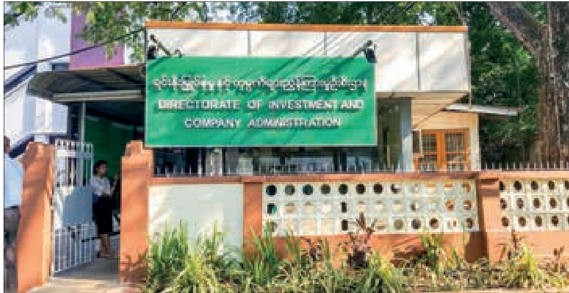
The front view of the Directorate of Investment and Company Administration office in Yangon.

need to submit AR on the MyCO registry system within two months of incorporation and at least once every year (not later than one month after the anniversary of the incorporation) under Section 97 of the law.