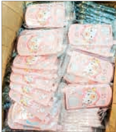
Photos show seized illegal goods in different states and regions.

ON 18 March, the Customs team confiscated various items valued at K17.626 million from four containers at the Myanmar Industrial Port. These included 912.69