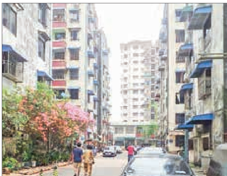
The photo shows Punhlaing Housing apartments in Kyimyindine Township.

The units under K 100 million attract more interest and sell well in the residential market while sales of K300-K350 million condominiums and K500-K600 million detached houses or land have resumed, he added. "Those under K100 million are doing well. There have been deals for land or separate houses worth K500-K600 million. Houses in Kyimyindine have jumped from K500 million to K600-K700 million. If it is on a wide main road, the price can be K1 billion. Sales are just steady. It is not as brisk as the most active periods," he said. Yangon's property market reached its high-price window in 2022-2023, and prices have recently doubled