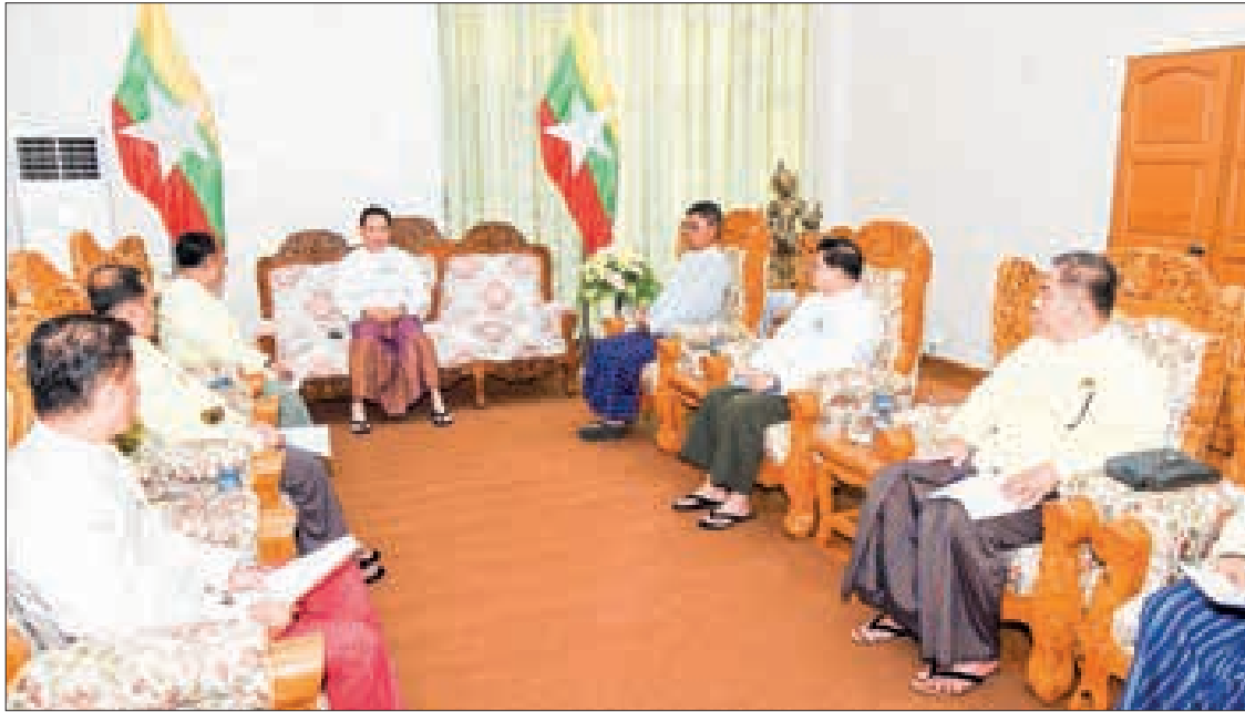
Union Minister U Maung Maung Ohn receives the YMBA officials in Nay Pyi Taw yesterday.