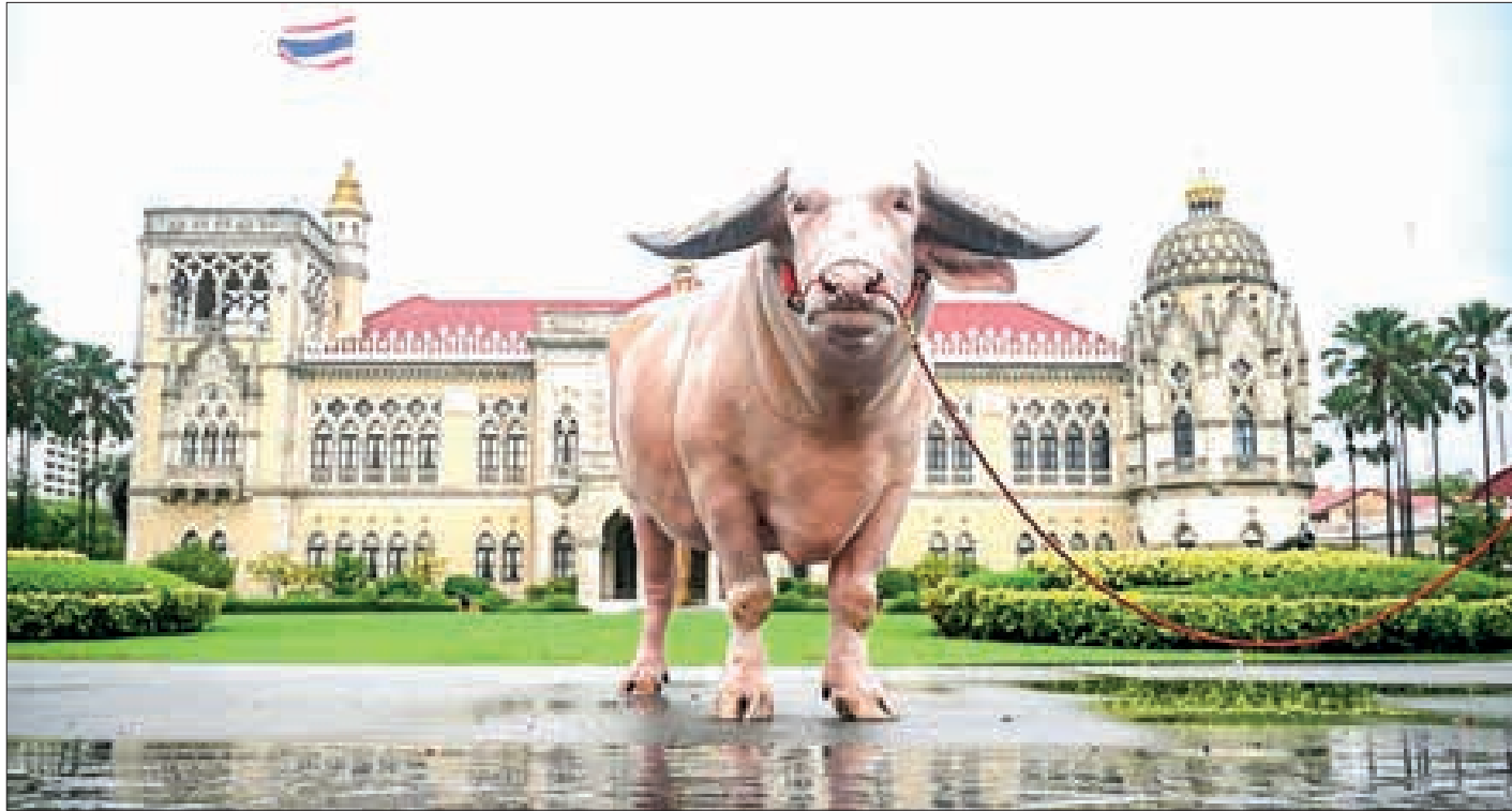
Bulky bovine Ko Muang Phet, who recently sold for about $500,000, was welcomed to Thailand's Government House.