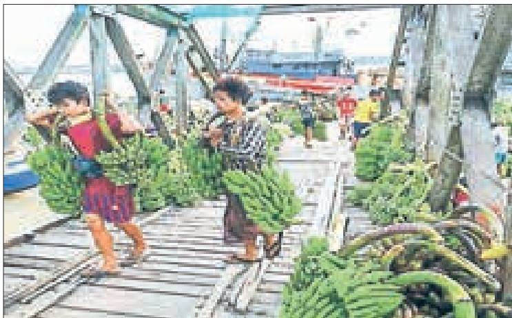
Two workers carrying banana bunches from a boat to Bagaya banana market.

IN the banana market, Pheegyan and Rakhine bananas have been selling well, but Theemhwe banana, which previously gained active sales, has been slow now, according to banana traders.