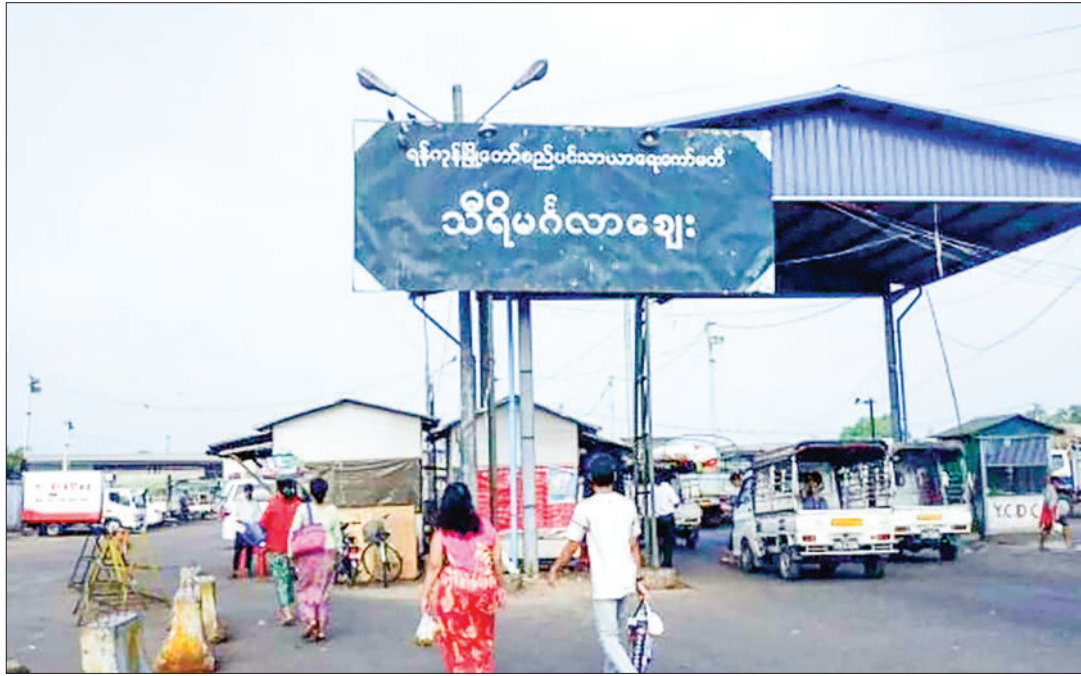
Thiri Mingala Mart in Hline Township, Yangon.