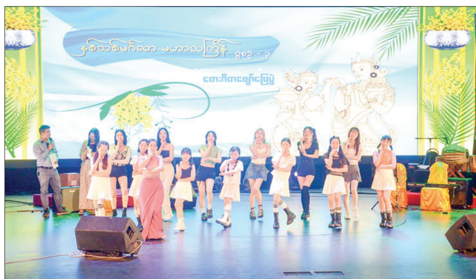
Photos depict the rehearsal for the Friday Night Live Show of Korean artistes in progress yesterday in Nay Pyi Taw.

THE first group of K-pop artistes participating in the Thingyan festival as part of a cultural exchange programme conducted a rehearsal for the festival's