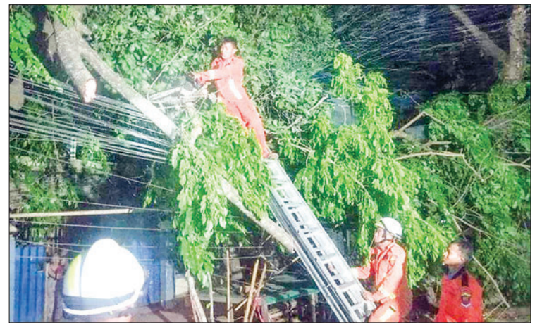
The photo shows clearing works being carried out after trees fell due to strong winds on Maha Bandoola road in Shwepyitha township on 10 April night.

Furthermore, eighteen houses were toppled by strong winds in various states and regions, including Sagaing, Taninthayi, Bago, Mandalay, Shan, and Nay Pyi Taw, resulting in partial destruction of 174 dwellings and affecting 721 individuals. — TWA/MKKS