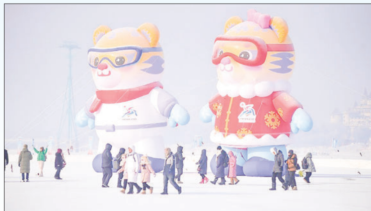
"Binbin" and "Nini", the adorable Siberian tiger mascots for the 9th Asian Winter Games in 2025, greet visitors at Harbin Songhua River Ice and Snow Carnival in northeast China's Heilongjiang Province, on 13 January 2024.

"We have selected environmentally friendly decoration materials such as paints and boards, all of which must pass environmental testing before use. Sports lighting fixtures and equipment will all be energy-efficient, low-consumption devices, and temporary buildings will adopt recyclable modular structures," said Qin Xulin, Director