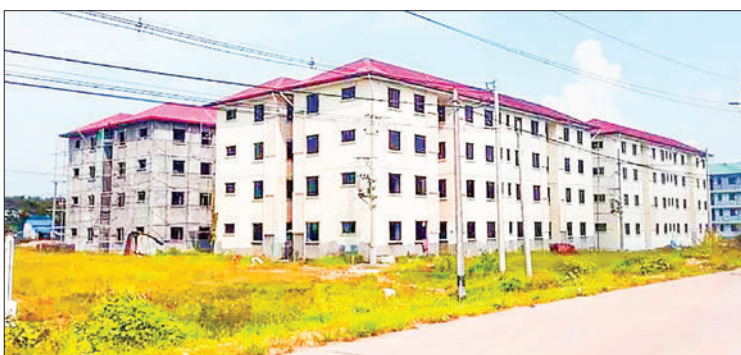
Aung Myint Mo housing units between Yoma Yeiktha and Aung Myint Mo street, Ward 144, Dagon Myothit (South), Yangon Region.

If there are any difficulties with the registration, people can contact the DUHD on 067 340 7527, 09 795 824 722, the CHID Bank on 01 837 0124, 01 837 0125, and call centre on 09 401 010 810 and 09 401 010 820 during office hours, it said. — MT/ZN