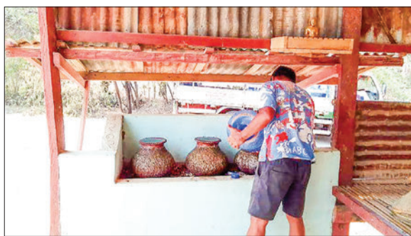
A member of the charity group is refilling the water pots at a roadside drinking water stand.

THE Yenangyoung-Magway-Chauk Road has public water stands that traditionally provide free drinking water pots (Yaychanzin). Now, the number of people consuming water has increased due to high temperatures. Hence, the water pots need to be refilled more frequently, according to the Yenantha Dingar Brothers Parahita group, a charity organization which takes charge of donating drinking water pots.