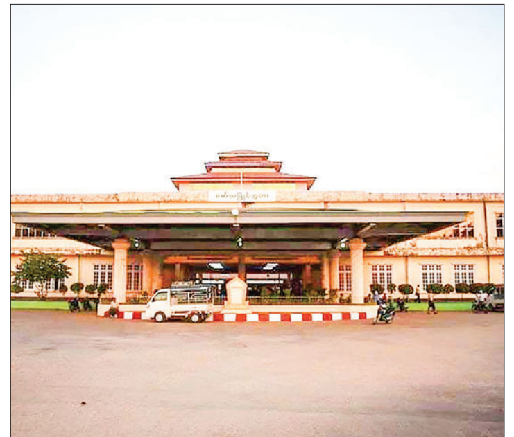
The front view of the Mawlamyine railway station.

Refunds for upper-class and ordinary-class tickets for 11 April will be given from 6 am to 10 am at the daily ticket counter at Mawlamyine Railway Station.