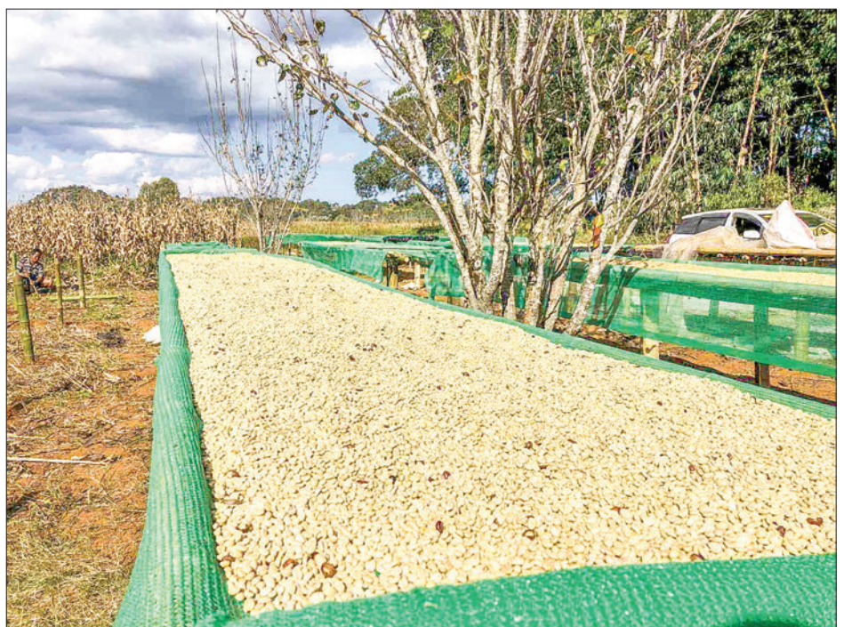
A stretch of freshly harvested coffee beans, representing Myanmar's agricultural export industry.

Myanmar has been implementing the National Export Strategy (NES) 2020-2025 in order to boost exports. The priority sectors of the NES include agricultural production, garment and apparel, industrial and electronic device, fishery business, forest product, digital manufacturing and service, logistic service, quality management, trade information service, innovation and entrepreneurship sectors. — NN/KK