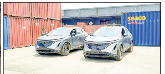
Officials inspect newly arrived battery electric vehicles at Yangon Port yesterday.

WITH the approval of the National Electric Vehicle and Related Industries Development Steering Committee, HongQ and EQM5 electric vehicles of China imported by UV Au-