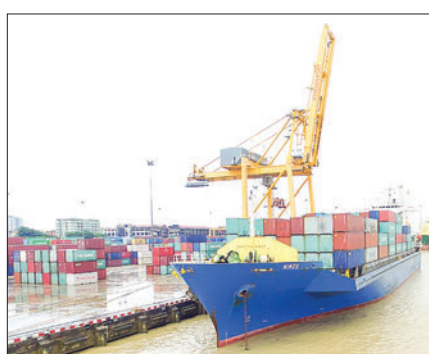
Shipment containers that carry export products are seen at the port.

of over US$14.6 billion was earned from exporting products from agri-