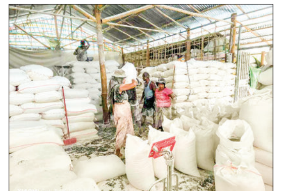
Bags of tapioca powder are well organized at the warehouse.

China and India are the biggest buyers of tapioca powder, and Myanmar lies between the