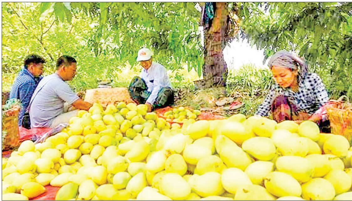
Fruit traders and a worker are seen sorting freshly harvested mangoes.

At present, extreme weather and transportation on rough