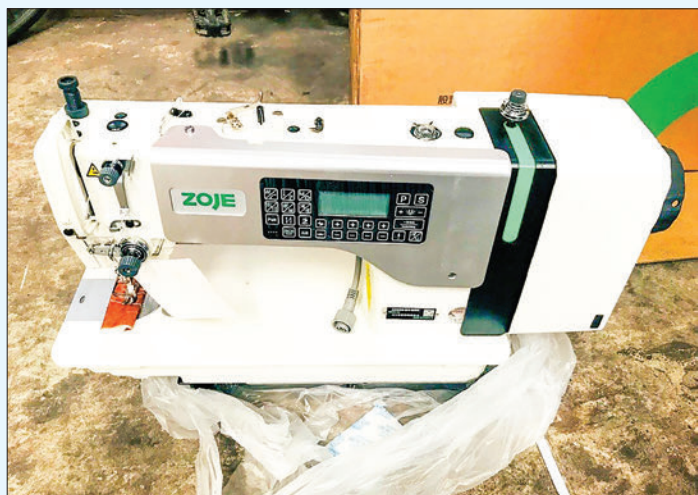
Seized illegally imported ZOJE sewing machine at Myanmar Industrial Port.

The Illegal Trade Eradication Steering Committee reported 20 arrests over three consecutive days, from 8 to 10 April, with an estimated value of K847 million. — MNA/MKKS