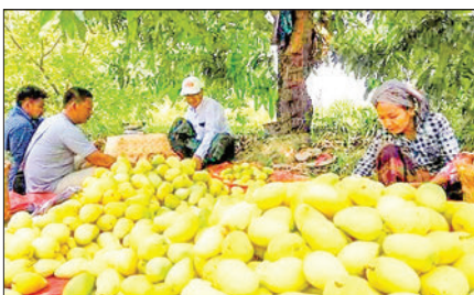
Discussions underway for Myanmar's mango export to China