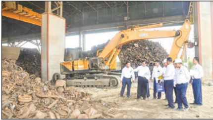
Engineers collaborate to overcome challenges at No 1 Steel Mill (Myingyan)