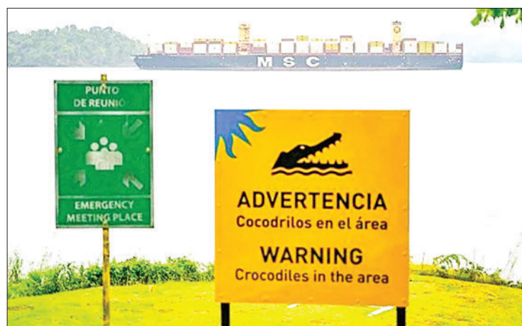
A cargo ship passes through the Panama Canal.

A decree simplifying procedures for transporting cargo by land across the isthmus has already been declared by President Laurentino Cortizo.