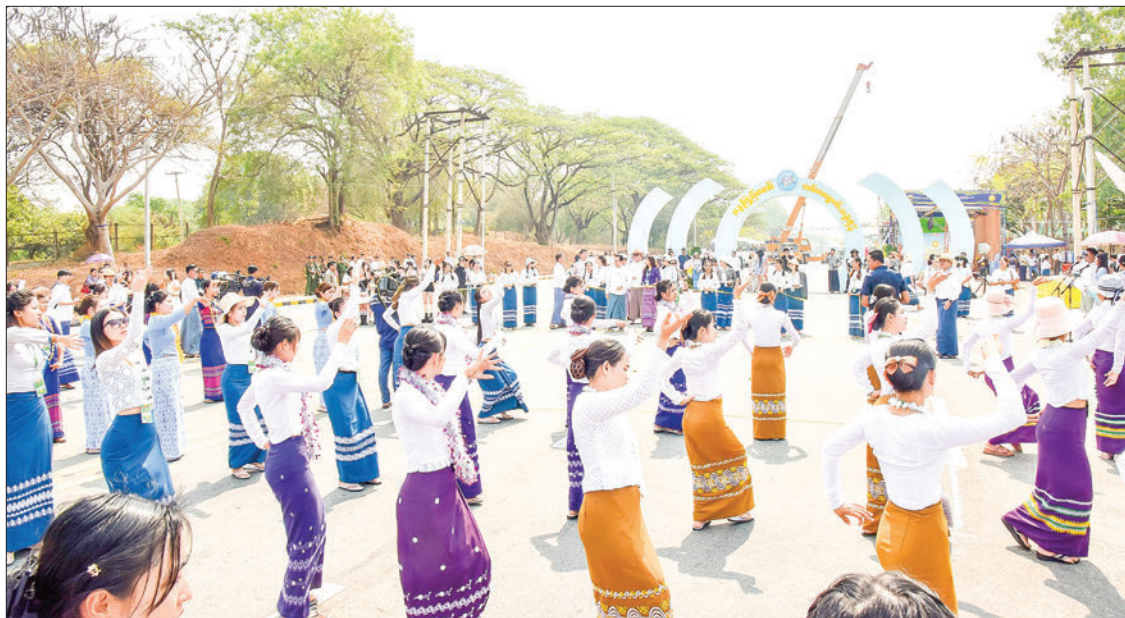
The rehearsal of Myanmar's traditional Yein (coral dance) in action – one of the programmes prepared for the Nay Pyi Taw Walking Thingyan.