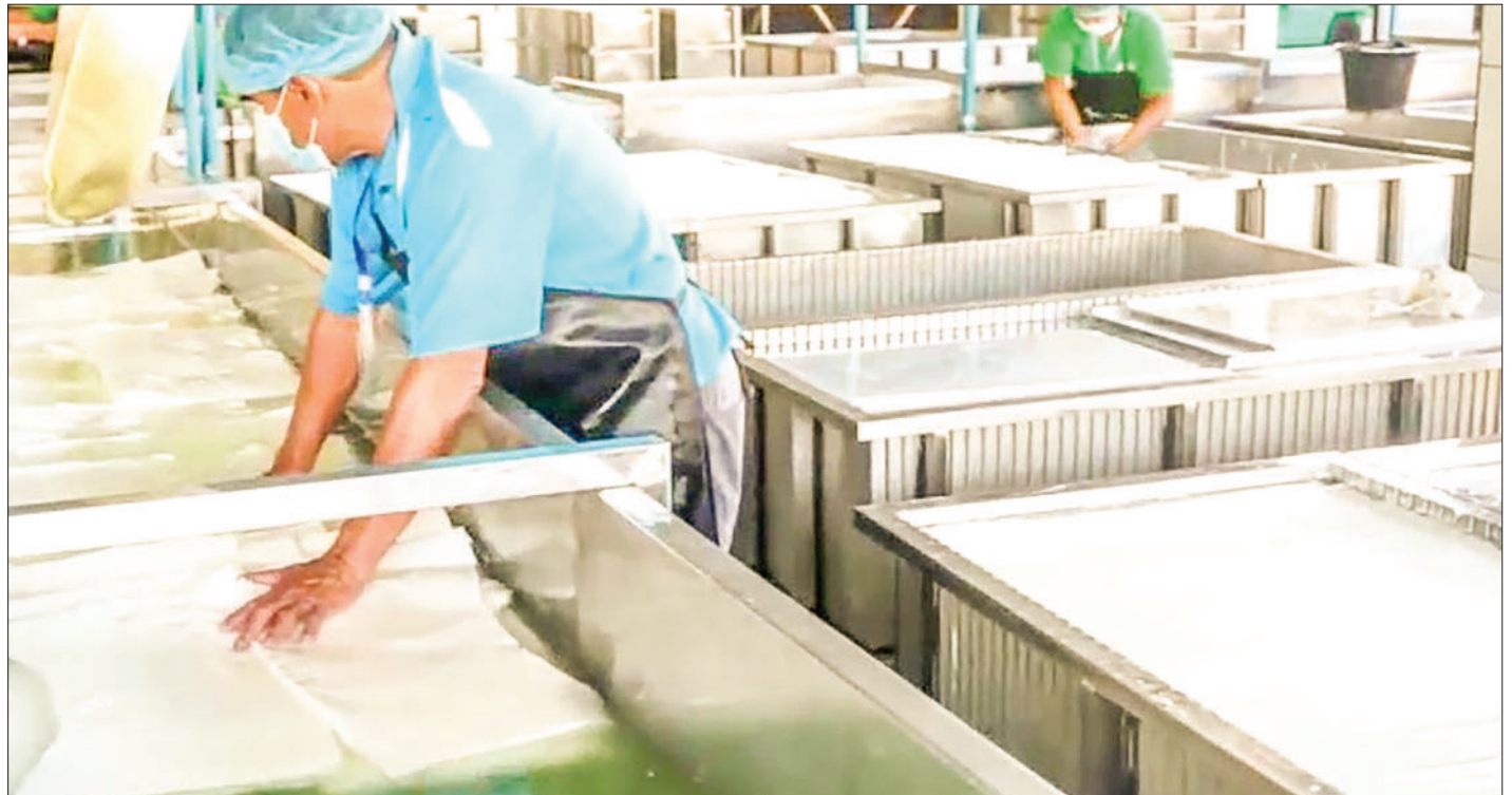
A worker is captured on the rubber processing line, one of Myanmar's key export commodities.