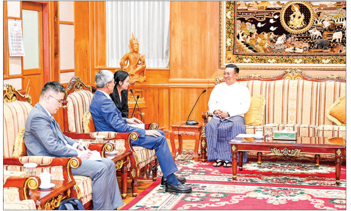
The Chinese Ambassador calls on Union Minister Admiral Moe Aung yesterday.

Also present at the meeting were officials of the SAC Office and the Chinese Embassy in Myanmar. — MNA/TTA