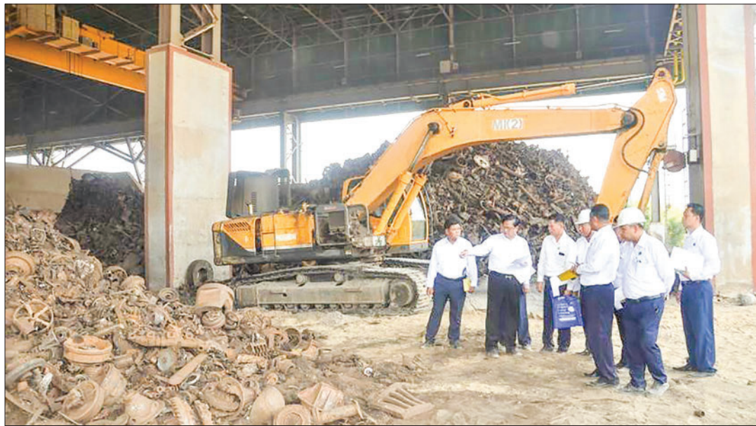
Union Minister Dr Charlie Than inspects the No 1 Steel Mill (Myingyan) yesterday.

ALL staff and engineers have to strive to operate the steel mill producing iron and steel wares, not to halt production, said Union Minister for Industry Dr Charlie Than on his inspection tour of all sections at No 1 Steel Mill (Myingyan) yesterday morning.