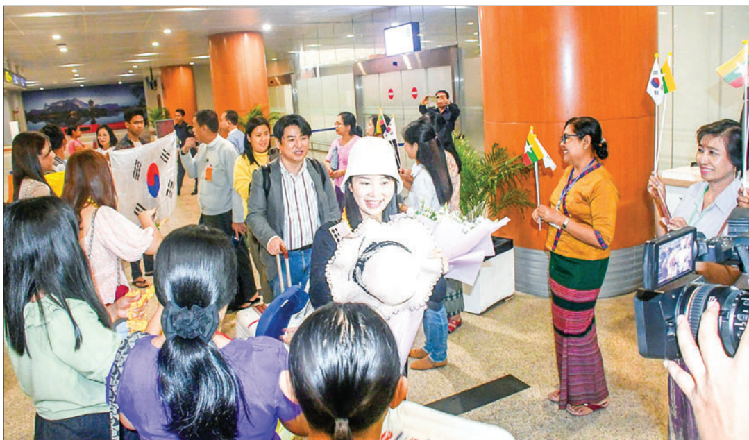
Korean artistes seen being warmly welcomed on their arrival at the Yangon International Airport yesterday.

REPORTS indicate that the second contingent of Korean artistes, slated to participate in the Nay Pyi Taw Walking Thingyan event, arrived in Yangon yesterday evening. Their visit aims to foster cultural exchange and feature performances at the traditional Myanmar Thingyan Festival.