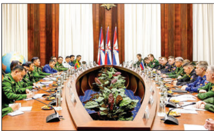
Myanmar attends 2 nd meeting of Myanmar-Russia Joint Anti-Terrorism Committee