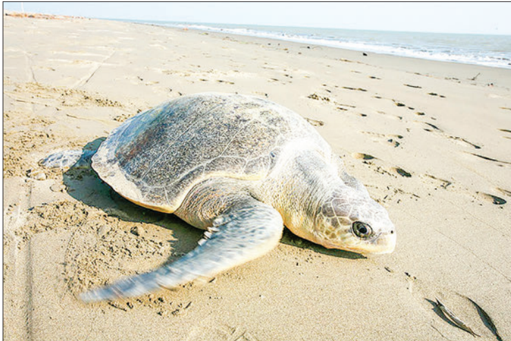
The Thameehla Island, where sea turtle species come to lay their eggs every month, regardless of the season.