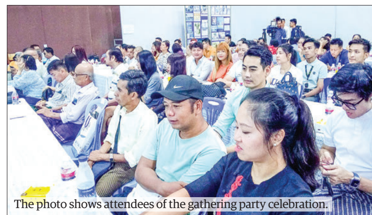
The photo shows attendees of the gathering party celebration.