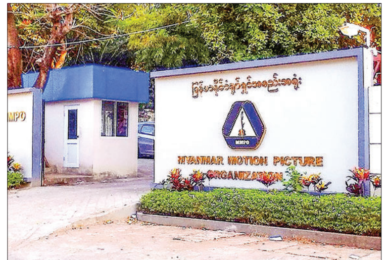
The general view of the MMPO office in Bahan township, Yangon.

Before COVID-19, film shooting permissions were granted if the application included approval of the script. — ASH/TRKM