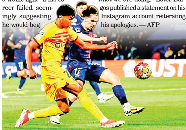
Barcelona forward Lamine Yamal (L) has burst into the limelight this season with dynamic performances on the right wing.