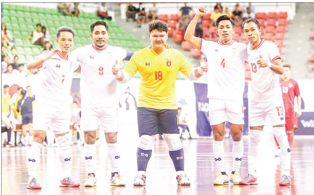
Players of the Myanmar national futsal team celebrate victory in a warm-up match.