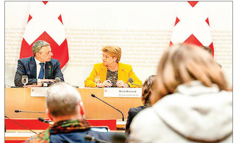
Swiss President and Foreign Minister Ignazio Cassis announced plans for Switzerland to host a high-level international conference in June, inviting over 100 countries to collaborate on forging a path to peace in Ukraine following more than two years of conflict.

Emphasizing Switzerland's commitment to peace and humanitarian values, Cassis highlighted the nation's tradition of playing a pivotal role in such endeavours.