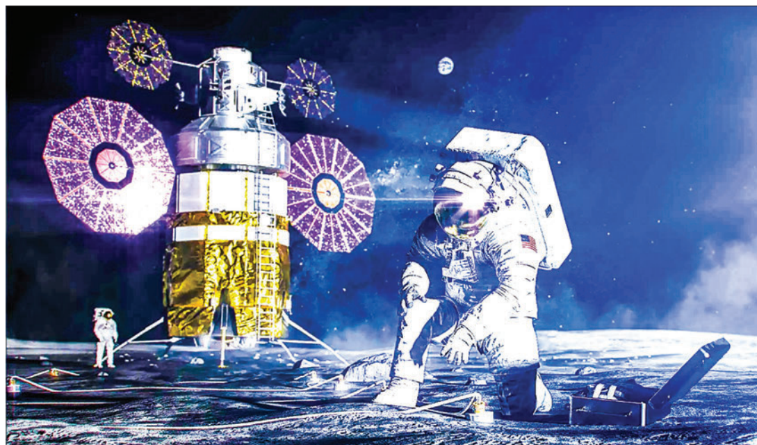
A rendering of the new space suit that NASA is designing for the Artemis astronauts. The suit is called the xEMU, or Exploration Extravehicular Mobility Unit.