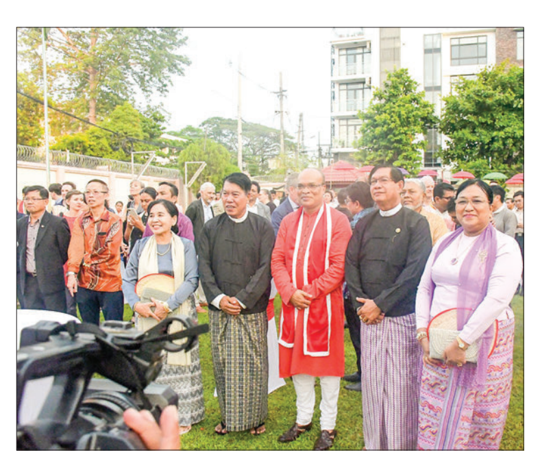
Bangladesh Embassy celebrates Bangladesh New Year Day event on 10 May at the Embassy of Bangladesh in Yangon, Myanmar.

THE Bangladesh New Year Day celebration took place on the evening of 10 May at the Embassy of Bangladesh in Yangon, Myanmar.