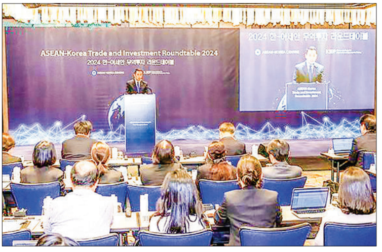
ASEAN-Korea Trade and Investment Roundtable 2024 in session.

The ASEAN-Korea Centre has convened the ASEAN-Korea Trade and Investment Roundtable jointly with the Korea Institute for International Economic Policy four times, including this year. — ASH/NT