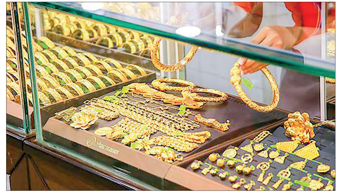
Jewellery and gold ornaments sold in the gold market.

The Gold and Currency Market Monitoring and Regulatory Working Committee, under the leadership of the Central Bank of Myanmar, has formed special joint forces and conducted on-site investigations at gold shops in Yangon Region