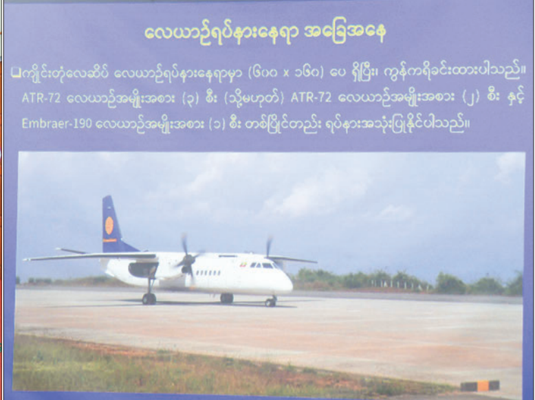
Chairman of the State Administration Council Prime Minister Senior General Min Aung Hlaing hears the report on progress of the Kengtung airport construction yesterday.