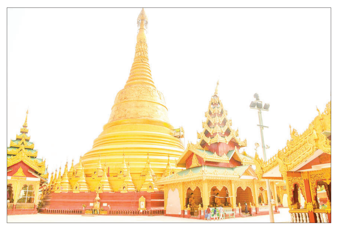
The Shwehsandaw Pagoda in Toungoo and the 445th Buddha Pujaniya festival.