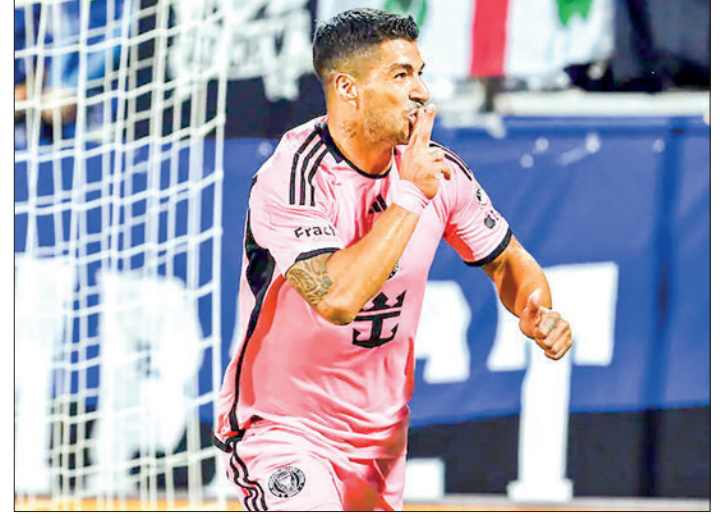
Luis Suarez in action.