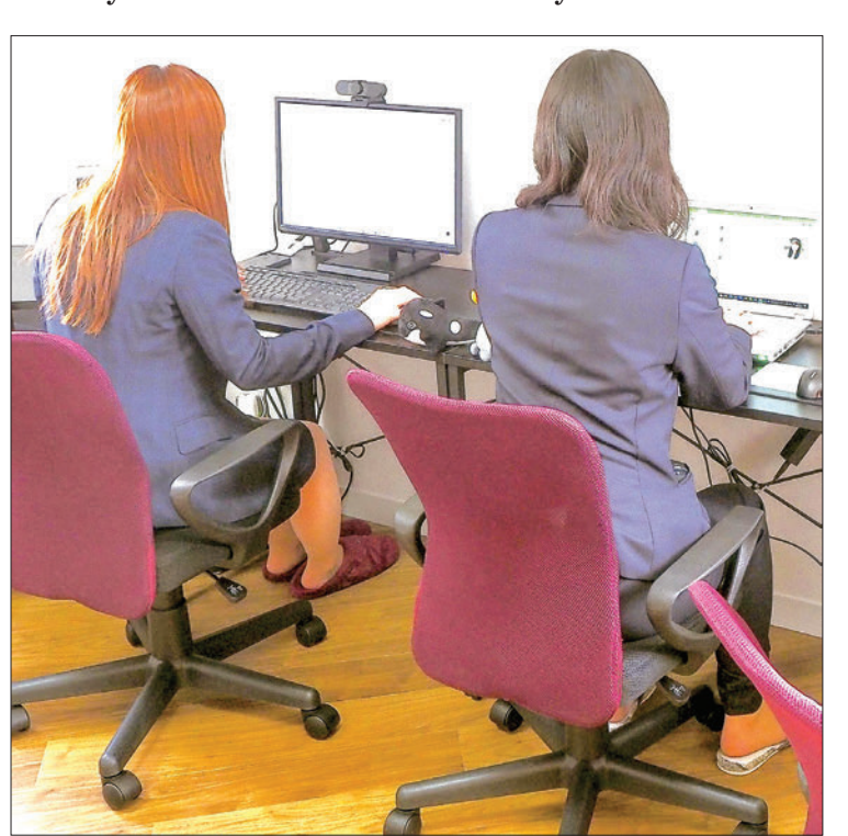
Staff at Albatross Co. in Tokyo handle cases from customers using the company's resignation proxy Momuri service to quit their jobs, in April 2024.

One graduate told Albatross their new employer had "made it seem at the hiring meeting like it was a company with a glamorous corporate culture, but in reality, the boss ran it like a dictatorship and employees were verbally abused." More quit after the person came forward, the firm said. — Kyodo