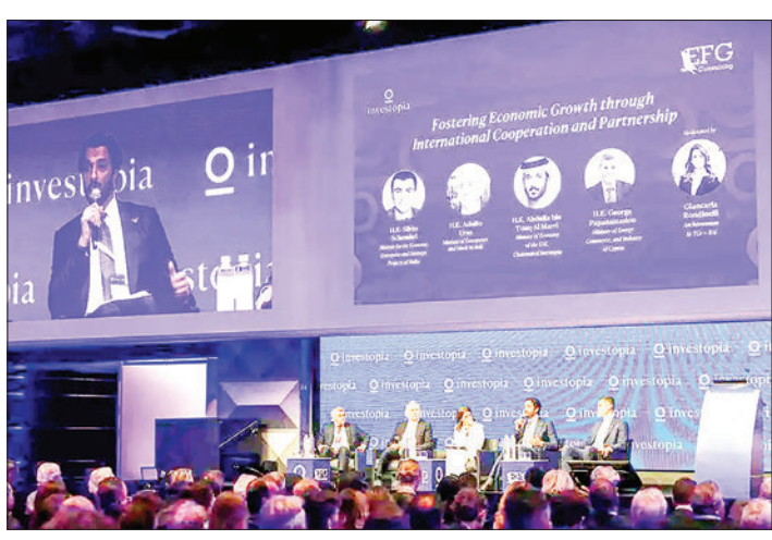
Investopia, a global ecosystem initiated by the UAE Government, launched the second edition of Investopia Europe at Palazzo Mezzanotte, the historic headquarters of the Italian Stock Exchange in Milan.

This event also aimed to explore the latest global trends in expanding business operations into new markets to attract investments and modern financing trends in European markets, with a focus on new and sustainable economic sectors