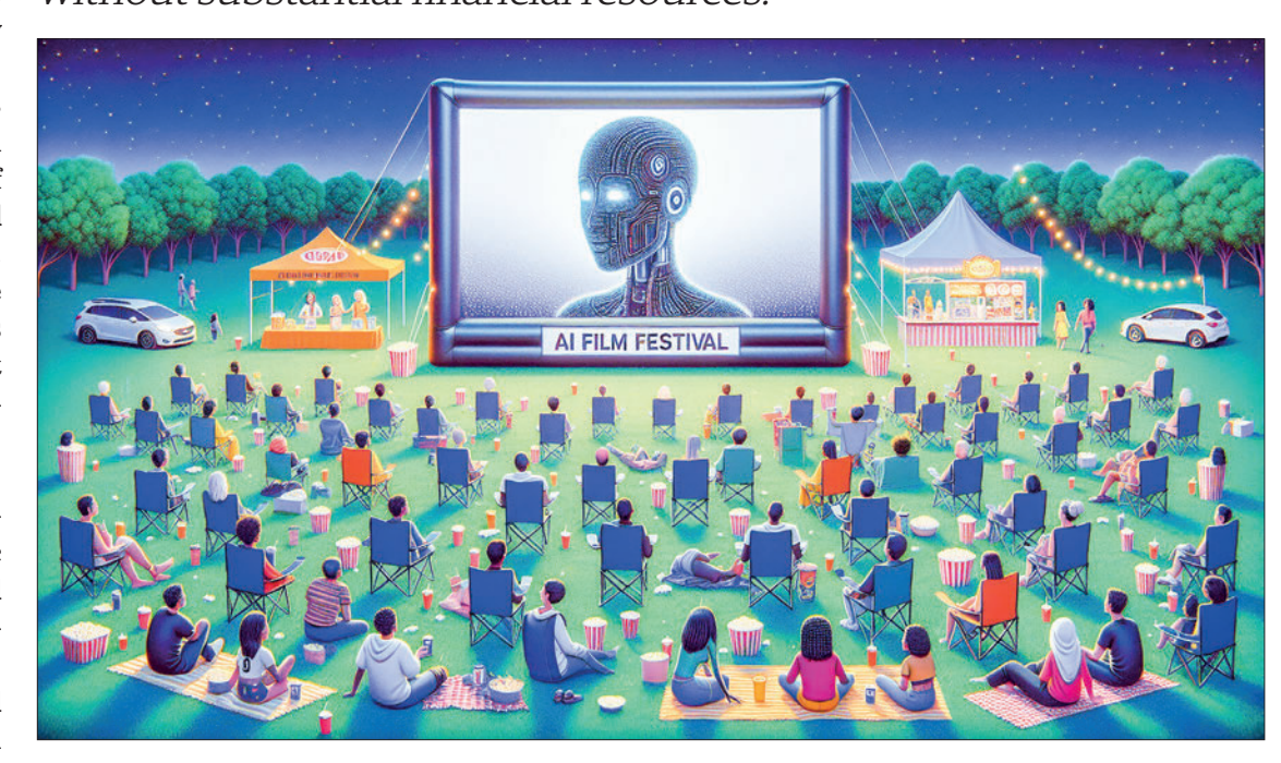
ILLUSTRATION: PIX FOR VISUAL PURPOSE/ AI-GENERATED IMAGE/ TECHXPLORE

AI filmmaking has the potential to revolutionize the industry, enabling independent filmmakers to produce compelling stories without substantial financial resources.