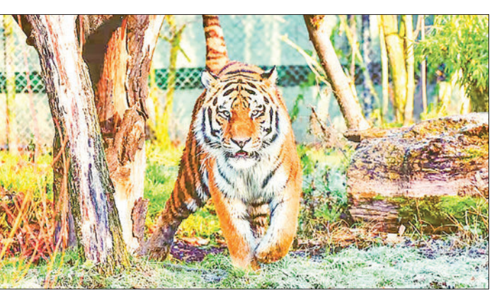
India celebrated 50 years of Project Tiger and 30 years of Project Elephant, demonstrating its commitment to species conservation.

forest management, which led to a consistent increase in forest cover over the past fifteen years. Globally, India ranks third in the net gain, in average annual forest area, between 2010 and 2020.