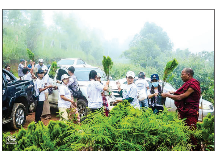
Green Challenge Association grew trees in 2023.

It is necessary to get food product codes for product expansion. Awareness campaigns for the Food Product Notification system will be conducted, and afterwards, mandatory labelling orders for on-the-go food will be exercised. — TWA/KK