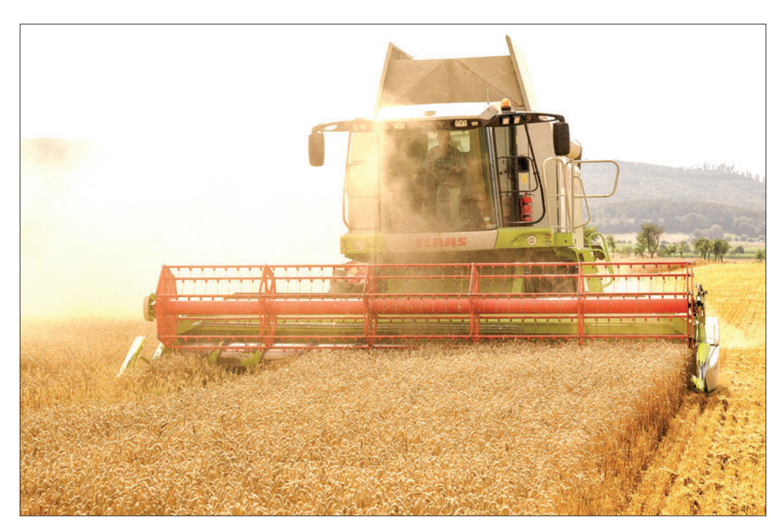
Israel's Minister of Agriculture, Avi Dichter, signed a memorandum of understanding with Romanian officials in Bucharest to bolster Israeli food security by securing emergency wheat supplies.