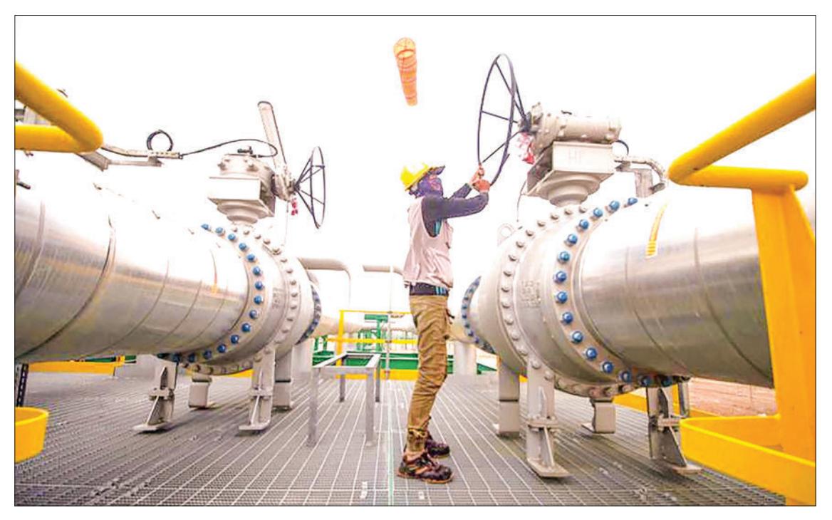
Untapped potential: An employee turns a valve at the Hammar Mushrif station inside the Zubair oil and gas field, north of Basra.

Iraq currently holds 145 billion barrels of proven oil reserves, among the largest globally, with 96 years' worth of production at the current rate.