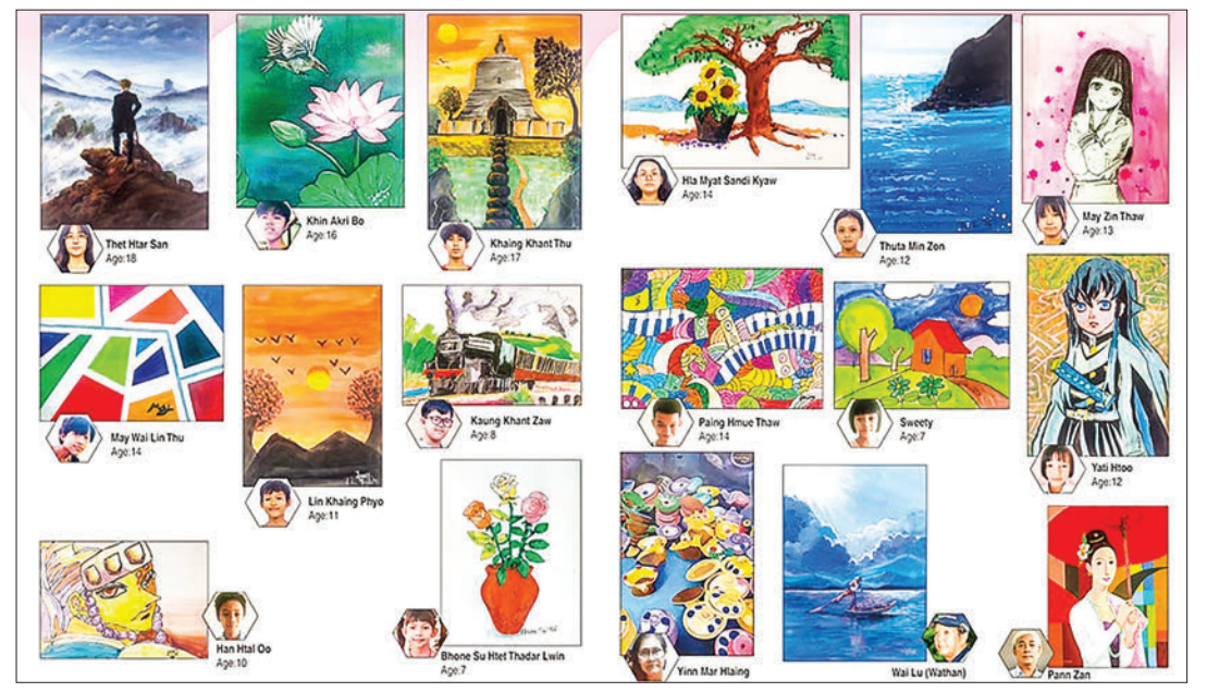
Some paintings which will be displayed at the gallery seen in the catalogue.

"We will show the paintings of the twenty children who attended the drawing class in March and the three coach artists. At the exhibition, the audience will also have to enjoy the painting of our six-year-old youngest artist".