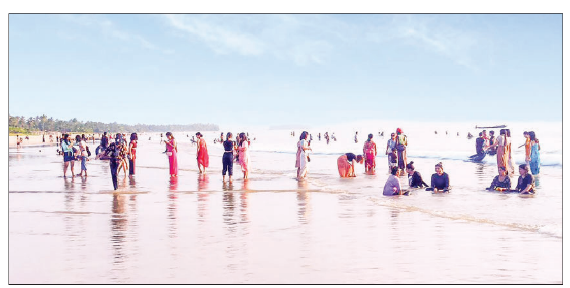
The photo shows Ngwehsaung Beach with travellers.