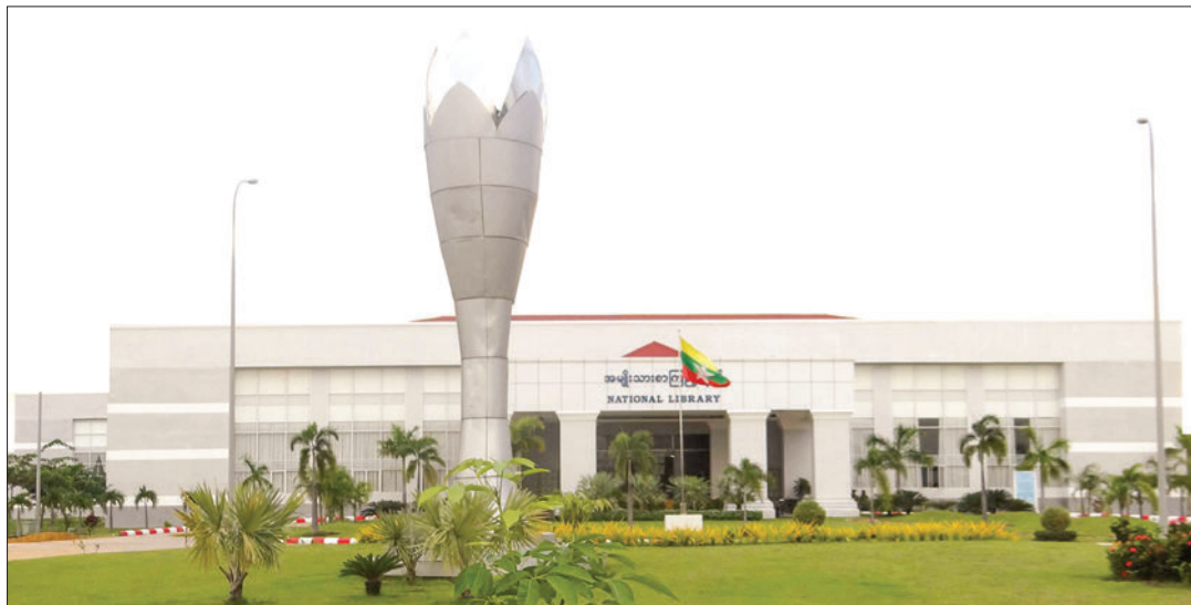
The photo showcases the National Library of Myanmar in Nay Pyi Taw.