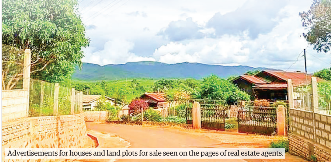
Advertisements for houses and land plots for sale seen on the pages of real estate agents.

MANY people in Mandalay have been more interested in buying real estate in PyinOoLwin, which has cold and fair weather, according to the real estate agents.