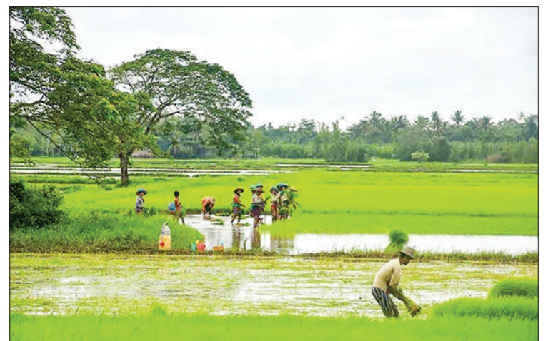
The photo shows the summer paddy field in Mandalay Region.

The objective is to assist cooperative society members in increasing crop yields and earning higher profits through collaboration. The loan carries an interest rate of one kyat per month, with both interest and principal repayment required after six months. — TWA/MKKS