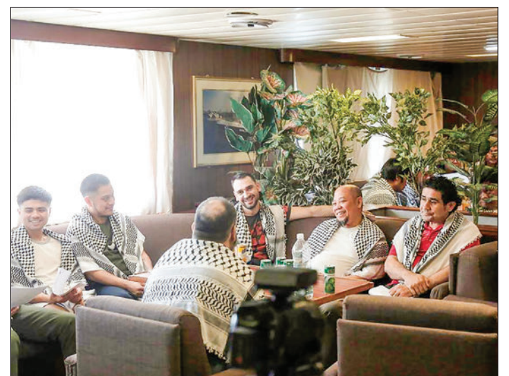
This photo taken on 12 May 2024 shows crew members of the Galaxy Leader on the ship near the port city of Hodeidah in western Yemen.