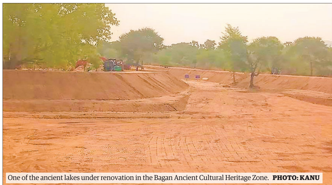
One of the ancient lakes under renovation in the Bagan Ancient Cultural Heritage Zone.

The Ministry of Agriculture, Livestock and Irrigation keeps