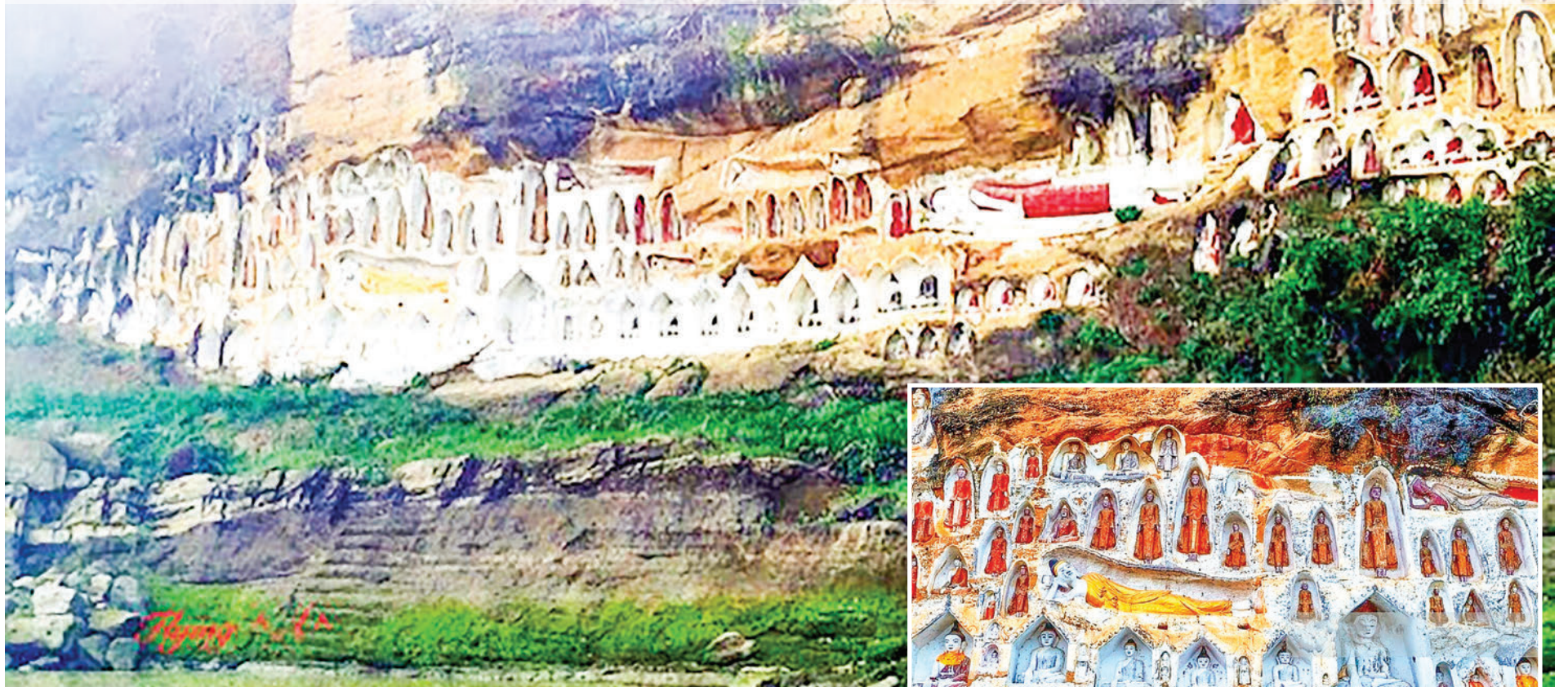
The Buddha images carved into the wall are visible from the Ayeyawady River.

ing boats and ships. Over time, artisans carved the mountain walls, resulting in 370 Buddha images depicted in various positions: standing, sitting, and lying. Most of these Buddha images date back to the Konbaung era, with some originating from the Innwa era. — ASH/NT