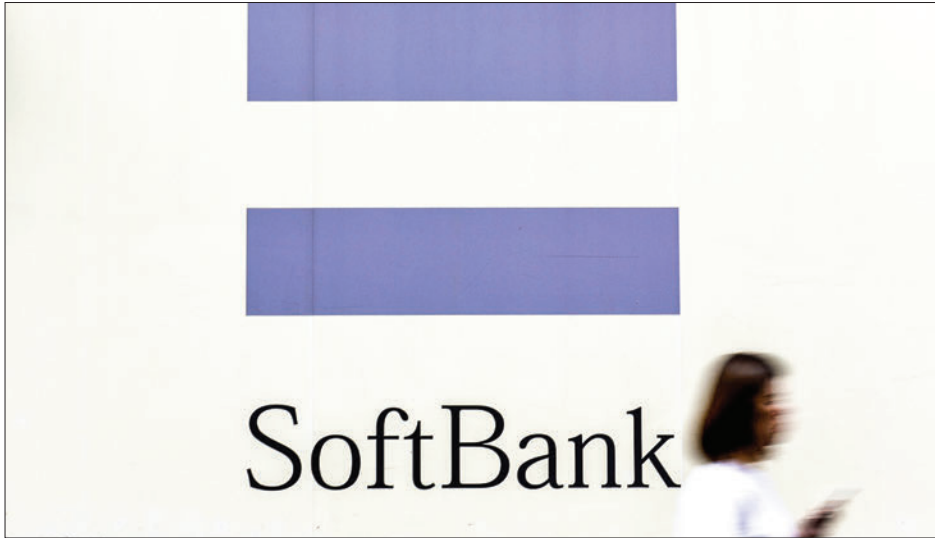
File photo taken May 2019 shows the logo of Softbank Group Corp in Tokyo.

SOFTBANK Group Corp said Monday it booked a net loss of 227.65 billion yen ($1.5 billion) for the year ended March, posting red ink for the third straight year due to investment losses. The net loss shrunk from the 970.14 billion yen