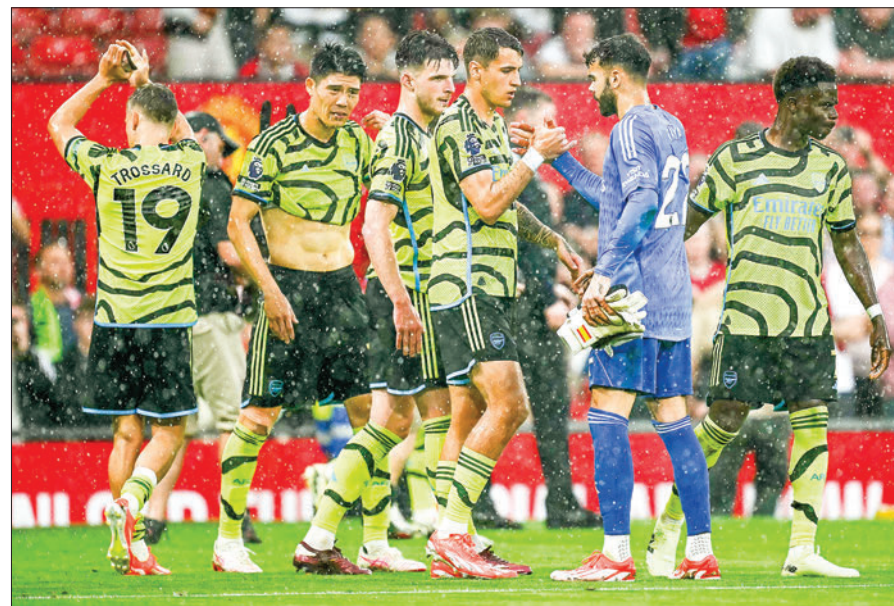
Arsenal reacts after the English Premier League football match between Manchester United and Arsenal at Old Trafford in Manchester, north west England, on 12 May 2024.

THE battle for the Premier League title will go to the last game of the season after Arsenal won 1-0 at Manchester United on Sunday afternoon.