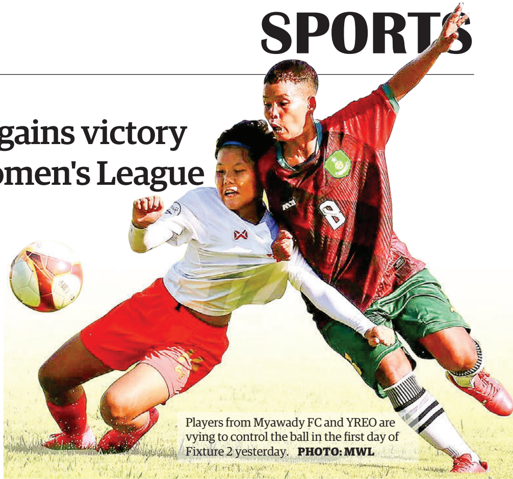
Players from Myawady FC and YREO are vying to control the ball in the first day of Fixture 2 yesterday.

Phyu Phyu Win shot two goals, and Yupa Khaing three goals for Myawady FC.