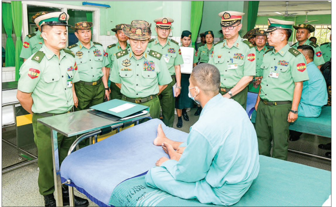
The Vice-Senior General is seen viewing and encouraging patients yesterday.

VICE-CHAIRMAN of the State Administration Council Deputy Commander-in-Chief of Defence Services Commander-in-Chief (Army) Vice-Senior General Soe Win comforted Tatmadaw members and families receiving medical