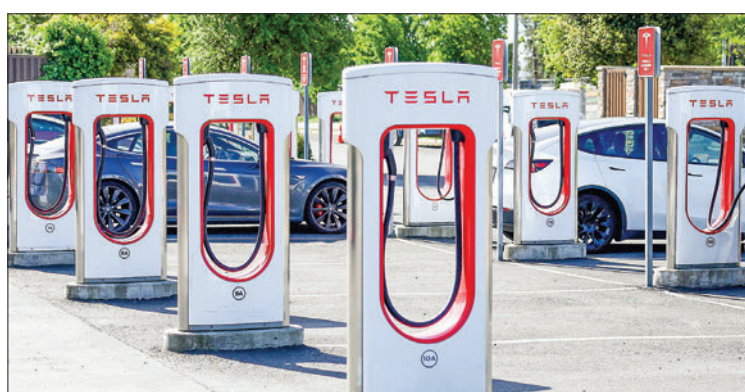
Tesla cars charge up at a Tesla Supercharger on 2 May 2024 in Petaluma, California. California Gov Gavin Newsom said over the weekend that Tesla's charging network will now be available to non-Tesla electric vehicles.

By the end of April, some 89,000 China-Europe freight train trips had been completed in total, serving 223 cities across 25 European countries, according to China Railway.— Xinhua