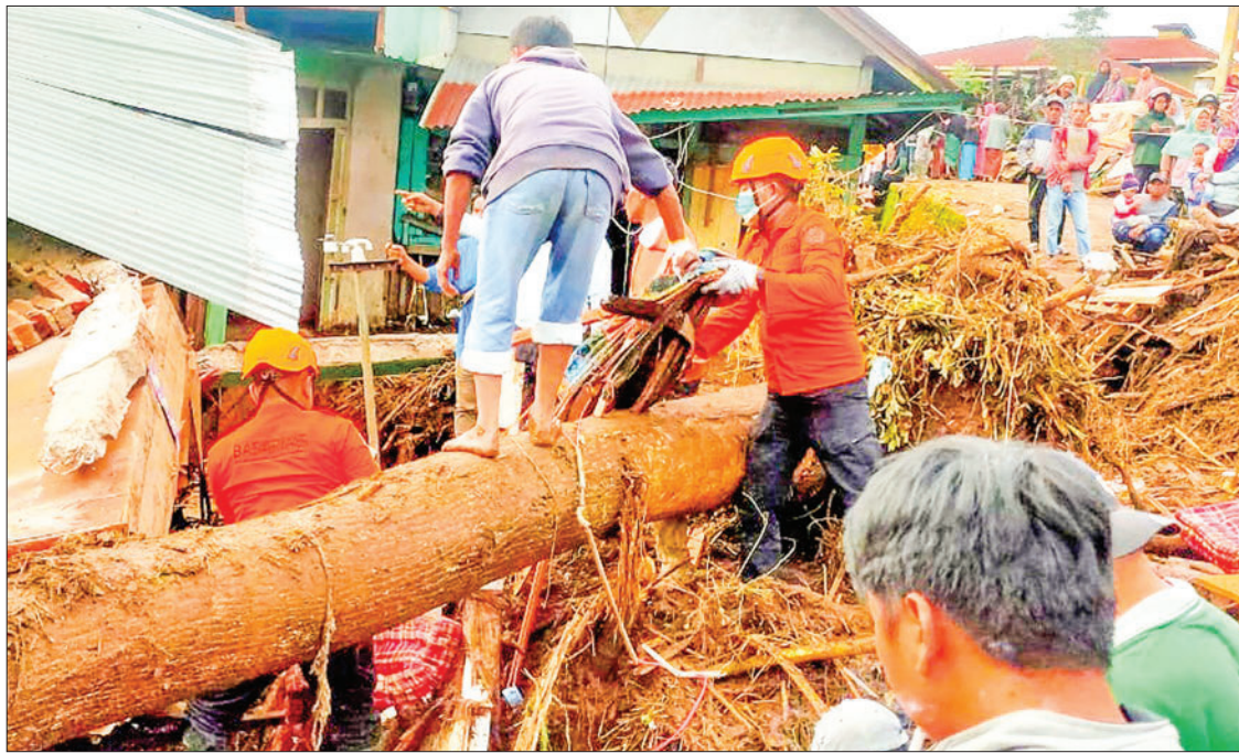
This handout image taken and released by Indonesia's National Search and Rescue Agency (BASARNAS) on 13 May 2024 shows personnel taking part in a search operation in Tanah Datar, West Sumatra.

Residents said they heard rocks thundering down roads outside their homes when the heavy rains struck.