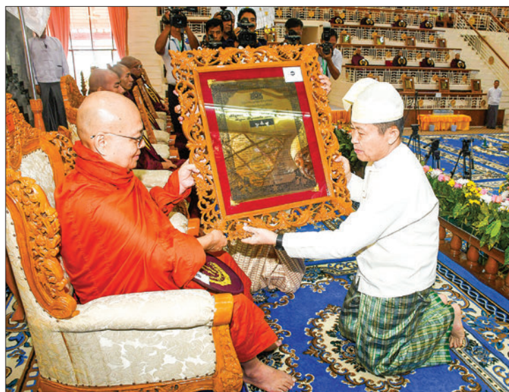
The Vice-Senior General offers the Tipitakadhara Tipitakakovida title at yesterday's event.