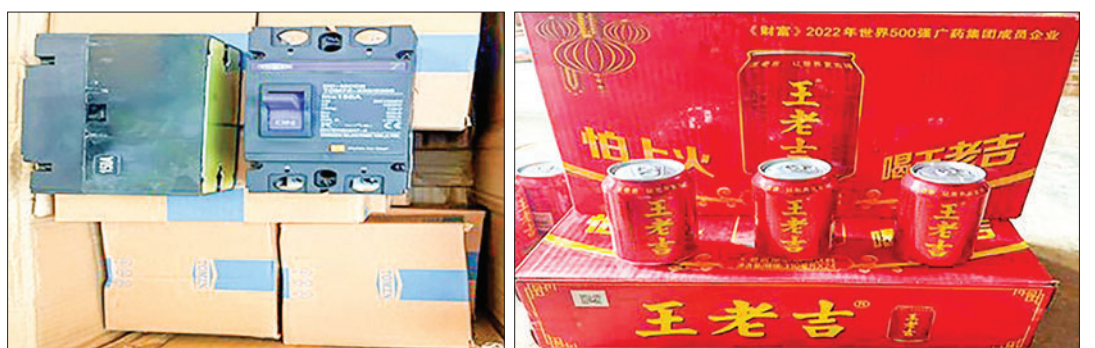
Confiscated illegal commodities from various states and regions.

The Illegal Trade Eradication Steering Committee reported 14 arrests made on 11 and 12 May, with an estimated value of K221 million. — MNA/MKKS