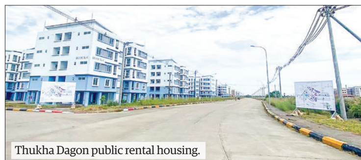
Thukha Dagon public rental housing.