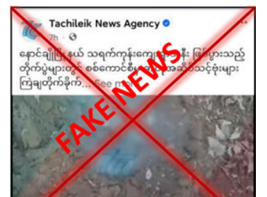
The screenshot validates misinformation.

They claim that these bombs resulted in symptoms of dizziness and nausea among terrorists. However, an official from the security forces has refuted these claims, stating that there was no use of chemical weapons. According to their statement, terrorists have falsely accused Tatmadaw of employing such tactics in conflicts where they faced significant losses. Reports from the recent