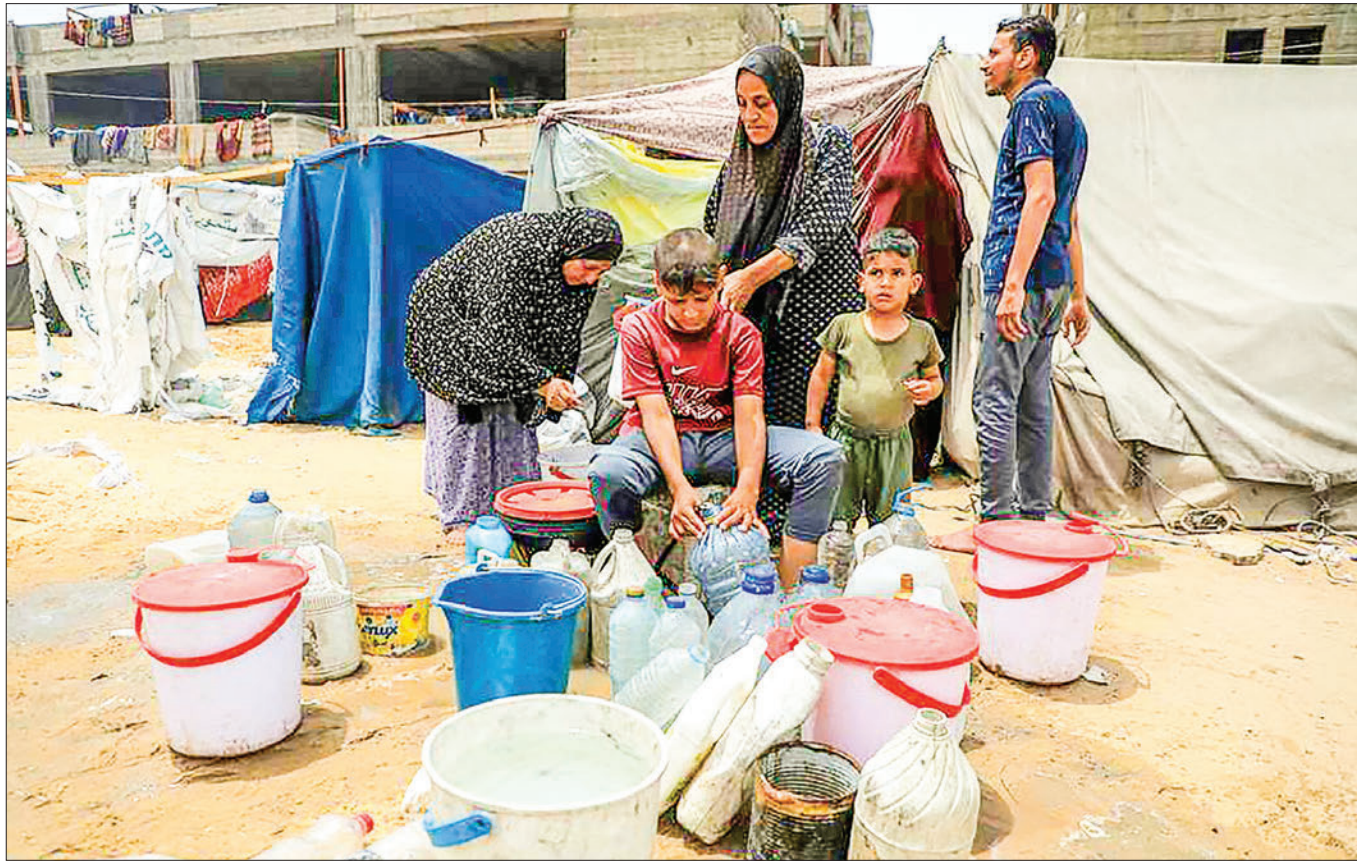
Palestinians are seen at a temporary camp in the southern Gaza Strip city of Rafah on 10 May 2024.