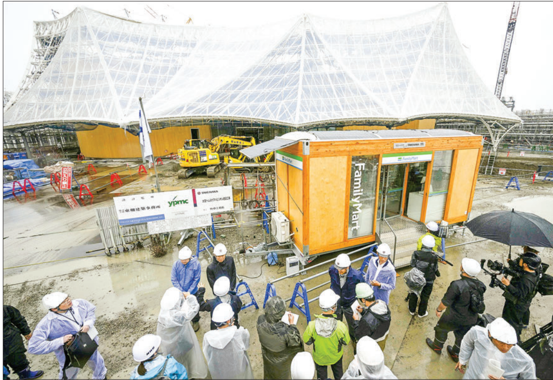
Photo taken on 13 May 2024, shows an unmanned, mobile convenience store operated by FamilyMart Co at a construction site at the venue for next year's 2025 World Exposition in Osaka.