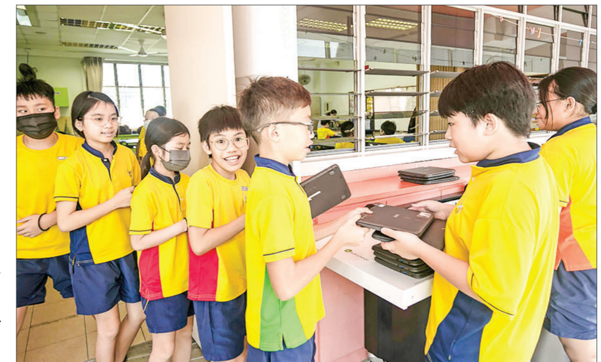
Students receive laptops for a mathematics lesson using artificial intelligence at Lakeside Primary School in Singapore on 9 November 2023.