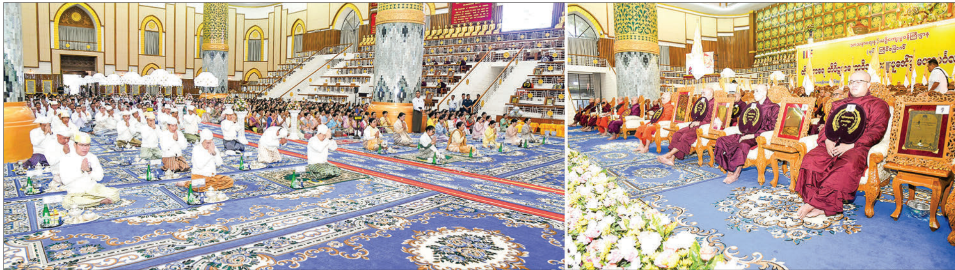
State Administration Council Vice-Chairman Deputy Prime Minister Vice-Senior General Soe Win, his wife and the congregation take Five Precepts from Members of the Sangha at yesterday's ceremony.

A ceremony to honour 112 members of the Sangha who passed the 76 th Tipitakadhara Tipitakakovida Selection Examination organized by the Religious Affairs Department of the Ministry of Religious Affairs and Culture took place in conjunction with the certificate offering ceremony at Maha Pasana Cave on Thiri Mingala Kaba Aye Hill in Yangon yesterday.