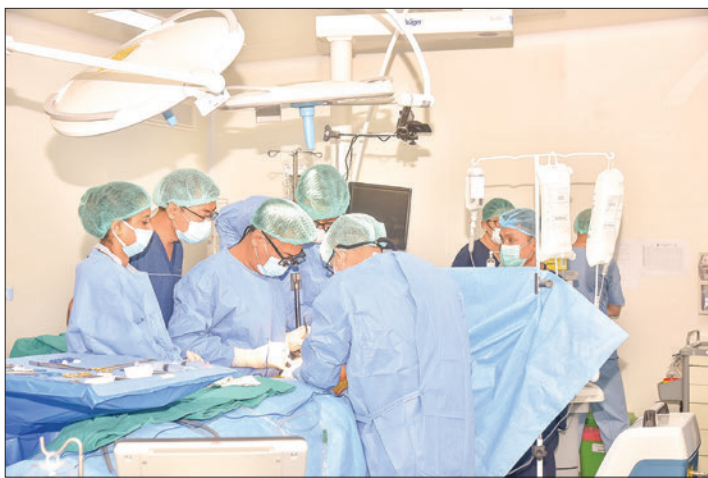
The sixth liver transplant surgery in operation yesterday.

The health conditions of the two liver donors and two liver recipients who underwent surgery in the preceding two days are also showing improvement. — MNA/TKO