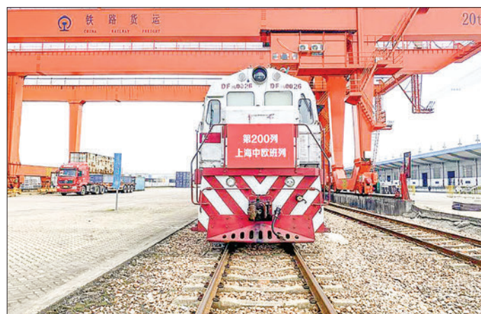
This photo taken on 19 April 2024 shows a China-Europe freight train departing from east China's Shanghai.

CHINA-EUROPE freight train services saw solid growth from January to April this year, with continuous improvements to the transport capacity, efficiency and ser-