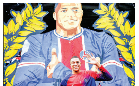
Paris Saint-Germain's French forward (7) Kylian Mbappe poses in front of a giant tifo before the French LI football match between Paris Saint-Germain (PSG) and Toulouse (TFC) on 12 May 2024 at the Parc des Princes stadium in Paris.

However, Thijs Dallinga quickly equalised for the visitors against a PSG side which showed 10 changes to the team knocked out of the Champions League by Borussia Dortmund in the semi-finals in midweek, with Mbappe the only player to keep his place. — AFP