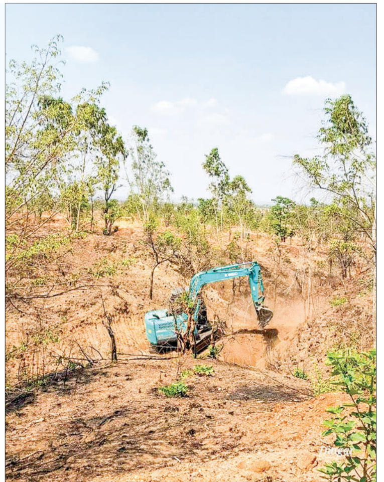
Parahita park located near Yenangyoung bypass where the man-made forest will be created.

In order to protect the man-made forest including shade trees such as rain trees, neem trees and Homalium longifolium from forest fire, arson attack and animals, gardeners including their families will be hired by providing financial support. — Thit Taw/ZS