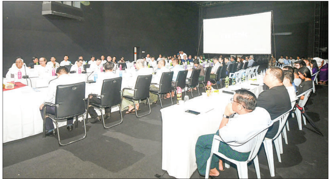
Union Minister U Maung Maung Ohn speaks on the meeting occasion with the film industry businesspeople yesterday in Yangon.

the COVID-19 period, and possible ways to cover the expenses of producers in making films.