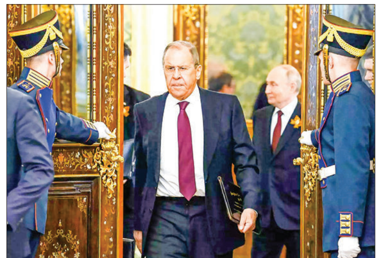
Russian Acting Foreign Minister Sergey Lavrov arrives to attend a meeting of Russian President Vladimir Putin with Cuban President Miguel Diaz-Canel at the Kremlin, in Moscow, Russia.