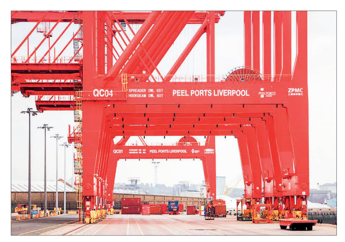
Photo taken on 26 April 2022 shows a view of the Port of Liverpool, in Liverpool, Britain.

BUSINESS leaders projected confidence in Britain-China trade prospects during a recent trade expo held here.