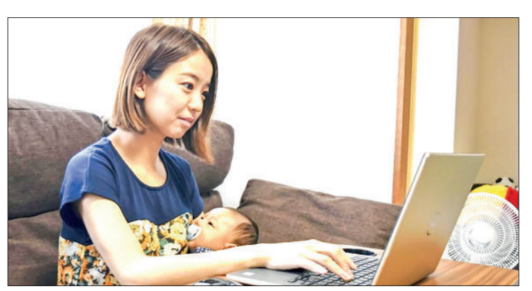
The survey indicated that the average frequency of teleworking remained unchanged at 2.3 days per week compared to the previous year.

After the government downgraded the legal status of COV-ID-19 in May last year, roughly aligning it with seasonal influenza, the change in teleworking patterns became notable. — ANI