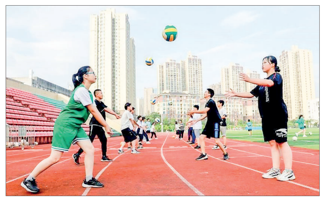
Students play volleyball during a physical class as a daycare service during summer vacation provided by Shuanghe No 2 High School in Huaying City, southwest China's Sichuan province, 22 July 2021.