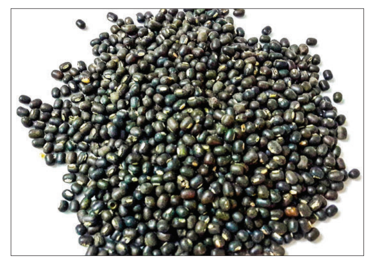
India has been partnering with Myanmar for the black gram trade for a long time.

INDIA, the leading buyer of Myanmar's black gram (urad), is possibly to bring in 50,000 tonnes of urad from Brazil, citing news reported by the Hindu Businessline.