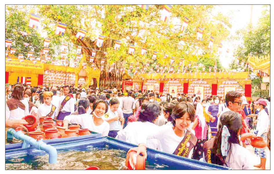
Devotees are seen pouring water onto the Maha Bodhi tree in the previous year.

THE 41<sup>st</sup> Kason Water Pouring Festival will be held at the Shwedagon Pagoda, as announced by the Shwedagon Pagoda Board of Trustees.