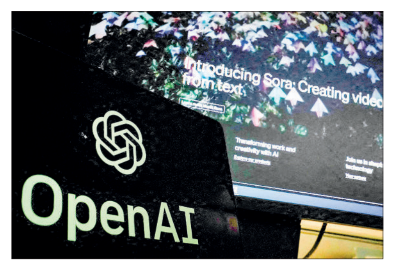
In this photo illustration, Open AI's newly released text-to-video "Sora" tool is advertised on their website on a monitor in Washington, DC, on 16 February 2024

"The new voice (and video) mode is the best computer interface I've ever used. It feels like AI from the movies," said OpenAI CEO Sam Altman in a blog post.