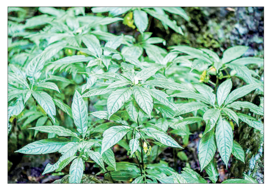
This photo taken on 7 October 2019 shows a new species of impatiens named Impatiens beipanjiangensis in Panzhou City, southwest China's Guizhou Province.

Of the 9,506 species sequenced for this study, over 3,400 were derived from material sourced from 163 herbaria in 48 countries, with additional material from plant collections around the world such as DNA banks, seeds, and living collections. SOURCE: Xinhua