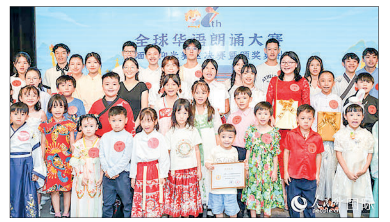
A glimpse of the Seventh Global Chinese Language Prose Reading Competition.

The Union minister, Myanmar Libraries Foundation Patron U Kyaw San and relevant officials received cash donations from the well-wishers. The Union minister and party observed the books and publications displayed at the event. — MNA/KTZH