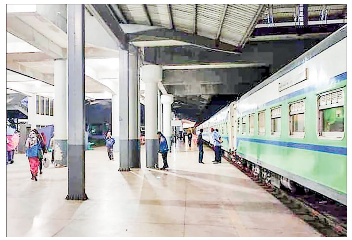
Photos showcase the Up and Down trains that run the Yangon-Mawlamyine-Yangon railway.