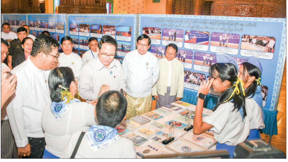
Developing libraries and raising reading habits campaign is launched yesterday, attended by Union Information Minister U Maung Maung Ohn.

Moreover, the State Administration Council organized the Myanmar Libraries Development Cooperation Committee, which aimed to improve read-