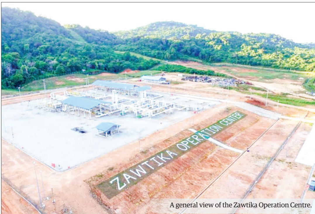
A general view of the Zawtika Operation Centre.

nearly 50 MW of electricity is generated at the Thilawa and Thakayta power plants using diesel engines at night in an effort to meet the power demand as much as possible. — TWA/TKO