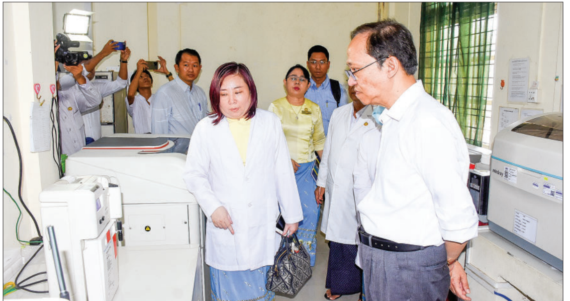
Union Minister for Health Dr Thet Khaing Win inspects medicines and hospital equipment at Thanlyin People's Hospital in Yangon Region, on 18 May.

In addition, the Union minister toured the emergency and outpatient departments, laboratory, x-ray room, operation theatre, intensive care unit, infirmary and specialist outpatient department of the Thanlyin Hospital. — MNA/TKO