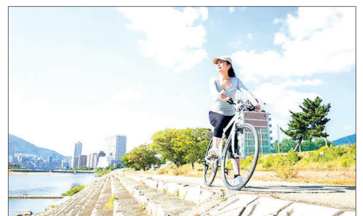
These changes aim to streamline enforcement for minor violations while still addressing serious infractions, ultimately enhancing road safety and reducing administrative burdens.

Before the change, cyclists were only able to be issued with red tickets for some 20 serious offenses, including riding while heavily intoxicated. The red tickets require investigations that can lead to criminal procedures, creating a burden for both police and the offender.—Kyodo