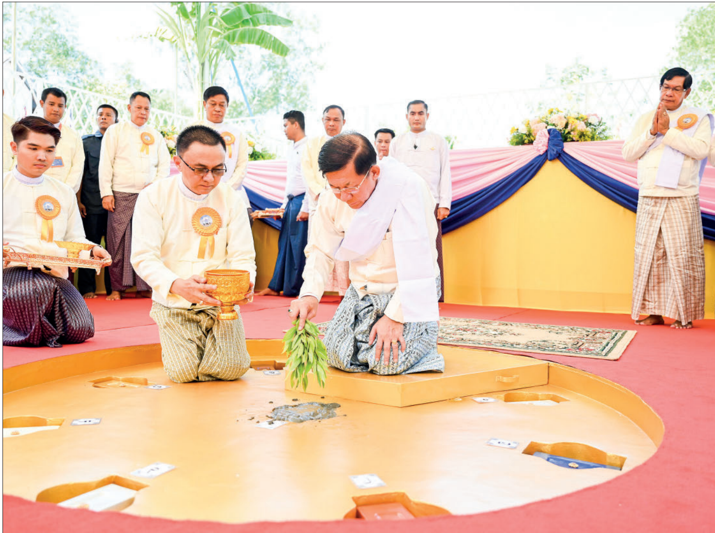
Chairman of the State Administration Council Prime Minister Senior General Min Aung Hlaing sprinkles scented water on a ruby brick during the ceremony to lay cornerstones for the construction of the convocation of the International Theravada Buddhist Missionary University in Yangon yesterday.