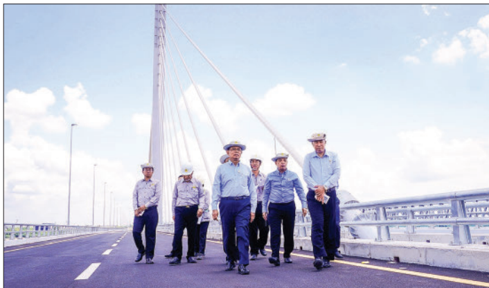
Officials seen inspecting the Thanlyin Bridge 3, connecting Thakayta and Thanlyin townships of Yangon Region.

Regarding the construction of the toll plaza and control building on the Thakayta side, the Union Minister suggested implementing QR code-assist-