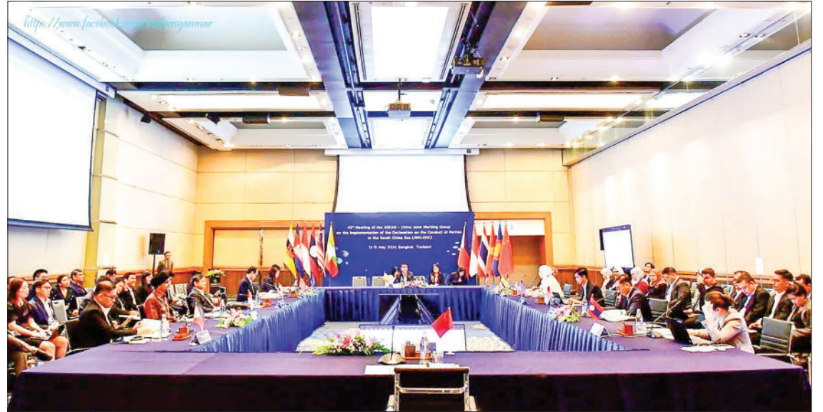
The 43 rd ASEAN-China Working Group meeting is held in Bangkok, Thailand, on 13-15 May.

The Meeting continued the negotiations on the Single Draft COC Negotiating Text (SDNT) and arranged preparation for the ASEAN-China foreign ministerial-level meeting. The Meeting expressed its appreciation and gratitude to Myanmar for its valuable and constructive contributions as the co-chair of the JWG-DOC and SOM-DOC meetings for the