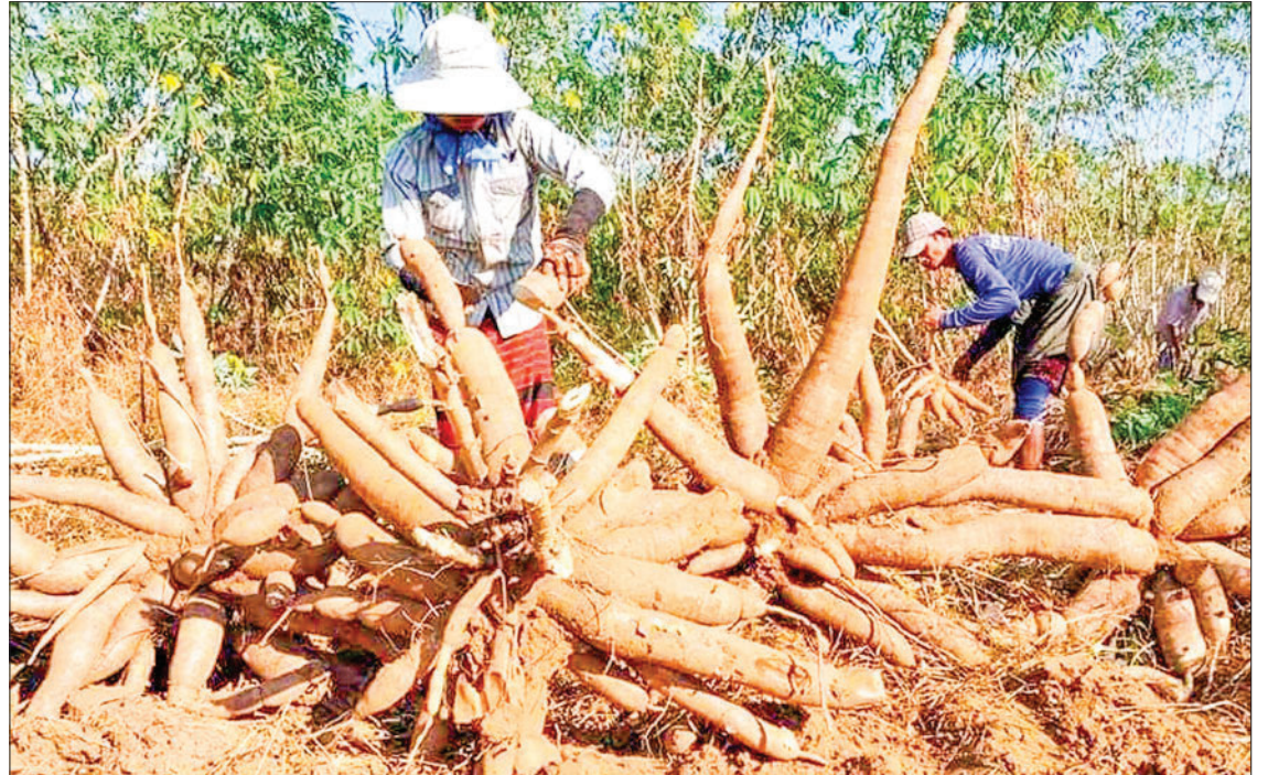
Farm workers harvesting cassava roots at a farm.

China and India account for 90 per cent of global demand for tapioca starch. Myanmar is strategically located