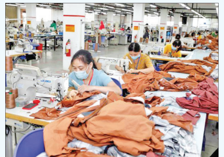
Myanmar employees seen working at a garment factory.

With the proper regulations in place, quality can be guaranteed for vacationers, while operators can be assured of a legal status for the new businesses they invest in.