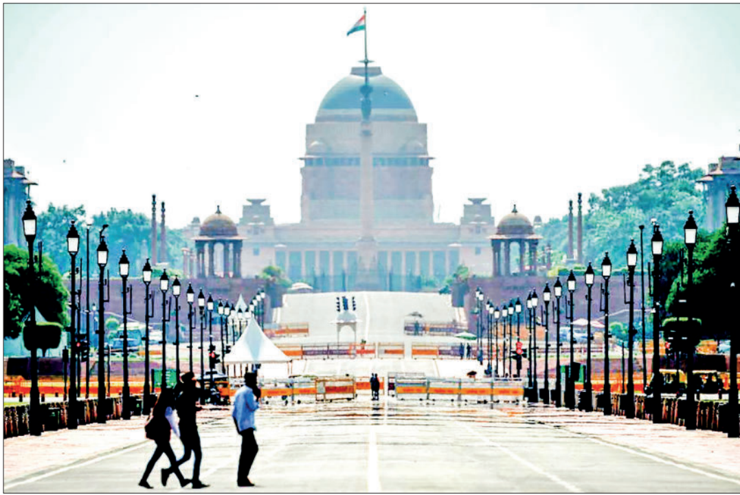
The Indian capital city recorded the season's hottest day on Friday with the mercury soaring to 47.4 degrees Celsius, confirmed the Indian Meteorological Department (IMD).

THE Indian capital city recorded the season's hottest day on Friday with the mercury soaring to 47.4 degrees Celsius, confirmed the Indian Meteorological Department (IMD).