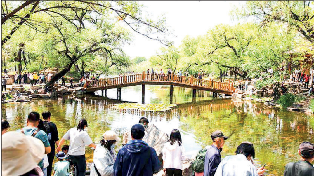
Tourists visit the Imperial Summer Resort in Chengde, north China's Hebei Province, 2 May 2024.

Xi acknowledged the distinct path China has charted in tourism development while noting the sector's new opportunities and challenges in the current era.