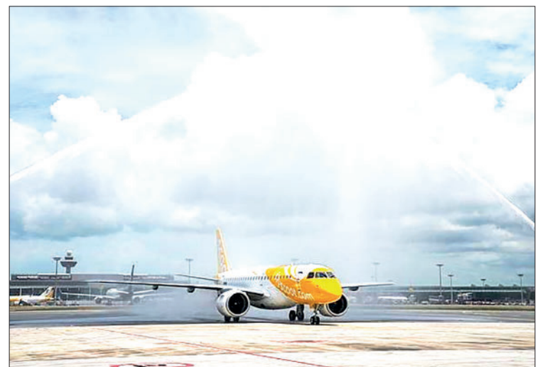
An Embraer E190-E2 passenger aircraft of Singapore's budget airline Scoot receives water cannon greetings at Singapore's Changi Airport in Singapore on 15 April 2024.

The SIA Group's passenger network covered 122 destinations by the end of April, and the cargo network comprised 126 destinations. — Xinhua