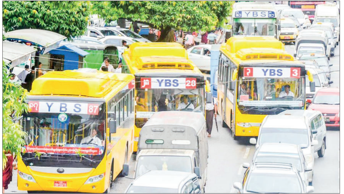
Some YBS buses are seen operating in downtown Yangon.

Pickpocketing mostly happens on buses without CCTV, while for cases on CCTV-installed YBS, pickpocket identification procedures have been started in cooperation with the Myanmar Police Force after being tracked by YRTC’s control