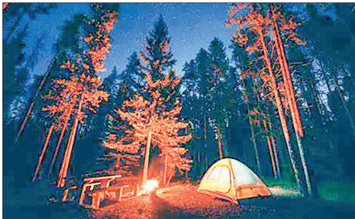
Some travellers are recreating at a campsite.

“It is good to have more new tours. It is also a sensible thing to develop in the tourism sector. The main point is that there are still no regulations. For example, licences are issued to hotels and guesthouses. Since these new tours don’t have a licence, we have been discussing this with the Ministry of Hotels and Tourism. If proper licences can be issued, it