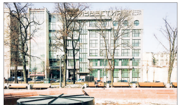
In Moscow stands the Izvestia Building, home to Izvestiya, a historically significant Russian daily newspaper.

RIA Novosti is Russia's leading news agency and