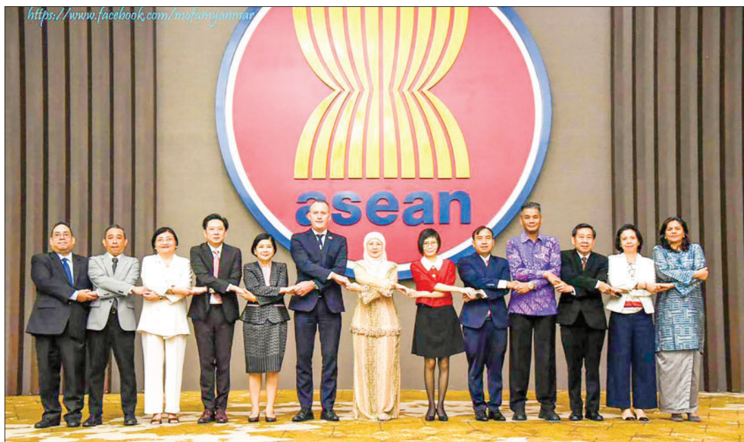
Attendees including Myanmar's Permanent Representative to ASEAN U Aung Myo Myint pose for the documentary group photo at the 12 th ASEAN-New Zealand Joint Cooperation Committee meeting.

MYANMAR'S Permanent Representative to ASEAN U Aung Myo Myint attended the 12 th ASEAN-New Zealand Joint Cooperation Committee meeting at the ASEAN Secretariat on 15 May, according to the Ministry of Foreign Affairs.