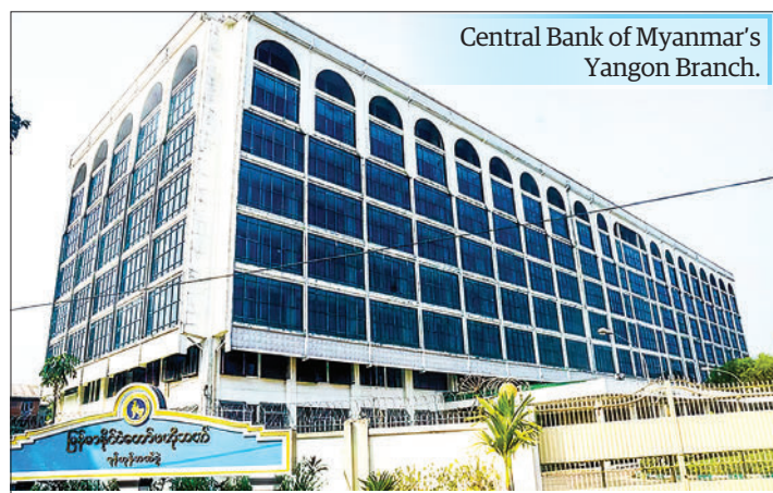
Central Bank of Myanmar's Yangon Branch.

CBM injected $3 million, two million yuan and 54 million baht into the financial market in April. It also sold $18 million, 12 million yuan and 312 million baht in March, $77.38 million and 850 million baht in February and $68.33 million, 313.5 million baht and 4.2 million yuan in January 2024, with a view to curbing the instability in the foreign exchange market and stopping the currency devaluation.