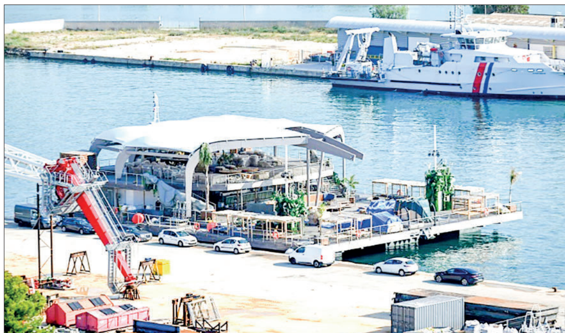
Canua Island, a private floating beach denounced as 'an ecological aberration' by its opponents, has been unveiled off the French Riviera.