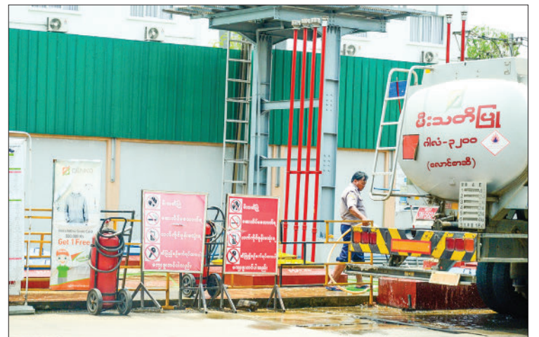
A fuel oil bowser is pictured filling fuel at one petrol outlet in Yangon.

If they can provide complete and verified documents, the supervision ticket fee is only K20,000. The ticket processing time is only two working days. Individuals can also complain to the department through contact numbers 067 3411282 and 067 3411129 for any inconvenience. — NN/EM