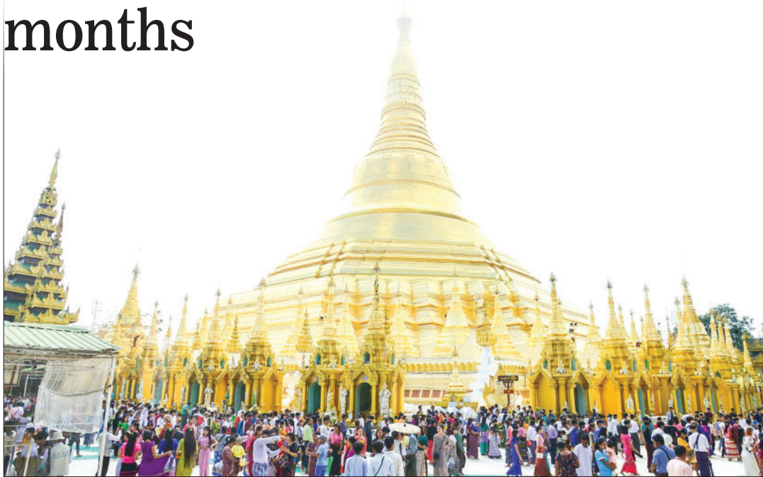
The photo shows pilgrims who visit the Shwedagon Pagoda.

ACCORDING to official figures, a total of 26,067 foreigners visited the Shwedagon Pagoda, with 6,830 in January, 7,474 in February, 7,206 in March, and 4,557 in April.