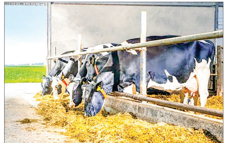
The photo depicts dairy cows at the breeding farm.

In the financial year 2023-2024, the State economic promotion fund lent K20 billion to breeders of three types of animals: broilers, duck, and pig from 11 states and regions, including Nay Pyi Taw. — TWA/KZL