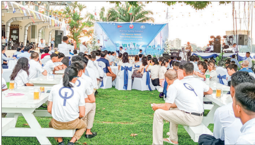
The awarding event for the National Yachting Championship 2024 in progress yesterday in Yangon.

A total of 24 athletes for Optimist Class, five for ILCA-4 event, another five for the ILCA-6 (Men) event and four for ILCA-6 (Women) event competed at Ngwehsaung Yacht Club & Resort, while 14 athletes for Sharpie A event, another 14 for Sharpie B event and further 14 for