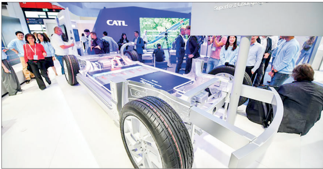
“Shenxing”, a fast-charging lithium iron phosphate (LFP) battery made by China’s EV battery maker Contemporary Amperex Technology Co, Ltd (CATL), is displayed during the press preview of the 2023 International Motor Show (IAA) in Munich, Germany, 4 September 2023.

The United States announced its intention to impose additional tariffs on various Chinese imports, including electric vehicles, lithium-ion batteries, solar cells, critical minerals, semiconductors, steel, aluminum, and cranes, as part of its Section 301 tariffs.