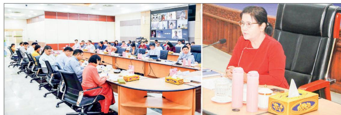
A coordination meeting on foreign exchange rate and financial matters, as well as the trading and banking system, in progress in Yangon yesterday.

She then called for cooperation of people from government/private sectors in implementing