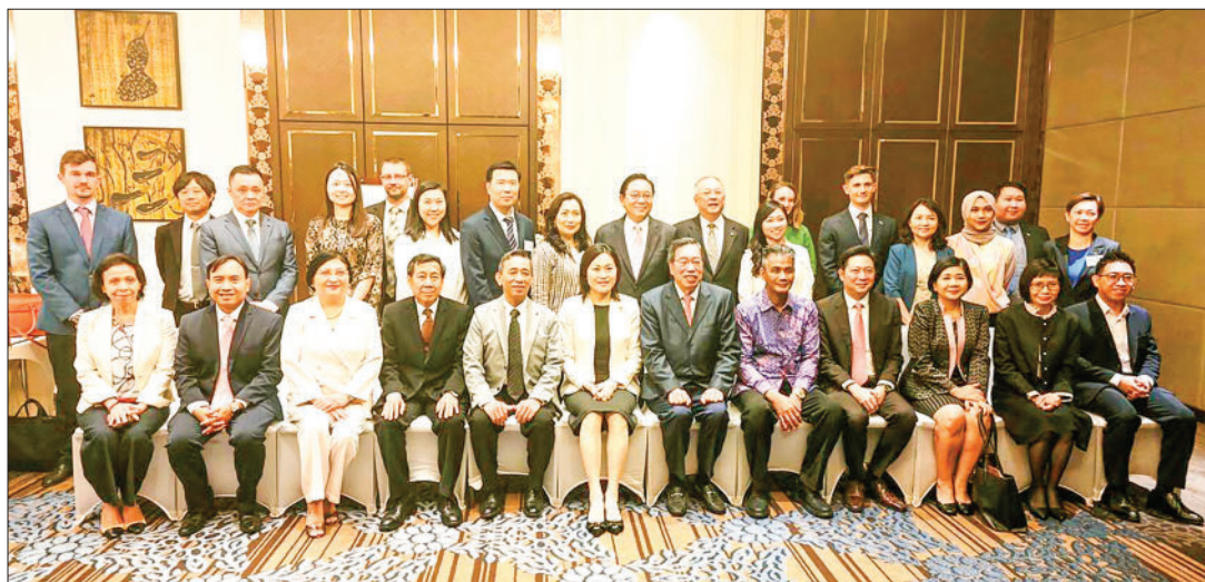
ASEAN permanent representatives seen in group photo of ASEAN-HK collaboration talk.