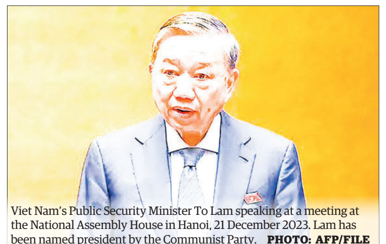
Viet Nam’s Public Security Minister To Lam speaking at a meeting at the National Assembly House in Hanoi, 21 December 2023. Lam has been named president by the Communist Party.

Al Jazeera reported that Thuong was the second president to quit in two years amid an anti-corruption crackdown that has seen several senior politicians fired and top business leaders tried for fraud and corruption. Tran Thanh Man, 61, was also nominated as the new head of Viet Nam’s National Assembly, state media said, becoming one of Viet Nam’s four most powerful leaders, Al Jazeera reported. — ANI