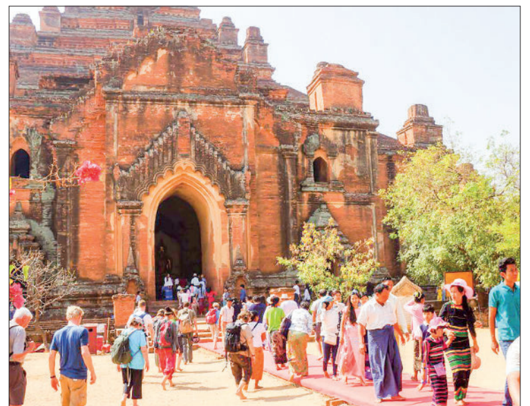
Local and foreign tourists visit ancient religious edifices in Bagan.

The inbound tourism services, which generate significant income for the country without smoke, is attracting foreign revenue through the development of many destinations and attractions. With its natural scenery, natural lakes, and ancient cultural heritage areas, community-based tourism will thrive in Bagan. Tourism operators predict that 2024 will bring more tourists to Myanmar than 2023, thanks to the country's hospitable traditions and warm-hearted people. — Nyein Thu (MNA)/TH