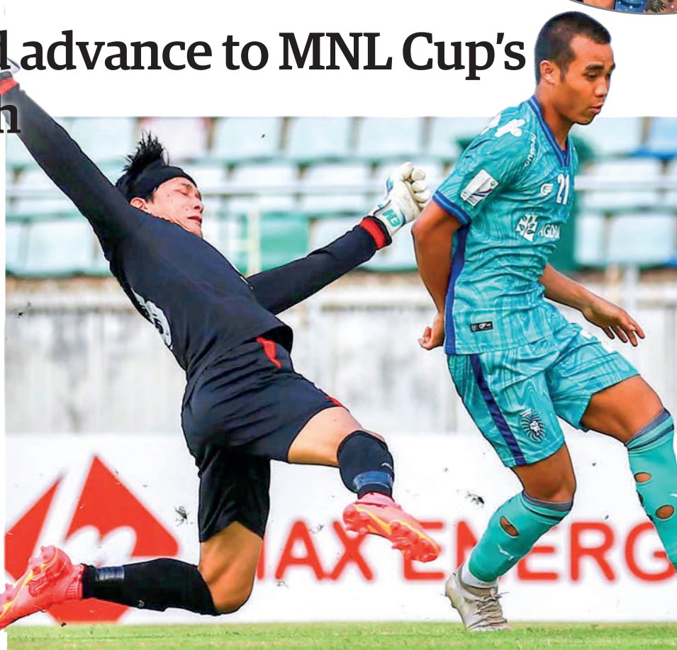
Yangon United player (greenish blue) vies the ball with Maha United keeper during the Group A match of the Myanmar National League Cup Championship 2024 at Thuwunna YTC in Yangon on 19 May 2024.