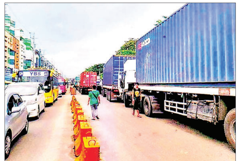
Photo shows some container trucks which are rolling in downtown Yangon.