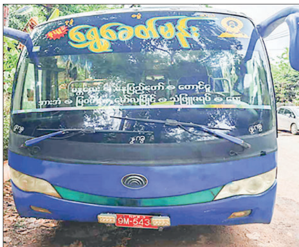
A Yutong Bus seized in Kayin State.

The Illegal Trade Eradication Steering Committee reported that 12 arrests were made on 16 and 17 May, with an estimated value of K189 million. — MNA/MKKS