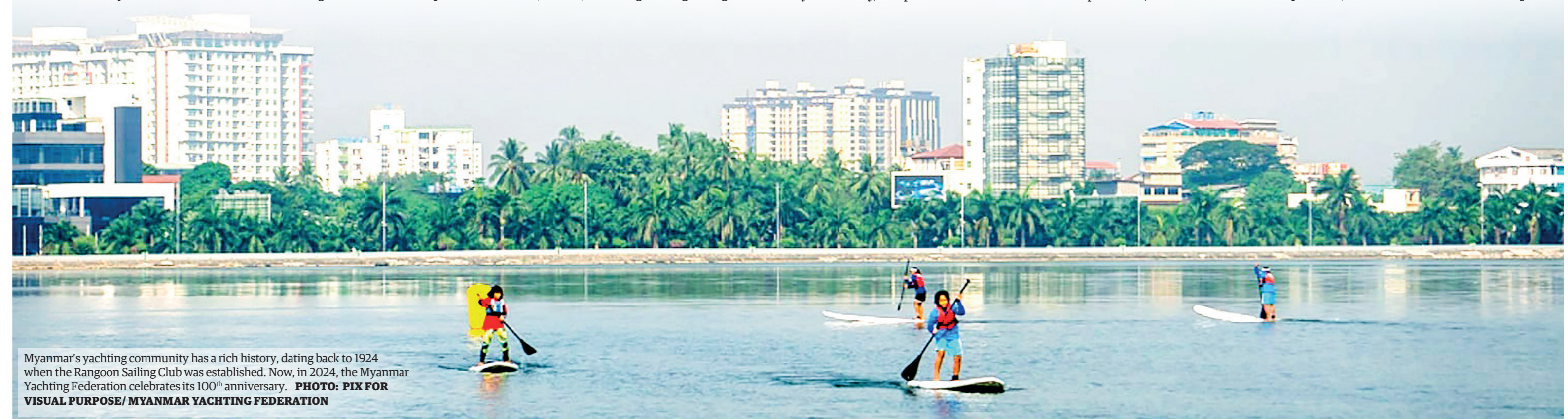
Myanmar's yachting community has a rich history, dating back to 1924 when the Rangoon Sailing Club was established. Now, in 2024, the Myanmar Yachting Federation celebrates its 100 th anniversary.