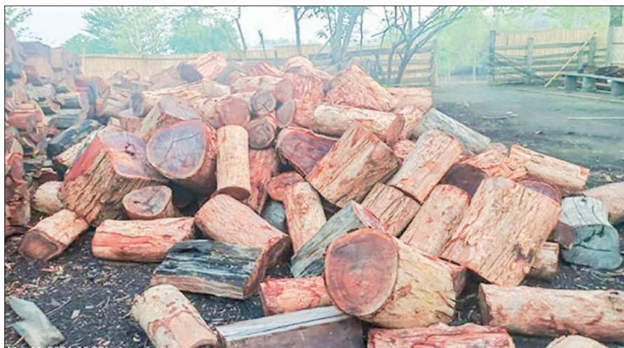
Illegal timbers seized in Bago Region on 17 May.

teams impounded a Yutong bus (approximately K30 million), heading to Nay Pyi Taw from Eindu of Kayin State, carrying