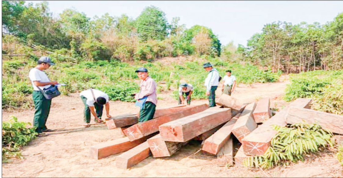
Illegal timbers seized in Bago Region on 17 May.