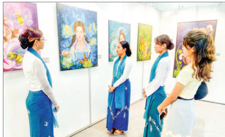
Stories portray paintings art exhibition held at the National Library of Myanmar (Yangon) situated on the Merchant Street in Pabedan township.

The art exhibitions by the students of the Painting Department had been shown in outdoor art galleries in Yangon before the Covid-19 period, and this exhibition is shown for the first time after the pandemic period.