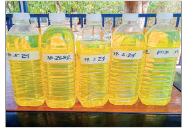
Seized smuggled fuel oil bottles.

cedures and the Petroleum and Petroleum Products Law.