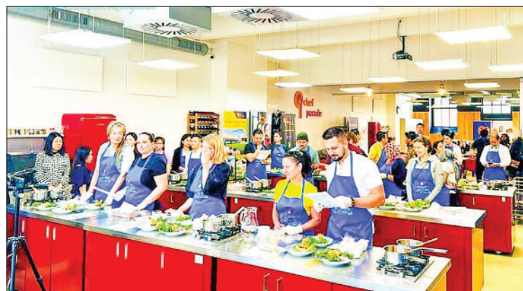
Czech citizens and family members from embassies in the Prague seen with traditional foods.

During the discussion, both sides explored collaboration opportunities in investment, finance, technology and innovation, and tourism sectors between ASEAN and Hong Kong. They also discussed priority sectors to be implemented in 2024 by Laos, the ASEAN alternate chair, and the potential for entering the Regional Comprehensive Economic Partnership. — ASH/TMT