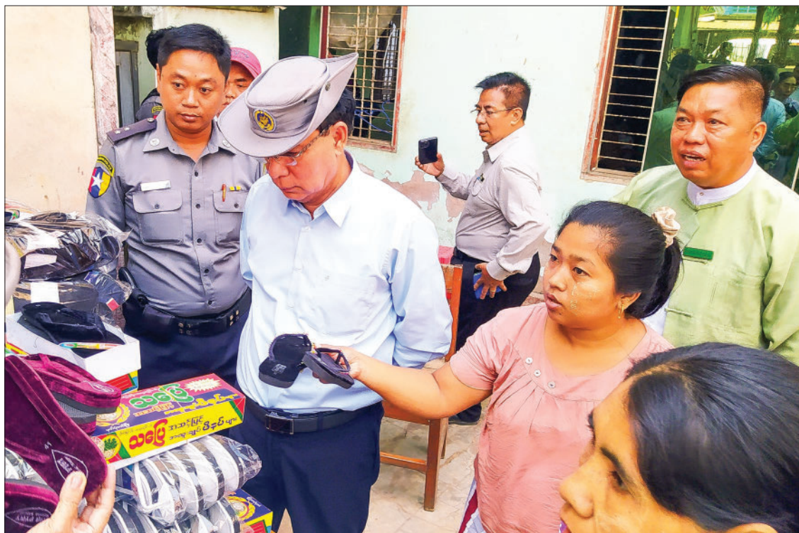
Bago Region Chief Minister U Myo Swe Win observes a local business, producing velvet footwear, in Natpadee Village in Paungde Township yesterday.

The Chief Minister also held discussions concerning assistance for local business owners and farmers. — Shwe Thar (IPRD)/ TMT