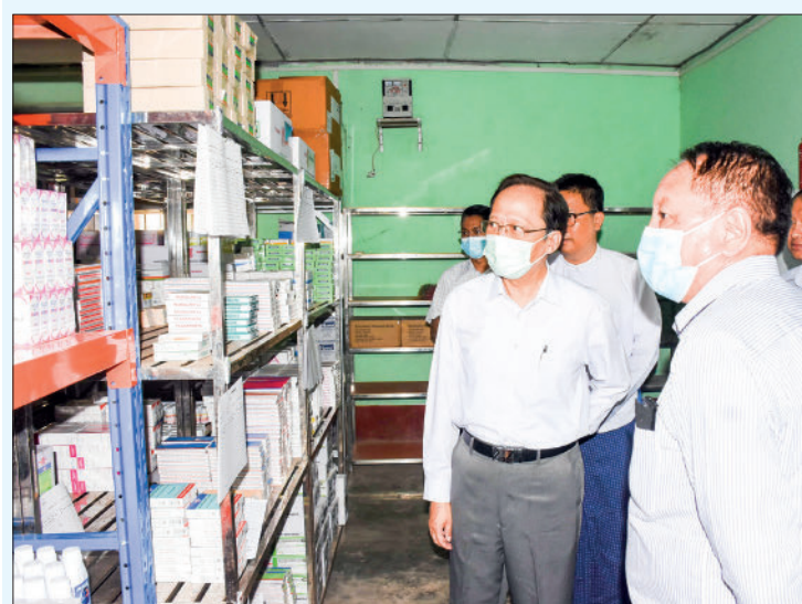
Union Minister for Health Dr Thet Khaing Win inspects medicines and medical equipment stored in Taikkyi People's Hospital in Yangon Region, on 19 May.

The 500 KV Kankaung substation project is the first of its kind in Myanmar. Upon completion, it will enable the full transmission of electricity produced by power plants in the northern part of the country to the southern part through the 500 KV power grid system. The project is currently 79 per cent complete and is expected to be fully completed by December 2024. — MNA/TKO