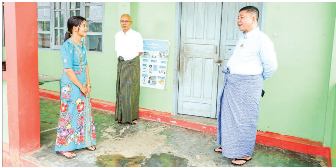
Mon State Chief Minister U Aung Kyi Thein looks into the basic education schools in Chaungzon Township yesterday.

MON State Chief Minister U Aung Kyi Thein conducted inspections of basic education schools in Mon State yesterday to provide necessary assistance.