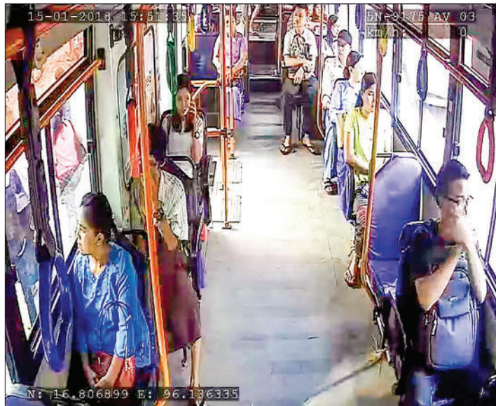
CCTV cameras are installed in a YBS bus.

About 3,800 buses from 131 YBS bus lines commutes about 1.6 million passengers daily, according to YRTC. — MT/ZS