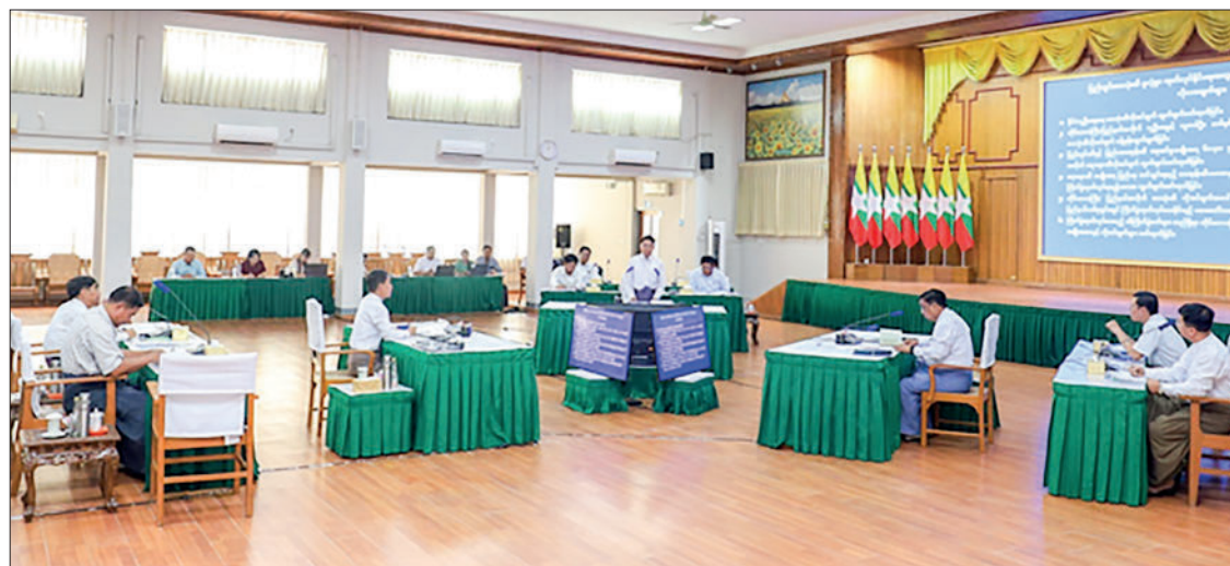
A coordination meeting on boosting domestic edible oil production in progress at Office No 15 in Nay Pyi Taw yesterday.

Attendees included Union Minister for Agriculture, Livestock and Irrigation, U Min Naung, Union Minister for Industry Dr Charlie Than, Union Minister for Commerce U Tun Ohn, as well as permanent secretaries from relevant ministries, directors-general, and experts. Discussions centred on achieving sufficient domestic