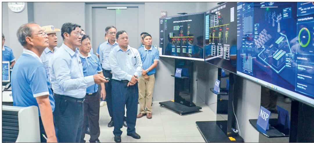
Union Minister U Nyan Tun inspects the production and connection of solar energy to National Grid System in the power control room at Thapyaywa-3 30 MW and Thazi 30 MW solar power plant projects in Thazi Township 18 May 2024.

UNION Minister for Electric Power U Nyan Tun visited the Belin Base of the Hydropower Implementation Department in Kyaukse Township on 18 May. During his visit, they met with temporarily displaced employees from Shan State (North) and provided necessary assistance.