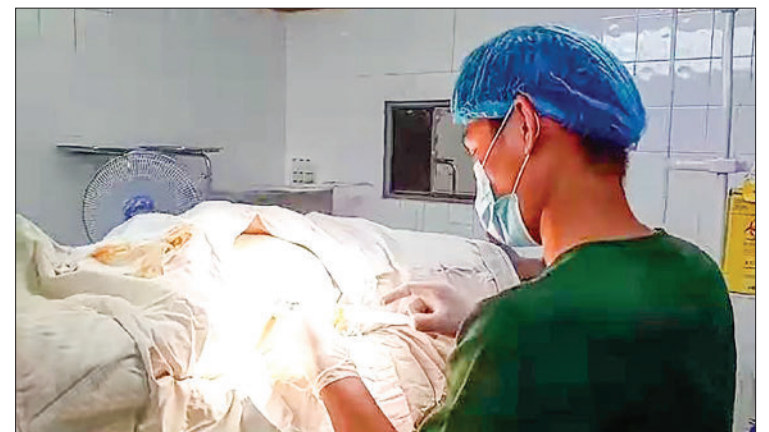
Emergency medical treatment was provided to the pulmonary oedema patient with opaque right lung.