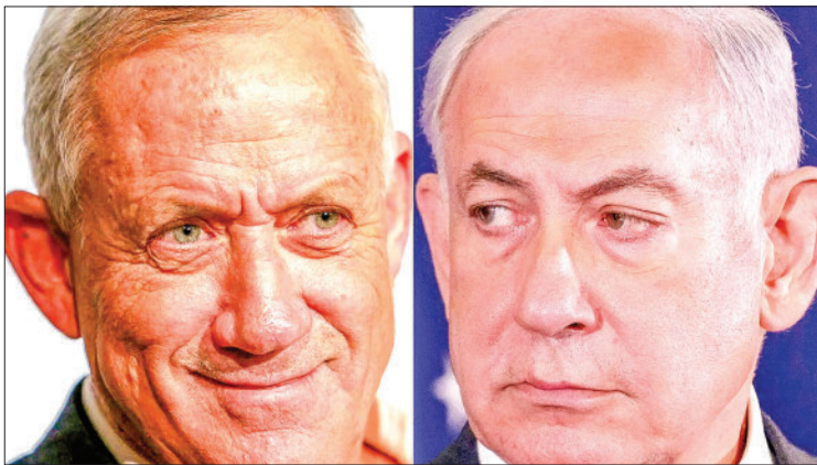
If Netanyahu chooses a path that leads the nation to the abyss, Gantz is prepared to quit the government.

Recent polling reveals Netanyahu's approval rating in Israel stands at some 32%.