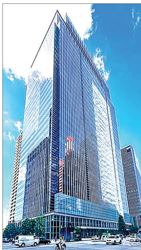
Norinchukin plans to engage in discussions with its primary investors, including the Japan Agricultural Cooperatives, regarding the proposed capital increase.

According to a source familiar with the situation, the bank anticipates a net loss of around 500 billion yen for the fiscal year ending March 2025 due to the disposal of these unrealized losses.