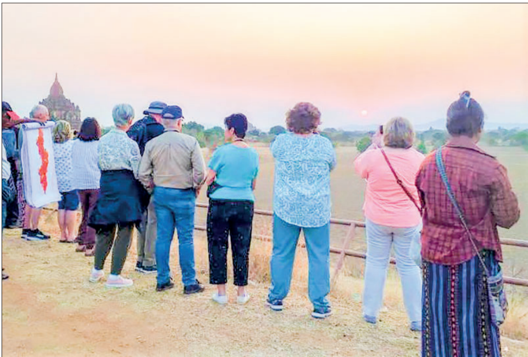
Foreign tourists enjoying sunset views from view desk in Bagan ancient cultural zone.