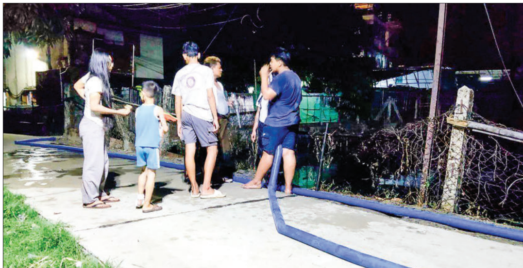
Rehearsal for flood rescue operations.

“Floods don’t happen all the time. Dirt and silt remain after water drops. So we have to clean up the dirty water by machines. So we have made tests in order to make them ready when rescue works are carried out,” she said. — Htet Oo Maung/ZS