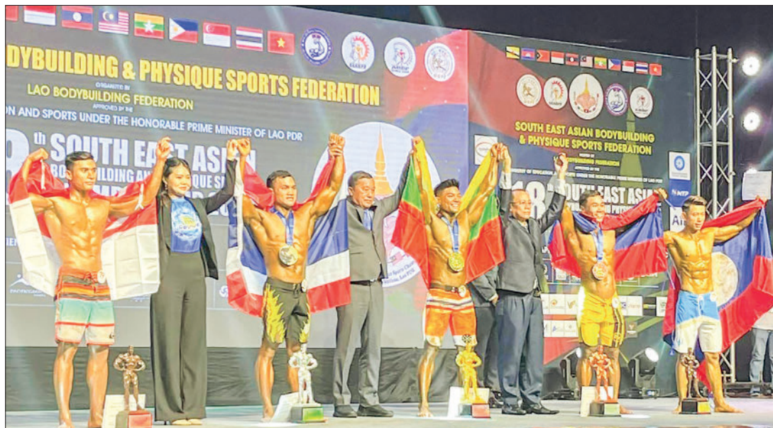
The Myanmar bodybuilder (C) is seen with gold medal during the 18 th Southeast Asian Bodybuilding & Physique Sports Championship 2024.