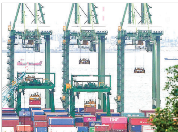
Containers are seen at the Pasir Panjang container terminal in Singapore on 17 August 2020.

Masahiro Nozaki, who led the team's discussions with Singapore from 7 May to 16 May foresees headline and core inflation moderating to 3 per cent this year, with core inflation stabilizing around 2 per cent by 2025.