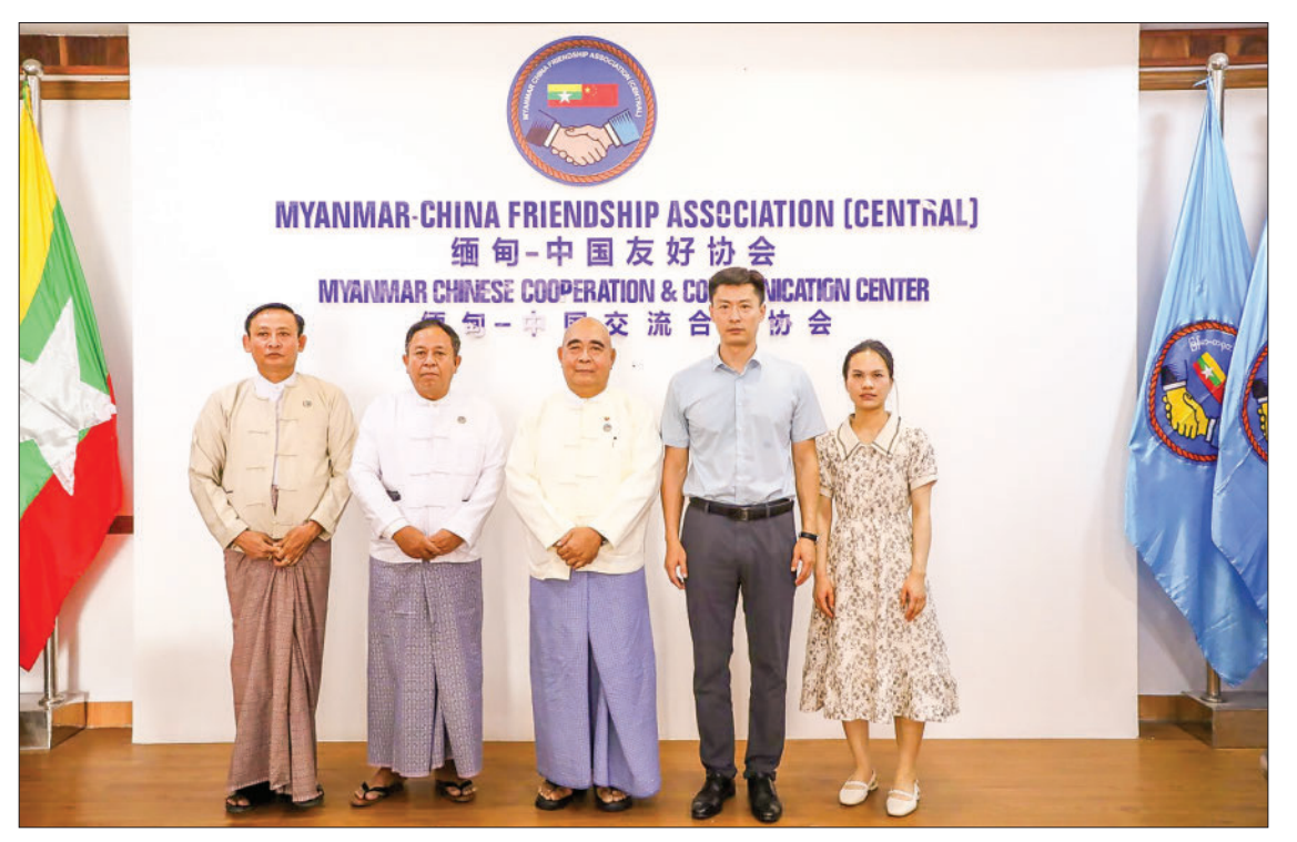
Officials and the Chinese Minister Counsellor seen posing for the documentary photo at the 16 May event.

The Minister Counsellor emphasized that the one-Chi-