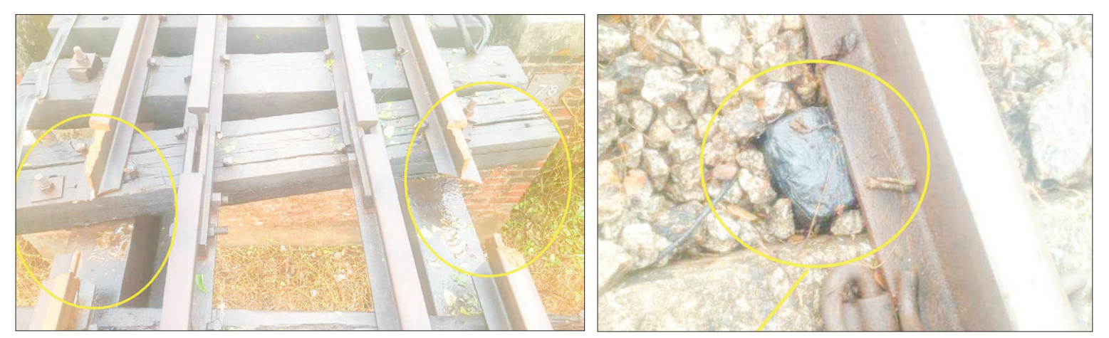
Photos depict debris in the aftermath of four explosions on the Bago-Mawlamyine railway in Thaton Township.

THE 60-foot bridge No 78 at 124/3 milepost between Theinseik and Donwun railway stations on the Bago-Mawlamyine rail section in