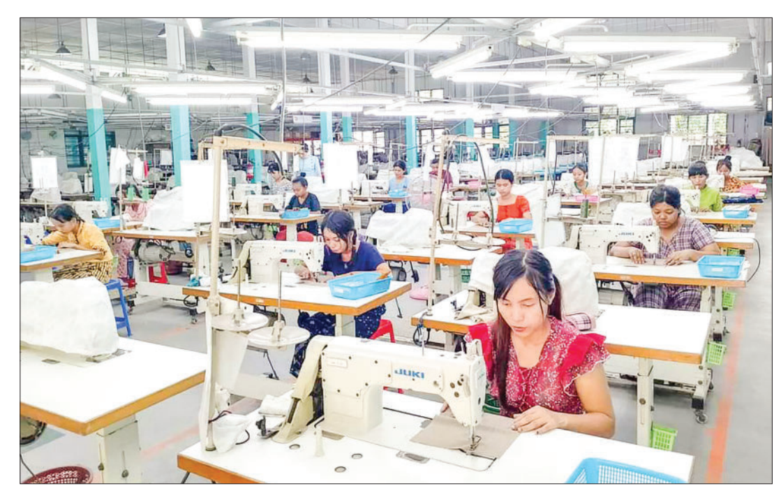
Diligent workers seen in the manufacturing line at the garment factory.

with a view to creating job opportunities. Those who wish to attend the training can enrol through phone numbers 09 940858350, 09 450723262, 09 9403912570, 09 784085794, and 09 952802635. — NN/EM