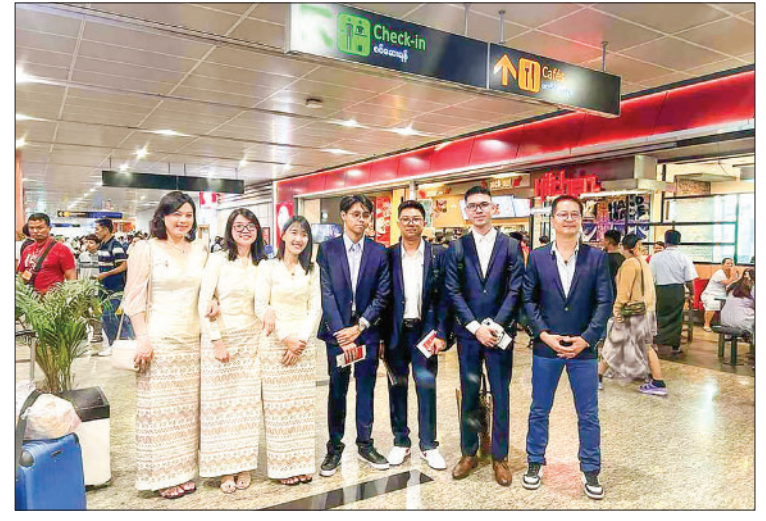
Representatives of the Myanmar-China Friendship Association (Central).

University students from China and ASEAN countries will participate to exchange experiences and cultures among future leaders. Additionally, the report states that the delegation has prepared Pyu era dance performances to entertain the ASEAN-China representatives and will showcase Myanmar traditional handicrafts and foods at the festival.