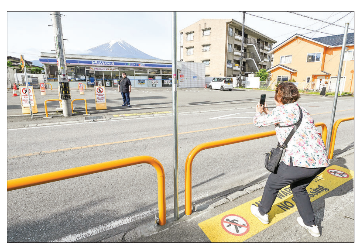
A person takes pictures of Mount Fuji from across the street of a convenience store, hours before the installation of a barrier to block the sight of Japan's Mount Fuji to deter badly behaved tourists, in the town of Fujikawaguchiko, Yamanashi prefecture on 21 May 2024.

Japan's most famous sight can be seen for miles around, but Fujikawaguchiko locals are fed up with streams of mostly foreign visitors littering, trespassing and breaking traffic rules in their hunt for a photo to share on social media. Parking illegally and ignoring a smoking ban, they would cram a pavement to shoot the snow-capped mountain, which soars photogenically into the sky from behind a convenience store, residents said. Workers began putting the black netting measuring 2.5 by 20 metres (eight by 65 feet) in place on Tuesday, and by late morning they were already done, an AFP reporter at the scene said. "I