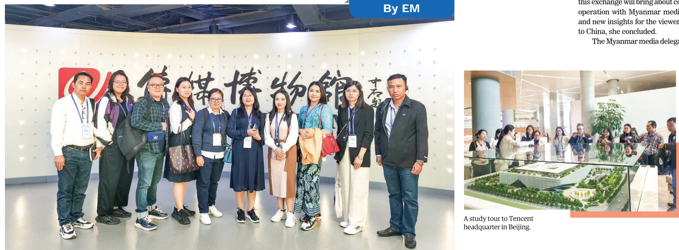
Posing for a documentary photo at the Media Museum of Communication University of China.

Insights from tradition media transforming to New Media