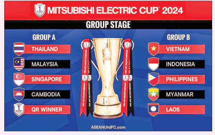
The fixtures for the AFF Mitsubishi Electric Cup 2024 Championship.

The ASEAN Mitsubishi Electric Cup Tournament is formerly named the Tiger Cup, ASEAN Championship and ASEAN Suzuki Cup Championship, respectively. Thailand has won the championship title seven times while Singapore