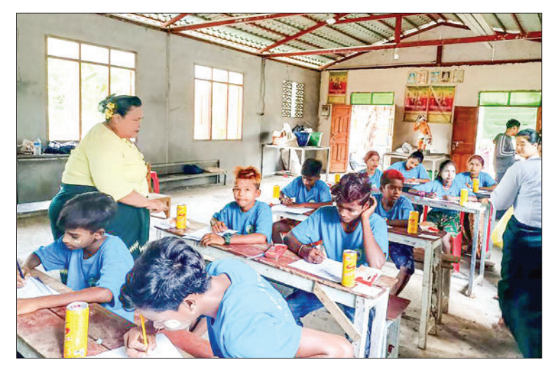
NFPE's year-end evaluation test in Mon State's Paung township in 2023.

MYANMAR non-formal primary education (NFPE) which provides free education to children aged between 10 and 14 in Shwepyitha Township, Yangon Region, has seen an increase in the number of students.