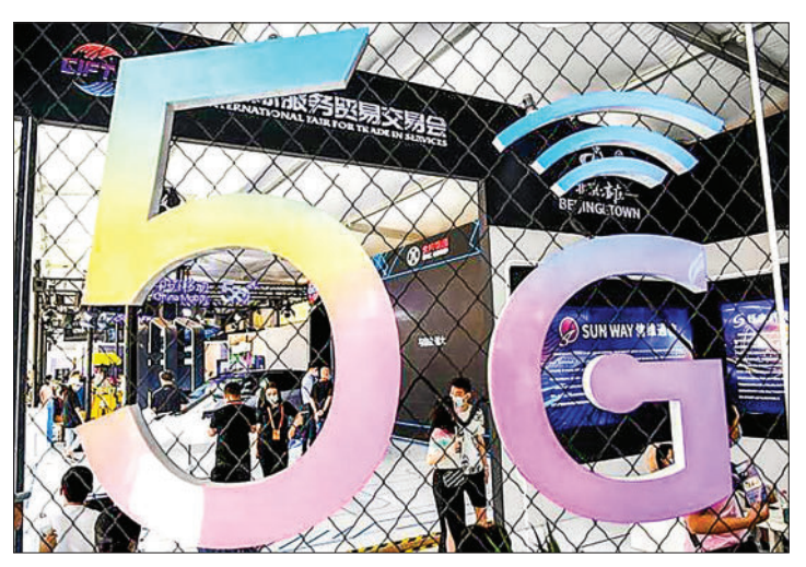
Visitors watch exhibits displayed at the 5G telecommunication service section of the China International Fair for Trade in Services in Beijing, capital of China, on Sept. 5, 2020.

The 5G-A network is set to gradually cover 18 areas in Beijing, including prominent locations like Chang'an Avenue, Financial Street, Beijing Capital International Airport, and the central area of Beijing Olympic Park.