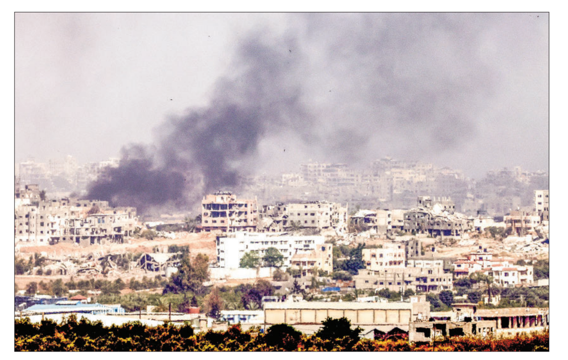
Smoke plumes from an explosion billow in the Gaza Strip, as seen from Israel's southern border with the Palestinian territory on 21 May 2024 amid the ongoing conflict between Israel and the militant group Hamas.