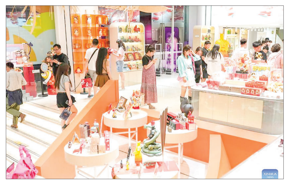
Tourists select cultural and creation products at a shop in the Great Tang All Day Mall in Xi'an, capital of northwest China's Shaanxi Province, 20 May 2024.

TOURISM is increasingly emerging as a strategic pillar industry in China, serving as a focal point of the country's high-quality development.