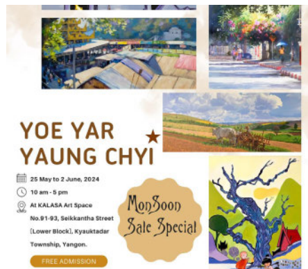
The image showcases some paintings displayed at the 'Yoe Yar Yaung Chyi Monsoon Special Art Exhibition.