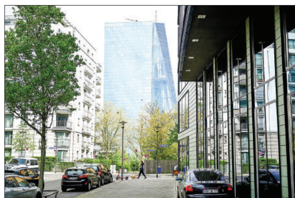
The headquarters of the European Central Bank (ECB, C) in Frankfurt am Main, western Germany, is pictured on 11 April 2024.

“The focus will be the eurozone’s first reading of May CPI and the US core PCE index, both released on Friday.” — AFP