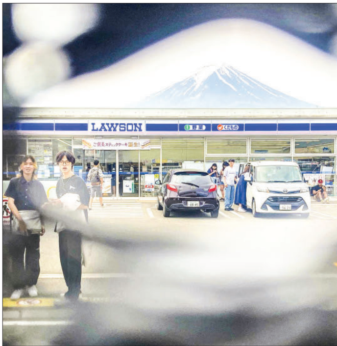
Mt Fuji is seen on 24 May 2024 through a hole opened on a black screen set up by Fujikawaguchiko, Yamanashi Prefecture.

The town plans to repair the screen promptly while posting a notice asking visitors not to touch it. — Kyodo