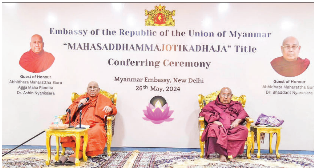
The conferring ceremony of religious titles to three members of the Sangha in progress in New Delhi on 26 May 2024.

THE conferring ceremony of religious titles ‘Maha Saddhamma Jotikadhaja’ and ‘Saddhamma Jotikadhaja’ offered by the Government of the Republic of the Union of Myanmar was held on 26 May 2024 at the Myanmar Embassy in New Delhi.