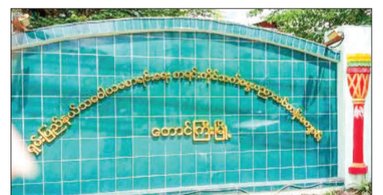
The photo showcases the Cooperative Accounting Vocational Training Centre (Taunggyi).

Application forms are available at the Cooperative Accounting Vocational Training Centres in Taunggyi, Magway, Mandalay, Patheingyi, and Mawlamyine. Completed forms and necessary documents must be submitted by 15 June at the latest. — TWA/TRKM