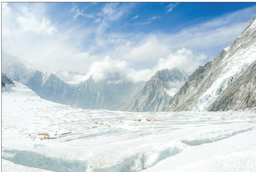
This photograph taken on 4 May 2024 shows mountaineers during their ascend to Mount Everest's summit, in Nepal.

AN Indian climber rescued from Everest has died in hospital, a Nepali tourism official said Tuesday, taking the number of fatalities this season on the world's highest mountain to eight.