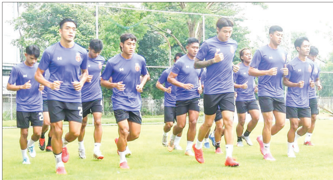
Myanmar footballers seen taking training ahead of the World Cup qualifiers.

THE Myanmar national team has been training since yesterday evening for the remaining two group matches of the 2026 World Cup Asian zone qualifiers against Japan and North Korea, which will be played in June.