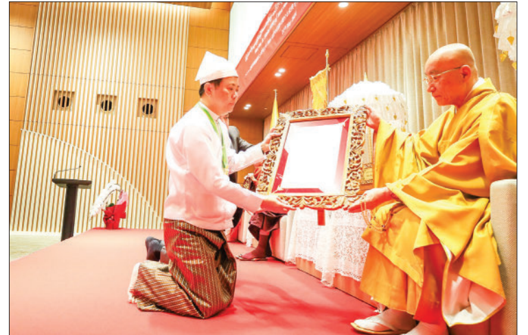
The Myanmar Embassy seen holding the ceremony to honour two title-recipient monks from Japan on 25 May 2024.