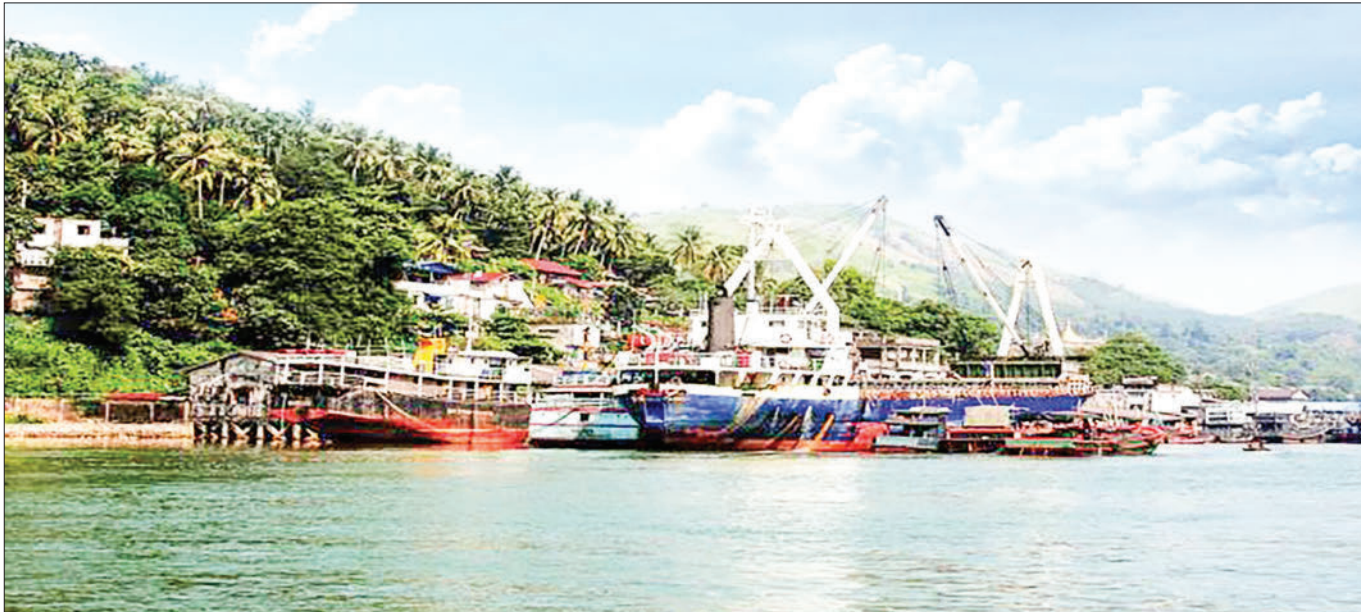
Vessels are seen being loaded with fisheries products at the Kawthoung border.

Myanmar exports cashew nuts, fisheries products such as squid, crab and fish, fishing nets, construction materials and other goods to external markets. — TWA/KK