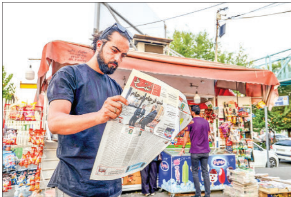
A man reads the Iranian newspaper Etemad, with the front page title reading in Farsi "The night of the end of the JCPOA", and cover photos of Iran's Foreign Minister Hossein Amir-Abdollahian and his deputy and chief nuclear negotiator Ali Bagheri Kani, in the capital Tehran on 16 August 2022.

He said that the exchange of indirect messages between Iran and the American side on sanctions removal had been ongoing without interruption. However, such interactions had focused solely on areas concerning the lifting of the embargoes and nuclear issues and had never gone beyond that framework. — Xinhua