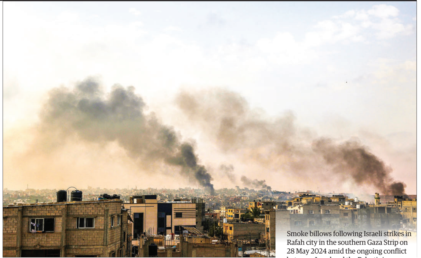
Smoke billows following Israeli strikes in Rafah city in the southern Gaza Strip on 28 May 2024 amid the ongoing conflict between Israel and the Palestinian Hamas militant group. The UN Security Council was set to convene an emergency meeting on 28 May over an Israeli strike that killed dozens in a displaced persons camp in Rafah, as three European countries were slated to formally recognize a Palestinian state.

"We saw everyone fleeing again," she told AFP. "We too will go now and head to Al-Mawasi because we fear for our lives," she said, referring to a nearby coastal area Israel has declared a safe "humanitarian zone".