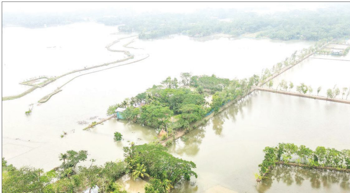
This aerial photograph shows deluged land after cyclone Remal's landfall in Patuakhali on 28 May 2024.