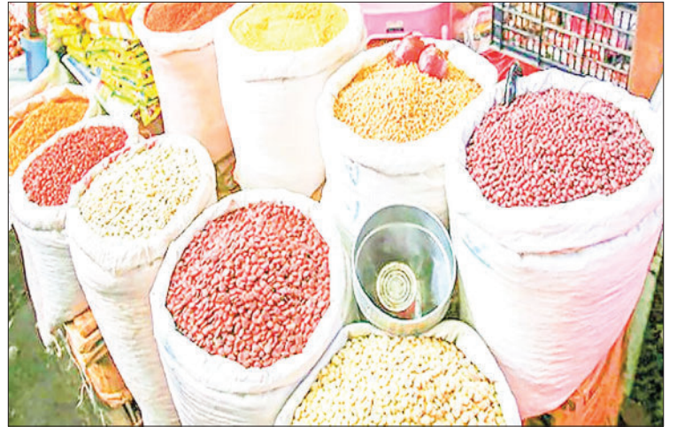
Various beans and pulses seen being arranged for sales in the market.

Myanmar's black gram output is estimated at 400,000 tonnes per year, whereas pigeon