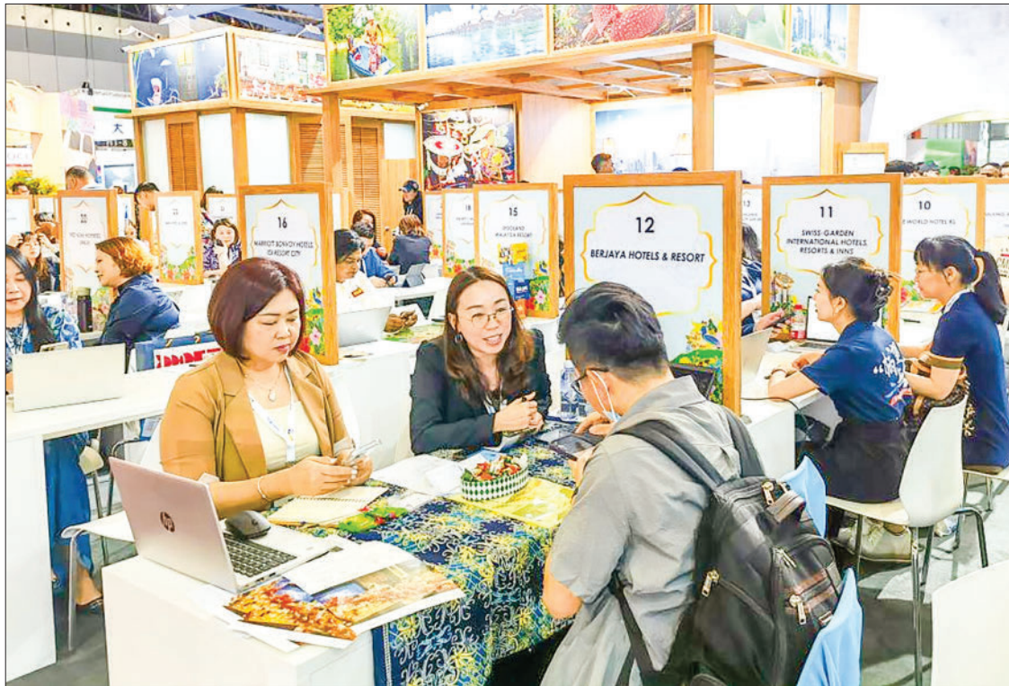
People visit a booth of Malaysia at ITB China 2024 in Shanghai, east China, 27 May 2024.

market has been on a steady positive trajectory, and with the impact of improved visa policies and increased flight capacity, China's travel market is showing strong signs of growth at the start of 2024," said David Axiotis, vice-president for the China market at Messe Berlin GmbH.