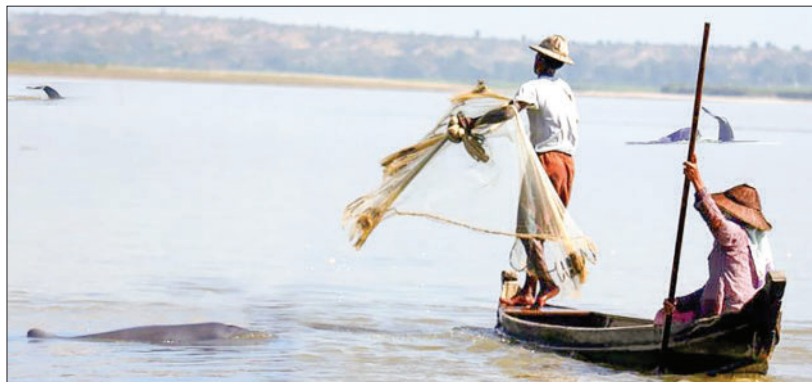
Photos show Irrawaddy dolphins in the Mandalay- Kyaukmyaung area.

THE Irrawaddy Dolphin Protected Area near Indaung Village in the Mandalay-Kyaukmyaung region is home to up to 16 Irrawaddy dolphins.