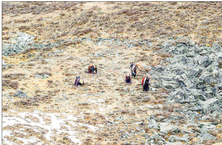
People dig caterpillar fungus in Shade Town, Kangding City, Garze Tibetan Autonomous Prefecture, southwest China's Sichuan Province, 23 May 2024.

Prefecture, southwest China's Sichuan Province. Found only at high altitudes, caterpillar fungus, known in China as "winter-worm summer-grass", is said to be effective in boosting the immune system.