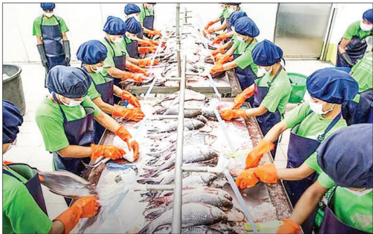
Workers seen in the fisheries processing line.

THE Department of Fisheries aims to achieve export earnings of over US$800 million in the current financial year 2024-2025.