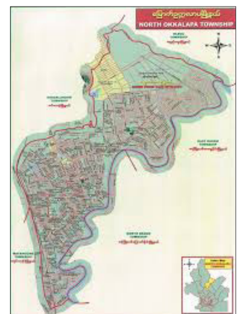
North Okkalapa Township map.

Village in Wetlet Township. We have also asked fishermen and local villagers to inform our team if they see baby dolphins,” said U Maung Maung Lay. Additionally, groups of Irrawaddy dolphins are also notably living and grazing in the Ayeyawady River near Ayekyun Village in Madaya Township, which is developing village-based tourism in the Mandalay-Kyaukmyaung area. — ASH/MKKS