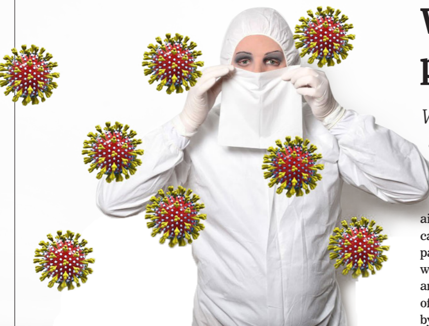
Reflecting on the immense toll of COVID-19, with at least seven million lives lost globally, Dr Tedros emphasized the need for a concerted effort to prepare for future pandemics.

While progress has been made in negotiations towards a pandemic agreement, challenges remain. The World Health Assembly is seen as a crucial platform to galvanize efforts and finalize this agreement, aiming to better equip the world to handle future health crises.