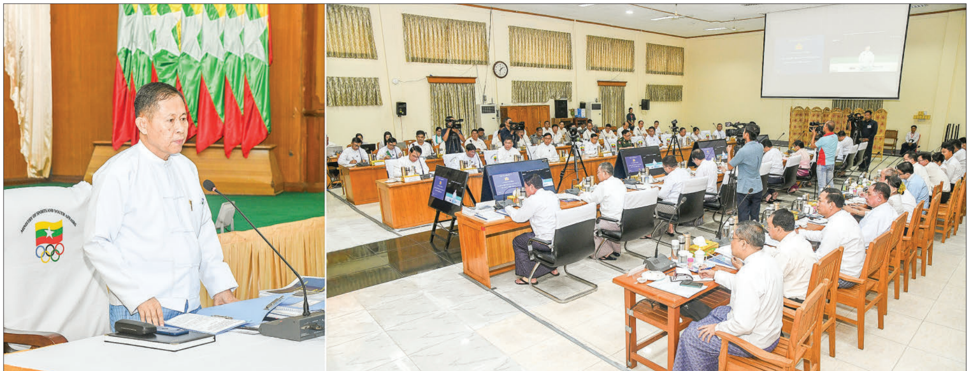
State Administration Council Vice-Chairman Deputy Premier Vice-Senior General Soe Win presides over the first meeting of the Leading Organizing Committee on the Fifth National Sports Festival 2024 yesterday in Nay Pyi Taw.

Officials need to fairly manage competitions in the National Sports Festival in accordance with sporting spirit and sports oaths, although all competitions will be strong in line with the prestige of the sports festival.