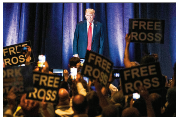
People hold up signs reading "Free Ross" as former US President and Republican presidential candidate Donald Trump arrives to address the Libertarian National Convention in Washington, DC, 25 May 2024.

PROSECUTORS in the trial of Donald Trump will make a final pitch to the jury Tuesday, in their historic pursuit of the first ever criminal conviction of a former US president.