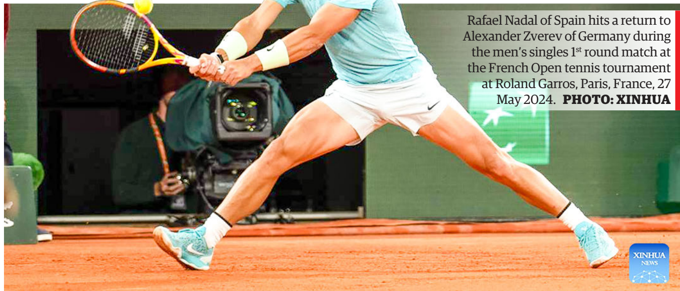
Rafael Nadal of Spain hits a return to Alexander Zverev of Germany during the men's singles 1st round match at the French Open tennis tournament at Roland Garros, Paris, France, 27 May 2024.

"We are really excited to continue this journey with no limits to our dreams," said Emery on the club's website. — Xinhua