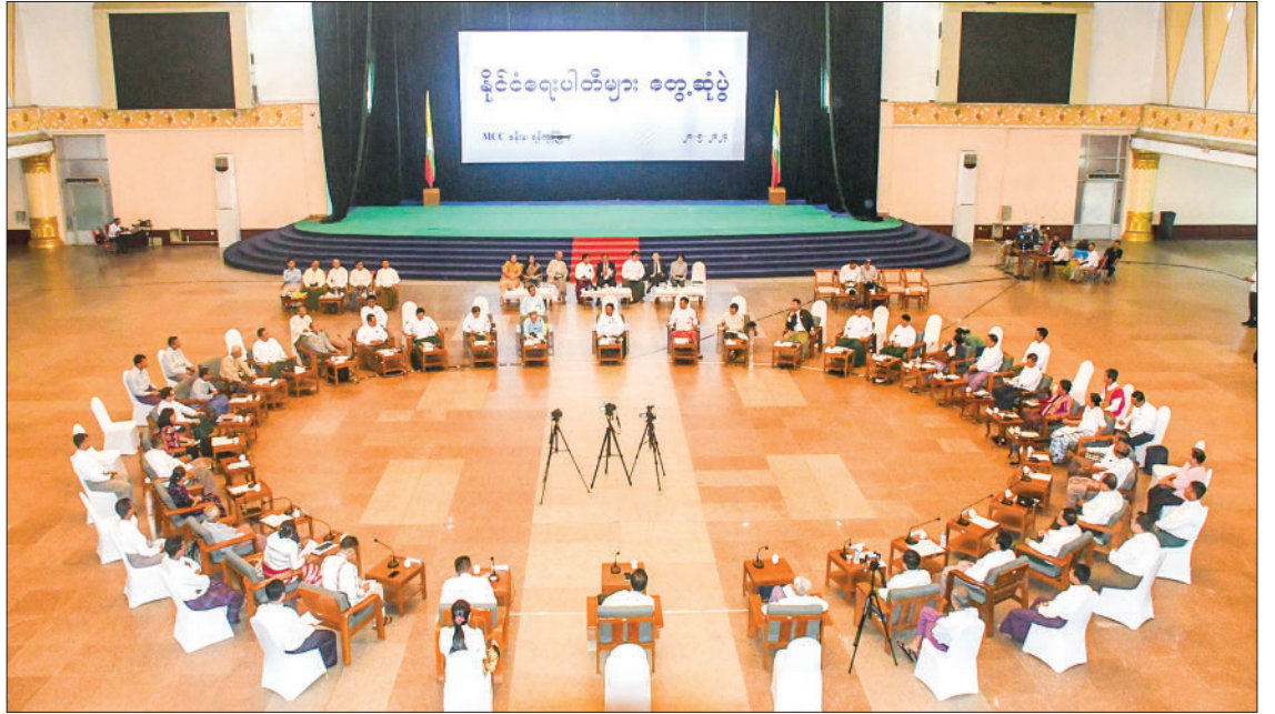
A roundtable meeting amongst political parties, the Myanmar Writer's Association, and the Myanmar Farmer's Development Foundation in progress yesterday.

Attendees then had discussions on sanctions and released a joint statement strongly opposing and condemning sanctions on Myanmar. — MNA/KTZH