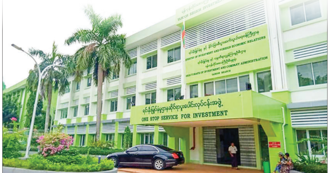
The general view of the office of the One-Stop Service for Investment.

At the meeting, nine companies also raised capital expansion and general matters. — NN/EM