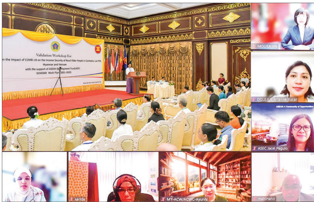
The Validation Workshop for the Research on the Impact of COVID-19 on the Income Security of Rural Older People in Cambodia, Laos, Myanmar and Vietnam in progress yesterday.