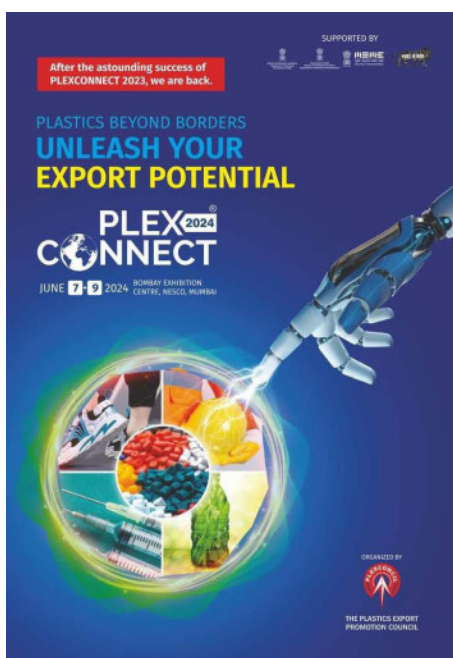
An advertisement of the Plexconnect 2024 that will be held in June in Mumbai, India.