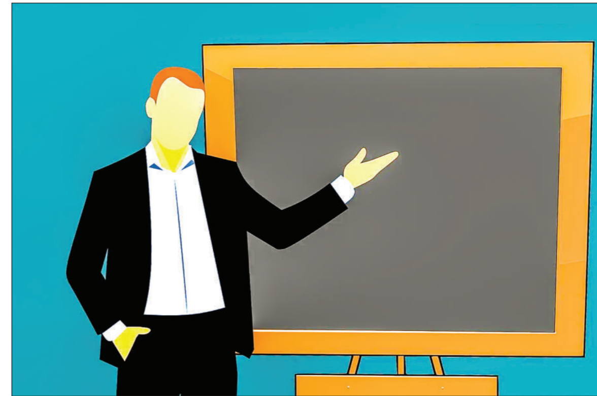
Today's teachers face a multitude of challenges, requiring a diverse skill set including soft skills like speaking, reading, reciting poetry, singing, playing music, acting, dancing, and painting, alongside digital literacy.

What would happen next if a teacher has not learnt Educational Psychology at all? Sure! If there will be an undesirable increase in apparent tensions between teachers and students. Not knowing Educational Psychology, some teachers harshly blame or are sharply angry at or shortly get impatient with students for possibly negligible reasons. A teacher who knows educational psychology inside