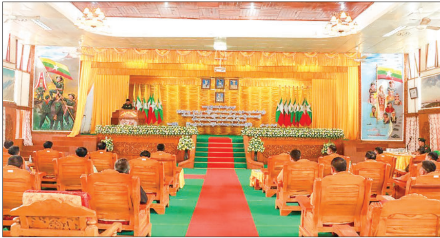
The handover ceremony of ethnic youths to their parents in progress at the North-East Command.

MNDAA and TNLA terrorists forcibly detained the young ethnic people and made them attend terrorist training and serve their duties. The young eth-