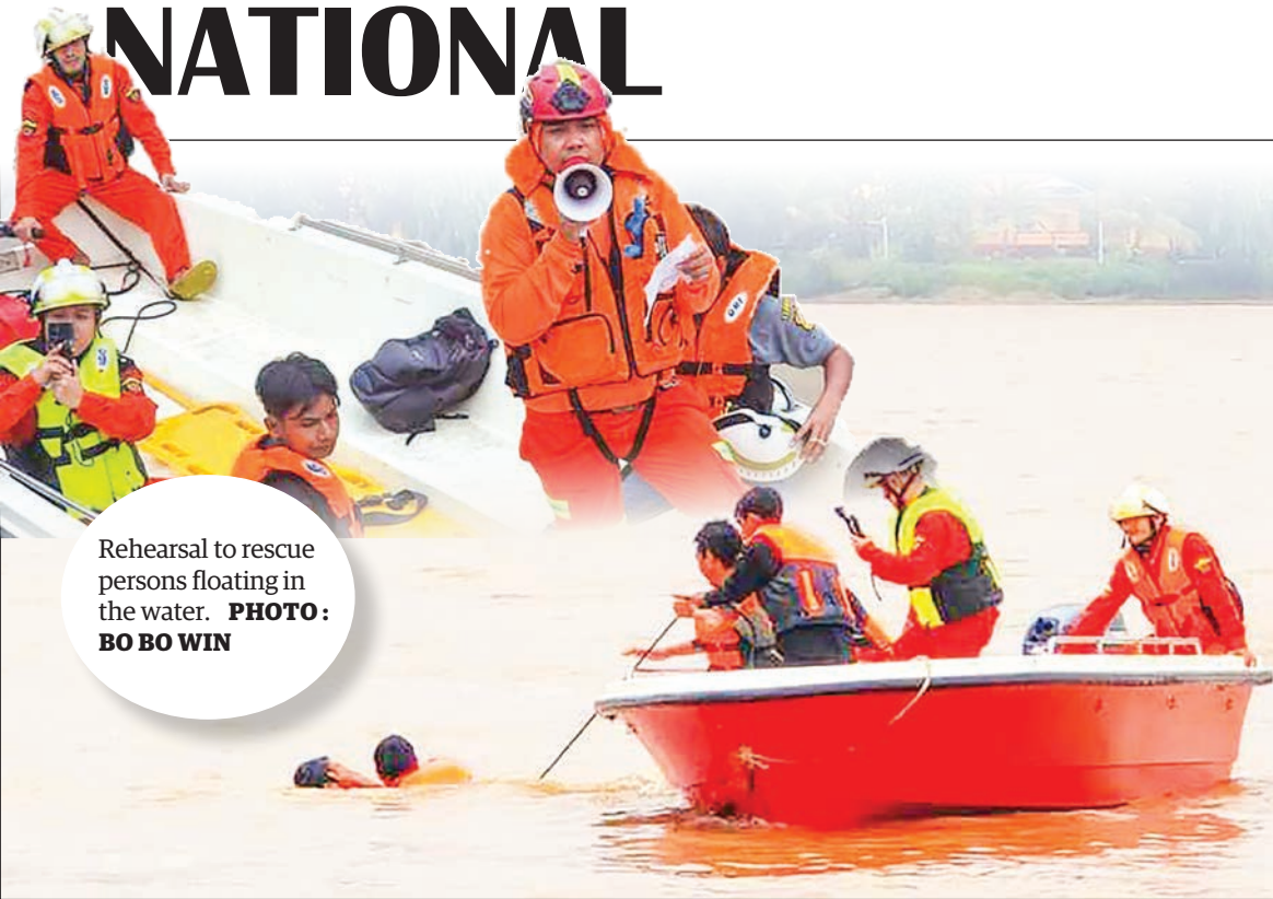
Rehearsal to rescue persons floating in the water.