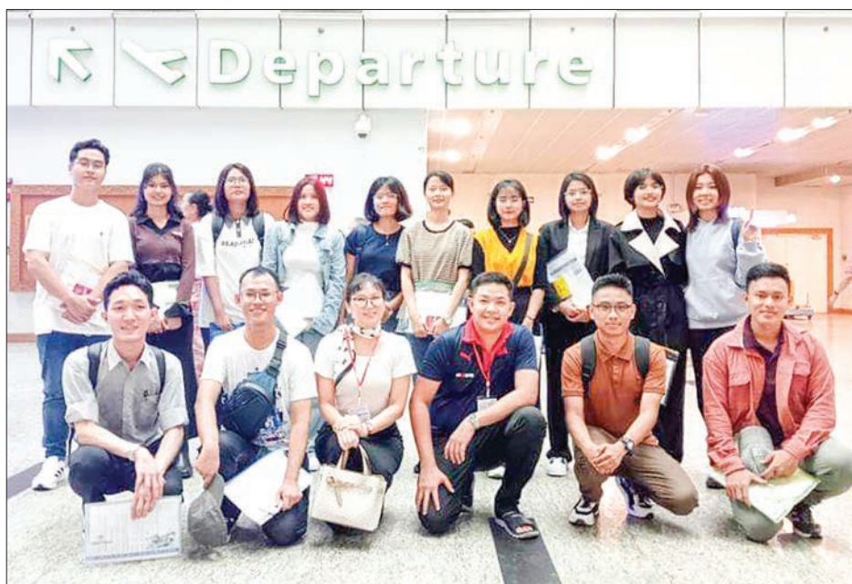
The Eighth batch of Asahi Shinbun Scholarship winners from the MAJA Centre seen at the airport.