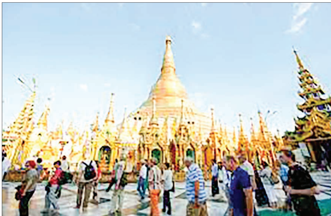
Photo depicts flocks of foreigners visiting Shwedagon Pagoda.

Due to the increasing number of pilgrims, the pagoda is open from 5 am to 8 pm.