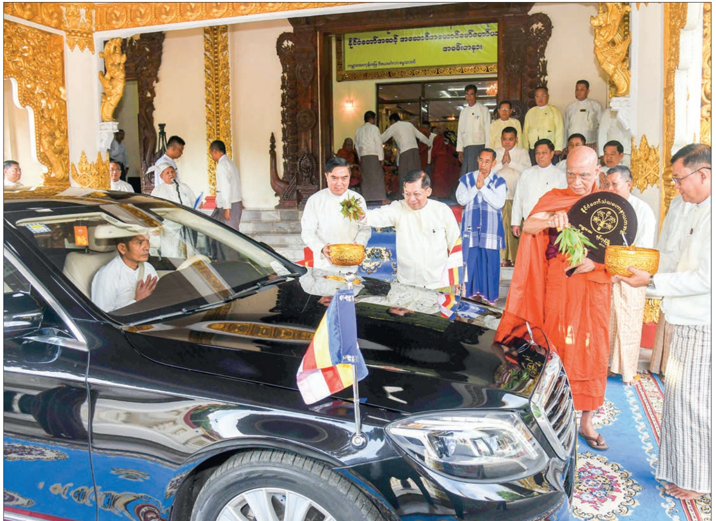
The Chairman Sayadaw of State Sangha Maha Nayaka Committee, and Senior General Min Aung Hlaing sprinkle Paritta scented water on the vehicle during the ceremony to offer national-level regalia vehicle to member Sayadaws of SSMNC yesterday.