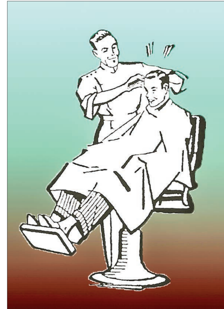
The passage of time and the natural progression of aging are depicted as universal truths that everyone must confront.

In contemplating the nature of infirmity, we come to understand the resilience of the human spirit. Despite the physical limitations that ageing imposes,