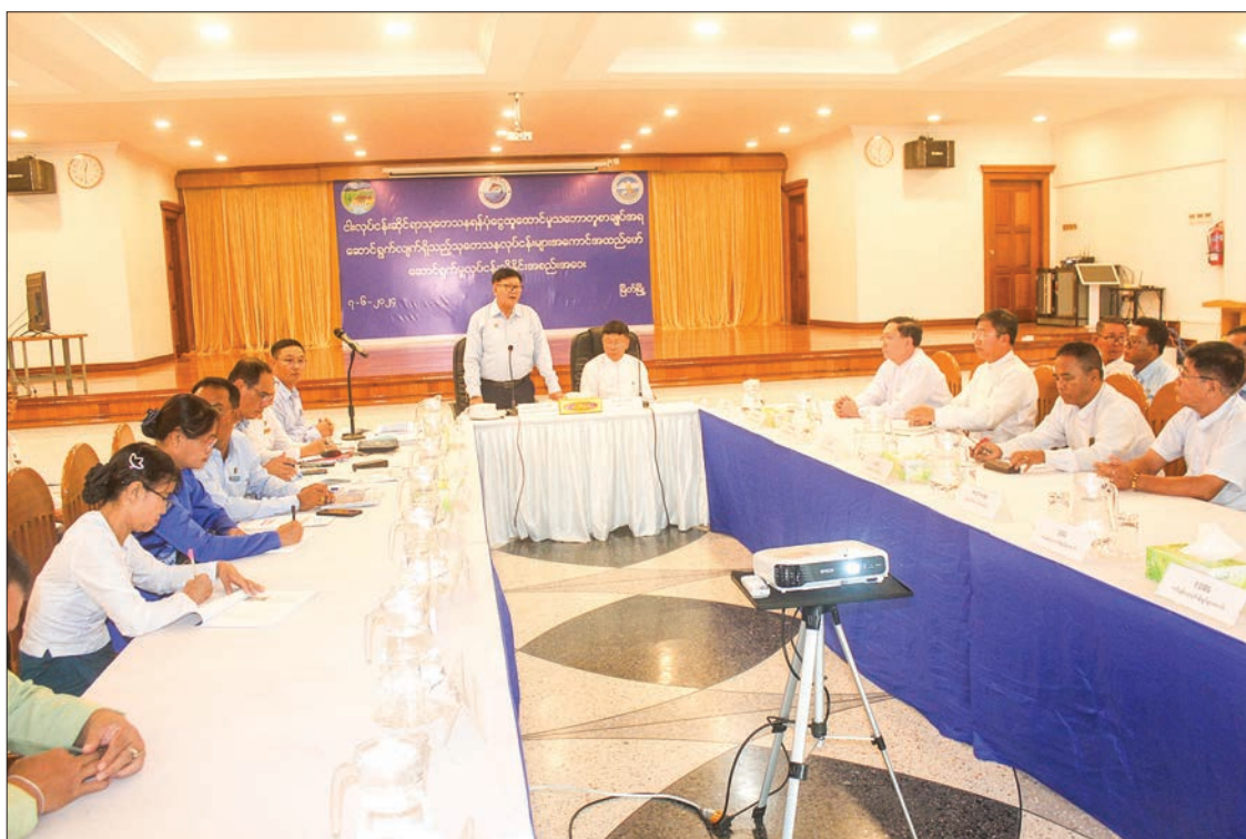
Deputy Minister for Agriculture, Livestock and Irrigation Dr Aung Gyi emphasizes research process to boost marine industry on 7 June.

The deputy minister mentioned that Myanmar ranks third globally in terms of mangrove coverage among 123 countries. Myeik District alone boasts over 300,000 acres of mangroves, making it the area with the highest mangrove concentration in Myanmar. Furthermore, the Taninthayi Region contributes 30 per cent