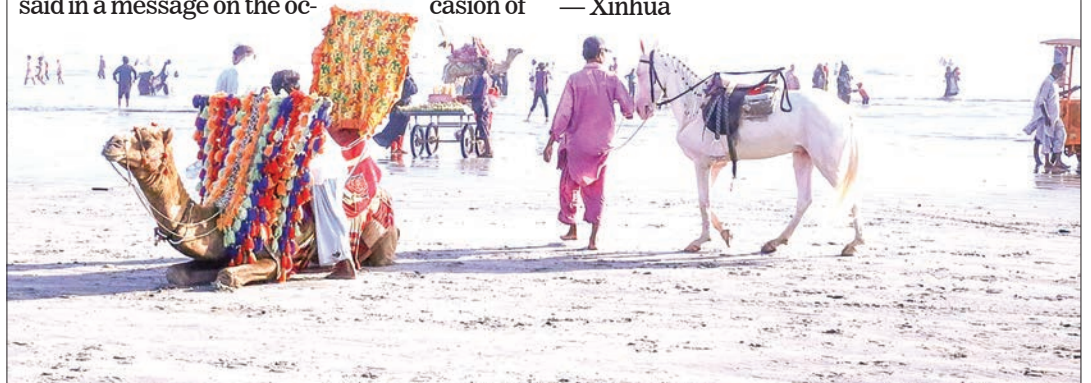
Karachi Beach is a popular tourist destination located in Karachi, Pakistan. It's renowned for its scenic beauty, sandy shores, and vibrant atmosphere. Tourists and visitors flock to Karachi Beach to enjoy a variety of activities and experiences.

As a coastal nation, she said Pakistan is committed to playing its part in advancing marine conservation efforts, adding that as a country with a rich maritime heritage, Pakistan recognizes the vital role that oceans play in supporting life on Earth, regulating climate, and providing resources that sustain livelihoods. — Xinhua