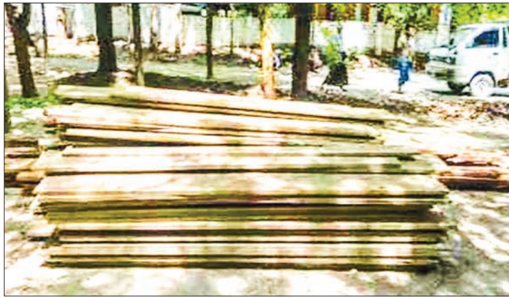
Confiscated sawn timbers in Sagaing Region.

On 7 June, the Mon State Illegal Trade Eradication Task Force conducted an inspection and found 1,050 kilogrammes of apples, 30 bags of 25 kilogrammes of Mingzhu wheat, and 1,000 gallons of liquid products