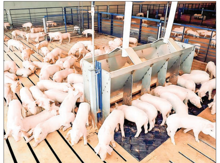
Pigs seen at a farm.

"We want the pig farming industry to develop. Now, some people have started pig farming and want to resume their pig farming," said a pig farmer in Bago Region.