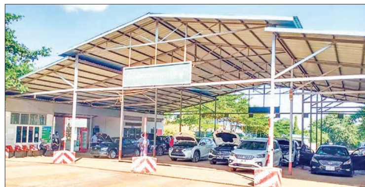
Vehicle Inspection Section of the Road Transport Administration Department.

These registrations cover a range of vehicles, including passenger vehicles, light trucks, heavy trucks, two-wheeled and three-wheeled vehicles, transporters, machinery, and others. — ASH/TMT