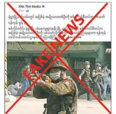
The screenshot validates false claims.

circulating fake news accusing the security forces and misleading the public about the security measures in the area and committing public panic.