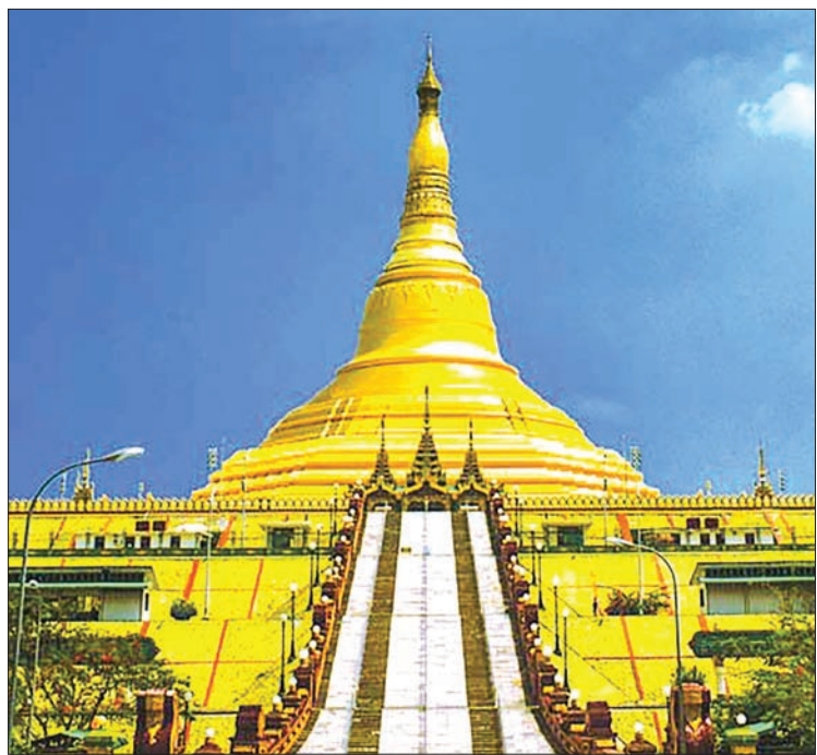
The Uppatasanti Pagoda.