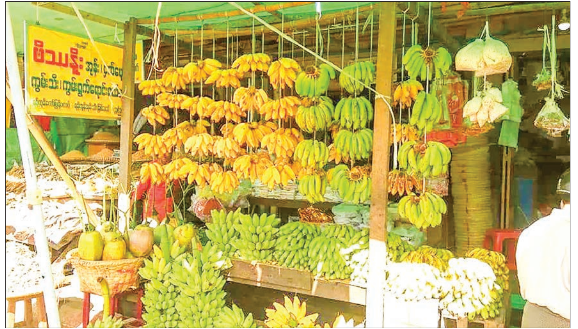
A banana shop.

“Pheegyan is the most consumed. Rakhine banana is only used for offering to Nat (spirit)