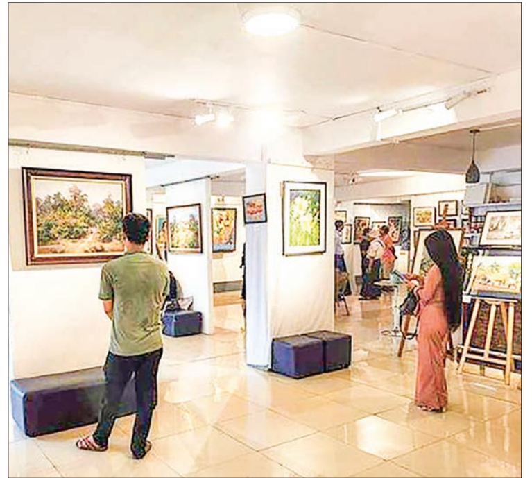
Some fans seen viewing paintings displayed in the exhibition with interest.

Myanmar’s manufacturing sector is primarily concentrated in garment and textiles produced on a Cutting, Making, and Packing basis, and it contributes to the country’s GDP to a certain extent. — MT/EM