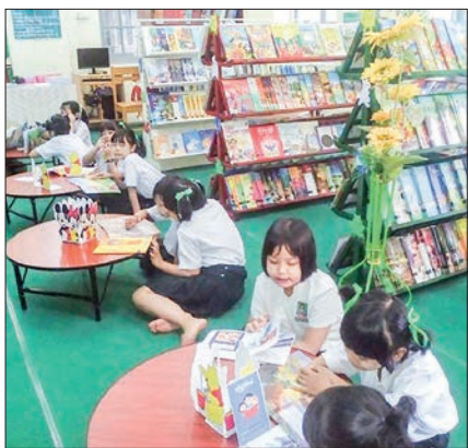
Students seen reading in a school library.

ACCORDING to the Ministry of Education, a designated reading period has been incorporated into the school timetables for this academic year and is currently being implemented.