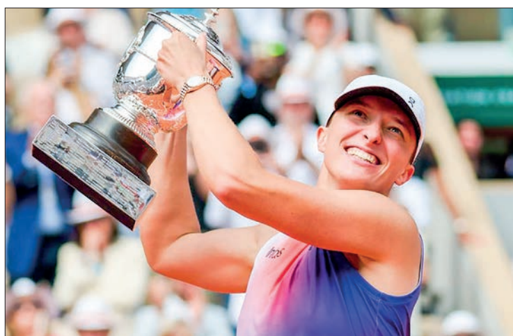
Iga Swiatek celebrates during the awarding ceremony after the women's singles final match between Iga Swiatek of Poland and Jasmine Paolini of Italy at the French Open tennis tournament at Roland Garros, Paris, France, 8 June 2024.

"I wanted to thank my family, my team. Honestly, so many difficulties in so many weeks," Swiatek said tearfully. Swiatek also recalled her second-round match against former world No.1 Naomi Osaka, where she saved a match point to over-