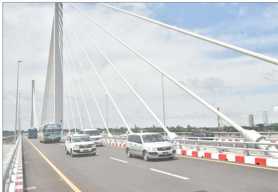
Photo shows vehicles rolling on new Thanlyin Bridge 3 across Bago river on 8 June.

The Senior General also inspected religious edifices on Thiri Mingala Kaba Aye Hill, the halls for stay of State Ovadacariya Sayadaws and members of the State Central Working Committee of the Sangha on Hanthathiri Hill, and improvement of roads and gave necessary guidance to officials. — MNA/TTA