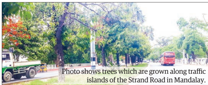
Photo shows trees which are grown along traffic islands of the Strand Road in Mandalay.