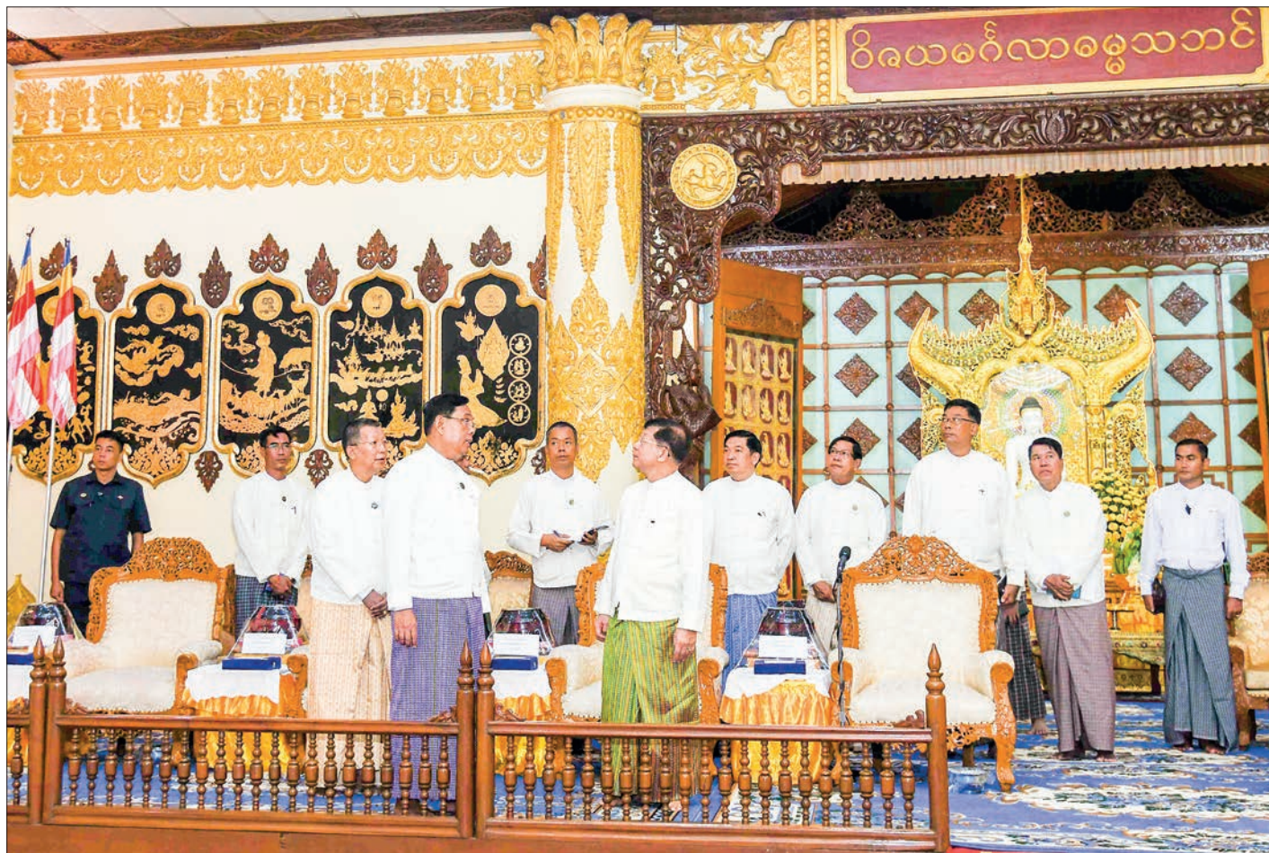
State Administration Council Chairman Prime Minister Senior General Min Aung Hlaing inspects religious edifices on Thiri Mingala Kaba Aye Hill and the halls for stay of State Ovadacariya Sayadaws yesterday.

He noted that a total of 720 stone plaque chamber pagodas were built, north of the Buddha, and all chambers accom-