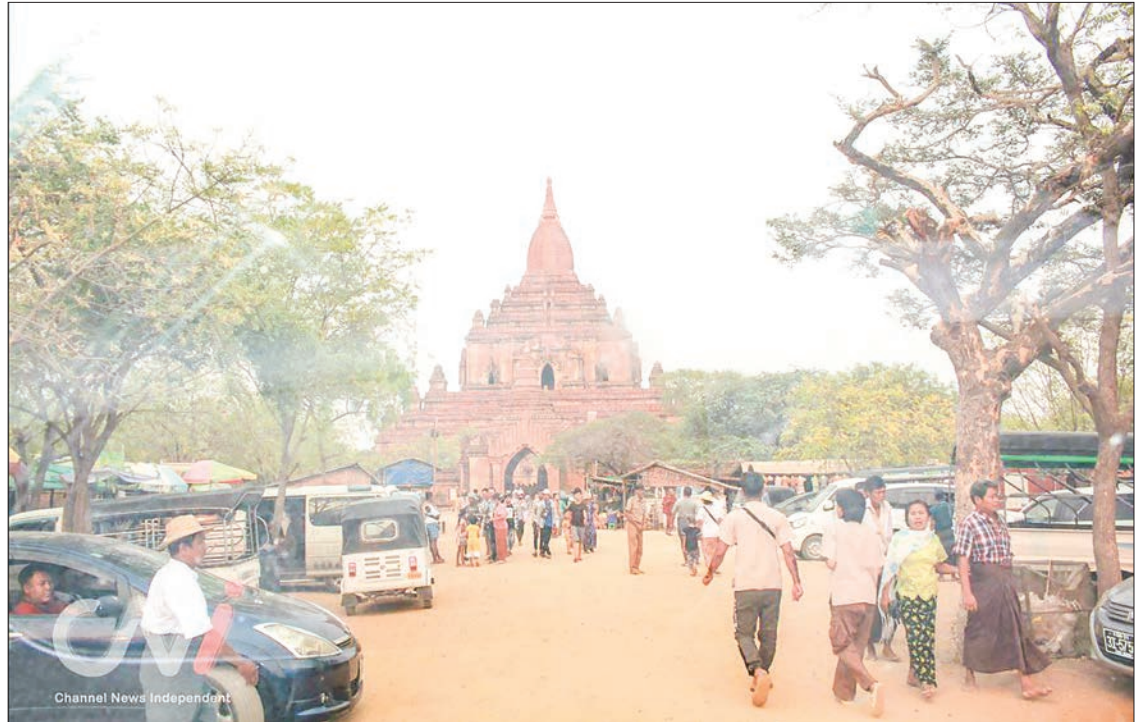
Local and foreign tourists are visiting Bagan.

There are still visitors in post-Thingyan period this year so hotels have still operated and some hotels have given discount, he said.