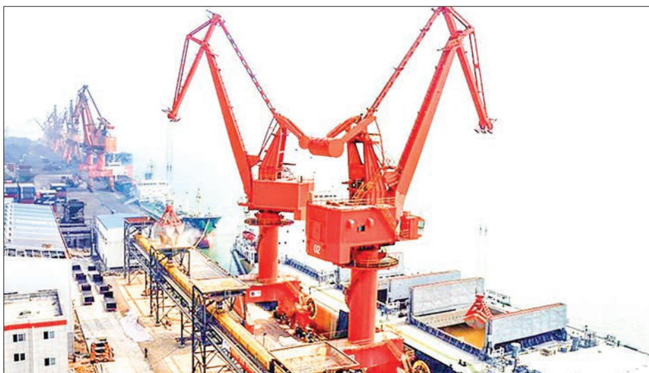
File photo shows the automated terminal handling equipment at a 50,000-tonne specialized wharf of Qinzhou Port in Qinzhou, south China's Guangxi Zhuang Autonomous Region.

From January to May, the country's foreign trade in goods stood at 17.5 trillion yuan (about US$2.46 trillion). Exports reached