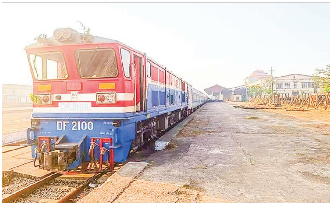
An express train seen at Mawlamyine railway station.