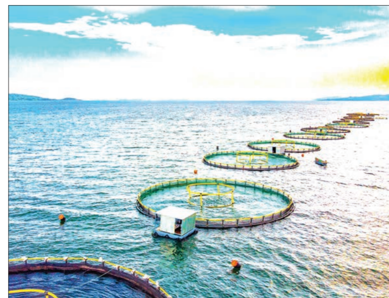
Fish farming near islands can be integrated with other aquaculture practices, such as seaweed farming or shellfish cultivation. This allows for the efficient use of resources and creates synergies between different components of the marine ecosystem.