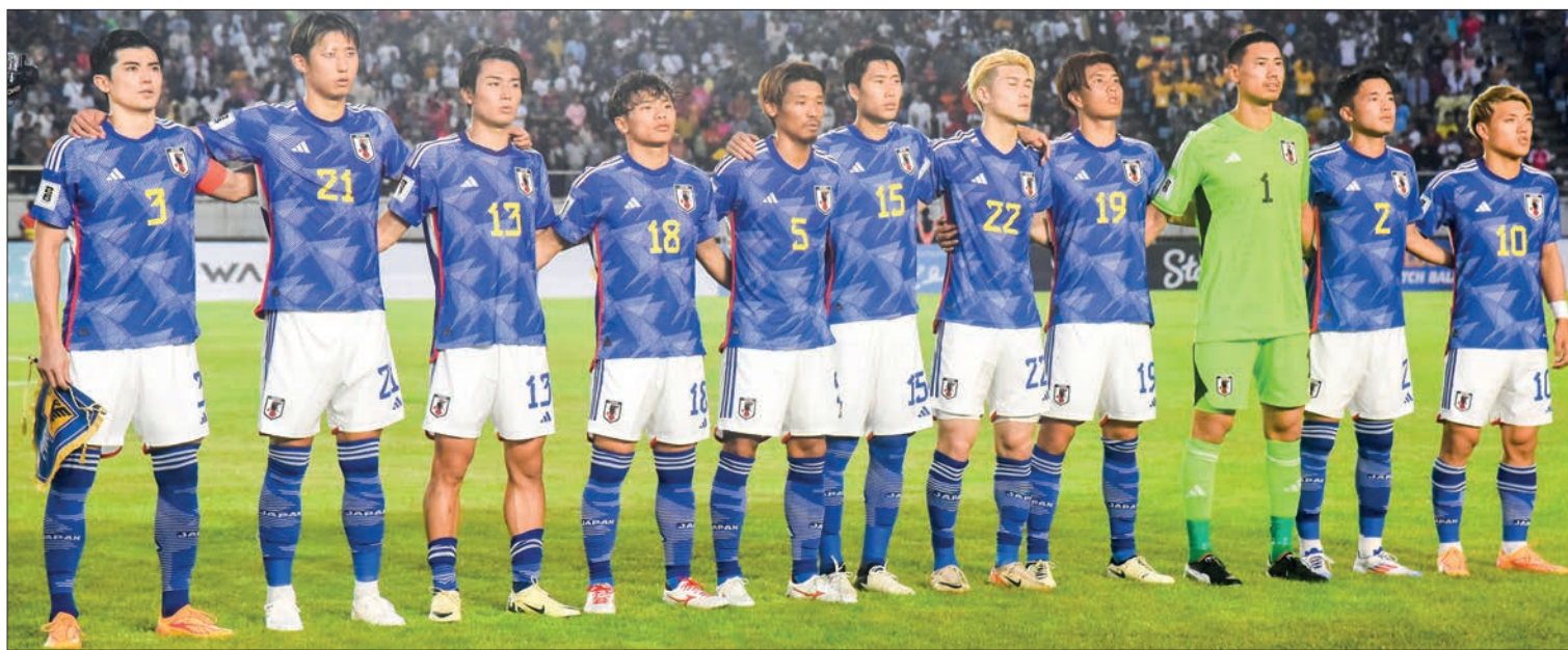
The Japanese team which has already advanced to the third round World Cup 2026 Qualifiers.

ONLY five teams are left to qualify for the next round of the 2026 World Cup Asian zone qualifiers.