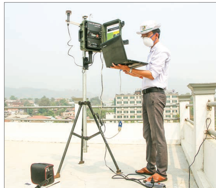
A staff check the air quality measurement machine and index.

The Environmental Conservation Department noted that test results were influenced by factors such as air temperature, wind speed, wind direction, humidity, rainfall, vehicle emissions, and industrial pollution, and therefore, air quality levels may fluctuate. — TWA/TMT