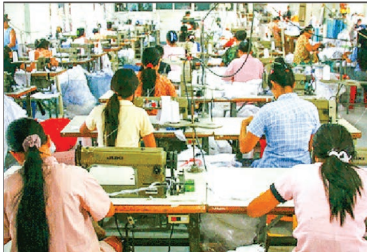
Female workers are seen running operations at a factory on a cutting, making, and packing basis.

MYANMAR garment manufacturers received growing foreign orders this year, a garment factory owner told The Global New Light of Myanmar (GNLM).