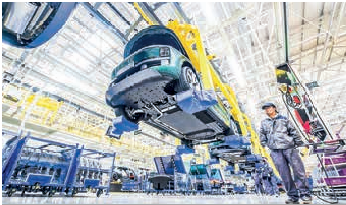
This photo taken on 15 February 2023 shows a workshop of Chinese electric vehicle (EV) maker Li Auto Inc in Changzhou, east China's Jiangsu Province.

The investigation is said to violate WTO rules as it prevented Chinese carmakers from participating, and Chinese industries vow to defend their rights under WTO regulations.