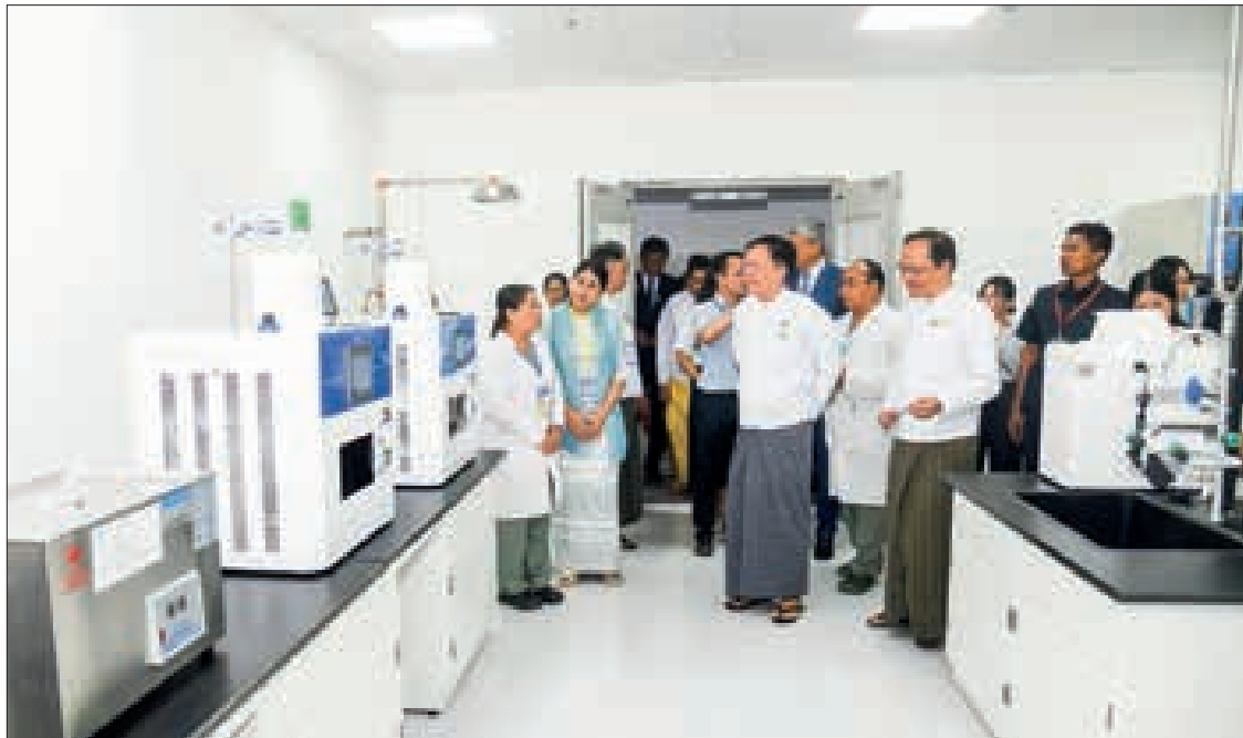
On behalf of the Chairman of the State Administration Council Prime Minister, State Administration Council Secretary Lt-Gen Aung Lin Dwe views round the Myanmar National Centre for Disease Control and Medical Training Centre in Nay Pyi Taw at yesterday’s opening event.

The world countries faced natural disasters and pandemics, and Myanmar also encountered the COVID-19 pandemic that started in December 2019 and Cyclone Mocha in May 2023.