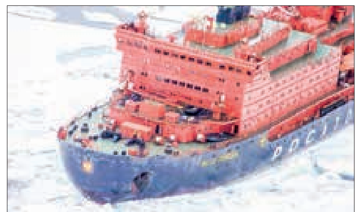
The Arctic Utrenneye port in Russia's Gydan Peninsula plays a vital role in the Northern Sea Route, serving as a key hub for shipping and energy exports, notably liquefied natural gas (LNG) from the nearby Yamal Peninsula. Its strategic positioning grants access to Arctic resources, bolstering Russia's influence in global energy markets.

"We don't see Canada as a threat there [Arctic], but obviously will have to take into account both a possible change in Ottawa's policy, as well as its coordination and joint planning with the US and within NATO in this regard," Stepanov said. "Obviously, if Trudeau's cabinet takes a confrontational stance versus Russia in the Arctic, it will be, first of all, detrimental to Canada's security." — SPUTNIK