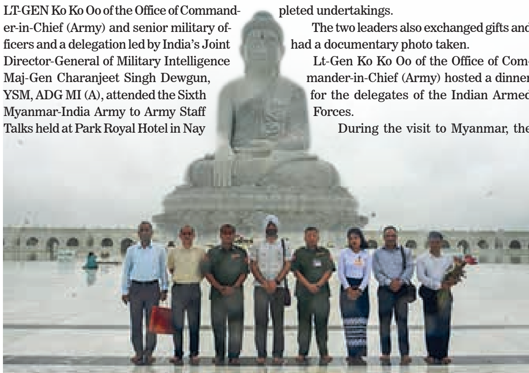
The Indian Army delegation visits the Maravijaya Buddha Image yesterday.