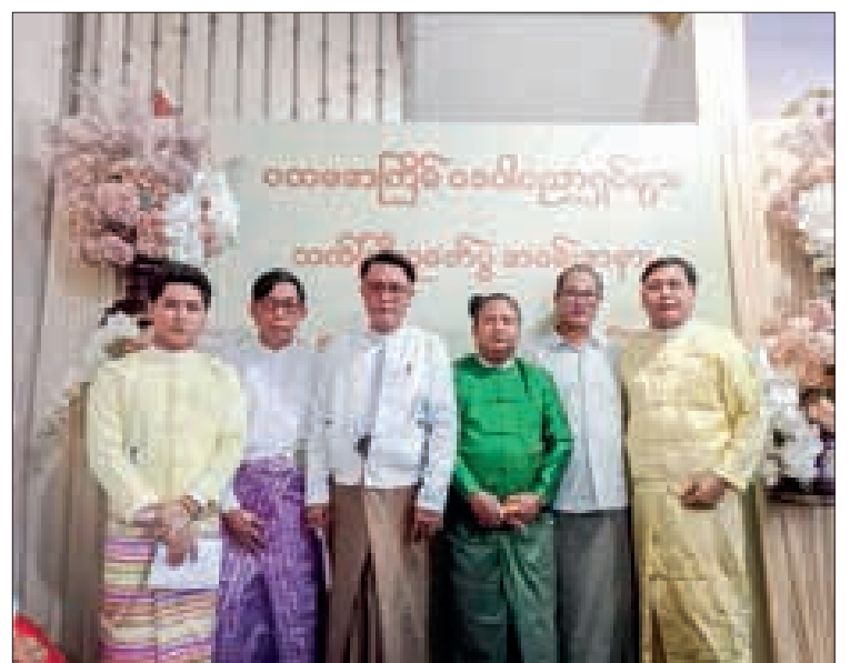
The photo shows the first ceremony of paying respect to elderly Deva experts.

Deva experts are spirit mediums who communicate with spirits (Nat). Since they used to work with a Myanmar traditional orchestra, they were classified under the dramatic arts and elderly spirit experts received obeisance along with other people from various dramatic arts. — Thit Taw/ZN