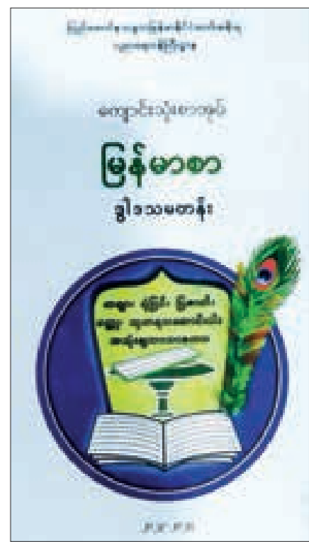
Grade-12 Myanmar Sar

In my article on English language texts in the GNLM, I suggested that a