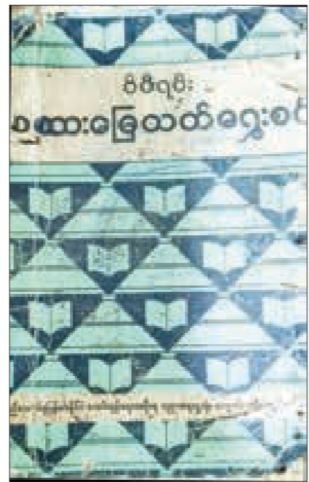
The Compulsory Burmese Prose Text