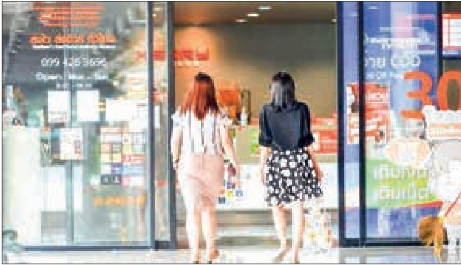
Two customers walk into an express service outlet in Bangkok, Thailand.

budget disbursement and the implementation of stimulus measures could restore consumer optimism in the second half of the year, he noted. — Xinhua