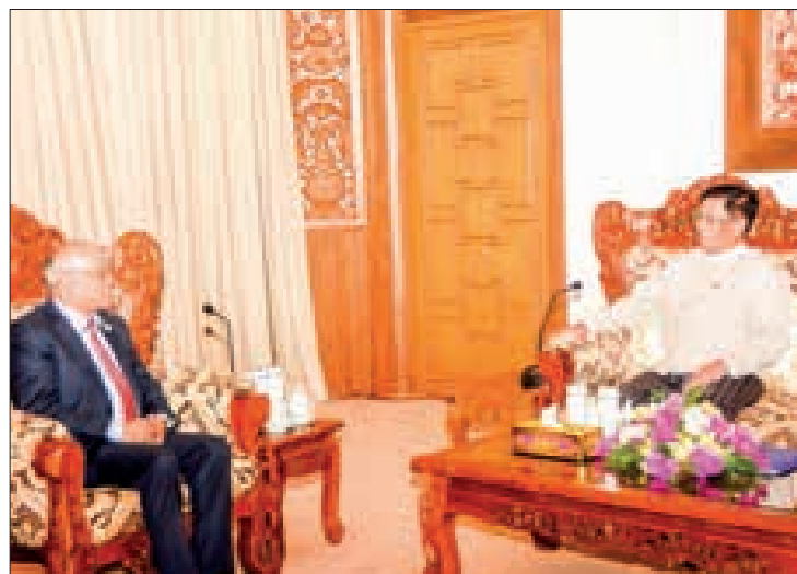
Deputy Prime Minister MoFA Union Minister U Than Swe receives Dr Md Monwar Hossain, Ambassador of Bangladesh, yesterday.

dially exchanged views on matters pertaining to the further consolidation of friendship and expansion of multi-sectoral cooperation between the two countries, continued collaboration to maintain peace and stability in the border area, as well as promotion of people-to-people exchanges between Myanmar and Bangladesh. — MNA