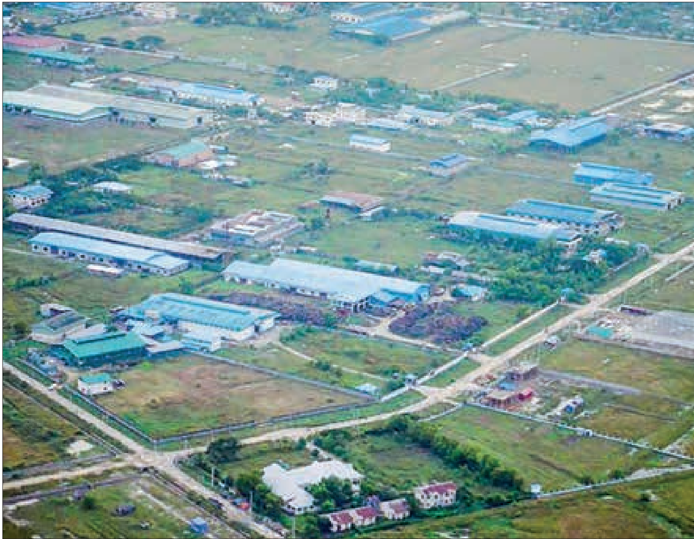
Aerial panorama of the Industrial Zone's promising areas.

Myanmar ships over 71,000 tonnes of rice to external markets in May