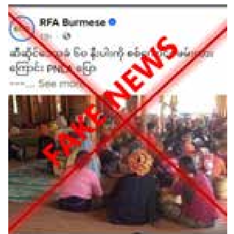
The screenshot shows fake claims of subversive media.

PNLA terrorists, disrupting their peaceful daily lives. Residents are known to be protesting against PNLA's terrorist actions, while subversive media outlets continue to circulate false claims to serve their propaganda purposes. — MNA/TRKM