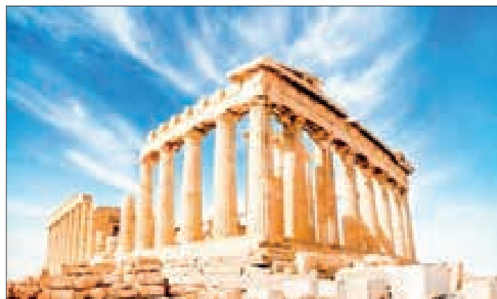
The UNESCO-listed archaeological site shut its doors from midday until 5:00 pm (0900 to 1400 GMT).

The heatwave, anticipated to be the earliest on record, prompted school closures and health warnings across the country.