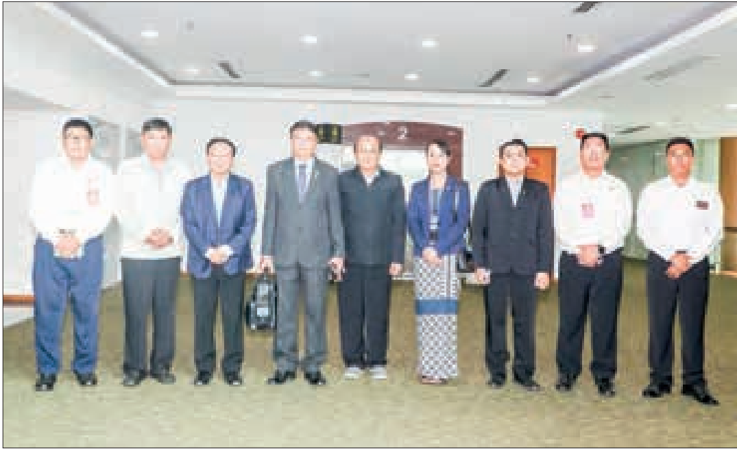
Union Minister U Min Thein Zan and delegation are seen before departing for Thailand.