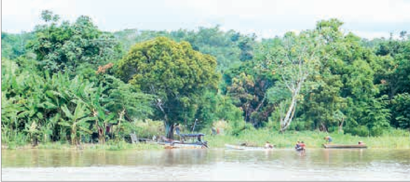
Deforestation in the Amazon rainforest decreased by 50% compared to 2022.