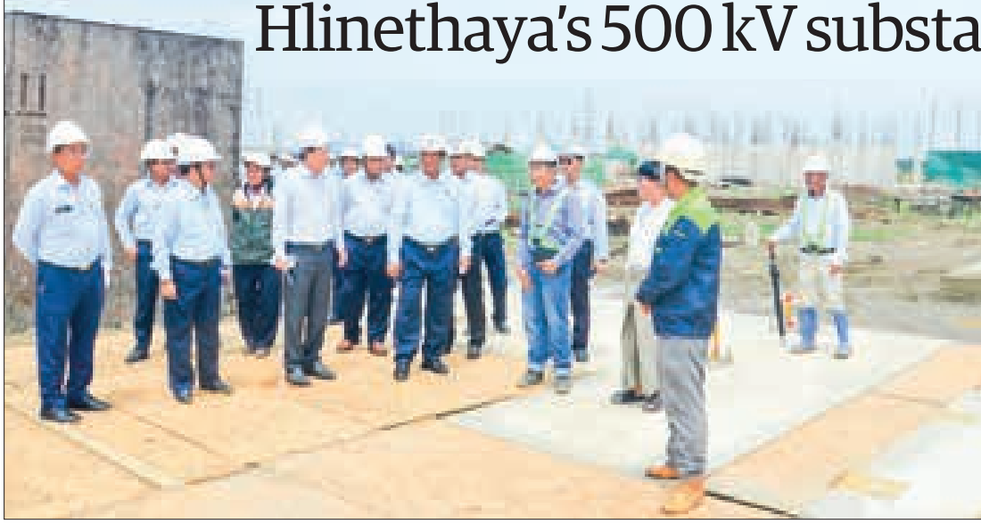
Union Minister for Electric Power U Nyan Tun, along with departmental officials, inspects the construction of the 500 kV Hlinethaya (Western University) substation in Yangon Region on 11 June 2024.

ACCORDING to the Yangon Region Electricity Transmission and Control Department, 75 per cent of the project to build a substation with a 500 kV system has been completed in Hlinethaya Township.