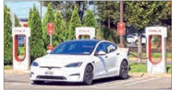
The package, valued at up to $56 billion, had been a focal point of Tesla's efforts to secure shareholder approval ahead of the company's annual meeting.