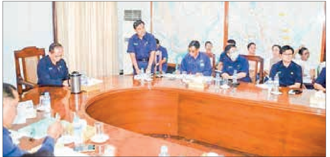
Officials of the Yangon City Development Committee and the Public Health Department are seen during a dengue prevention consultation.

ACCORDING to the dengue fever prevention coordination meeting of the Public Health Department under the Yangon City Development Committee (YCDC) held on 12 June, there were 377 dengue cases and one death between January and May 2024.