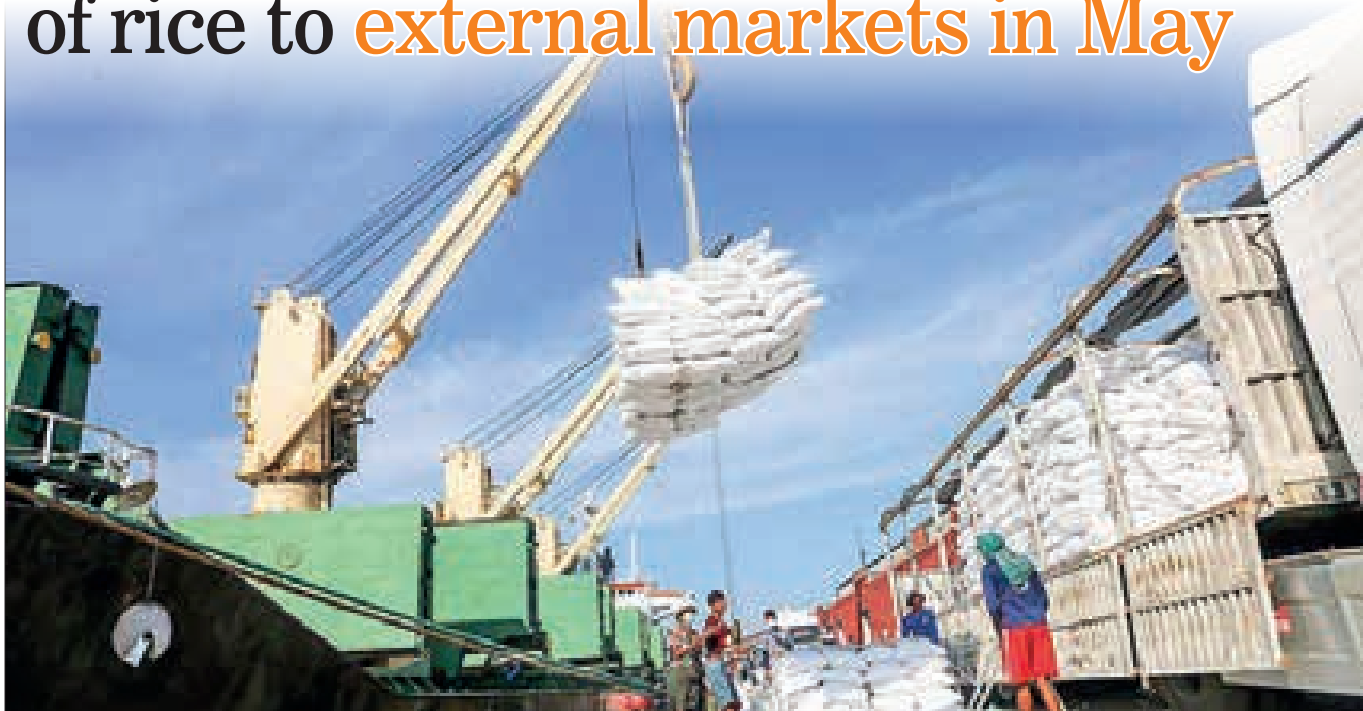
Export rice bags being loaded onto the overseas merchant vessel at Yangon Port.

MYANMAR'S rice and broken rice exports hit over 71,000 tonnes in May 2024, comprising over 70,751 tonnes by seaborne trade and 528 tonnes at the border, statistics released by the Myanmar Rice Federation (MRF) showed.