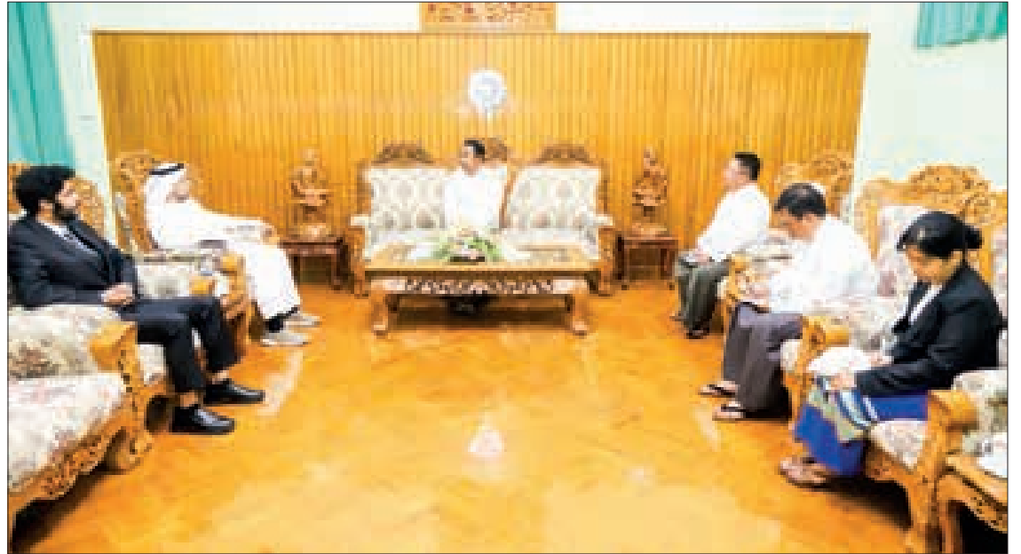
Union Minister U Myint Naung receives the UAE ambassador yesterday in Nay Pyi Taw.

They also addressed procedures for sending workers to countries with which Myanmar has signed MoU and those with which it has not, including the protection of over 4,000 Myanmar workers in the UAE. — MNA/KZL