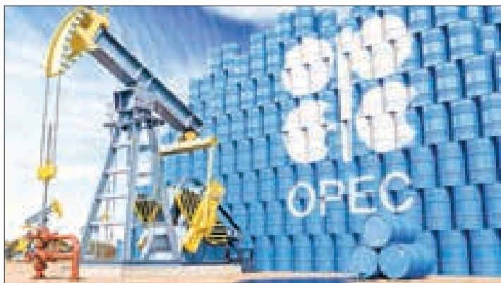
Global demand is expected to plateau at around 106 million barrels per day (bpd) by the end of the decade.

At the same time, oil production capacity appears set to surge, led by the United States and other countries in the Americas, leading to the forecast of an eight-million-barrel surplus — a level reached only during the Covid-19 lockdowns of 2020. — AFP