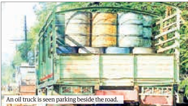
An oil truck is seen parking beside the road.

If violations of the traffic rules are found during inspections by such combined forces, a fine of up to K50,000 will be imposed, as stated by the Mandalay City Development Committee. — TWA/KZL