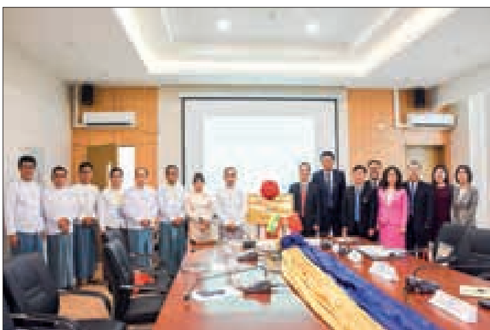
Officials from both sides pose for the group documentary photo at yesterday's MoU-signing ceremony.

Following the ceremony, it was reported that the 8 th Myanmar-China Bilateral Workshop on Infectious Diseases and Malaria Control proceeded as planned. — MNA/TKO