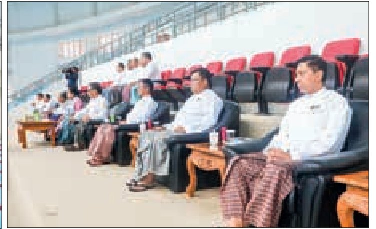
SAC members and dignitaries watch the final match of the 2024 ISR Swimming Championship yesterday.

team claimed third, respectively. In turn, the Yangon Region team won the women's 200-metre event while the Ayeyawady Region team earned the second and