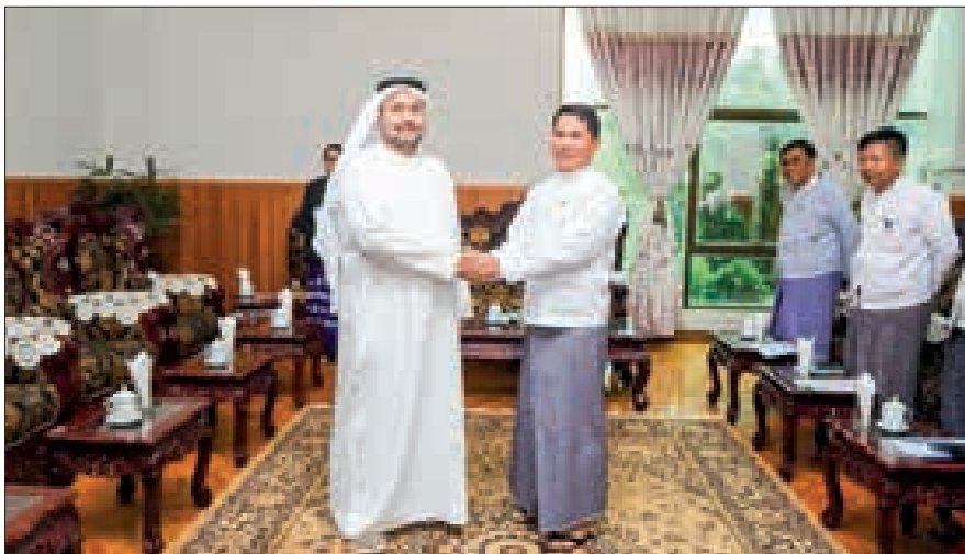
Union Minister U Min Naung shakes hands with the UAE ambassador yesterday.