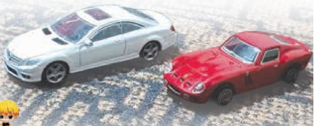
Japan's used toys and model cars.

These are good-quality toys, and even if some have errors, they have buyers. The price of new toys is high, but used toys are cheaper and of good quality. There are model car collectors, and some buy them because they enjoy