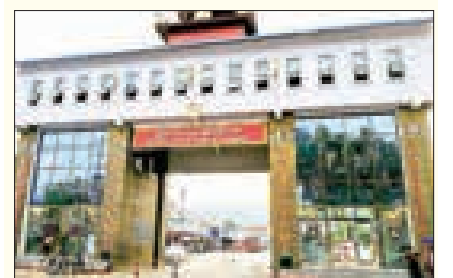
The Lweje border trade post: A hub for export and import trade activities on the Myanmar-China border.

Myanmar conducts cross-border trade with neighbouring China via Muse, Lweje, Chinshwehaw, Kampaiti, and Kengtung. The Muse border registered the highest trade figure of $215.668 million. The trade values stood at $92.796 million via Kampaiti, $1.214 million via Lweje and $107.189 million via Kengtung. Myanmar has been carrying out border trade with the four neighbouring countries – China, Thailand, Bangladesh and India. Export items are agricultural produce, livestock products, fisheries products, minerals, forest products, manufacturing goods and other goods. Myanmar imports capital goods, intermediate goods, manufacturing goods and raw materials for CMP enterprises. — NN/KK