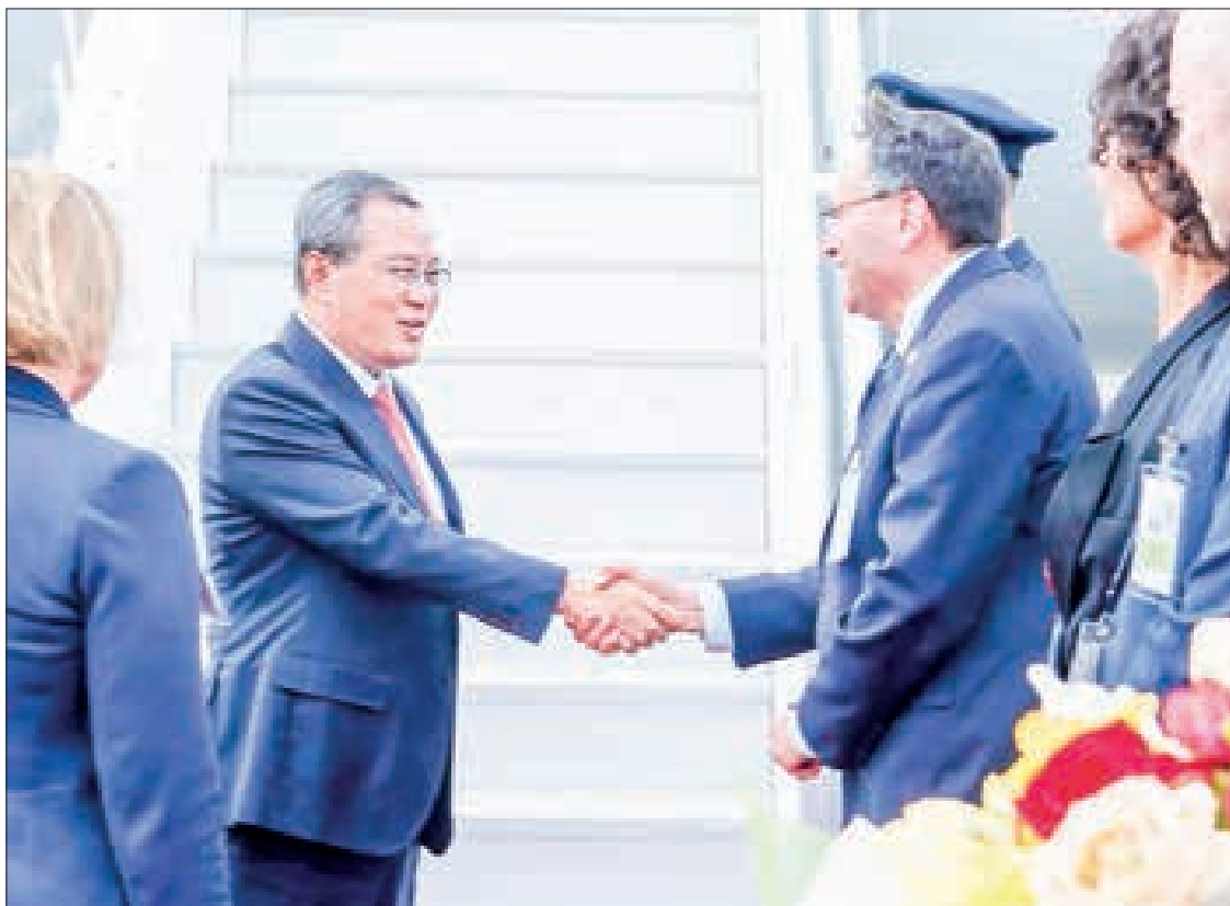
Chinese Premier Li Qiang arrives in Wellington, New Zealand, 13 June 2024 for an official visit to New Zealand. Li will also pay official visits to Australia and Malaysia, and will co-chair the ninth China-Australia Annual Leaders' Meeting with Australian Prime Minister Anthony Albanese.

Li highlighted the 10 th anniversary of President Xi Jinping's visit to New Zealand and the establishment of the China-New Zealand comprehensive strategic partnership.