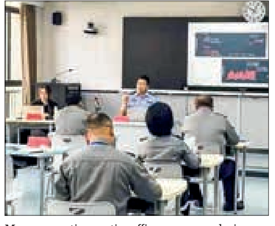
Myanmar anti-narcotics officers are seen during the training course on drug prevention and control conducted by the Yunnan Police College.

During the course, the trainees visited the drug prevention and control centres of the Public Security Department in Yunnan and Guizhou Provinces and had an exchange of work experience. They also visited a drug inspection station in Yuxi, Qinglongchang, Yunnan Province and