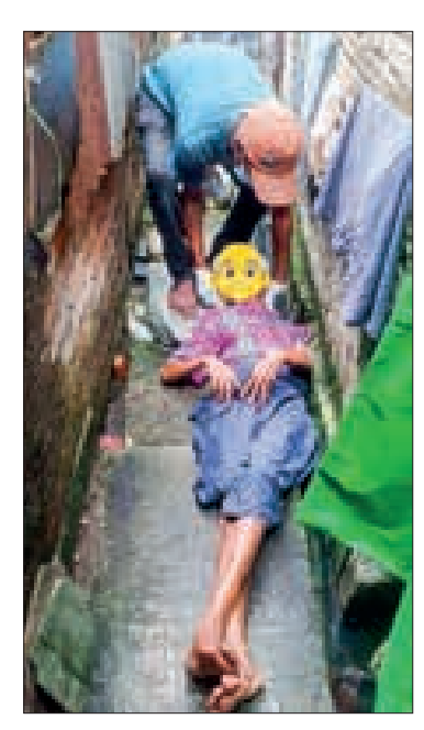
A man abandoned by a roadside.

"Most of the men, aged between 30 and 50, had problems with alcoholism. And some of them had TB, AIDS or asthma. As these chronic diseases are a huge burden on their families, they were found to be abandoned," she explained.