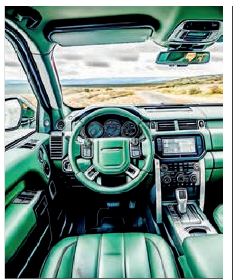
The emphasis on cybersecurity reflects broader industry trends where the integration of digital technology in vehicles (such as connected cars and autonomous vehicles) has heightened concerns about vulnerabilities to SOURCE: ANI cyber attacks. ILLUSTRATION: PIX FOR VISUAL PURPOSE/PIXABAY

Automotive manufacturers are focusing on strategies that prioritize workforce retention, upskilling, and engagement. Technologies such as smart manufacturing and automation, which complement and augment the value brought by their employees, are key to driving positive business outcomes.