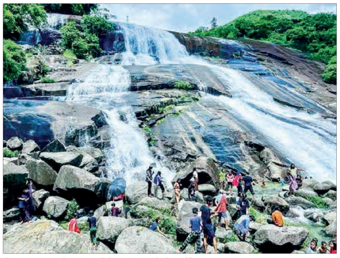
The image captures people recreating and taking vacation at Zinkyaik Waterfall in Mon State.

Qualified applicants to draw lots for Thilawa and Kanaung Housings