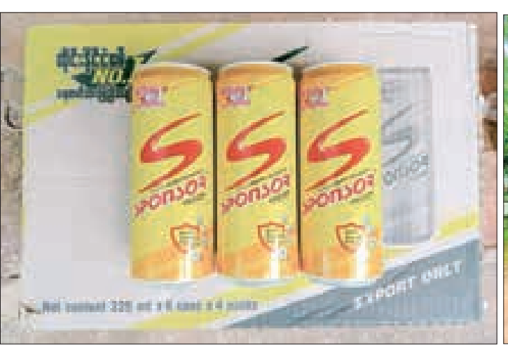
Confiscated Sponsor soft drink cans in Shan State and a vehicle in Mon State.

and 19 June, the combined teams captured six kinds of medicines worth K287,500, including ten boxes of Ventolin without Myanmar drug registration number, in Mingala Taungnyunt town-