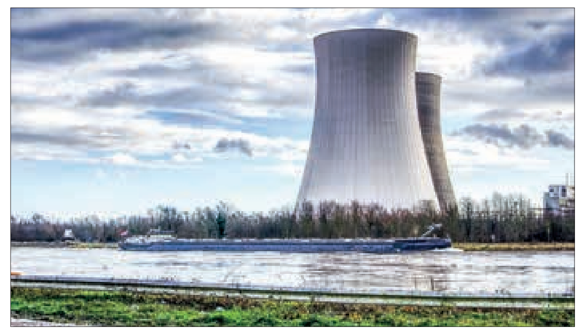
Australia's conservative opposition, led by Peter Dutton, has unveiled plans to construct nuclear power plants nationwide if they win the upcoming election.

Dutton framed the impending election as a "referendum on nuclear", criticizing current renewable energy scaling policies as insufficient and unreliable.