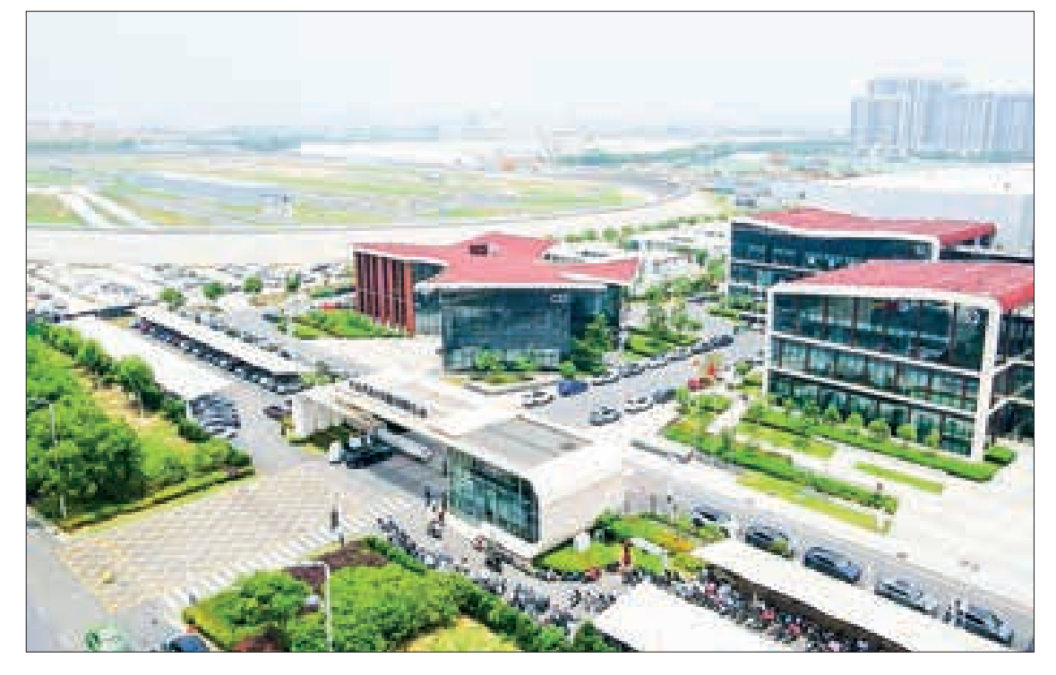
The photo taken on 7 June 2024 shows an exterior view of Volkswagen (Anhui) Automotive Company Limited in Hefei, east China's Anhui Province.

Disregarding facts and rules and preconceiving outcomes, the