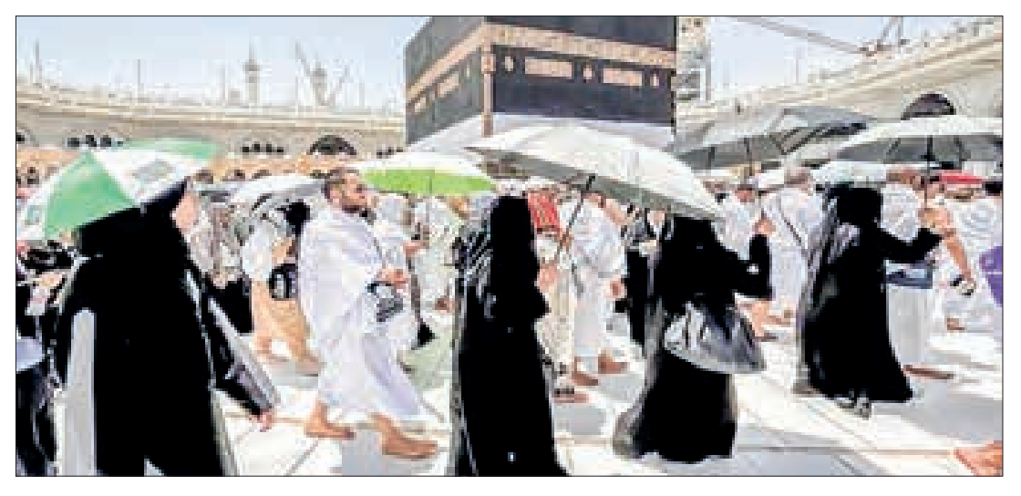
Egypt's foreign ministry confirmed efforts with Saudi authorities to locate missing Egyptian pilgrims amidst the tragic events.

The pilgrimage was once again marked by intense heat, contributing to most of the deaths among Egyptians.