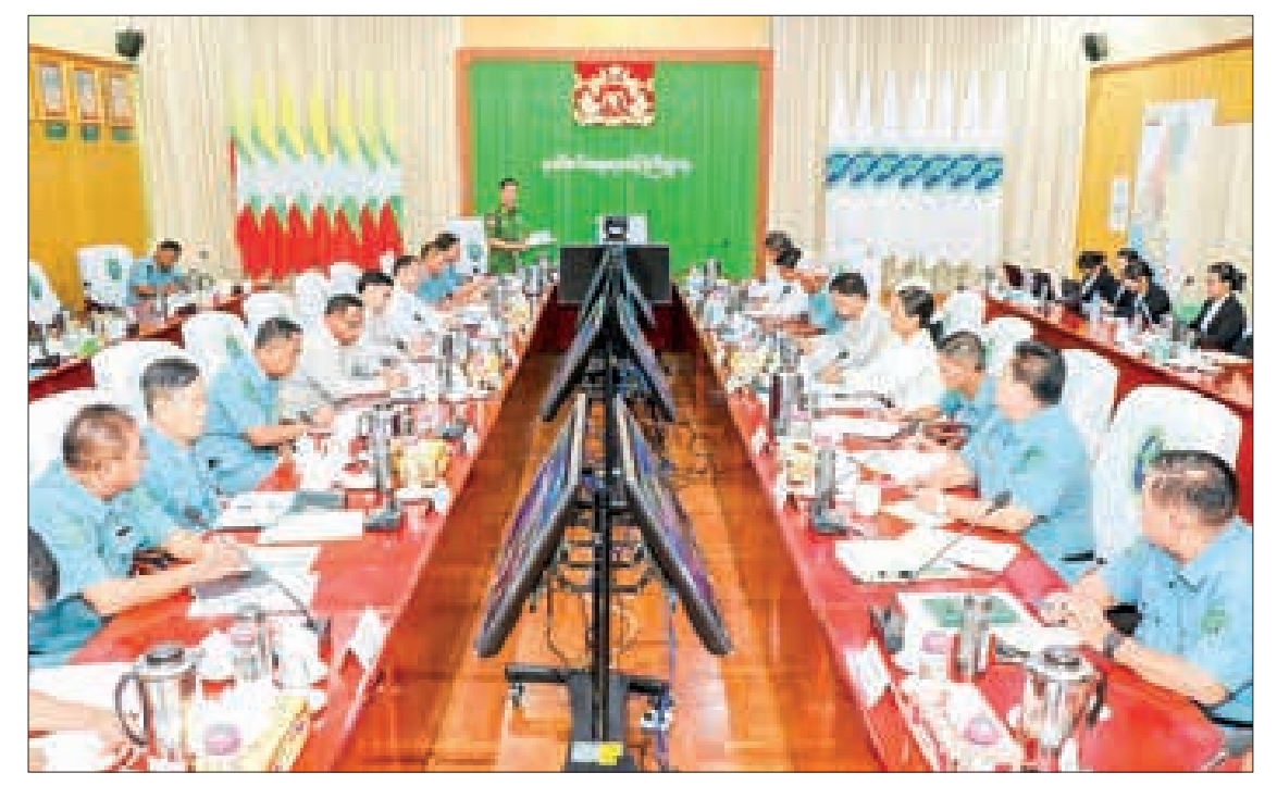
The meeting 1/2024 of Road, Bridge, and Building Development Working Subcommittee on the development of border regions and ethnic communities in progress yesterday.

THE Road, Bridge, and Building Development Working Subcommittee held its first coordination meeting 2024 at the Union Minister's Office of the Ministry of Border Affairs on 18 June 2024. The meeting focused on the development of border regions and ethnic communities.