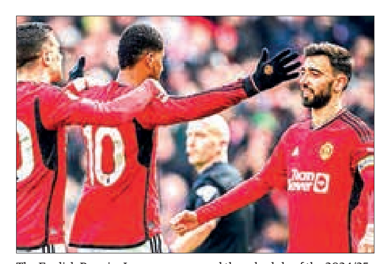
The English Premier League announced the schedule of the 2024/25 campaign where Manchester United will be locking horns against Fulham in the opening game of the competition on Friday, 16 August.

THE English Premier League announced the schedule of the 2024/25 campaign where Manchester United will be locking horns against Fulham in the opening game of the competition on Friday, 16 August.