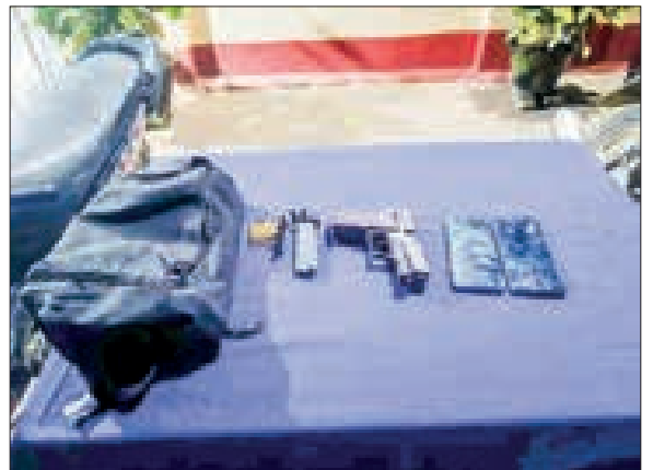
The photos show bank notes robbed by four terrorists and handphones, pistol and bullets used by terrorists during the robbery of the KBZ Bank in Sagaing.

FOUR terrorists (under verification) arrived at the Sagaing KBZ Bank 1 by two motorbikes and robbed the bank in Pabedan