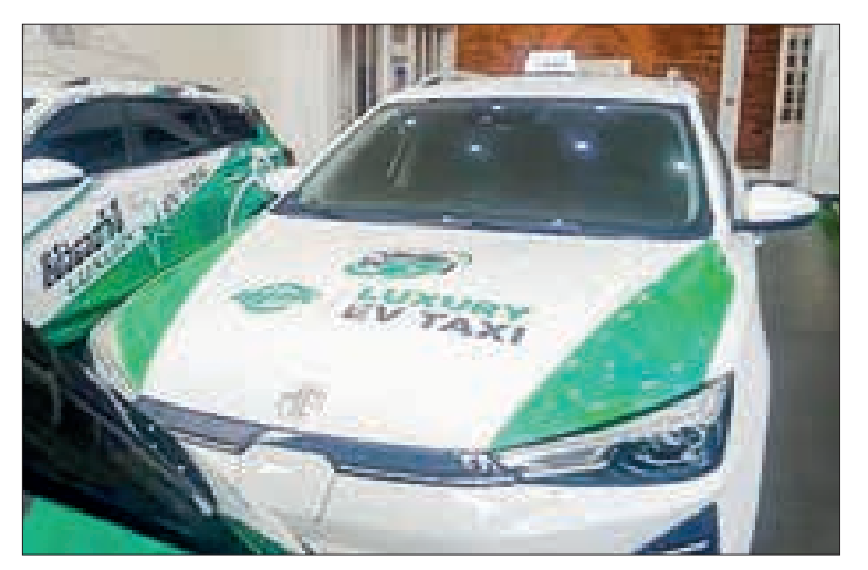
The photo shows luxury EV taxis running in Yangon Region.

LUXURY electric vehicle (EV) taxis operating in downtown areas of Yangon will see an increase to 250, as announced by luxury EV taxi service providers.