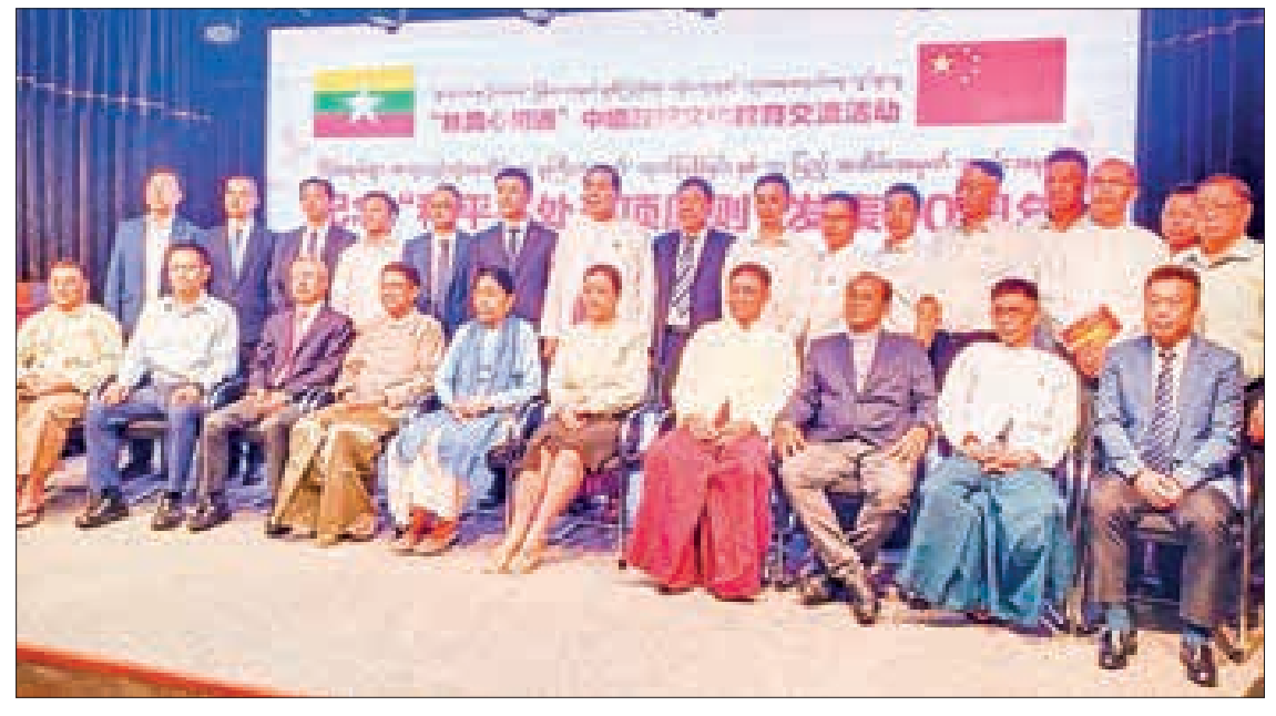
The photo shows the celebration of the 70^{\rm th} Anniversary of the Initiation of the Five Principles of Peaceful Coexistence by China-Myanmar civil societies.

tries signed the Five Principles on 29 June 1954 in Yangon. "In April 1955, these principles were endorsed at the Asia-Africa Summit (Bandung Conference) in Indonesia. Many nations embraced them and subsequently became funda-