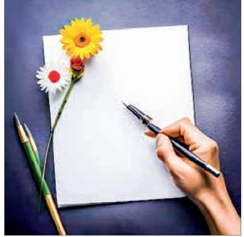
In contemporary poetry, there has been a noticeable shift in style and preference compared to earlier periods.

That is why, both quality and quantity are vital in workforce evaluation. Quality focuses on the excellence and distinctive attributes of work, while quantity measures the volume or amount. Effective management and leadership play a crucial role in enhancing both aspects, leading to the success of organizations and the development of nations. Qualified individuals, whether in businesses or in society at large, are fundamental to achieving long-term progress and prosperity.