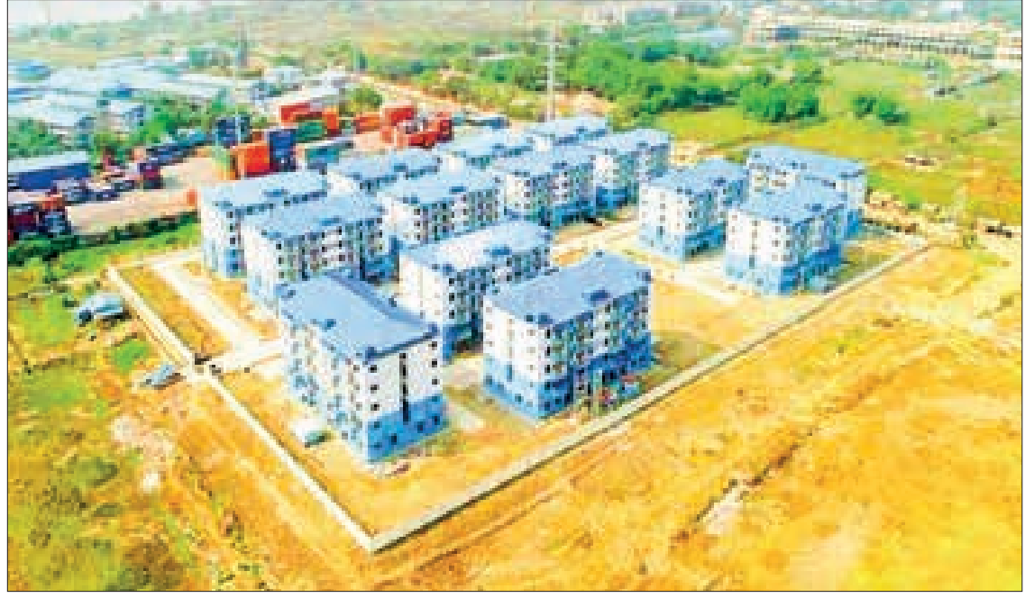
One of the Public Rental Housing projects in Yangon Region.

There are 463 applicants for 150 apartment units in three