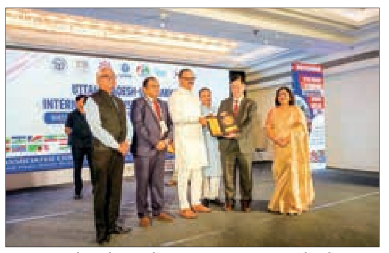
Myanmar Ambassador to India U Moe Kyaw Aung was with Indian businesspeople.

Mr Keshav Prasad Maurya, Deputy Chief Minister of Uttar Pradesh, participated as a special guest, joining approximately 1,500 invited guests including ambassadors, chargé d'affaires, diplomats from forty countries, government officials, and businessmen. — ASH/TMT