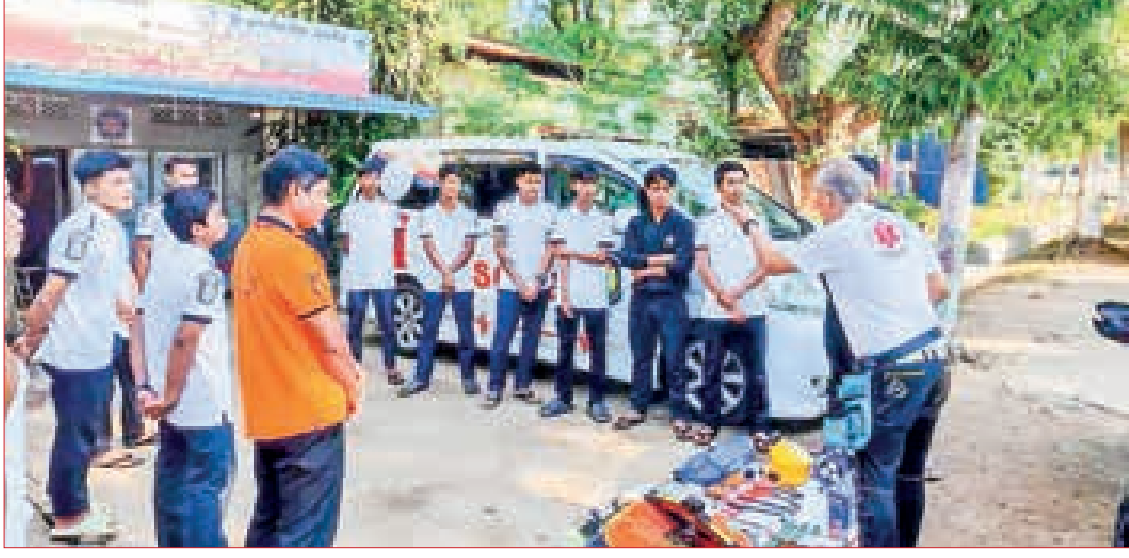
A person trapped in a car accident is rescued using extrication equipment. The various uses of this equipment are also discussed.

Previously, he travelled around Myanmar to train in patient rescue and transport and found that people trapped in an accident could die due to delays in the authorities arriving to help, so he has been donating such equipment and giving training on how to use