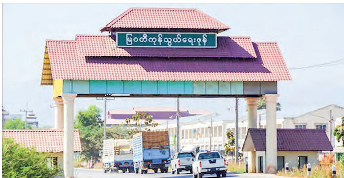
The general view of the Myawady Trade Zone on the Myanmar-Thai border.

The Myawady border saw exports of 230.605 tonnes of dried chilli pepper worth $0.376 million, 740.2 tonnes of onion worth $0.373 million, 241 tonnes of dried cassava worth $0.034 million, 20 tonnes of tamarind worth $0.005 million and 10.5 tonnes of turmeric worth $0.002 million in the second week of June. Meanwhile, Myanmar imports plastic goods ($0.111 million), construction goods ($0.058 million), food products ($0.054 million), cotton ($0.050 million), electronic devices ($0.038 million), zinc sheets ($0.016 million), iron and steel products ($0.011 million), lace fabric ($0.007 million), bicycle