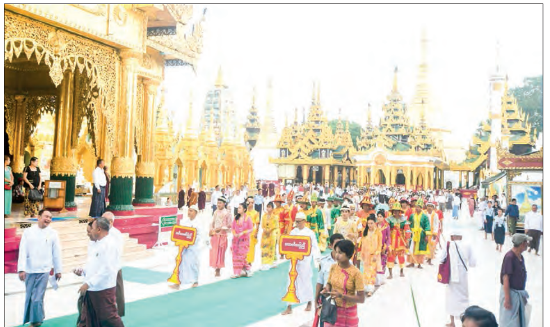
Photos above and below show devotees holding the Maha Samaya Day celebrations yesterday.

They also grew Ceylon ironwood saplings at designated places to mark the 10 th International Day of Yoga.