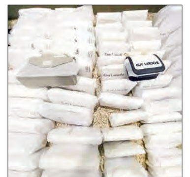
Confiscated illegal items in different regions and states.

procedures and the Export and Import Law.