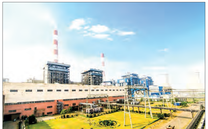
The thermal power plant in India contributes significantly to electricity generation nationwide.

Coal India Limited (CIL) has recorded coal production of 160.25 MT, growing by 7.28 per cent compared to the corresponding period last year, which stood at 149.38 MT. Similarly, coal production from captive and commercial mines reached 33 MT, with a growth of 27 per cent compared to the corresponding period last year. — ANI