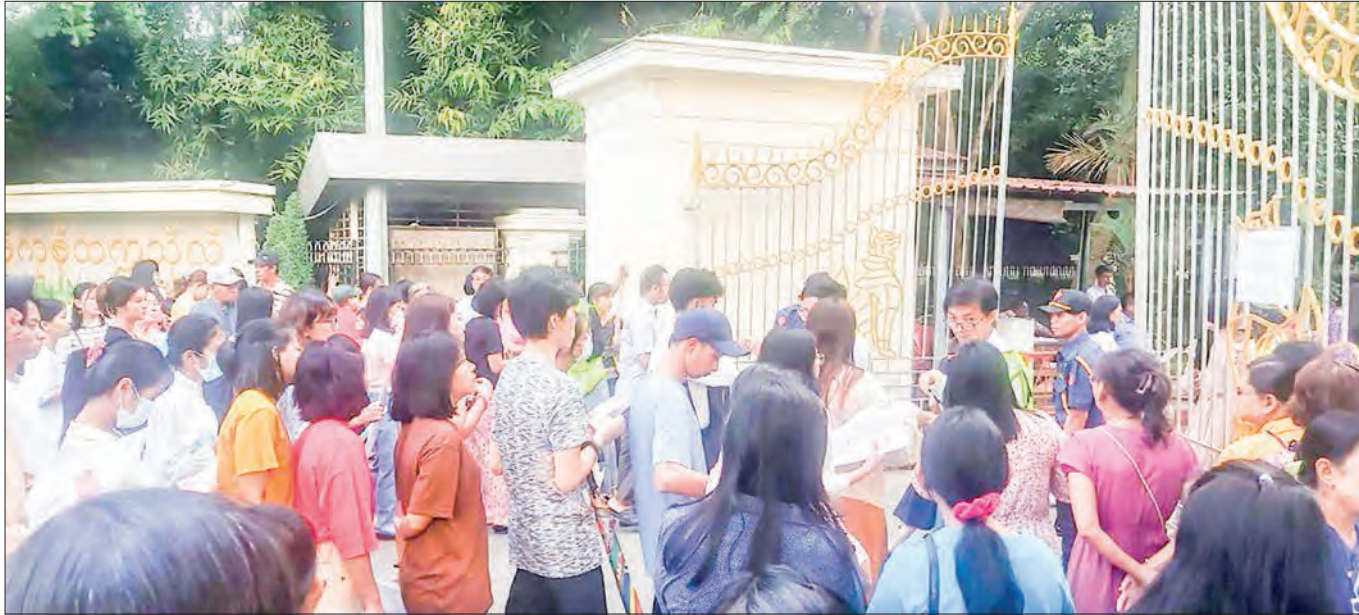
Applicants for JLPT 2024.

AN announcement on dos and don'ts for the Japanese Language Proficiency Test 2024, which will take place soon, was released on 21 June by the JLPT organizing committee, Myanmar Association of Japan Alumni.