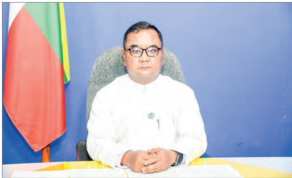
SAC's Information Team Leader Maj-Gen Zaw Min Tun.