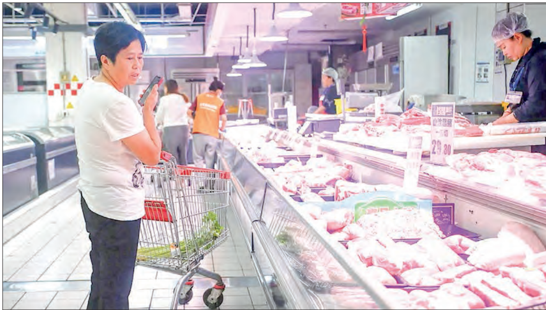
A customer selects pork products at a supermarket in Beijing in June 2024.

This decision aims to address concerns over alleged dumping practices in the pork trade between China and the EU.