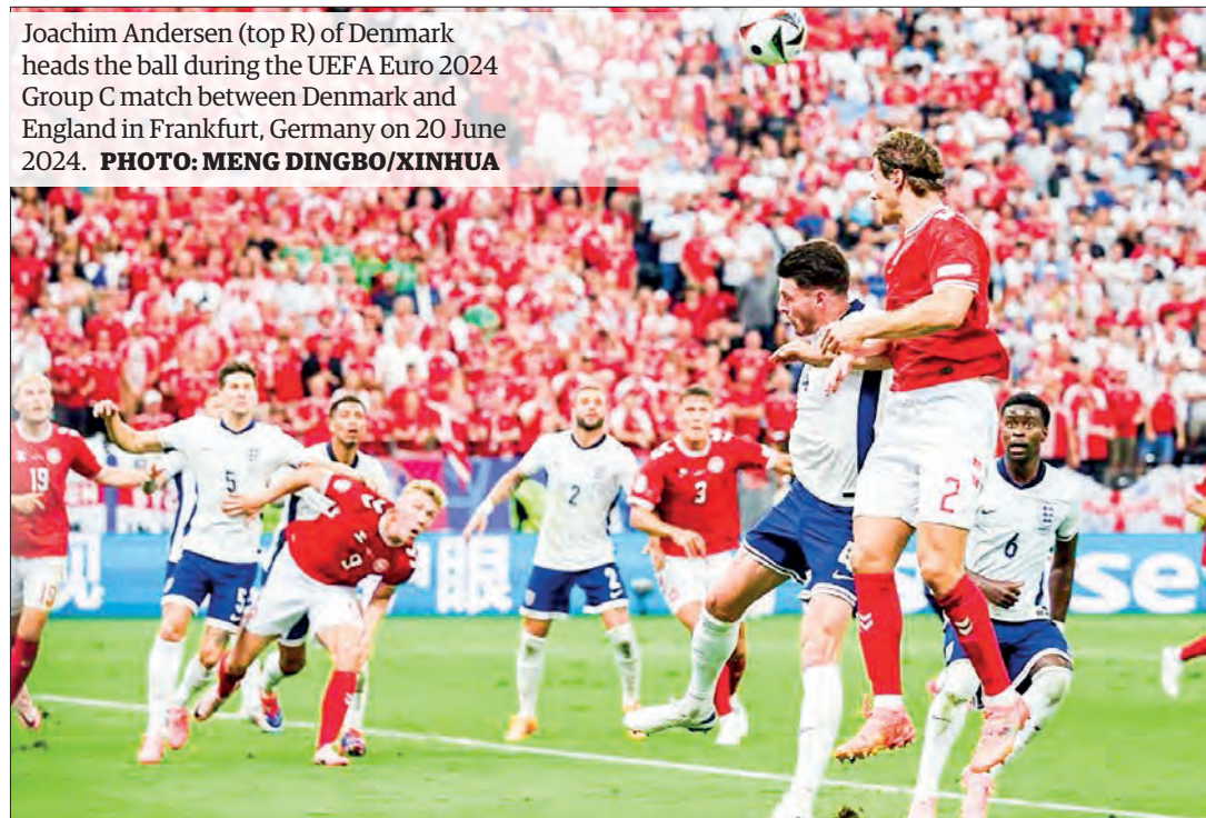
Joachim Andersen (top R) of Denmark heads the ball during the UEFA Euro 2024 Group C match between Denmark and England in Frankfurt, Germany on 20 June 2024.

The game between England and Denmark unfolded at a packed Deutsche Bank Park in Frankfurt, where England took control early on, pressing Denmark onto the defensive.