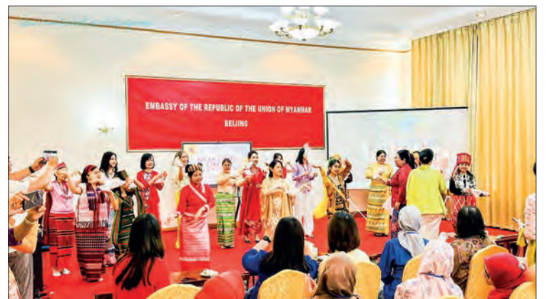
The image showcases an event called the Tea Gathering meeting being organized by the ASEAN Ladies Circle-Beijing in Beijing, China.

At the meeting, staff members from the Myanmar Embassy and students wore traditional cultural dresses representing their ethnic groups and performed the song 'A Song for Unity'. — ASH/MKKS