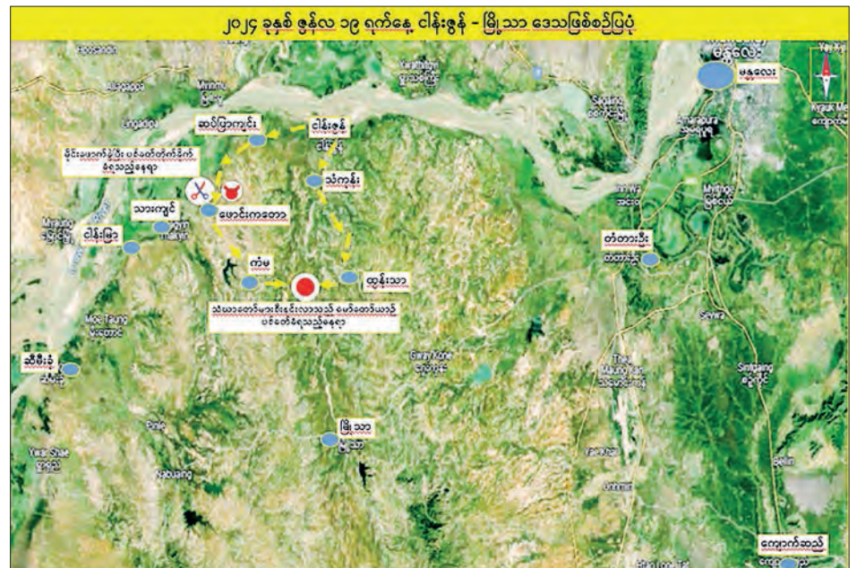
The incident location map in Ngazun-Myotha on 19 June 2024.