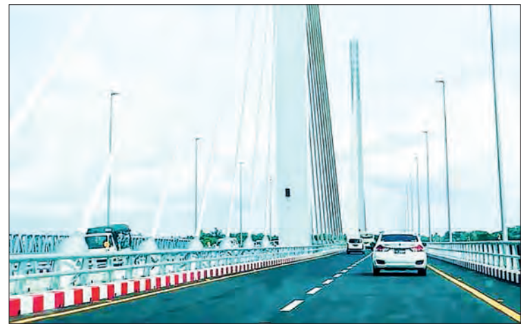
Some vehicles are seen crossing the Thanlyin Bridge 3.