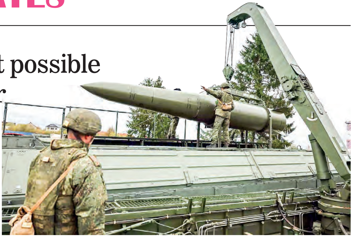
The Iskander-M missile system represents a significant component of Russia's military modernization efforts, providing it with enhanced capabilities for both conventional and nuclear deterrence, as well as for tactical and strategic operations.

Putin delivered these remarks on 21 June at a press conference held during his visit to Vietnam. The Russian president arrived in Hanoi on 19 June upon the conclusion of his trip to North Korea. — SPUTNIK