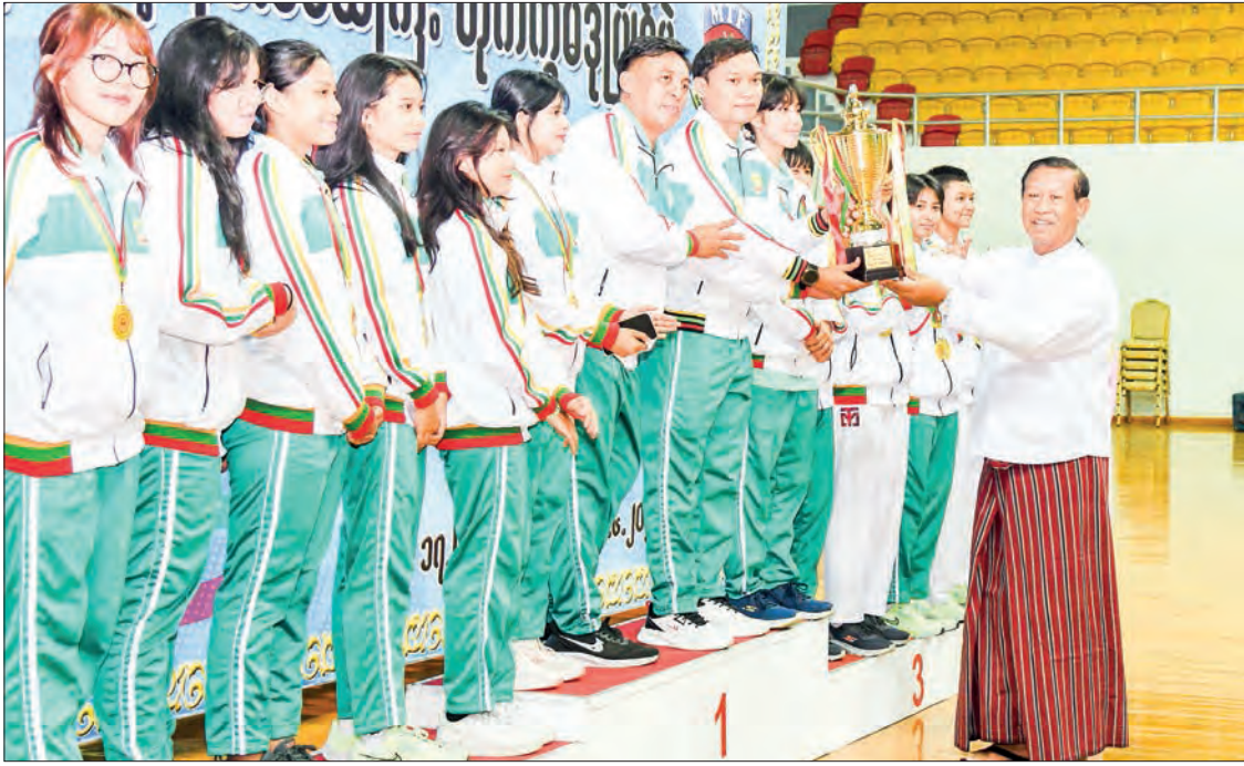
The championship trophy is presented at yesterday's awarding ceremony in Nay Pyi Taw.

FINAL matches plus the awarding ceremony of the 2024 Inter-State/Region Taekwondo Championship was held at Wunna Theikdhi Gymnasium A in Nay Pyi Taw yesterday.