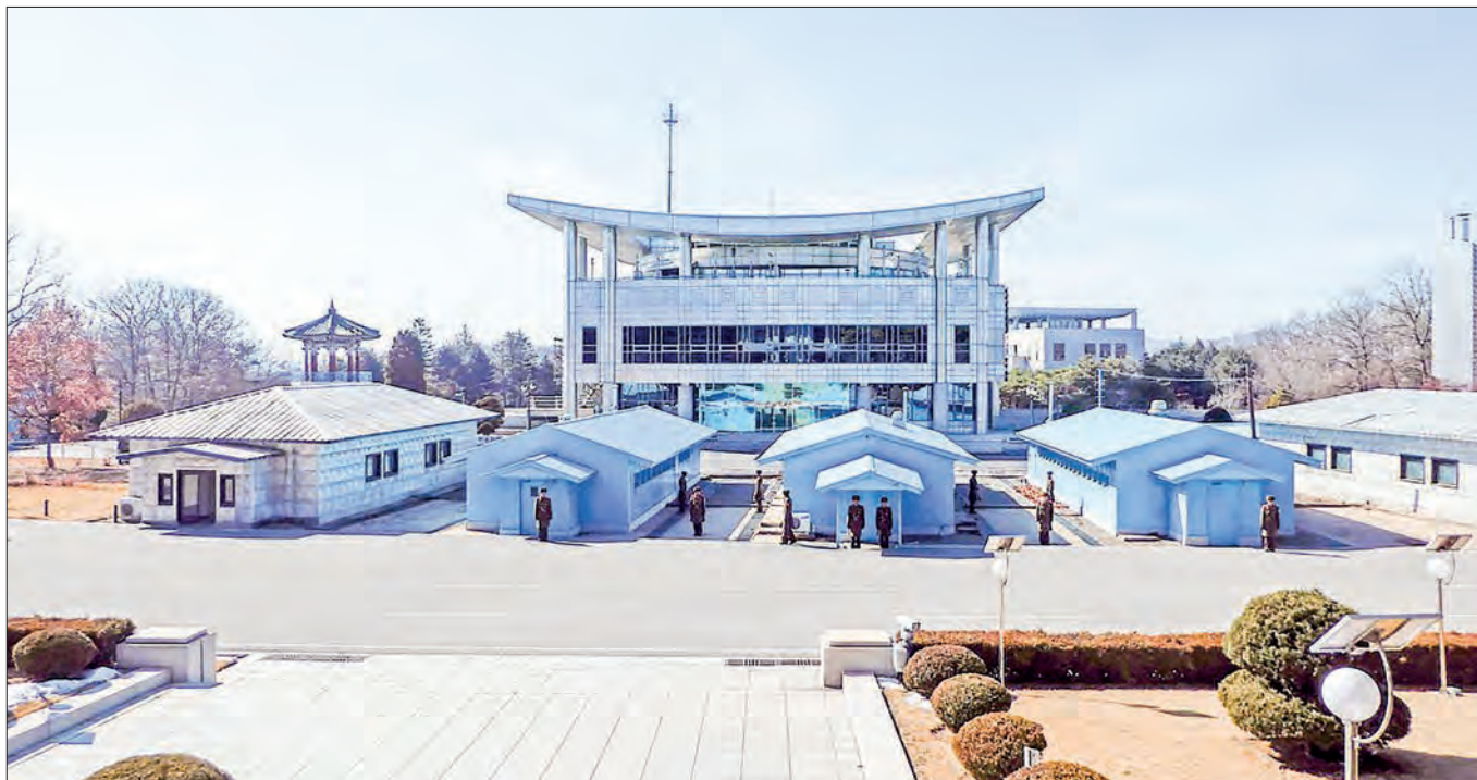
Access to the DMZ is highly restricted and controlled by both North and South Korea.

The work is likely aimed "as much at keeping their countrymen in as it is at keeping the South Koreans out," he said, but warned that "a lack of inter-Korean communication channels and confidence-building mechanisms increases the danger of escalation in border areas." — AFP