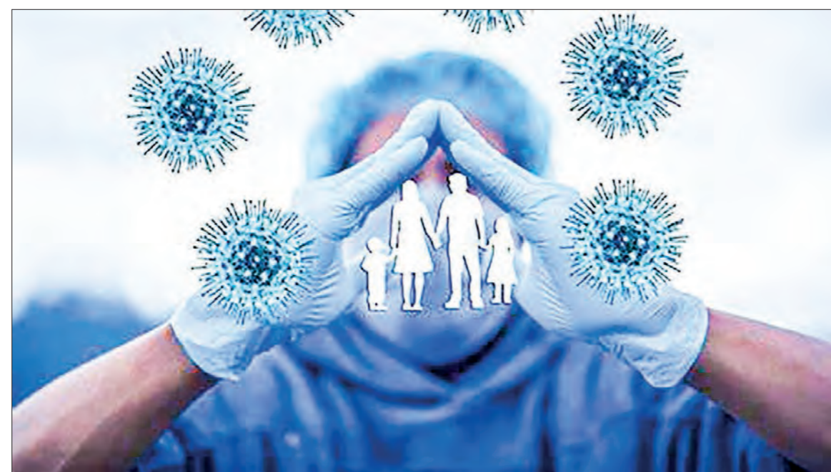
Healthcare providers, policymakers, patient advocacy groups, and various societal stakeholders recognize the pivotal role of patients and their families in enhancing patient safety.

LIVING a healthy life is a fundamental necessity for everyone. Even when various conditions lead to the occurrence of diseases, systematically receiving necessary diagnoses and treatments offers numerous benefits, including recovery,