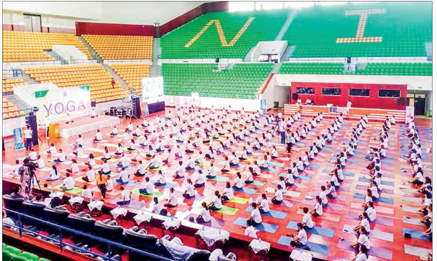
The Thuwunna Stadium hosts the International Day of Yoga in Yangon on 21 June 2024.

Thick fabric used clothes in high demand this rainy season