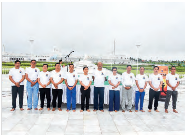
Participants pose for the group photo at yesterday's event in Nay Pyi Taw.

THE collective Yoga session marking the 10 th International Day of Yoga was organized at the Maravijaya Buddha Park compound in Nay Pyi Taw yesterday.