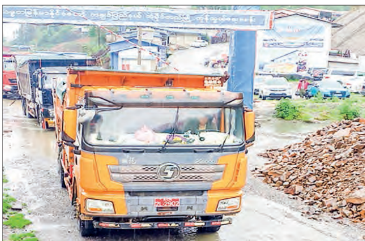
Lorries loaded with export and import cargo are seen crossing the Myanmar-China border.

The main export items at the Kampaiti border were tissue-culture banana, dried chilli, onion, dried mango slice, fresh areca nut, black cardamom, various pulses, tamarind with seeds and aluminium scrap. Meanwhile, Myanmar imports capital goods, inter-