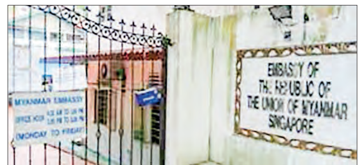
The Myanmar Embassy in Singapore.

The embassy regularly provides passport extension services to about 120 nationals