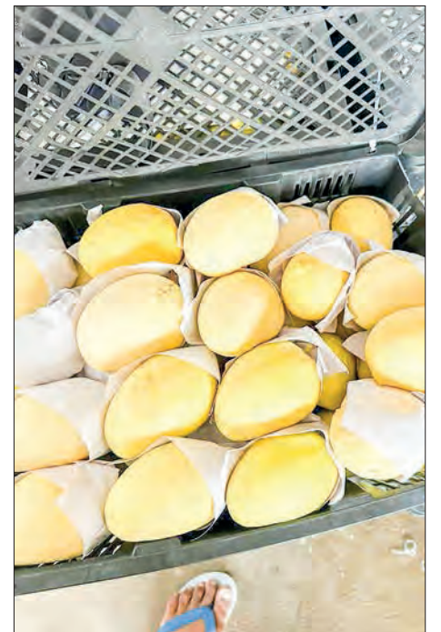
Seintalone mangoes are exported to China.

"Border trading has operated normally, but mango export has become low. There is still an export of Seintalone mango produced from Shan State. The price was better at the beginning of the fruit's harvest season. Now, mango production has become abundant, so the price can't get much better. Now this is the rainy season, so traffic congestions are happening, and that is taking longer on the journey," said a trader.