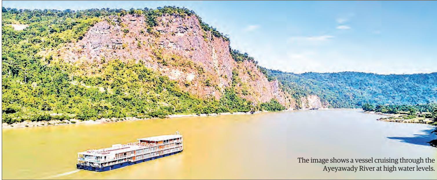
The image shows a vessel cruising through the Ayeyawady River at high water levels.

These swirling currents have been reported since the second week of June, and authorities have issued warnings regarding them. In the first week of June, the department advised all vessels, including those travelling from Mandalay ports to Bhamo, to pay close attention to navigational signs for safe manoeuvring, but will temporarily stop installing them along the Ayeyawady River. — TWA/TRKM