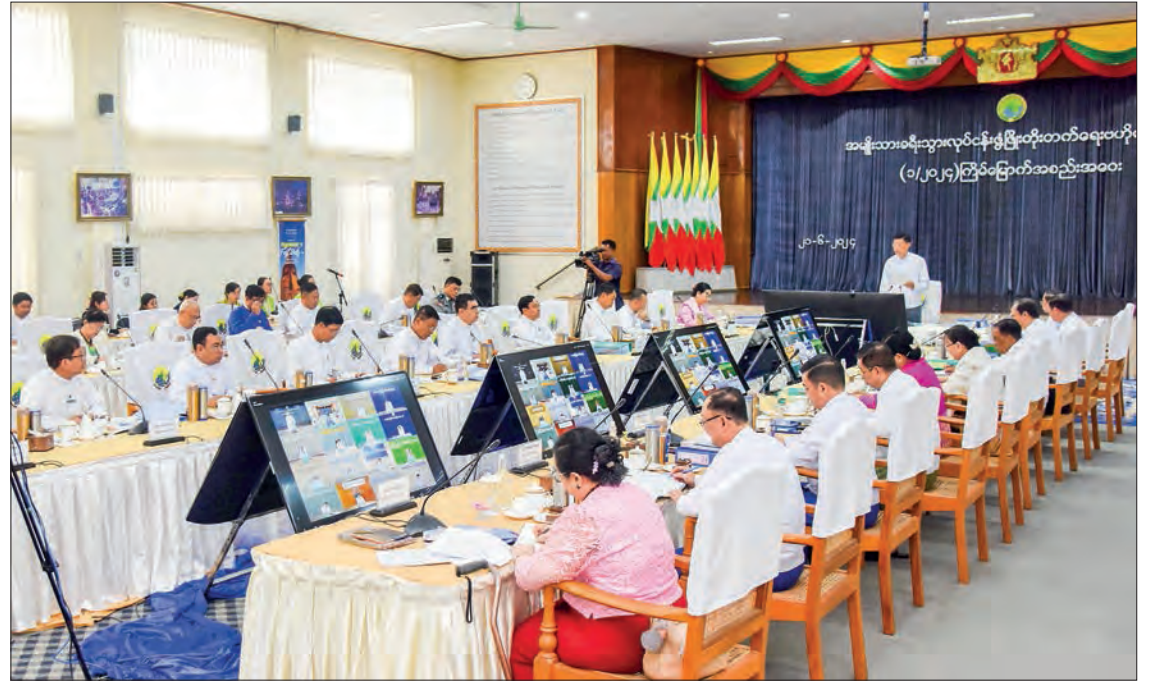
SAC Member Deputy Prime Minister MoTC Union Minister General Mya Tun Oo presides over the first coordination meeting of the Central Committee on National Tourism Development yesterday.

He then mentioned the efforts of the Ministry of Hotels and Tourism to resolve the challenges in tourism sectors and offer the best services for respective destinations, plans to hold the 5 th National Sports Festival in Nay Pyi Taw from 9 to 20 December, and stressed the need to apply digital technology in exploring market, online