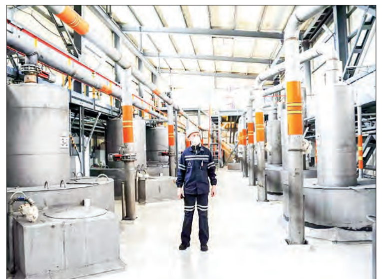
A worker at a workshop of the Khiagda enterprise in the Republic of Buryatia beginning preparations for the development of the Istochnoye and Verhinskoye natural uranium deposits at the Khiagda ore field.

He said that in 2016-2018, Vietnam decided "not to use nuclear energy in the power balance at all," although nuclear technologies remained and cooperation with Russia continued on the nuclear technology centre project.