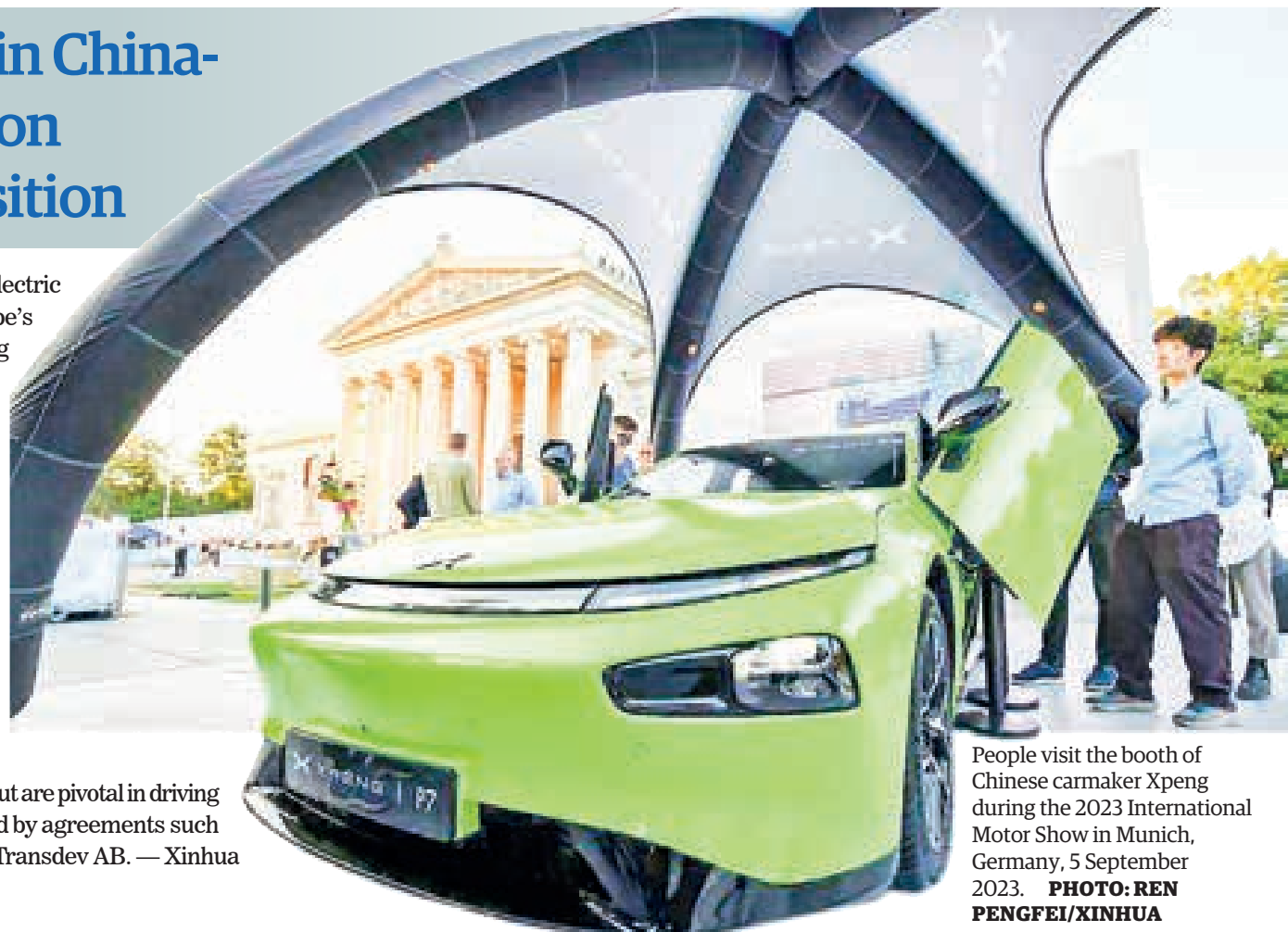
People visit the booth of Chinese carmaker Xpeng during the 2023 International Motor Show in Munich, Germany, 5 September 2023.

With cutting-edge technology and robust products, Chinese EV companies are not just participating but are pivotal in driving Europe’s green transportation revolution, highlighted by agreements such as BYD’s deal with Swedish public transport leader Transdev AB. — Xinhua