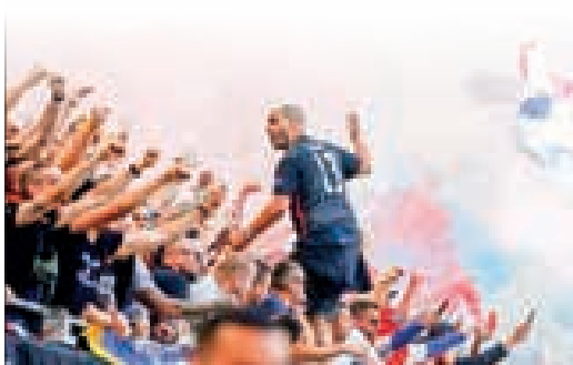
Supporters of Croatia cheer during the Uefa Euro 2024 Group B football match between Croatia and Albania at the Volksparkstadion in Hamburg on 19 June 2024.

UEFA have fined the Croatian Football Federation (HNS) for the incidents that occurred in the stands during Croatia's 2-2 draw with Albania at Euro 2024, the national federation said on Saturday.