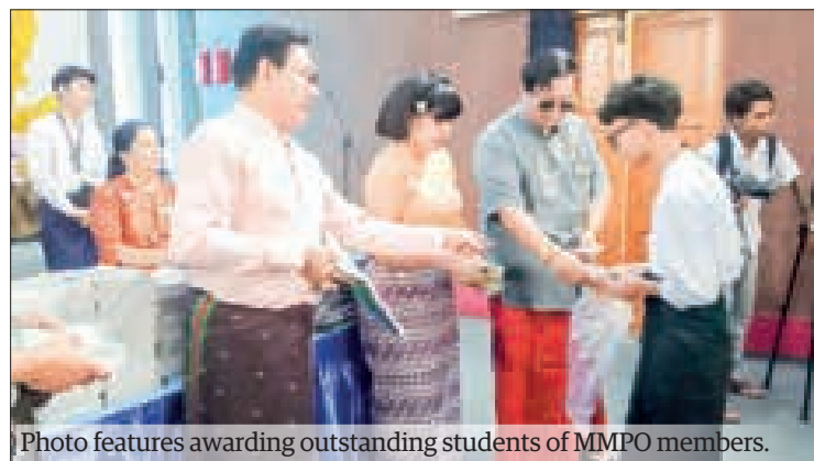
Photo features awarding outstanding students of MMPO members.

The organization provided rice, cooking oil and foodstuffs to organization members for the tenth time in April.