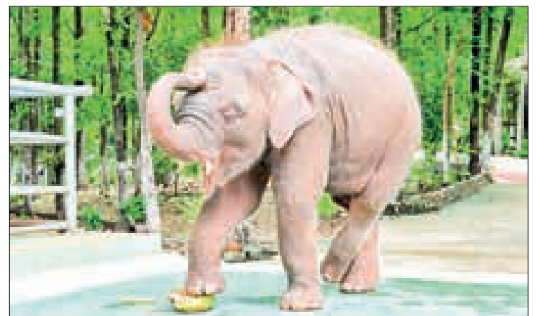
At one year and eleven months old, the baby white elephant Rattha Nandaka, thrives happily.

At one year and eleven months old, the baby white elephant is four feet and six inches in height, seven feet and four inches in circumference and weighs about 1,370 pounds. According to the Ministry of Natural Resources and Environmental Conservation, he stays healthy and happy with his mother elephant under the peace human and elephant interaction training system. — MNA/KZL