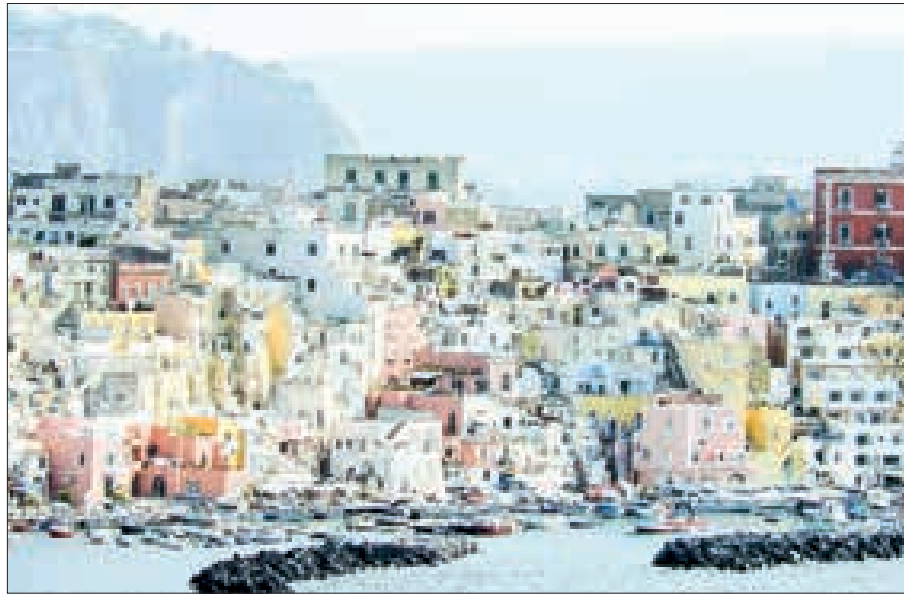
Capri, an island in Italy's Bay of Naples, draws vast numbers of day-trippers in summer months. PHOTO: PIXABAY

Capri, in the Bay of Naples, is famed for its white villas, cove-studded coastline and upscale hotels. It has around 13,000 permanent residents but attracts huge numbers of day-trippers in summer months. — AFP