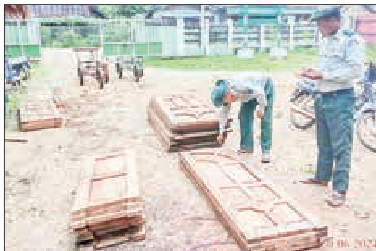
Confiscated illegal teak doors in Bago Region.

The confiscated wood comprised 0.741 tonne of illegal timber and 0.553 tonne of hardwood, with a combined estimated value exceeding K1.4 million. Action is being