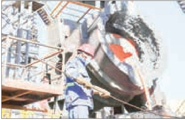
A worker is busy at the Dinson Iron and Steel Company (DISCO) in Manhize, Midlands Province, Zimbabwe, 20 June 2024.