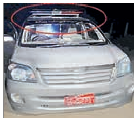
The vehicle from Myat Ponnya Parahita Association.

Security force members sent the dead body of the Sayadaw and the injured