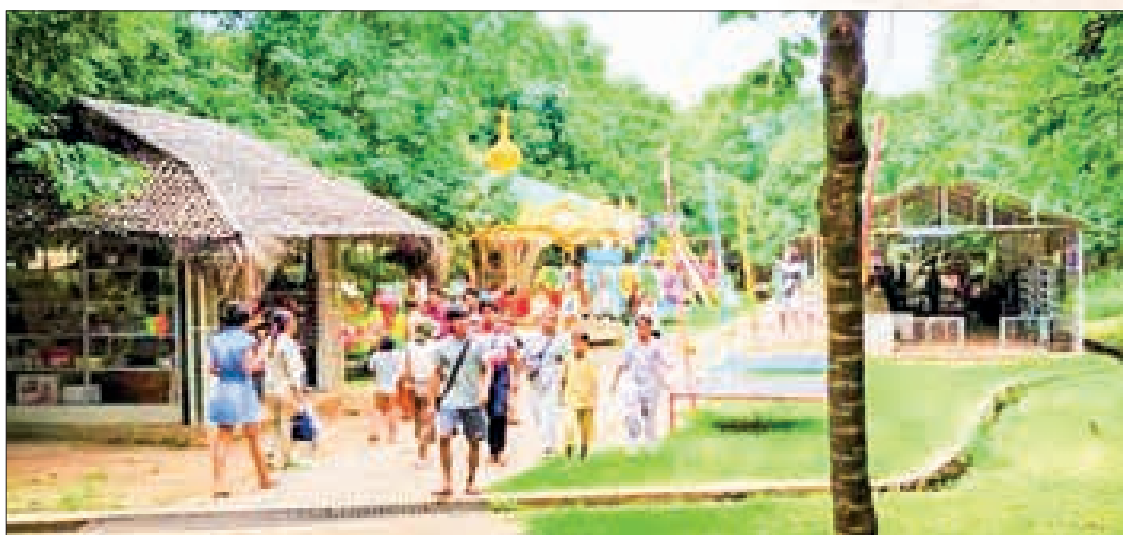
Flocks of visitors seen in Kandawgyi Botanical Garden in PyinOoLwin (above) and BE Fall (lower).

Both locals and foreigners visit the botanical gardens and waterfalls in PyinOoLwin, especially on holidays from Yangon, Nay Pyi Taw and Mandalay. The BE Waterfall which was formerly known as Hampshire Fall hosts