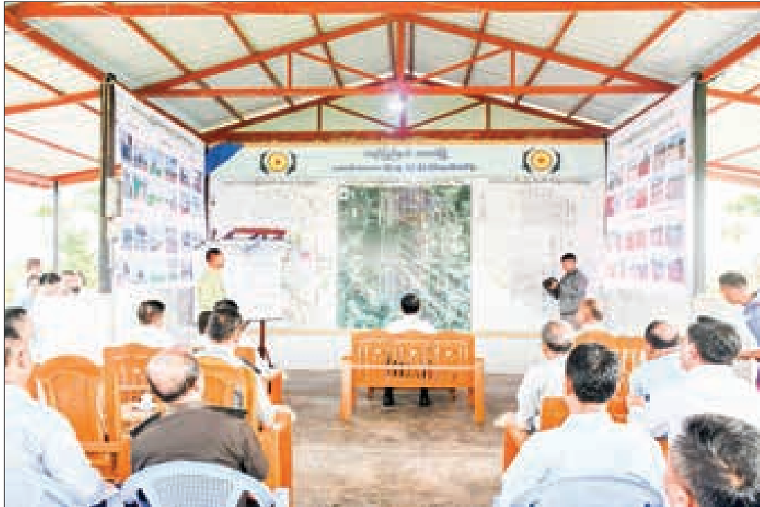
An official made a brief of the progress of Taunggale extended urban housing project to Kayin State Chief Minister U Saw Myint Oo on 22 June 2024.