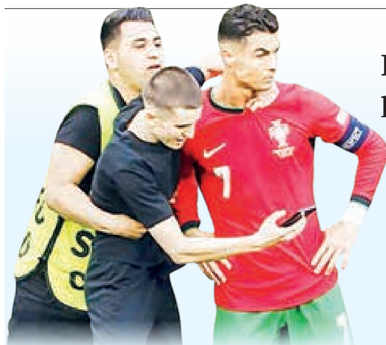
A pitch invader takes a selfie with Cristiano Ronaldo.