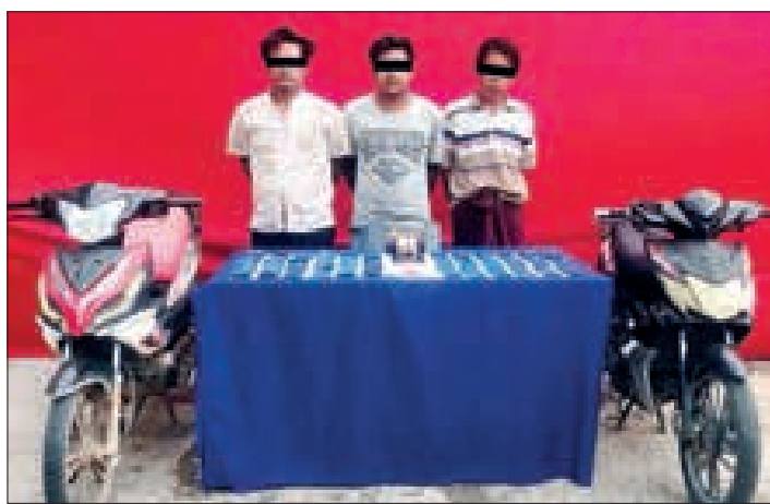
Photo shows offenders with the seized drugs.