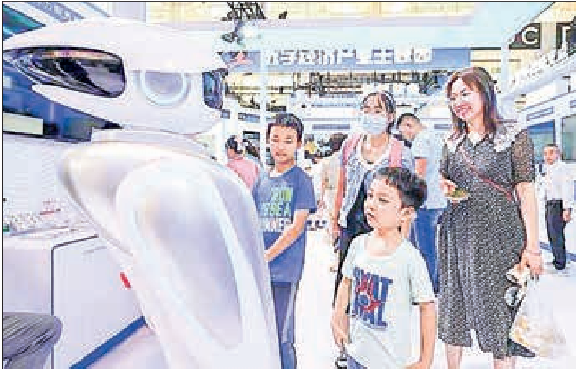
Visitors interact with an AI robot at the 2024 World Intelligence Expo held in Tianjin Municipality, north China, 22 June 2024.