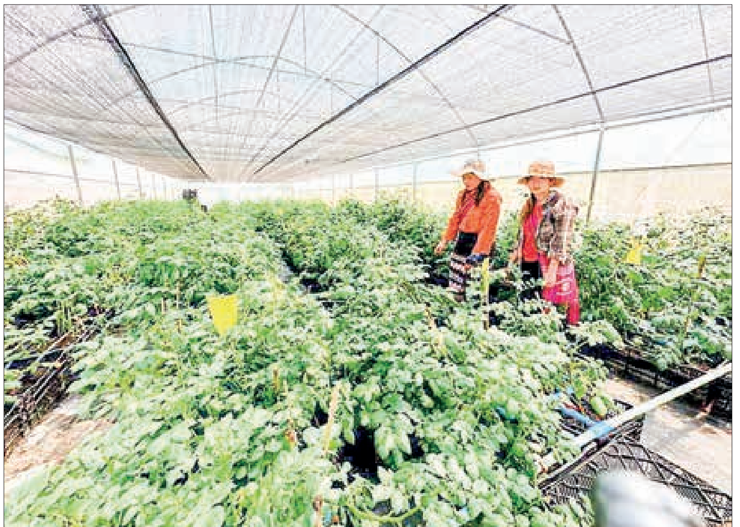
Potato plantation in Naungtaya of Shan State (above) and potato baskets which arrived at wholesale trading centre (lower).

MMPO honours outstanding students for 2024-2025 academic year