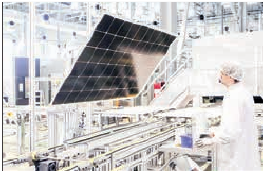
Hevel LLC, a Russian company specializing in solar technology, is driving forward its clean energy goals with its innovative solar module technology.

The main subjects selected by Brazil's G20 leadership for discussion include combating poverty and hunger, ensuring equitable energy transitions that do not hinder economic advancement, and reforming global governance bodies.