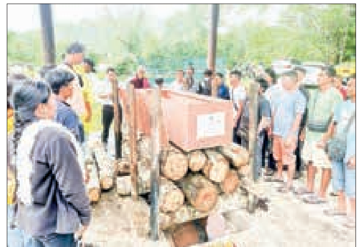
Myanmar community helped in the cremation of unclaimed body of Myanmar woman.

“The car driver run away. She has no relatives here and can’t contact her family in Myanmar. She had been here for long. She owed the hospital over 7,000 ringgits for medical expenditure and nobody was unable to pay, so it made dif-