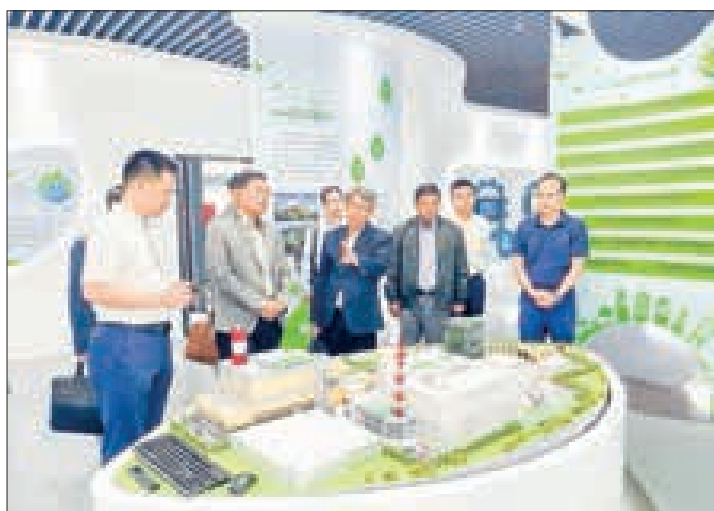
Myanmar delegation led by Union Minister U Myo Thant visits the galleries showcasing Green Innovation and Digital Connectivity at the IICF.

A Myanmar delegation, led by Union Minister for Construction U Myo Thant, attended the 15 th International Infrastructure Investment and Construction Forum (IICF), co-hosted by the China International Contractors Association (CHINCA) and the Macao Trade and Investment Promotion Institute (IPIM), held under the theme "Green Innovation and Digital Connectivity" on 20 June. They