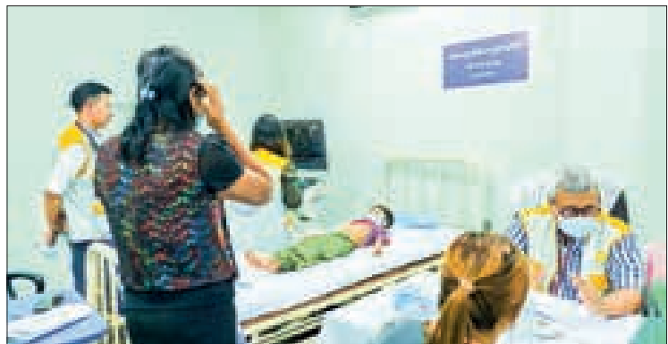
The specialist medical team examines a child patient at Kawthoung District People's Hospital.

These medical specialist teams have conducted 13 field trips in 2024.