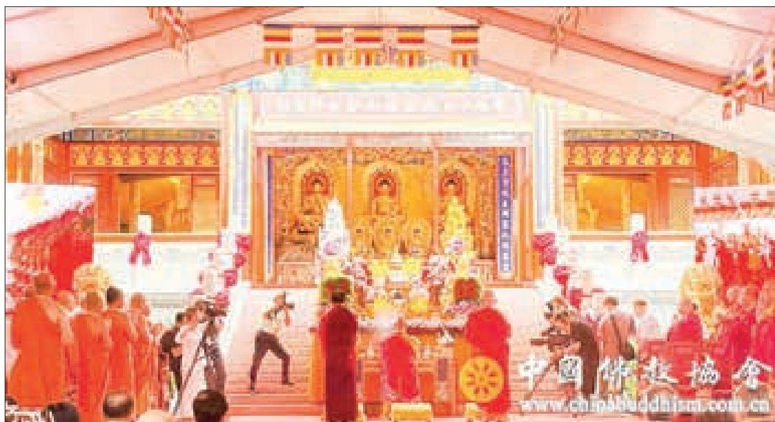
The opening ceremony of the 60 th Anniversary of Buddha's tooth pagoda in progress.