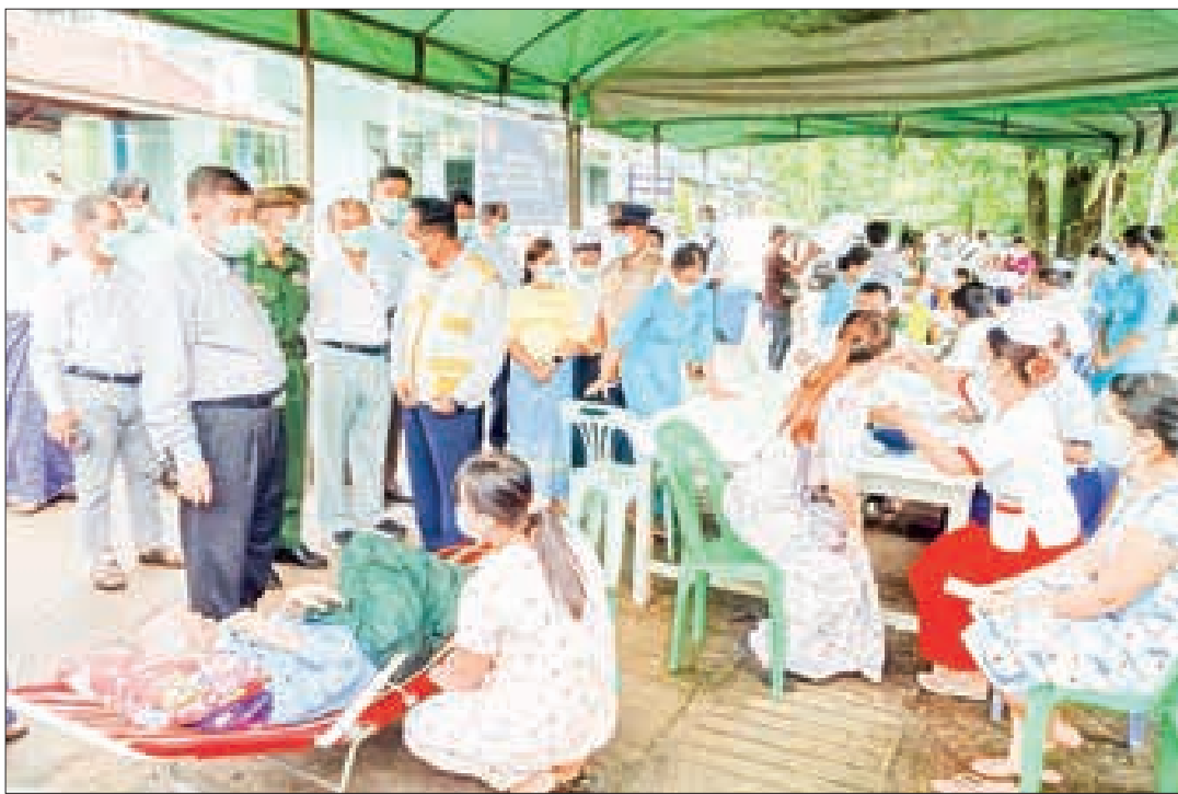
Mon State Chief Minister U Aung Kyi Thein and officials encourage the patients during the medical trip at Muiyitkalay Station Hospital in Chaungzon Township on 22 June.