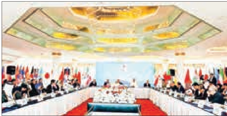
The ACD Senior Officials' Meeting in progress on 23 June 2024 in Tehran.

During the meeting with the Acting Foreign Minister of Iran, the Deputy Prime Minister and Union Minister for Foreign Affairs appraised the Myanmar Government's efforts to ensure