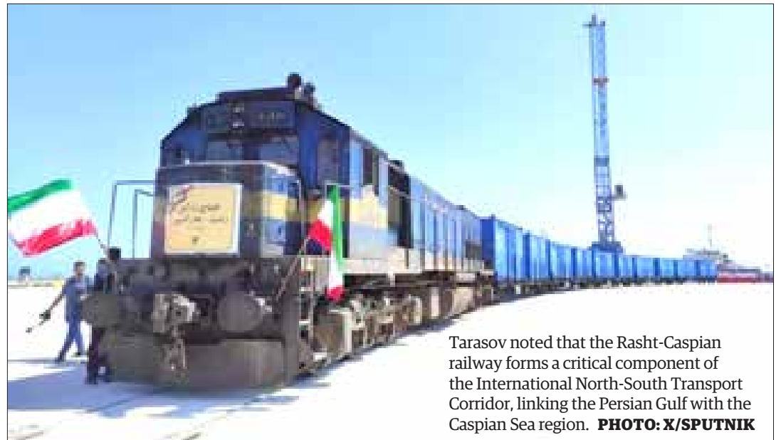
Tarasov noted that the Rasht-Caspian railway forms a critical component of the International North-South Transport Corridor, linking the Persian Gulf with the Caspian Sea region.

The railway, recently unveiled in Iran, holds strategic economic importance for the Islamic Republic.