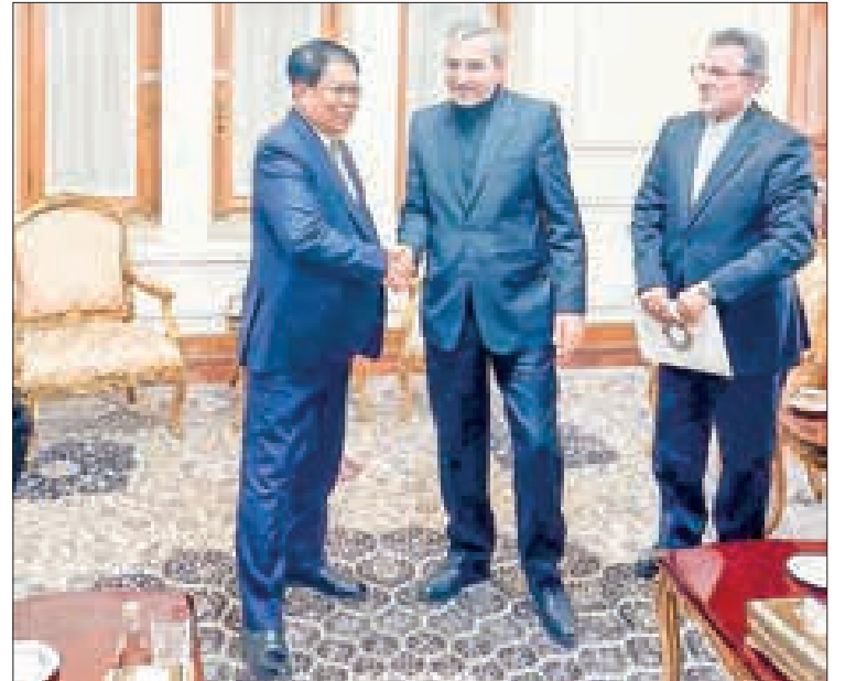
Deputy Prime Minister Union Minister for Foreign Affairs U Than Swe shakes hands with Dr Ali Bagheri Kani, Acting Foreign Minister of Iran on 23 June 2024 in Tehran.

national fora including cooperation in the ACD.