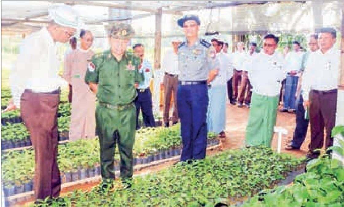
Officials inspect coffee seedlings to be provided FOC to the local farmers in Dawei District, Taninthayi Region.