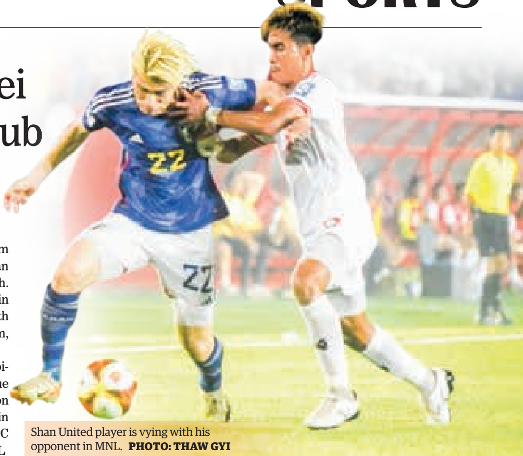
Shan United player is vying with his opponent in MNL.

Since Shan United won the championship in the Myanmar National League Cup title, the first domestic competition this season, they will have to compete in two foreign competitions including AFC Challenge League.