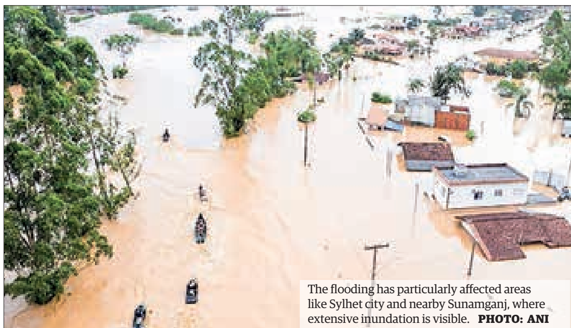
The flooding has particularly affected areas like Sylhet city and nearby Sunamganj, where extensive inundation is visible.

The deluge is attributed to continuous heavy rains and runoff from hilly regions along the Indian border, causing four major rivers to exceed their danger levels.