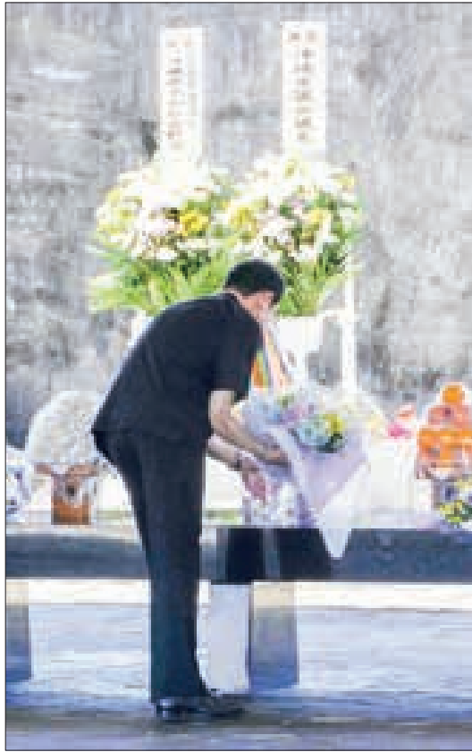
Japanese Prime Minister Fumio Kishida lays flowers at the Peace Memorial Park in Itoman, Okinawa Prefecture, on 23 June 2024, the 79 th anniversary of the end of the Battle of Okinawa in World War II.

OKINAWA on Sunday marked the 79 th anniversary of the end of a fierce World War II ground battle between Japanese and US troops that claimed over 200,000 lives.