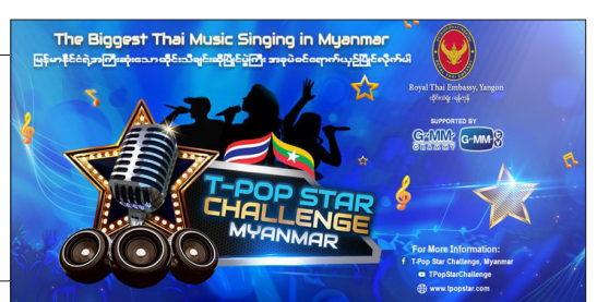
An advert for the first Thai music singing contest in Myanmar.

Thai artistes from GMM Grammy and GMMTV and Myanmar artistes will participate in the contest as judges and special guests, it said. — MT/ZN