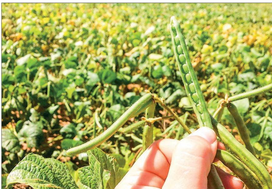
A farm workers seen plucking the green gram.

Myanmar conveyed around 503,970 tonnes of green gram worth $336.89 million to foreign markets in the past FY 2023-2024 beginning 1 April, according to the Ministry of Commerce.