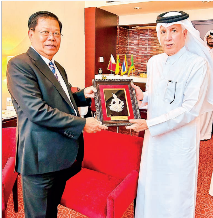
Deputy Prime Minister MoFA Union Minister U Than Swe presents a souvenir to the State Minister of Foreign Affairs of Qatar on 24 June 2024.

At the meeting with the Thai Minister of Foreign Affairs, both sides cordially exchanged views on strengthening the existing friendly relations between Myanmar and Thailand, promoting mutually beneficial cooperation,