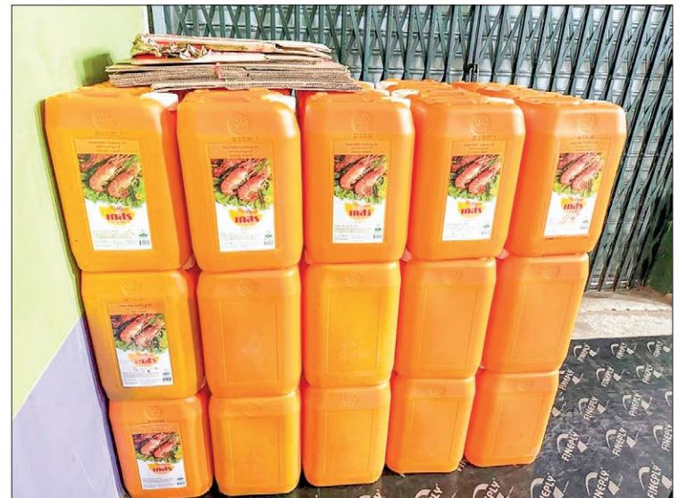
Confiscated illegal items in Yangon Region.

SUPERVISED by the Illegal Trade Eradication Steering Committee, legal action is being taken nationwide against illicit trading.