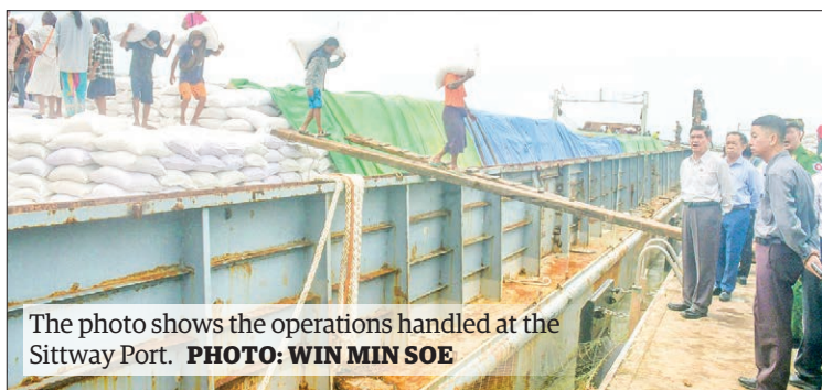
The photo shows the operations handled at the Sittway Port.

The forum will also feature discussions on the FAO Mountain Partnership project, reducing food waste and using more local produce, and the successes of food tourism in Asia and the Pacific. — MNA/KZL