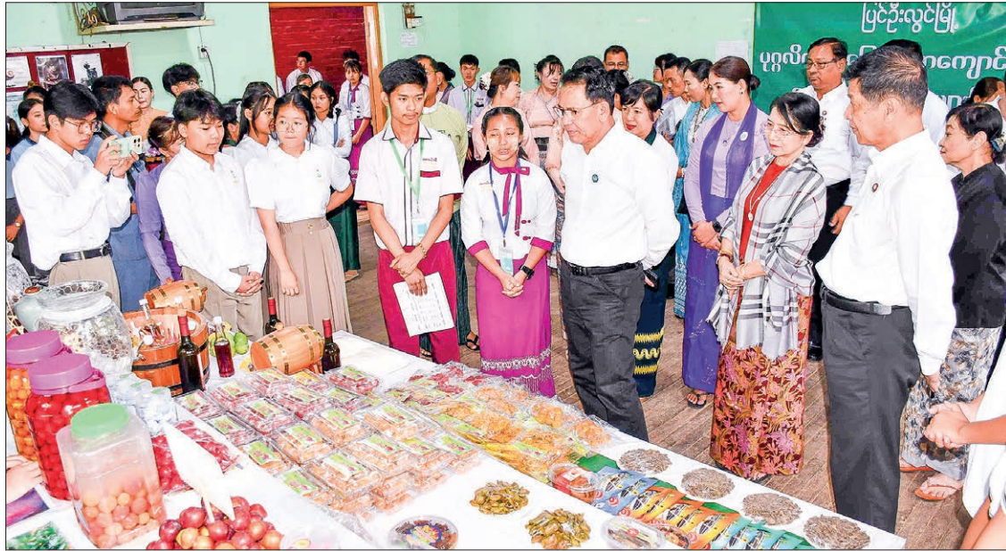
Union Minister U Maung Maung Ohn views round the display at yesterday's launching ceremony in PyinOoLwin.

He then highlighted the efforts of the Prime Minister to create learning opportunities