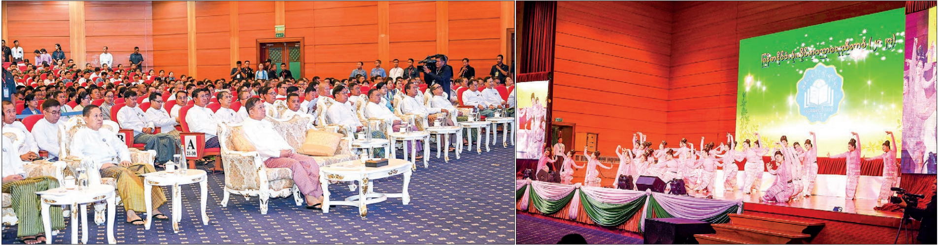
Senior General Min Aung Hlaing and dignitaries watch the performance during the opening ceremony of the Myanmar National Education Conference 2024 yesterday.