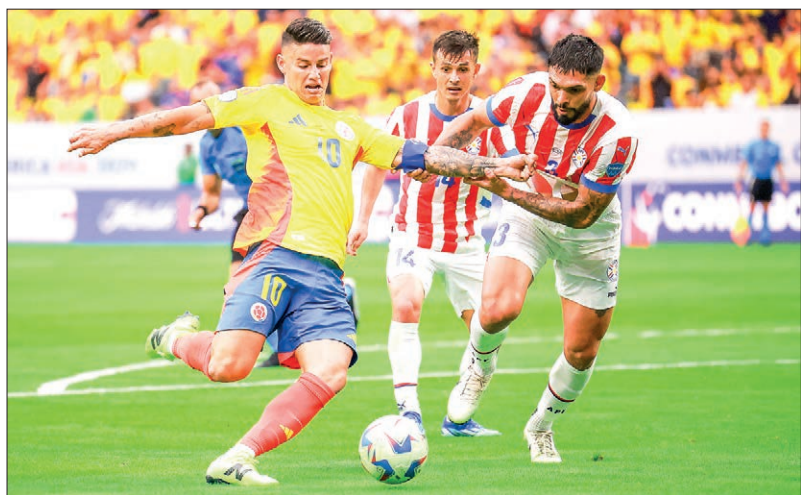
James Rodriguez of Colombia challenges for the ball with Omar Alderete of Paraguay during the CONMEBOL Copa America 2024 Group D match between Colombia and Paraguay at NRG Stadium on 24 June 2024 in Houston, Texas.

A lacklustre Brazil launched their Copa America campaign with a dour 0-0 draw against Costa Rica on Monday as James Rodriguez inspired Colombia to a 2-1 win over Paraguay.