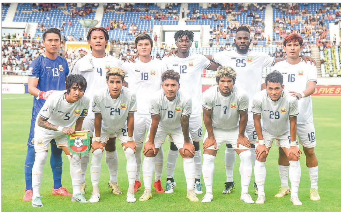
The Shan United squad is seen posing for the group photo.

Myanmar club Shan United is placed in the East Asia zone with Indonesian club Madura