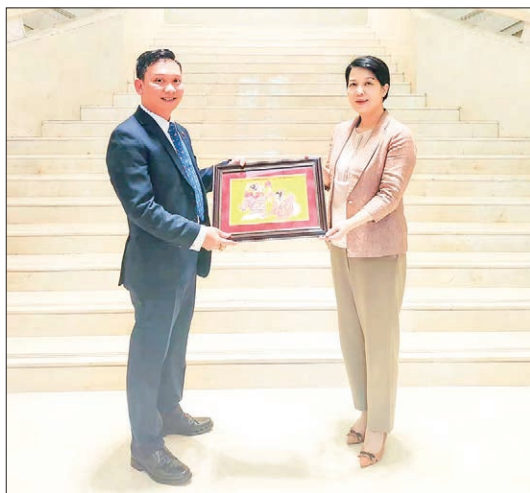
Gifts are exchanged during the discussions in China on 21 June 2024.

THE Ministry of Foreign Affairs has reported that talks on signing an MoU to establish sister cities between Yangon and Chongqing took place in Chongqing, China, on 21 June.