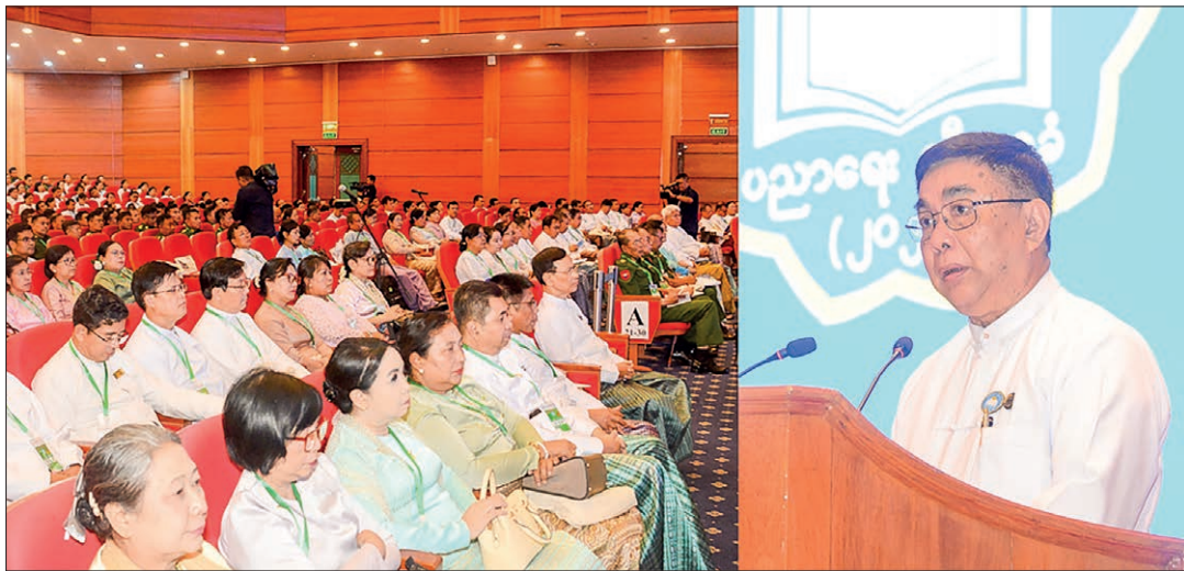
Union Minister Dr Nyunt Pe speaks on the inaugural occasion of the Myanmar Education Conference 2024 yesterday in Nay Pyi Taw.

THE Myanmar Education Conference 2024, which was themed 'To Further Promote Education for the development of Human Resources', took place at the Myanmar International Convention Centre II (MICC II) in Nay Pyi Taw from 25 to 27 June.