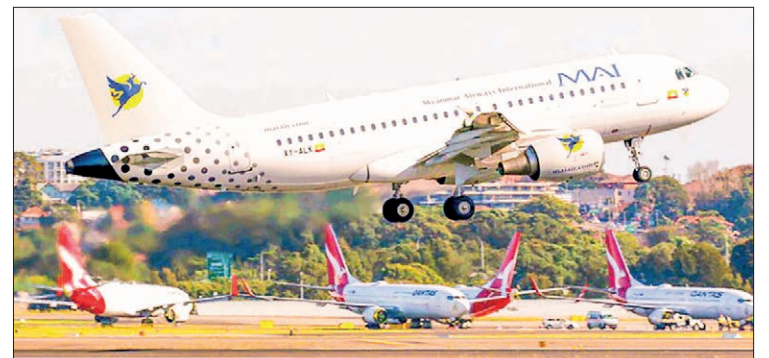
The photo showcases an aircraft from Myanmar Airways International (MAI).

MAI launched flights to Chiang Mai and Dhaka in April and May. By the end of 2024, MAI aims to offer a comprehensive network of 21 international and 20 domestic flights.