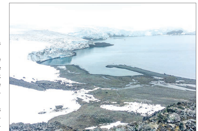
The Collins glacier on King George Island has retreated in the last 10 years and shows signs of fragility, in the Antarctic on 2 February 2018.

act on it." The casualties of war this time would have unprecedented consequences, including severe and long-lasting economic costs.