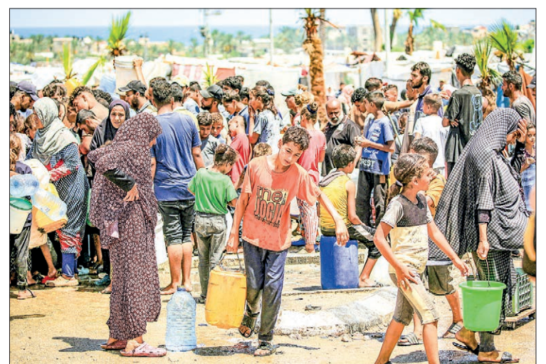
A boy walks with a jerrycan after filling up with others from a truck loaded with water cisterns in Rafah in the southern Gaza Strip on 25 June 2024 amid the ongoing conflict in the Palestinian territory between Israel and Hamas.

But it warned that in the south of Gaza, the situation was getting worse. — AFP