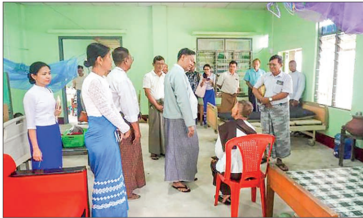
The MNHRC member inspects the U Maung Yone + Daw Yin Home for the Aged in Oakkan Township yesterday.

The inspection team inspected U Maung Yone + Daw Yin Home for the Aged under