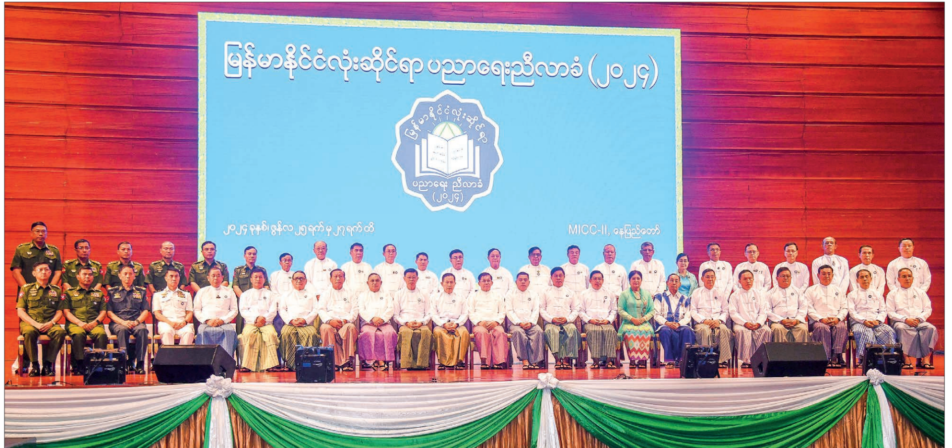
State Administration Council Chairman Prime Minister Senior General Min Aung Hlaing poses for the group documentary photo together with participating dignitaries at the inaugural event yesterday in Nay Pyi Taw.