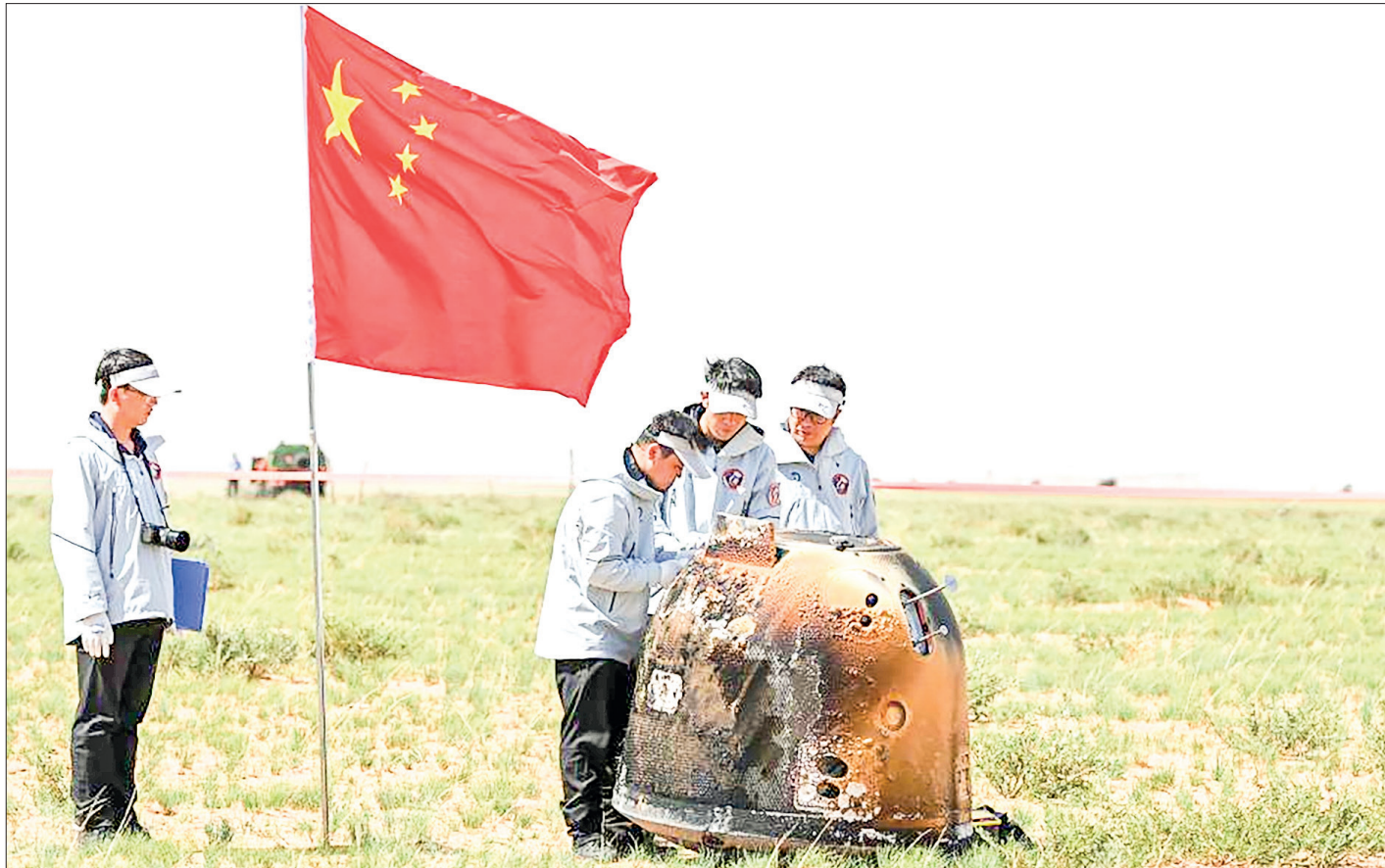
The return capsule of the Chang'e-6 probe lands in Siziwang Banner, north China's Inner Mongolia Autonomous Region on 25 June 2024.