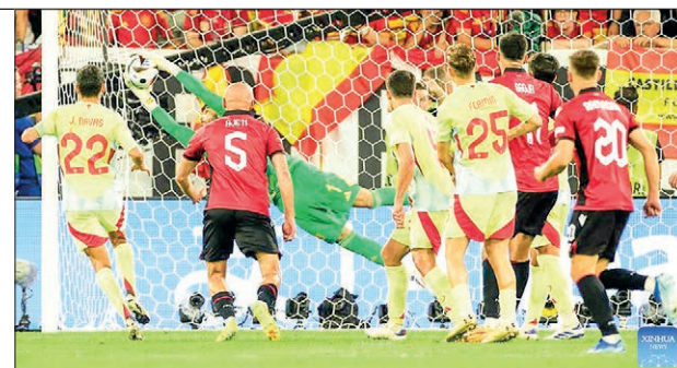
David Raya Martin (Back), goalkeeper of Spain, makes a save during the UEFA Euro 2024 Group B match between Spain and Albania in Dusseldorf, Germany, on 24 June 2024.

The 32-year-old midfielder, who has played just a handful of minutes for Brazilian club Sao Paulo in the two months leading into the Copa America, set up the opening goal for Colombia in the 32 nd minute. — AFP