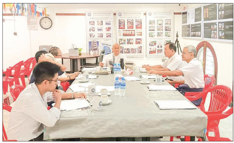
The MSF Executive Committee's regular monthly meeting 6/2024 in progress on 25 June 2024.

The Myanmar Seafarers Federation is an organization that champions the rights and welfare of seafarers and also conducts training courses for them. — TWA/MKKS