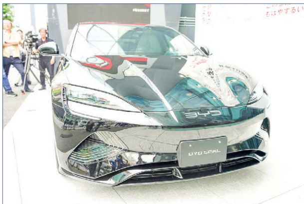
Photo taken on 25 June 2024 shows Chinese electric vehicle maker BYD Co's Seal sedan on display at the venue of its press conference in Tokyo to launch the company's third EV model for Japan.

The base model, priced at 5.28 million yen (about US$33,110), offers a driving range of about 640 kilometres, while the all-wheel-drive (AWD) version