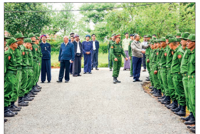
Photos showcase the activities of the people's military servants training 3 in different commands and the state/region and Nay Pyi Taw Council Chairman ministers reached out to them.