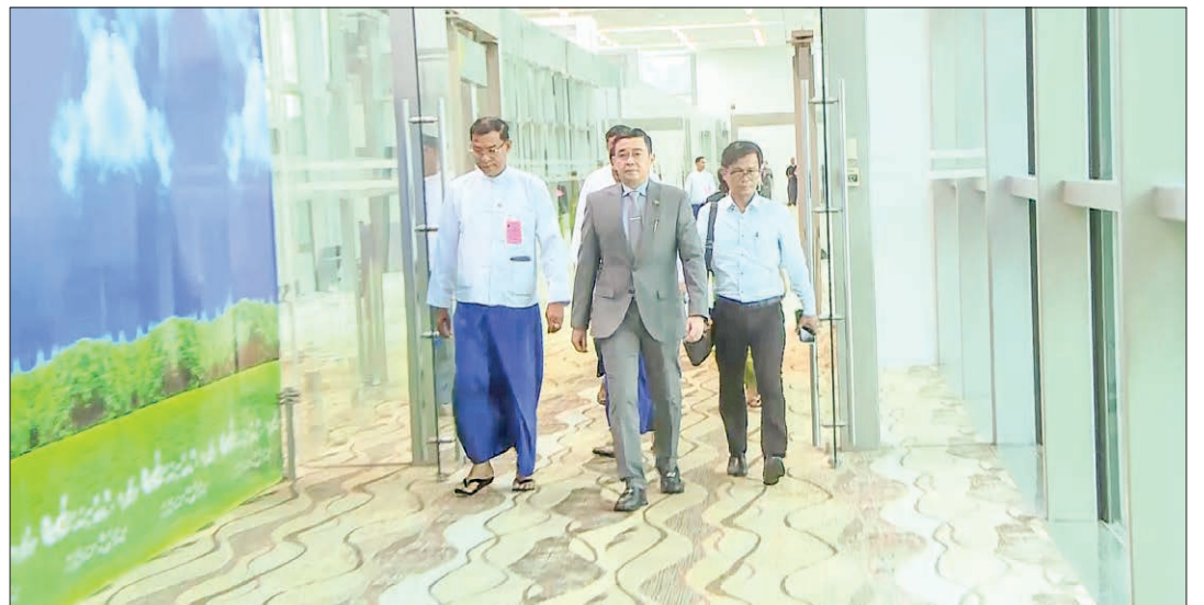
Deputy Minister for Hotels and Tourism U Phyo Zaw Soe is seen leaving for the Philippines yesterday.

AT the invitation of the Secretary-General of the United Nations Tourism Organization and the Secretary of the Department of Tourism of the Philippines, Myanmar delegation led by Deputy Minister for Hotels and Tourism U Phyo Zaw Soe left for the Philippines yesterday to attend the 36 th Joint Meeting of the UN Tourism Commission for East