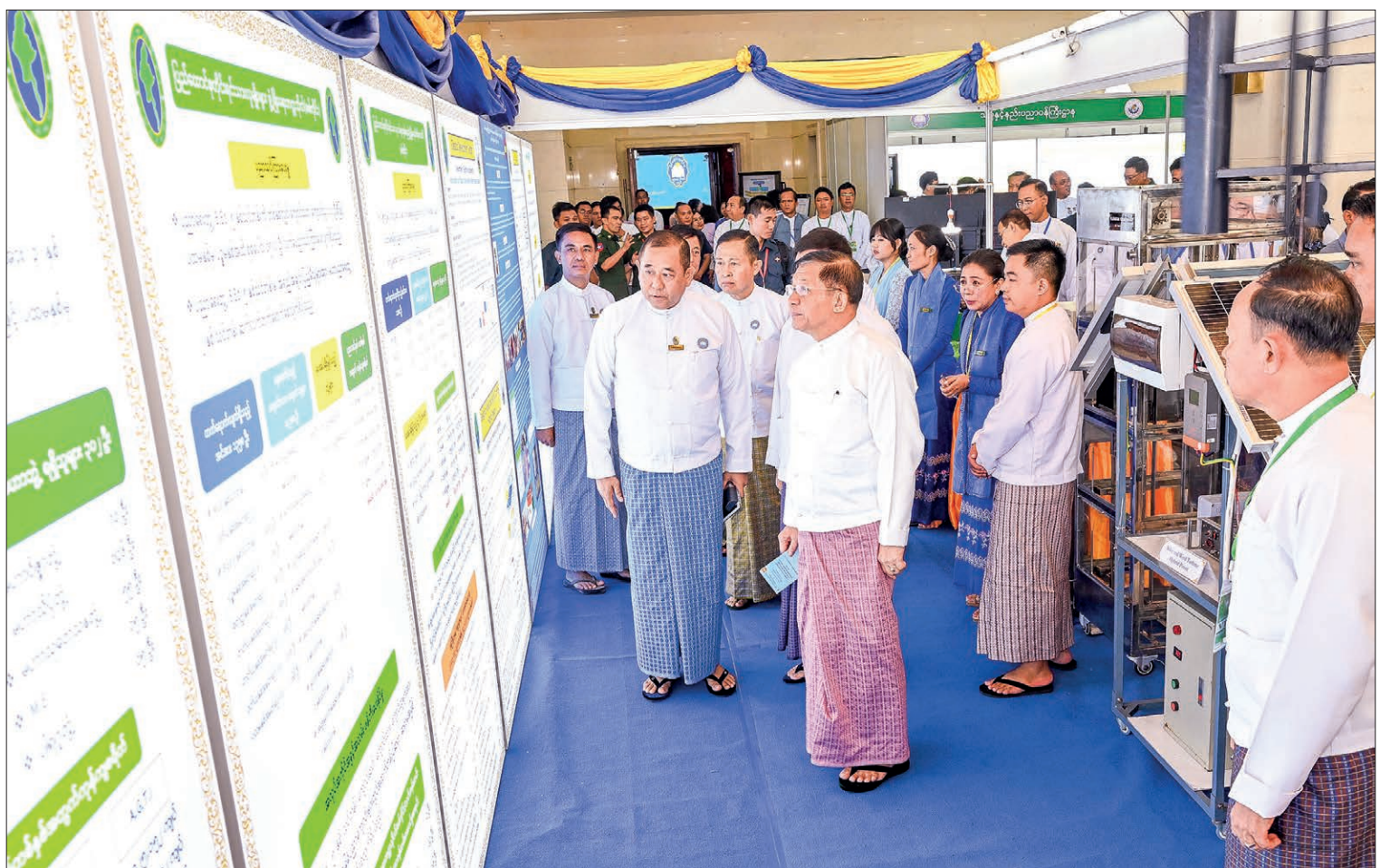
The Senior General looks into the display at yesterday's event in Nay Pyi Taw.

The conference organized by the Ministry of Education and relevant ministries continues till 27 June. — MNA/TTA